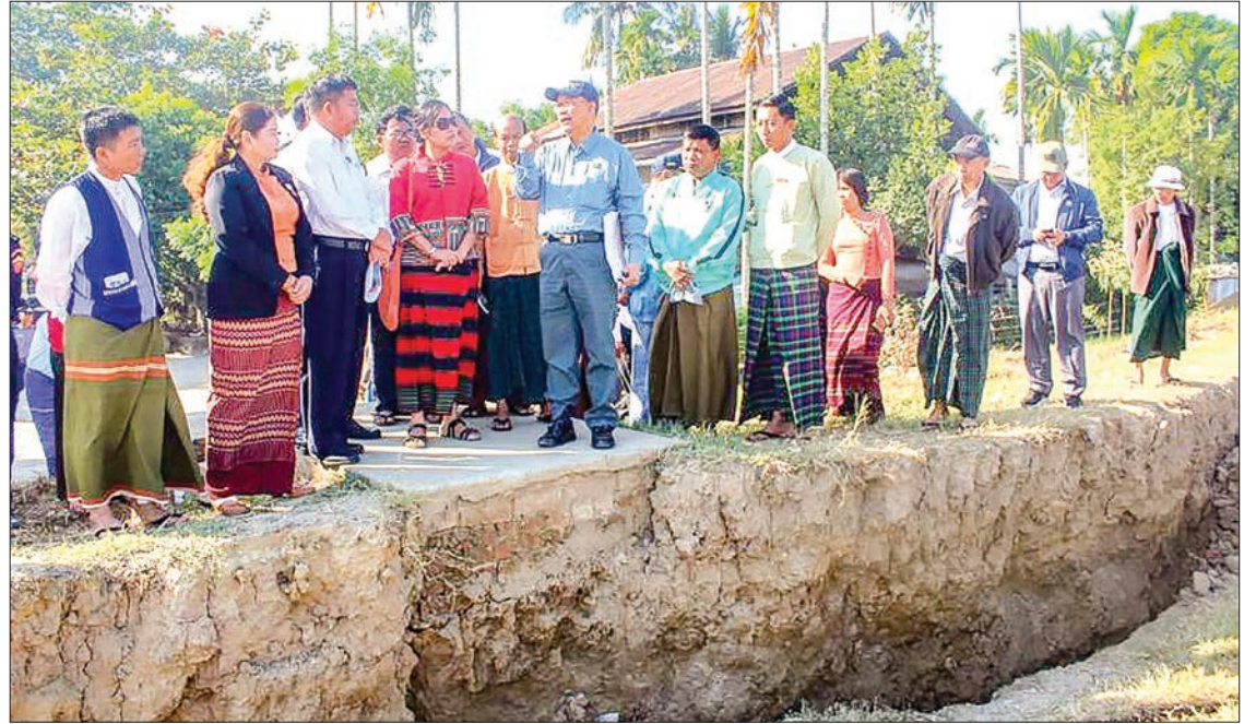
Union Minister U Thant Sin Maung inspects embankment maintenance work to prevent river bank erosion in Nyaungdon yesterday.