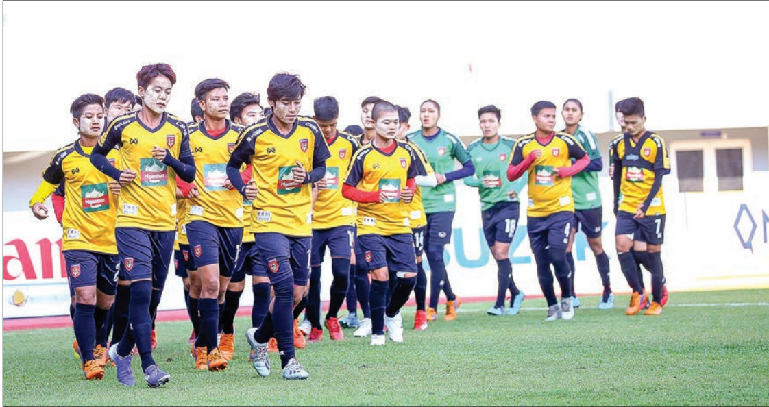
The players of Myanmar women's national football team train in Mandalay yesterday.

AS part of their preparation for the third round of qualifying matches for the 2020 Tokyo Olympics, the Myanmar women's national football team arrived in Mandalay on Sunday for training.