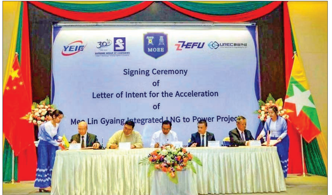
A signing ceremony of Letter of Intent for the Acceleration of Mee Lin Gyaing Integrated LNG to Power Plant held in Nay Pyi Taw on 17 January.