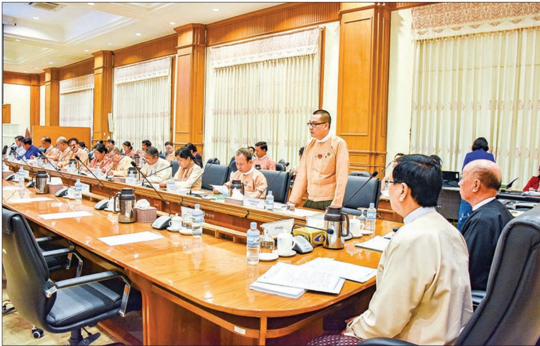
Meeting 3/2020 of the Joint Committee on Amending the 2008 Constitution underway in Nay Pyi Taw yesterday.

THE Joint Committee on Amending the 2008 Constitution held its 3/2020 meeting at Pyidaungsu Hluttaw Building D in Nay Pyi Taw yesterday.