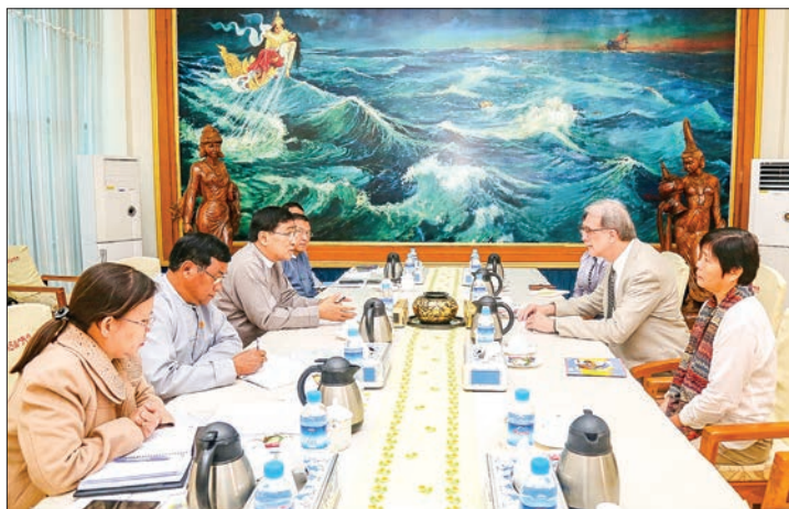
Union Minister Dr Win Myat Aye holds talks with a delegation from Community and Family Service International (CFSI) in Nay Pyi Taw yesterday.

They also discussed making social welfare accessible to the village-level, producing more volunteers for social welfare and providing them with the needed training and technological assistance, and signing MoU for future processes.