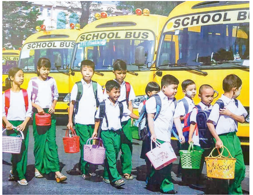
School children in Yangon.