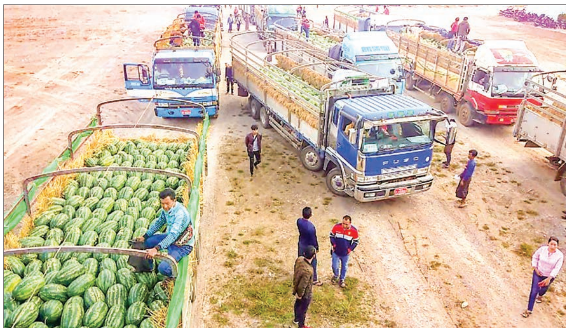
Trucks laden with watermelons wait for inspection to enter China at the Muse 105 th Mile border trade zone.

WITH the closure of China's customs office during the Chinese New Year Festival, Muse fruit depots will suspend trading between 24 and 26 January, according to the Khwar Nyo fruit depot.