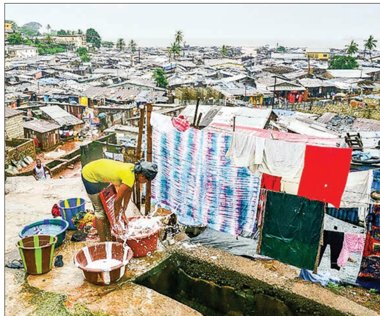
The 22 richest men in the world have more wealth than all the women in Africa, Oxfam says.

Each is colour-coded to denote different flavours: blue for rum and pineapple, pink for gin and strawberry, orange for vodka and orange, brown for whisky and coke, and yellow for tequila and lemon. Haribo's chewy confections are alcohol-free and sold thousands of shops across the world, from Europe to China, Australia, Brazil and the United States. “As normal in such cases, Haribo has started judicial proceedings to protect its registered trademarks,” a spokesperson for the company told AFP.—AFP ■