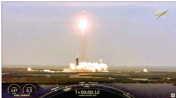
This NASA TV video frame grab shows a SpaceX rocket launching to perform an in-flight abort test of its Crew Dragon spacecraft, which was unmanned for the apparently successful test.

Crew Dragon continued its upward trajectory alone reaching an altitude of about 40 kilometers before beginning its natural descent toward the Atlantic. Four large parachutes opened to brake its descent and splashdown in the ocean, where recovery teams were pre-positioned. Nine minutes after launch, Crew Dragon was in the water, apparently without suffering damage.—AFP