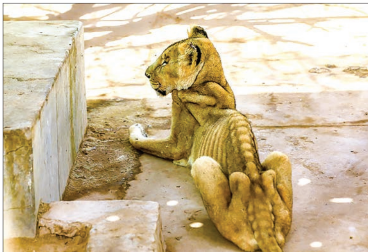
For weeks now, five lions held at Khartoum’s Al-Qureshi Park in an upscale district of the capital have been suffering from shortages of food and medicine.

Sudan is in the midst of a worsening economic crisis, led