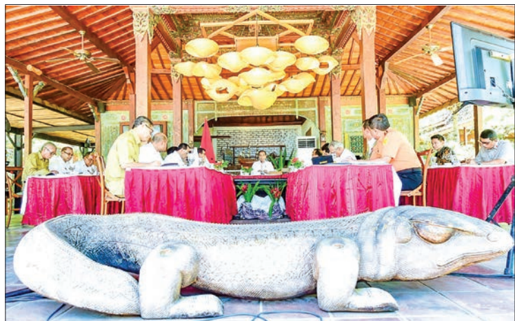
Indonesian President Joko "Jokowi" Widodo chairs a Cabinet meeting in the town of Labuan Bajo in eastern Indonesia on 20 January 2020.

Komodo National Park, which includes Komodo, Padar and Rinca islands and numerous smaller ones, was declared a World Heritage site in 1986. The Komodo Biosphere Reserve was accepted under the UNESCO Man and the Biosphere Program in 1977. — Kyodo News ■