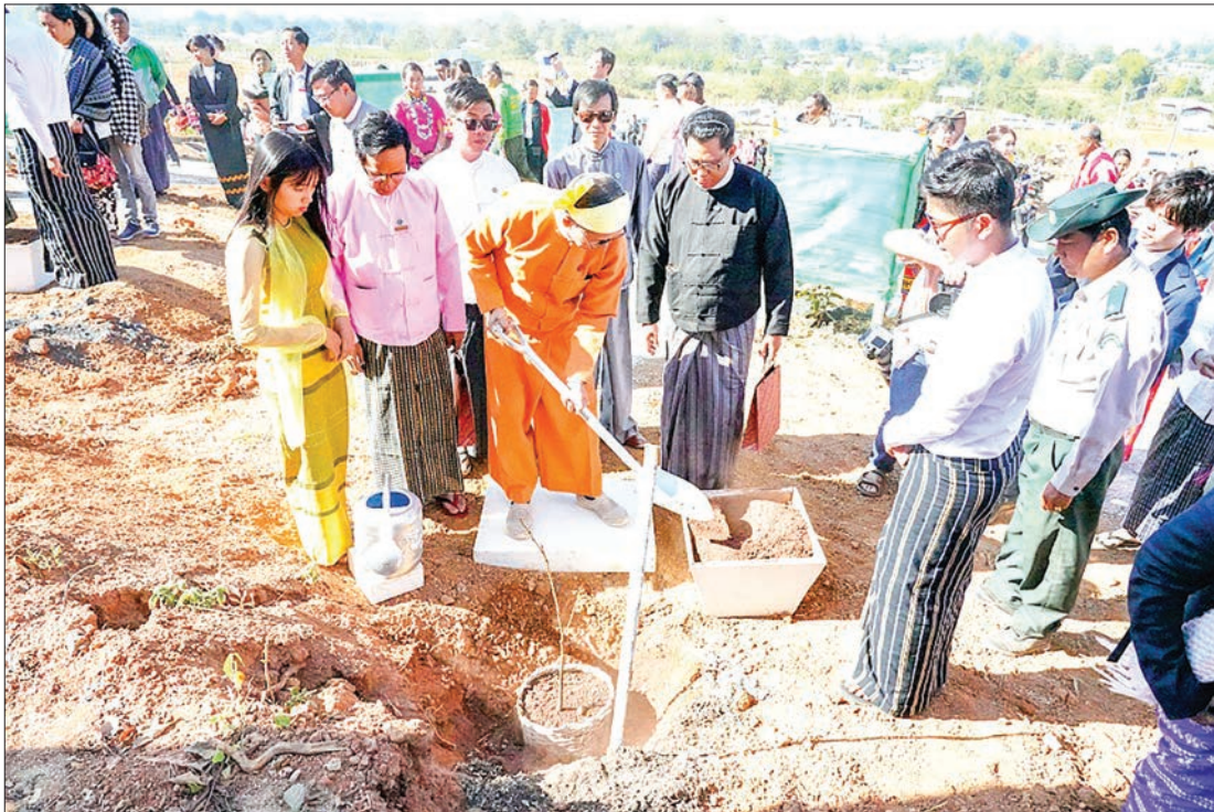
Union Minister U Ohn Maung plants a cherry tree at the 4 th Cherry Trees Planting Ceremony to mark the 68 th Anniversary of Kayah State at the Buddha Park in Loikaw, Kayah State, yesterday.

THE 4 th Cherry Trees Planting Ceremony was held at the Buddha Park in Loikaw, the capital city of Kayah State, on 19 January, marking the 68 th Anniversary of the State.