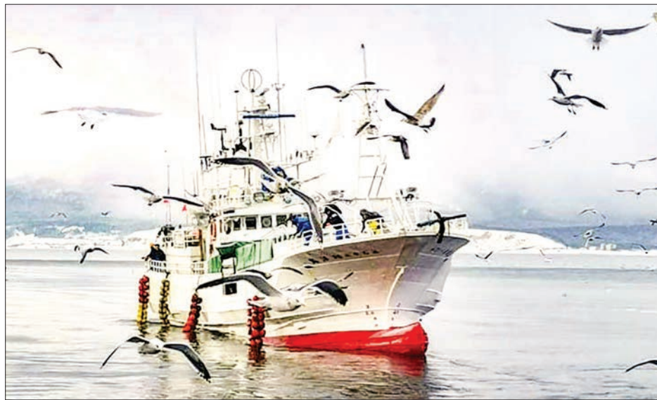
Supplied photo shows ShoyoMaru No. 68.

The ShoyoMaru No. 68, with six crew members, was seized last Wednesday after the border security agency from Sakhalin in Russia's Far East, which