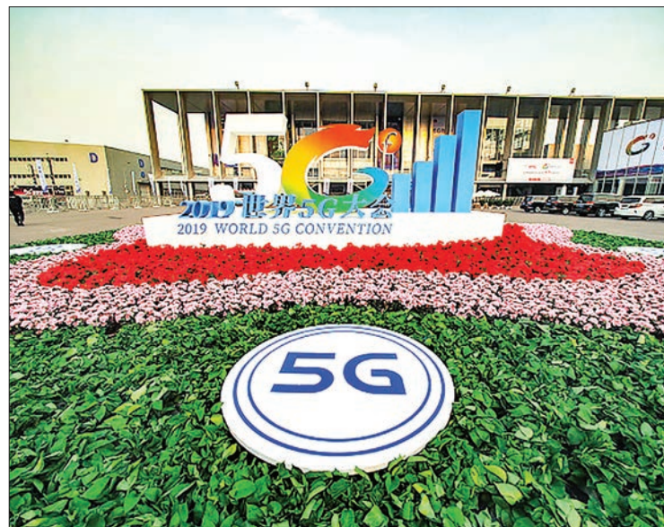
Flower bed of 2019 World 5G Convention is pictured during 2019 World 5G Convention at Beijing Etrong International Exhibition & Convention Center on 21 November 2019 in Beijing, China.

"At this point in time, Huawei is not the only group that we are looking at for 5G rollout. We are also looking at other companies. It is a question of what they propose and how we can work with them, and security aspect will be analyzed," the communications minister told reporters at Monday's event. —Kyodo News ■