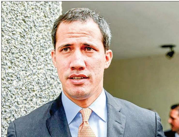
Venezuelan opposition leader and self-proclaimed acting president Juan Guaido is said to have traveled to Colombia to meet with US Secretary of State Mike Pompeo.

The move comes after an overture by Maduro for direct negotiations with the United States on an end to crippling US sanctions, and amid signs he is preparing for renewed confrontation with the opposition.