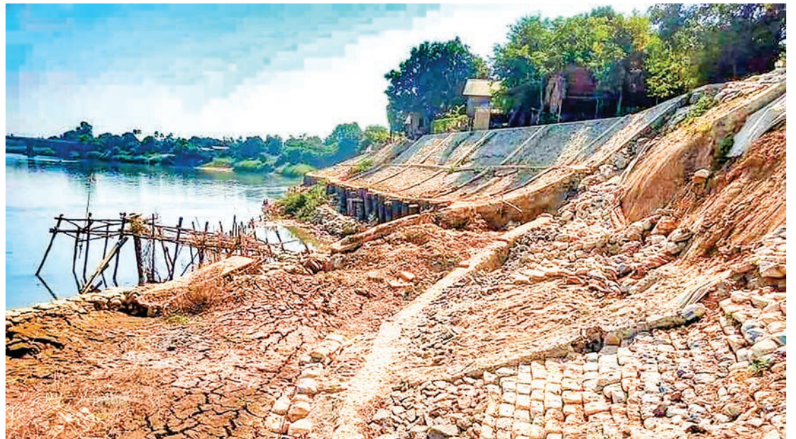
A work processing area of River bank protection project seen in Mandalay Region.

“A total of 44 companies submitted tender applications, the closing date of which was 9 January. Last year, some of the activities were carried out by the department. But this year, the department will only supervise the project. The project will be implemented by the