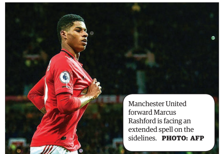
Manchester United forward Marcus Rashford is facing an extended spell on the sidelines.

"We've had many injuries to big players this season, it's just an unfortunate position that we are in. The window is open and it might be that we look at something for the short term." —AFP