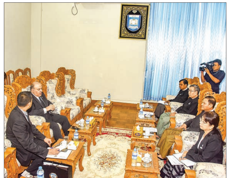
Union Attorney-General U Tun Tun Oo meets with Charge d' Affaires a.i. of Embassy of Kuwait Mr Adel Al Adgham in Nay Pyi Taw yesterday.