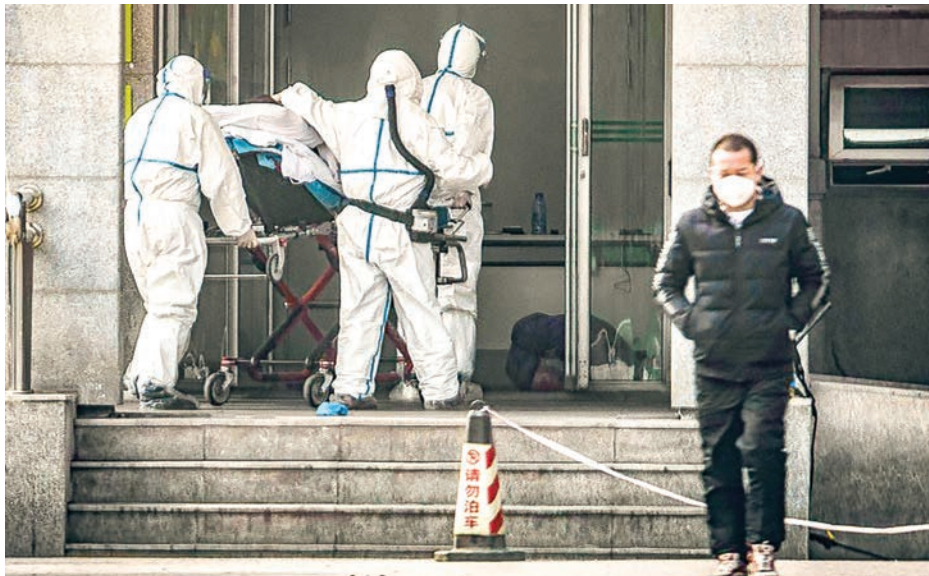
No human-to-human transmission has been confirmed so far, but authorities have previously said the possibility 'cannot be excluded'.

Xi said it was necessary to "release information on the epidemic in a