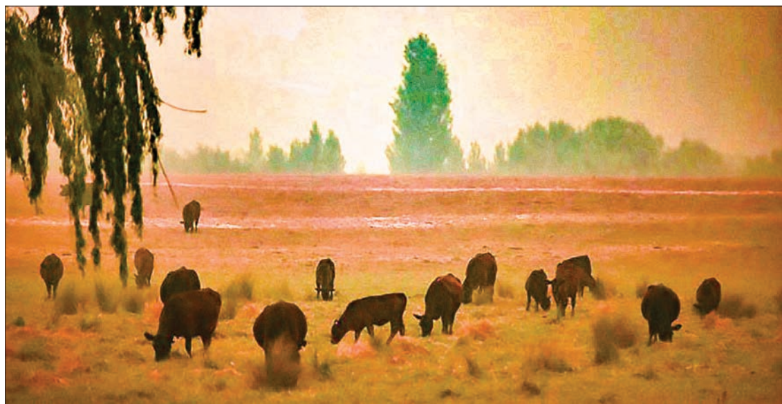
Australia has since October been overwhelmed by an unprecedented bushfire season made worse by climate change.

This one was “more spectacular” than the typical dust storm, she added. “It was honestly like an apocalyptic movie, a huge wave coming towards us, really quite impressive, but I just wish it actually brought a good amount of rain, not dust.” — AFP ■