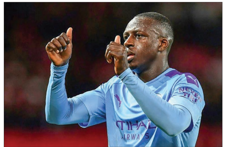
Benjamin Mendy expects Manchester City to enjoy a strong second half of the season.