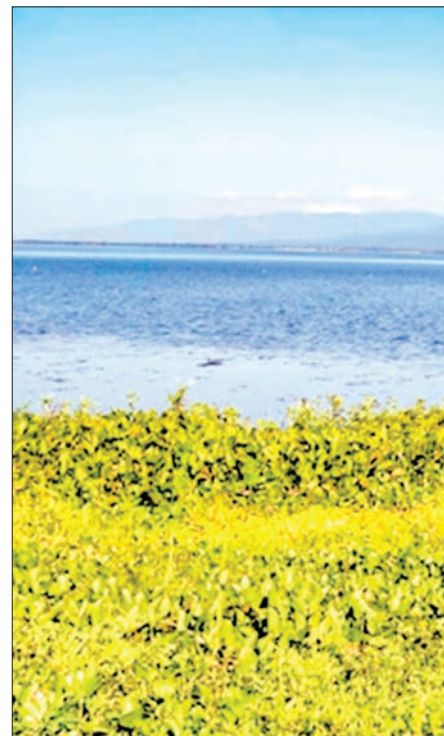
A visitor enjoys boat ride in the Indawgyi Lake in Mohnyin Township.