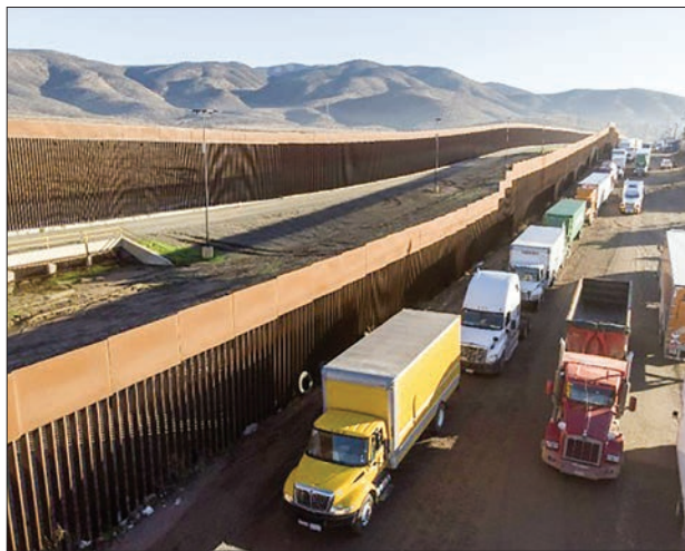
Aerial view of trucks lining up near the border fence to cross to the United States at Otay Commercial port of entry in Tijuana, Baja California state, Mexico, on December 10, 2019.

CHICAGO —Chicago Board of Trade (CBOT) crop futures ended this past week mixed as the United States signed or passed important deals with its key trading partners including China, Canada and Mexico.