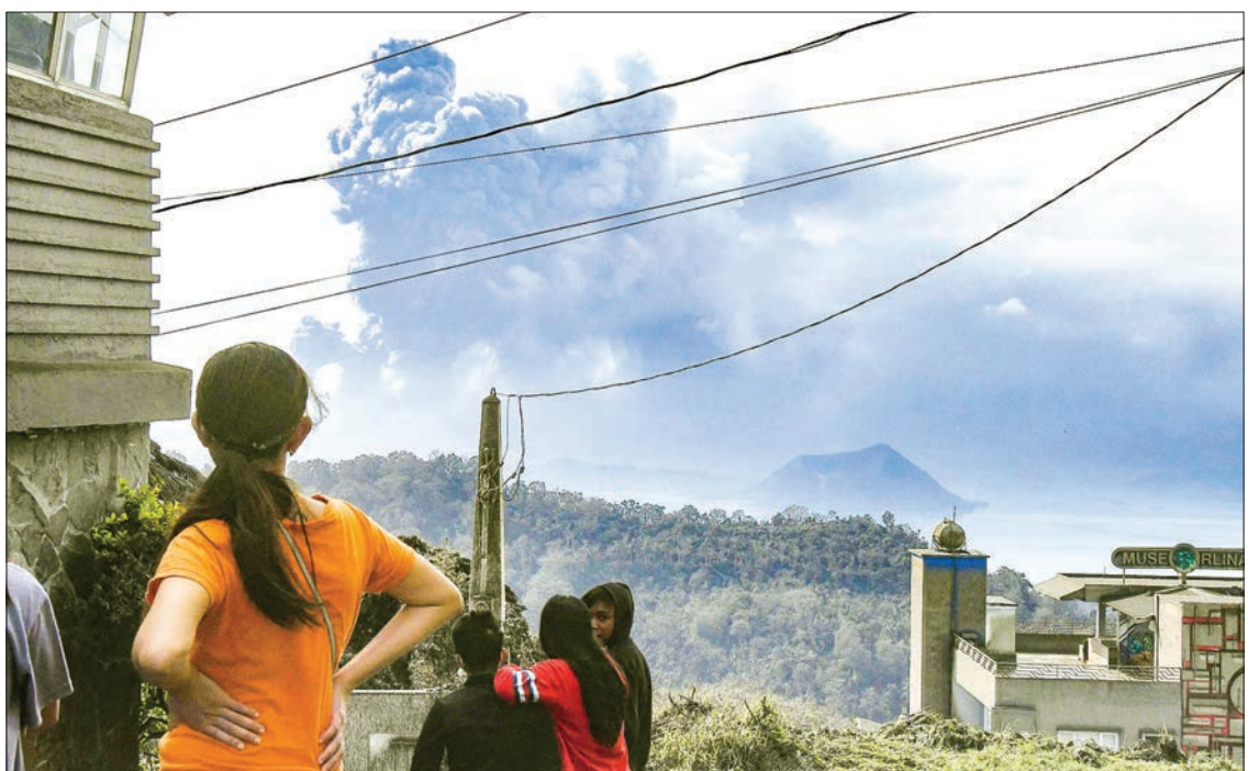
People in Tagaytay, south of Manila, look at Taal volcano spewing fumes on Jan. 13, 2020, following an eruption the previous day.

The volcano, which is just 311 meters high, is one of the most active in the Philippines.—Kyodo ■