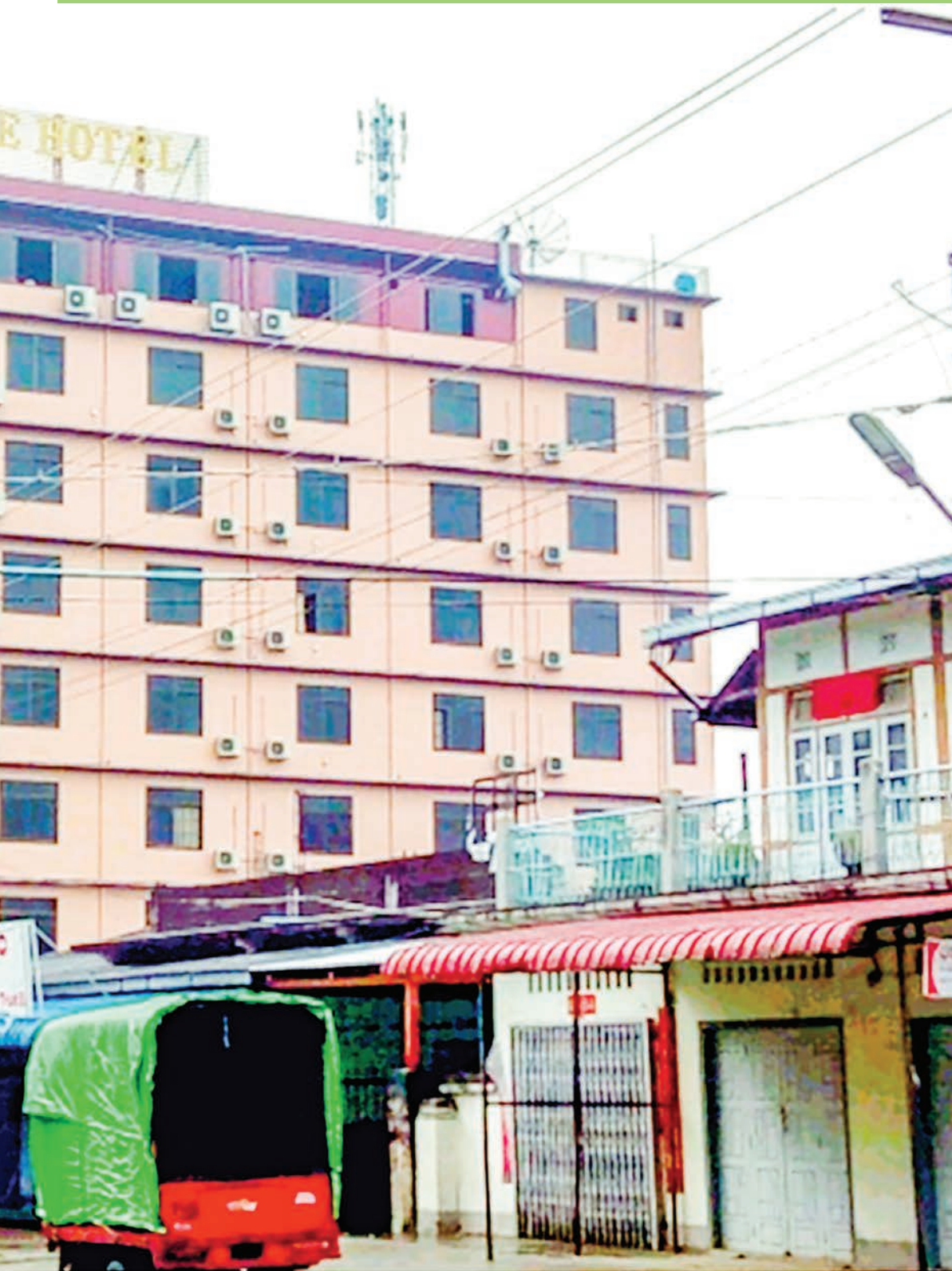
Photo shows one of the newly-built hotels in Kachin State's capital Myitkyina.

in 2018 from 26 with a capacity of 714 rooms in 2017. There are five hotels under construction in Kachin State, according to the DHT. More than 24,000 tourists