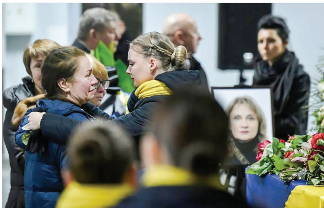
Relatives and colleagues attend a tribute ceremony and react in front of the flag-draped coffins of the 11 Ukrainians who died in a plane mistakenly shot down by Iran during a spike in tensions with Washington.

KIEV The flag-draped coffins of the 11 Ukrainians who died in a plane mistakenly shot down by Iran during a spike in tensions with Washington arrived in Kiev on Sunday.