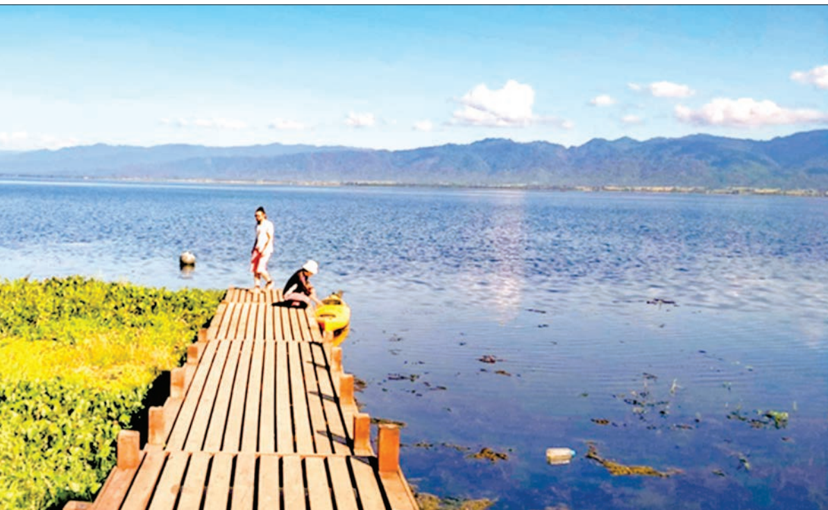
Tourists visit the Indawgyi Lake, one of the largest inland lakes in Southeast Asia.

foreigners visited Kachin State in 2017 whereas 103,972 visitors including 24,421 globetrotters traveled to the area in 2016. ■ ■ ■