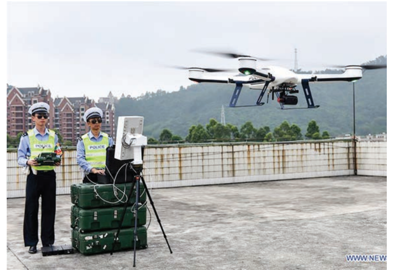
FILE PHOTO: Two traffic police officers prepare a drone to help them monitor highway condition in Guangzhou, South China's Guangdong provinc.

Authorities estimated that about 3 billion trips will be made during this year's 40-day "chunyun," or Spring Festival travel rush from Jan. 10 to Feb. 18, according to the National Development and Reform Commission.—Xinhua