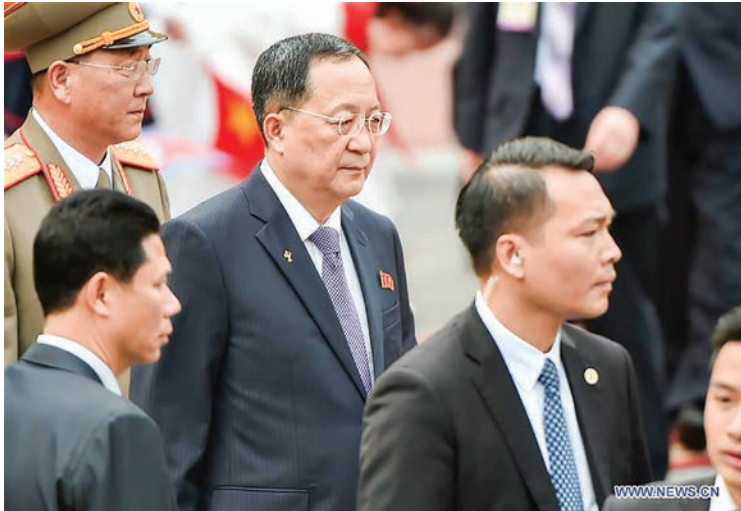
Foreign Minister of the Democratic People's Republic of Korea (DPRK) Ri Yong Ho (3rd, L) attends an activity in Hanoi, Vietnam, March 1, 2019.

BEIJING — North Korean Foreign Minister Ri Yong Ho, a career diplomat, has been replaced, North Korea-focused news site NK News reported Sunday, possibly signaling a shift in the country's dealings with Washington