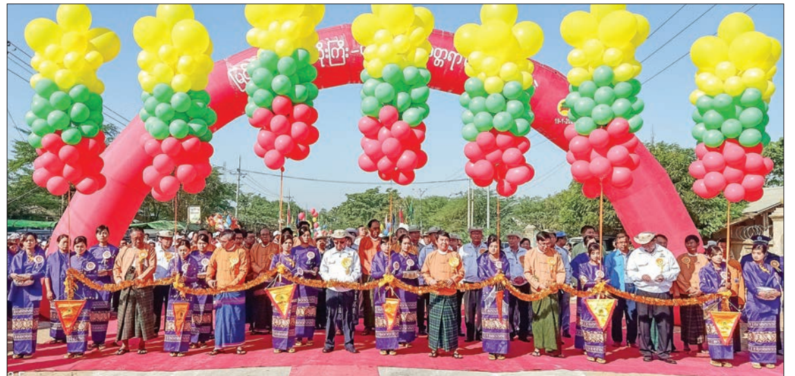
Union Minister U Han Zaw and officials open the new tarred road between Natogyi and Taungtha townships of Myingyan District, Mandalay Region yesterday.

A new tarred road between Natogyi and Taungtha townships of Myingyan District, Mandalay Region, was opened yesterday morning.