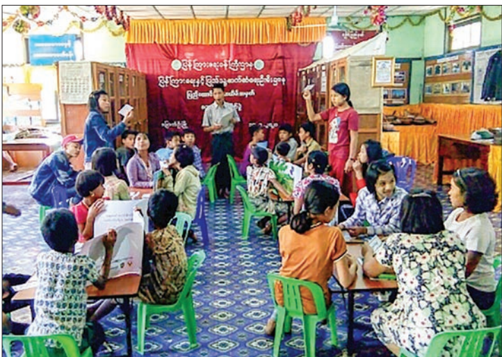
Children participating in the proverbs game competition in Mrauk U yesterday.