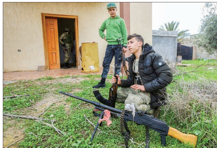
Fears are growing that Libya could become the theatre of a proxy war fought by several international powers.

The move underlined the devastating impact of foreign influence in the crisis, in which Sarraj’s GNA is backed by Turkey and Qatar while Haftar has the support of Russia, Egypt and the United Arab Emirates.—AFP ■