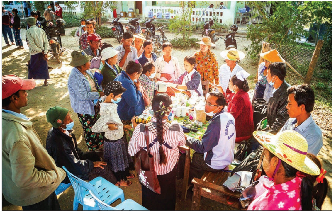
Medical team provide free TB treatments to the patients from villages in Kanbalu Township.

The medical team will also provide free TB treatments to the patients of Mae Htae, Htangone, Chatgyi and Koe