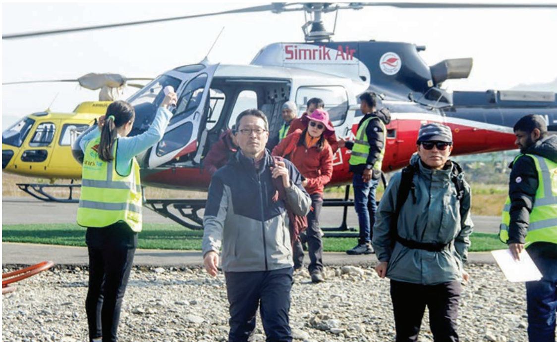
Helicopters were sent out on Saturday to rescue about 200 people stranded around Annapurna and other nearby mountains after the avalanche.

KATHMANDU — Avalanches, heavy snow and poor visibility hampered the search Sunday for four South Koreans and three Nepalis caught in an avalanche in the popular Annapurna region of the Himalayas, officials said