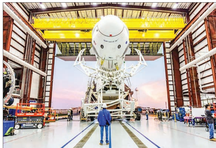
SpaceX Falcon 9 rocket with the company's Crew Dragon attached, rolling out of the company's hangar at NASA Kennedy Space Center.

The rocket could explode and possibly create "a fireball