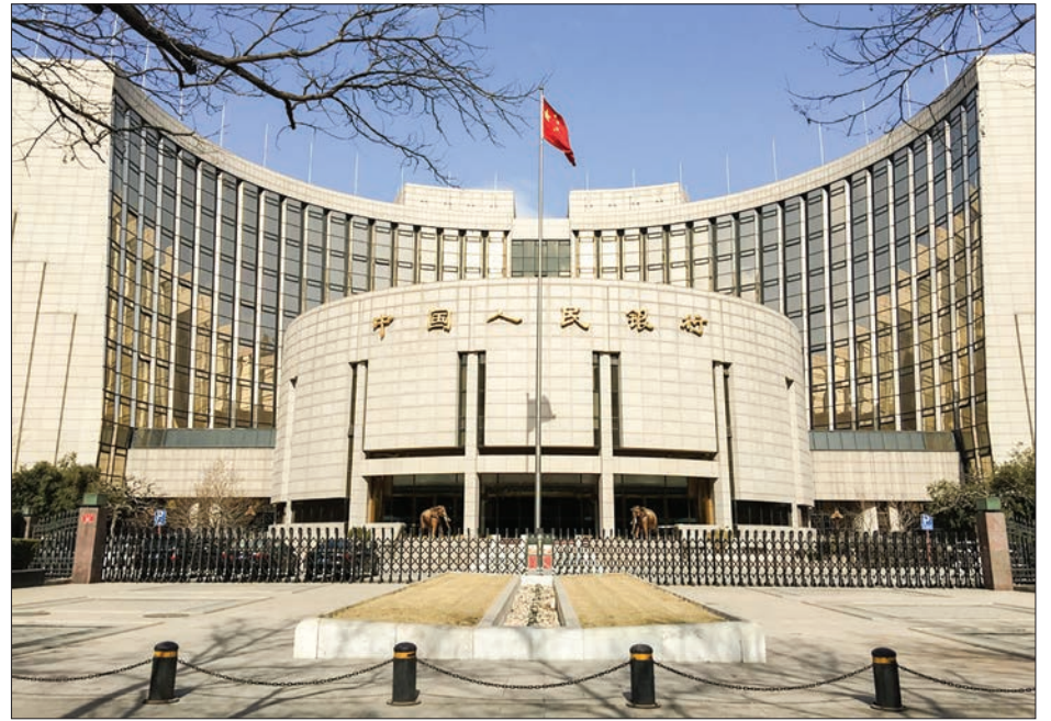
The new system will provide more details of the credit status in a better format, such as co-borrowing records and loan repayment records, according to the People's Bank of China (PBOC).

agement and protection of user identity and information transmission to ensure information security, said the PBOC. China first launched its credit record system in 2006. By the end of 2019, the system had kept records for more than 1 billion individuals and 28.34 million enterprises and organizations. Some 2.5 billion inquiries have been conducted with the system so far, according to the central bank.—Xinhua