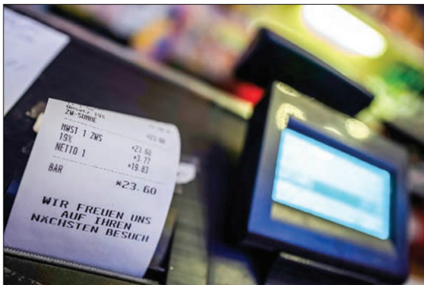
German retailers and customers are unhappy with the requirement that a receipt must be printed for each transaction. PHOTO: AFP

“They should worry more about people like Amazon, make them pay their taxes in Germany,” she added.—AFP