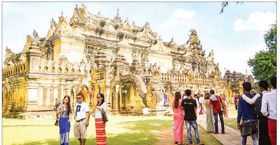
Holiday makers through the Me Nu Oak Kyaug (brick monastery) in Inwa.

The monastery was donated by King Bagyitaw of the Konbaung dynasty and Chief Queen Namadaw Me Nu in 1822. It was damaged in an earthquake in 1838 and restored in 1873 by Sinphyumashin, the daughter of Me Nu. The monastery is a