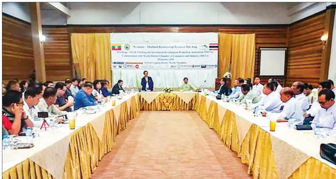
Myanmar-Thailand Relationship Business Matching Meeting being convened in Myeik on 18 January.

ing system in Prachuap and Myeik, permits for Thai citizens opening bank accounts in Myanmar, and the formation of a working group comprising ten representatives each from Myanmar and Thailand to promote trade. They also talked about the healthcare sector, tourism, and SME development. Later, they exchanged commemorative presents. About 100 PMTA members attended the business matching event. Border trade through Myeik gate was estimated at US$52.9 million in the past three months of the 2019-2020 fiscal year compared with $68.7 million registered in the year-ago period. —Myeik IPRD (Translated by Ei Myat Mon)