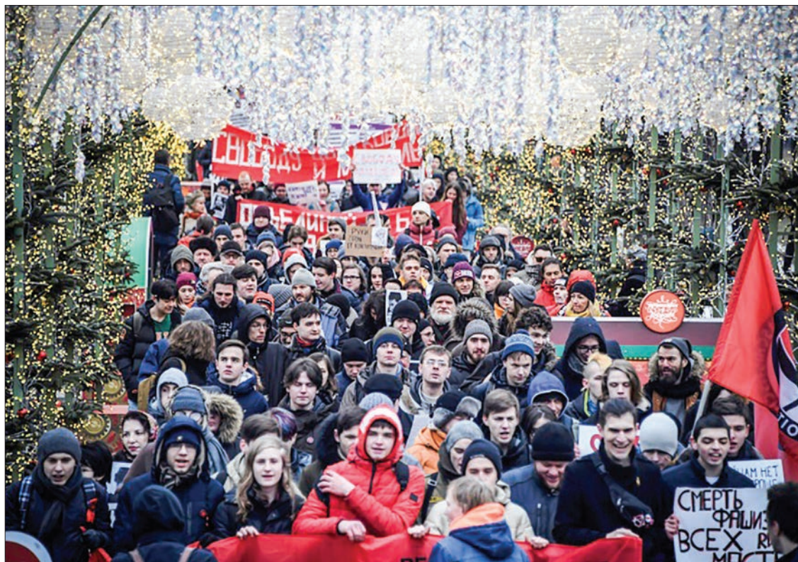
The march wasn’t supposed to be about Putin, but many had a go at him anyway.

Many observers have said Putin’s proposals are designed to ensure his grip on power after he leaves the Kremlin and his critics have accused him of orchestrating a “constitutional coup”.—AFP ■