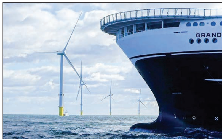
Offshore wind currently provides about seven percent of British electricity.

Britain plans to favour the development of colossal offshore wind farms given the country's relatively small land mass.— AFP ■