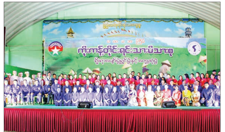
Union Minister Nai Thet Lwin, officials and ethnic youths pose for a group photo at the gathering ceremony of Kokang families at the National Races Village in Yangon yesterday.