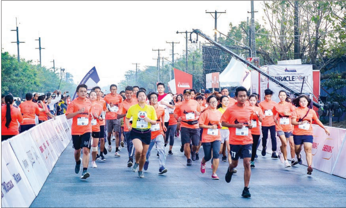
Athletes participating in the 8 th Yoma Yangon International Marathon.

WITH aiming to connect communities both locally and internationally through a mutual passion for running and promoting healthy lifestyles in Myanmar, the 8 th Yoma Yangon International Marathon was organized yesterday morning, with the participation of over 11,000 runners from Japan, Singapore, Thailand, China, Malaysia and France, together with the locals.