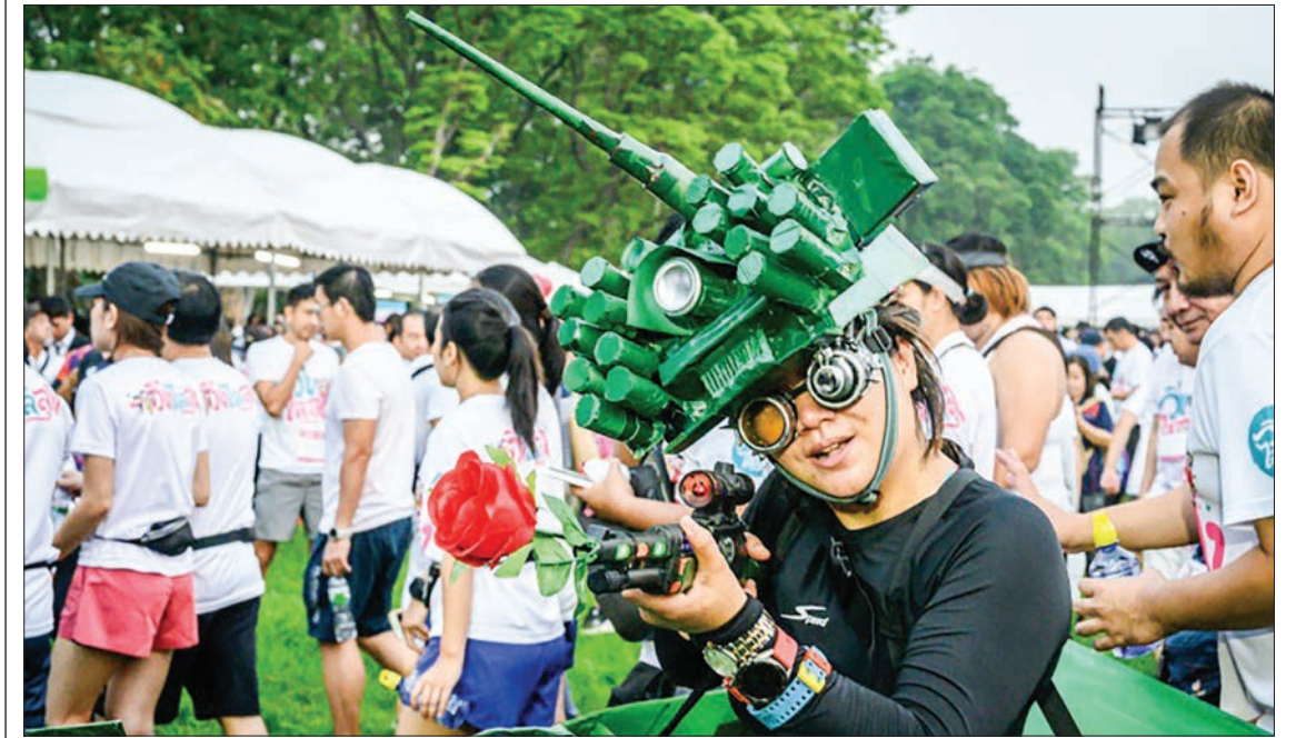
Many participants wore costumes for the anti-government fun run.

His Future Forward Party meanwhile is bracing for possible dissolution, with the court set to rule later this month on a petition to disband it over an alleged election law violation.— Kyodo News