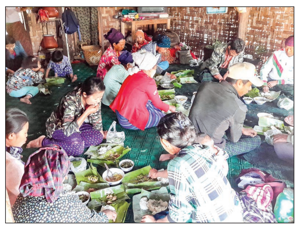
Local people enjoy new harvest feast.

The village is more than two hours drive from Hopin by motorcycle. Red Shan, Bamar and Kachin ethnics are resid-