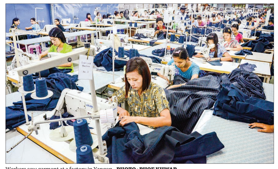
Workers sew garment at a factory in Yangon.

CMP businesses have been valued at US$608.9 million for the three months since October in the 2019-2020 fiscal year, an increase of $49.49 million compared with the year-ago period, according to the Ministry of Commerce.