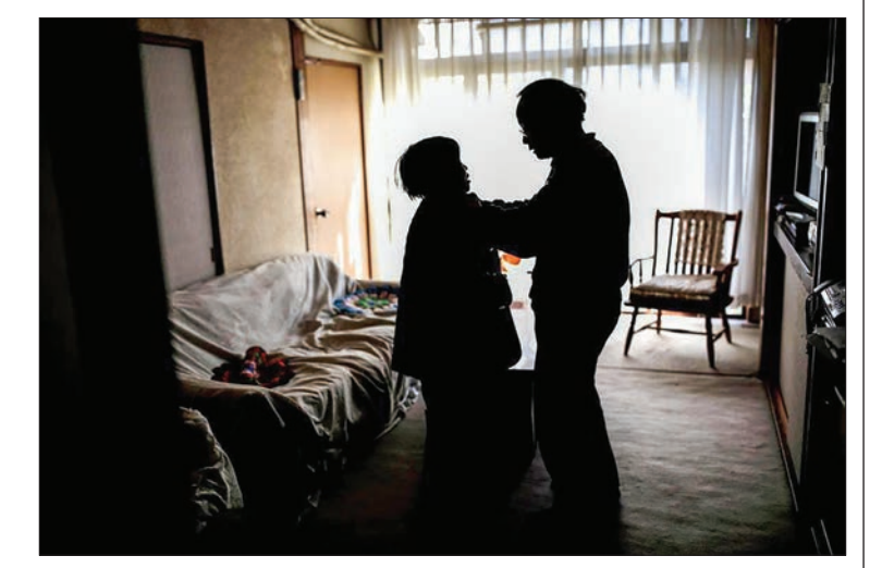
Patients with language impairment due to Dementia have shown signs of reading and speech inefficiency.

named after Sir Alfred Wallace, who was the most famous historical collector exploring the area.—ANI ■