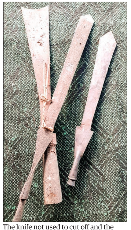
spear not used to stab.

Although the feast hosted by individuals ended its pro-