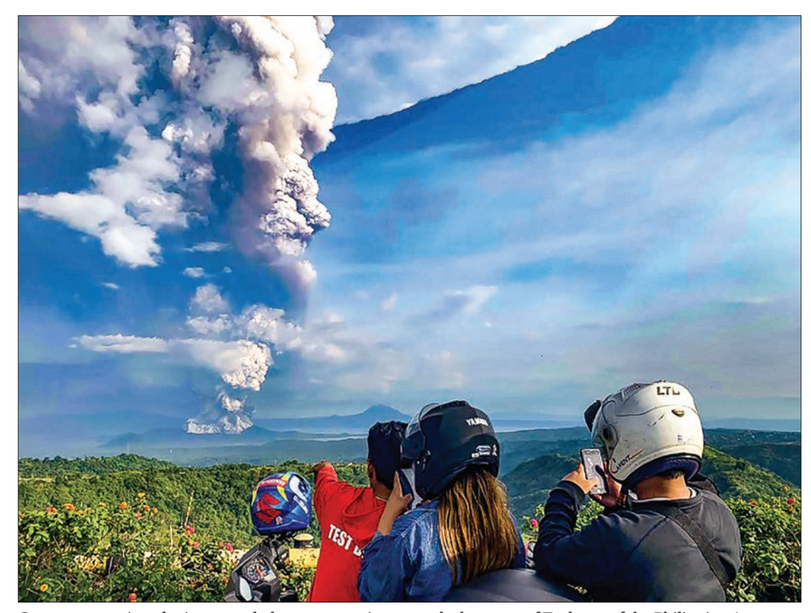
Government seismologists recorded magma moving towards the crater of Taal, one of the Philippines' most active volcanoes.

Earthquakes and volcanic activity are not uncommon in the Philippines due to its position on the Pacific "Ring of