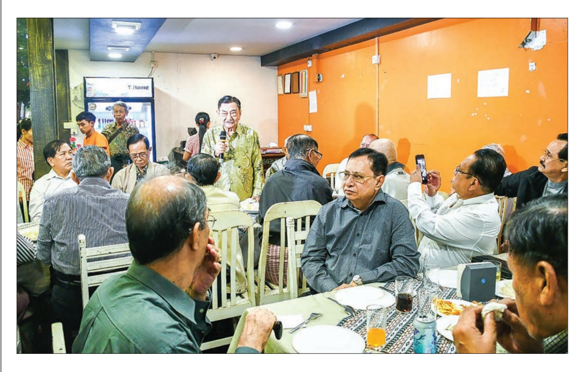
Former Staff from Ministry of Foreign Affairs hold annual gathering in Yangon yesterday.

Trade Mark ACS Call Thin Thin May, Ph-09 251 022 355