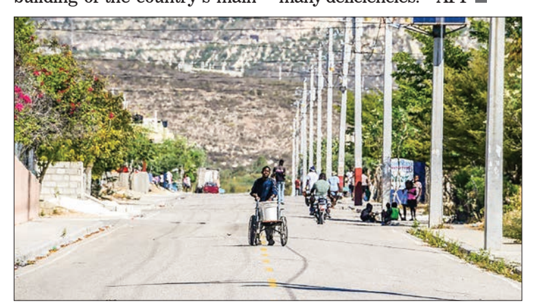
A man carries water on a wheelchair on a street in the Haitian city of Croix des Bouquets; 10 years after the devastating quake of 2010, life is little improved for many Haitians

hospital remains incomplete, and non-governmental organizations struggle to make up for the state's many deficiencies.—AFP ■