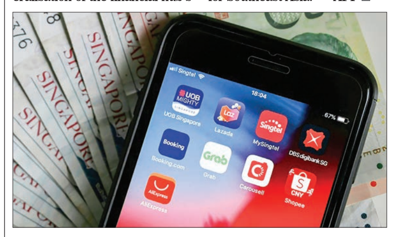
Traditional banks are being challenged by a new generation of onlineonly competitors.

"Singapore is the launchpad for Southeast Asia."— AFP ■