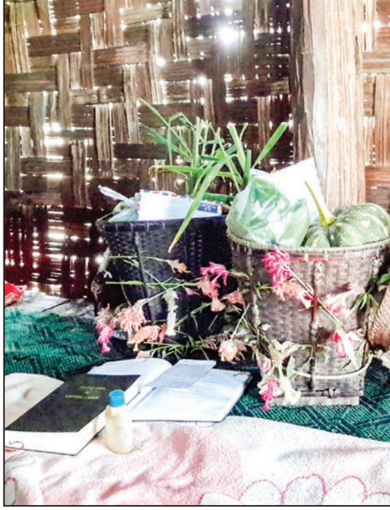
Tumpline for new harvest feast.

With regard to the feast of Christians, candles at the altar decorated with flowers are lit at the time when the house of host is full of guests, and the host explains the purpose of the feast. The father who led