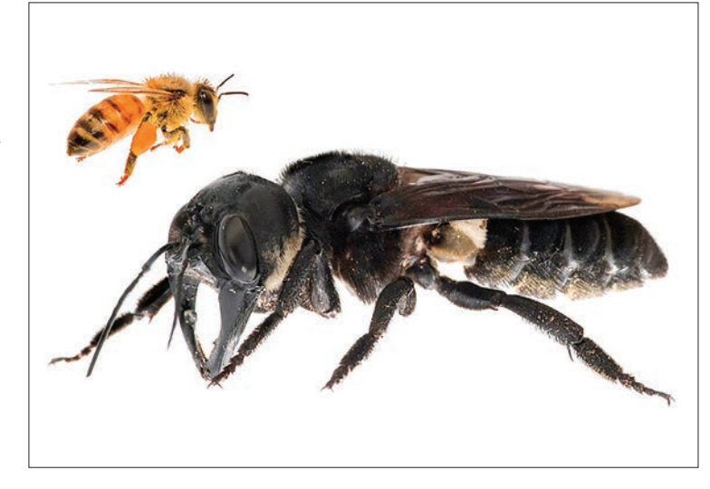
This file photo shows a living Wallace's giant bee (Megachile pluto) (R), which is approximately four times larger than a European honeybee, after it was rediscovered in the Indonesian islands of the North Moluccas.

in Indonesia's Wallacea region, an archipelago at the interface between the Oriental and Australian biogeographical realms,