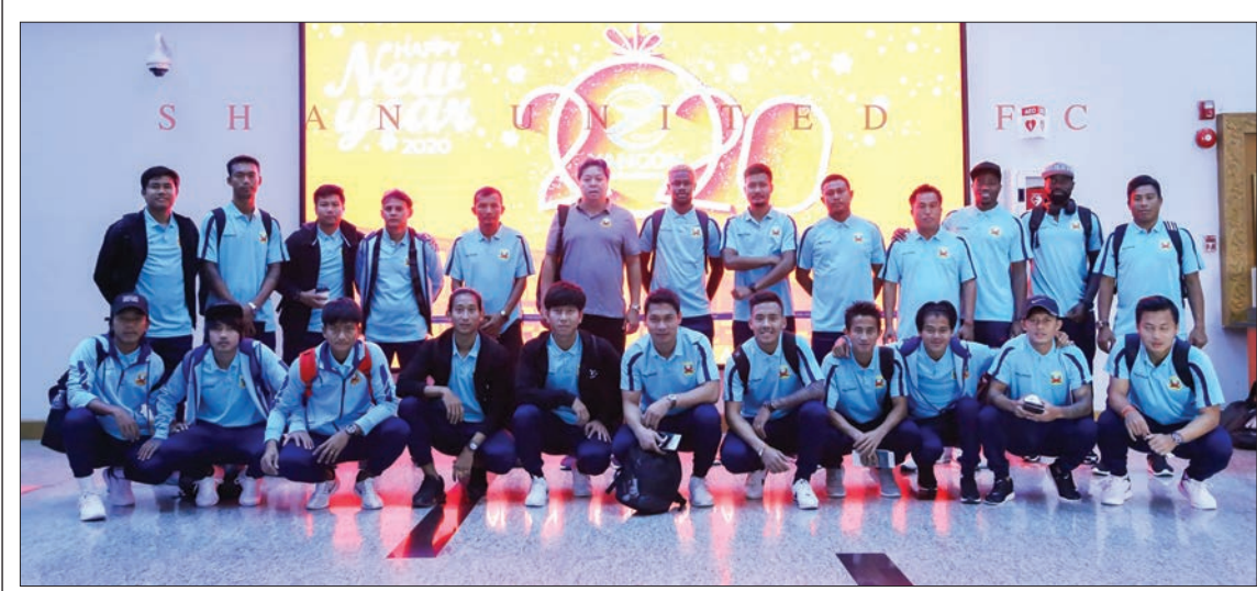
Shan United pose for a group photo at the Yangon International Airport before leaving for Manila, the Philippines.

The winning team will play an away game against Port F.C. of Thailand in the preliminary stage 2 match scheduled on 21 January.—Lynn Thit (Tgi)