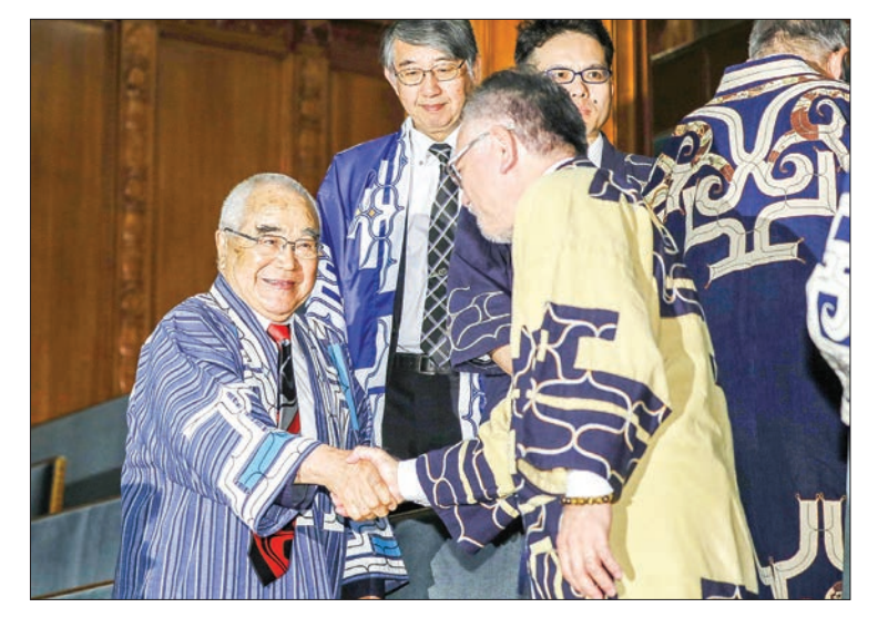
Ainu people celebrate after legislation aimed at protecting and promoting their culture is enacted following its passage through the House of Councillors in Tokyo on April 19, 2019. The law stipulates for the first time the Ainu, an ethnic minority in northern Japan, are an "indigenous" people.

But some Ainu have criticized the legislation, saying it