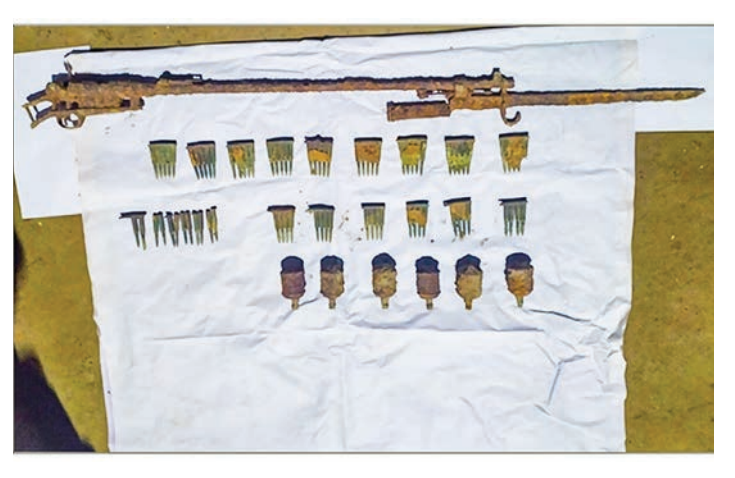
Remains of Japanese soldiers from the World War II era discovered in Ngazun.