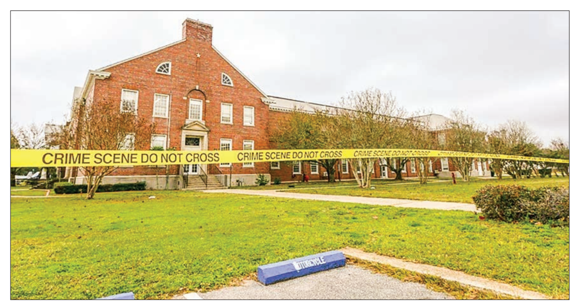
Police tape cordons off an area after a shooting at the Pensacola Naval Air Station in December 2019

WASHINGTON — The United States will expel at least a dozen Saudi military students accused of extremist links and child pornography, after an investigation