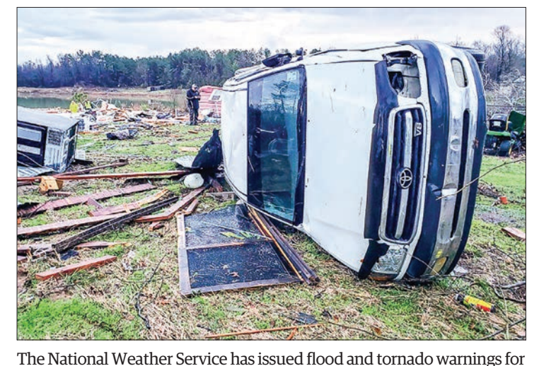
several states.

WASHINGTON — Severe storms sweeping the southern US killed at least 11 people, authorities said, as tornadoes and high winds upturned cars, destroyed homes and left tens of thousands without power.