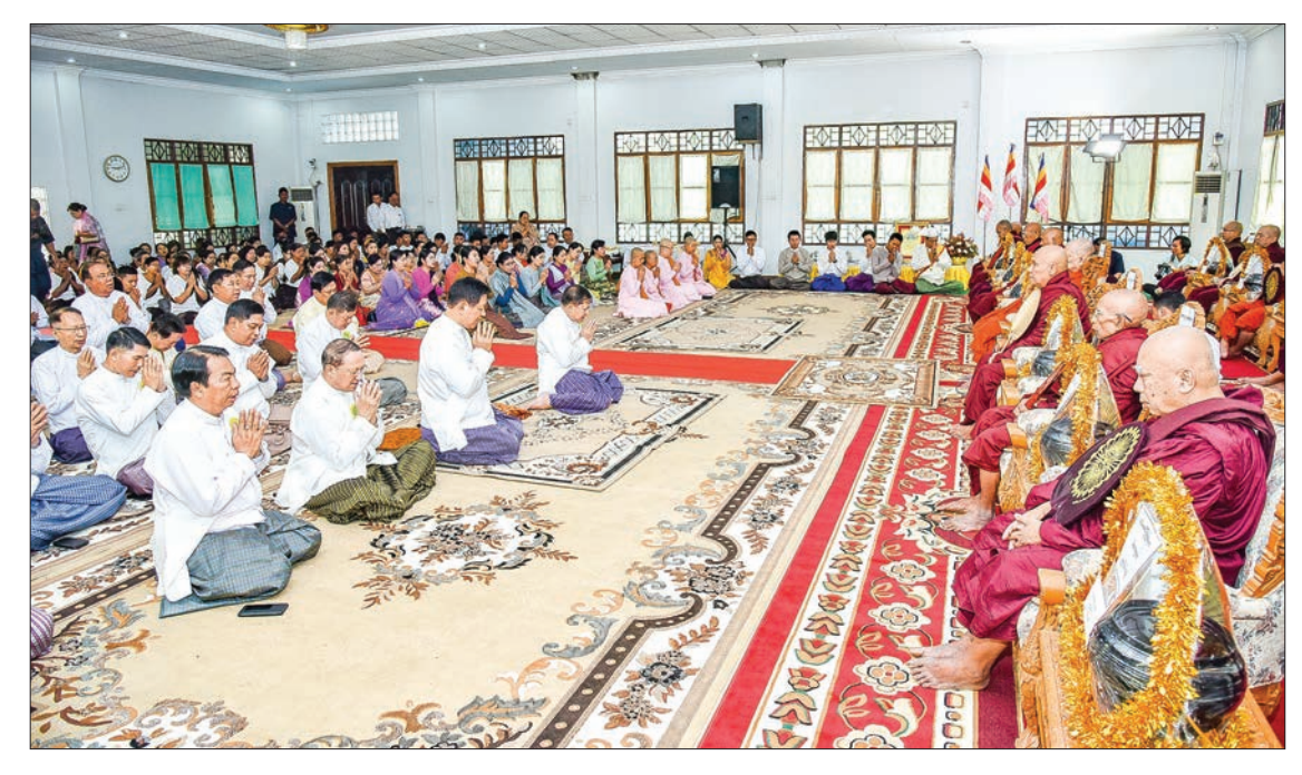
The congregation led by Senior General Min Aung Hlaing pay homage to the members of Sangha at the state driving ceremony at Kabar Aye Pagoda Road in Yangon yesterday.

After the stake-driving ceremony, the Senior General offered soon (a day meal) to the members of the Sangha, according to information released by the Office of the Commander-in-Chief of Defence Services. — MNA (Translated by Kyaw Zin Tun)