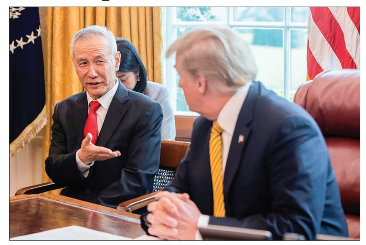
China's Vice Premier Liu with US President Donald Trump in 2019 is expected at the White House again for the signing of a "phase one' trade deal between the two economic powers.

Han Jun, vice minister of agriculture in Beijing, said the partial agreement also would boost China's farm exports to the United States, including cooked