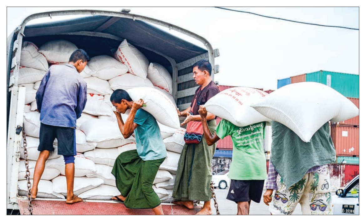
Workers loading the truck with sacks of rice at Botahtaung Jetty in Yangon .

At present, rice is being exported to China through a gov-