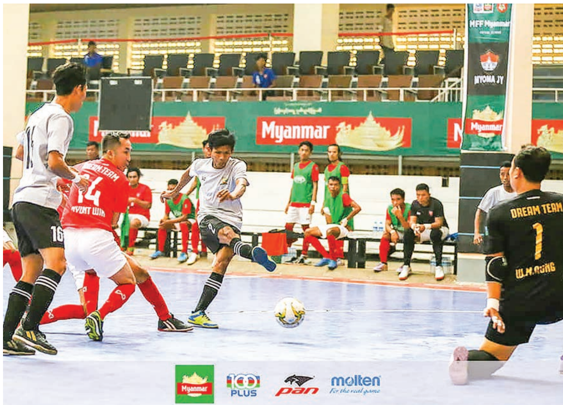
A player from AMM Brothers FC attempts to score during the match against Dream Team FC in Week-12 of Myanmar Futsal League at National Indoor Stadium II in Yangon yesterday.

VICTORIA University College (VUC) Futsal Club and GV Futsal Club saw big victories