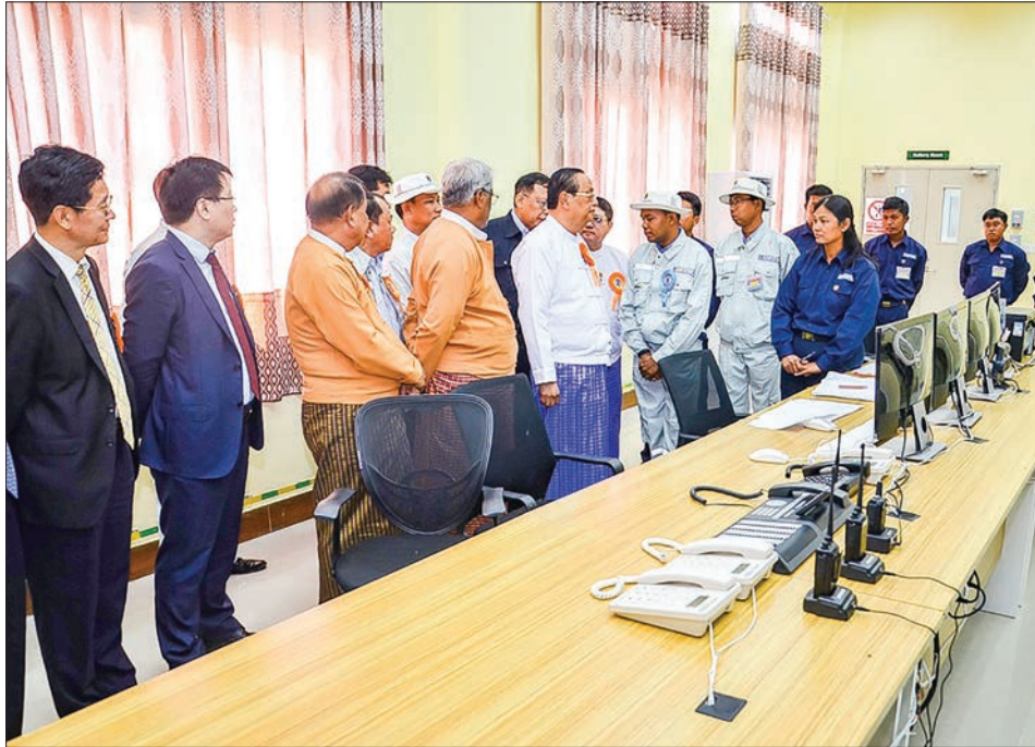
Union Minister U Win Khaing meets with officials from the sub station yesterday.