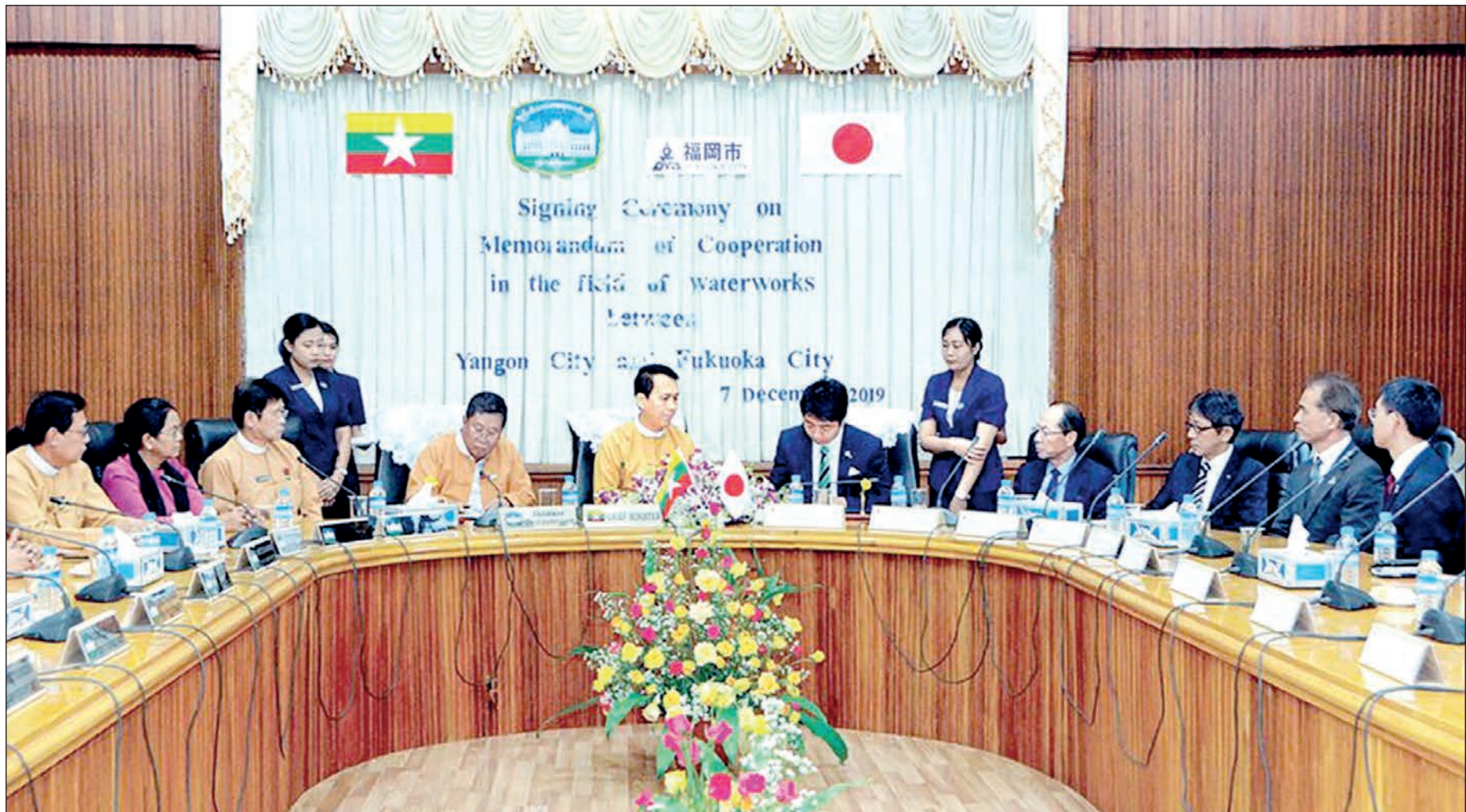
Signing Ceremony in progress.