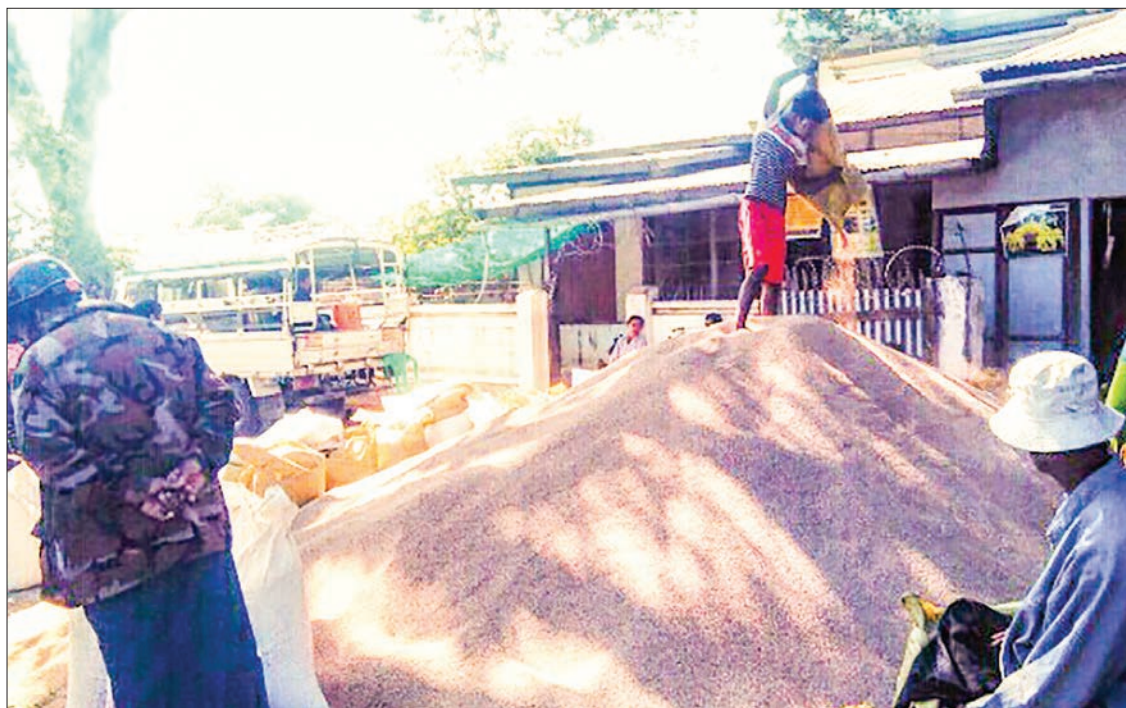
Farmers collecting sesame near a warehouse in Sagaing.