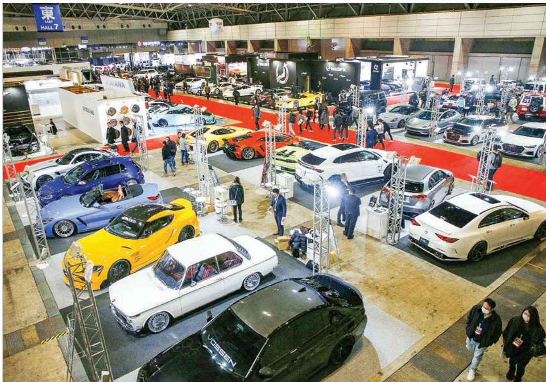
Photo taken on 10 January 2020, shows Tokyo Auto Salon trade show at Makuhari Messe convention center in Chiba, near Tokyo.

TOKYO — Automakers and auto parts manufacturers from Japan and abroad displayed on Saturday some 800 custom and race cars at an auto show near Tokyo.