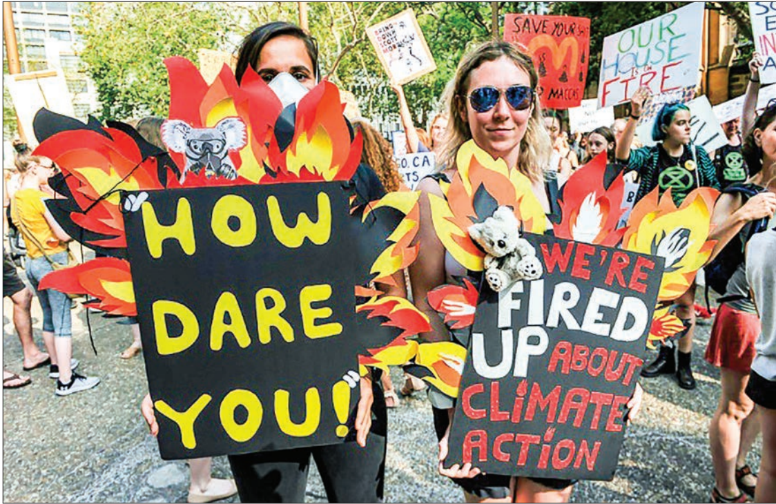
This year is the deadline for the landmark deal to go into effect, yet half a decade of diplomatic wrangling has fallen far short of what science says is needed to avert disastrous climate change.