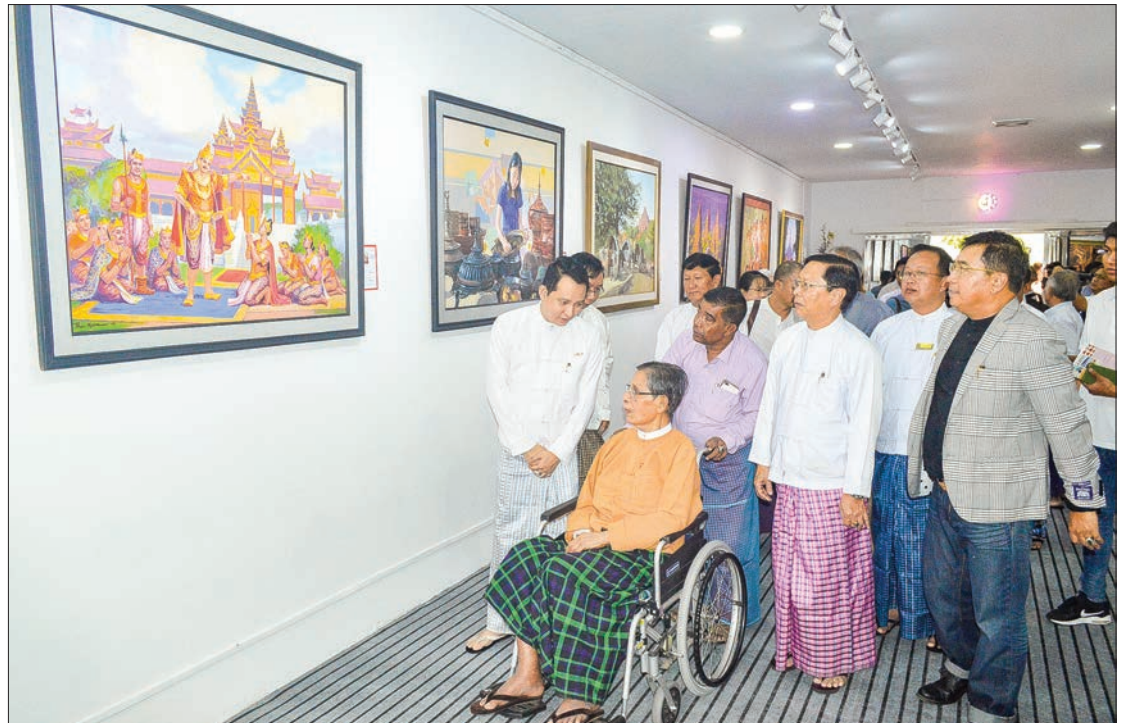
Patron of the National League for Democracy U Tin Oo, Union Minister Thura U Aung Ko and officials observe the art works at the Anawrahta Art Gallery in Yangon yesterday.

Art works by 70 artists are exhibited free of charge for public viewing from 11 to