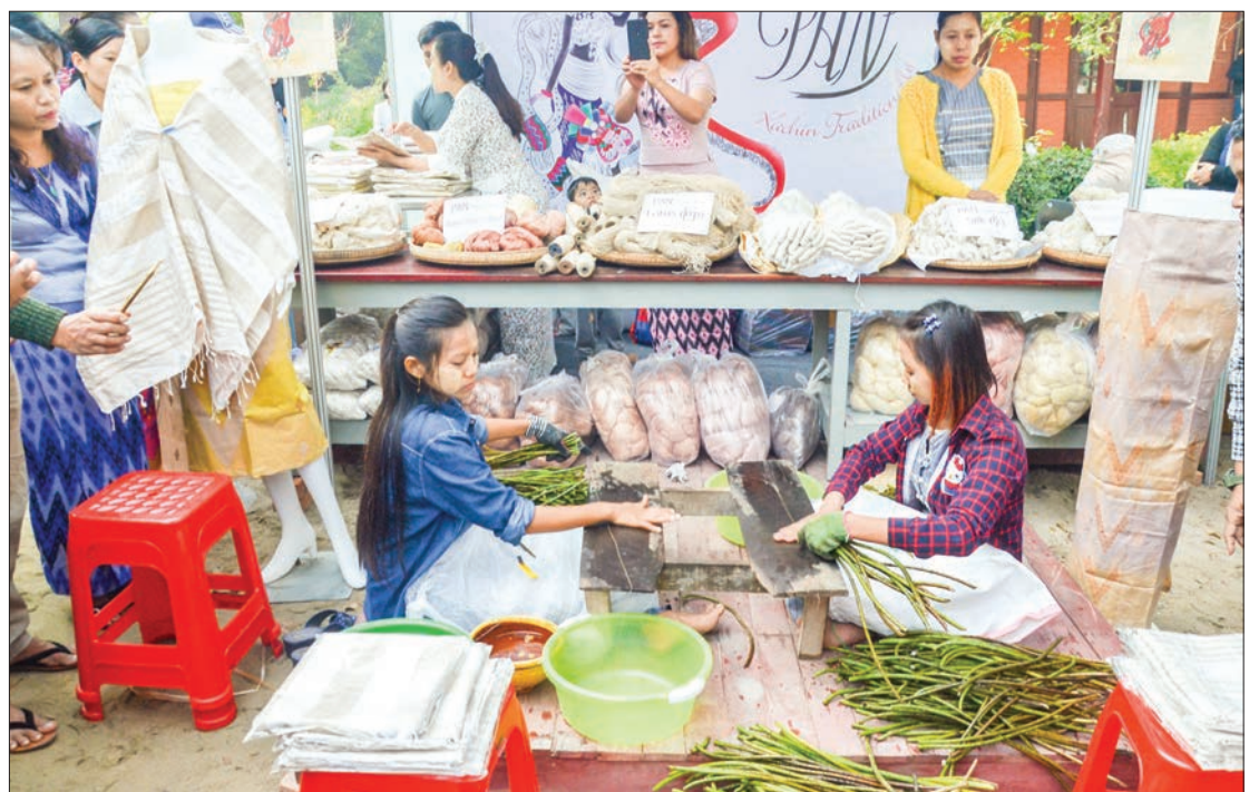
Women showing how to prepare for lotus threads for making lotus towels at a booth.