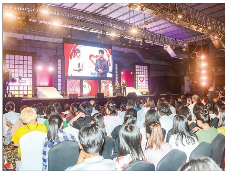
Audience enjoy the Japanese TV episodes at Yangon Convention Centre yesterday.

A Japanese organization sponsored the J Series Festival or the Japanese TV episodes for first time in Myanmar at Yangon Convention Centre (YCC) yesterday evening. The main organizer, the executive committee of the International Drama Festival in Tokyo, has held the J Series Festival for five times in Thailand, two times in Indonesia and one time each in Vietnam and Tai-