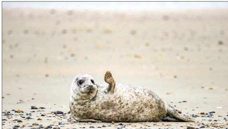
Grey seals come to Helgoland island in the North Sea to give birth.

Dozens of tourists come each day to see the white-furred seal pups hop around the beach during the whelping season that lasts into January.