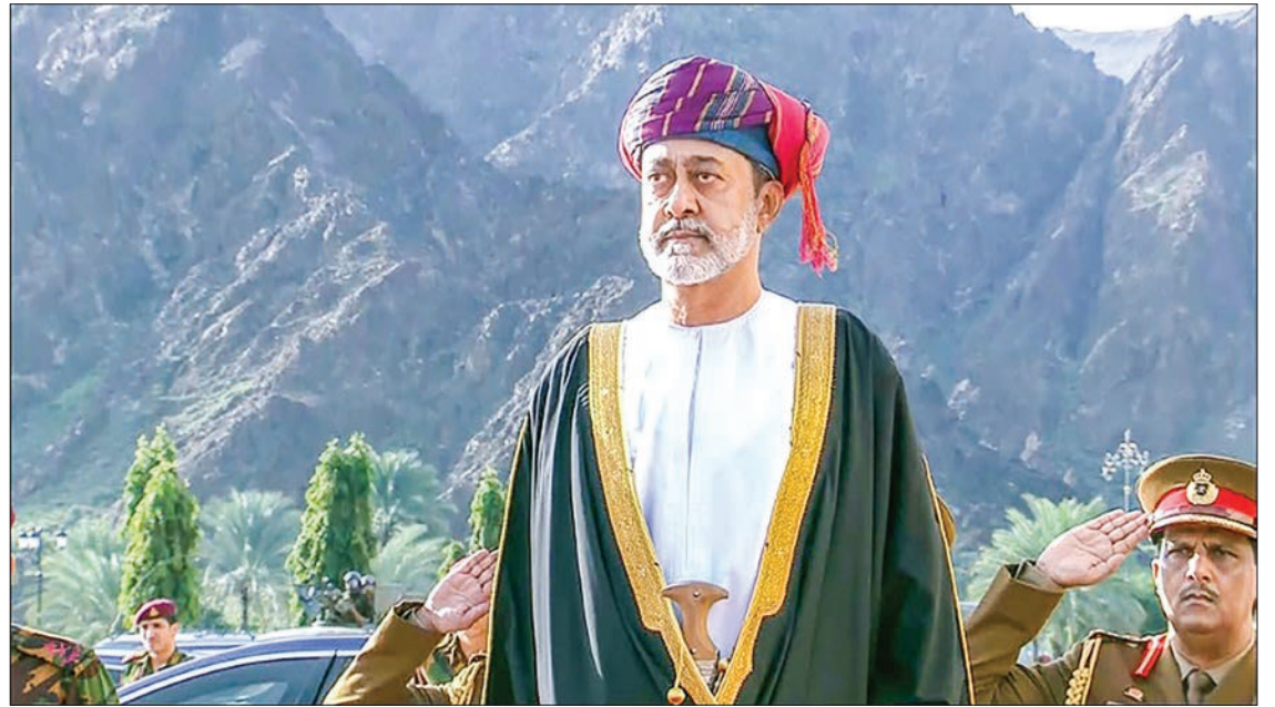
Oman's new ruler Haitham bin Tariq pledged to follow his predecessor's policy of neutrality.

The late sultan, who was unmarried and had no children, left no apparent heir. Under the constitution, his successor was to be selected in a meeting of the royal family. If they could not agree, the