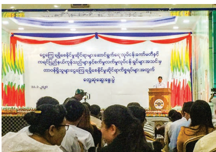
Deputy Minister U Maung Maung Win delivers the speech at the meeting with small- and medium-sized enterprises in Kayin State yesterday. (NEWS ON PAGE-1)