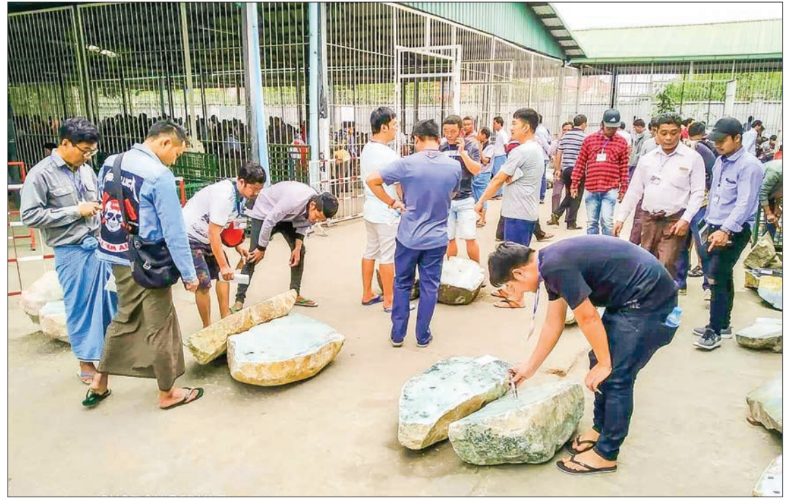
Merchants examine the jade lots displayed at the Mani Yadana Jade Hall in Nay Pyi Taw.

we are facing these problems because we are weak in cooperation. And what is more, we are selling gems and jewellery at a much cheaper price, because we receive and produce them cheaply. In fact, we first need to