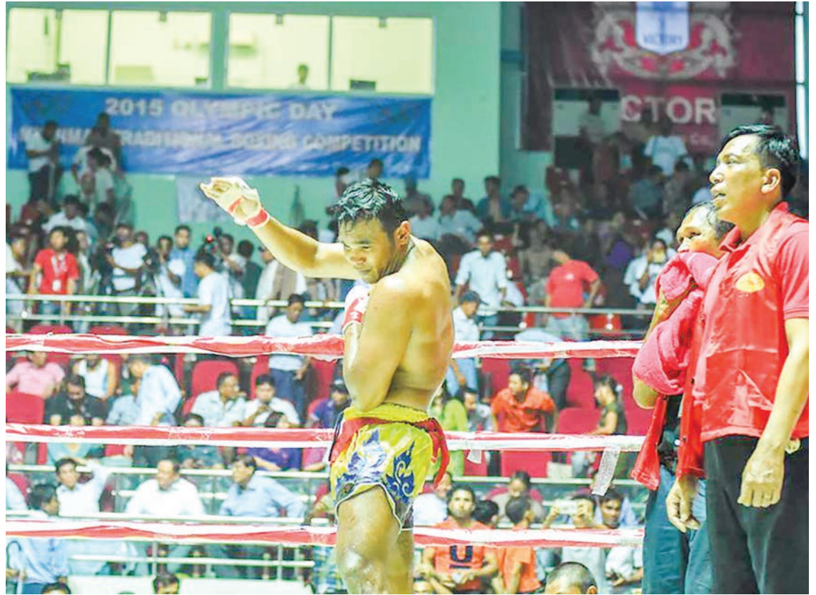
Myanmar lethwei star Tun Tun Min celebrating his victory at a lethwei challenge fight.

Tickets for the lethwei fights are priced at K 8000 and K 10000, according to the lethwei fights organisers.—Lynn Thit (Tgi)