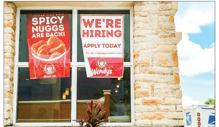
Retailers and restaurants hired at a solid pace in December 2019, but the US monthly average in 2019 was much slower than 2018.

Worker pay was a disappointment, rising only 2.9 percent compared to December 2018 — the first time that measure has fallen below three percent since July 2018. That still