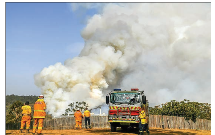
The milder conditions are expected to last around a week, giving firefighters time to try to get the fires under control.