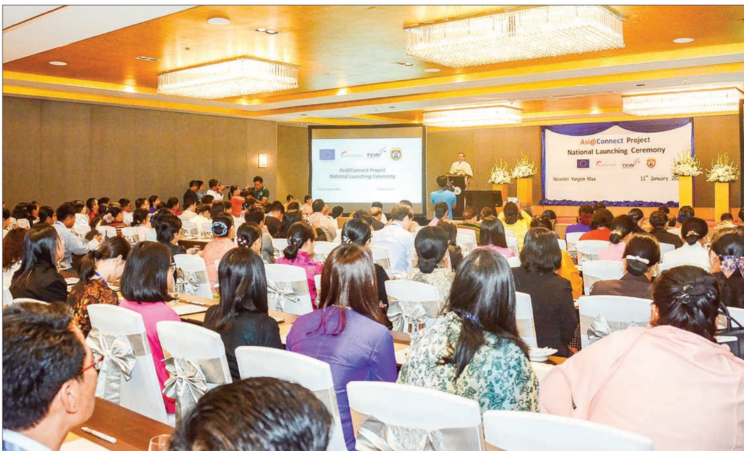
Union Minister Dr Myo Thein Gyi delivers the speech at the Asi@Connect National Launching Ceremony in Yangon yesterday.

T HE Asi@Connect National Launching Ceremony was held at the Novotel Hotel in Yangon yesterday, with an opening speech by Union Minister for Education Dr Myo Thein Gyi.