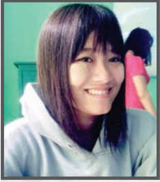
By Hnin Wint Bachelor of Commerce (Finance) (MEUE)

12 JANUARY 2020 THE GLOBAL NEW LIGHT OF MYANMAR