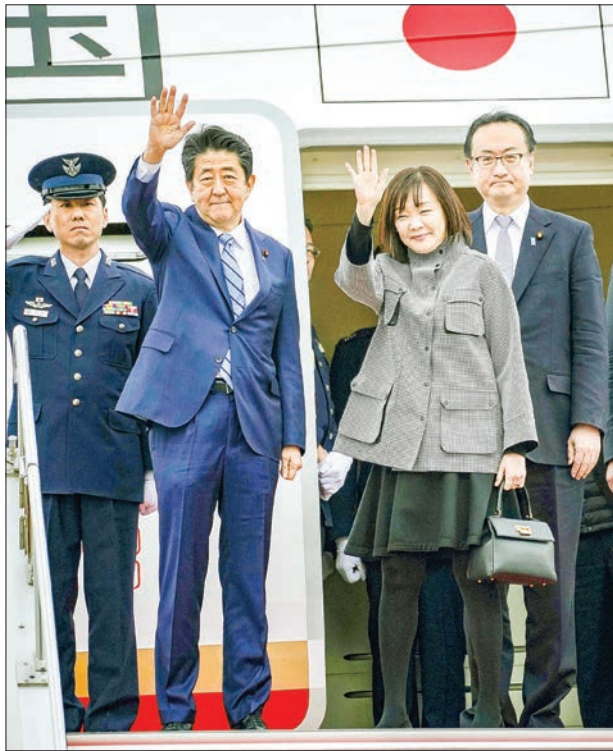
Japanese Prime Minister Shinzo Abe and his wife Akie wave at Haneda airport in Tokyo on 11 January 2020, kicking off his five-day tour to the Middle East.

own initiative to tenaciously conduct peace diplomacy so as to ease tensions and