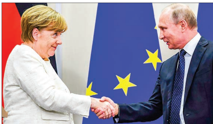
Libya and Iran will top the agenda for talks in Moscow between German Chancellor Angela Merkel and Russian President Vladimir Putin (pictured in Sochi in May 2018).

MOSCOW (Russia)—German Chancellor Angela Merkel met Russian President Vladimir Putin at the Kremlin on Saturday for talks set to focus on flashpoints in the Middle East.