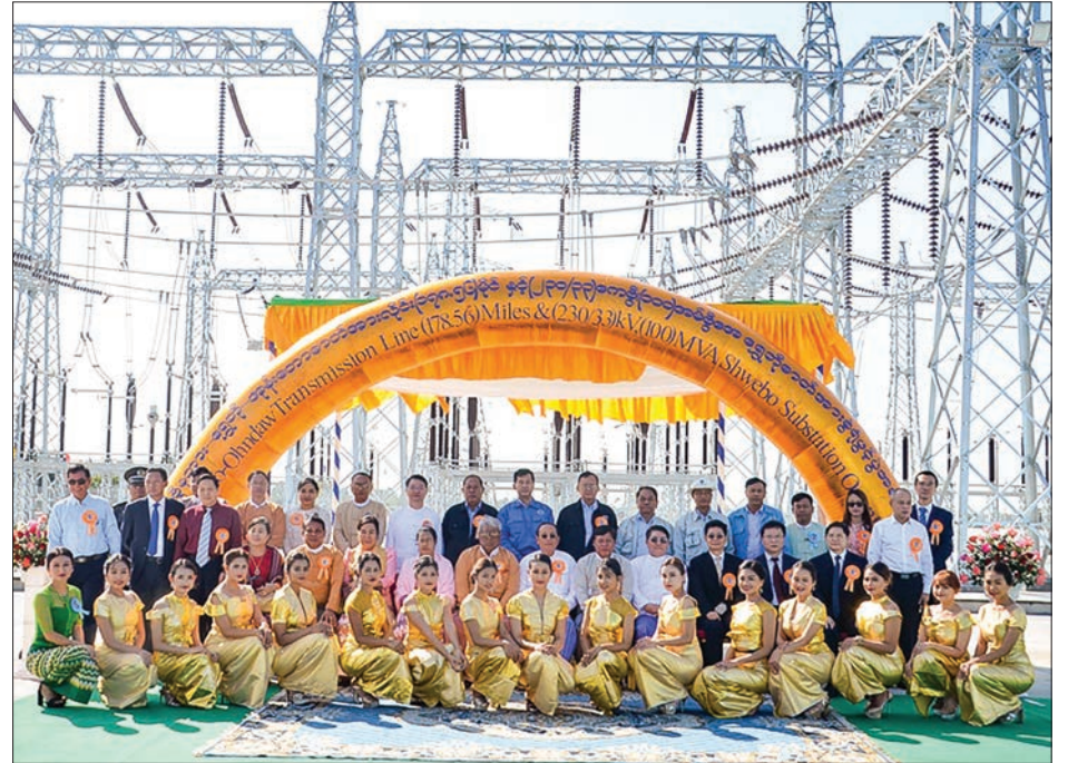
Union Minister U Win Khaing, officials and youths pose for a group photo at the opening ceremony of Sub Station in Shwebo yesterday.

THE 178.56 miles long 230-KV Nabar-Shwebo-Ohndaw cable powerline and the 230/33/11KV 100 AVA Shwebo main sub-power station in Shwebo, Sagaing Region, erected by the Department of Power Transmission and System Control (DPTSC) of the Ministry of Electricity and Energy was commissioned into service yesterday morning.