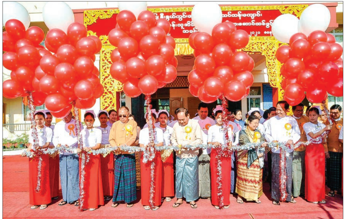
Union Minister Dr Myint Htwe and officials open the lecture hall, hostel and dining hall of Nursing Related Field Practice Training School in Yangon yesterday.

In his address, the Union Minister said sharing of knowledge and technology with the university has enhanced the efficiency of the ministry staff. Scholars who have completed their studies at the university should share and effectively apply their knowledge in the practical field. He urged the Niigata University to extend its cooperation with the departments and universities under the ministry in multiple sectors including research and development through