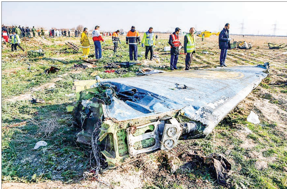
Iran has admitted that it shot down a Ukrainian airliner by mistake.

TEHRAN (Iran)—Iran said Saturday it “unintentionally” shot down a Ukrainian passenger jet, killing all 176 people aboard, in an abrupt about-turn after initially denying Western claims it was struck by a missile.