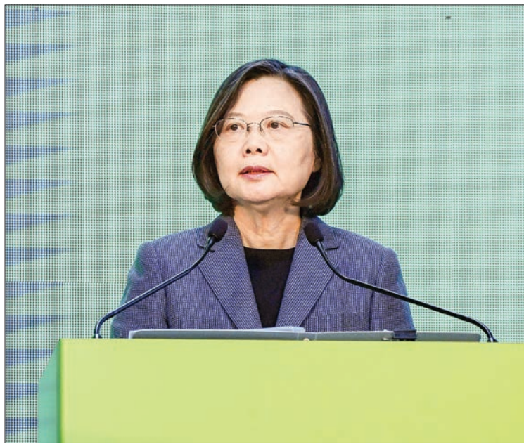
Taiwanese President Tsai Ing-wen of the Democratic Progressive Party in Taipei claims victory in the island's presidential election on 11 January 2020, defeating her main rival Han Kuo-yu of the main opposition Chinese Nationalist Party (KMT).

BEIJING — China warned that it will continue to oppose any kind of Taiwan's independence activities, hours after incumbent Tsai Ing-wen won a landslide victory in Saturday's presidential election.