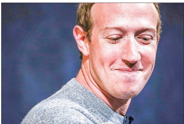
Facebook's Mark Zuckerberg has previously pledged to learn a language and eat only meat from animals he killed himself.

LOS ANGELES — Facebook CEO Mark Zuckerberg has ditched his annual new year's resolutions for a long-term list of goals and predictions that he posted on the social network, including a virtual reality boom and an emphasis on community.