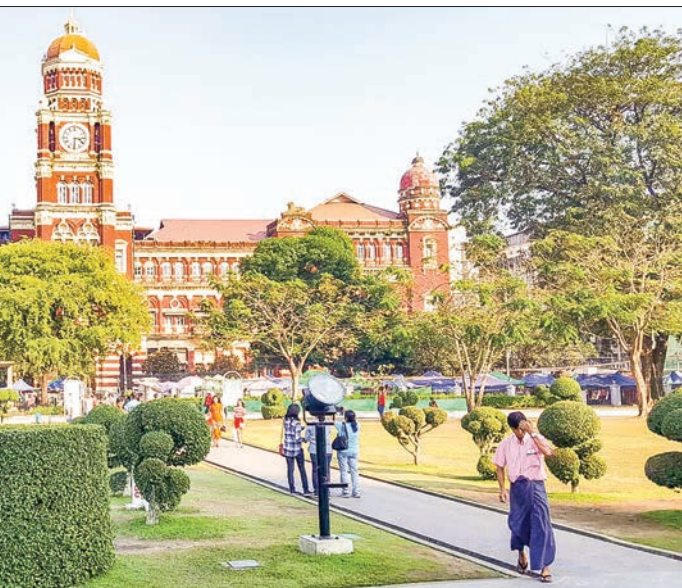
The photo shows Supreme Court installed with Blue Plaque in Kyauktada Township, Yangon (former High court building, built in 1911.)

The records of the YHT indicated that different religious structures