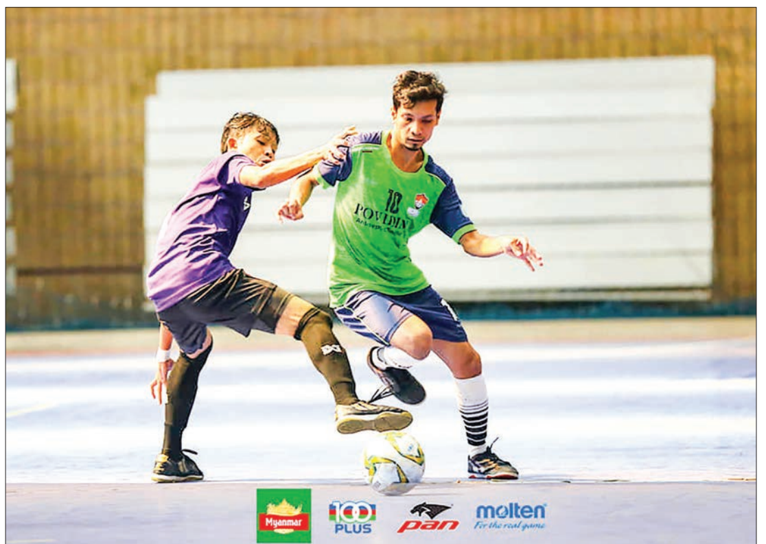
An MFF U-19 futsal player (violet) vies for the ball with a Myoma JY futsal team player (green) during the Week-11 match of the Myanmar Futsal League.

Rakhine United is currently seeking one more expatriate player for the team, according to the statement released by the football club.—Lynn Thit (Tgi)