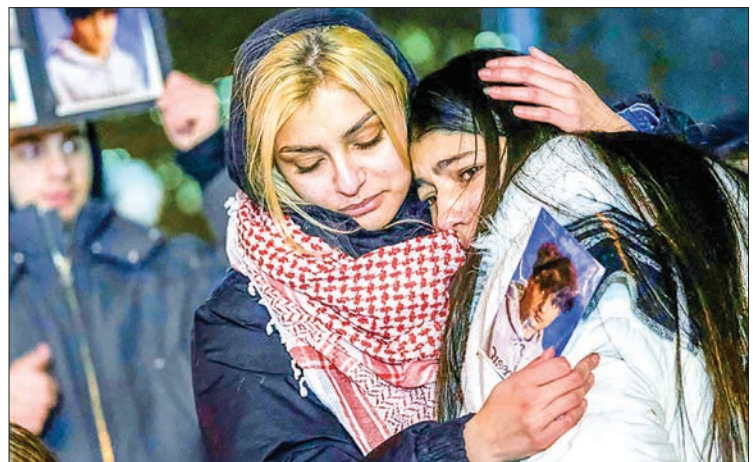
Mourners in Toronto console each other during a vigil for the victims of Ukrainian Airlines flight 752 which went down in Iran, killing everybody aboard.

The footage, which The New York Times said it had verified, shows a fast-moving object rising at an angle into the sky before a bright flash is seen, which dims and then continues moving forward. Several seconds later an explosion is heard.—AFP ■