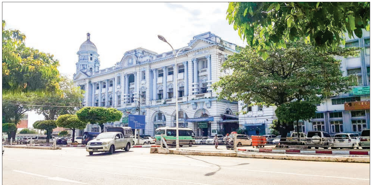
Myanma Economic Bank Branch- 3 ( formerly the Bank of Bengal building, built in 1914.)

The YHT is preserving rich heritage of historic buildings in Yangon by