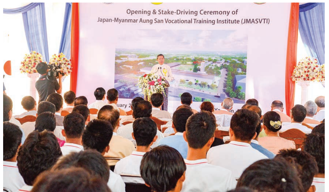
Union Minister Dr Myo Thein Gyi addresses the opening and stake-driving ceremony of the Japan-Myanmar Aung San Vocational Training Institute (JMASVTI) in Insein Township, Yangon yesterday.

The Union Minister said the AGTI Diploma-level three-year course on the two subjects had actually began to be taught on 2 December, 2019. He said the Ministry of Education is implementing the National Education Strategic Plan (2016-2021) and places great emphasis on technical and vocational sector. He said JMASVTI is a most valuable