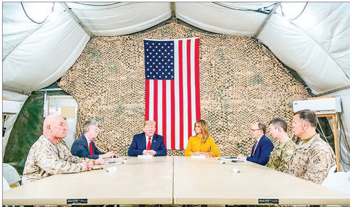
The United States has some 5,200 troops stationed at bases across Iraq, like this one visited by President Donald Trump and First Lady Melania in December 2018.

Their deployment was based on an executive-to-executive agreement never ratified by Iraq's parliament.