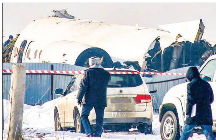
The plane crashed minutes after take off on 27 December.

Sklyar also read out excerpts of the pilot's dialogue with his co-pilot that indicated a disagreement between the pair prior to the crash. The plane was carrying almost 100 passengers when it crashed into the building but most survived without being seriously hurt. Twenty-one people were still being treated for their injuries on Friday. Viktor Sorochenko, head of the Moscow-based Interstate Aviation Committee and another member of the commission, noted that ice build-up had been found as the cause of a crash involving another Fokker-100 in France in 2007.—AFP ■