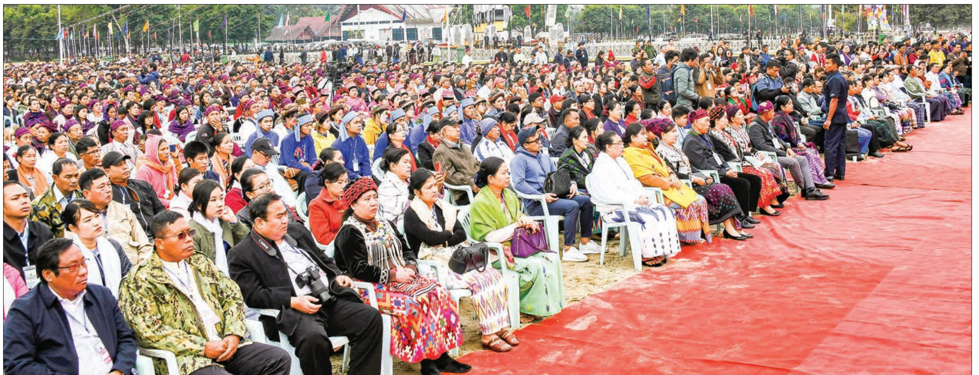
State Counsellor Daw Aung San Suu Kyi delivers the opening speech at the 72 nd Kachin State Day celebrations in Myitkyina, Kachin State yesterday.