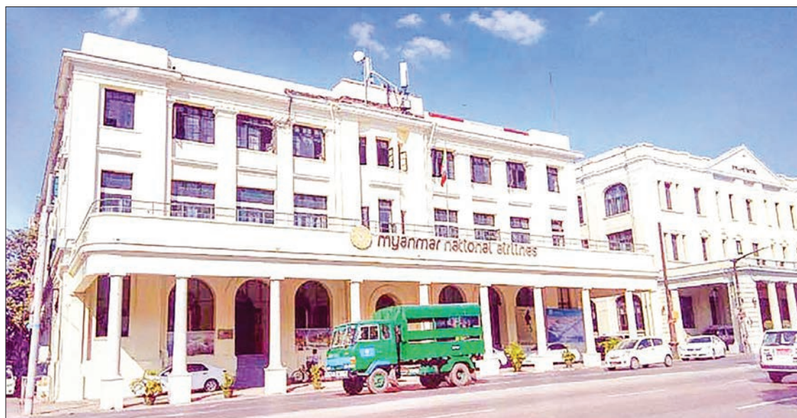
The photo shows Myanmar National Airlines installed with Blue Plaque (formerly known as Bombay Burma Timber Company).

and renovate historic buildings in Yangon for years has caused them in a state of ruin. Now one historic building after another becomes the ones without harming original architectural styles and they have returned to their former glory. Urban heritages don't belong to us and they are for the people. Preservation is a top priority and it is also the development. We have to think what we have and what opportu-