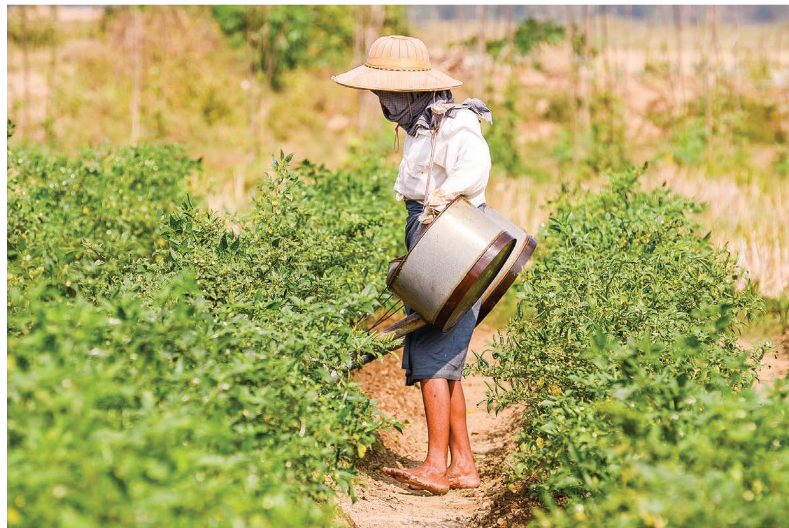
A worker watering chili plantation Padigon Township in Pyay District.

Myanmar depends on its agricultural sector and is critically important to learn how to use pesticides systematically. Climate