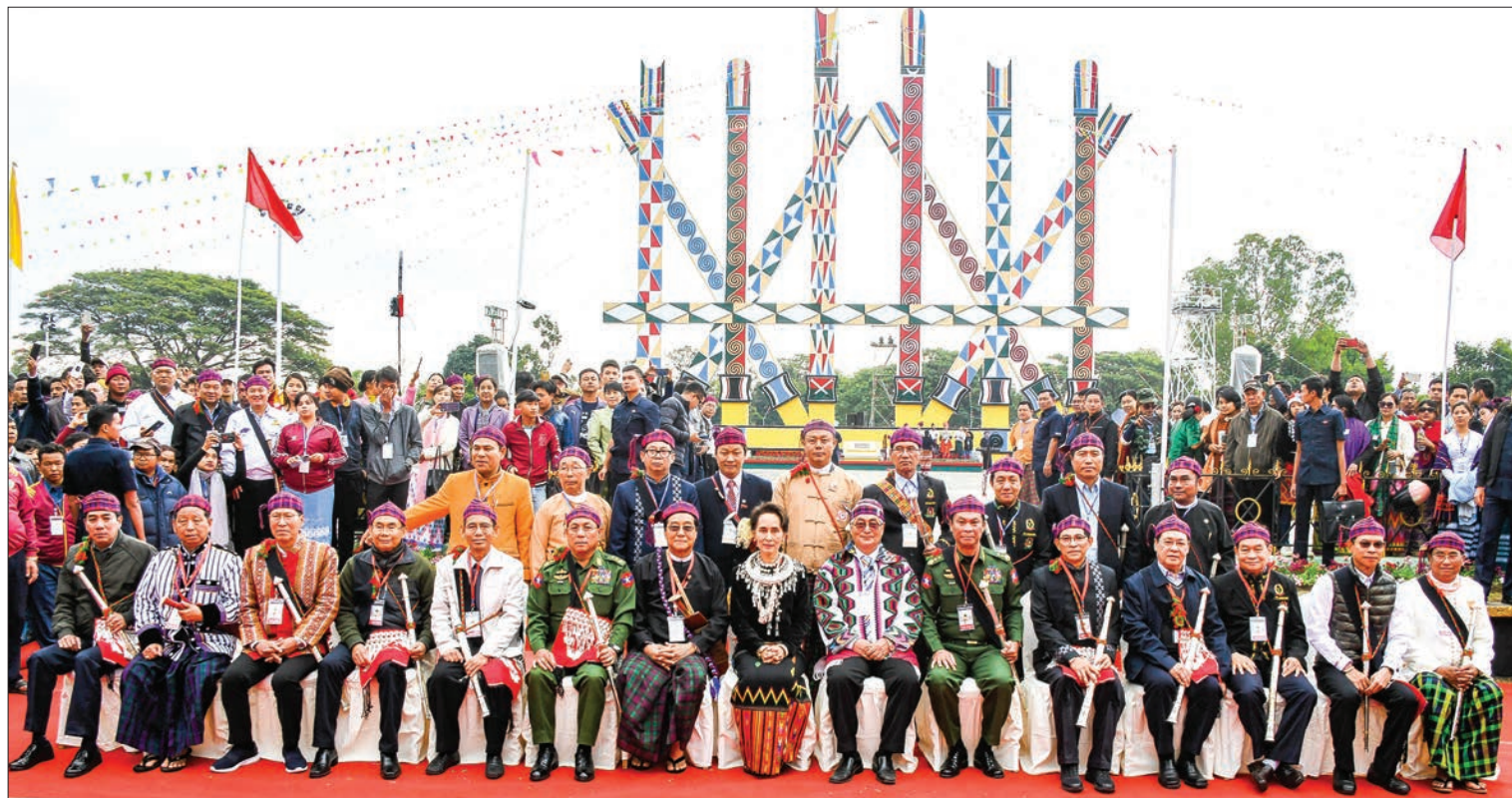
State Counsellor Daw Aung San Suu Kyi poses for a commemorative photo with Hluttaw representatives, Kachin ethnic leaders and officials at the celebration of 72 nd Kachin State Day at the Manaw Ground of Myitkyina, Kachin State, yesterday.

The State Counsellor then gave a short speech to the students. She said it was wonderful to be greeted with songs by chil-