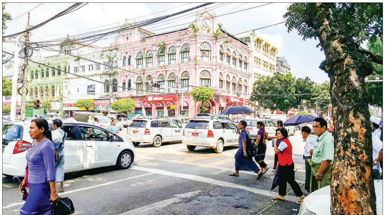
One of the colonial era buildings in Yangon.

ways of compiling a record, installing Blue Plaques, launching Walking Group programs, and educating the people.