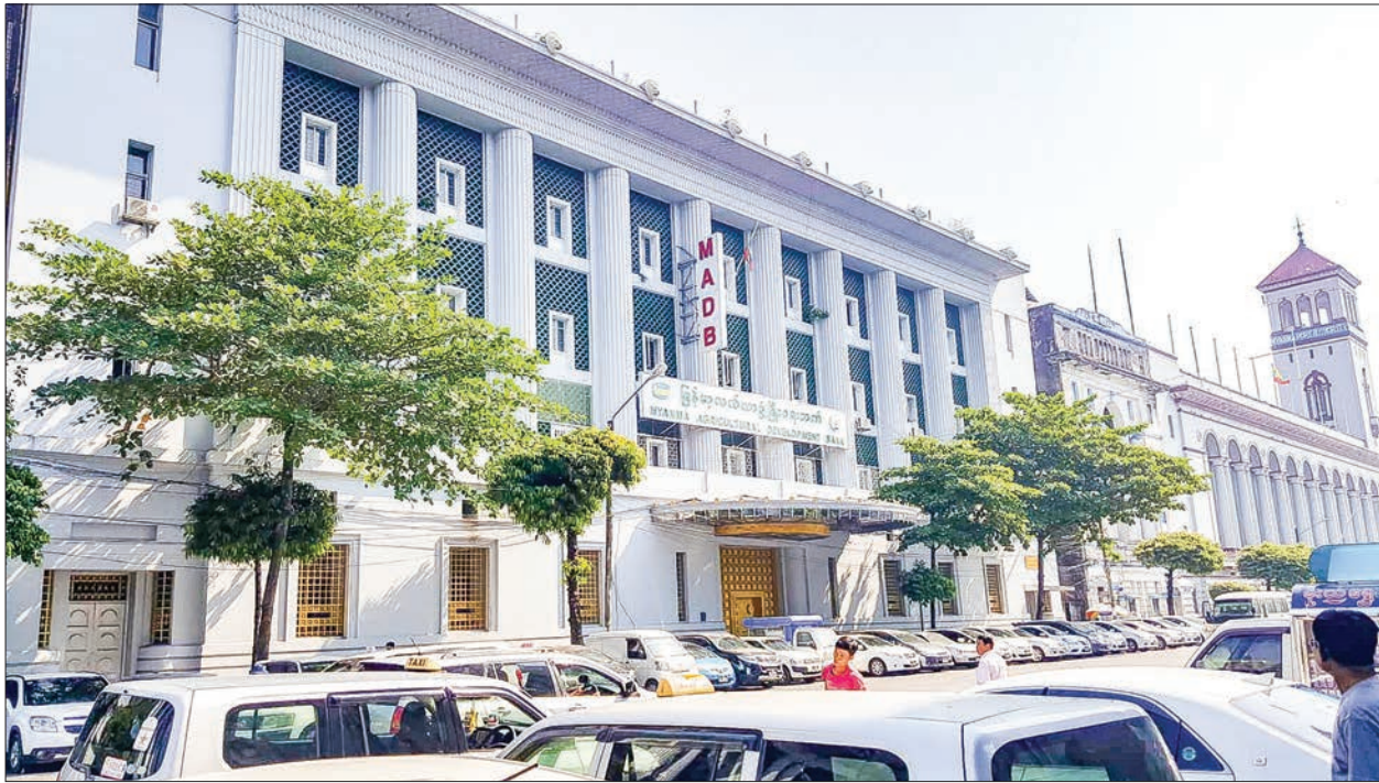
The photo shows Myanmar Agricultural Development Bank installed with Blue Plaque (formerly known as Grindlays Bank).

nities we have. We make a decision to do it only after thinking too much. If it is impossible at last, it may be replaced. We would like to have developments based on current situations,” said Daw Moe Moe Lwin.