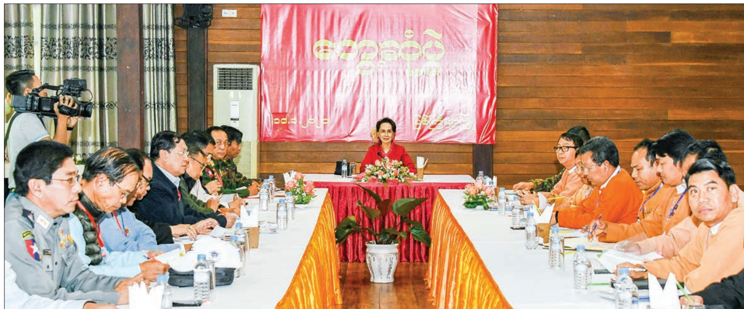
State Counsellor Daw Aung San Suu Kyi meets with Kachin State Chief Minister and State Ministers at the Palm Spring Hotel in Myitkyina, Kachin State yesterday.