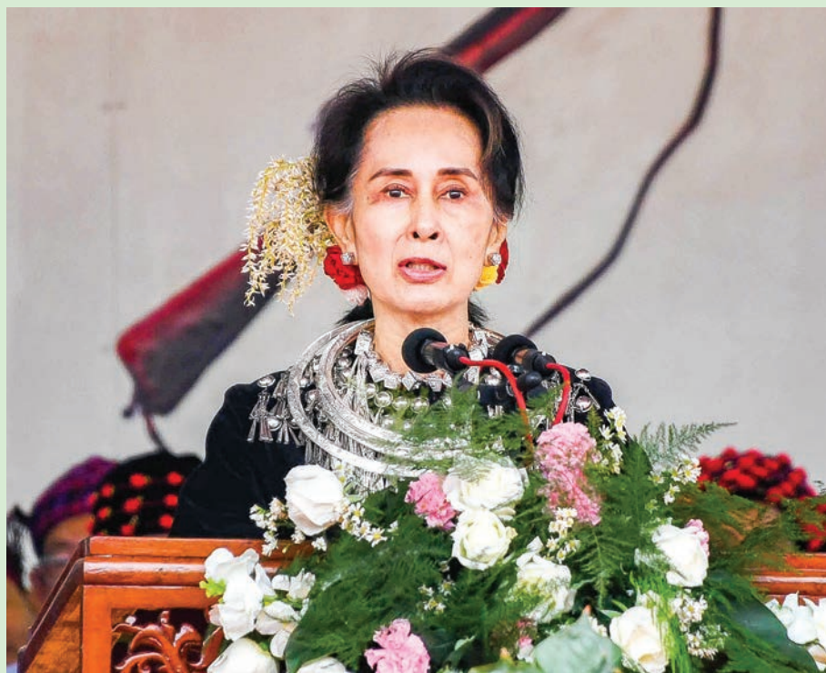
State Counsellor Daw Aung San Suu Kyi delivers the opening address at the 72 nd Kachin State Day celebrations in Myitkyina, Kachin State yesterday.

we can say my father had the happiest photos in Kachin State. You cannot find him smiling this happily in any other photos. It is because he was thinking that we would be able to establish our republic, a free republic or union and that hope was sparkling in him.