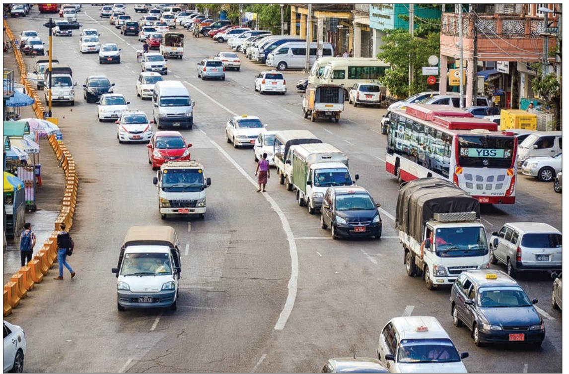
Taxis run in downtown Yangon.

began in 2002 to bring transport services on par with Yangon's image as a commercial hub and for regulating taxi services. Earlier, the registration of city taxis was handled