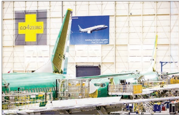
Newly released Boeing documents show messages between employees mocking US aviation regulators.

"I still haven't been forgiven by God for the