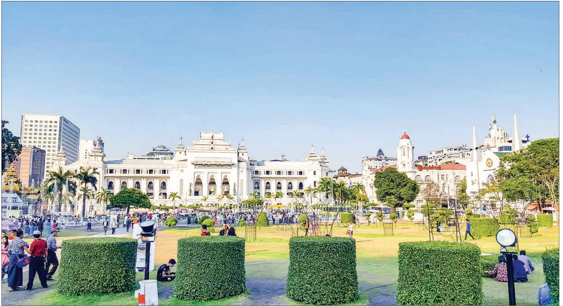
Yangon City Hall, built in 1927 and the headquarter of AYA Bank (former Rowe & Co building, built in 1911), and Immanuel Baptist Church, built in 1885.