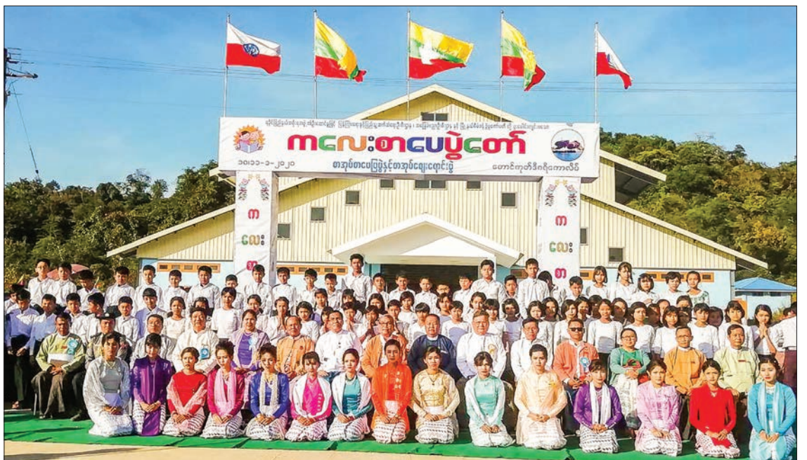
Rakhine State Chief Minister U Nyi Pu, Deputy Minister U Aung Hla Tun, and officials pose for a group photo at the opening ceremony of Children Literary Festival in Taungup, Rakhine State.

After the ceremony, Chief Minister, Deputy Minister and