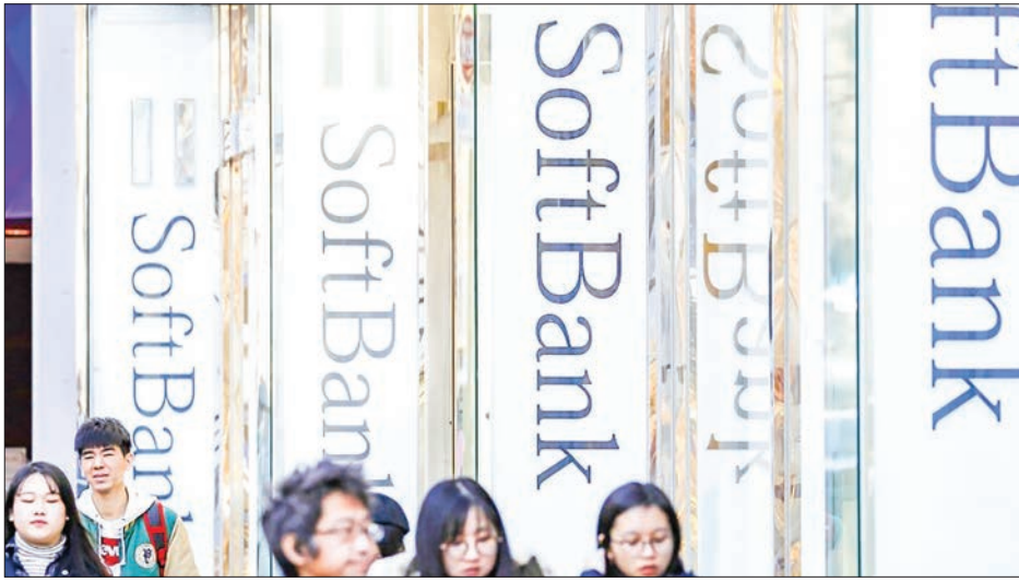
According to Son, the scale of the investment has not been decided yet, but it will be separate from SoftBank's earlier pledge to invest $2 billion in Indonesia over five years.