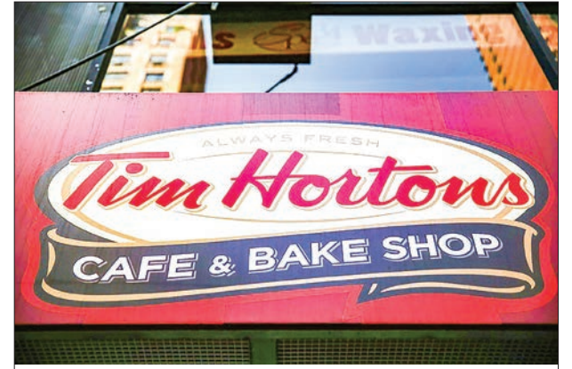
Tim Hortons is synonymous with coffee in Canada.

The offer proved hard to swallow for Canadians upset by the chain's labor relations practises. Canadian media reported that a branch of Tim Hortons