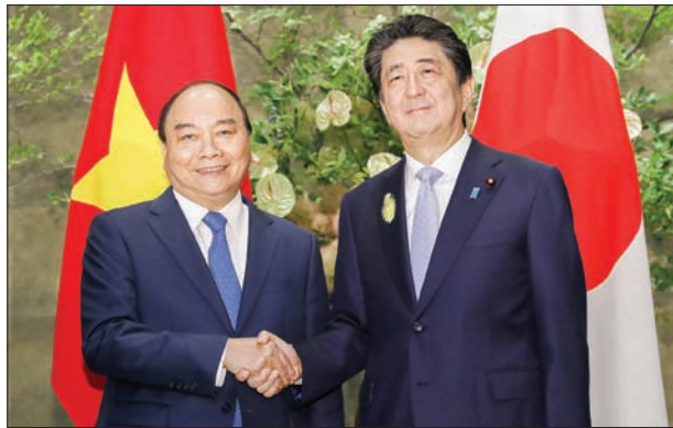
Japanese Prime Minister Shinzo Abe (R) shakes hands with Vietnamese Prime Minister Nguyen Xuan Phuc at his office in Tokyo on July 1, 2019.

Other respondents of the survey, targeting expatriates working for Japanese firms in Asia, attributed their choice to the country's proximity to China.