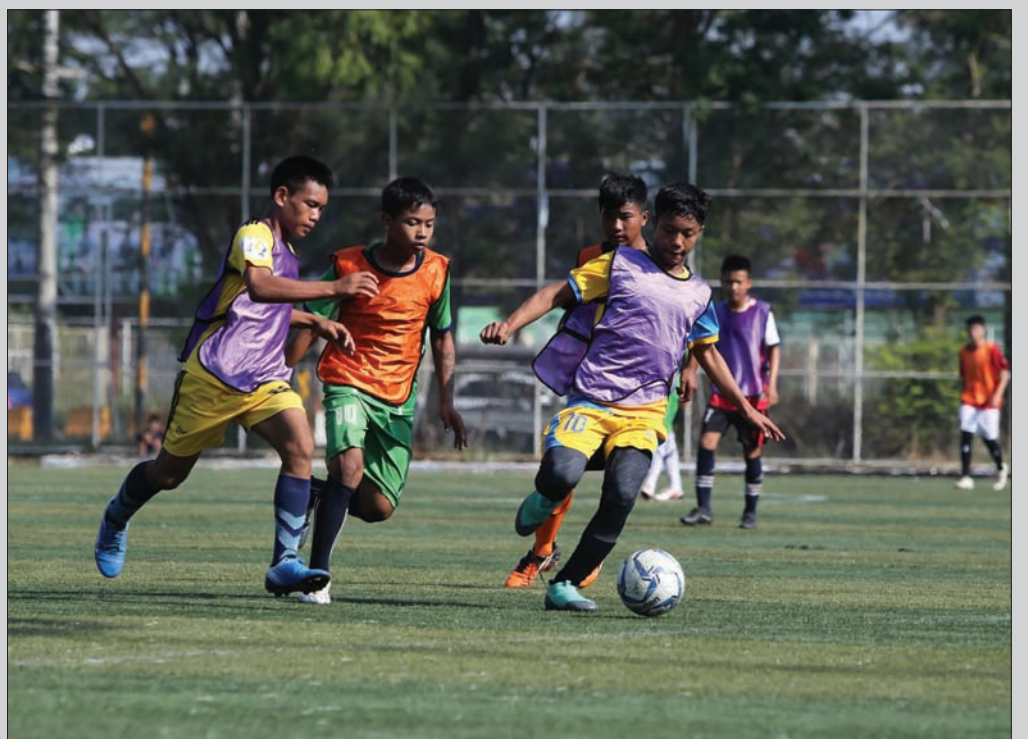
Youths participating in the “Road to Japan” football event in Yangon with their hope of Japan tour.

The youth football tour to Japan will include joint training programmes, friendly matches, and watching Japanese League football matches, according to the Myanmar National League.—Lynn Thit (Tgi)