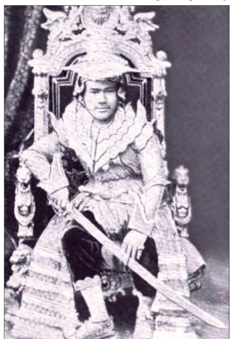
King Theebaw in full military uniform at the Equestrian Tournament on sports ground inside Mandalay Palace City Ratanapon.

The three main objectives of this great event were (1). to display (2). to award and (3). to recruit. Myanmar Land force was displayed not only in the month of Pyatho, but also on the occasion of the state visit of Head of State