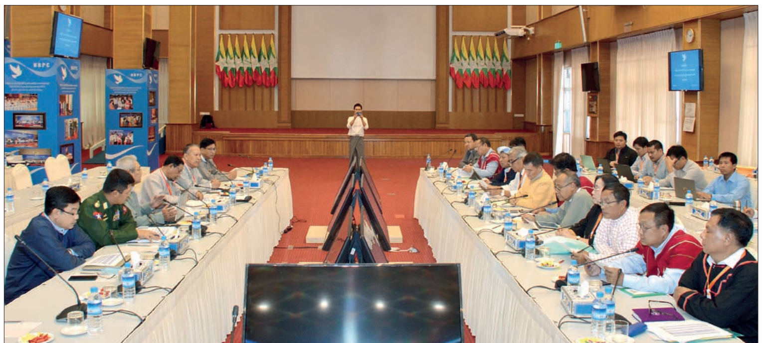
Coordination meeting on implementing the decisions of the 8 th JICM in progress in Nay Pyi Taw.