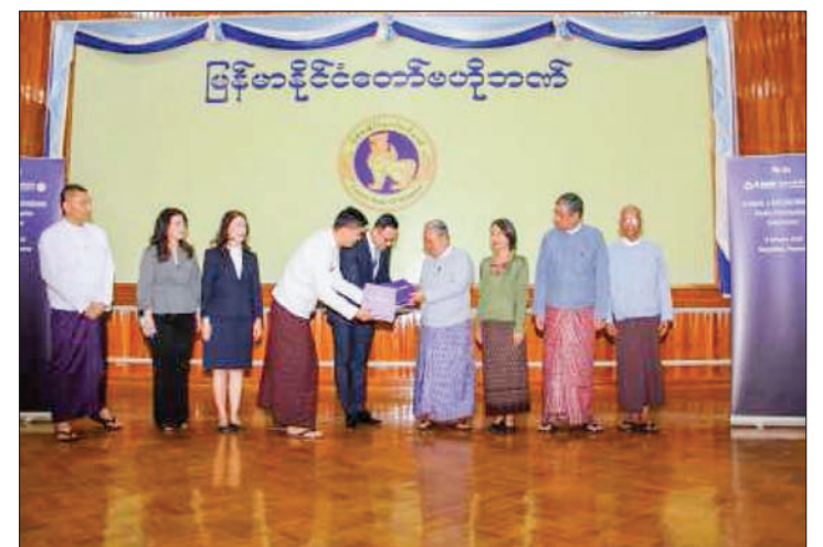
Officials of the K Bank and A Bank present their investment proposals to the Governor of CBM.