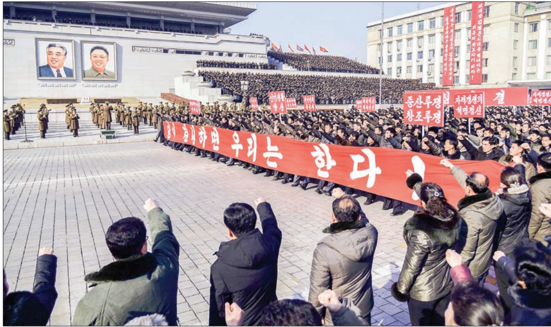
North Korean citizens gather at Kim Il Sung Square in Pyongyang on 5 January, 2020, to pledge to carry out tasks set forth at a plenary meeting of the Central Committee of the Workers’ Party of Korea.

Given the US strategy on Iran, Kim is expected to be forced to take a wait-and-see attitude “in order to avoid suffering the same