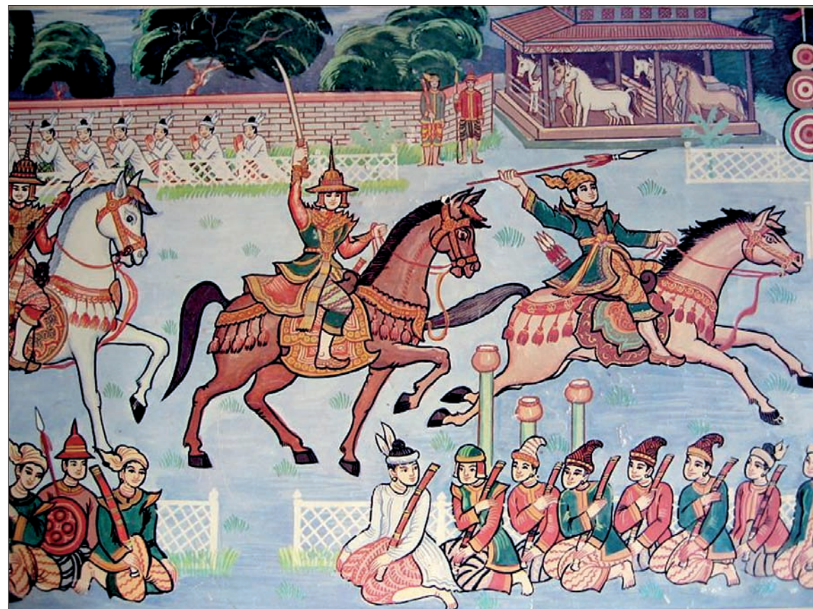
The painting shows the equestrian tournament in the Konbaung Period in Mandalay.

anmar land forces of the past, swords, spears, lancer, bows, arrows, muskets earners, lances throwing required extraordinary strength and skill. Long handle spear "Lunces" are called in Myanmar "Eh-Maung" [အမောင်းလှေ့]. At the tourneys, equestrian competitors at different speeds of their stallions had to throw, each his allotment of 20 lances, one by one at the target marked on the board. If the lance hit either the center or within the circles, he won the game. So this tourney is also called in Myanmar set dwin Pyit Pwe [စက်ကွင်းပစ်ပွဲ].