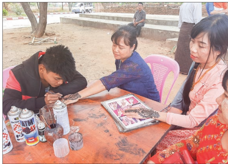
A tattoo artist paints a temporary tattoo on the hand of a customer in Bagan.

tattoo art is in the range of K1,000-3,000, depending on the design. Local and foreign travellers visit Bagan during the holiday sea-