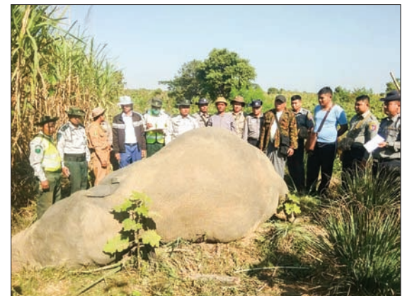
Authorities inspect an elephant carcass in Taikkyi Township.

"I have visited the spot. We found electric fencing in the area. They have no permissions. Our team hasn't erected electric fencing in this place. Wherever we have set up electric fencing in paddy fields, we have done so with the permission of the administrator and farmers. We are hiring experts to protect elephants and humans from conflict. We found some worms inside the elephant's trunk. The