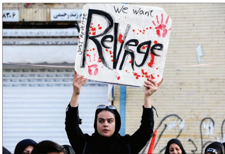
Some Iranians are calling for a revenge following the killing of Qasem Soleimani.

Chief Cabinet Secretary Yoshihide Suga, Japan’s top government spokesman, stressed the need to exercise restraint as he urged all parties involved to exhaust diplomatic efforts following the missile strikes. —Kyodo News ■