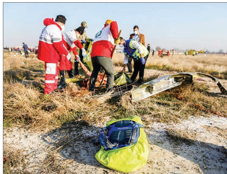
The Boeing 737 had left Tehran's international airport bound for Kiev, semi-official news agency ISNA said.

"The plane caught fire after crashing," said Press TV. A video aired by the state media broadcaster appeared to show the plane already on fire, falling from the sky. American airline manufacturer Boeing tweeted: "We are aware of the media reports out of Iran and we are gathering more information." — AFP ■