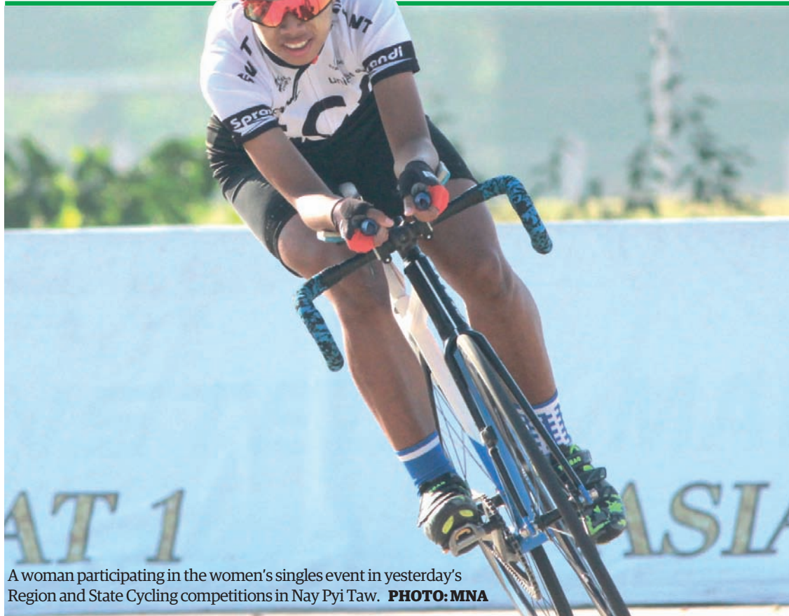
A woman participating in the women's singles event in yesterday's Region and State Cycling competitions in Nay Pyi Taw.