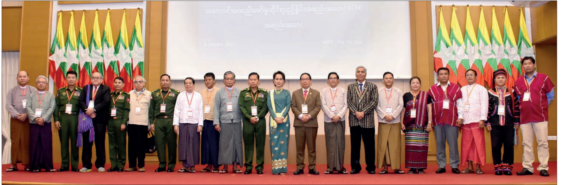
State Counsellor Daw Aung San Suu Kyi, peace negotiators and representatives of EAOs pose for the documentary photo.