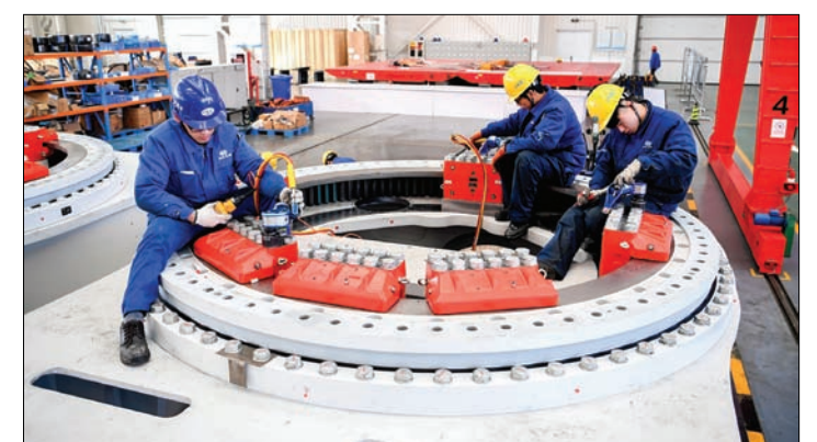
Employees from a subsidiary of China Shipbuilding Industry Corp install clean-energy equipment in Nantong, Jiangsu province.

The regulator will also study the integration of oil refining businesses. On 5 January, China National Chemical Corp. (ChemChina) and Sinochem Group announced the consolidation of their agricultural assets into a newly formed entity called Syngenta Group in the latest step to optimize resource allocations.—Xinhua ■