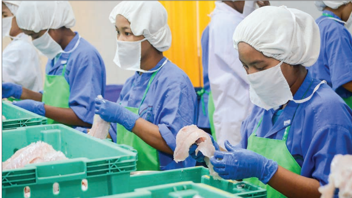
Labourers processing fish for export at a marine product factory.

The Myanmar Fisheries Federation (MFF) is making concerted efforts to increase fishery export earnings by developing fish farming lakes which meet international standards and adopting advanced fishing techniques.