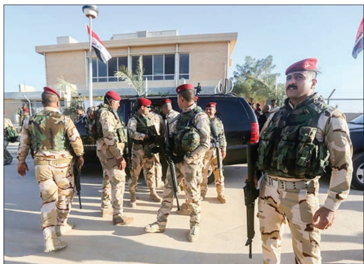
Iraqi soldiers are pictured in 2014 at Al-Asad air base, which was attacked in the first act of the Islamic republic's promised revenge for the US killing of a top Iranian general.

There were no immediate reports of casualties. The Pentagon said the facilities had been on "high alert" after days of steadily mounting tension and exchanges of threats of war. The Iraqi military said it sustained no casualties in 22 missile strikes on bases housing US troops. "Between 1:45 am and 2:15 am (2245 GMT and 2315 GMT) Iraq was hit by 22 missiles, 17 on the Ain al-Asad air base and ... five on the city of Arbil," the Iraqi military command said. "There were no victims among the Iraqi forces." — AFP ■