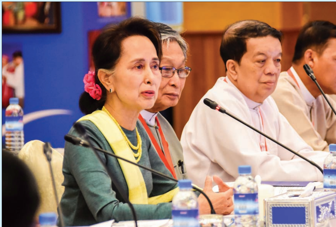
State Counsellor Daw Aung San Suu Kyi delivers the at the 8 th Joint Implementation Coordination Meeting for the Nationwide Ceasefire Agreement Implementation in Nay Pyi Taw yesterday.

Ours is "a dream of a federal Union", which we are all dreaming together, so it is no wonder that we share the same goal with heart and soul. I am sure nobody feels skeptical about it. But, of course, we have different views as to how we should materialize this dream, namely the ways and means; how to march towards the goal we have already set. Since today's meeting will focus on finding common agreement on different concepts regarding procedural matters, and adopt these agreements, this meeting has more political significance than the "restarting" of official