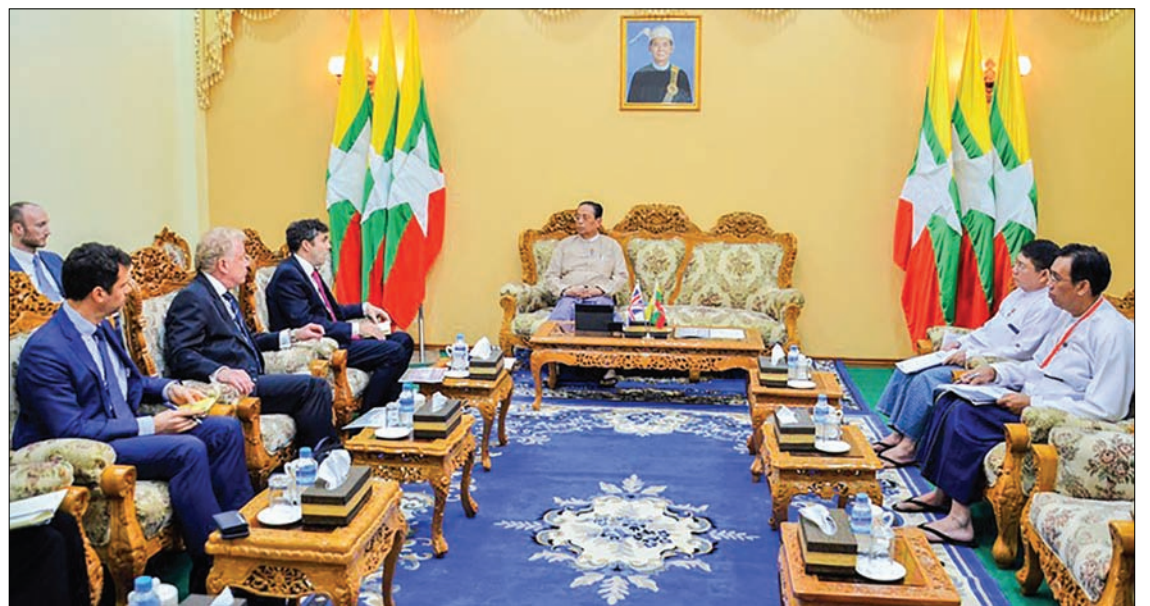
Union Minister U Win Khaing meets with British Ambassador Mr Daniel Chugg in Nay Pyi Taw yesterday.

ards during project implementation, advanced technology and designs for coherence with existing power grid, project plans moving forward, developing the renewable energy sector, UK government's support for Myanmar's green finance and opportunities, technical assistant capacity building and PPA negotiation, standards training programme, and the international climate change conference to be organized by UK in the later 2020.—MNA (Translated by Zaw Htet Oo)