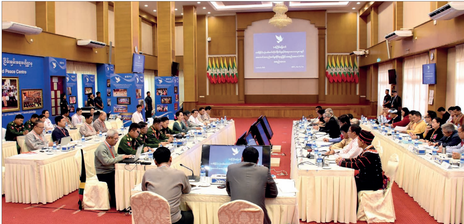
The 8 th JICM meeting in progress in Nay Pyi Taw yesterday.