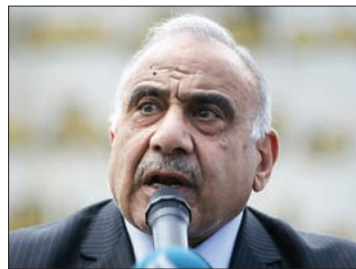
The office of Iraqi prime minister Adel Abdel Mahdi says it was warned by Tehran of its imminent missile strikes on bases housing US troops without the specific locations.

It said Abdel Mahdi was in talks with domestic and foreign partners to prevent an "open war." Secretary of State