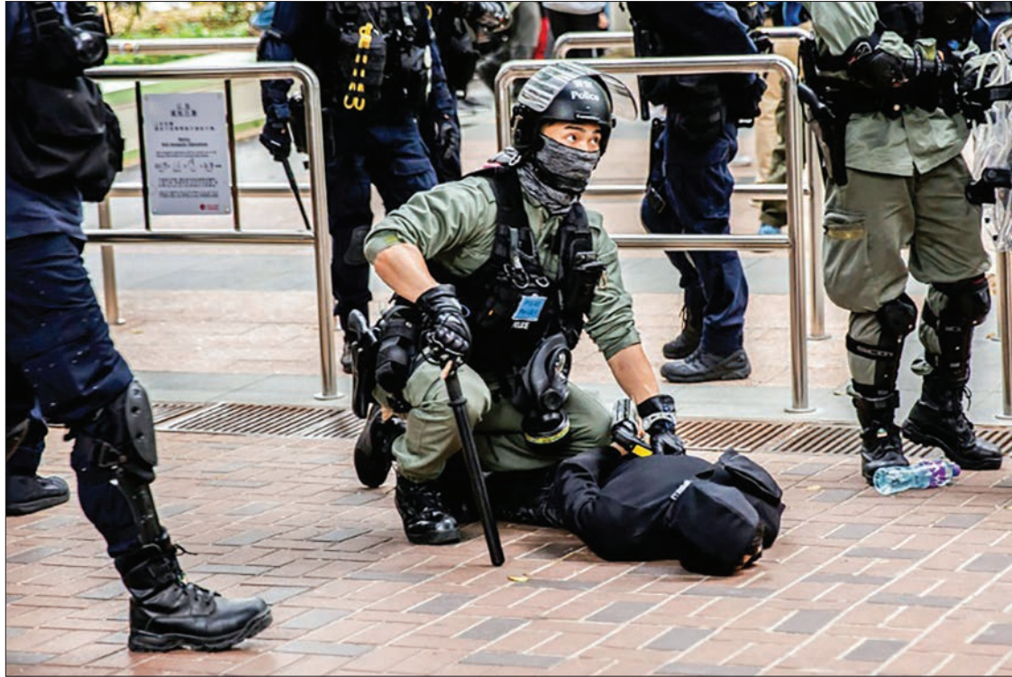
Beijing's new top envoy to Hong Kong Luo Huining gave little clue as to whether Beijing's approach towards the city would change as it convulses with popular anger against mainland rule.

"In the past six months, Hong Kong's situation has made everybody's heart wrench. Everyone earnestly hopes that Hong Kong can return to the right path," Luo said, declining to take questions from reporters.