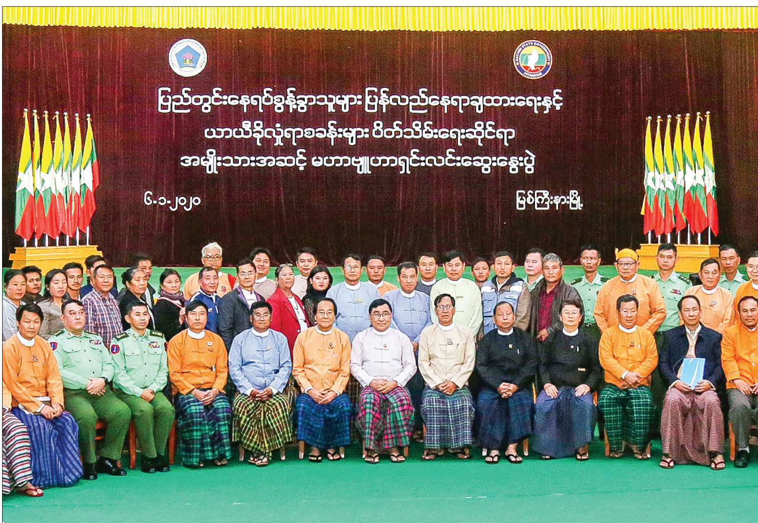
Union Minister Dr Win Myat Aye, Kachin State Chief Minister Dr Khet Aung and attendees pose for a group photograph at the meeting for the Strategic Plan for Resettling IDPs and Closing Temporary Camps in Myitkyina, Kachin State yesterday.

THE Ministry of Social Welfare, Relief and Resettlement discussed the Strategic Plan for Resettling Internally Displaced Persons-IDPs and Closing IDP Camps with Kachin State Government, local communities and social organizations yesterday.