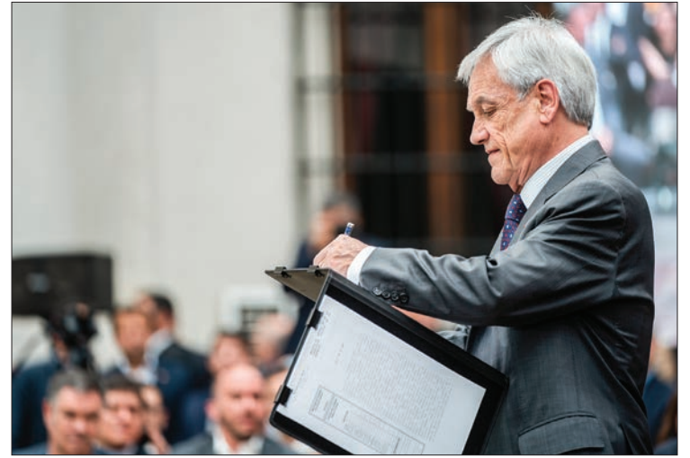
Chile President Sebastian Pinera.