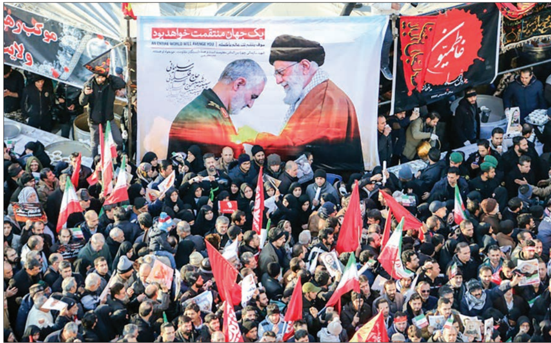
Iranian mourners carry a picture of Iran's Supreme Leader Ayatollah Ali Khamenei (r) granting the highest military honour of Iran to General Qasem Soleimani.

Iraq's parliament meanwhile demanded the government expel