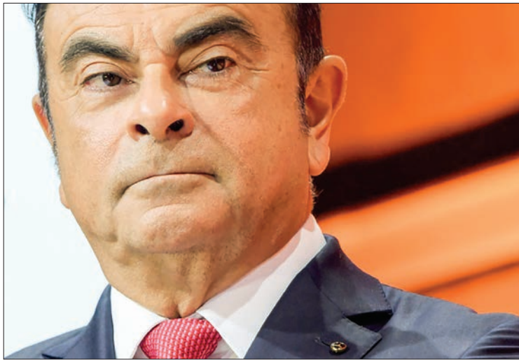
Former Nissan boss Carlos Ghosn escaped while awaiting trial in Japan on multiple counts of financial misconduct.