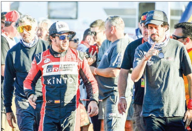
Toyota Gazoo Racing's driver Fernando Alonso (2nd L) of Spain speaks with staff members at the end of the Stage 2 of the Dakar 2020 between Al Wajh and Neom, Saudi Arabia, on 6 January 2020.

NEOM (Saudi Arabia) — South African driver Giniel De Villiers won the second stage of the Dakar Rally on Monday while former Formula One world champion Fernando Alonso was "glad to be able to continue" after dropping two-and-a-half hours when losing a wheel.