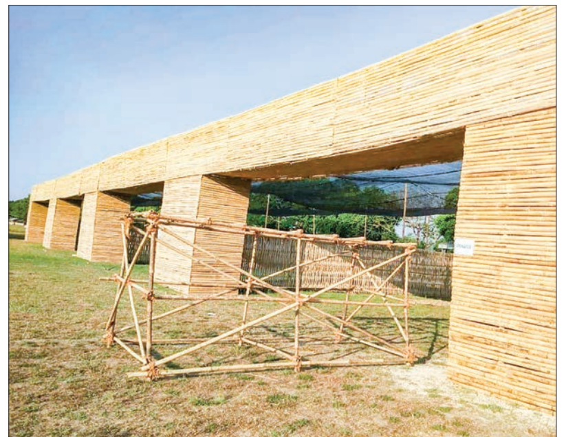
Myanmar Traditional cultural booths displayed at Ethnic Culture Festival which will be held from 1 to 7 February in Yangon.