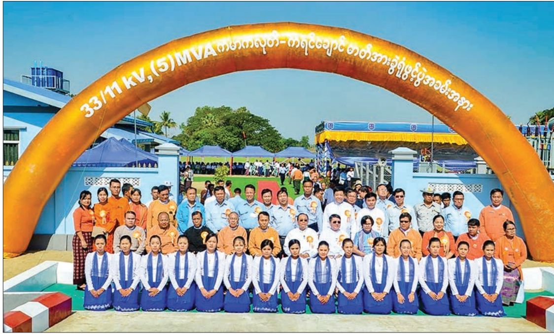
Union Minister for Electricity and Energy U Win Khaing and officials pose for a documentary photo at the opening ceremony of the Kamarkalote/Kayinchaung 33/11KV, 5MVA sub-power station in Kyauktan Township, Yangon Region.

THE opening ceremony of the Kamarkalote/Kayinchaung 33/11KV, 5MVA sub-power station in Kyauktan Township, Yangon Region, was held yesterday morning. It was implemented by the Yangon Electricity Supply Corporation, Ministry of Electricity and Energy.