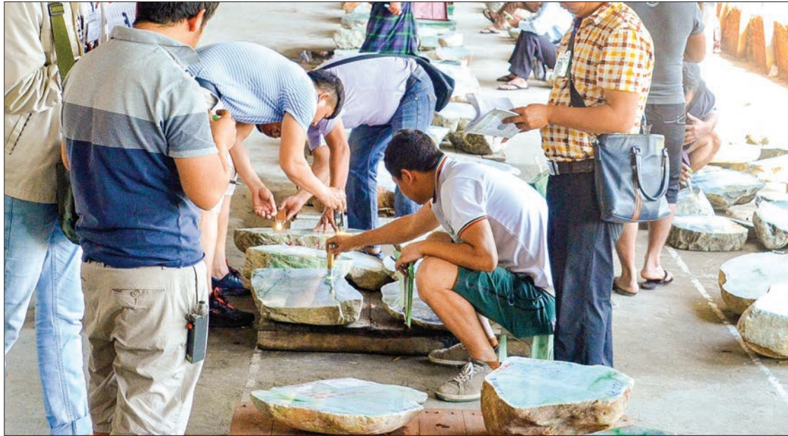
Jade merchants viewing pieces of jade on the 4 th day of Gems Emporium in Nay Pyi Taw.

Yangon International Gems and Jewellery Fair 2020, which is being organized by the Gems and Jewellery Entrepreneurs Association of Yangon, will take