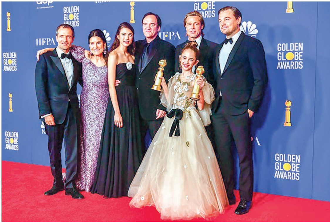
US film director Quentin Tarantino (c), poses with cast and crew of "Once Upon A Time... In Hollywood" including actors Brad Pitt (next to Tarantino) and Leonardo DiCaprio, after the film won three Golden Globes.