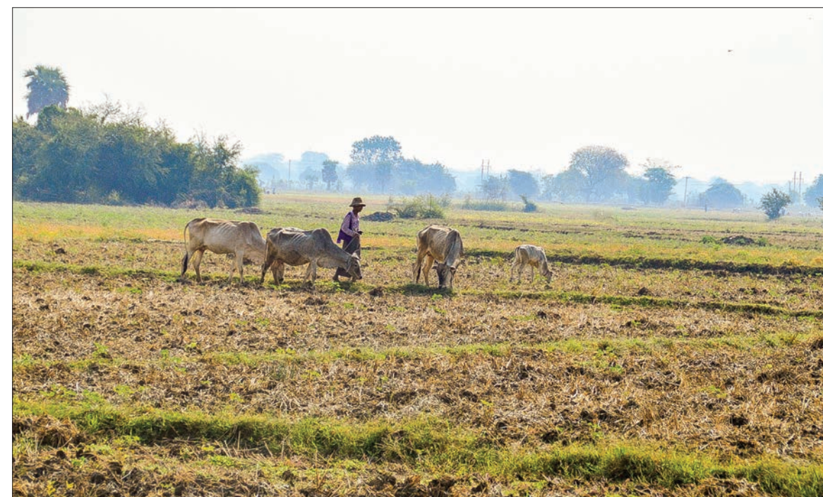
A farmer looks on as his cattle graze in a field in Mandalay.

The worst has not yet come. Food security will be at risk if more rice-producing regions are faced with intensification and an energy crisis will be imminent if supply of water at hydropower plants falls short. The chain reaction set off by drought will continue further in the form of inflation as a result of declining rice production.