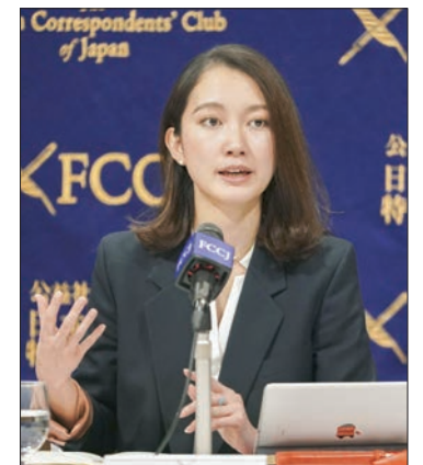
Japanese journalist Shiori Ito speaks at the Foreign Correspondents' Club of Japan in Tokyo on 19 December 2019.

The court rejected a counter-lawsuit filed by Yamaguchi seeking 130 million yen in compensation from Ito. He claimed his social reputation has been