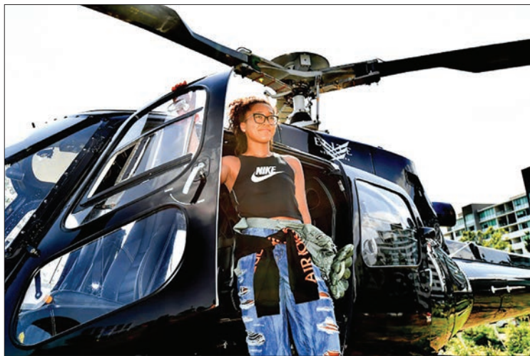
Tennis player Naomi Osaka opened up on her meeting with Beyonce and Jay-Z.

BRISBANE (Australia) — Japanese sensation Naomi Osaka has revealed her excitement at meeting her idol Beyonce, saying the US singer "smelled expensive" and gave her a morale-boosting pep talk at a low point last year.