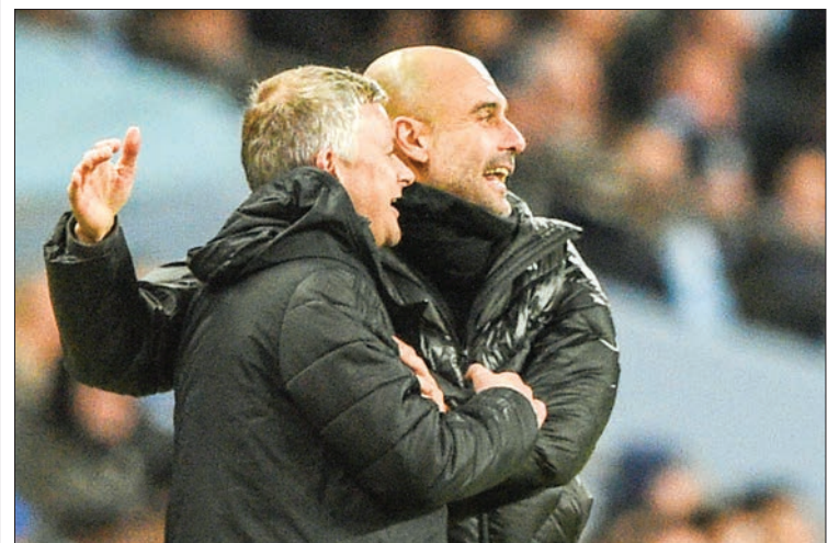
Manchester United manager Ole Gunnar Solskjaer (left) and Manchester City boss Pep Guardiola.

Guardiola will have Nicolas Otamendi available again after an injury but has not yet settled on a starting XI.—AFP