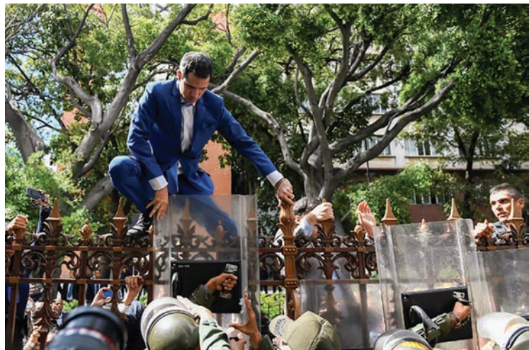
Venezuelan opposition leader and self-proclaimed acting president Juan Guaido is pushed back by police with riot shields as he tries access the National Assembly compound. PHOTO: AFP

Images of Parra declaring himself head of the chamber by megaphone were shown on state television channel VTV. After spending four hours outside parliament, Guaido and allied lawmakers went to the offices of El Nacional newspaper where they held their own session.— AFP ■