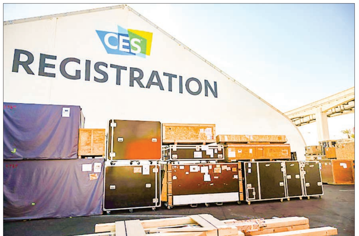
The road to 5G remains agonizingly slow at the massive Consumer Electronics Show opening this week in Las Vegas, where ultrafast products are expected to be few and far between.

SK Telecom of South Korea plans to show off at CES a mapping service that analyzes traffic in real time, gathering information from car sensors.—AFP