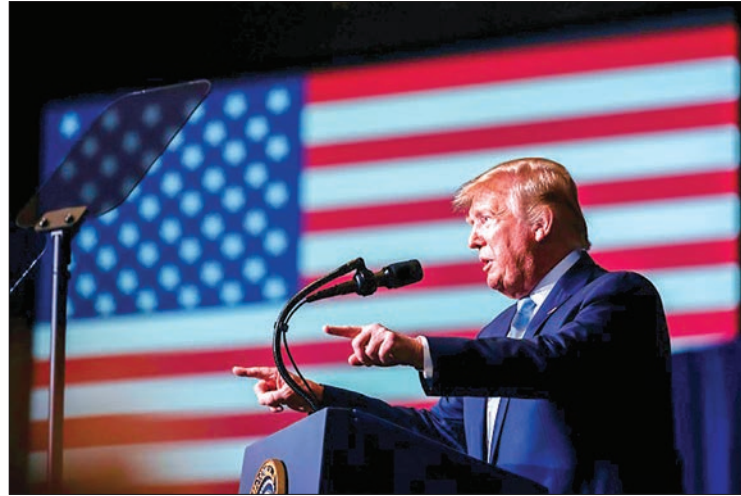
Donald Trump has dialled up the pressure after last week’s assassination, warning Iran of a ‘major retaliation’ if it tries to get revenge.

The crisis has jolted investors, who had been in an upbeat mood as China and the US prepare to sign their mini trade deal