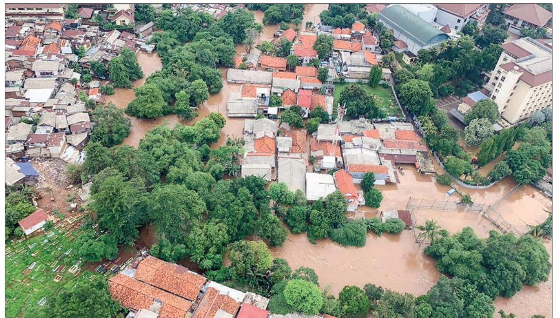
Photo taken on 1 January 2020 shows floods inundating parts of Jakarta.