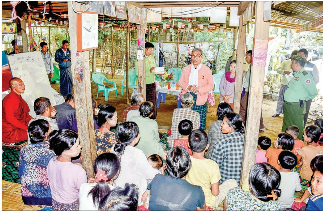
Rakhine State Chief Minister U Nyi Pu meets with IDPs at a monastery in Sittway, Rakhine State. PHOTO: TIN TUN

These displaced persons left their homes in Yathedaung Township for temporary shelters in Sittway.—Tin Tun (IPRD)