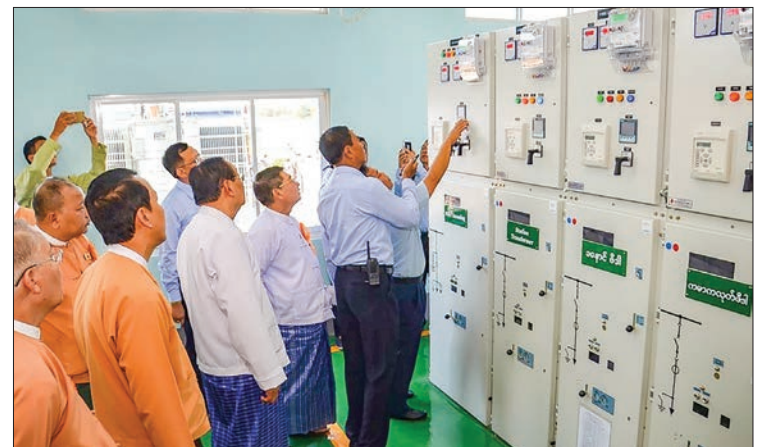
Union Minister U Win Khaing inspects the Kamarkalote/Kayinchaung 33/11KV, 5MVA sub-power station in Yangon.