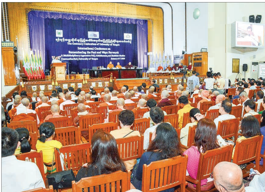
Union Minister Dr Myo Thein Gyi addresses the audience at the International Conference commemorating Yangon University's 100 th anniversary.

The Union Minister said research and development are the lifeblood of the university and essential to sustainable economic growth and devel-