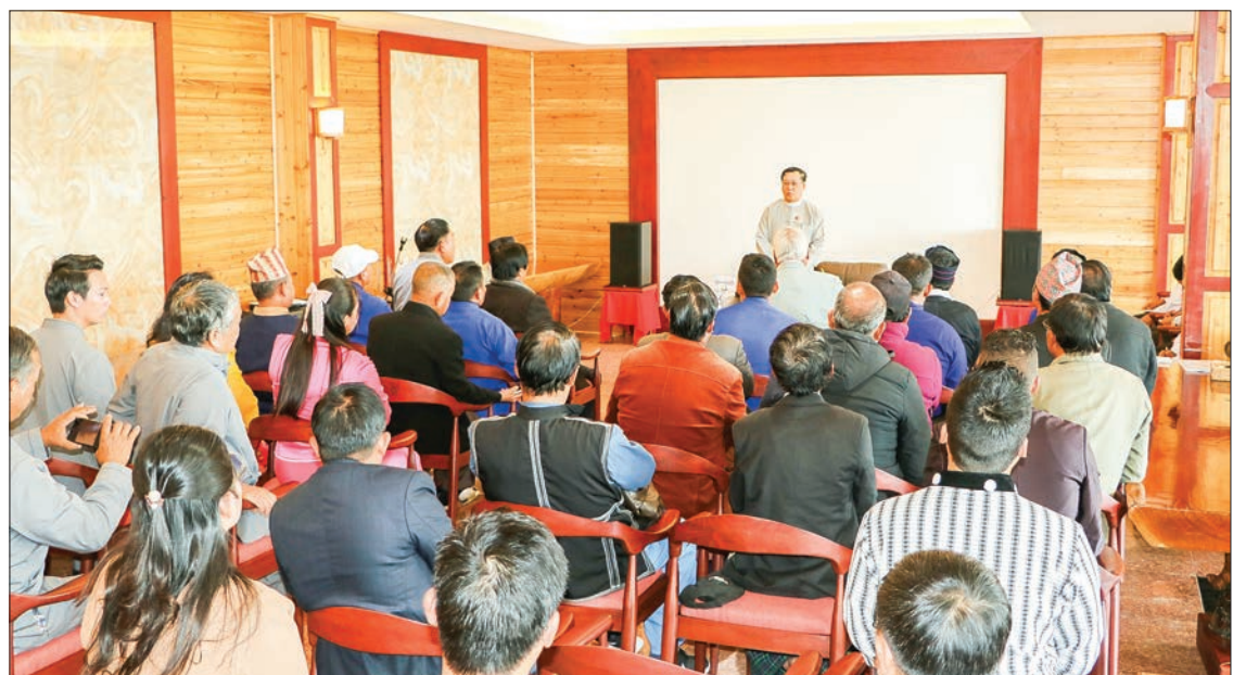
Union Minister U Thein Swe meets with members of cultural groups from ethnic communities of Nepal (Gurkha), Kholon Lishaw, Kokang and Mone Wun for issuing identification cards in Mogok.

The Union Minister later met with chairpersons and members of cultural groups from ethnic communities of Nepal (Gurkha), Kholon Lishaw, Kokang and Mone Wun to hand out family registration certificates and a certain type of identification cards to them in Mogok.