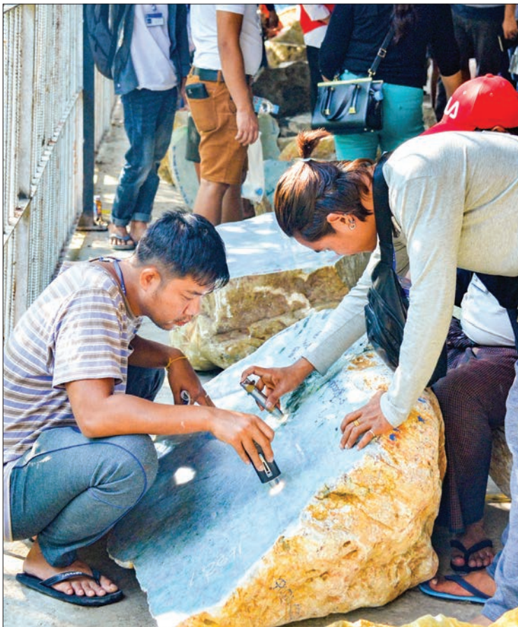
Traders evaluate jade stones at the Gems emporium in Nay Pyi Taw.

GEMS emporium in Nay Pyi Taw sold 1,158 jade lots for K23,561.403 million on the fifth day through open tender system at the Mani Yadana Jade Hall in Nay Pyi Taw yesterday.