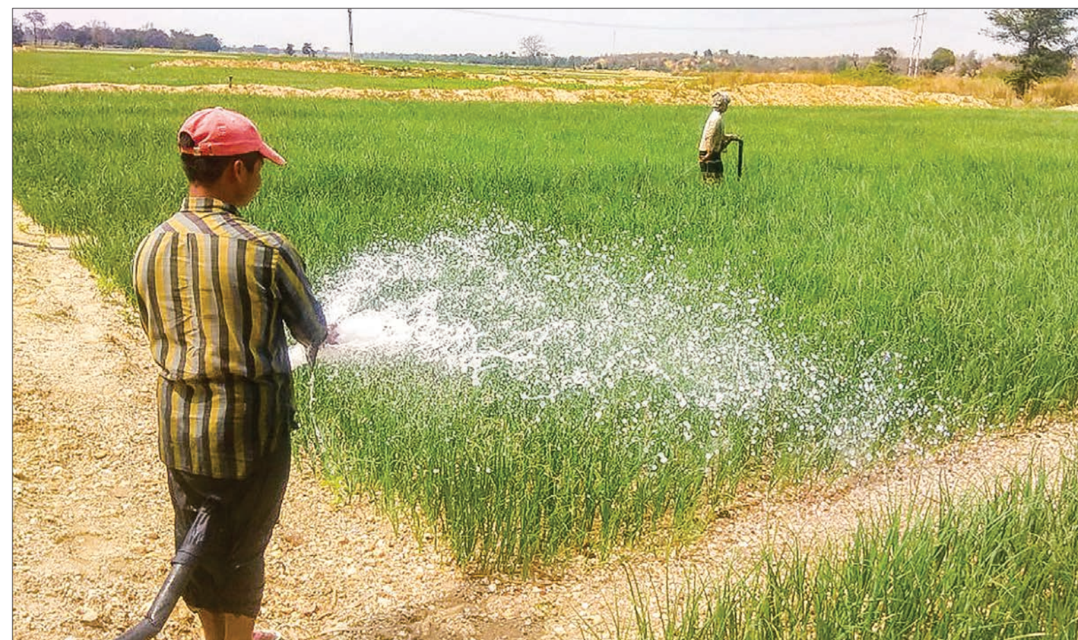
A farmer waters onion plants at a field in Seikphyu Township.

The drought in early monsoon season of last year affected