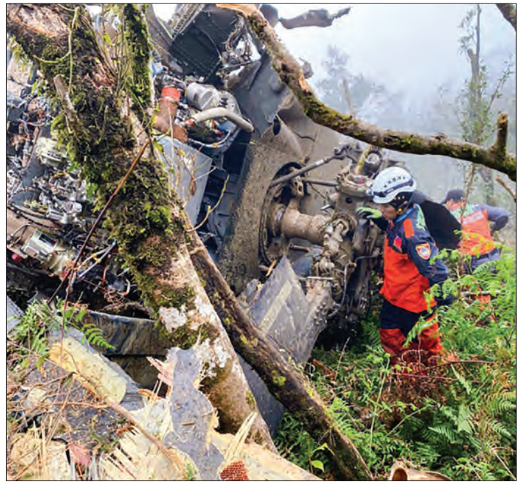
Rescuers searching for survivors after a military Black Hawk helicopter smashed into mountains in Yilan county near Taipei, killing the island's top military chief, Shen Yi-ming.

President Tsai Ing-wen's office said that she will cancel all campaign activities for three days after the tragedy. The ruling Democratic Progressive Party will also suspend campaigning for three days. Tsai is seeking a second term against Kaohsiung city mayor Han Kuo-yu of