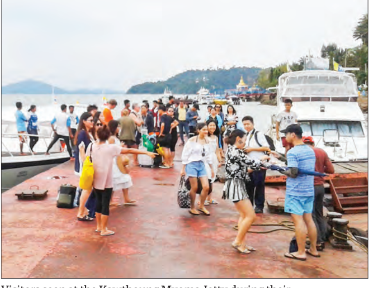
Visitors seen at the Kawthoung Myoma Jetty during their holidays.