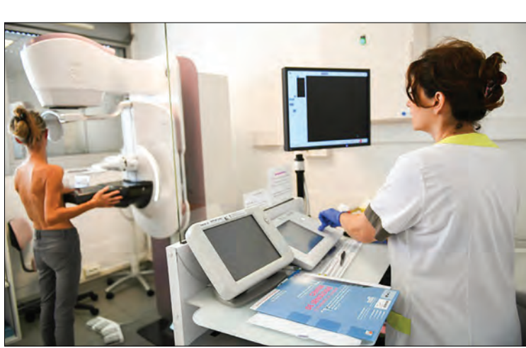
Breast scans are recommended for women above 50 who exhibit no signs of cancer.

the AI, which was trained to scan X-ray images. The system scanned for signs of malignancy through all the 28,000 pictures, after which its findings were matched against the actual cancer status of the women.