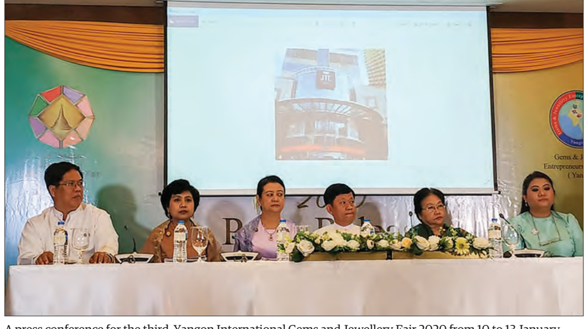
A press conference for the third Yangon International Gems and Jewellery Fair 2020 from 10 to 13 January held in Yangon.

According to the organizers, the fair is aimed at improving Myanmar's gems and jewellery market, boosting gems and jewellery production, attaining good prices in the global market, bringing together all the stakeholders in the supply chain, producing value-added gems and jewellery rather than focusing on rough stones sales, creating job opportunities, organizing seminars and business matching, disseminating gems and jewellery research news, and advertising the latest designs and high value gems to interested buyers through social media platforms.