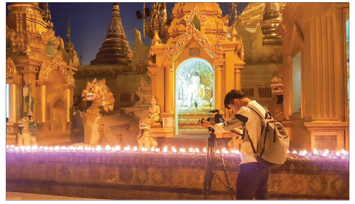
A Chinese film crew shoots New Year's Eve holiday of the people at the Shwedagon Pagoda in Yangon.