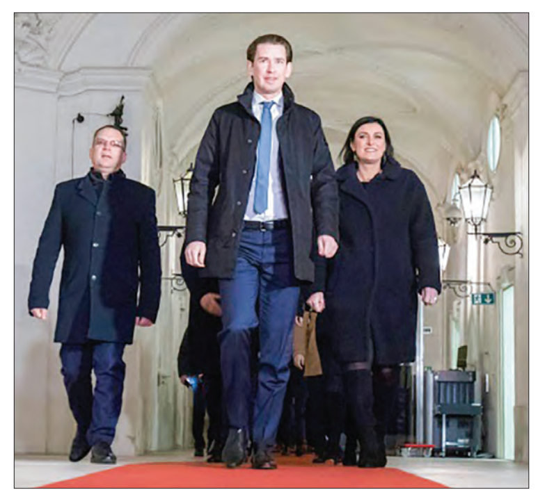
Kurz, shown here arriving for the last round of coalition talks on Wednesday, said the two parties would 'protect the climate and borders'.

"Historic accord fixed" ran the Kurier daily's main headline Thursday, while a column in the left-leaning Standard described the coalition as a "daring experiment" and a "political adventure". Papers said the pact bore the conservatives' stamp, with tabloid Oesterreich billing the OeVP as "powerful as never be-