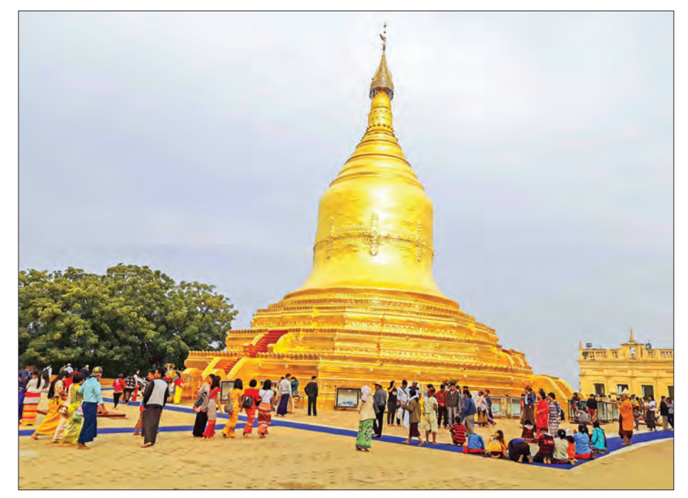
Travellers visit Shwezigon Pagoda in Bagan during the New Year holidays.

"Local and foreign travellers visited Bagan region during the New Year holidays. Some travellers came to Bagan to pay a visit to the four ancient pagodas, namely Shwezigon pagoda, Lawkananda pagoda, Tuyin Taung pagoda, and Tantkyitaung pagoda, located across the Ayeyawady River in Pakokku District. So, water vessel owners transported the pilgrims and earned a good income during the holidays. The fare of water vessels ranged from a minimum of K20,000 to a maximum of K35,000. There are over 200 water vessels at the Ayeyawady jetty,"