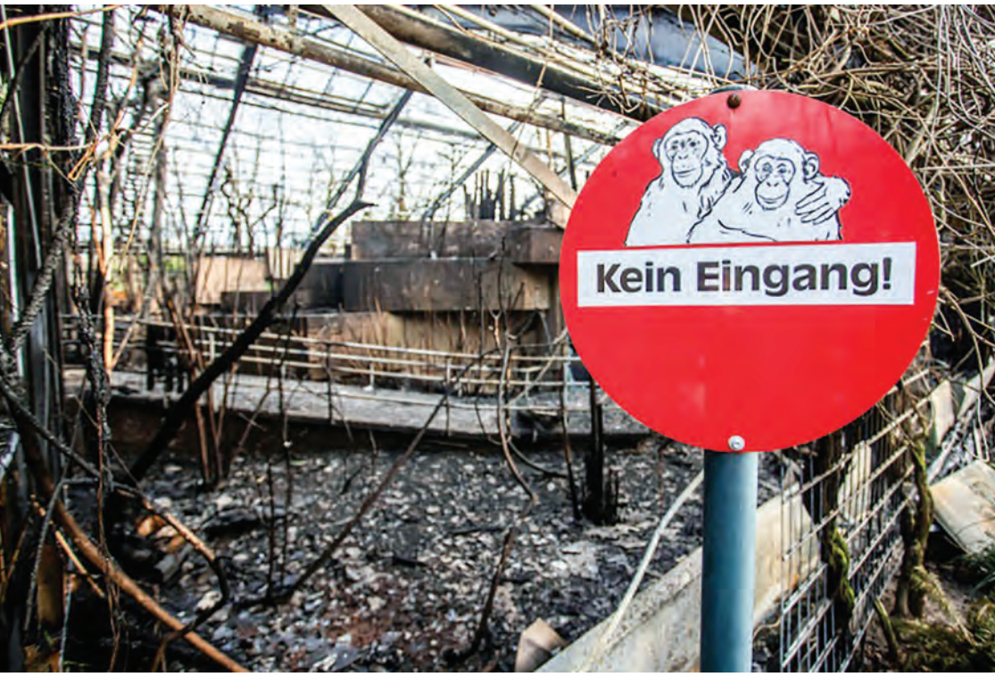
The zoo in Krefeld, western Germany, remains closed after the fire.

The fire, which claimed the lives of 30 primates including eight great apes, broke out shortly before midnight on New