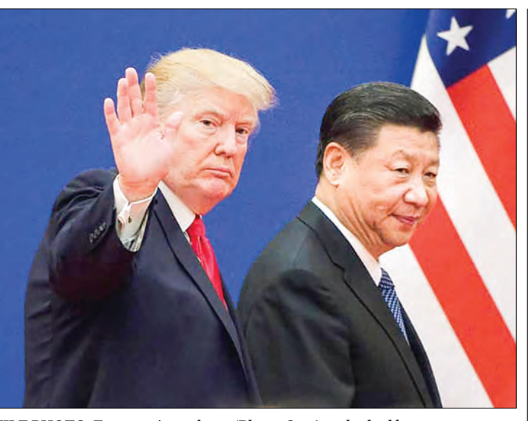
FILE PHOTO: Expectations that a 'Phase One' trade deal between the US and China will be signed in less than two weeks have boosted sentiment. US President Donald Trump and Chinese leader Xi Jinping leave a business leaders event at the Great Hall of the People in Beijing in November 2017. PHOTO: AFP

"Expectations that a 'Phase One' trade deal between the US and China will be signed in less than two weeks have boosted sentiment but the main driving force appears to be the announcement of a further easing of monetary policy from China's central bank."