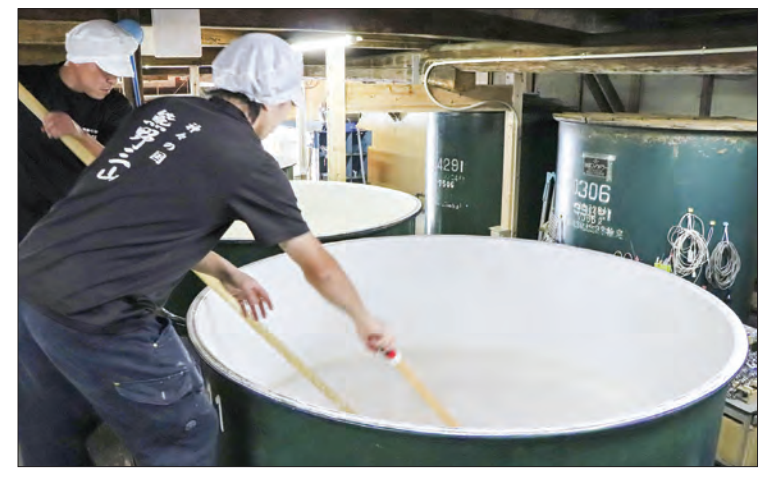
Sake making in Wakayama, western Japan, pictured in November 2018.

The total — of which 1.31 billion yen is in the budget for