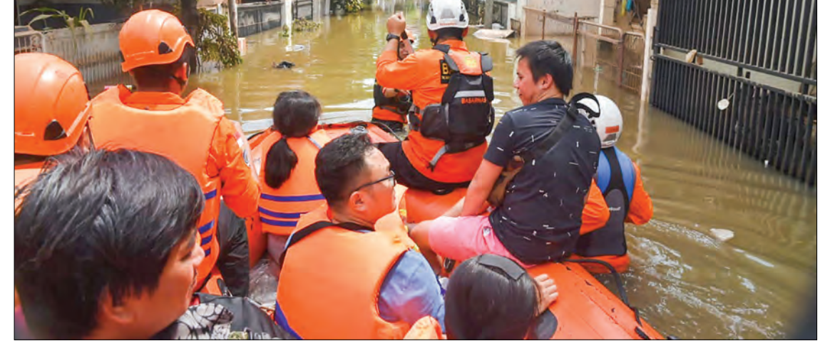
Photo taken 1 January, 2020 shows floods inundating parts of Jakarta.

City officials attributed the improvement in statistics to joint efforts by law enforcement agencies and community groups, in-