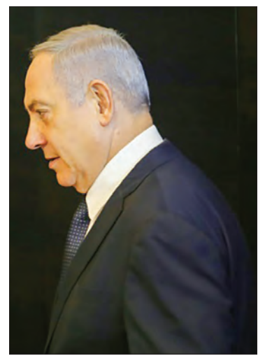
Netanyahu denies the allegations and accuses prosecutors and the media of a witch hunt .

The Israeli PM has been the subject of multiple corruption investigations and cases of impropriety, including, advancing a law that would benefit one of Israel's major newspapers, and supporting looser regulation of telecommunication company Bezeq in return for positive coverage. — ANI