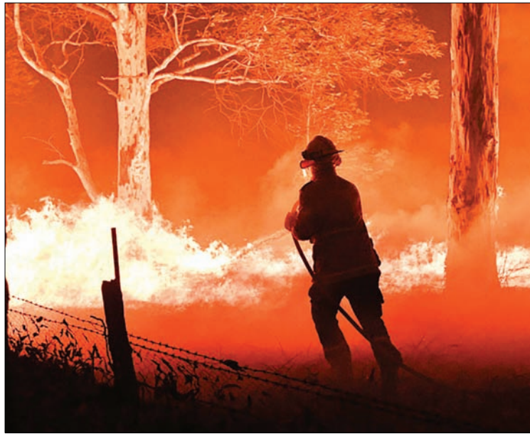
It has been a long and painful bushfire season in Australia. PHOTO: AFP

There were mounting fears for several others missing after the country's southeast was devastated by out-of-control blazes, which destroyed more than 200 homes and left some small towns in ruins.—AFP ■