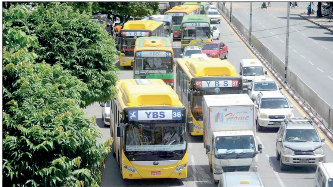
YBS buses seen in downtown Yangon.

"Some of the YBS branches are not operating within the approved system. We have to resolve this issue ourselves as we