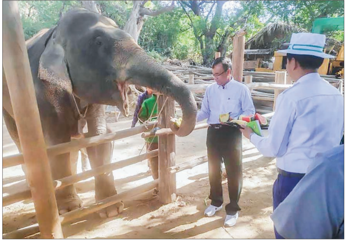
Union Minister U Ohn Win feeding an elephant at the elephant camp in Nyaung U Township, Mandalay Region yesterday.