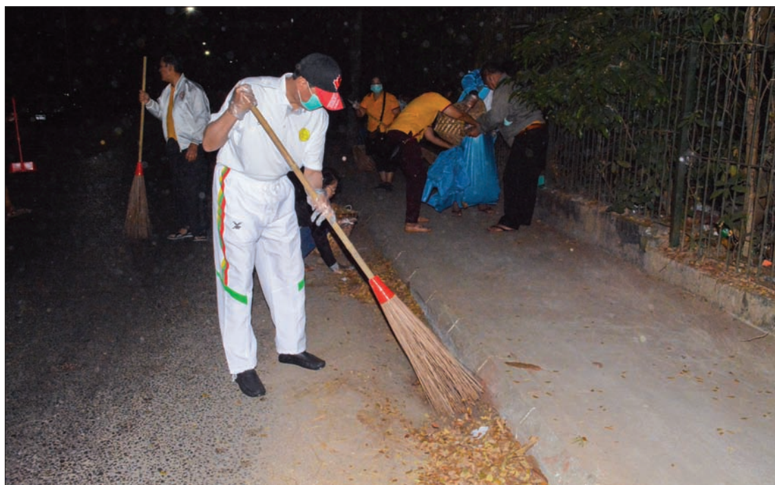
Union Minister Dr Myo Thein Gyi participates in the garbage-free campaign in Hline Campus of Yangon University and Yangon University of Economics yesterday.