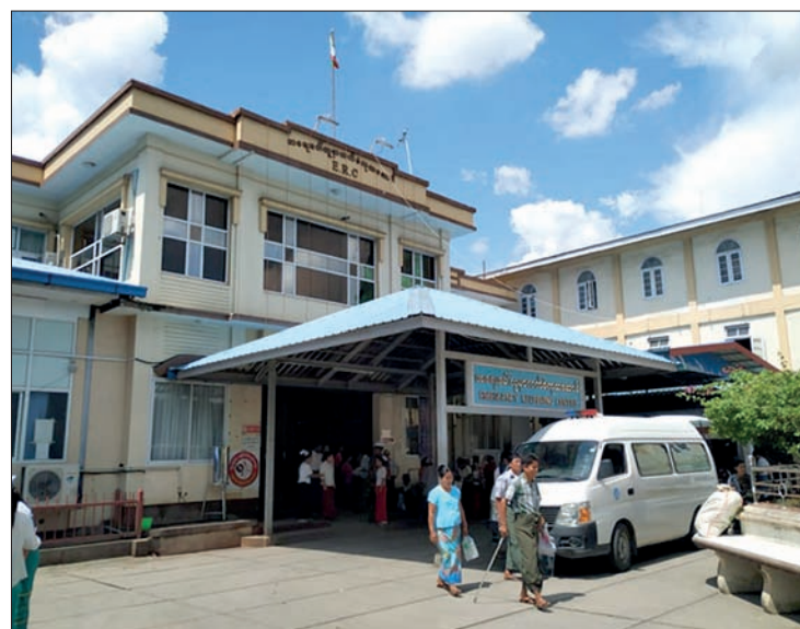
Mandalay General Hospital.