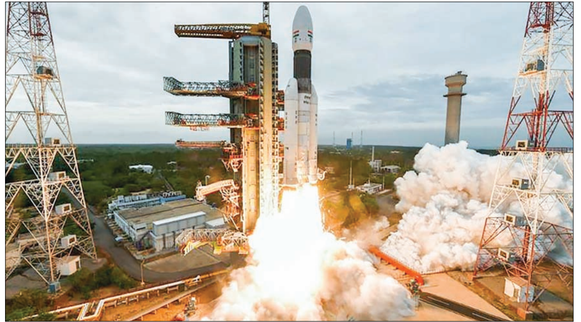
ISRO's Chandrayaan-2 was launched on 22 July, 2019.

He added that India had chosen four candidate astronauts to take part in the country's first manned mission into orbit, pledged to take place by