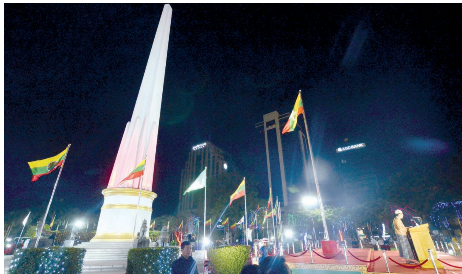
The flag raising ceremony to mark the 71 st anniversary of Independence Day was held in Yangon on 4 th January, 2019.

Liberty is of paramount importance for all human beings in