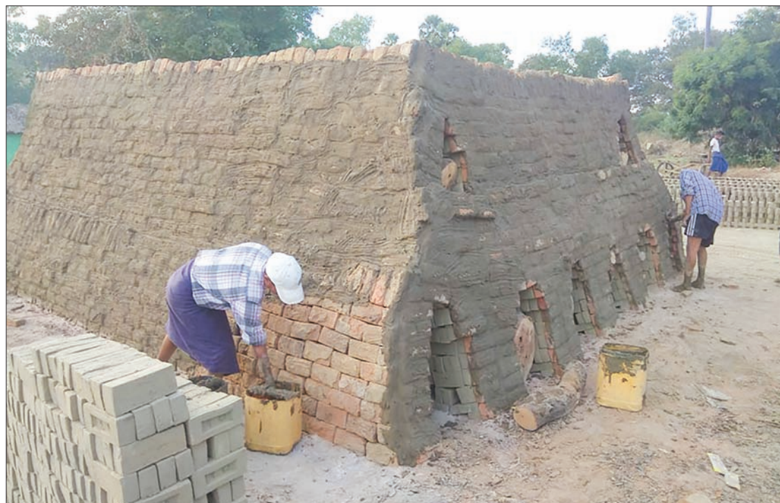
Workers making bricks in Kabargyi Village, Seikpyu Township, Magway Region.

BRICKS are selling well in Kabargyi Village, Seikpyu Township, Magway Region, though the local people are selling them at slightly higher prices.