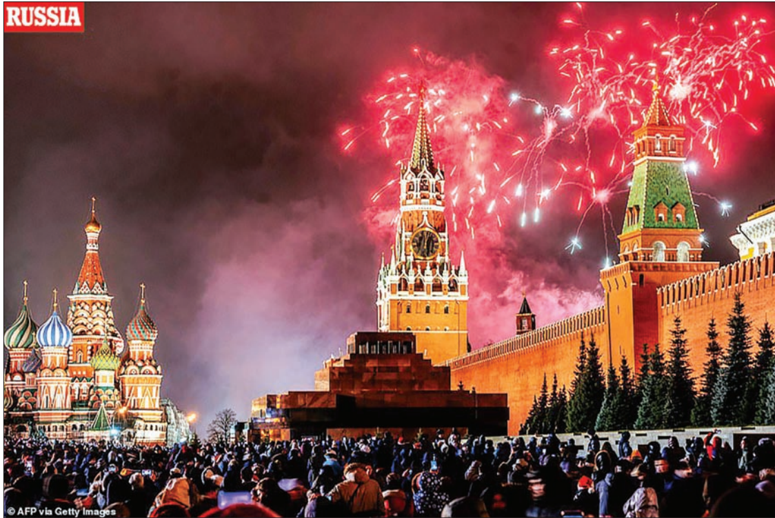
Fireworks explode over the Kremlin in Moscow during New Year celebrations, on 1 January, 2020.

LONDON — Leaders of European countries have voiced concerns and aspirations in their Christmas and New Year messages, as the eventful year of 2019 comes to an end.