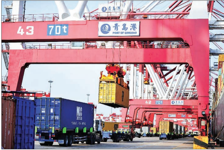
China's Vice-Premier Liu He said the two sides "reached a consensus, will not fight a trade war, and will stop increasing tariffs on each other".

WASHINGTON — A partial new US-China trade agreement will be signed in the middle of next month, US President Donald Trump said Tuesday, announcing that he will also then travel to China for continued talks. Trump's tweet, sent