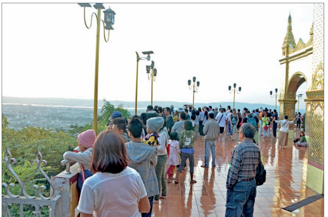
Tourists enjoy the sunset on the Mandalay Hill during their New Year holiday.

Being their first time in Myanmar, an Italian tourist said arriving in Mandalay checked off their bucket list of places to visit, which included Yangon and Bagan as well. They said they were fascinated with the architecture of Bagan's temples and they hoped to walk to the end of U Bein bridge while watching the sunset. They said they will encourage their friends to visit