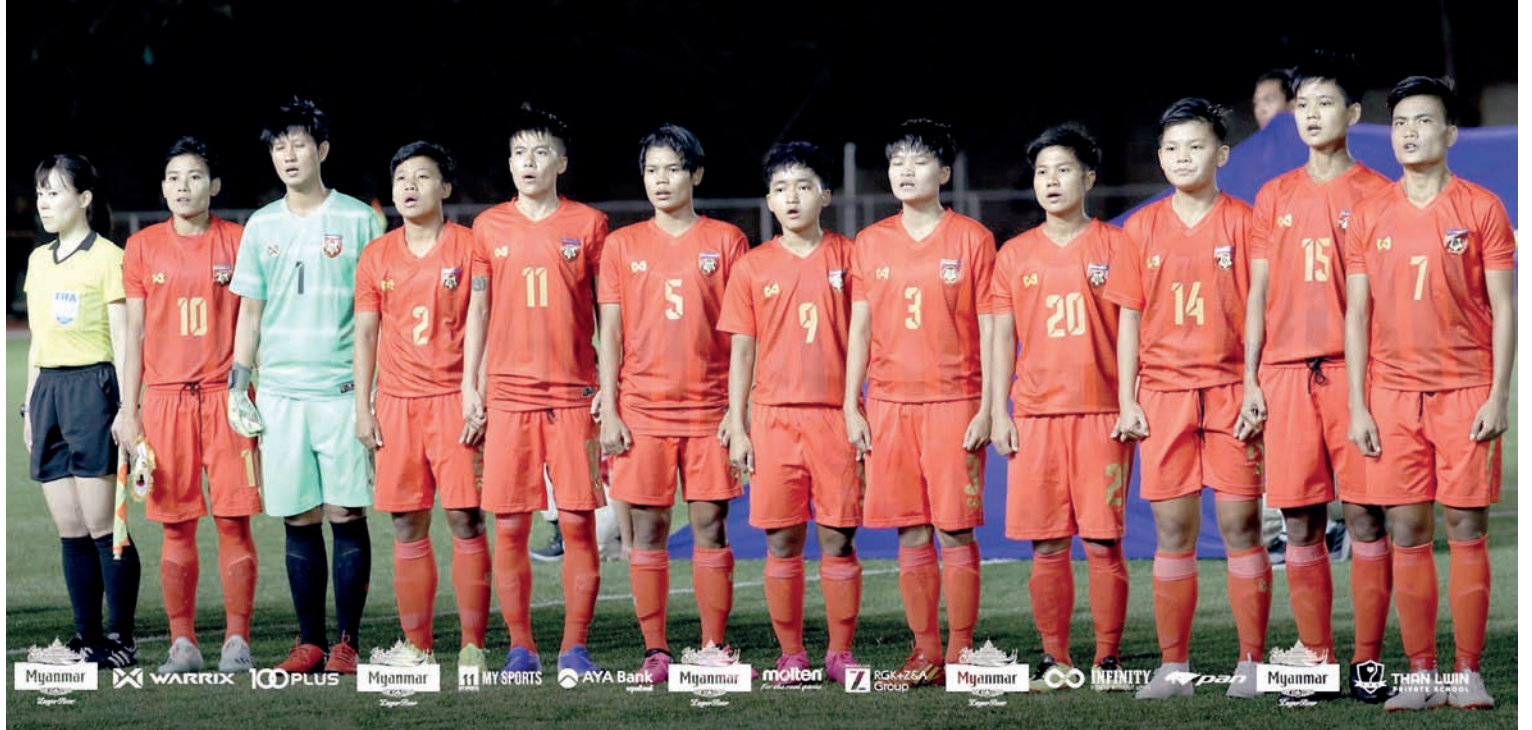
Myanmar's women's football team singing the national anthem at an international football match.

IN preparation for the upcoming qualifiers for the Tokyo Olympic Games 2020, Myanmar's national women's football team will play a friendly match with Thailand's team this month.