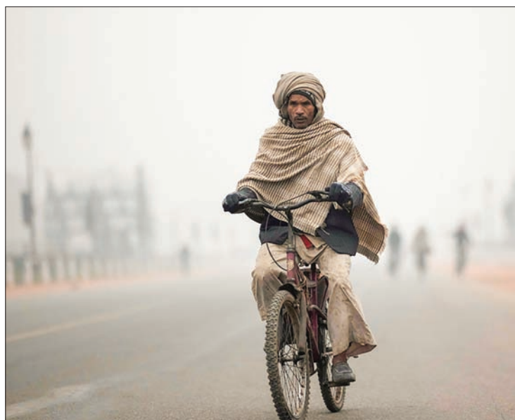
A man rides a bicycle along a street amid smog and foggy conditions on a cold morning in New Delhi on 28 December, 2019.

They need to keep themselves warm, consume hot flu-