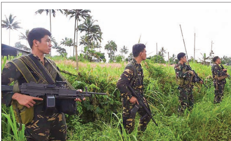
FILE PHOTO: Philippine soldiers secure a road as they provide security for a retrieval operation of dead civilians in the outskirts of Marawi on the southern island of Mindanao on 28 June, 2017.

Two other extensions were granted by Philippine congress for the entire years of 2018 and 2019.—Xinhua ■