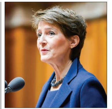
Fifty-nine-year-old Simonetta Sommaruga was already the minister for environment, transport, energy and communication.

Greece is welcoming 2020 with optimism, having learnt valuable lessons from past mistakes, leaving the financial crisis behind and moving forward with confidence and unity, Greek Prime Minister Kyriakos Mitsotakis said in his New Year message.—Xinhua