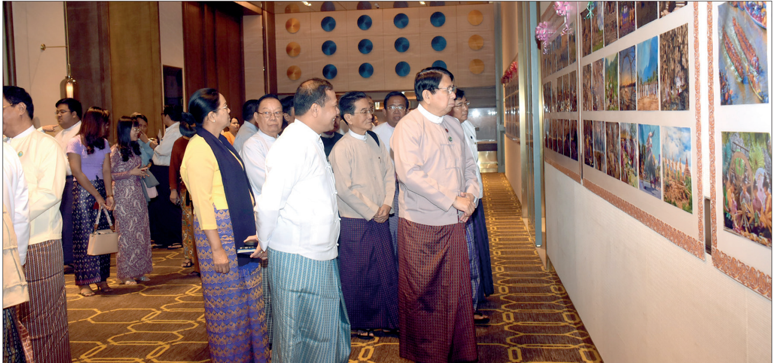
Union Minister for Information Dr Pe Myint looks winners' photos displayed at the photo and postcard contests organized by the Information and Public Relations Department under the title of “Value of State, Prestige of Nationality” in Yangon yesterday.

In delivering a speech, Union Minister Dr Pe Myint said that the Ministry of Information is organizing photo and