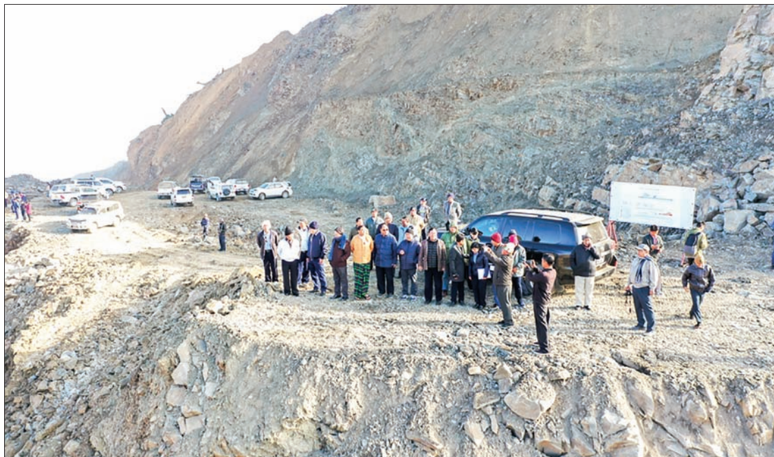
Union Minister for Transport and Communications U Thant Sin Maung inspects the construction site of the Surbung Airport project in Falam Township, Chin State, on 29 December.