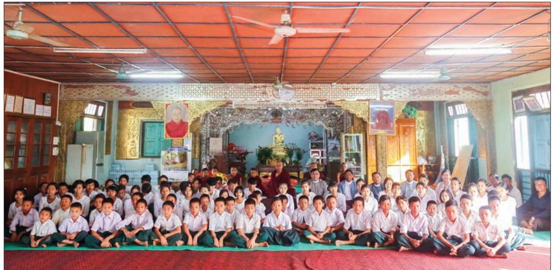
Union Minister Dr Win Myat Aye and Ma Soe Yein Monastery Sayadaw pose for a group photo together with students at the monastery in Thapyaygon, Nay Pyi Taw.