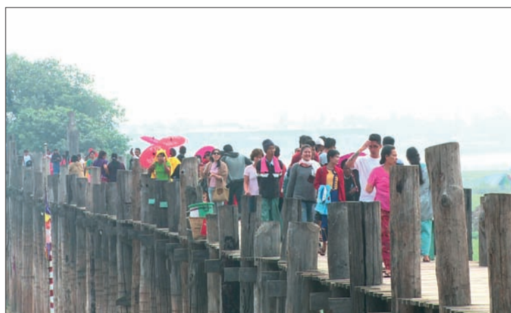
People visit the U Bein Bridge in Amarapura, Mandalay Region.

Myanmar when they go back and they themselves hope to visit here again after experiencing the friendliness and hospitality of local residents.