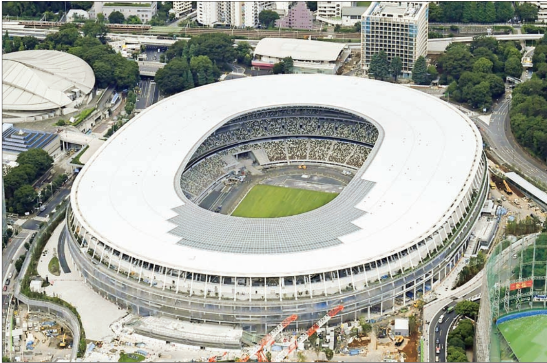
The new National Stadium, the main venue for the 2020 Olympics and Paralympics.