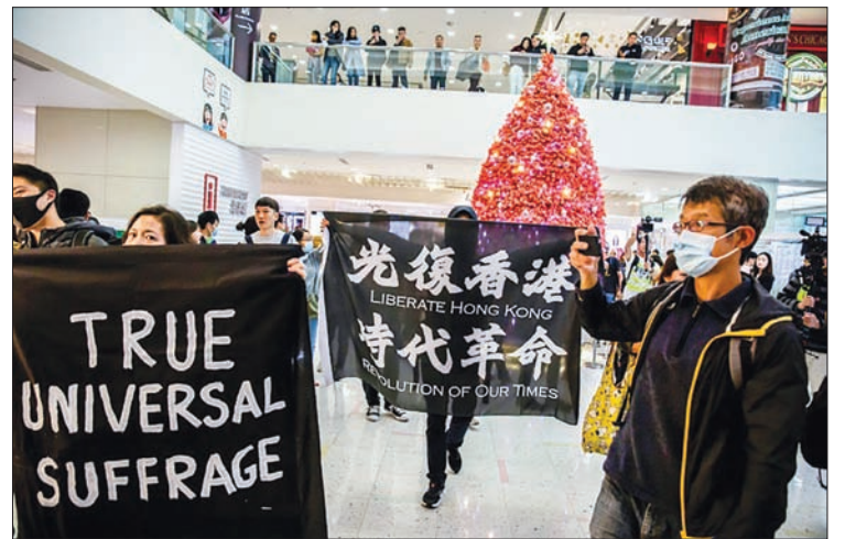
More than six months of protests have called for democratic reforms in the Chinese city.

Earlier in the evening, thousands of people linked arms in human chains that stretched for miles along busy shopping streets and through local neighbourhoods.—AFP ■