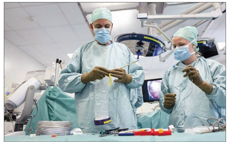
FILE PHOTO: A study on the early onset of stomach cancer found that majority of younger people under 60 who develop stomach cancer have a 'genetically and clinically distinct' disease.

The researchers found that the incidence of late-onset stomach cancer decreased by 1.8 per cent annually during the study period, while the early-onset disease decreased by 1.9 per cent annually from 1973 to 1995 and then increased by 1.5 per cent through 2013. — ANI ■