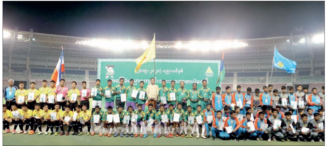
Union Minister Dr Myo Thein Gyi and winners pose for a documentary photo at the 2019-2020 Academic Year Basic Education Student Sports Festival awarding ceremony in Nay Pyi Taw yesterday.

The results are 15 gold, 2 silver and 4 bronze medals for Taninthayi Region, 3 gold, 2 silver and 1 bronze for Shan State, 2 gold, 4 silver and 6 bronze for Magway Region, 2 gold, 3 silver and 4 bronze for Bago Region, 2 gold, 3 silver and 3 bronze for Kachin State, 2 gold, 3 silver and 1 bronze for Ayeyawady Region, 2 gold, 2 silver and 3 bronze for Yangon Region, 1 gold, 5 silver and 2 bronze for Mon State, 1 gold, 2