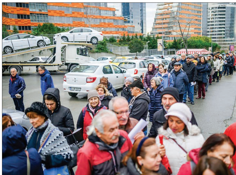
People have been waiting in line to lodge their protest against a giant canal project.

But the president is unfazed by Imamoglu's campaign: "We will build Canal Istanbul whether they want it or not," he said in a speech on Monday. "Turkey has the strength to do it."—AFP ■