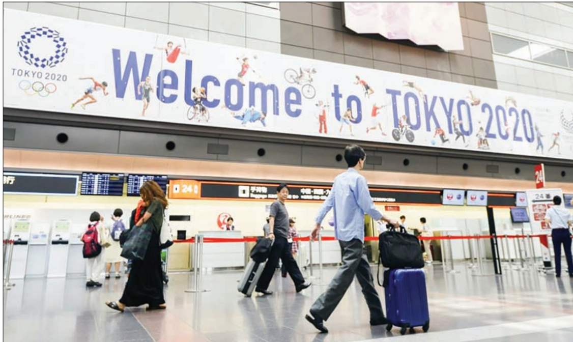
The 2020 Tokyo Olympics are scheduled to be held between 24 July and 9 August, followed by the Paralympics from 25 August to 6 September.