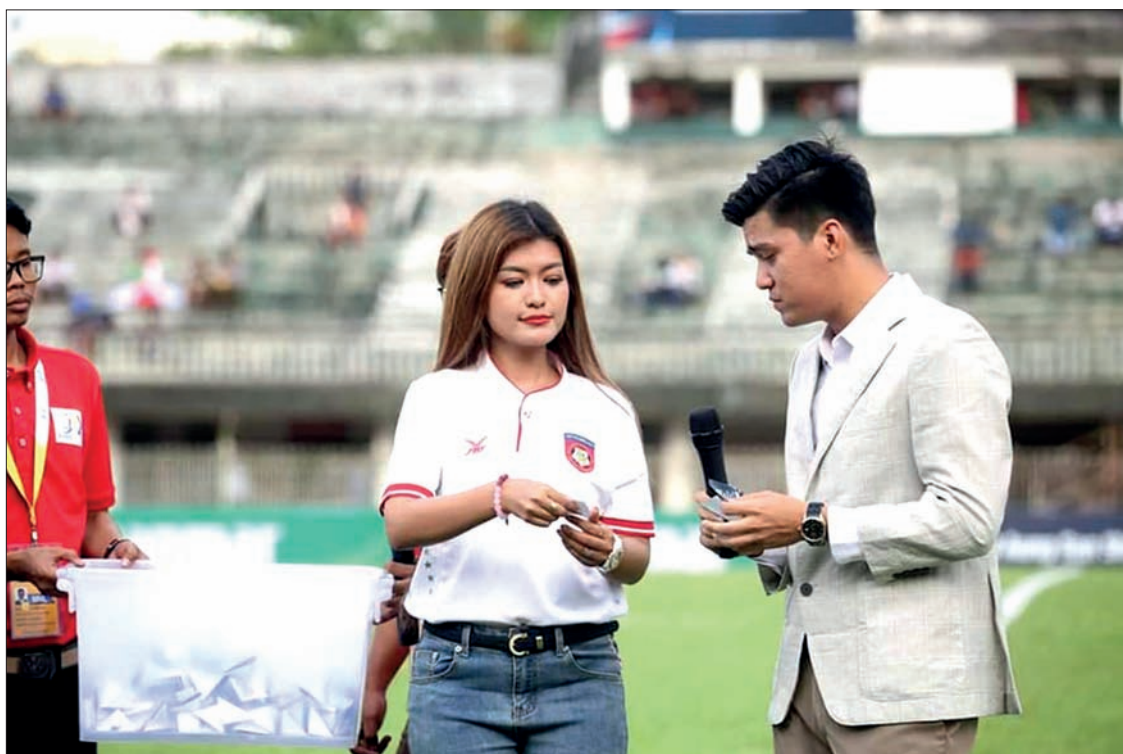
Artistes declaring the lucky draw winners at the previous MFF Charity Cup 2019.

All funds collected from Myanmar football fans will be donated to orphanages across Myanmar, according to the Myanmar National League.—Lynn Thit (Tgi)