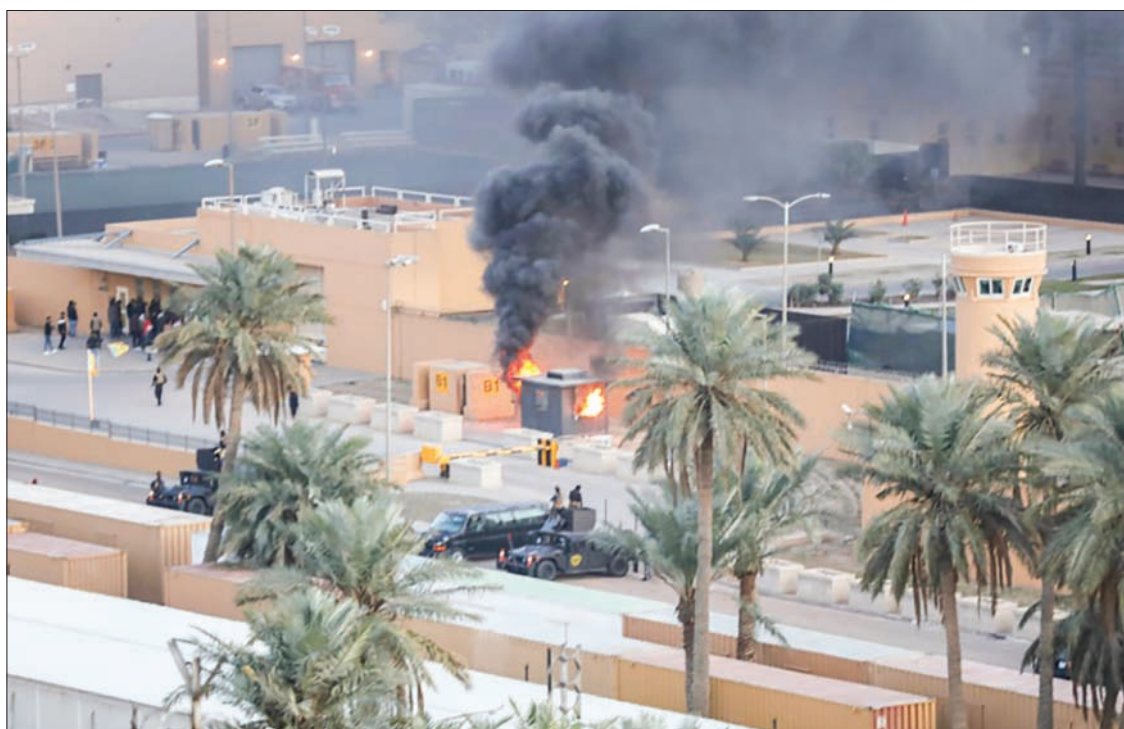
A sentry box burns at an entrance to the United States embassy in the Iraqi capital Baghdad. PHOTO: AFP

Security personnel inside responded with tear gas, wounding several protesters.— AFP ■