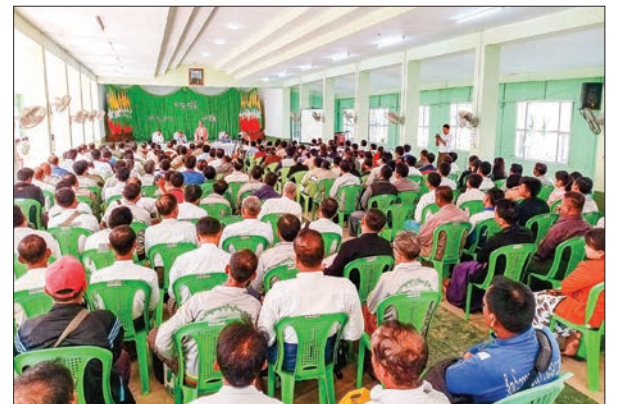
Rakhine State Chief Minister U Nyi Pu addresses the meeting with departmental officials and local people in Rakhine State.

cussed the needs for health, education, transportation and electrification sectors, and the officials coordinated discussions.