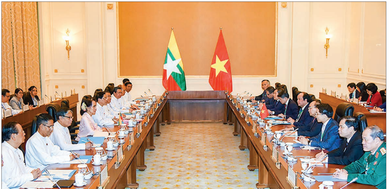
State Counsellor Daw Aung San Suu Kyi and Prime Minister Nguyen Xuan Phuc of the Socialist Republic of Viet Nam attend the senior-level meeting of the two countries.

They had in-depth discussions on a wide of issues including bilateral trade, investment, agriculture, and cooperation in defence and security sectors. They also agreed to take mu-