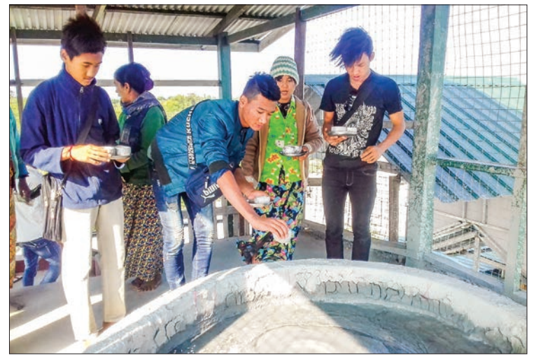
Pilgrims visit Naga Bwet Taung, the Mud Volcano near Minbu township during their New Year holidays.