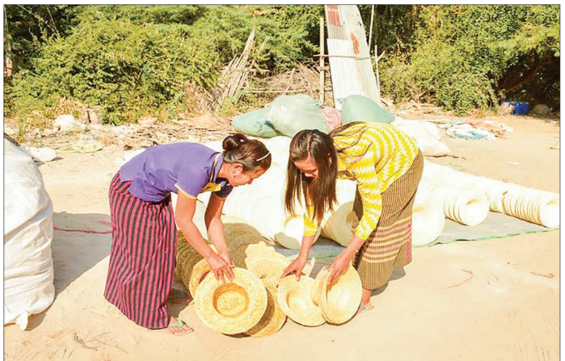
Workers collect wheat straw hats drying in the sun in Ngar Lone Tin Village, ChaungU Township.

"We have been in the wheat straw hat business in the villages for many years. We send all the finished products across the country. We did not make such good sales earlier, but now our sales have increased because there are only a few wheat straw hat makers in our town. We are sending the wheat straw hats mainly to Lashio because the local people from Lashio are primarily engaged in agriculture. So, they order wheat straw hats, which last long in bad weather conditions," she added. This year, Ngar