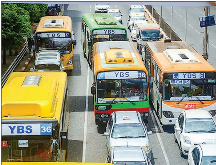
This photo shows YBS buses running through on the busy road in downtown area in Yangon.