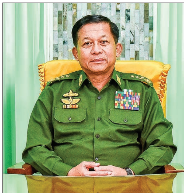
Senior General Min Aung Hlaing.

I wish all the country's people, with rationalization, join hands with the Tatmadaw in 2020. I