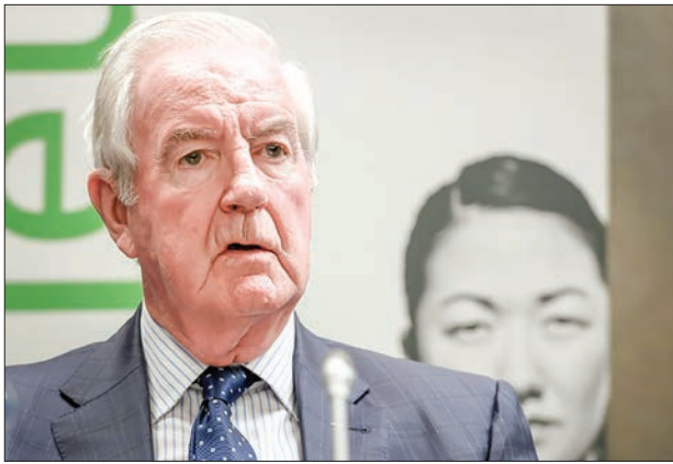
Outgoing WADA President Craig Reedie says the Russian doping crisis is the biggest challenge he has faced in his six years at the helm of the anti-doping agency.