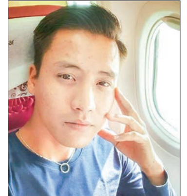
Singer Aung Htet.