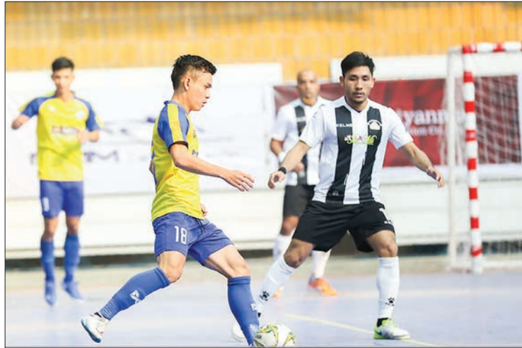
Players of MIU F.C. and VUC F.C. vie for the ball at the National Indoor Stadium (2) in Hline Township on 31 December 2019.

Meanwhile, On Doctor F.C. beat AMM Brothers F.C. with a score of 4-0, GV F.C. beat Futsal Chithu F.C. by 6-0, Myoma JY F.C. defeated the MFF U19 Team by 4-2, Do Do Ko Ko F.C. drubbed Let Wel Thone Nara F.C. with a score of 6-2, and Winner F.C. prevailed over Dream Team F.C. by 6-0.