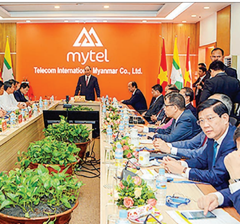
Vietnamese Prime Minister Mr Nguyen Xuan Phuc holds the meeting at Mytel HQ, the joint-venture telecoms firm between Myanmar and Viet Nam.

tually beneficial cooperation to a new level in various sectors and strengthen collaboration that will be helpful not only for the two countries, but also for peace and stability in the region. To ensure peace and security in the ASEAN Region, they pledged to boost bilateral security and defence cooperation by sharing information and experience. Vietnamese Prime Minister Mr Nguyen Xuan Phuc welcomed Myanmar's proposal on establishing a Viet Nam Industrial Park in Myanmar and Myanmar companies' presence in Viet Nam. Along with stronger bilateral relations at all levels, mutual trust and understanding between the two governments and peoples has been increasingly deepened.