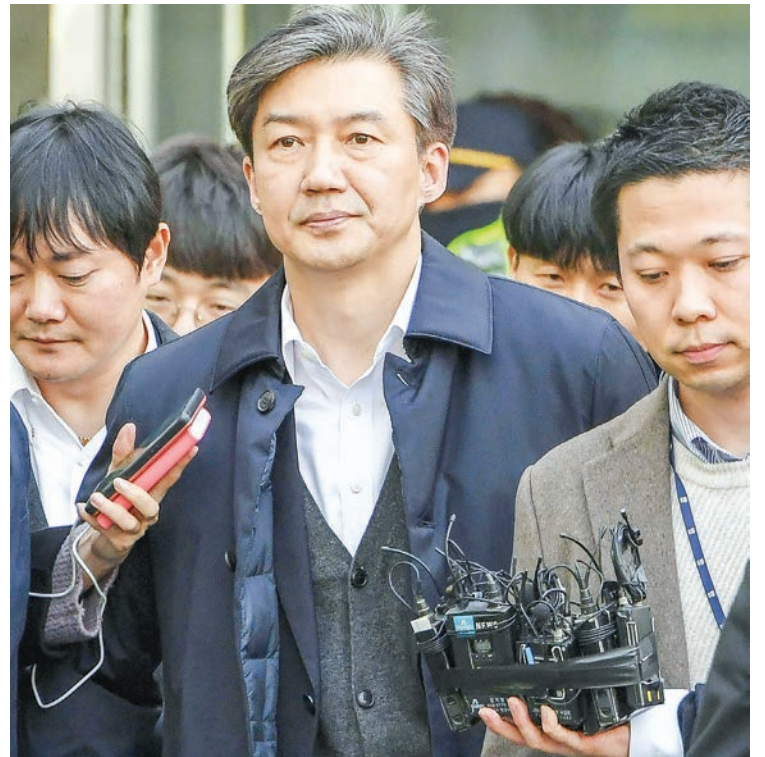
Former South Korean Justice Minister Cho Kuk leaves the Seoul Eastern District Court following a hearing on 26 December 2019, after prosecutors sought a warrant for his arrest.

His wife was that same month arrested on a range of charges including embezzle-