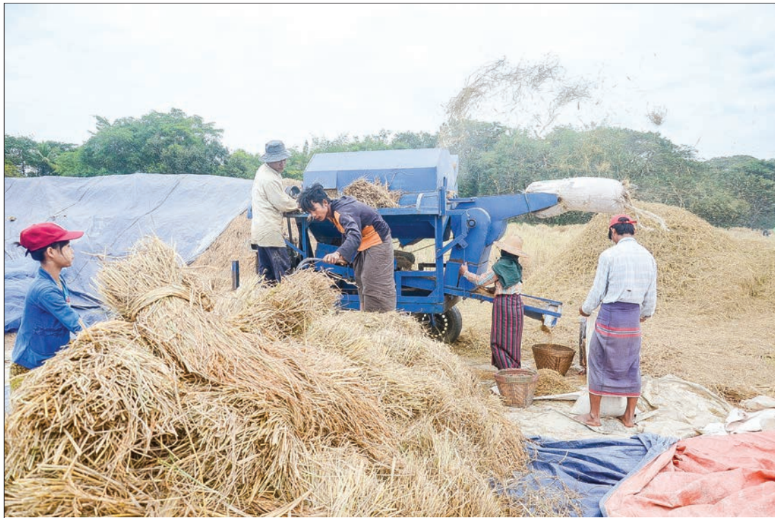
Farmers thresh rice with the help of a machine in a paddy field in Kangyidauk, Ayeyawady.

The two sides also aim to secure a stable water source by establishing a water management organization for farmers and improve profitably by obtaining a geographical indication tag for