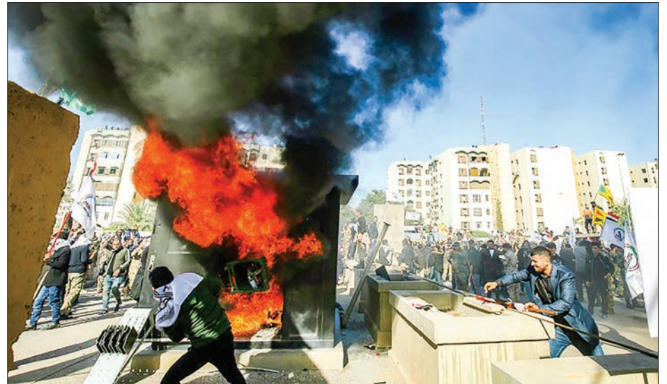
It was the first time in years protesters have been able to reach the US embassy in Baghdad, which is sheltered behind a series of checkpoints in the high-security Green Zone.

The demonstrators waved flags in support of the Hashed al-Shaabi, a mostly Shiite network of