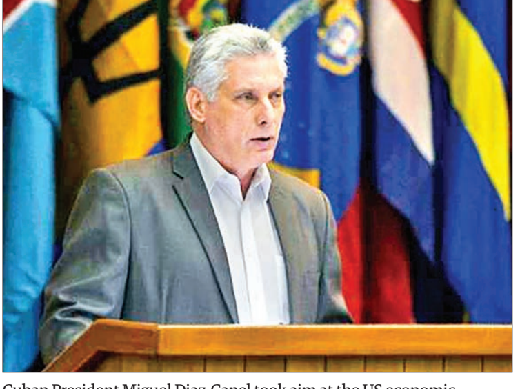
Cuban President Miguel Diaz-Canel took aim at the US economic blockade of Cuba.

Spearheaded by Mariela Castro, the daughter of former president Raul Castro, changes to the new constitution would include a provision that defines marriage as between "two people" rather than "a man and a woman." The silver-haired Diaz-Canel assumed power in April from Castro, who himself took over from his elder brother Fidel, father of the 1959 revolution.