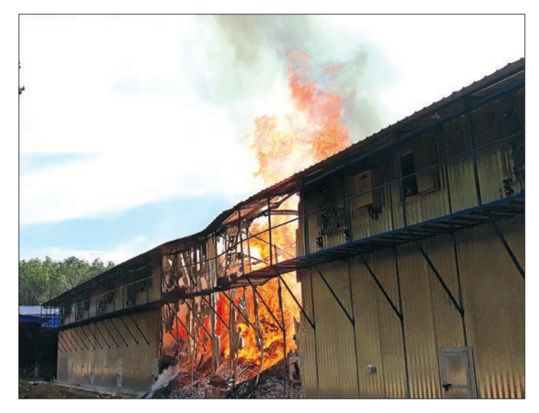
Fire at a timber factory in Thanbyuzayat.