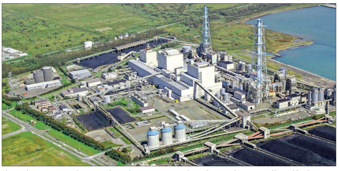
Photo taken on 6 September, 2018, shows the Tomatoatsuma thermal power plant operated by Hokkaido Electric Power Co in Atsuma on the northernmost Japanese main island of Hokkaido.

Hokkaido electricity use from its pre-quake weekday peak demand, with power supplies gradually being restored in the prefecture. Hokkaido Electric said it is prepared to provide up to 3.6 million kw against a projected peak of 3.19 million kw on Monday. However, as electricity demand is expected to increase with the restart of corporate activities following the end of a three-day holiday through Monday, Hokkaido Electricity urged users to save power between 8:30 am and 8:30 pm on weekdays. —Kyodo News 🔳