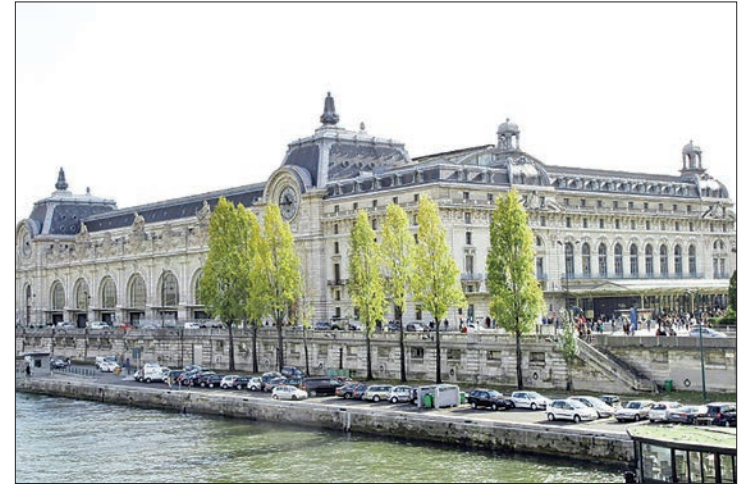
The Musee d'Orsay in Paris will be showing 'Picasso Blue and Rose' through 6 January.

PARIS (France) — More than 300 works from two key periods in Pablo Picasso's early years go on display in Paris on Tuesday, the first time they have been brought together in the city where the Spanish master took his first steps toward revolutionary new territories of modern art. "Picasso: Blue and Rose" delves into the formative days from 1900 to 1906 when the young artist was living the Bohemian life in a Montmartre studio, at times burning his works to ward off the cold.