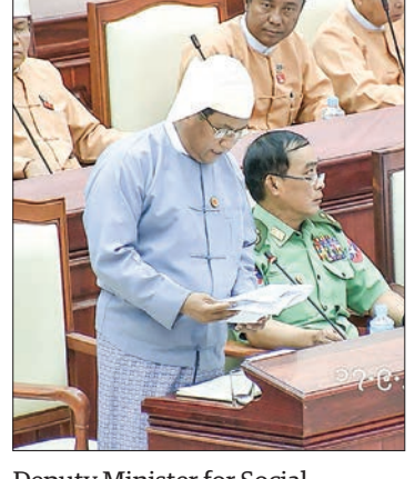
Deputy Minister for Social Welfare, Relief and Resettlement U Soe Aung.

In the first question of the day, U Kyaw Shwe of Yanbye constituency asked if there is a plan to construct multi-purpose cyclone shelters for workers and families living in Yanbye Township, Laytaung region, Santinmaw port and Kyaukoomaw port. In his reply on behalf of the ministry and Rakhine State government, Deputy Minister for Social Welfare, Relief and Resettlement U Soe Aung said the two ports had a population of more than 700 and 500 from 150 and 100 houses and there were even more during the open season. They were living close to the sea, and the nearest inland villages at Zayatpyin village tracts are about 6 miles away and there are no high grounds near the port. The Deputy Minister explained that a multi-purpose cyclone shelter will be constructed as a priority on an appropriate land chosen by Rakhine State government near the two ports with National Natural Disaster