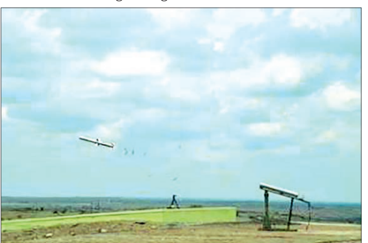
Indian Ministry of Defence.

A Defence Ministry spokesman said Indian Defence Minister Nirmala Sitharaman congratulated the DRDO team, Indian army and associated industries for the two successes of the MPATGM weapon system. —Xinhua 🔳