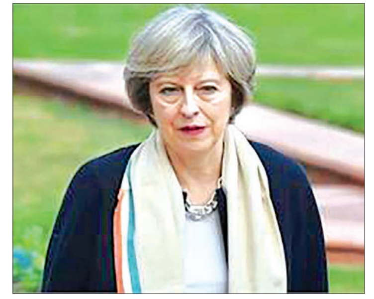
British Prime Minister Theresa May.

behind the increasing knife crime is that expanding London drugs gangs were engaging in turf wars with local drug dealers. —Xinhua ■