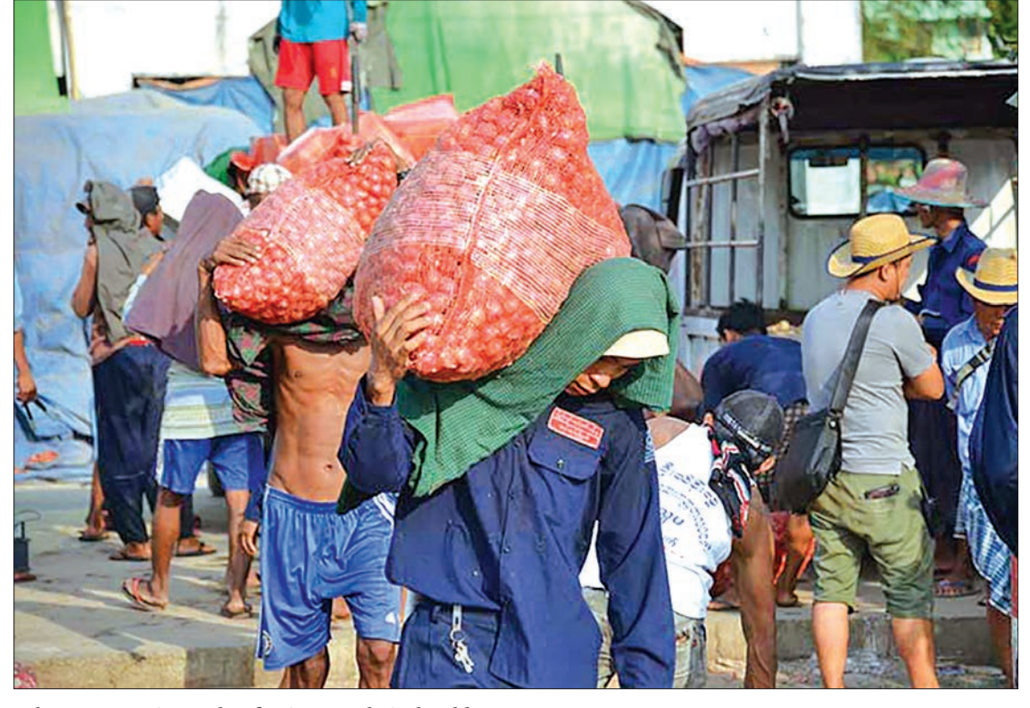
Labourers carrying sacks of onions on their shoulders.

market was sold between Ks 400 and Ks 600 per viss on 28 August, between Ks 500 and Ks 775 per viss on 8 September,