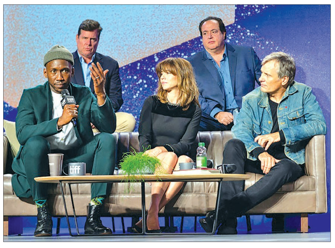
The film follows a working-class Italian-American bouncer who takes a job chauffeuring an African-American classical pianist through the US South in the 1960s, because it is too dangerous to travel alone.

So he hires street-fighting loud-mouthed Tony "Lip" Vallelonga (Mortensen) to accompany him on his journey, guided by the Negro Motorist Green Book to safe hotels and restaurants in the segregated South. —AFP