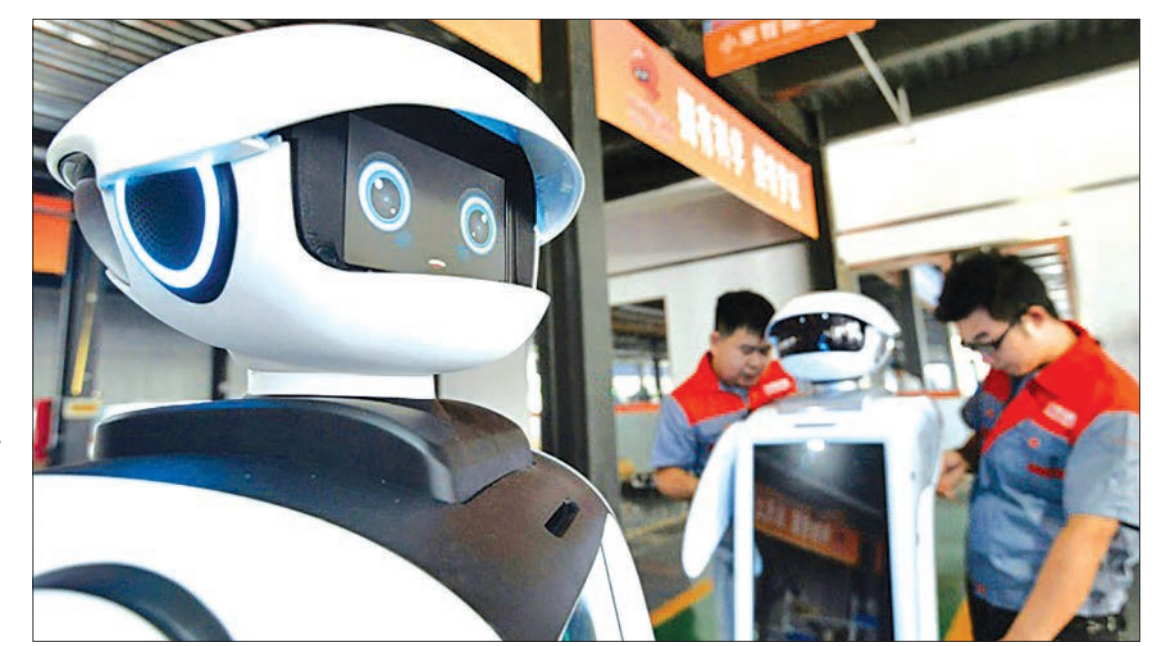
Robots will handle 52 percent of current work tasks by 2025, a World Economic Forum study says.

Based near Geneva, the WEF is known for the annual pow-wow of wealthy individuals, politicians and business leaders that it organises in Davos, Switzerland.