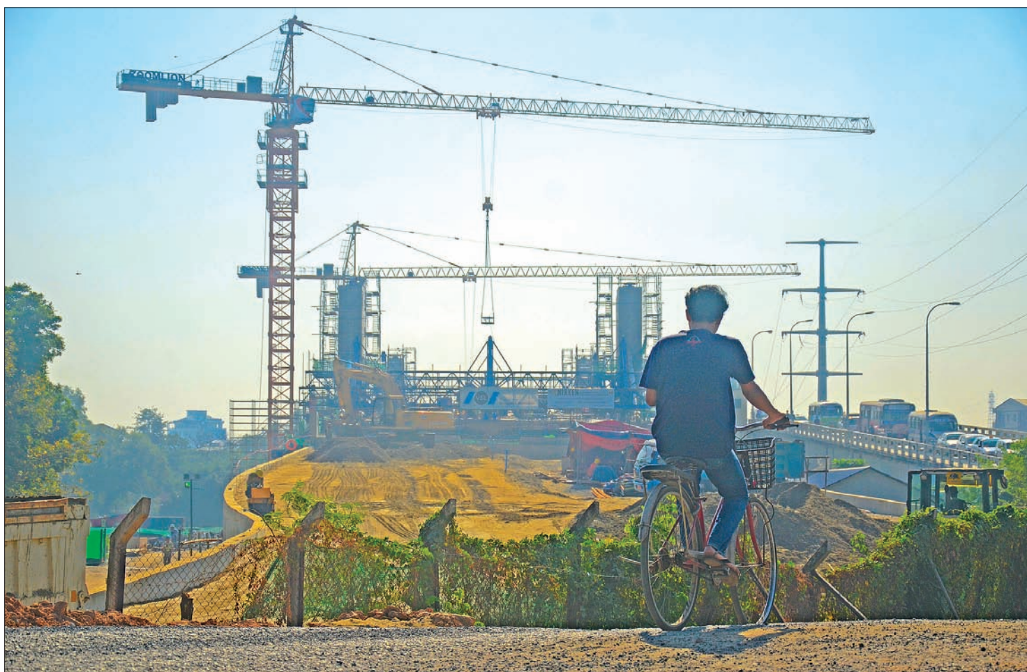
A man riding bicycle near the construction of the new Thakayta Bridge which is expected to open in July, 2018 in Yangon.

Due to limitation of space we are only able to publish "Letter to the Editor" that do not exceed 500 words. Should you submit a text longer than 500 words please be aware that your letter will be edited.