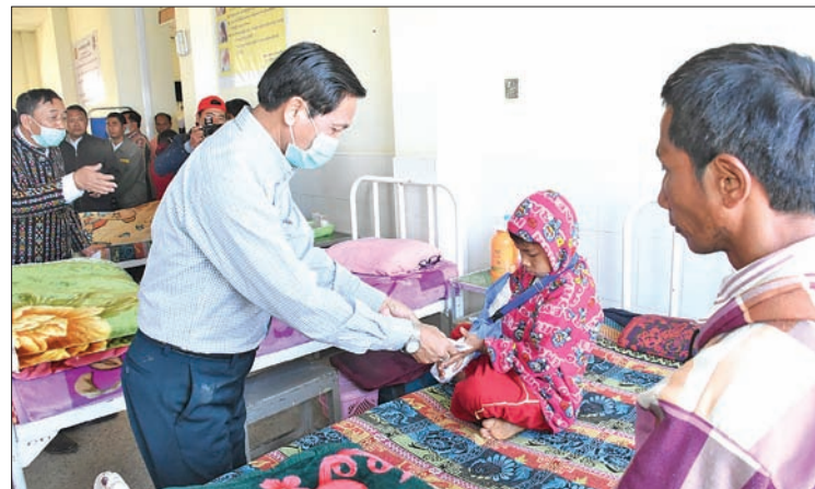
Vice President U Henry Van Thio provides the cash assistance to a patient at the Mindat District's General Hospital.

President offered advice on the process of supplying clean water to local residents. The site for Mindat College was a collective donation from Mindat residents for the betterment of Chin State's education.