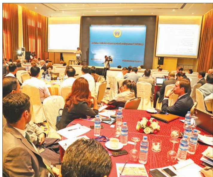
The Rakhine Relief-to-Recovery-to-Development Workshop being held in Nay Pyi Taw yesterday.

Myanmar has set up two reception camps and one transit camp on its side of the border. —Myanmar News Agency ■