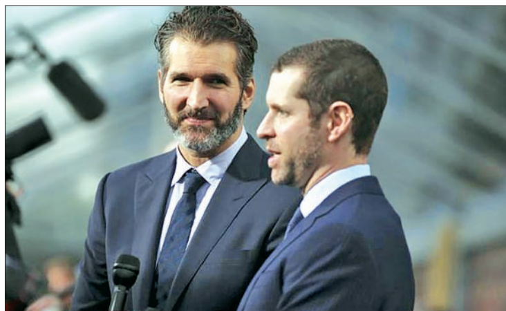
David Benioff (L) and Dan Weiss, creators and executive producers, arrive for the season premiere of HBO's 'Game of Thrones' in San Francisco, California on 23 March, 2015.

In November, Disney had announced that Johnson, director of "Star Wars: The Last Jedi," would write and direct the first of a new trilogy of films in the sci-fi franchise that would bring