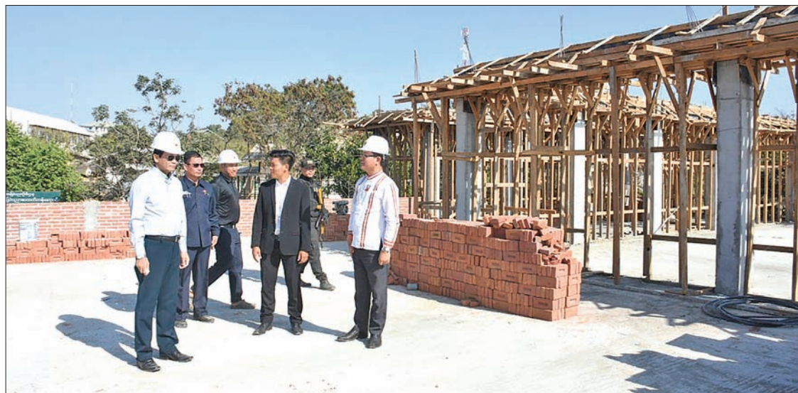
Vice President U Henry Van Thio inspects the construction site of new Mindat Market.