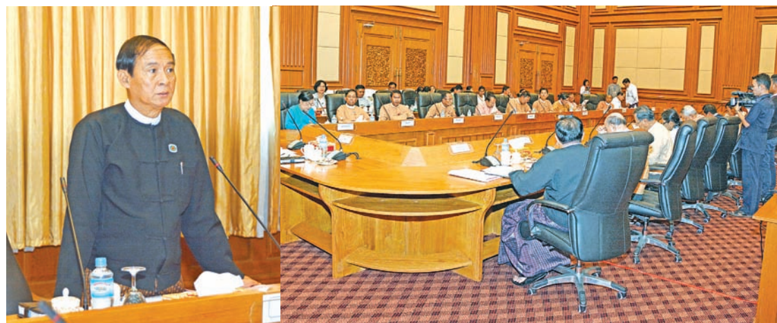
Pyithu Hluttaw Speaker U Win Myint addresses the coordination meeting in Nay Pyi Taw.

THE coordination meeting of the Speaker, Chairmen and Secretaries from the respective committees of Pyithu Hluttaw (1/2018) was conducted at Zabuthiri Hall in the Hluttaw building in Nay Pyi Taw yesterday.