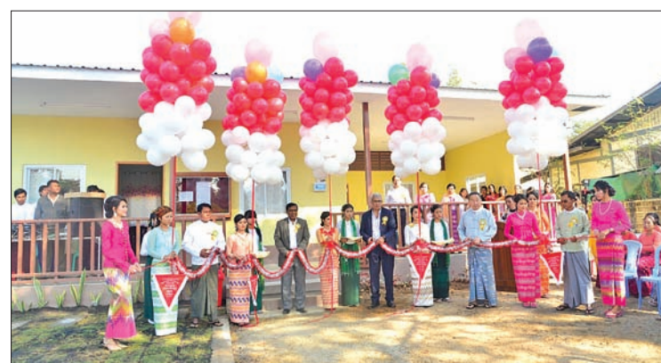
MPs and dignitaries formally open the ceremony to handover the school building in Thazi, Mandalay.

Representatives of the Shwe Taung Group handed over new two-storey buildings for BEHS in Pyi Nyaung Village. The new building is 12,672 square feet with 10 classrooms including a student lab and headmaster’s office. The