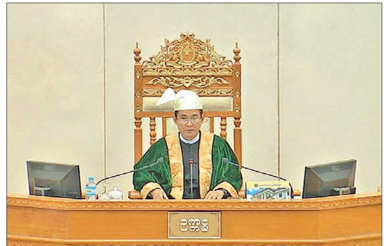
Pyithu Hluttaw Speaker U Win Myint.

He cited the Constitutional Act (385), which states that it is every citizen's duty to protect the security and sovereignty of the nation, as well as Section (21)