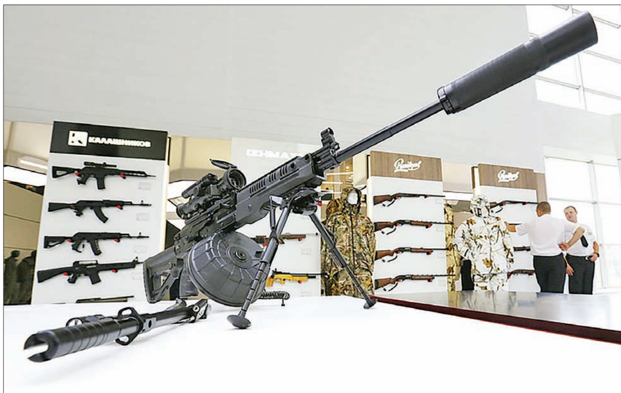
RPK-16 machine gun.