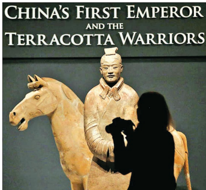
A Terracotta Warrior which guarded the tomb of China's First Emperor, Qin Shi Huang, on loan from China is displayed in The World Museum, Liverpool, Britain on 6 February, 2017.

The exhibit opens on 9 February and runs until 28 October at Liverpool's World Museum. —Reuters ■