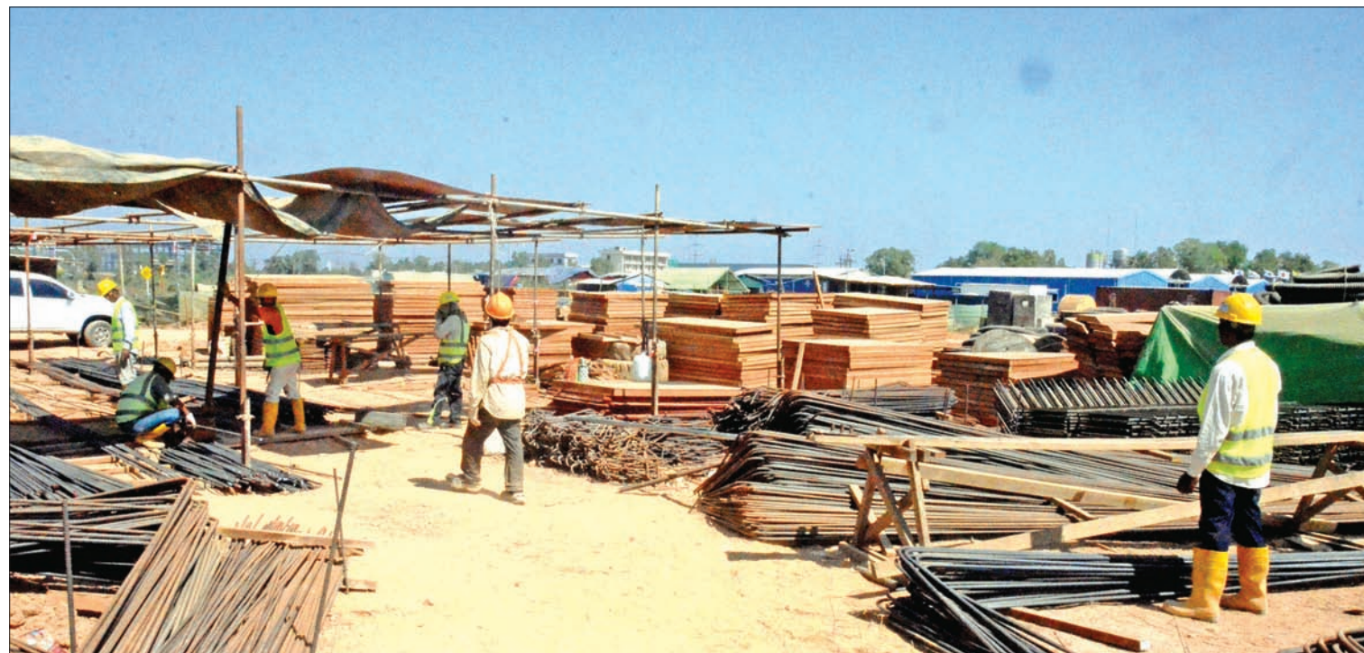
Construction workers working at the Thilawa Special Economic Zone, outskirts of Yangon.

Regarding the first part of Zone (B) that is spread over 101 hectares, she added that of the