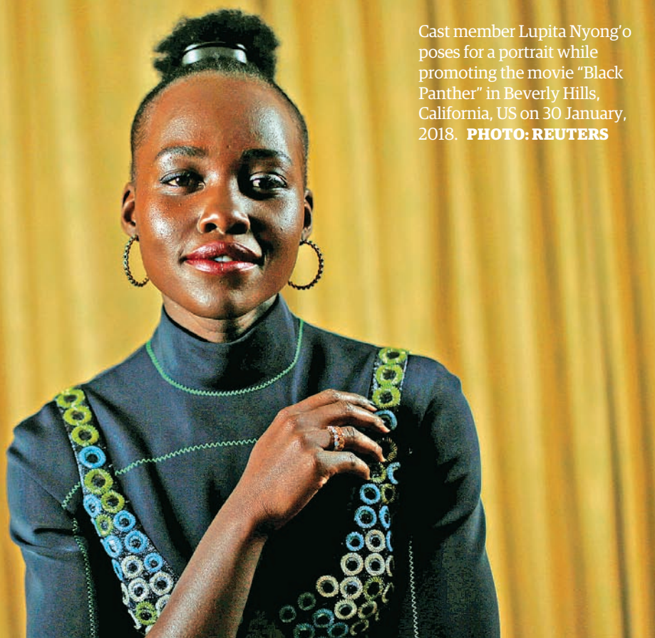
Cast member Lupita Nyong'o poses for a portrait while promoting the movie "Black Panther" in Beverly Hills, California, US on 30 January, 2018.

LOS ANGELES — "Black Panther," the first black standalone Marvel superhero movie, won rave reviews on Tuesday with critics praising both its adventure and its portrayal of a majestic Africa.