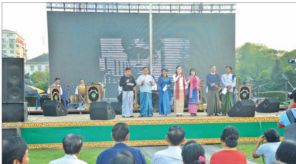
Writers and poets singing to open the poem recitation for peace in Yangon.

Fifty trainees are attending the training, which will end on 11 February.— Myanmar News Agency ■