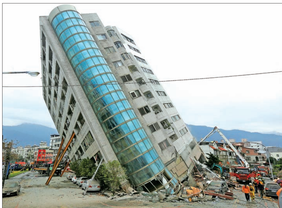
Rescue workers are seen by a damaged building after an earthquake hit Hualien, Taiwan on 7 February, 2018.

Hualien is home to about 100,000 people. Its streets were buckled by the force of the quake, with around 40,000 homes left without water and around 1,900 without power. Water supply had returned to nearly 5,000 homes by noon (0400 GMT), while power was restored to around 1,700 households.