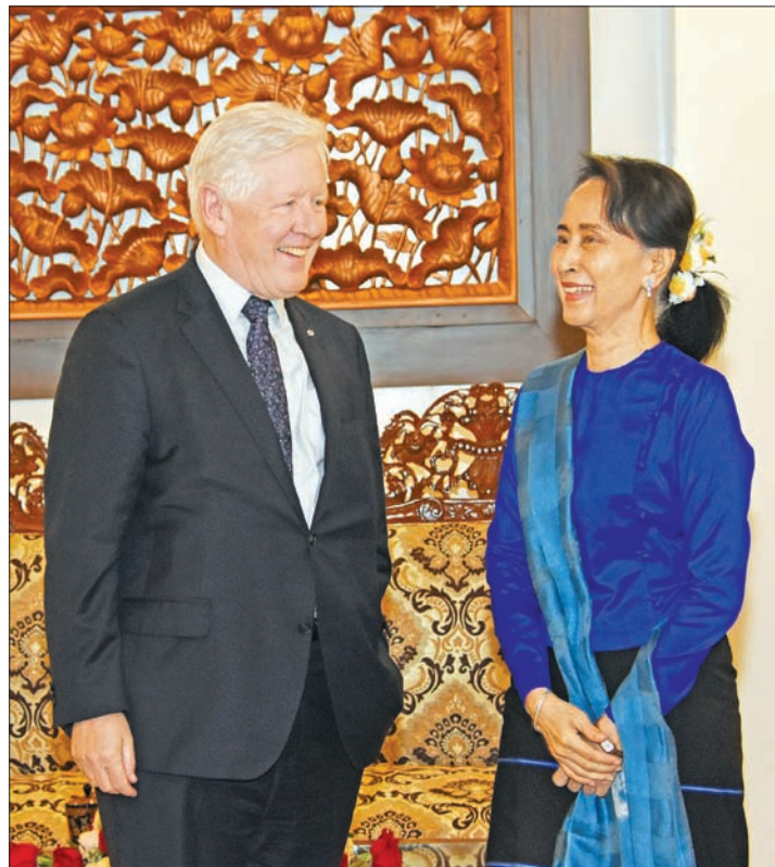
State Counsellor Daw Aung San Suu Kyi welcomes Hon. Robert Rae, former Ontario Premier of Canada, in Nay Pyi Taw.

Daw Aung San Suu Kyi, State Counsellor and Union Minister for Foreign Affairs of the Republic of the Union of Myanmar received Hon. Robert Rae, former Ontario Premier of Canada, at the Ministry in Nay Pyi Taw at 10:00 hrs yesterday.