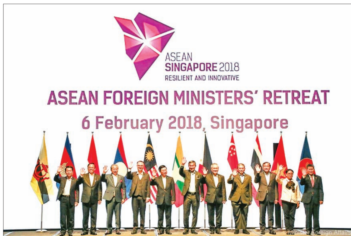
Union Minister for International Cooperation U Kyaw Tin and other ASEAN Foreign Ministers pose for a documentary photo at the ASEAN Foreign Ministers' Retreat in Singapore on Tuesday.

At the Retreat, the ministers discussed Singapore's initiative