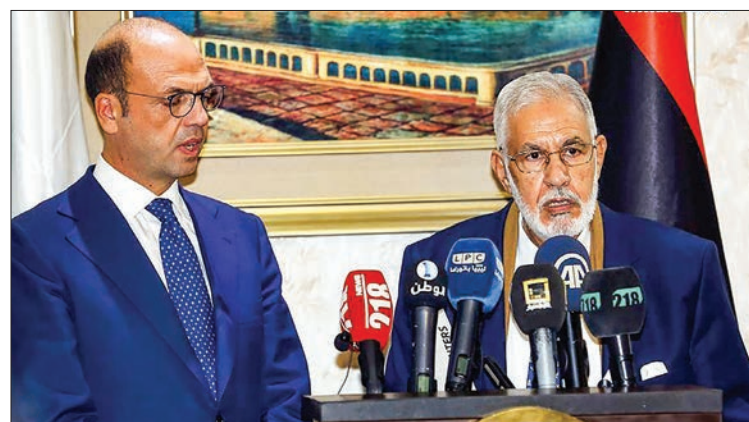
Libyan UN-backed Foreign Minister Mohamed Sayala (R) speaks during a press conference with Italian Foreign Minister Angelino Alfano in Tripoli, Libya, on 23 December 2017. Italian Foreign Minister Angelino Alfano is on a visit to Libya.

Eastern-based army commander, General Khalifa Haftar, announced a few days ago that the UN-sponsored political agreement had "expired" after it was signed by Libyan political factions two years ago. —Xinhua ■