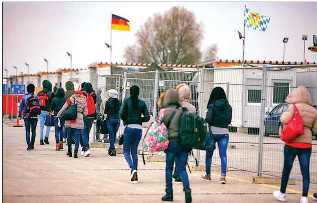
Eritrean migrants walk after arriving by plane from Italy at the first registration camp in Erding near Munich, Germany, on 15 November, 2016.

"That way municipalities would decide themselves how many refugees to take," he told the Funke newspaper group. "That would avoid citizens gain-