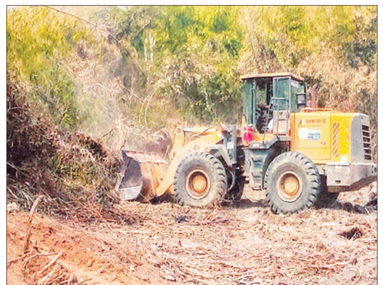
A Bulldozer works in action for 800 acres of farmland to be reclaimed in Kachin State.

A total of 300 acres of farmland are planned to be transformed from conventional farming into mechanized ones in Hopin, Waingmaw and Bhamo Townships next financial years with the use of Kachin State government's allotted fund, he added.—Win Naing (Kachin Land) ■