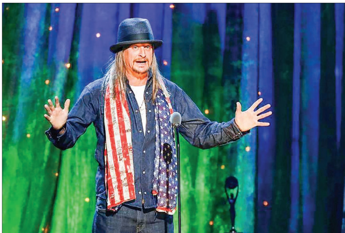
Kid Rock inducts rock band Cheap Trick at the 31st annual Rock and Roll Hall of Fame Induction Ceremony at the Barclays Center in Brooklyn, New York, US, in 2016.