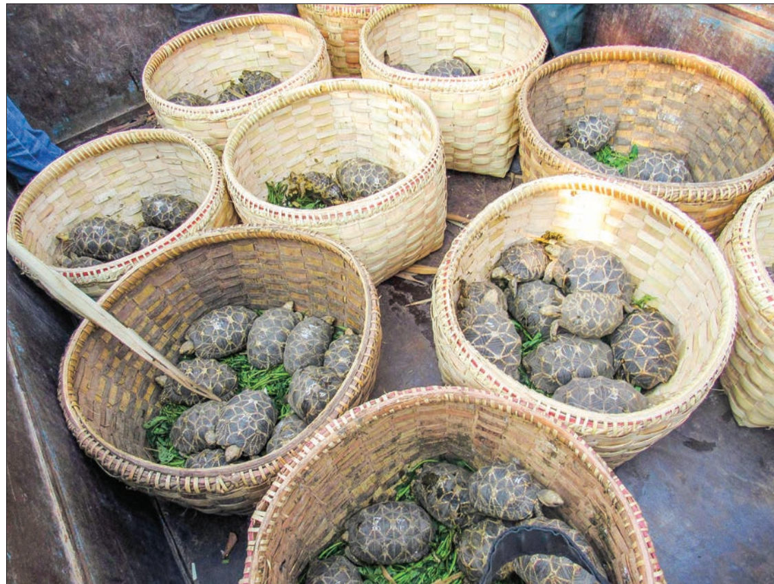
Population of star tortoises rise in Myanmar under captive-breeding programme.

This star tortoise species are country of origin. This breeding programme aims to conserve them from the brink of extinction, said U Myint Than Khaing, the deputy di-