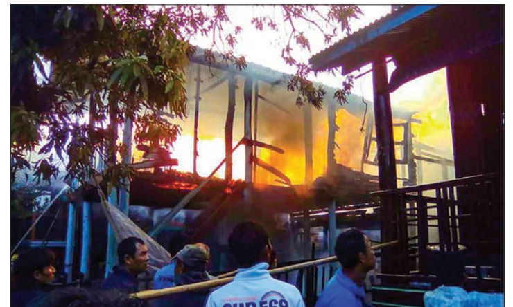
Fire breaks out in a house in Chaungkok Ward, Taungup Township, yesterday.

The estimated loss of property in the fire is about Ks 2 million, according to the township Information and Public Relations Department.—Myanmar Digital News ■