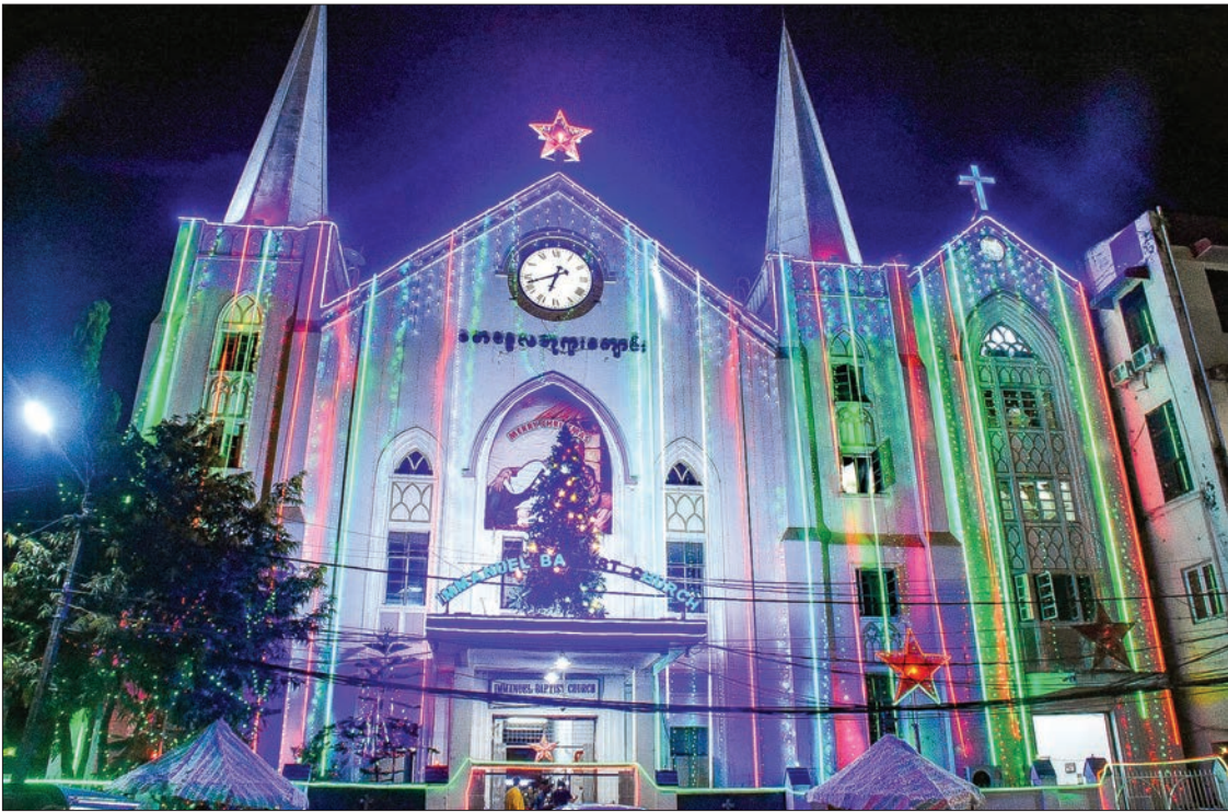
Christmas decorations at the Immanuel Baptist Church near Maha Bandula Park in Yangon.