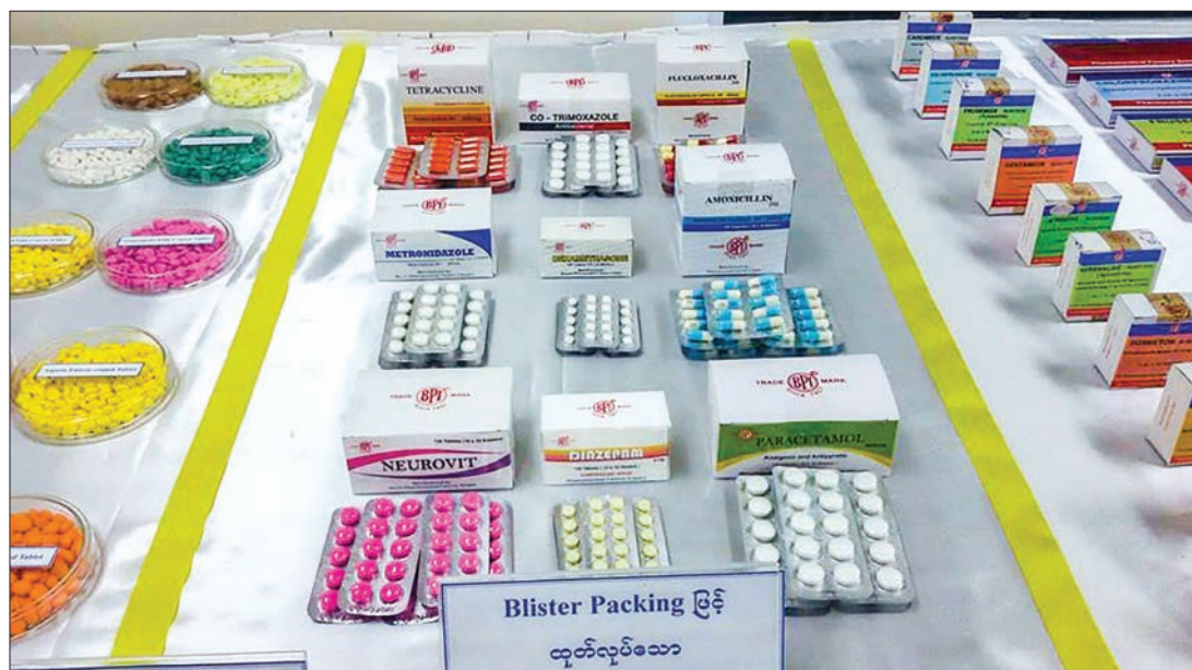
Myanmar Pharmaceutical Factory (MPF) carries out research activities.