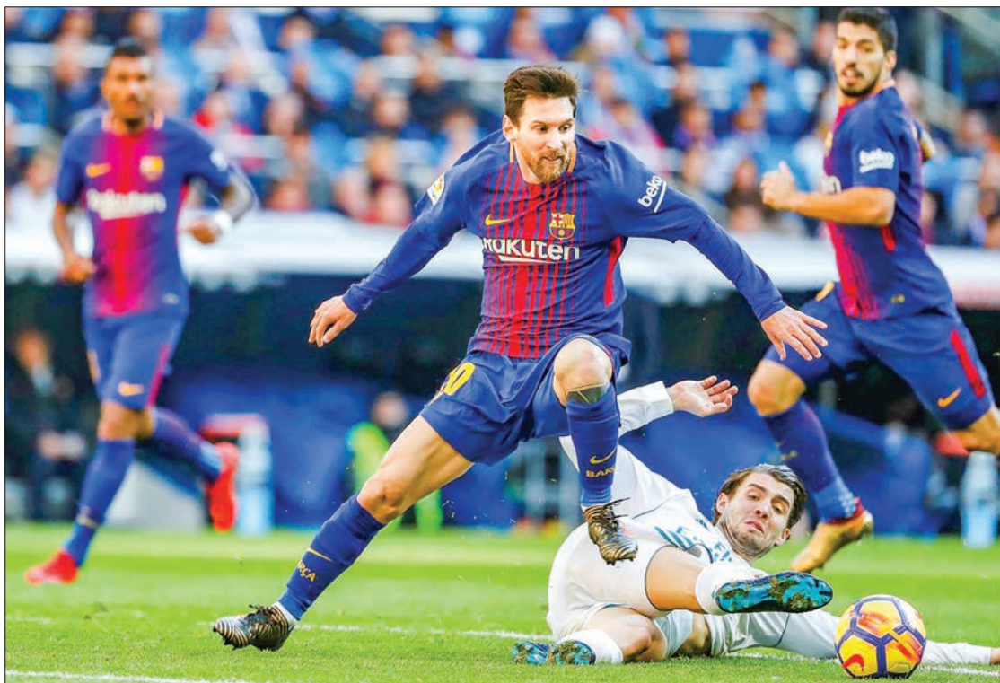
Barcelona's Lionel Messi in action as Real Madrid's Mateo Kovacic slides in at Santiago Bernabeu, Madrid, Spain, on 23 December 2017.

Real are 14 points adrift in fourth with a game in hand but their crushing defeat leaves their title hopes looking bleak, even though Barca's coach Ernesto Valverde said afterwards it was premature to write off the champions. After a tense