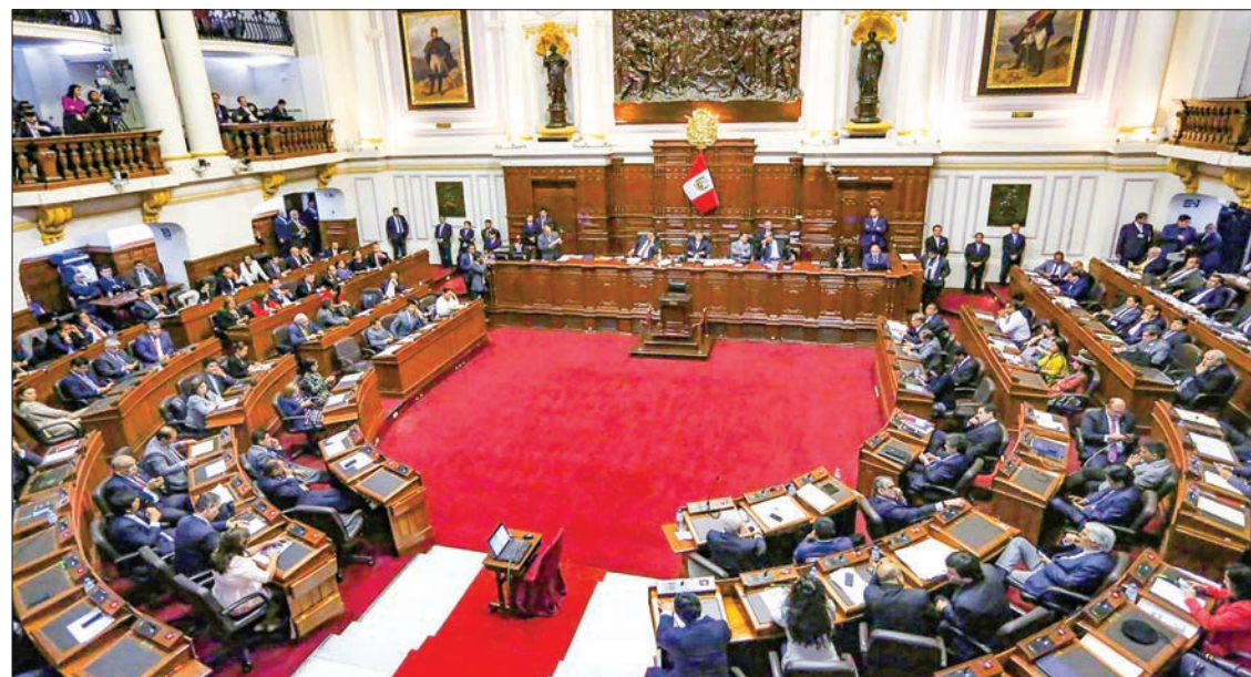
Lawmakers of Peru's opposition-ruled Congress decide whether to remove Peru's President Pedro Pablo Kuczynski from office in Lima, Peru, on 21 December 2017.

Negotiations to form a government in Catalonia are likely to open after 6 January following the holiday break. Parliament must vote by 8 February on putting a new government into place. —Reuters ■