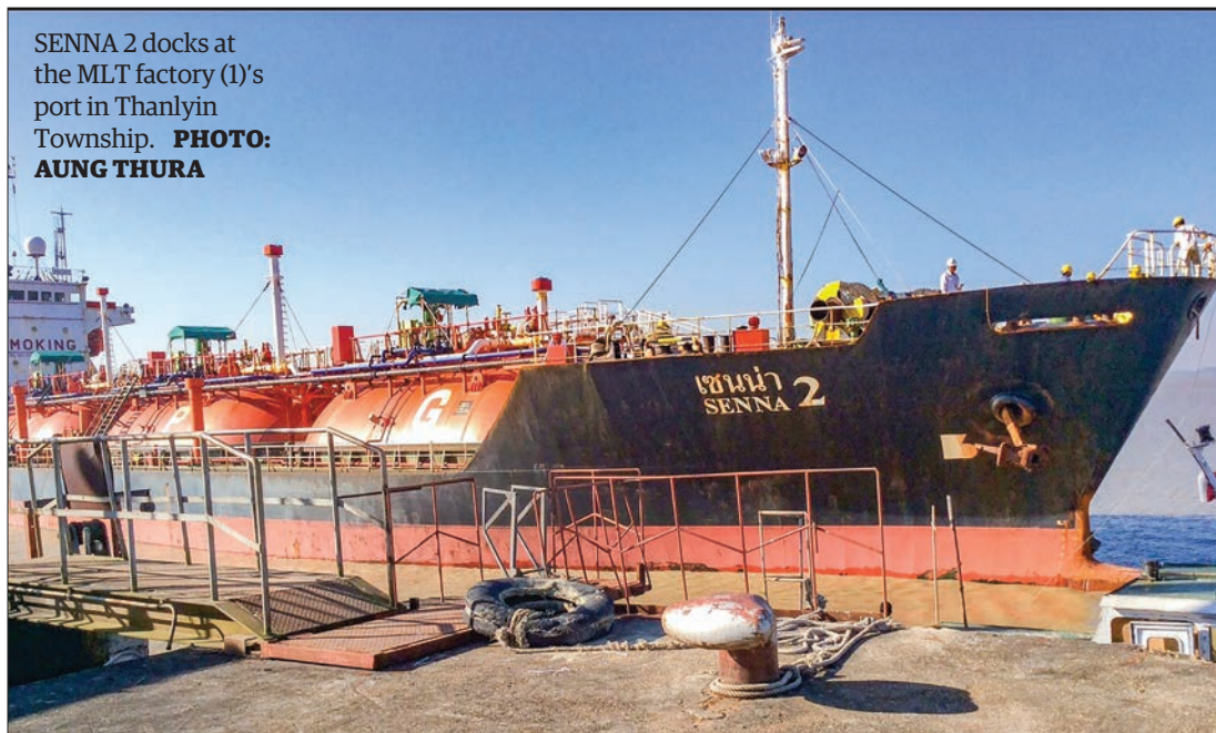
SENNNA 2 docks at the MLT factory (1)'s port in Thanlyin Township.