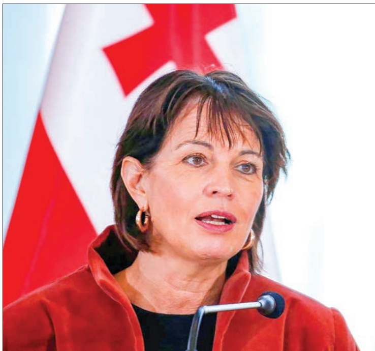
Switzerland's President Doris Leuthard speaks during a news conference in Tbilisi, Georgia, on 4 December 2017.