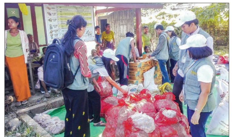
UEHRD render humanitarian assistance at villages in the northern sector of Maungdaw Township.

pura, cosmetics and carved figures, foods and beverages along with booths exhibiting for educating the public about food and drugs safety from Food and Drug Administration Department (FDA). The expo was concluded yesterday with Myanmar traditional dance and songs for entertainment.—Thiha Ko Ko (MDY)