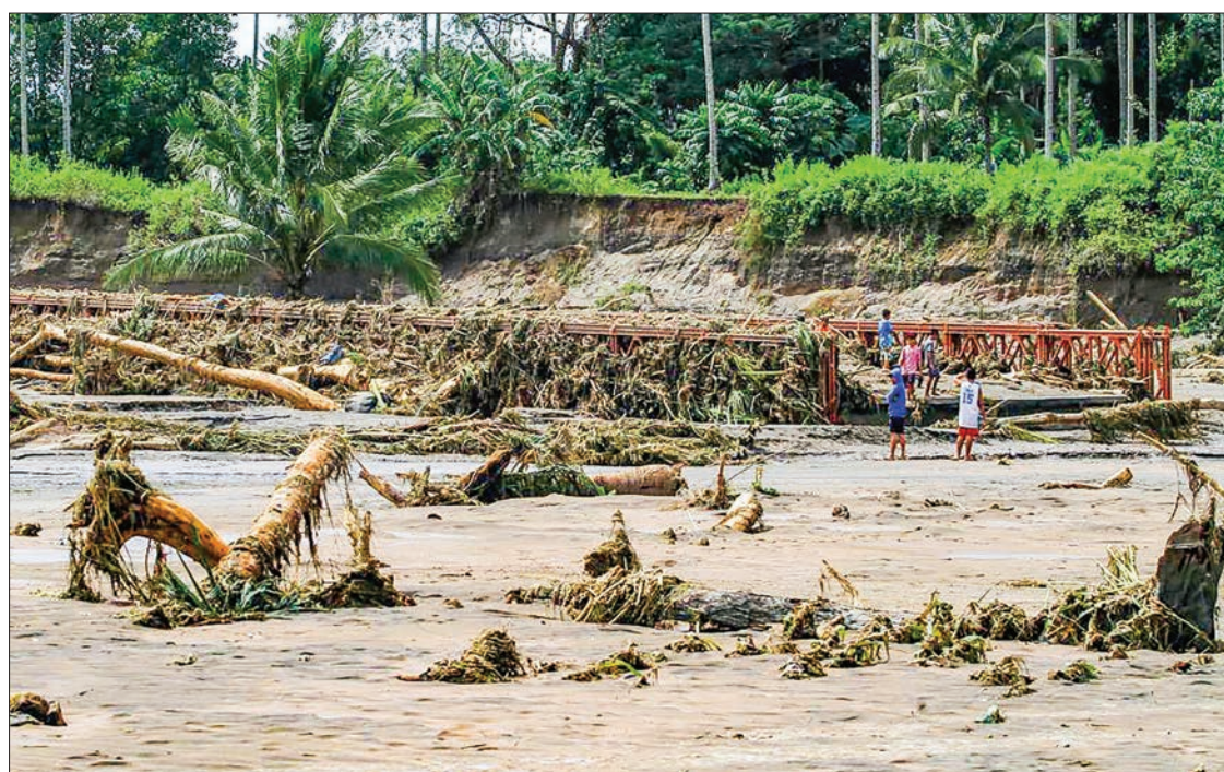
A general view of a destroyed bridge after flash floods in Salvador, Lanao del Norte in southern Philippines, on 23 December 2017.

Disaster officials said 159 people were listed as missing