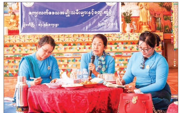
Chair of Myanmar Women's Affairs Federation (Central) Dr Thet Thet Zin and party explain rural women development program.

Whether they receive the invitation or not, MPs must inform at the Amyotha Hluttaw building I-19 not earlier than 13 January, not later than 14 January bringing together with them MP identity cards.— Myanmar News Agency ■