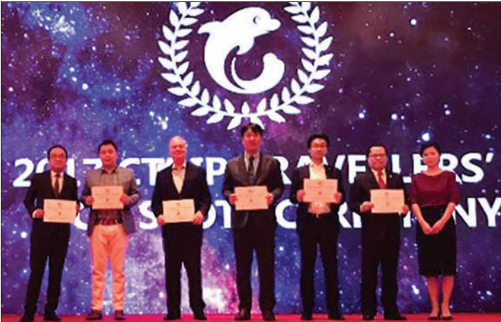
Sedona Hotel Yangon – Best Business Travel Hotel by Ctrip.

BAY INFERENCE: Weather is partly cloudy over the Andaman Sea and South Bay and a few clouds elsewhere over the Bay of Bengal. FORECAST VALID UNTIL MORNING OF THE 25th DECEMBER, 2017: Weather will be partly cloudy in Upper Sagaing and Taninthayi Regions, Kachin State and generally fair in the remaining Regions and States. STATE OF THE SEA: Seas will be moderate in Myanmar waters. Wave height will be about (4 - 7) feet off and along Myanmar Coasts. OUTLOOK FOR SUBSEQUENT TWO DAYS: Likelihood of scattered rain in Taninthayi Region, Kayin and Mon States. FORECAST FOR NAYPYITAW AND NEIGHBOURING AREA FOR 25th DECEMBER, 2017: Fair weather. FORECAST FOR YANGON AND NEIGHBOURING AREA FOR 25th DECEMBER, 2017: Fair weather. FORECAST FOR MANDALAY AND NEIGHBOURING AREA FOR 25th DECEMBER, 2017: Fair weather. EARTHQUAKENEWS A slight earthquake of magnitude(4.6) Richter Scale with its epicenter inside Myanmar (about (27) miles North-northeast of Mohnyin ) about (215) miles North of Mandalay seismological observatory was recorded at (03)hr (12)min (01) sec M.S.T on 24 th December, 2017.