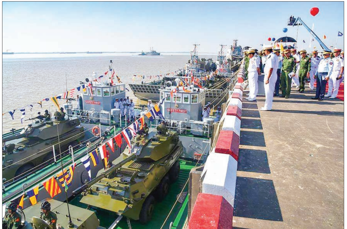
Senior General Min Aung Hlaing inspects a tank carrier landing craft.

Today's ceremony saw the commissioning of one offshore patrol boat, two tank carrier