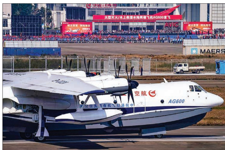
China's first home-grown large amphibious aircraft AG600 makes a smooth landing after its maiden flight in Zhuhai, south China's Guangdong Province, on 24 December 2017.

The 39.6-meter aircraft is powered by four domestically-built turboprop engines, according to its developer, the