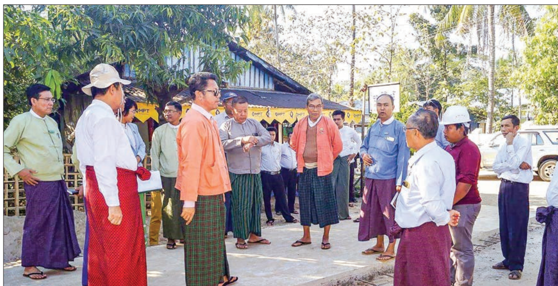
Rakhine State Chief Minister U Nyi Pu and officials discuss regional development for Manaung.

CHIEF Minister of Rakhine State U Nyi Pu and his cabinet yesterday met departmental personnel in Manaung and discussed regional development undertakings.