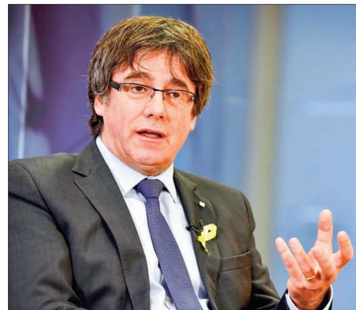
Former Catalan president Carles Puigdemont attends an interview with Reuters in Brussels, Belgium, on 23 December 2017.