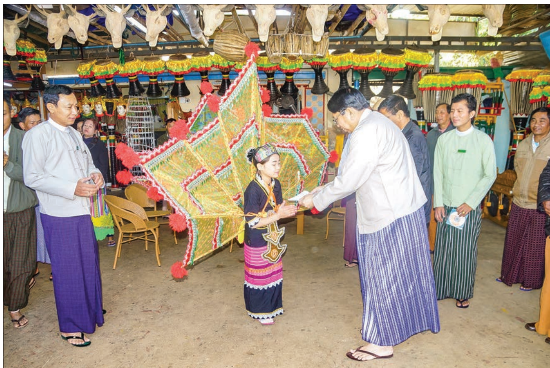
Union Minister Dr. Pe Myint gifts a young Shan girl wearing a Kinnari dress.