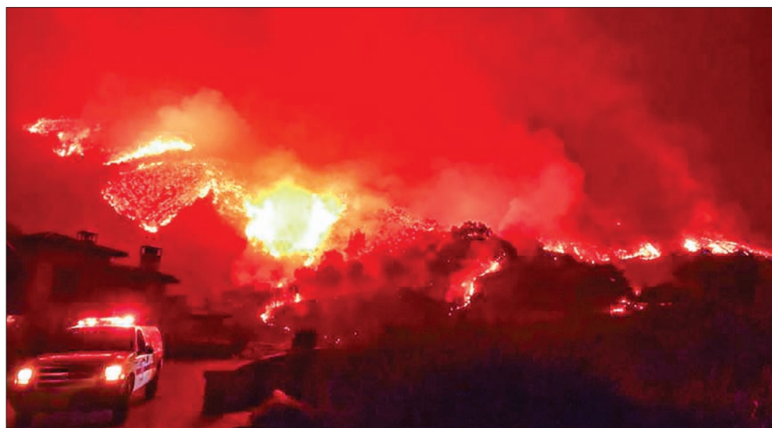
Thomas wildfire burns above Bella Vista Drive near Romero Canyon in this social media photo by Santa Barbara County Fire Department in Montecito, California, US on 12 December, 2017.

The Thomas fire was initially stoked by hot, dry Santa Ana winds blowing with rare hurricane force from the eastern desert, spreading flames across miles of rugged coastal terrain faster than firefighters could keep up. —Reuters ■