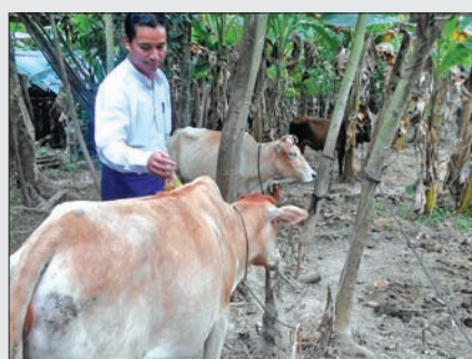
Veterinarian vaccinates cattle in Buthidaung.