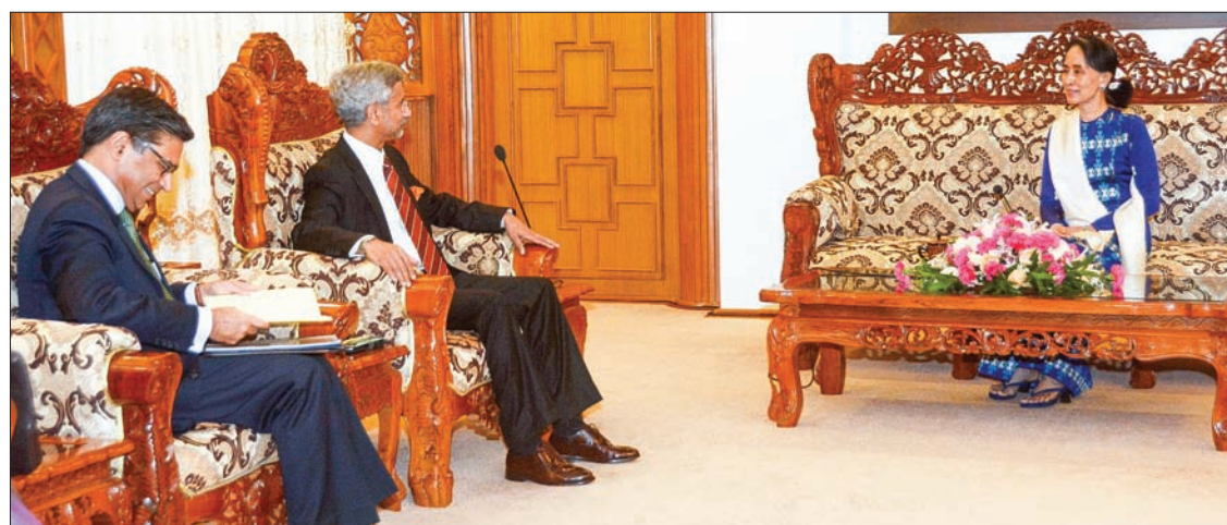
State Counsellor Daw Aung San Suu Kyi meets Dr. S. Jaishankar, Foreign Secretary, Ministry of External Affairs at the Ministry of Foreign Affairs yesterday.

STATE Counsellor and Union Minister for Foreign Affairs Daw Aung San Suu Kyi received a delegation led by H.E. Dr. S. Jaishankar, Foreign Secretary, Ministry of External