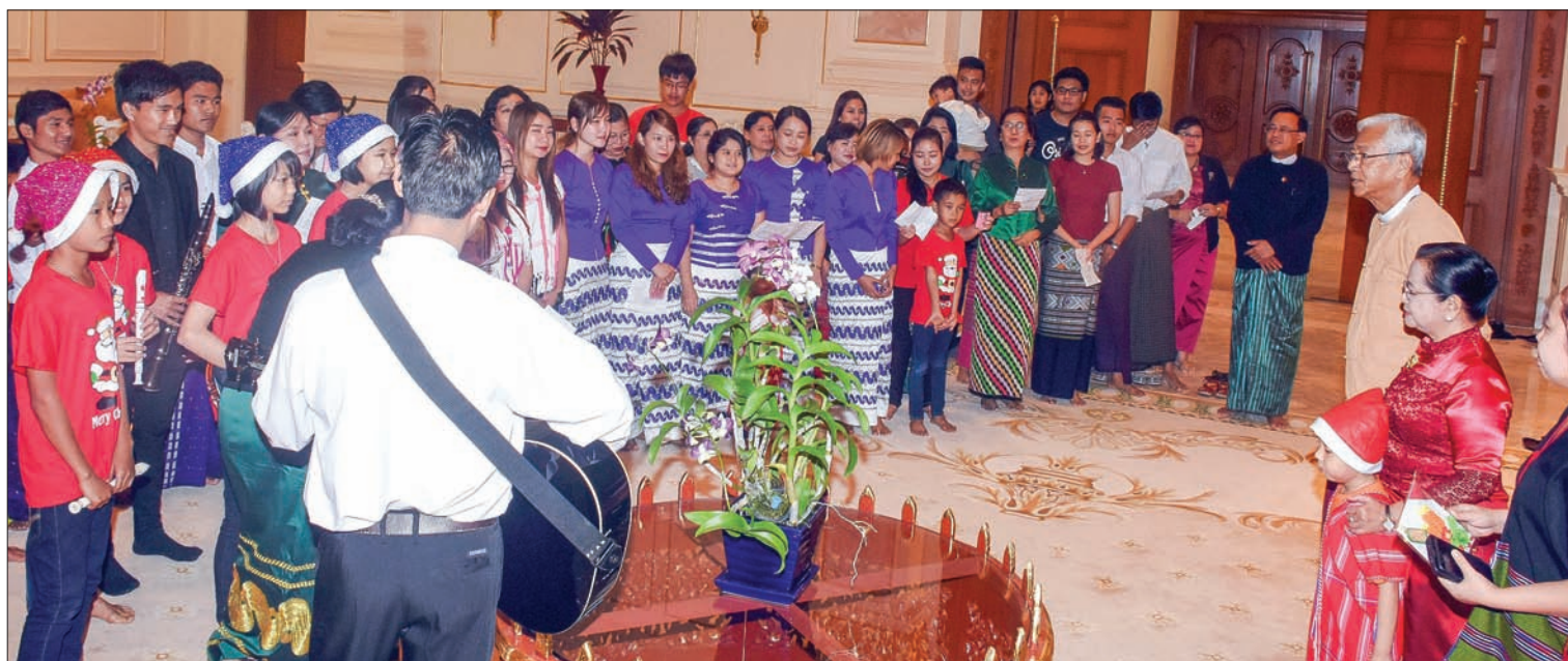
Pre-Christmas and prayers singing Christmas songs for President U Htin Kyaw, First Lady Daw Su Su Lwin and family at the Presidential Palace in Nay Pyi Taw yesterday.