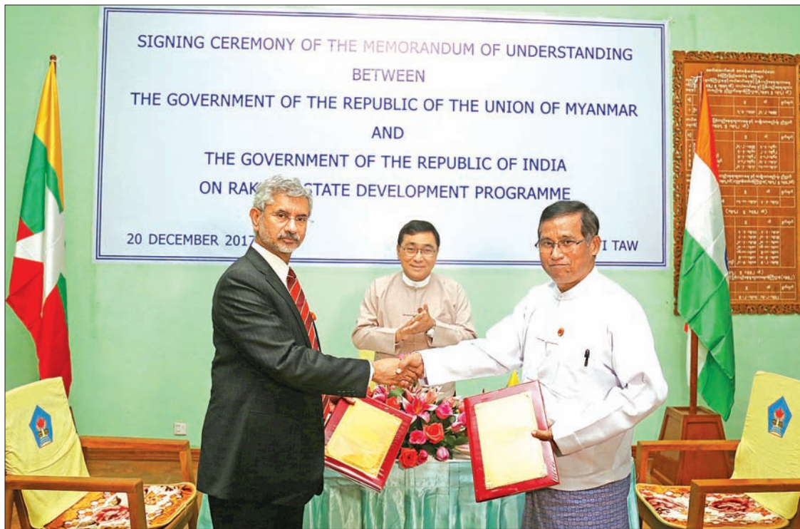
Deputy Minister for Social Welfare, Relief and Resettlement U Soe Aung shakes hands with Foreign Secretary Dr. S. Jaishankar after signing the MoU between Myanmar and India yesterday.

AN agreement was reached yesterday in which the government of India will provide US$25 million (Ks34.1 billion) to Myanmar for the development of Rakhine State.