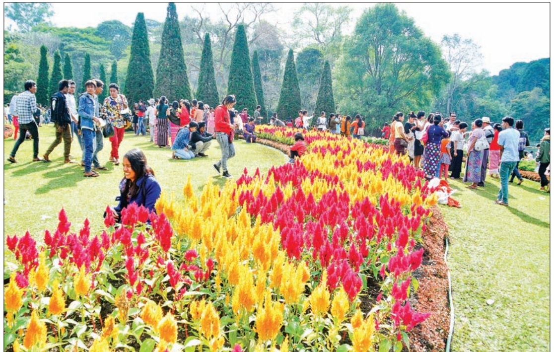
People are sightseeing around the site at the flower festival of Pyin Oo Lwin, also known as the city of flower.

About 200,000 flowers of differing colours from 48 different types of flowers will be displayed. The entry is Ks500 for children and Ks1,000 for adults. About 10,000 visitors are expected to visit daily. Due to recent rain, there were some difficulties in planting the flow-