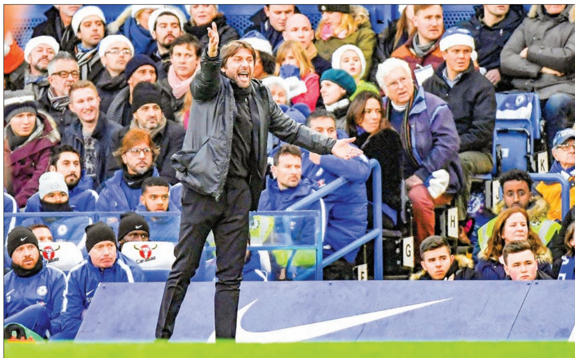
Chelsea manager Antonio Conte.

"I wish Christensen to have the same career as John. I think