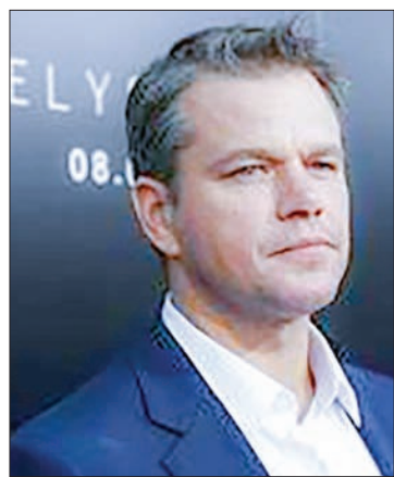
Actor-producer Matt Damon.

LOS ANGELES — Actor-producer Matt Damon has said amid the climate of sexual misconduct allegations in Hollywood people should also talk enough about all the men in the entertainment industry who are not sexual predators.