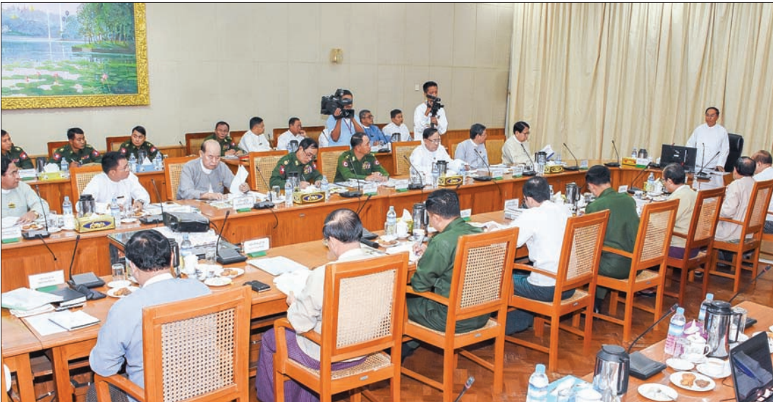
VP U Myint Swe delivers the speech at the meeting of the 70 th Anniversary of Independence Day Convening Central Committee .

“Today’s meeting is the 3 rd coordination meeting of the 70 th anniversary of Independence Day convening central committee for successful convention of the Independence Day ceremony. With a view to successfully hold the Independence Day Ceremony, in accord with 5 national objectives, the 70th anniversary of Independence Day convening central committee comprising 36 members including myself, was formed on 29 th September 2017, under notification 72/2017. The 1 st coordination meeting held on 13th October 2017 laid down 12 decisions, for implementation of which 9 sub-committees