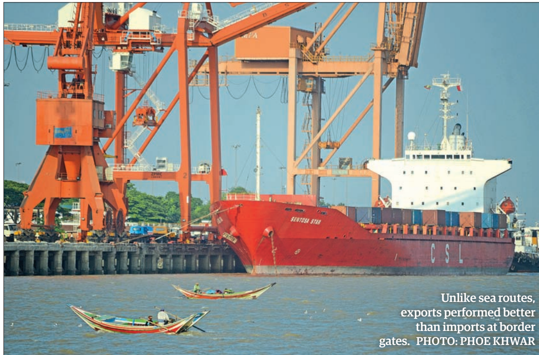
Unlike sea routes, exports performed better than imports at border gates.

trade is flowing in and out of Muse, Lweje, Chinshwehaw, Kanpiketee and Keng Tung gates.