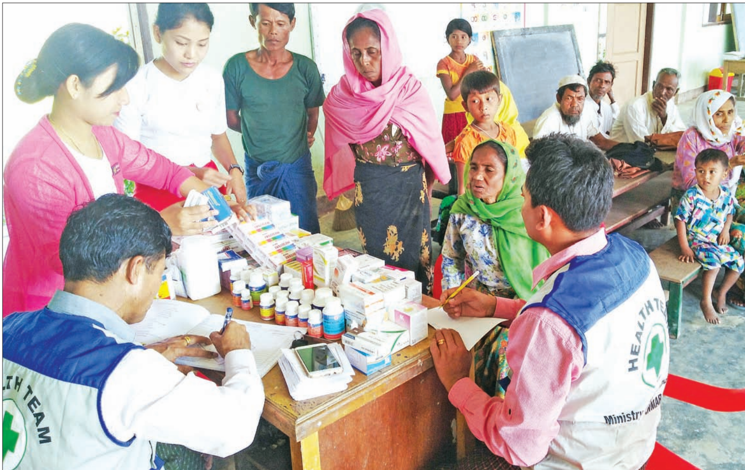
A mobile medical team provides health care services to Muslim families in Buthidaung, Rakhine State.