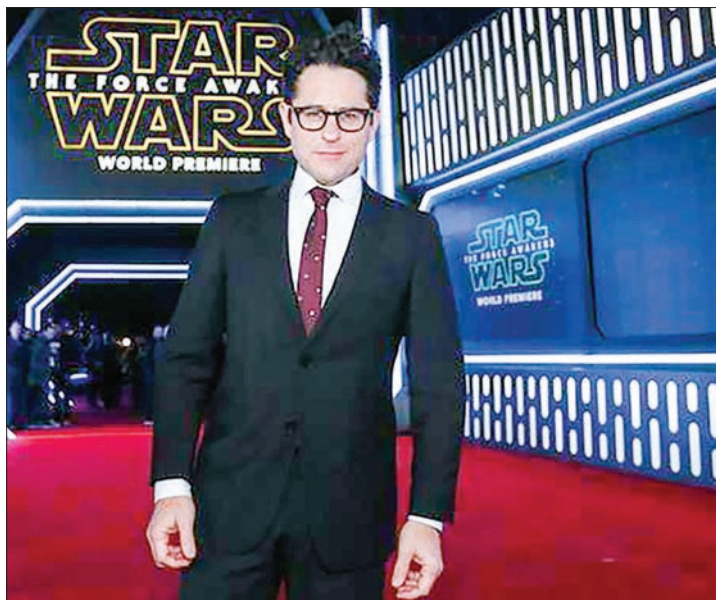
Filmmaker JJ Abrams.

Past recipients of the Athena Leading Man Award have included filmmaker Paul Feig in 2016, and actor David Oyelowo in 2017. The 2018 Athena Film Festival will take place from February 22 to 25 at Barnard College in New York City.—PTI ■