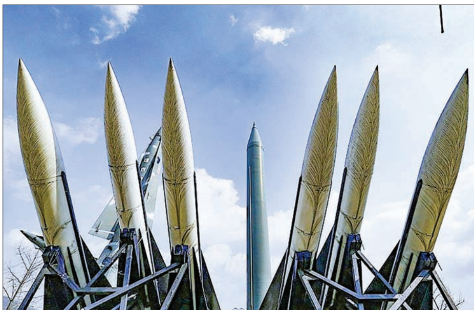
On Tuesday, Japan's government made a decision to expand the country's missile defence shield with the US-made Aegis Ashore missile defence systems.

On Tuesday, Japan's government made a decision to expand the country's missile defence shield with the US-made Aegis Ashore missile defence systems, which are supposed to help ensure the country's security from possible ballistic and cruise missile attacks.