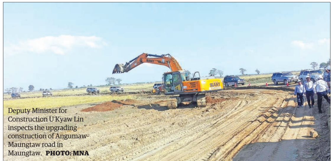
Deputy Minister for Construction U Kyaw Lin inspects the upgrading construction of Angumaw-Maungta road in Maungta.

THE upgrading of Angumaw-Maungta Road, an important thoroughfare for the development of the Maungta region in Rakhine State, will be completed in May, said an official from Asia World Company.