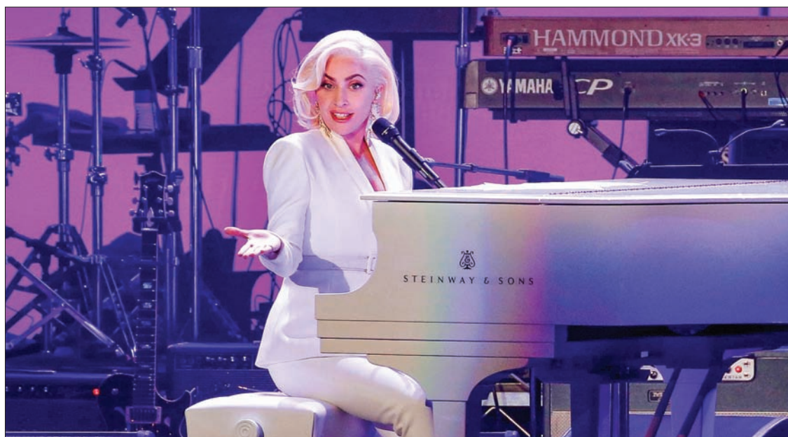
Lady Gaga performs for the five former US presidents, Jimmy Carter, George HW Bush, Bill Clinton, George W Bush, and Barack Obama during a concert at Texas A&M University benefiting hurricane relief efforts in College Station, Texas, US on 21 October, 2017.

In February, she kicked off her the halftime show at the annual Super Bowl by singing "God Bless America," from the top of Houston's NRG Stadium. But in September, the "Bad Romance" singer postponed until early 2018 the European leg of her "Joanne"