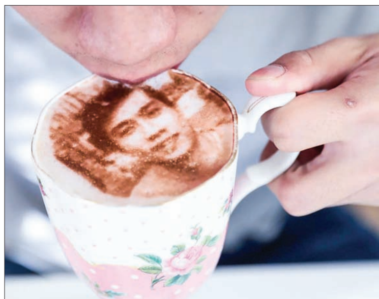
A customer drinks a 'Selfieccino' coffee at the Tea Terrace in London, Britain on 19 December, 2017.