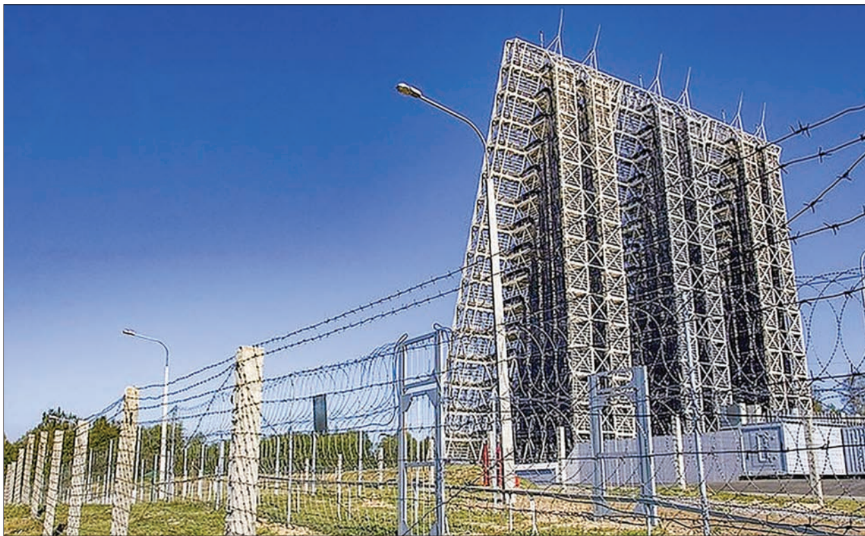
Voronezh-type radar.

The new radars were deployed in Siberia’s Krasnoyarsk and Altai regions and the Orenburg Region in southern Urals. This brings the overall number of Voronezh radars on duty to seven. Until recently, four new Voronezh radars were in operation: near Russia’s second largest