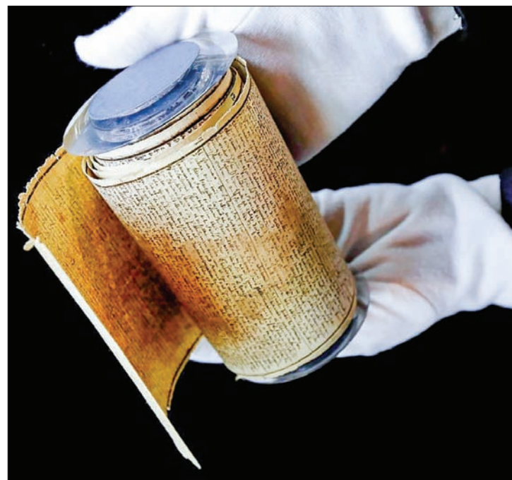
An employee displays the Marquis de Sade's original rolled manuscript called Le Rouleau de la Bastille of "Les 120 jours de Sodome ou l'école du libertinage" (The 120 Days of Sodom, or the School of Libertinage, 1785) before its auction at the Hotel Drouot auction house in Paris, France on 23 November, 2017.

Other items in the collection include original manuscripts by 'The Three Musketeers' author Alexandre Dumas and operatic scores drafted by Richard Strauss, and have drawn interest from Chinese buyers and European institutions, the auctioneers said.