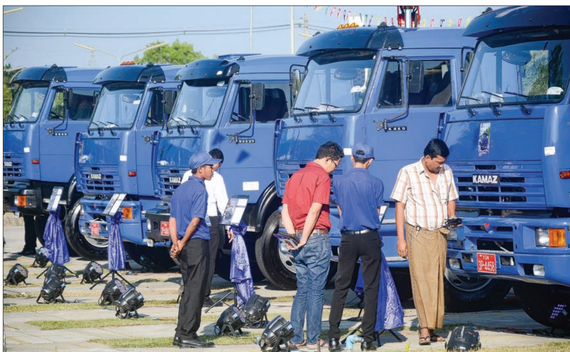
Visitors check the Russian KAMAZ trucks at the market launch in Yangon.

By early October 2017, the KAMAZ automobile plant had built more than 2 million 230 thousand finished trucks since the production launch in 1976. —GNLM ■