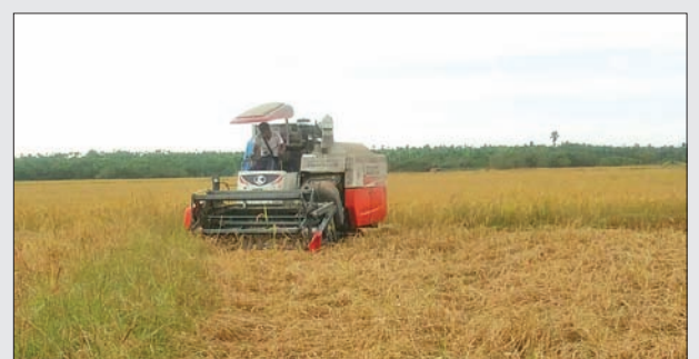
The harvester is seen in paddy field in Maungta.