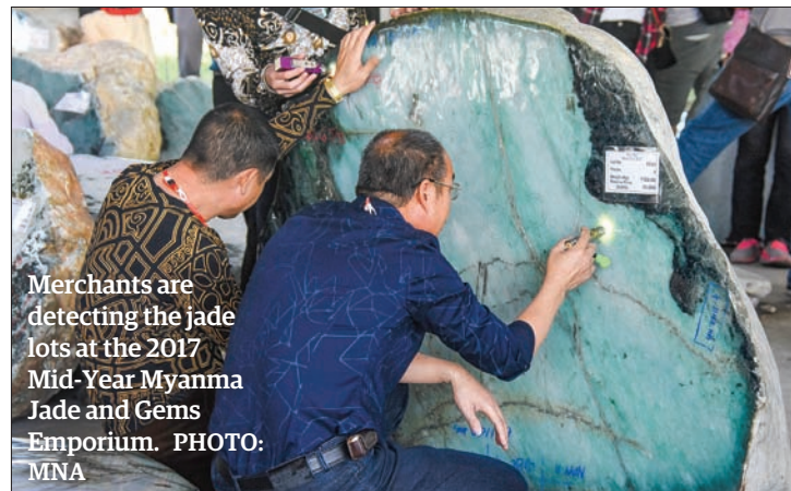
Merchants are detecting the jade lots at the 2017 Mid-Year Myanmar Jade and Gems Emporium.

UNION Minister for Natural Resources and Environmental Conservation U Ohn Win toured the 2017 Mid-Year Myanmar Jade and Gems Emporium at Mani Yadana Jade Hall in Nay Pyi Taw yesterday morning, the ninth day of the country's largest gems show.