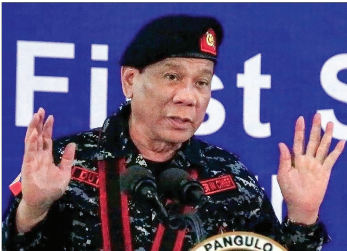
Philippine President Rodrigo Duterte.

Duterte restarted a stalled peace process and freed several