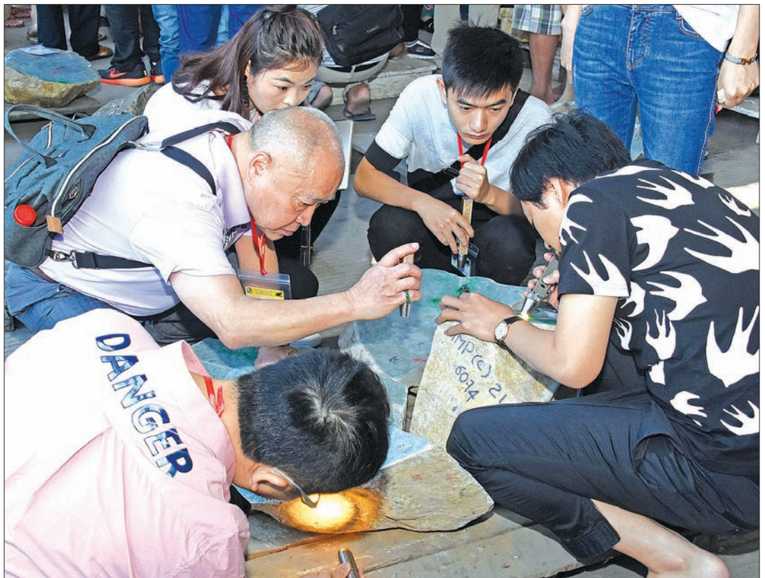
Merchants appraise a jade stone at the 2017 Mid-Year Myanmar Jade and Gems Emporium.

During the 2017 Mid-Year Myanmar Jade and Gems Emporium, 190 gem lots will be sold under an open tender system on 15 December. The schedule for the sales of lots includes 16 December jade lot no. 1 to 1150, on 17 December jade lot no. 1151 to 2300, on 18 December jade lot no. 2301 to 3450, on 19 December jade lot no. 3451 to 4600, on 20