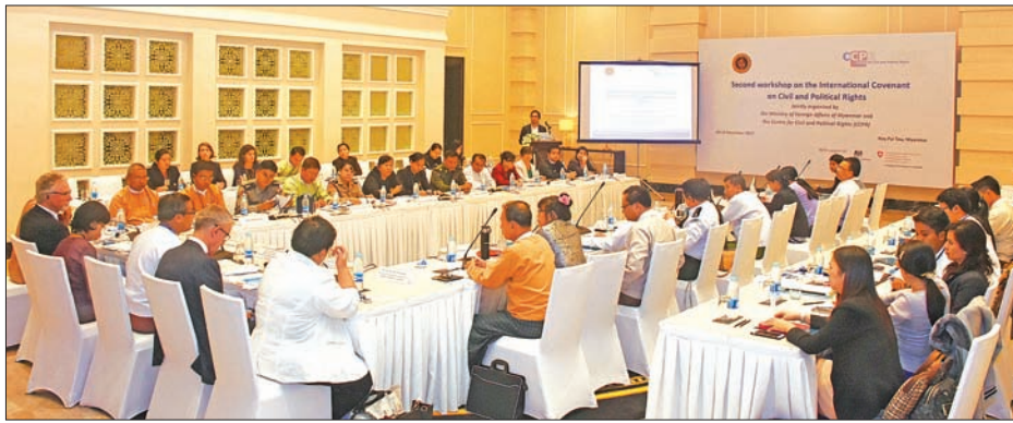
The second workshop on the International Covenant on Civil and Political Rights held in Nay Pyi Taw.

A total of fifty participants including the members of Pyithu Hluttaw and Amyotha Hluttaw officials from the Ministry of Foreign Affairs, the Ministry of Home Affairs, the Ministry of Defence, the Ministry