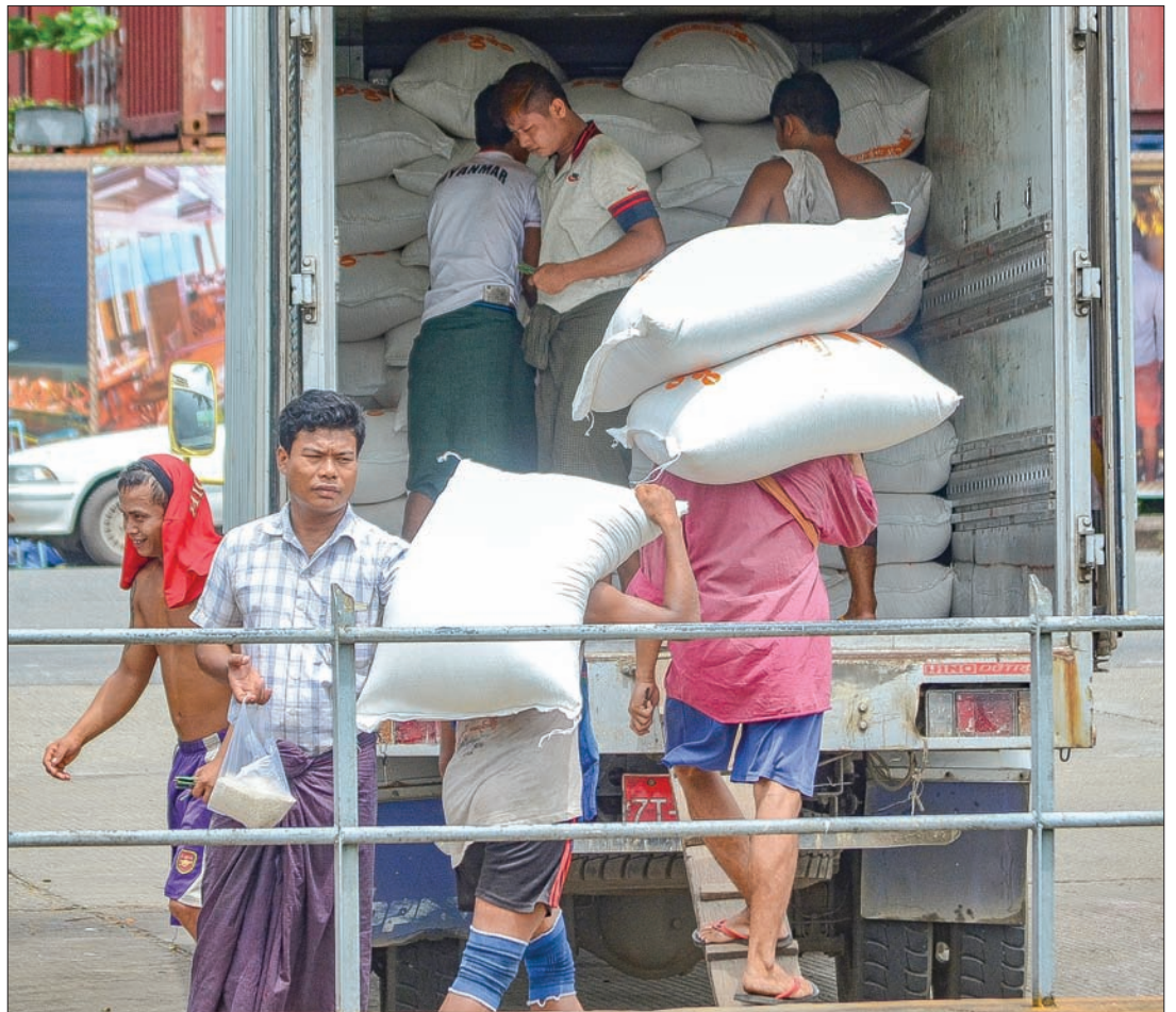
Workers load sacks of rice to a truck in Yangon.

Kyat depreciation results in high prices for imports, such as consumer products and raw industrial goods.—Htet Myat ■