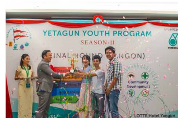
YETAGUN YOUTH PROGRAM SEASON-II CHAMPION TEAM

The Yetagun Youth Program Season-2 proudly announced 'Yangon Binarhaus' team from Myanmar Maritime University for their proposed project 'Maker Space and Underwater Research Lab' as champion team for Yangon Region. Winning teams were awarded by Country Chairman, PETRONAS Myanmar Operations and Myanmar Oil and Gas Enterprise (MOGE) officials.