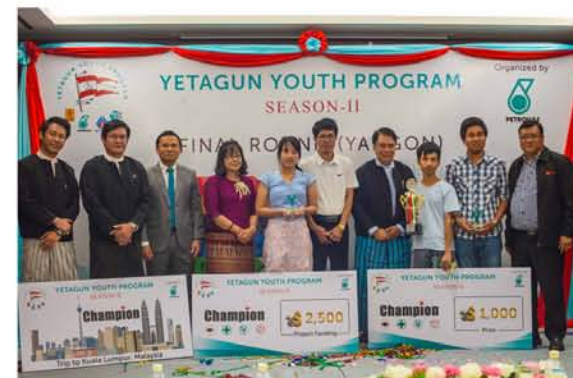
YETAGUN YOUTH PROGRAM SEASON-II CHAMPION TEAM WITH JUDGES, PETRONAS TEAM & MOGE OFFICIALS