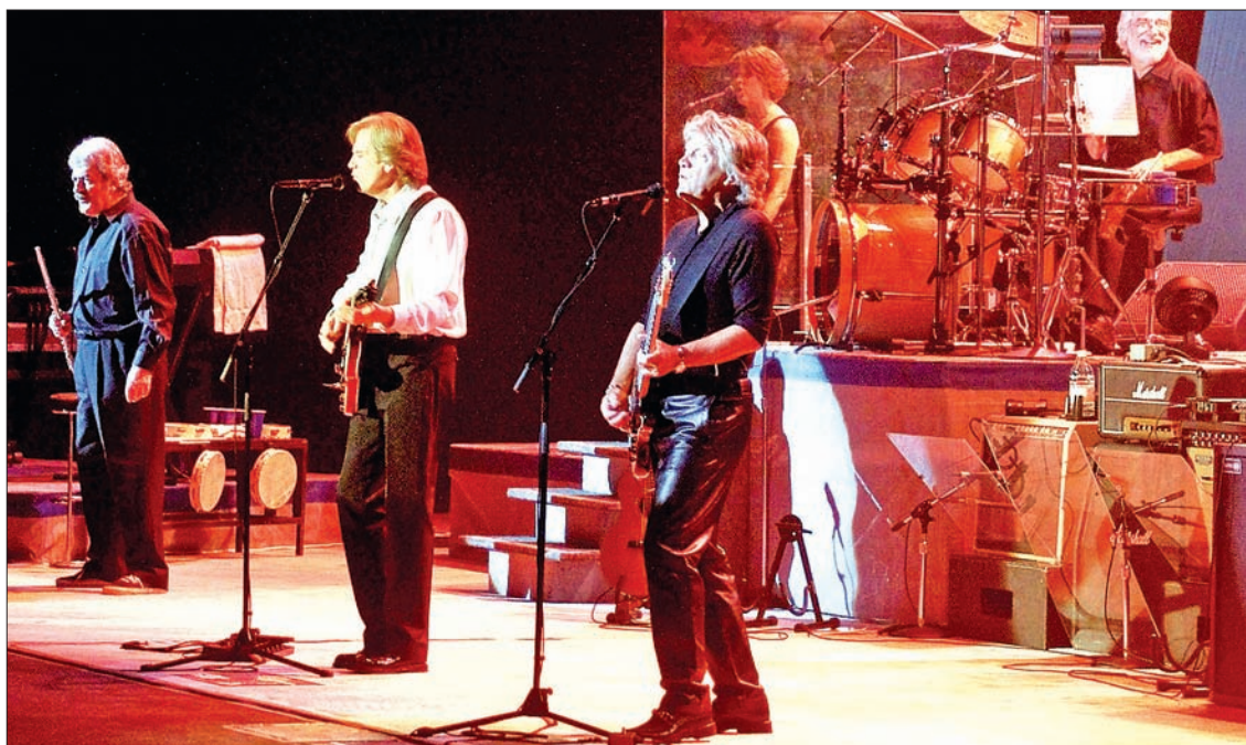
Legendary British rock group “The Moody Blues,” L-R, Ray Thomas, Justin Hayward, John Lodge and Graeme Edge, performs during the first of four shows at Le Theatre des Arts at the Paris Las Vegas hotel-casino in Las Vegas, Nevada, US on 5 April 2001.

After several changes of lineup, the band is due to embark in