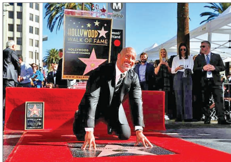
Actor Dwayne Johnson poses on his star after it was unveiled on the Hollywood Walk of Fame in Los Angeles, California, US, on 13 December, 2017.

1988. The band reunited in 2010, releasing the album “Move Like This,” and toured in the United States in 2011.—Reuters ■