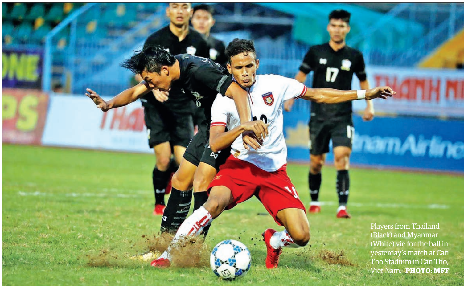
Players from Thailand (Black) and Myanmar (White) vie for the ball in yesterday's match at Can Tho Stadium in Can Tho, Viet Nam.