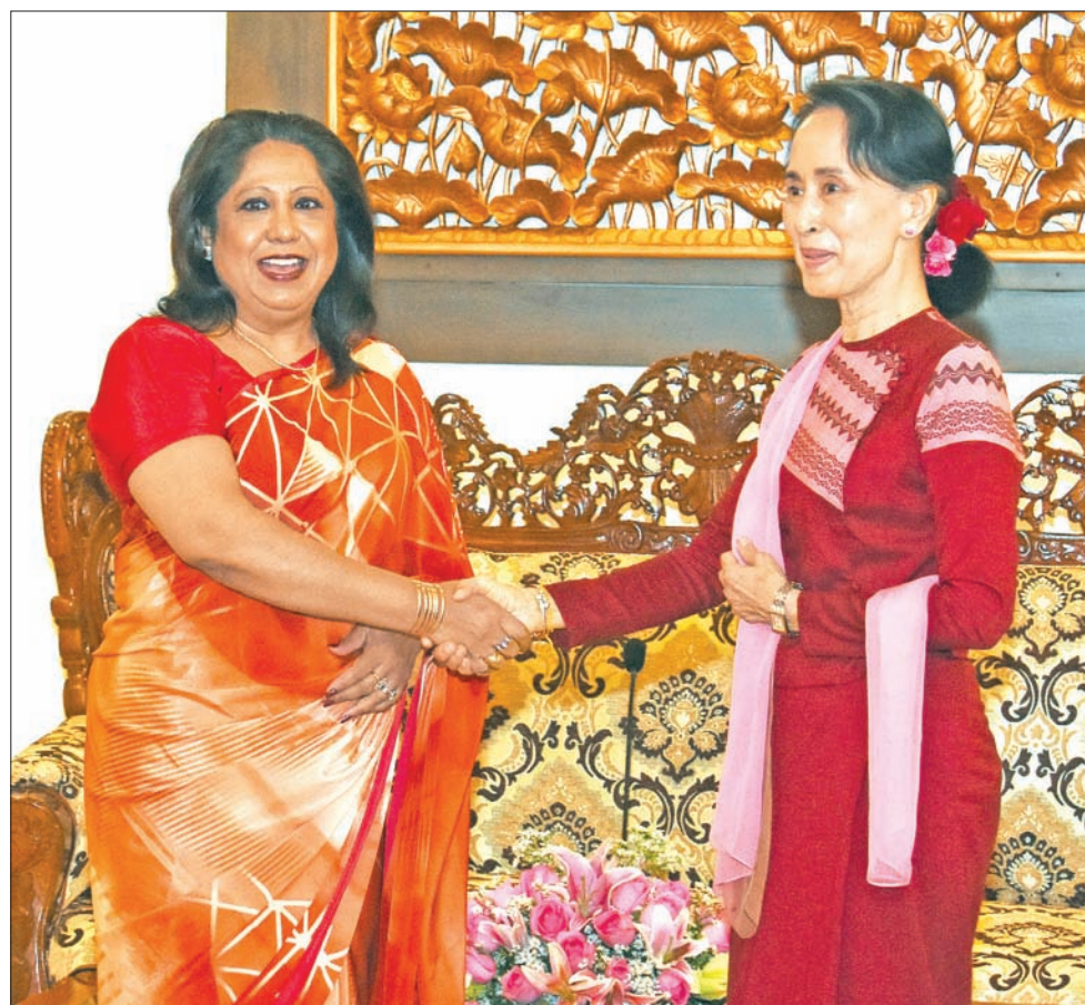
State Counsellor Daw Aung San Suu Kyi welcomes Ms. Pramila Patten, UNSG's representative, in Nay Pyi Taw.

During the meeting, they discussed matters pertaining to the possible technical assistance and cooperation extended by the United Nations to Myanmar in promoting and protecting of women rights.— Myanmar News Agency ■