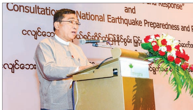
Union Minister Dr. Win Myat Aye delivers his speech.