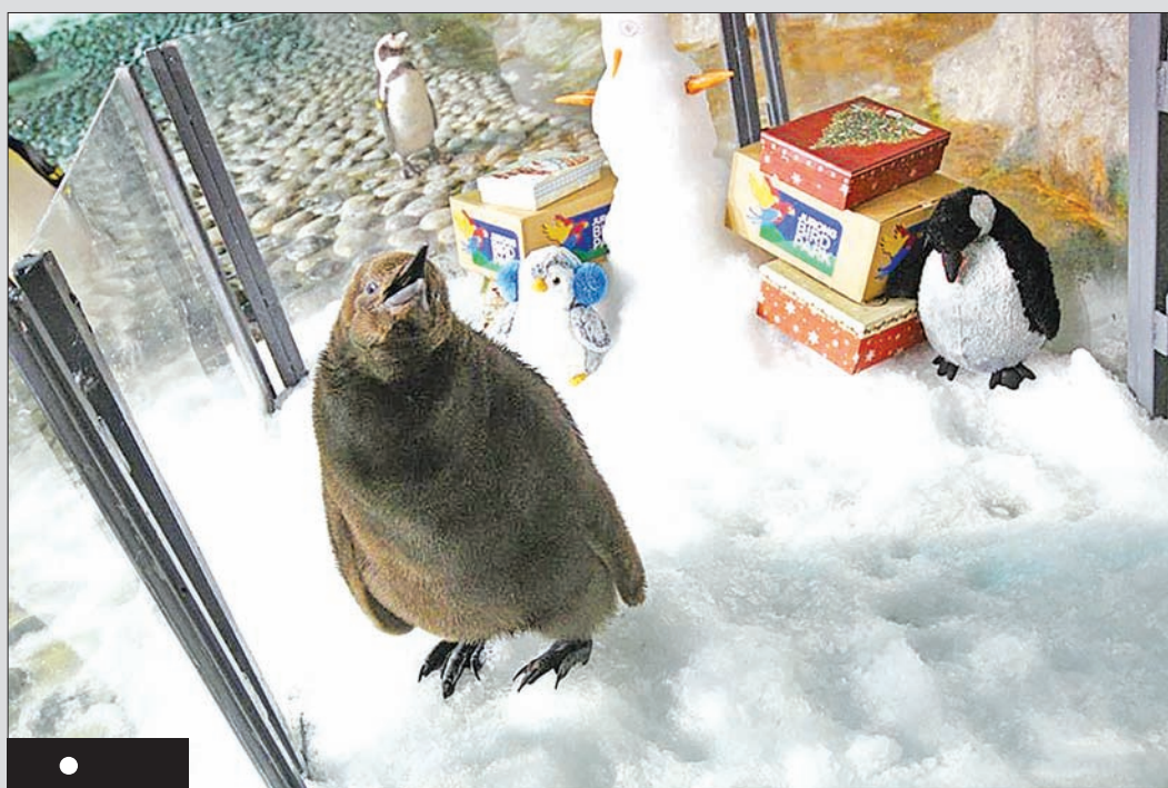
Two-month-old King Penguin chick Maru is seen at the Jurong Bird Park in Singapore, on 13 December 2017. Maru is the first newborn King Penguin at the park in almost 10 years.