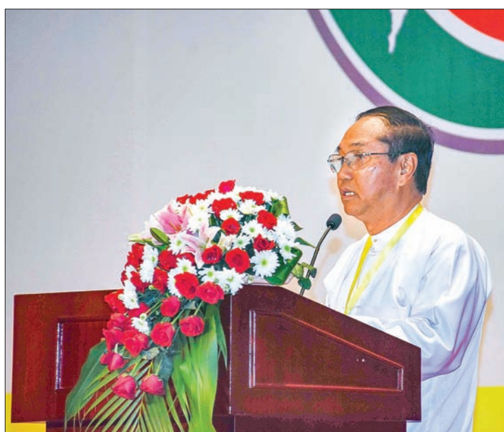
Vice President U Myint Swe addresses the ceremony to mark the completion of the nationwide population and household census yesterday.

The 2014 census was a valuable investment for Myanmar and international organisations,