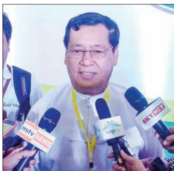
U Thein Swe .

Statistics on ethnics had been compiled, but it still needs to be negotiated. It is necessary to explain to ethnics to be well convinced of it. For the time being, it cannot be publicised as there are still to be done. We tried our best to publicise as soon as possible. Concerning carrying out the tasks of publicising designation, it needs not to disagree with each other. For unnecessary consequences not to happen, all are scrutinising with great care. We are making arrangements for the nationals to be able to accept in unity. It is not sure yet as to