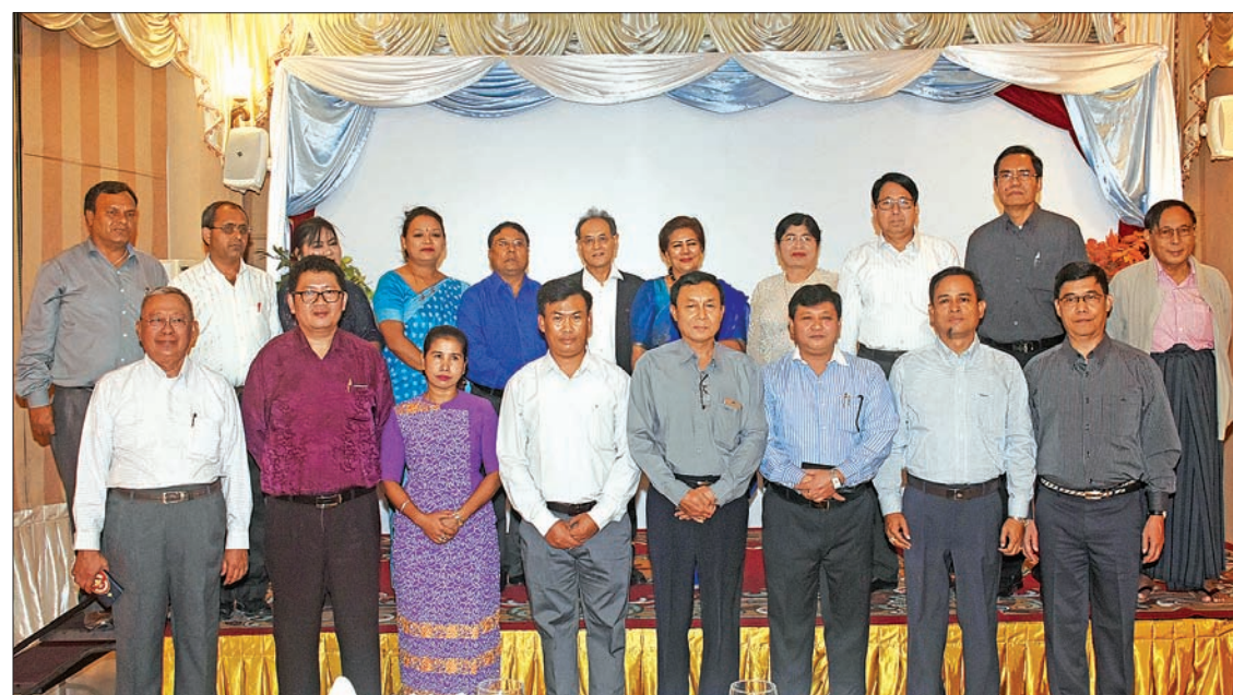
Union Minister Dr Pe Myint and the chairperson of the Press Council of the Federal Democratic Republic of Nepal Mr Kishor Shrestha and party pose for the photo in Nay Pyi Taw.