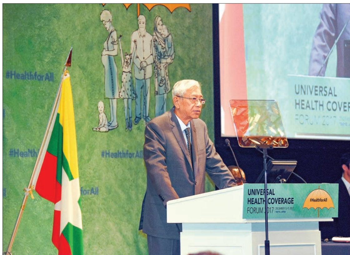
President U Htin Kyaw delivers the speech at the Universal Health Coverage (UHC) Forum in Tokyo yesterday Tokyo, Japan.

Underlying the critical role of health sector in our nation-building efforts, key