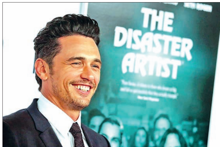
Director and star James Franco arrives for the gala presentation of “The Disaster Artist” at the AFI Film Festival in Los Angeles, California, US, on 12 November 2017.

British World War II movie “Dunkirk”, which had been seen as a big player at the Oscars, was also ignored by SAG voters. Instead, the best actor lineup recognized relative newcomers like Timothee Chalamet, 21, for gay romance “Call Me By Your Name,” and Daniel Kaluuya for “Get Out.” They will compete with James Franco for comedy “The Disaster Artist”, Gary Oldman for his role as British wartime leader Winston Churchill in “Darkest Hour,” and Denzel Washington for “Roman J. Israel, Esq.” —Reuters ■