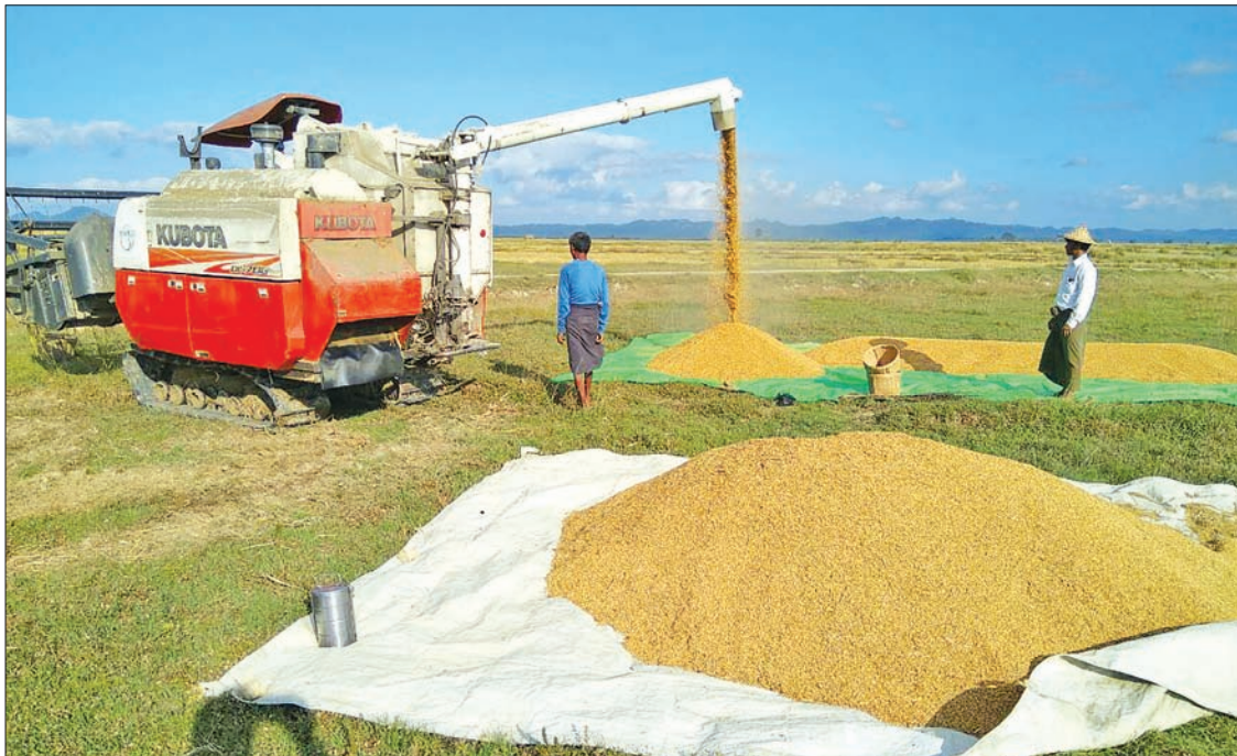
Rice fields are being harvested by Myanmar Rice Federation in Maungtaw, Buthidaung and Yathedaung.