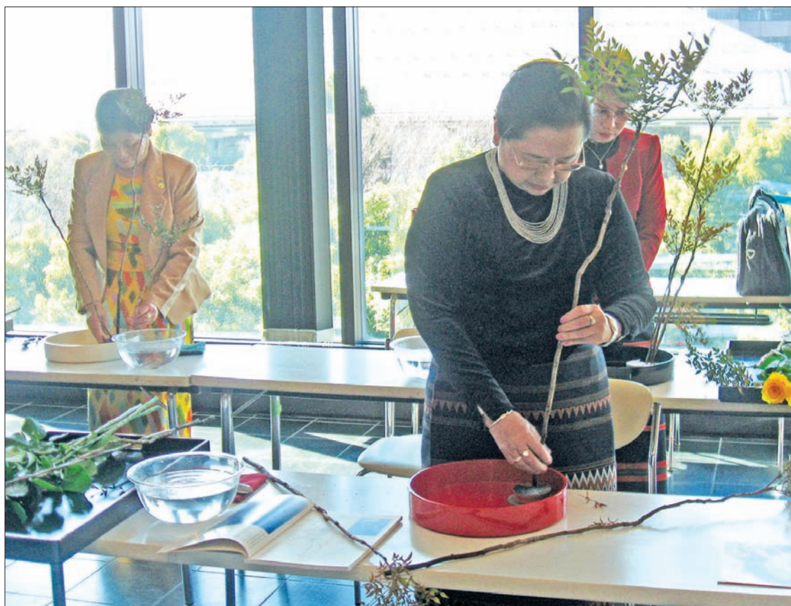
First Lady Daw Su Su Lwin visits Sogetsu Kaikan Flower Arrangement School in Tokyo, Japan.