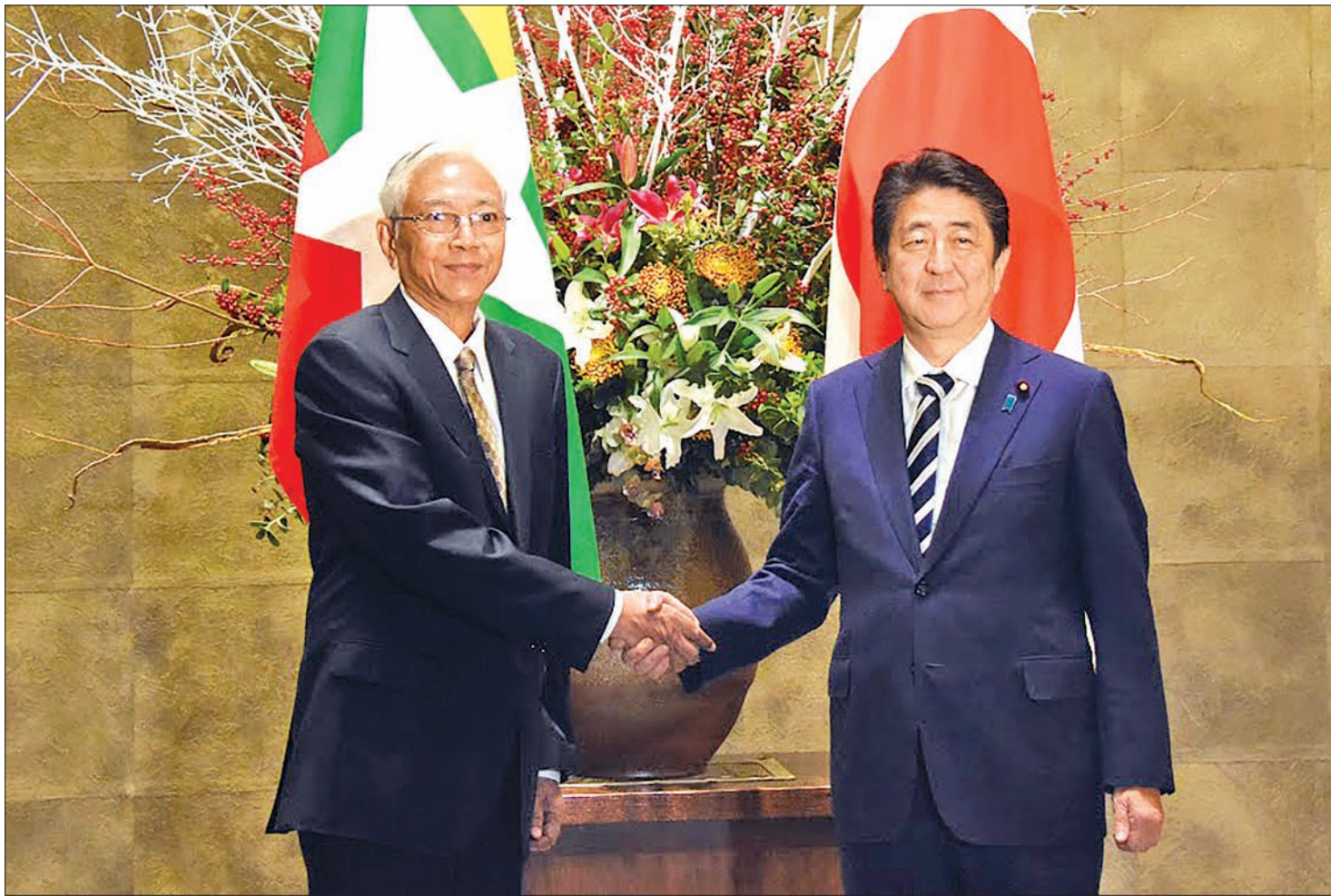
President U Htin Kyaw (L), is welcomed by Japanese Prime Minister Shinzo Abe at the prime minister's office in Tokyo yesterday.