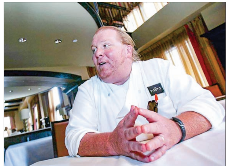
Celebrity chef Mario Batali talks during an interview with Reuters at his latest restaurant, Del Posto, in New York, US on 11 April, 2006.

The EXO was scheduled to release its special winter album on 21 December.—Xinhua ■