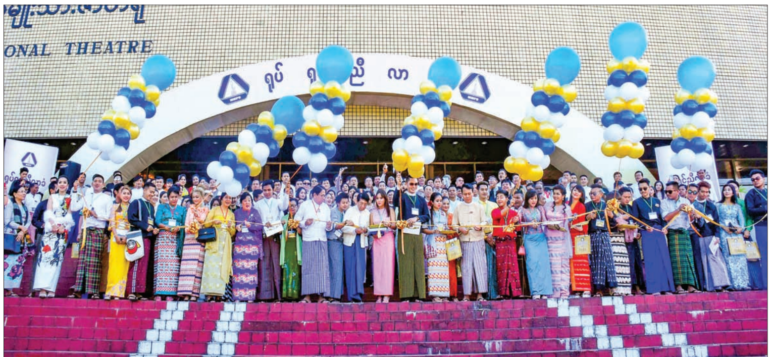
Union Minister Dr Pe Myint, Chief Minister U Phyo Min Thein and officials cut ribbon to open ceremony of film conference in Yangon.

At the opening ceremony, Dr Pe Myint addressed the audience, noting, "We were very pleased that the Myanmar Film Asiayone held the film conference, which had not been held for many years, and we hope today's conference will produce good ideas and suggestions for the development of the film world. Cinematography is a kind of art which can develop people's minds in different ways. Being an art of great strength which can strike the hearts of people, its effect over audiences is extremely large. In the message sent by State Counsellor, Daw Aung San Suu Kyi to the ceremony for presenting Myanmar Academy Awards 2016, held on March 18, 2017, it was said that those persons from the film world have a great responsibility, because films greatly influence human society, especially youths. It was also found that in the mes-