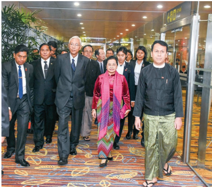
President U Htin Kyaw and wife Daw Su Su Lwin are seen at Yangon International Airport as they depart for Japan.

The President and wife will be accompanied at the forum by Union Minister for Health and Sports Dr. Myint Htwe. —Myanmar News Agency ■