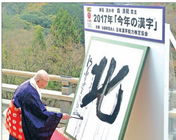
Seihan Mori, chief Buddhist priest of Kiyomizu Temple in Japan's ancient city of Kyoto, writes the kanji character "kita" meaning north with a calligraphy brush on 12 December, 2017. The character was selected as the single best kanji to symbolize the national mood for the year, referencing North Korea's missile launches among other things.