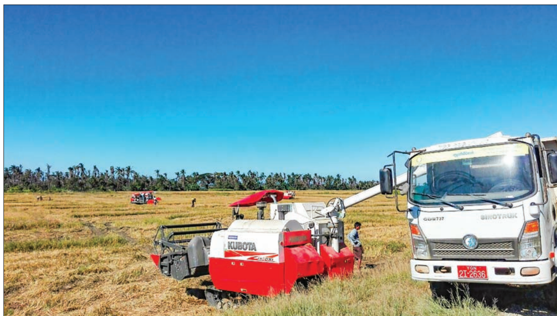
Workers harvest rice in Maungtaw with the use of harvestors.

Also, 112 schools in Maungtaw region will soon be opened, though 48 schools remain closed.—Myanmar News Agency ■