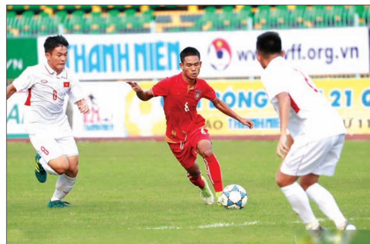
Myanmar footballer (red) in action with Viet Nam players (white) at Can Tho Stadium, Viet Nam on 12 December.