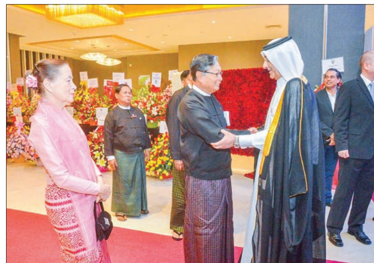
Union Minister for the Office of the State Counsellor U Kyaw Tint Swe and wife are welcomed by Qatar Ambassador Mr. Hassan Bin Mohamed Rafel Al Emadi.

Also present were Union Minister for International Cooperation U Kyaw Tin, Yangon Region Chief Minister U Phyo Min Thein and invited guests.—Myanmar News Agency ■