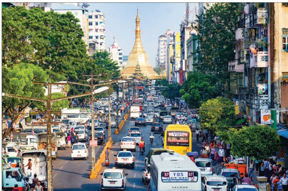
Experts conducted measurements of air pollution in nine locations in six townships of Yangon Region. Kyimyindine has the highest level of air pollution among the townships.