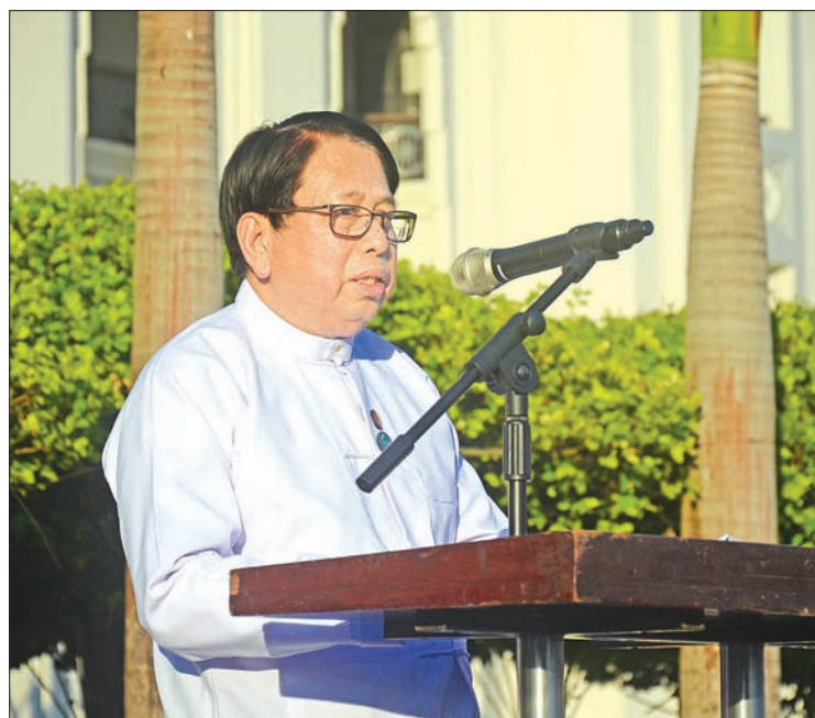
Union Minister Dr Pe Myint delivers the speech at Literary Conference 2017 opening ceremony in Yangon.

The Union Minister pointed out the theme "Free voice, Free Literature," and remarked that the Literary Conference was attended by people from the literary community individually,