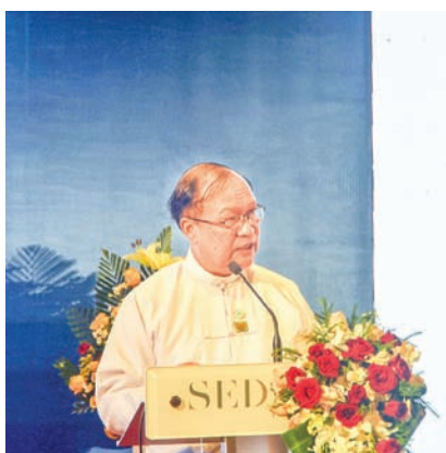
Union Minister U Thant Sin Maung delivers the concluding speech at the 3 rd Asia-Pacific Water Summit.

The second day of the 3 rd Asia-Pacific Water Summit (3 rd