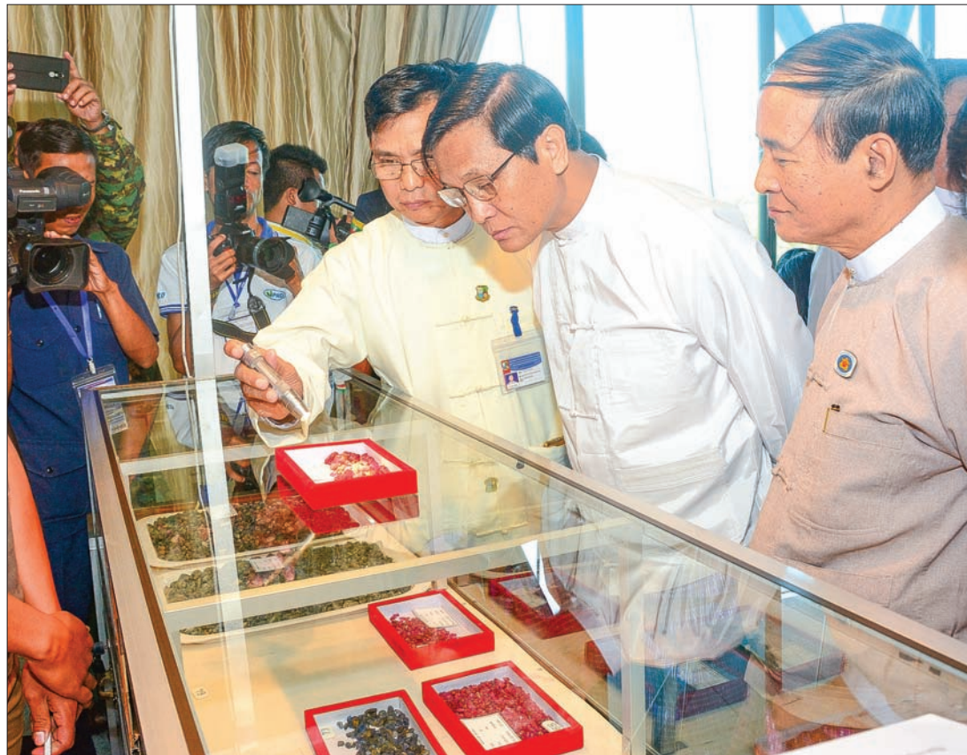
Vice President U Henry Van Thio inspects ruby at Mid-year Myanmar Jade and Gems Emporium in Mani Yadana Jade Hall on 12 December 2017.