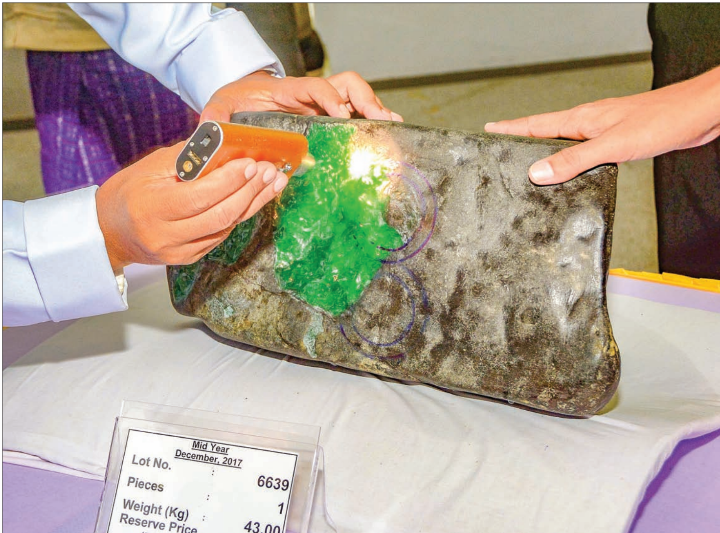
Traders check a large chunk of uncut jade at the Mid-Year Myanmar Jade and Gems Emporium in Nay Pyi Taw yesterday.