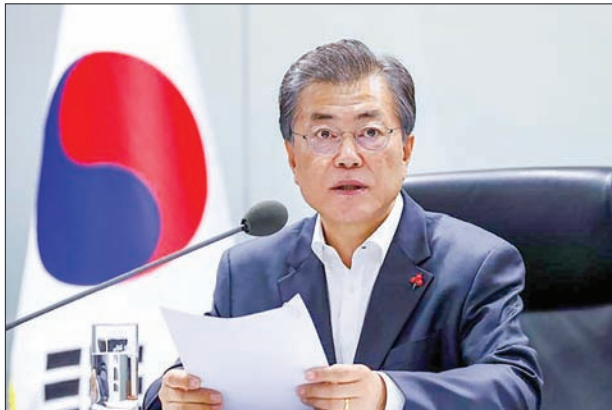
South Korean President Moon Jae-in.

this year with Chinese President Xi Jinping on Thursday in Beijing, Moon is expected to reaffirm South Korea's agreement with China in late October that they would normalise exchanges and move past the dispute over THAAD, which froze trade and business exchanges between the two.