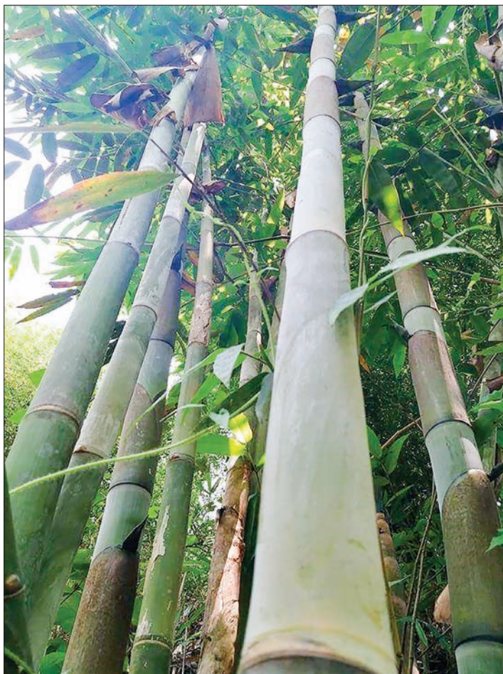
Bamboo plants.

At present, bamboo from Pinlaung, Shan State, is being exported to Japan. Further, efforts are being made to make available locally manufactured bamboo finished products for