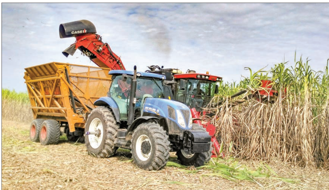
A Brazilian made sugar-cane harvesting machine was introduced in Pyay of Bago Region.

The sugarcane harvester which is a type of Case A 8,000 can harvest about 200 tonnes of sugarcane per day, at a