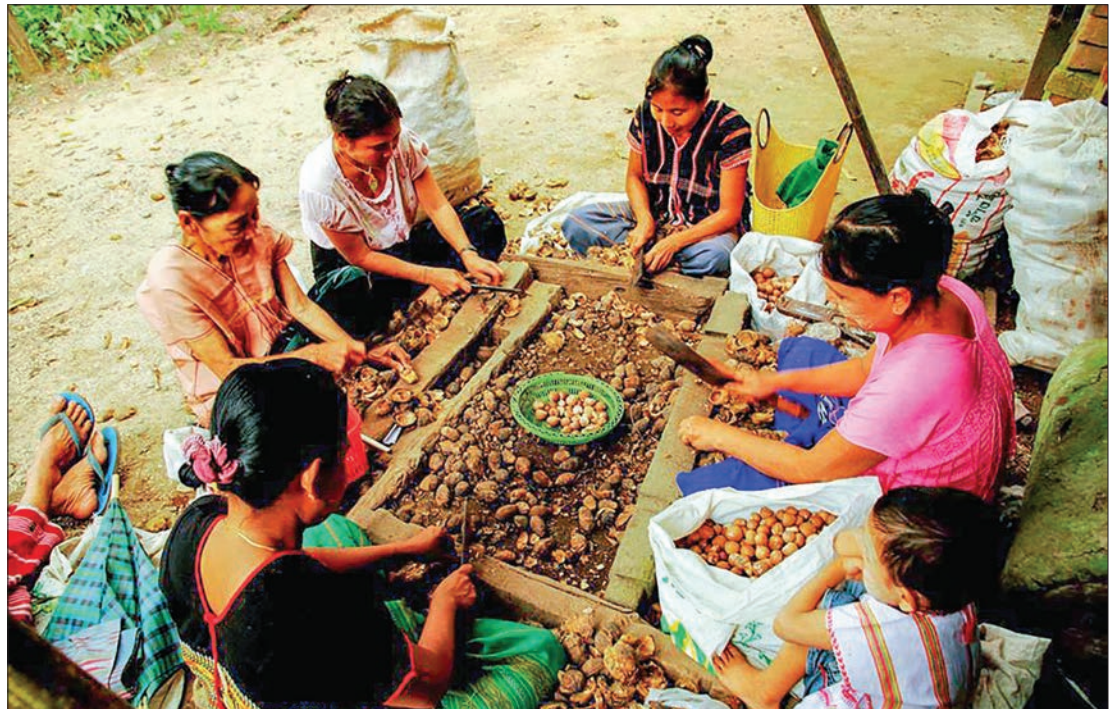
Women workers preparing areca nut for export.

modities including 15 tonnes of cigarette worth $0.486 million was also exported from the Republic of India at the Tamu border gate, whereas the coun-