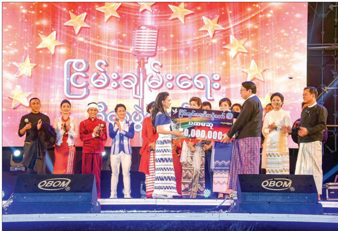
Union Minister Dr Pe Myint awards first prize to the winner.