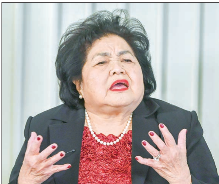
Setsuko Thurlow, 85, who survived the 1945 US atomic bombing of Hiroshima, speaks at a press conference in Oslo on 9 December 2017, a day before the Nobel Peace Prize Award Ceremony.

She also said Japan has "a moral responsibility," as the only country to have suffered atomic