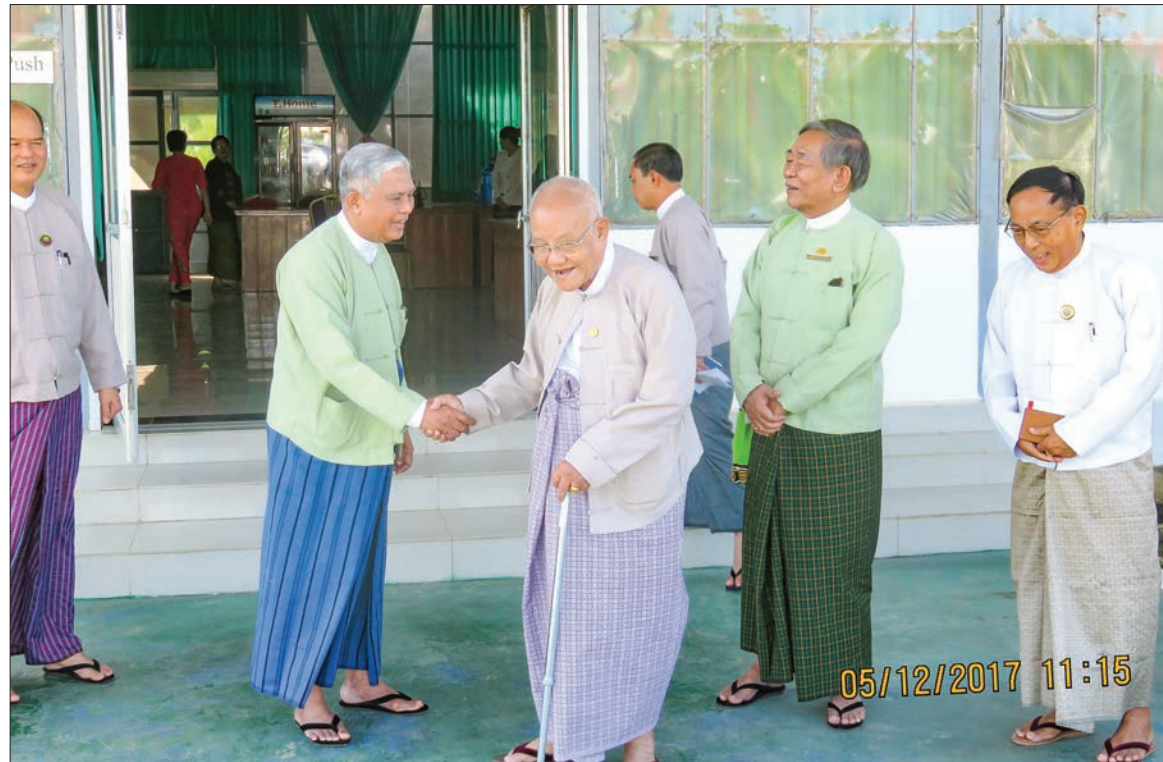
Anti-corruption commission chairman U Aung Kyi welcomes NMC member Veteran journalist U Ohn Kyaing in Nay Pyi Taw.

Corruption is defined as dishonest or illegal behavior; especially of people in power and authority. Countries free from corruption, bribery and malpractice are difficult to find these days. Cases of bribery and corruption may be found in many countries, the only difference being