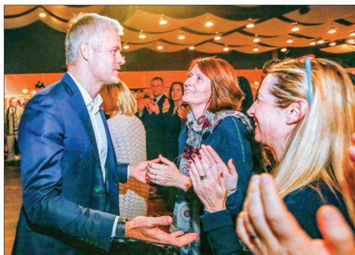
Laurent Wauquiez, the front-runner for the leadership of French conservative party "Les Republicains" (The Republicans) attends a political rally in Saint-Priest, near Lyon, France, on 7 December 2017.

There are few policy parallels between the two men, however. Wauquiez is a relentless critic of the 39-year-old presi-