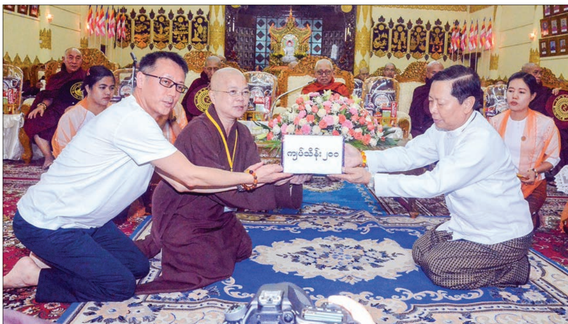
Union Minister for Religious Affairs and Culture Thura U Aung Ko accepts donation from a Buddhist missionary to Yangon.

presented K 20 million as a health trust fund for Sayadaws of the State Sangha Maha Nay-