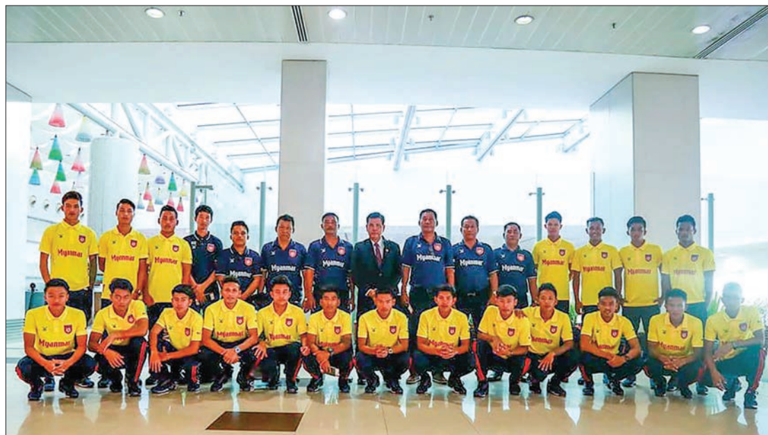
Myanmar U-21 footballers with team's officials seen at the Yangon International Airport before their departure for Viet Nam.

In addition to improving the quality of football in the country, the tournament also