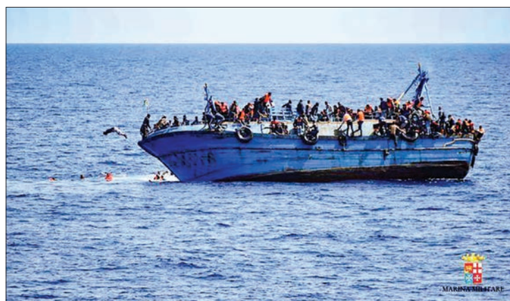
Migrants are seen on a capsizing boat before a rescue operation by Italian navy ships "Bettica" and "Bergamini" (unseen) off the coast of Libya in this handout picture released by the Italian Marina Militare on 25 May 2016.

The agreement to set up the operations room was announced after a meeting in Tripoli between the head of the UN-backed Government of National Accord (GNA), Fayez Seraj, Libyan Interior Minister Aref Khodja, and his Italian counterpart Marco Minniti. A statement from Seraj's office said the centre would consist of "representatives from the coastguard, the illegal mi-