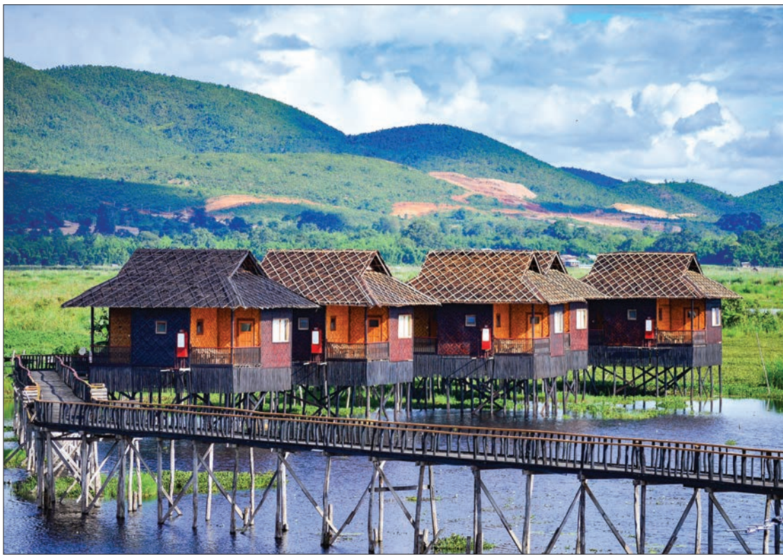
Myanmar is in progress in extending destinations as tourism is a promising business.