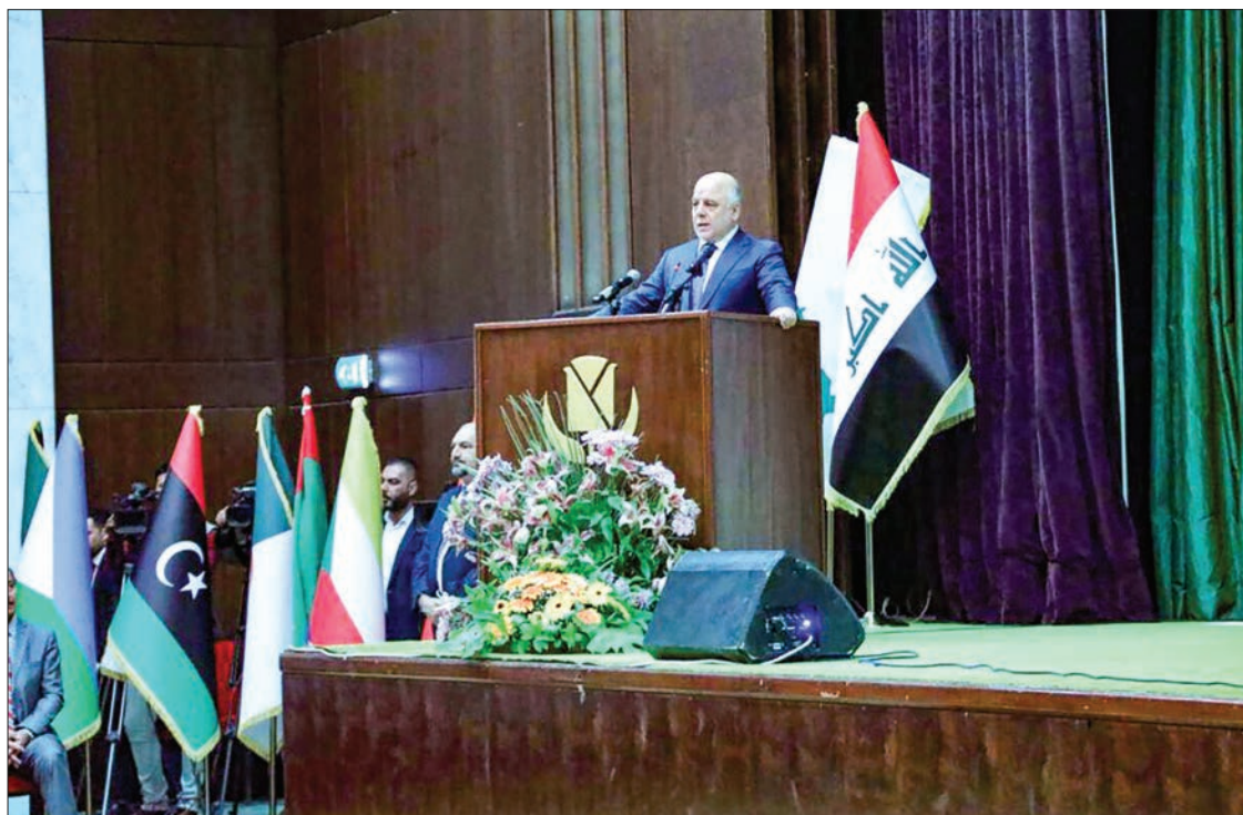
Iraqi Prime Minister Haider al-Abadi speaks during an Arab media conference in Baghdad, Iraq, on 9 December 2017.

The US-led coalition that has been supporting the Iraqi forces against Islamic State wel-