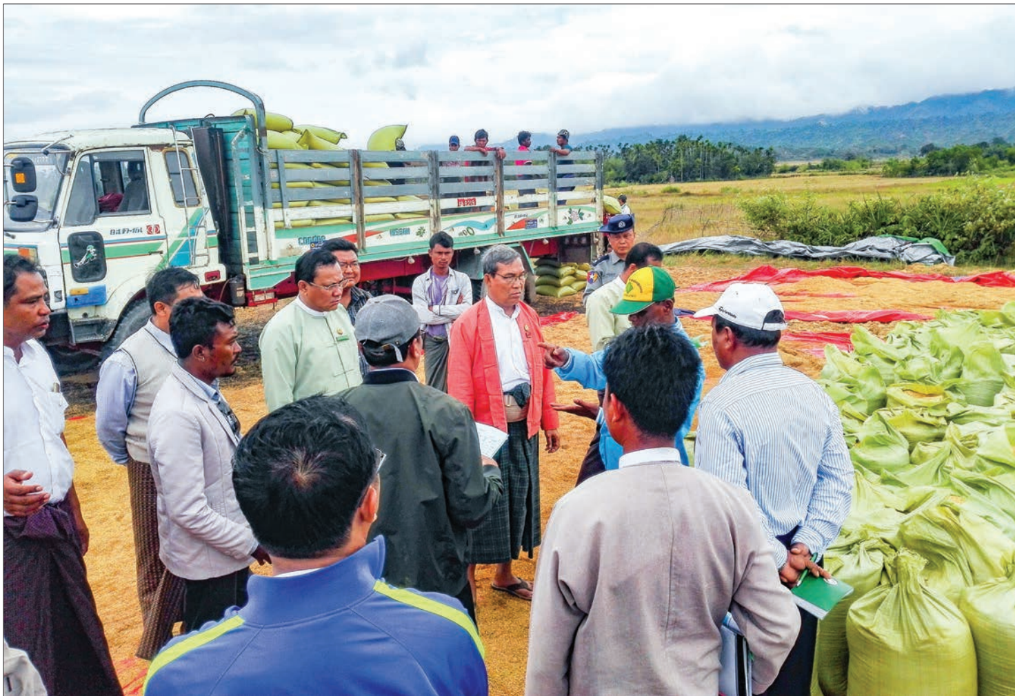
Rakhine State Chief Minister U Nyi Pu coordinates storage and sale of paddy in Maungtaw District.