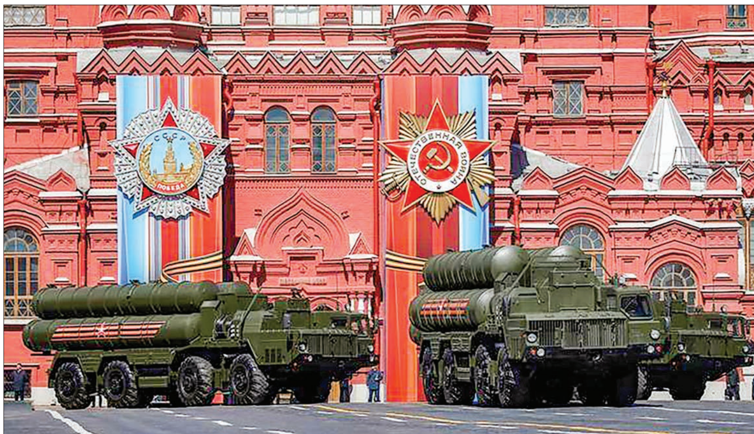
Russian army S-400 Triumph medium-range and long-range surface-to-air missile system rehearse before the World War II anniversary in Moscow, on 7 May 2017.