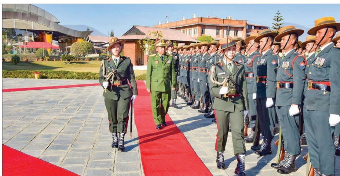
Senior General Min Aung Hlaing receives the guard-of-honour welcome in Nepal.

Then, in the meeting hall, the Senior General and the Chief of Army Staff of the Nepali Army