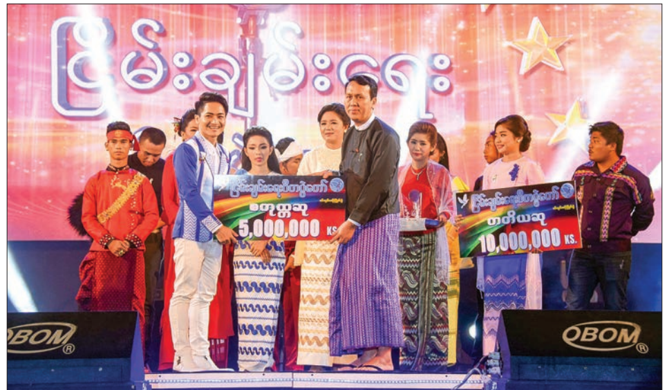
Yangon Region Chief Minister U Phyo Min Thein awards fourth prize to the winner.