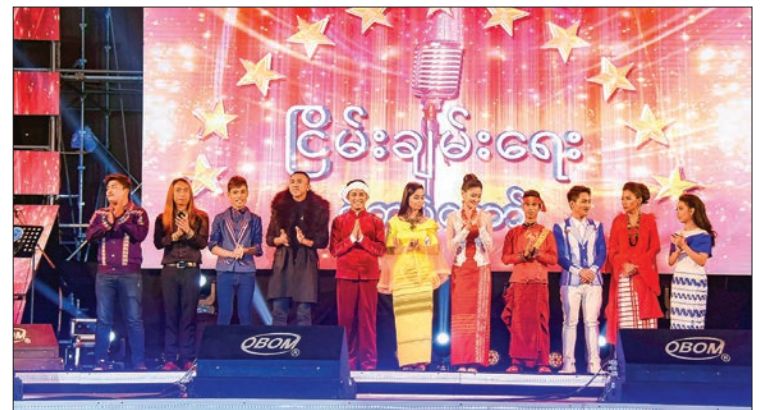
Grand final competition of peace music festival in progress.