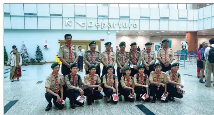
The 12 member team of the Myanmar Scout Delegation seen before their departure for Thailand at the Yangon International Airport.

15000 scouts of Thailand, 100 scouts from international Scout Federations including Myanmar will take part in the