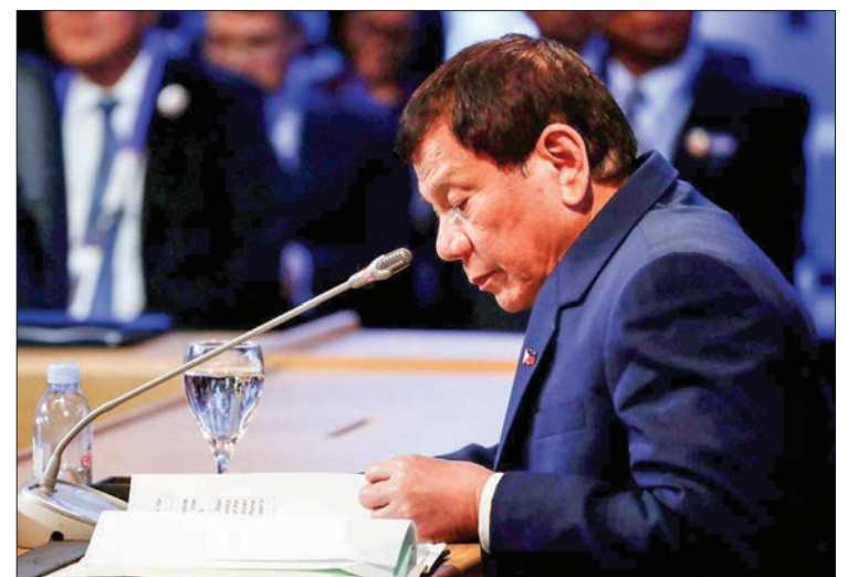
Philippine President Rodrigo Duterte participates in the opening session of the 15th ASEAN-India Summit at the Philippine International Convention Center in Manila, Philippines, on 14 November 2017.