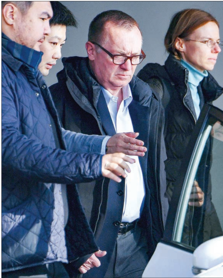
UN Undersecretary General for Political Affairs Jeffrey Feltman (2nd from R) arrives in Beijing, on 9 December 2017, after a rare visit to Pyongyang for talks with senior diplomats.

BEIJING — The UN political affairs chief on Saturday ended a rare visit to North Korea after holding talks with senior diplomats, but apparently with a lack of major progress in stopping the country's accelerating nuclear weapons and missile programmes.