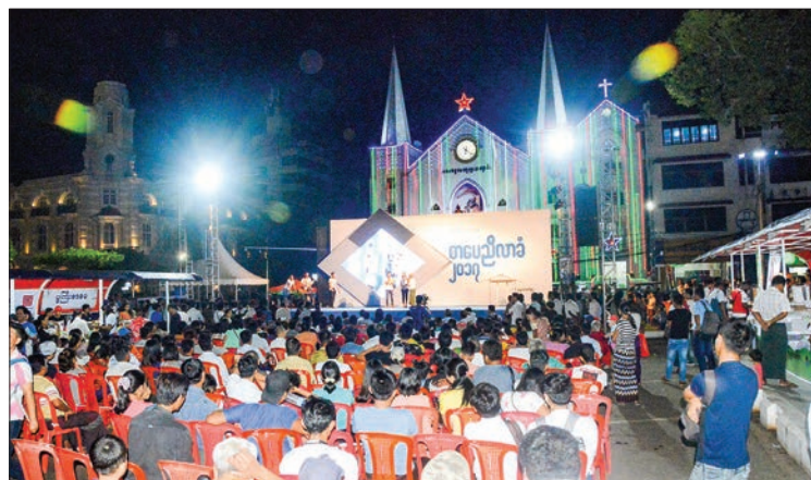
People waiting in front of Yangon's City Hall for ferries to travel to the Literary Festival.

TRANSPORT will be arranged for the would-be participants of the Literary Conference 2017 at Myanmar Convention Centre in Yangon from 13 to 16 this month.