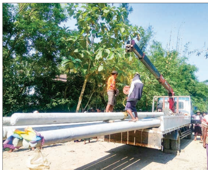
Workers transporting concrete beams for installation of a power line in Maungtaw District. PHOTO: NAY WIN TUN AND HANLIN NAING

at Bir Smarak memorial to heroes in Army Pavillion, Tundikh. —Myanmar News Agency ■