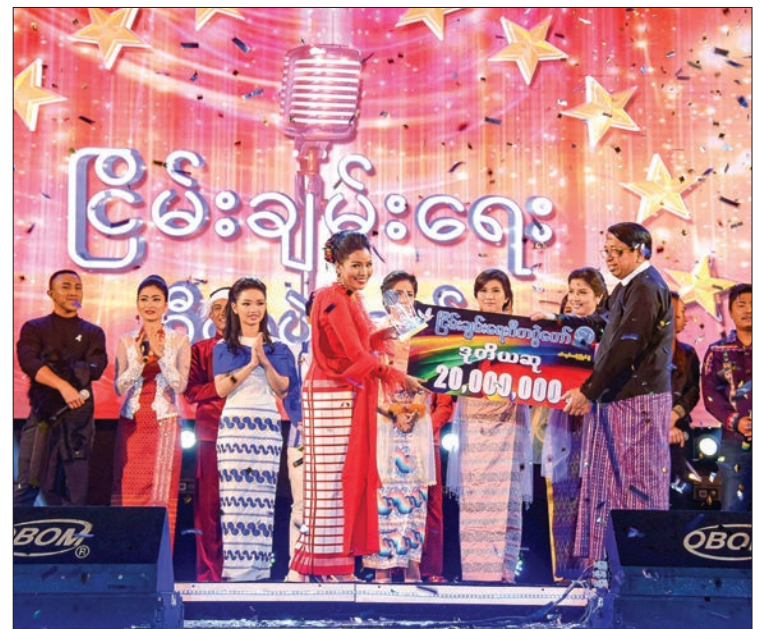
Union Minister Dr Pe Myint awards second prize to the winner.

THE grand final event and awarding ceremony of 2017 peace music festival was held yesterday night at People's Park, Dagon Township, Yangon. The 2017 Peace music festival was supervised by Ministry of Information, supporting nation peace process.