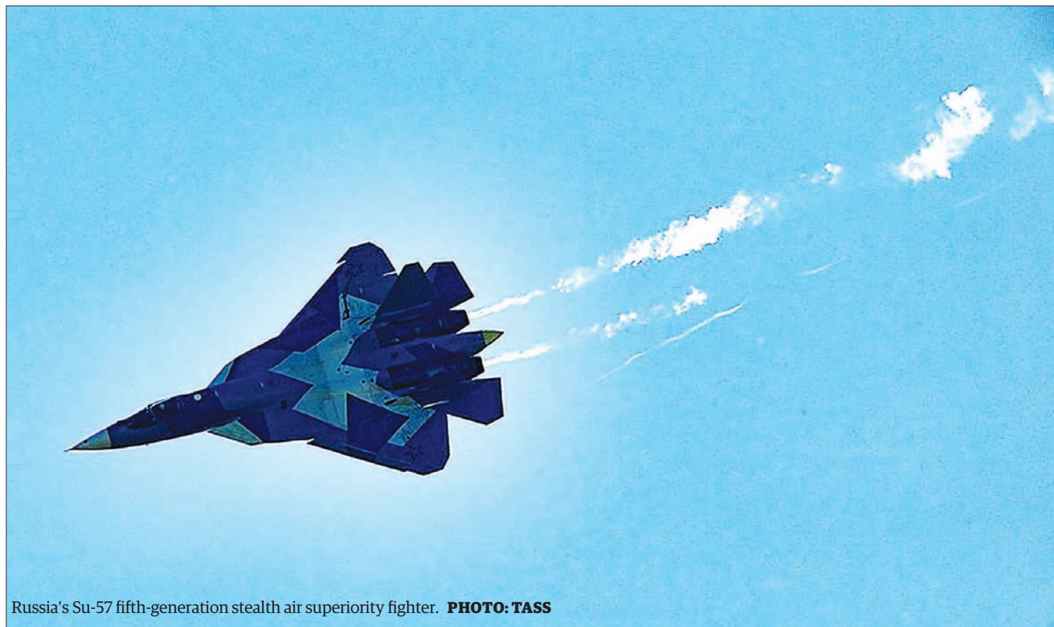
Russia's Su-57 fifth-generation stealth air superiority fighter.