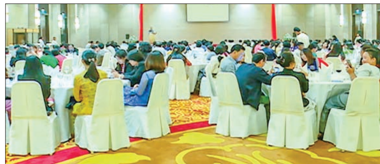
Officials attend the dinner which is held to appreciate their efforts for 13 th ASEM Ministers' Meeting.

A dinner hosted in honour of the officials from respective Ministries and Sub-Committees who made efforts for success of the 13 th ASEM Foreign Ministers' Meeting and other related meetings held at Thingaha Hotel in Nay Pyi Taw yesterday evening.