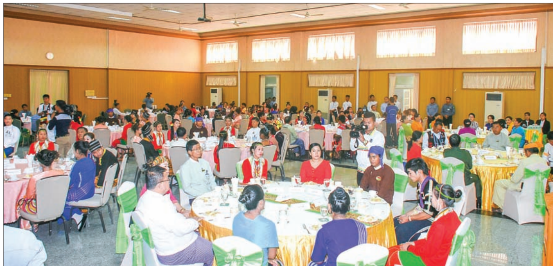
Union Minister for Border Affairs Lt-Gen Ye Aung meets with 100-member ethnic delegation at the Ministry of Border Affairs on 6 December.

UNION Minister for Border Affairs Lt-Gen Ye Aung met cordially with delegation members of ethnic races at the ministry hall yesterday evening.