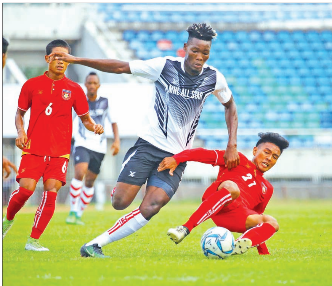
Players from MNL All-star and Myanmar U-21 vie for the ball at yesterday's match in Thuwunna Stadium.

U-21 team benefited the most, because they had much to learn from playing an experienced,