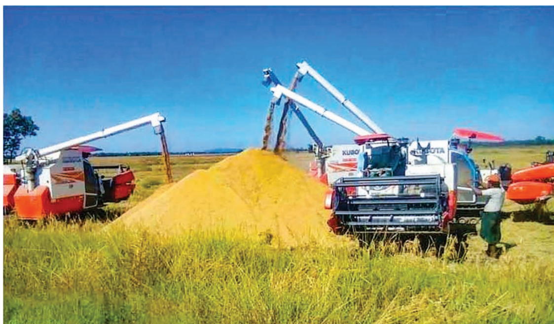
Harvesting rice in a model plot with the use of machinery in Kyaukpandu village, Maungtaw.

Many villages in Sittway Township, totaling 378 acres of rice fields, have been winnowed in Chaungnwe, Partalate, Thinganet, Kweetae, Kantkawkyun,