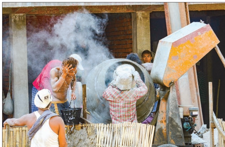
Labourers working with cement mixer used in construction site.

The cement bags were imported 26 tons from Thailand and 21,218 tons from Malaysia. Moreover, Myanmar has also imported cement weighing over 5,600 tons via border trades from 11 to 17 Novem-