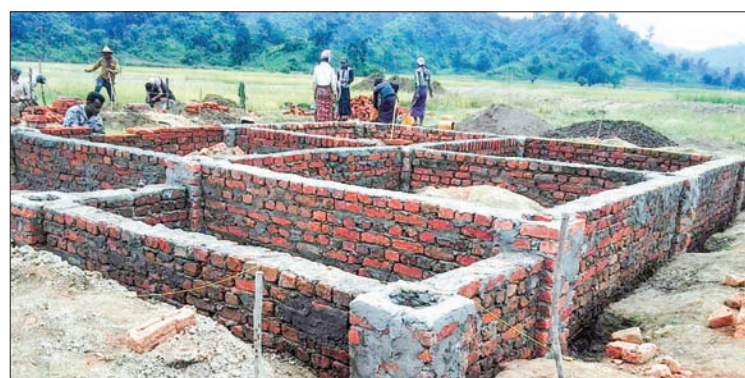
Workers constructing houses for four villages of ethnic Mro villagers in Maungtaw District.

Ethnic Mro nationals lived peacefully with agriculture and new Khonhtaing (Mro) village will soon be developed with the full requisite of a village.— News Team ■