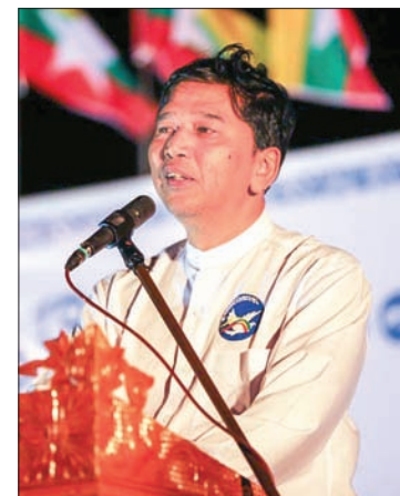
U Min Ko Naing.

Later, attendees to the public peace talk event lighted candles and prayed for