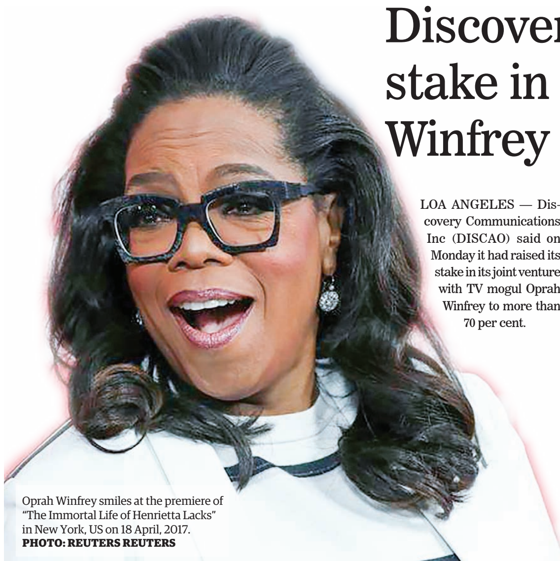
Oprah Winfrey smiles at the premiere of "The Immortal Life of Henrietta Lacks" in New York, US on 18 April, 2017.

Magic Moment, the first film being jointly produced by Turkey and China, was introduced during the festival.—Xinhua ■