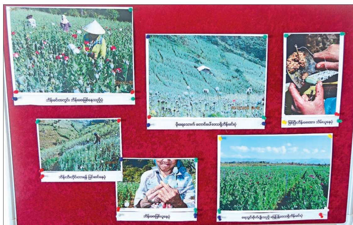
Photo shows pictures of opium poppy cultivation in Myanmar.

At the ceremony, Lt-Gen Kyaw Swe, Union Minister for Home Affairs and Chairman of Central Committee for Prevention from the Dangers of Narcotic Drugs and Psychotropic Substances, said, “The Central Committee for Drug Abuse and the United Nations Office of Drugs and Crimes made a data collection survey in cooperation since 2001 concerning poppy cultivation and opium production under the program ICMP. The ICMP is launching the data collection in cooperation with respective governmental departments, according to the projects laid down by the 53 rd Session of the UN Commission on Narcotic Drugs held in March in 2009. Poppy cultivation and opium production in Myanmar decreased, reaching to the lowest level in 2006 — 21500 hectares. But it rose up again during the period — from 2007-2013. And then it dropped to some extent during 2013-2016. In 2017 it decreased