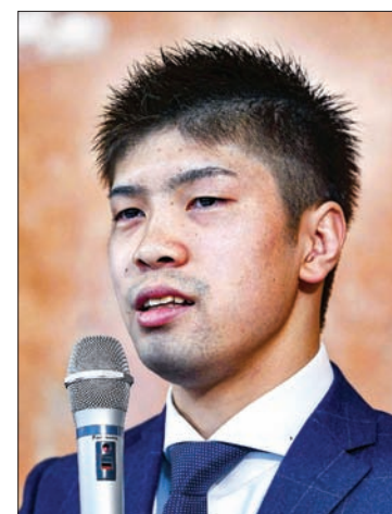
Japanese boxer Kosei Tanaka.

Tanaka has won all 10 of his career bouts, six of them by knockout.—Kyodo News ■