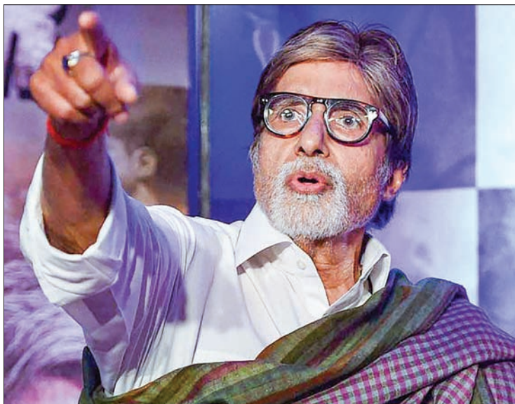
Amitabh Bachchan

"I said to myself, as very uncertain thoughts raced through my mind of wanting to become a film actor; that, with men like him around, I stood no chance at all..."