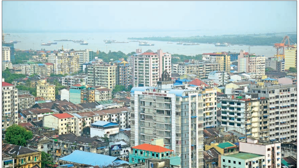
Over 20,000 individuals opened housing savings account at Construction and Housing Development Bank.

driven by Myanmar's growing population, which is estimated to rise from its current population of 51 million to 70.56 million by 2040. It is estimated that the commercial city Yangon will require one million new units by 2040. According to the 2014