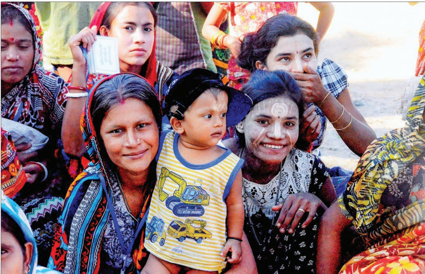
Hindus from Ngakhuya Village wait to receive aid delivered by volunteers. The second batch of volunteers from UEHRD arrived in Sittway on 29 November and started to conduct surveys and distribute aid in the villages of Buthidaung and Maungtau townships.