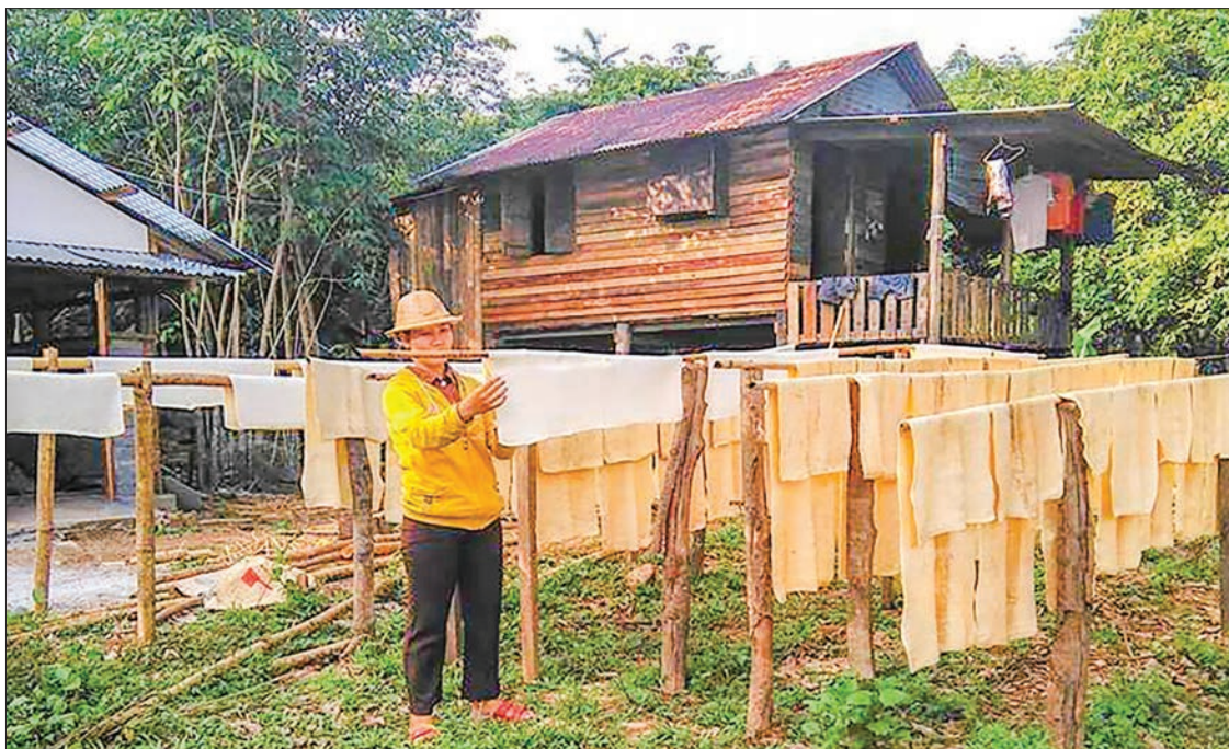
A worker hangs rubber sheets to dry.

Technically Specified Rubber (TSR) producing plants are required to establish in order to produce high quality