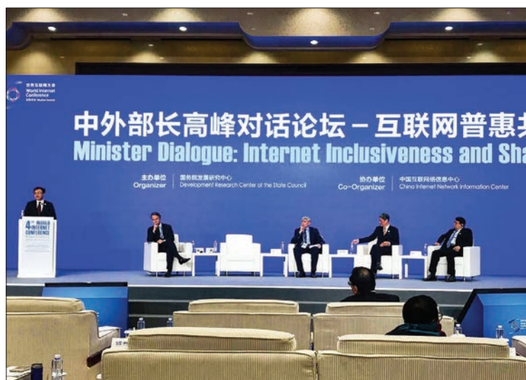
Union Minister Dr Pe Myint attends Fourth World Internet Conference in Wuzhen, People's Republic of China yesterday.