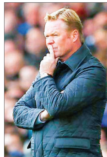
Everton manager Ronald Koeman.

The 54-year-old was touted to take over at several vacant managerial roles at Premier League and European clubs, including West Bromwich Albion and West Ham United, but turned down the offers. "I need to put those feelings of disappointment away first," Koeman added.