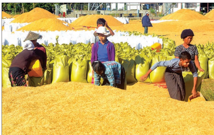
Workers collect rice after drying the grain under the sun in Maungtau region.

icisms that Maungtau region is weak in rule of law. As a responsible person, what would you like to say about this?