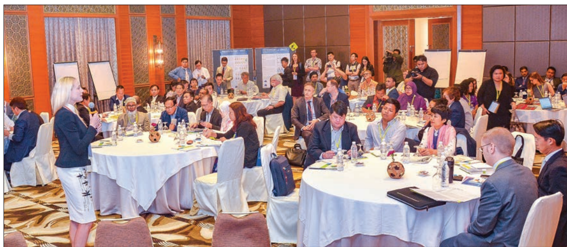
A ceremony of week's activities for Asia-Pacific Malaria Elimination in 2030 held in progress.

Currently construction and basic infrastructure construction work group is renovating 2 barracks measuring 120 ft. long and 30 ft. wide while Ministry of Construction is stockpiling materials and conducting earth work to construct the modular houses.— Myanmar News Agency ■