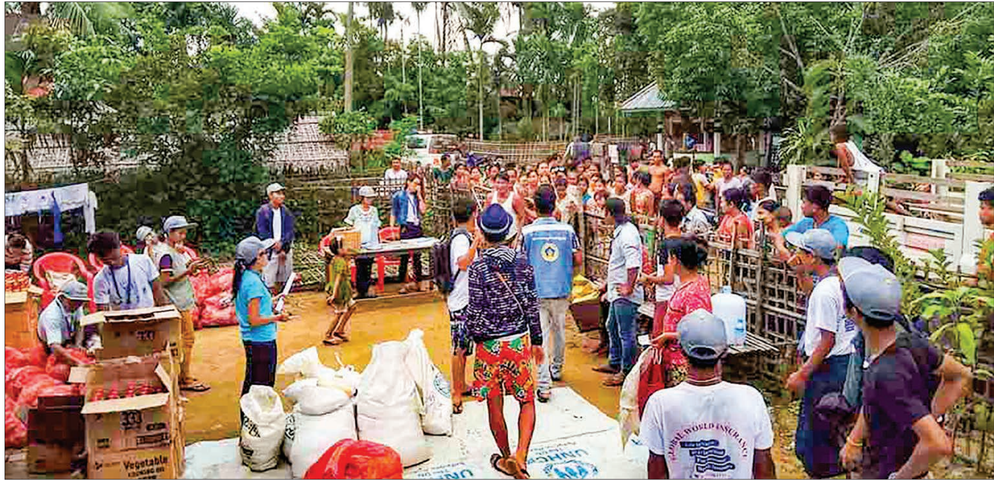
The first batch of youth volunteers deliver aid to people in Maungdaw.

Starting from May 2016, the Ministry of the Social Welfare, Relief and Resettlement systematically formed 3 committees—central committee, working committee and drafting committee, in cooperation with the related ministries including the Ministry of Health and Sports, the Ministry of Education, youths representing Regions and States, female representatives and those representing the disabled youths, UN Organizations, NGOs and INGOS. Committees at different levels are also constituted of youth representatives to basically collect youths' voices, opinions and suggestions. In drafting the policy, thorough considerations were made so as not to go astray from standards of human rights, different situations in Myanmar, necessities