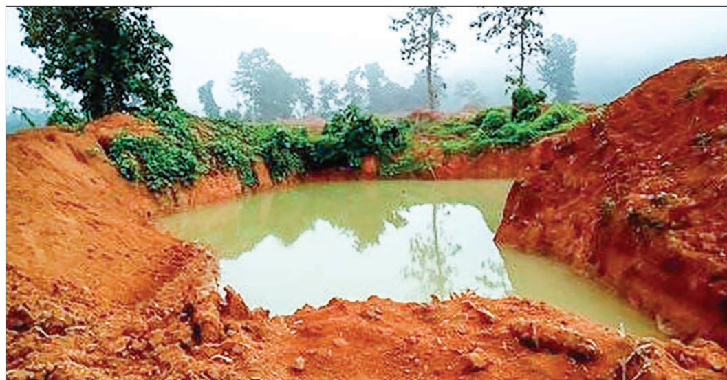
Farm land is damaged by unauthorized gold diggers in Bamauk Township, Sagaing Region.