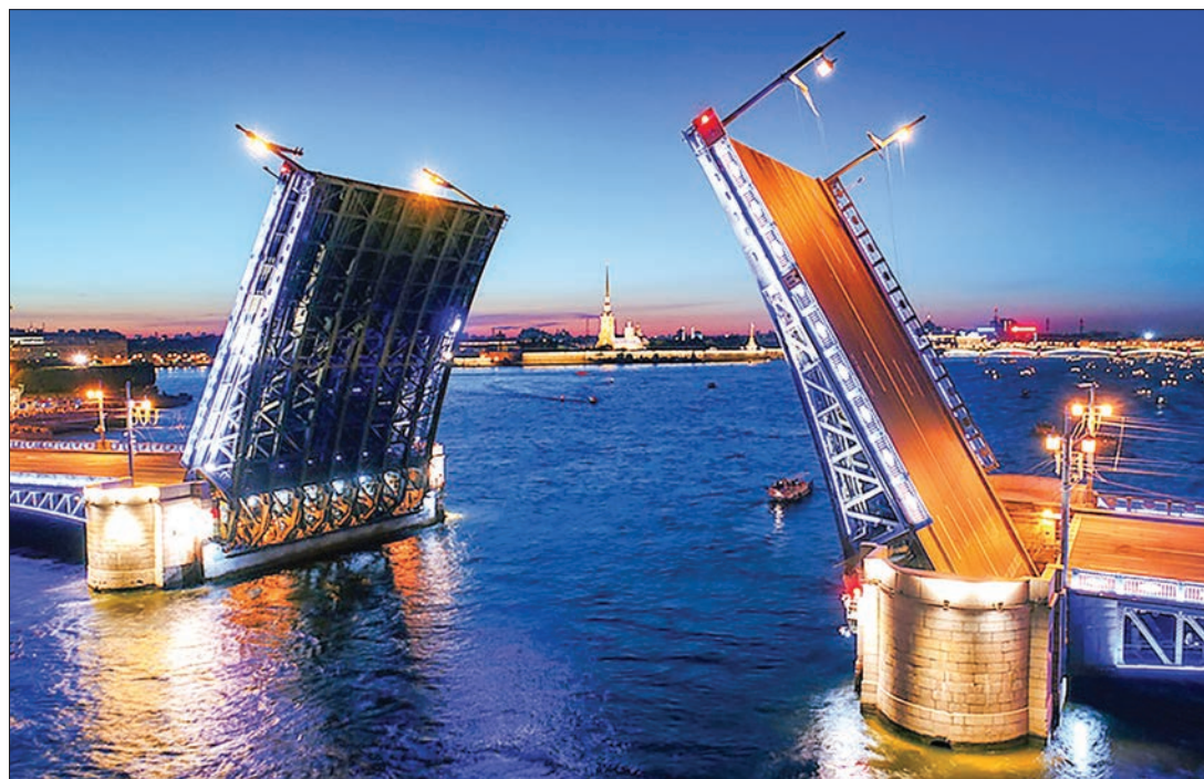
Palace Bridge in St Petersburg.

The navigation on the city’s smaller waterways, including