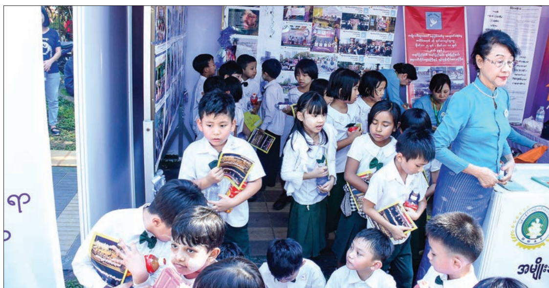
Myanmar Women Affairs team member distribute to students the pamphlets of the protection of child abandonment at the Youth All-Round Development festival in Yangon University.

At the youth all-round development festival, educative programmes were launched. Spreads of pamphlets and awarding prizes to winners in the quiz were made.