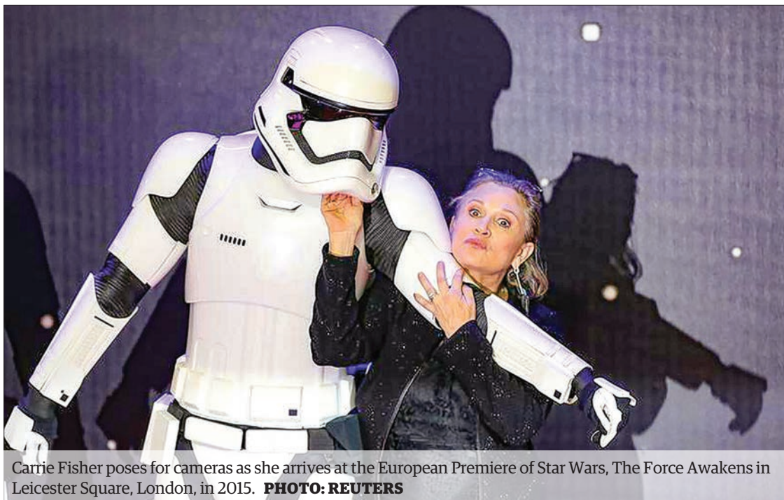
Carrie Fisher poses for cameras as she arrives at the European Premiere of Star Wars, The Force Awakens in Leicester Square, London, in 2015.

Fisher had filmed all of her scenes for "Star Wars: The Last Jedi," the eighth instalment of the blockbuster space saga, before she died of a heart attack in December 2016. "She's irreplaceable," Mark Hamill, who plays Luke Skywalker, told Reuters. "'Star Wars' is about great triumphs and great tragedies, and I can't think of a bigger tragedy than missing our Leia," Hamill told Reuters. Writer and director Rian Johnson said he did not change Leia's story in "Last Jedi" after her death. The film debuts in theatres 14 December.