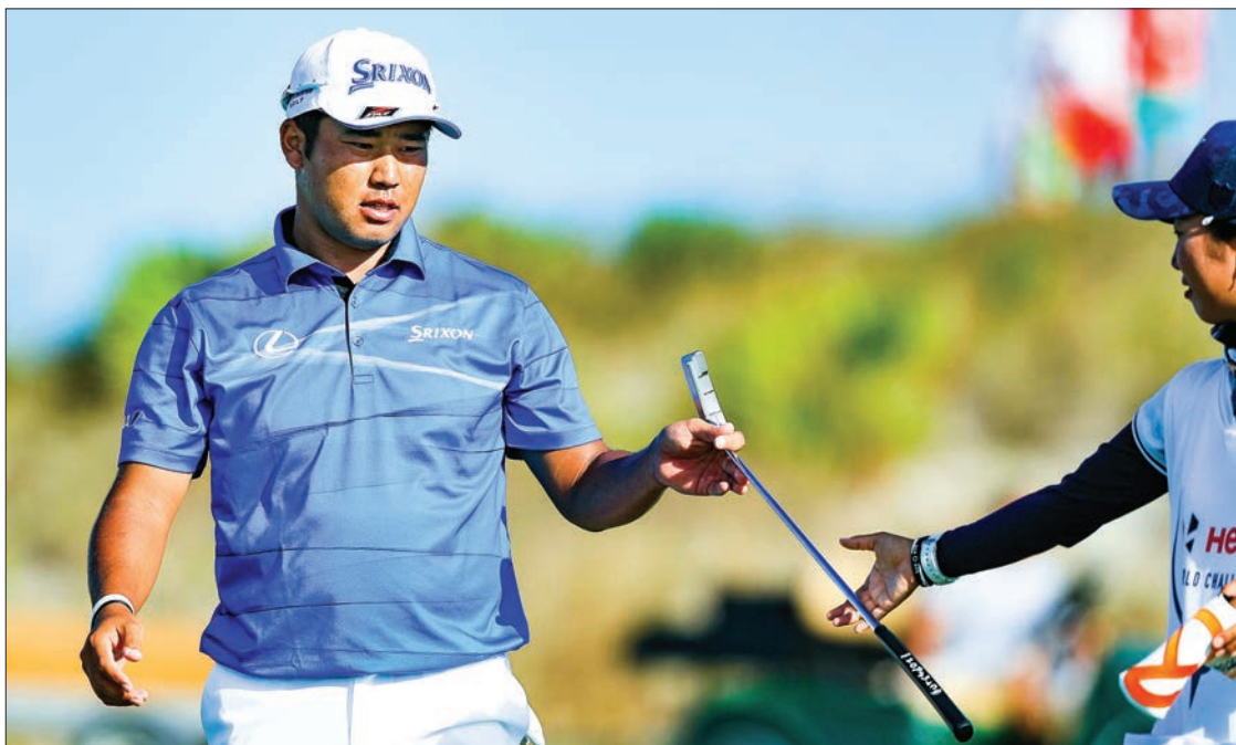
Hideki Matsuyama of Japan hands his caddy a putter in the final round of the Hero World Challenge at Albany Golf Club in the Bahamas on 3 December, 2017. Matsuyama placed fifth.

Matsuyama is scheduled to compete in the Sentry Tournament of Champions in Hawaii which gets under way on 4 January.—Kyodo News ■