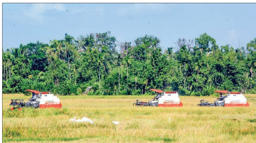
Harvesting of monsoon rice in Maungtau region.

There should be proper road for entry and exit to/from the village. Existence of health hazards and lack of systematic house construction is due to the weaknesses of the related departments. Nothing more need to be said about rule of law in the region if the administrators administer according to the law and the people obey the law. ■