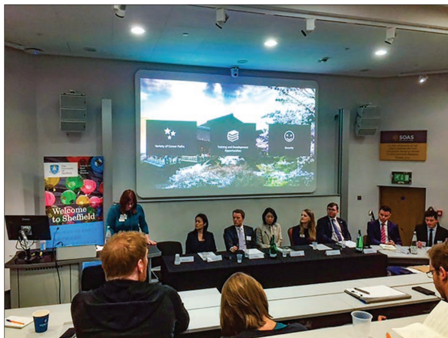
This photo taken on 6 November, 2017, shows delegates speaking at a two-day conference on foreign graduate employment at SOAS, University of London. Participants agreed universities and employers need to provide more assistance for graduates.