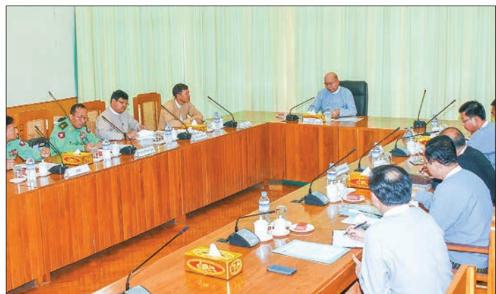
A coordination meeting for publishing NRPC periodical holds in Nay Pyi Taw yesterday.

A coordination meeting to publish a NRPC periodical that will inform the public of the national policy and the works done on the peace process was held yesterday morning at the Ministry of the Office of the State Counsellor meeting hall, Nay Pyi Taw.