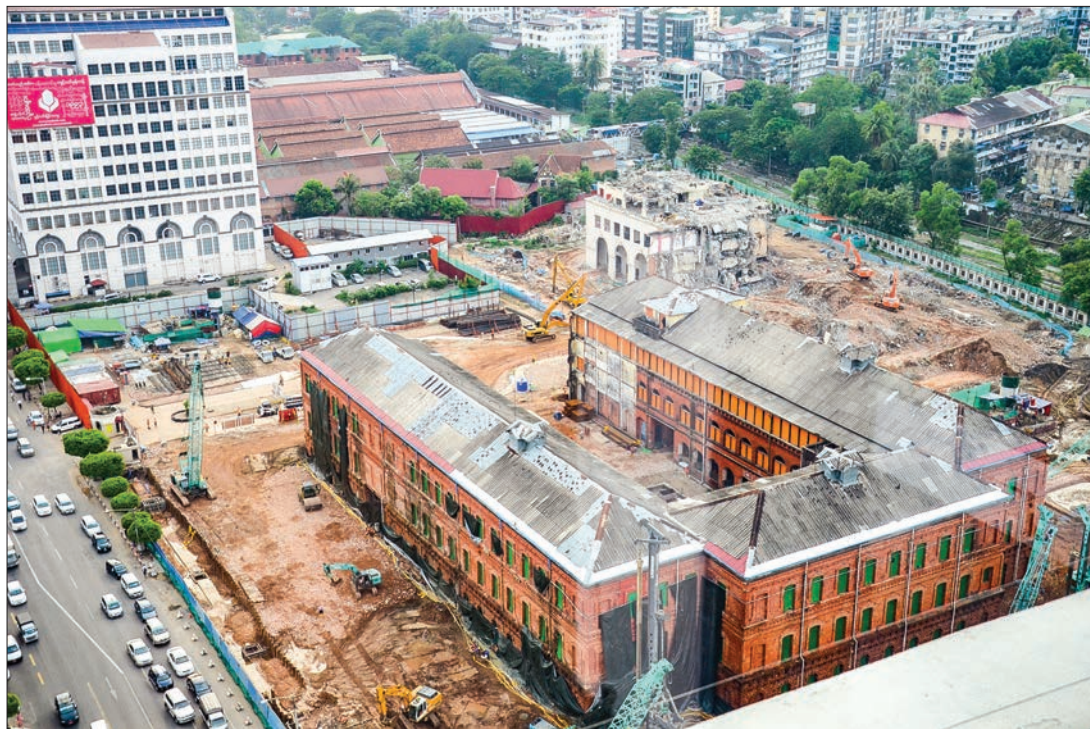
The construction of Yoma Central and The Peninsula Yangon seen in Yangon.

Yoma Central will include Peninsula-branded residences, two Grade "A" office towers, a business hotel, service apartments and retail shops. The Yoma Central project will be implemented jointly by BTJV Myanmar, a joint venture between Dragages Singapore Pte Ltd. and Taisei Corporation.