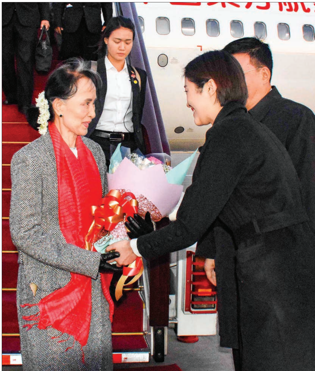
State Counsellor Daw Aung San Suu Kyi welcomed at Beijing International Airport.

Kayin State Government to donate houses, wells to Maungtaw