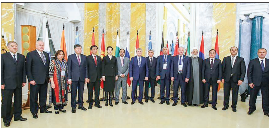
Delegates pose for photos before the 15 th Meeting of Prosecutor Generals of the Shanghai Cooperation Organisation (SCO) member states in St. Petersburg, Russia, on 29 November 2017.

Bilateral and multilateral meetings were also held on the sideline of the meeting.—Xinhua ■