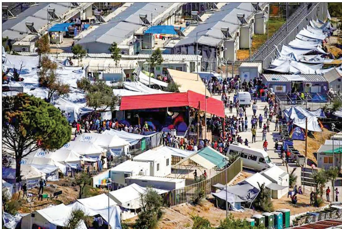
Refugees and migrants line up for food distribution at the Moria migrant camp on the island of Lesbos, Greece, in 2016.

Lesbos is now hosting some 8,500 asylum-seekers,