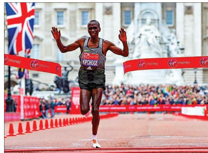
Kenya's Eliud Kipchoge celebrates winning the men's race at 2016 Virgin Money London Marathon, London, Britain, on 24 April 2016.

Officials from the MNL have already announced that the purse for the upcoming MNL League-1 Champion will be Ks110 million.