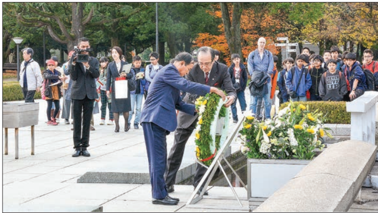
Speaker U Win Myint lays the wreath at the Hiroshima Peace Memorial Park.