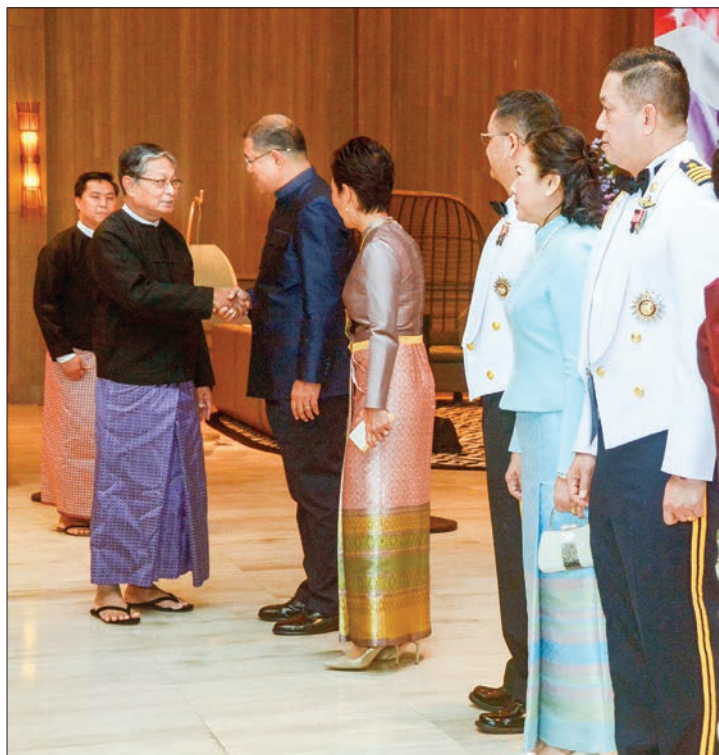
Union Minister U Kyaw Tint Swe is welcomed by Thailand Ambassador.