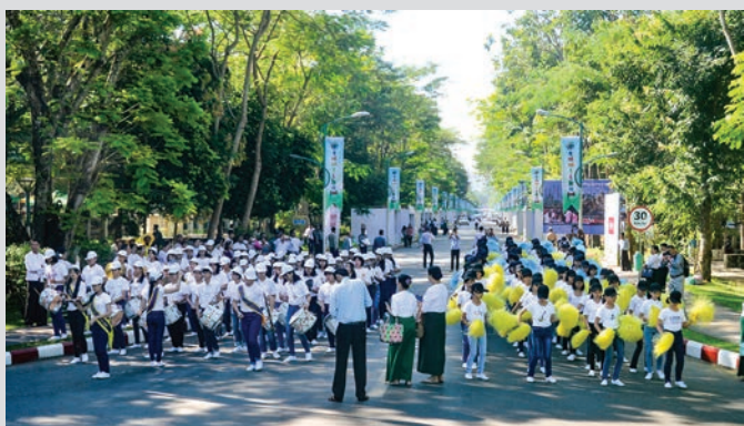
in Picture Band Troupe and Pom Pom troupe rehearse for the opening ceremony of Youth All-Round Development Festival at the University of Yangon one day ahead of opening ceremony.

U Myo Myint Than, Ambassador Extraordinary and Plenipotentiary of the Republic of the Union of Myanmar to the Kingdom of Thailand presented his Credentials to His Majesty King Maha Vajiralongkorn Bodindradebayavarangkun, King of Thailand on 27 November 2017, in Bangkok.