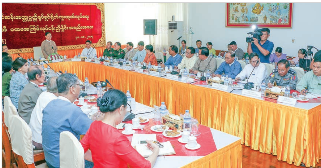
Ministry of Religious Affairs and Culture takes steps to fil about the life of Bogoyoke Aung San.

At the meeting, the Union Minister for Religious Affairs and Culture Thura U Aung Ko, Chairman of the Biographical Film Production about the life of Bogoyoke Aung San, said, "Those present at today's meeting will have to deservedly take the responsibility of producing a biographical film about the life of Bogoyoke Aung San. All nations across the world usually produce classic films about their national leaders. In Myanmar as well, there started to make attempts to produce the film about Bogoyoke Aung San on February 13 in 2012. Now the Ministry of Religious Affairs and Culture had an opportunity to successfully produce the classic film about the life of Bogoyoke Aung San,