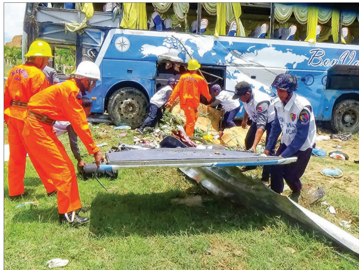
File photo shows highway Police and rescuers prepare to send the injured from a road accident to the hospital.

emergency patient means anyone who suffers physical or mental injuries—minor or major cases—and anyone facing effects of trauma or other life-threatening conditions due to road accidents, natural disasters or other causes. Thus, we may occasionally meet such emergency patients in our environment.