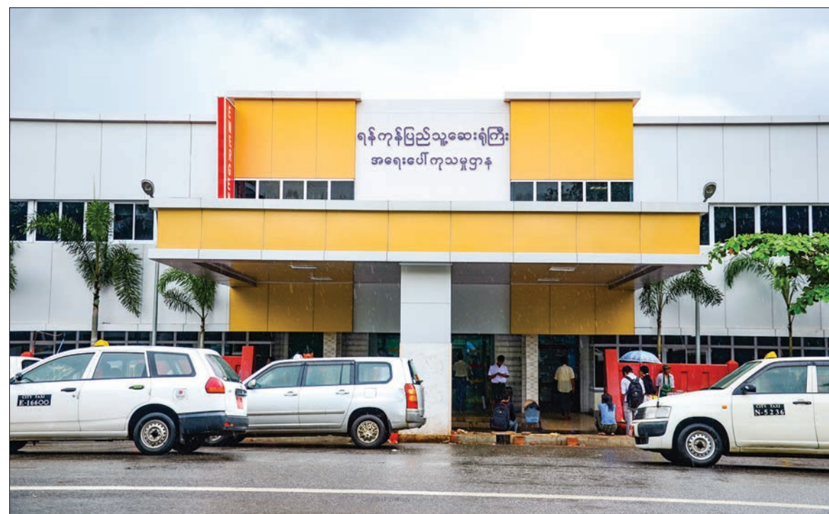
Yangon General Hospital Emergency Department.

The report entitled, 'Building Disability Inclusive Societies in Asia and the Pacific' indicates that persons with disabilities continue to face extreme poverty and are up to six times more likely to be unemployed. Their participation in decision-making is also low, with only 0.4 per cent representation in national parliaments across the region.—ESCAP