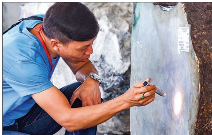
A merchant appraises a jade stone at the Myanmar Gems Emporium in Nay Pyi Taw.

“The government earns the tax mostly from cut jade and threaded jade beads. The gem and jade traders can pass the checkpoints without any delay with documents that show they have already paid the tax,”