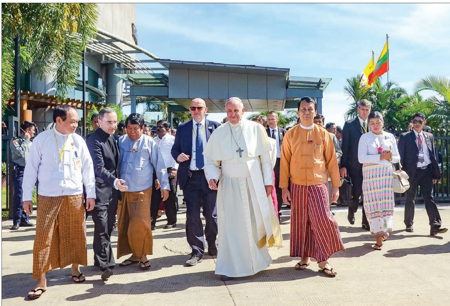
Pope Francis is seen off by dignitaries at Yangon International Airport on 30 November 2017.

At 7 pm, the State Counsellor attended a dinner hosted by the Head of the International Liaison Department of the Communist Party of China Mr. Song Tao. — Myanmar News Agency ■