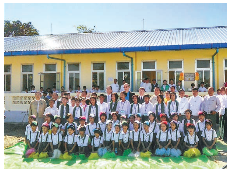
Japanese Ambassador Mr. Tateshi Higuchi and dignitaries pose for photo with children in at Kin Seik Village in Rakhine State.

"Japan is promoting the principles of 'Build Back Better', with better and stronger building standards and structures, so that the schools are more resilient to future floods and other natural disasters" said H.E Tateshi Higuchi.