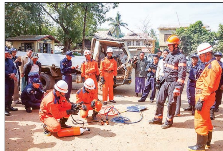
The Holmatro Rescue Equipment (the Netherlands) Product Presentation & Demonstration is held at the office of Magway Region Fire Services Department in Magway

In the past, concerning victims of car accident, assault and battery case, suicide poisoning, drowning cases, the patients or the bodies must be sent to Yangon General Hospital where forensic medicine branch was situated. Volunteers have to send to the nearest hospital or clinic, from there the patient or the corpse must continue to be transported to YGN. Now, they can be transported to many places. Once in the past, ambulances were not that plentiful as in now, depending upon taxis. The then taxi-drivers transported willingly. Now situations changed greatly. Taxi drivers pretended not to notice such accidents, avoiding getting involved with police. At