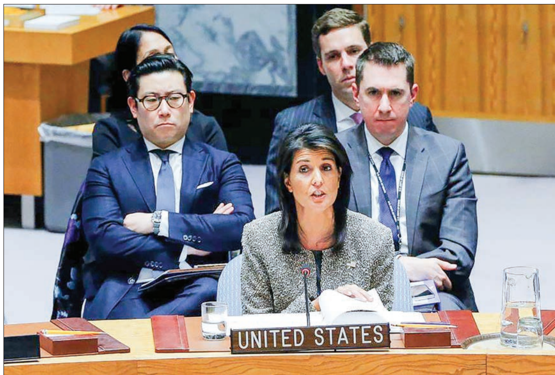
United States ambassador to the United Nations (UN) Nikki Haley speaks during a meeting of the UN Security Council to discuss a North Korean missile launch at UN headquarters in New York, US, on 29 November 2017.

Haley said the United States has asked China to cut off oil supply to North Korea, a drastic step that Beijing - the North's neighbour and sole major trading partner - has so far refrained from doing. Trump and Chinese President Xi Jinping talked on the phone earlier on Wednesday.