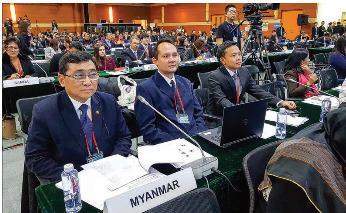
Union Minister Dr. Win Myat Aye attends the High-Level Intergovernmental Meeting on the Mid-Point Review of the Asian and Pacific Decade of Persons with Disabilities held in China on 30 November.

Incheon Strategy currently implemented in regional countries and the experiences and difficulties of all-inclusive development, and how to upgrade international