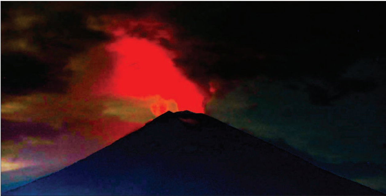
Lava, inside the crater of Mount Agung volcano, reflects off ash and clouds, while it erupts, as seen from Amed, Karangasem Regency, Bali, Indonesia, on 30 November 2017.

lines and China Eastern Airlines sent planes to fetch more than 2,700 Chinese tourists from Bali, Xinhua news agency said.