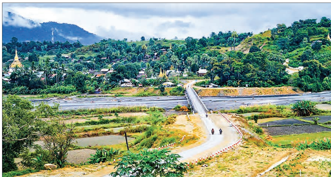
Local people in Laungshe are preparing to celebrate the town's millennium anniversary.