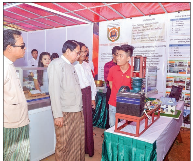
Union Minister Dr. Pe Myint visits a booth of a university at the Youth All-Round Development Festival.

In the evening, the union minister viewed the booths of the Ministry of Social Welfare, Relief and Resettlement and Yangon City Development Committee (YCDC). — Myanmar News Agency