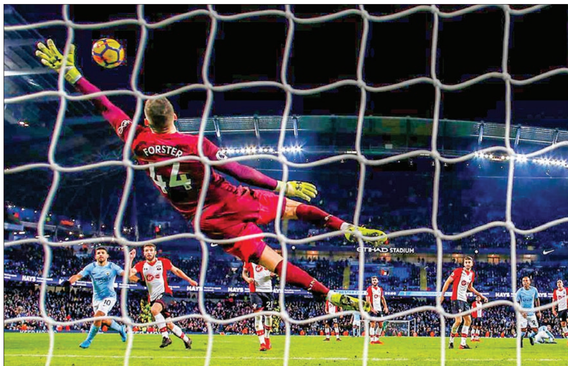
Manchester City's Raheem Sterling scores their second goal at Etihad Stadium, Manchester, Britain, on 29 November 2017.

running, everything needs to come right on the day. "The competition is always tough in London so I must wait and see how well I train and what the weather will be. I know that I have the world record in me so we will have to wait and see what happens." Kipchoge ran the quickest recorded marathon at the Nike event in Monza in May, finishing in 2:00:25, though that time is not an official world record due to aspects of the event not satisfying IAAF criteria. The Kenyan joins fellow Olympic champion Mo Farah of Britain in confirming his intention to run the London Marathon on 22 April. "I came so close to breaking the world record in 2016 and it is natural for anyone in that situation to think of what might have been," Kipchoge added. "But that race gave me the confidence to go on and win the Olympic title in Rio and run so well throughout 2017." —Reuters ■