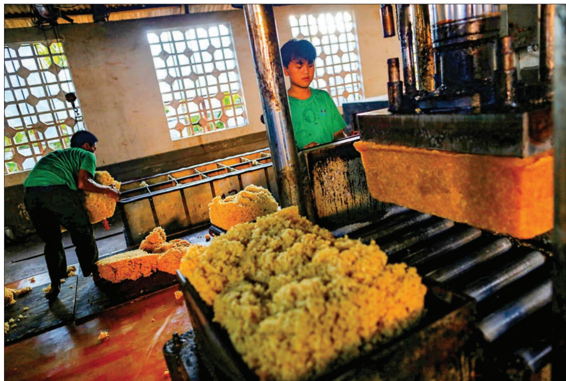
Workers work in a rubber factory at Namtit in ethnic Wa territory.

drafted and frequently amended. The bill is expected to be acted on by the Hluttaw in late 2018.