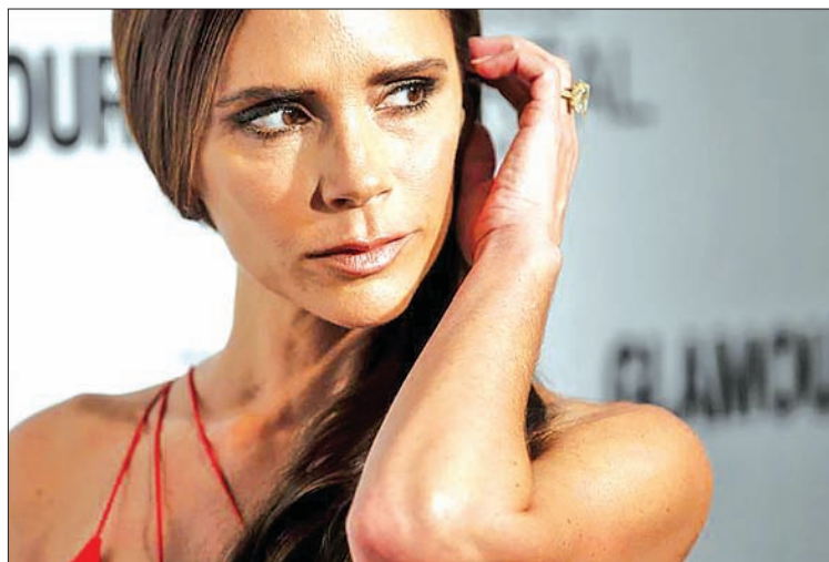
Designer Victoria Beckham in the Manhattan borough of New York on 9 November, 2015.

LONDON — Victoria Beckham, the former Spice Girl turned luxury fashion designer, has raised 30 million pounds to expand her stores and e-commerce channel via a new funding round from NEO Investment Partners.