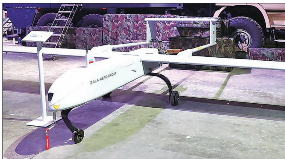
ZALA 421-20 unmanned aircraft.

"We will make our views known to the Taoiseach at cabinet this morning," the Independent Alliance group's Finian McGrath told reporters, refusing to comment on Fitzgerald's position.—Reuters ■