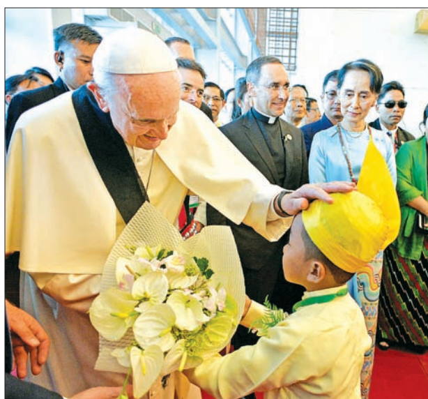
Pope Francis blesses a child as he arrives with State Counsellor Daw Aung San Suu Kyi to attend a meeting with members of the civil society and diplomatic corps in Nay Pyi Taw, on 28 November 2017.