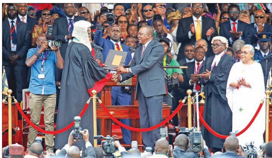
Kenya's President Uhuru Kenyatta shakes hands with Chief Justice David Maraga as he takes the oath of office during his swearing-in ceremony at Kasarani Stadium in Nairobi, Kenya on 28 November, 2017.