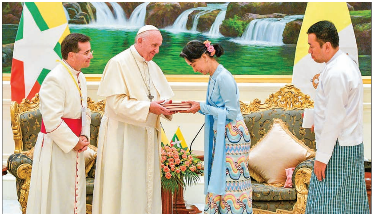
State Counsellor Daw Aung San Suu Kyi meets Pope Francis in Nay Pyi Taw on 28 November 2017.