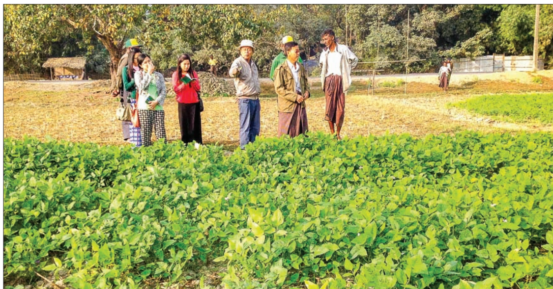
Agricultural officials visit a winter crop field in Sittway as they assist farmers in growing peas.

A total of 24,123 acres of summer paddy and 459,219 acres of winter crops were planned to be cultivated in Rakhine State for fiscal year 2017-2018.