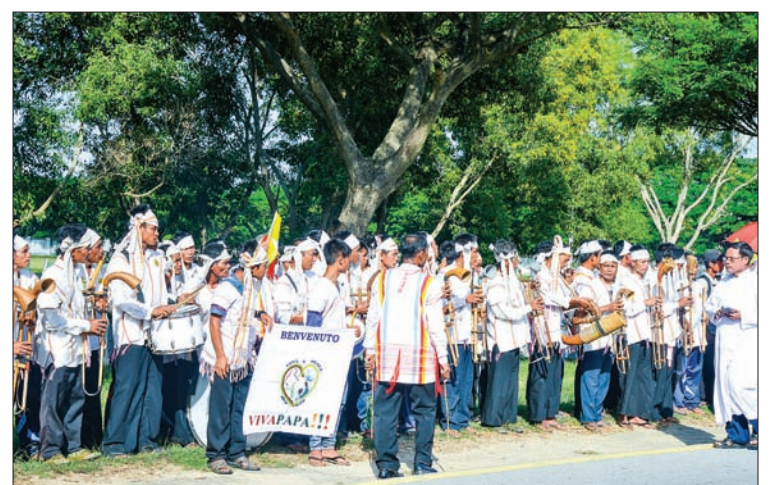
Pope Francis is welcomed at the Nay Pyi Taw Airport, on 28 November 2017.