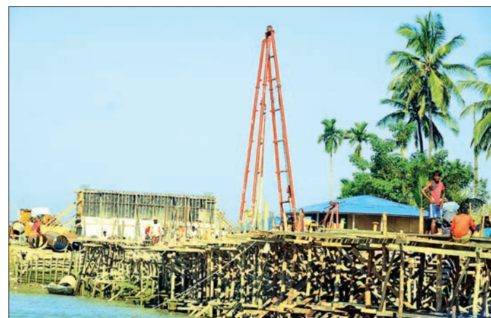
Sai Din Bridge is under construction in Maungdaw.