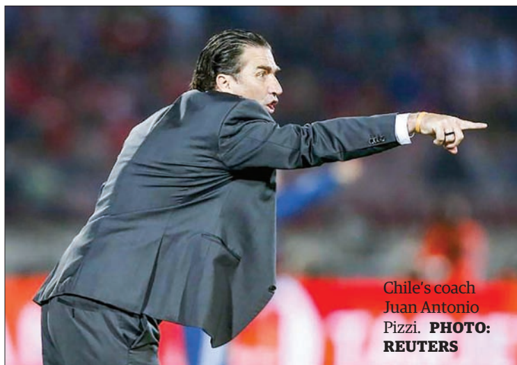
Chile's coach Juan Antonio Pizzi.