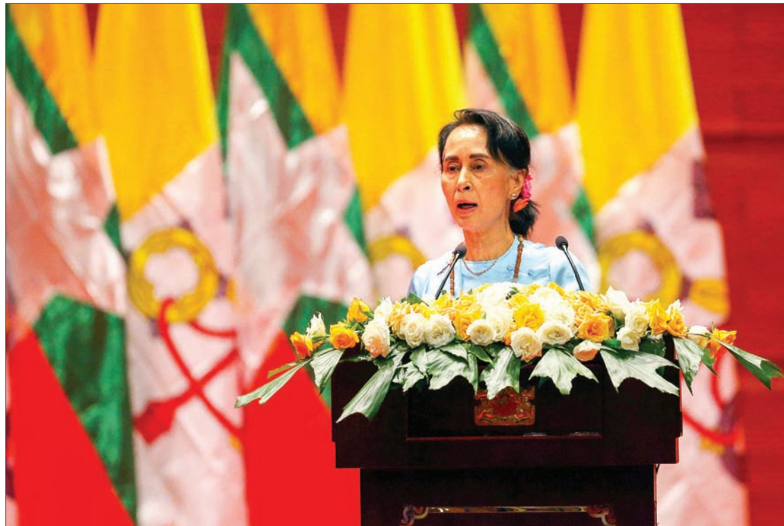
State Counsellor Daw Aung San Suu Kyi gives a speech during a meeting with the Pope and members of civil societies and the diplomatic corps in Nay Pyi Taw yesterday.

Of the many challenges that our government has been facing, the situation in the Rakhine has most strongly captured the attention of the world. As