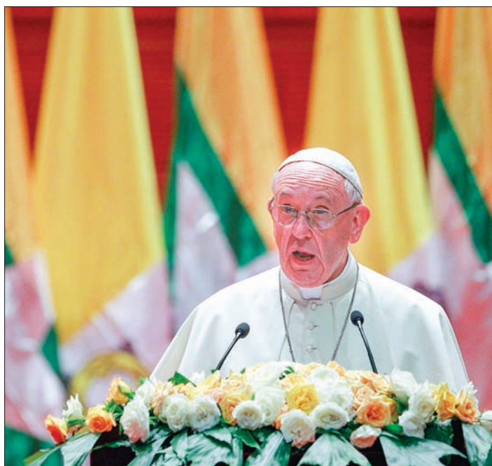
Pope Francis makes a speech during a meeting with members of the civil societies and diplomatic corps in Nay Pyi Taw, on 28 November 2017.

Indeed, the arduous process of peacebuilding and national reconciliation can only advance through a commit-