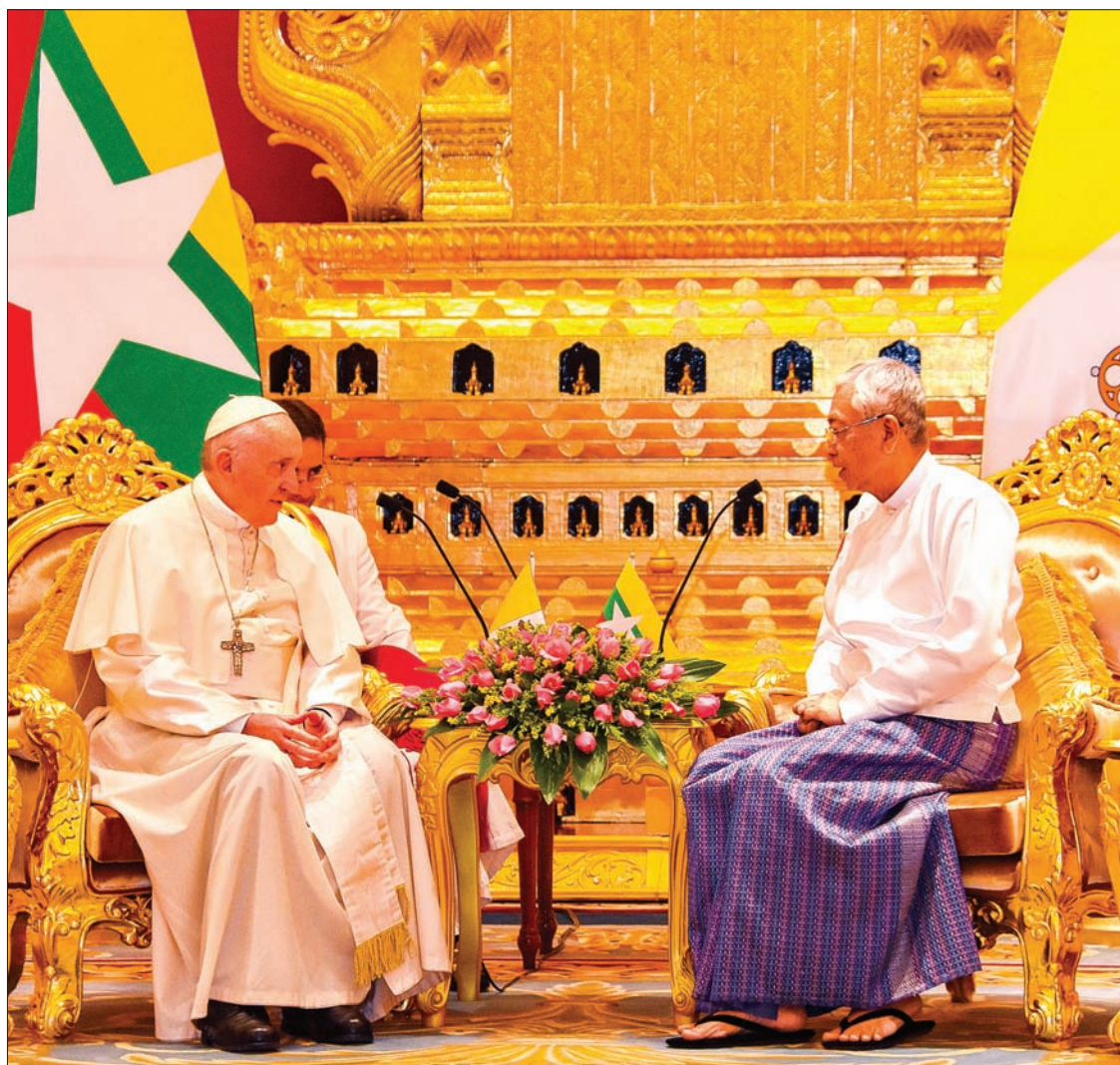
President U Htin Kyaw holds talks with Pope Francis in Nay Pyi Taw on 28 November 2017.

Following the ceremony, President U Htin Kyaw and Pope Francis met in the lounge for envoys of the Presidential Palace.—Myanmar News Agency