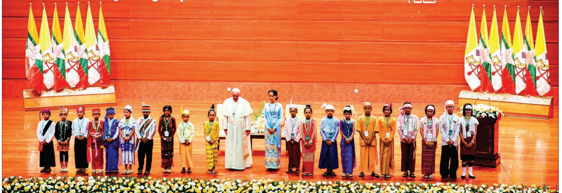
State Counsellor Daw Aung San Suu Kyi and Pope Francis stand on stage with children during a meeting with members of the civil society and diplomatic corps.