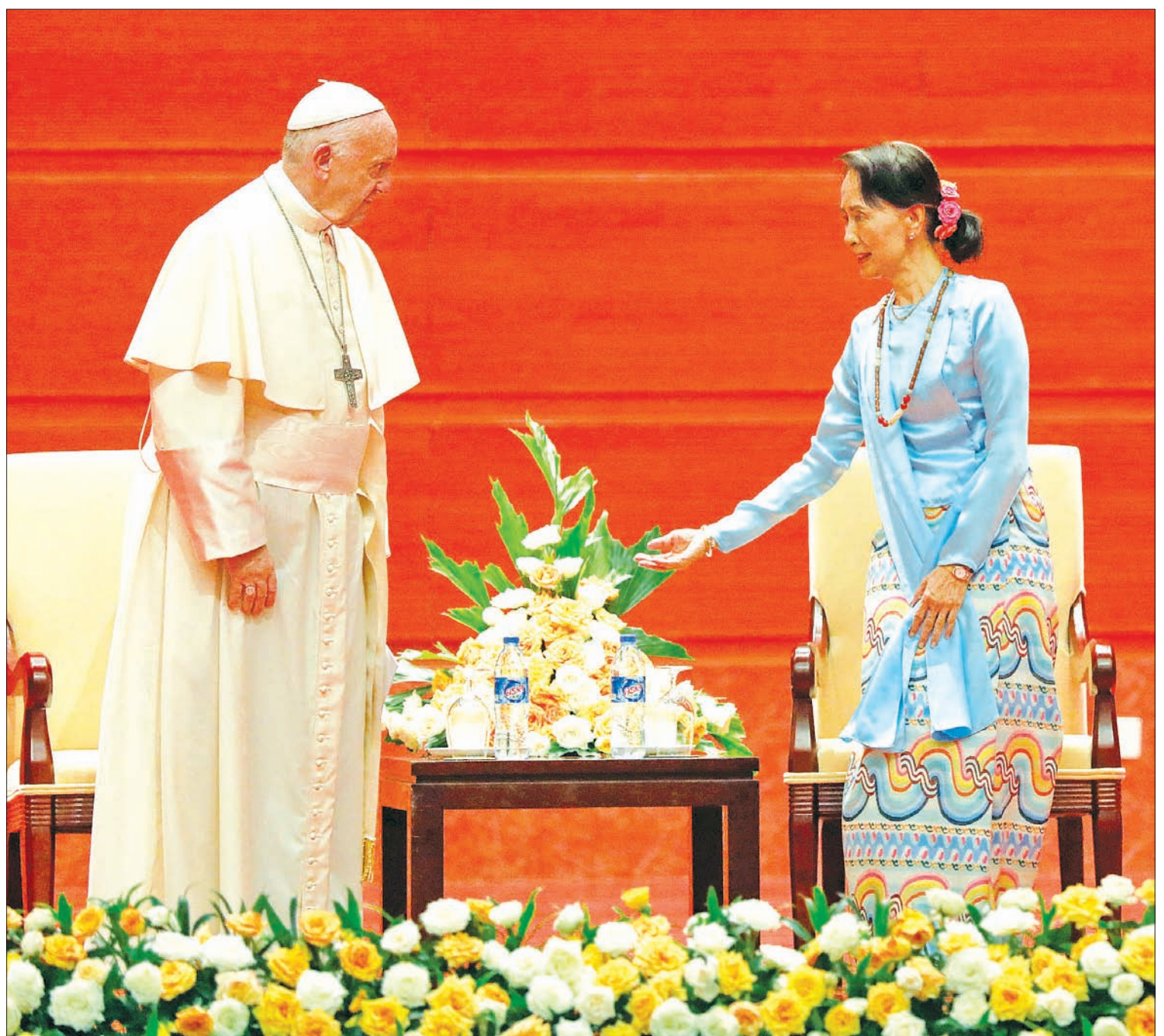
Pope Francis and State Counsellor Daw Aung San Suu Kyi attend the meeting with members of the civil societies and diplomatic corps.