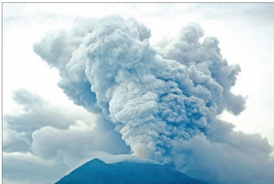
Eruption of Mount Agung as seen from Kubu village in Karangasem, Bali, Indonesia on 28 November, 2017.