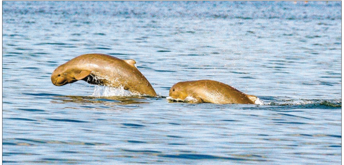
Two Ayeyawady dolphins jump in Ayeyawady River.