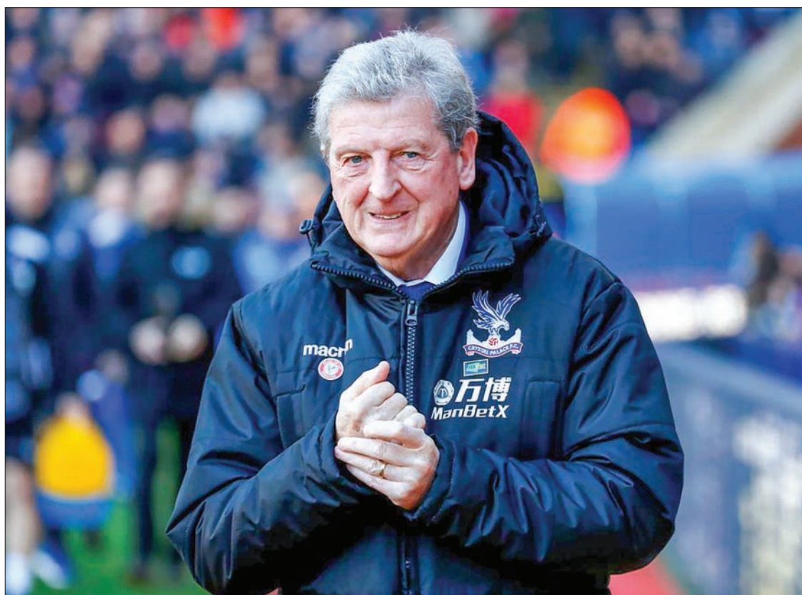
Crystal Palace manager Roy Hodgson.

"I think they are getting some sort of belief that even though we've given ourselves a mountain to climb, there's some chance we'll be able to do that." —Reuters ■