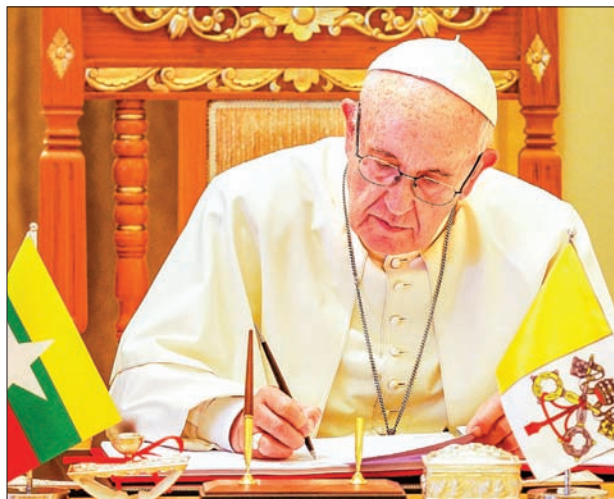
Pope Francis signs a guestbook during a meeting with President U Htin Kyaw at the Presidential Palace in Nay Pyi Taw, on 28 November 2017.