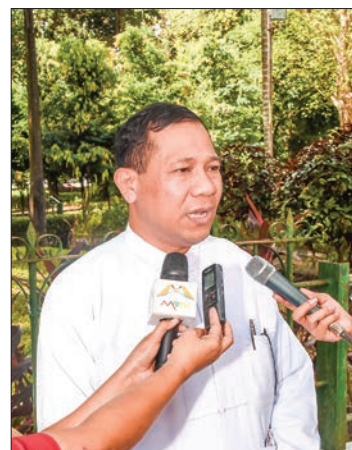
Director-General of IPRD U Ye Naing.

teresting subjects of the IT age are available for youths. As it is a festival it will also be a showcase youths can visit and participate in a joyful atmosphere. Thanks to our arrangements the festival will be a long memory for the