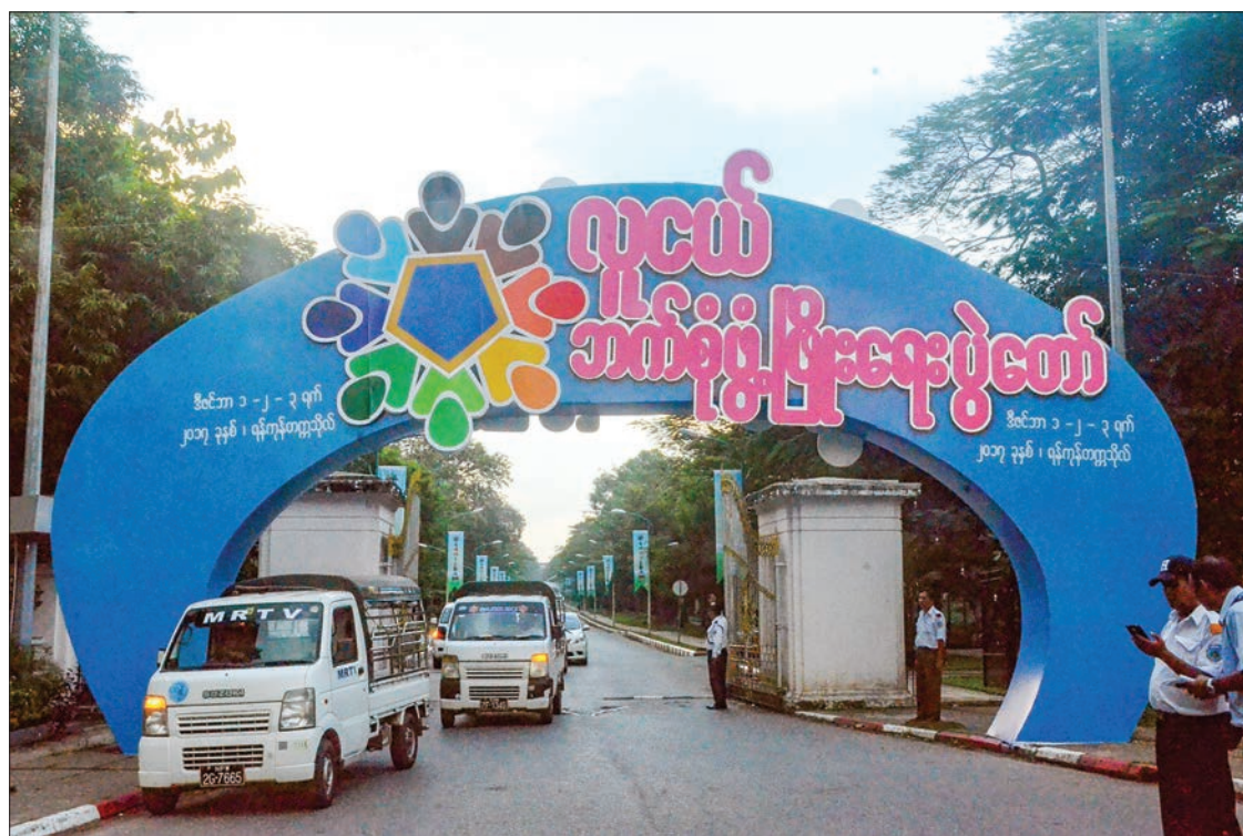
Preparations are under way to hold youth all-round development festival in Yangon University.

Youths of the country are the ones who will shape our future. They should have individual abilities. They should be enlivened with the spirit of developing their own country and community. The festival aims at promoting this spirit and the individual abilities. The festival will serve as a venue where in-