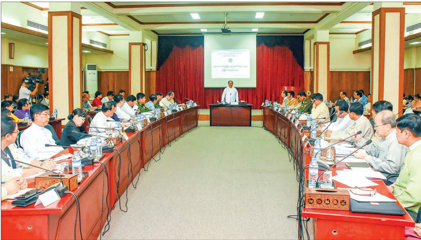
Vice President U Myint Swe delivers address at Coordination meeting of the Leading Committee for celebrating the Youth All Round Development Festival.

with World Political Parties" High-Level Meeting to be held in Beijing and to pay a working visit to strengthen bilateral relations between Myanmar and the People's Republic of China. —Myanmar News Agency ■