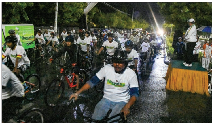
Cycling lists in action at Mandalay's.