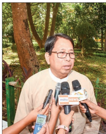
Union Minister for Information Dr Pe Myint.