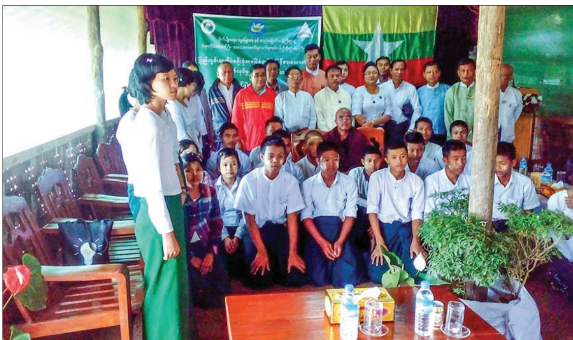
Yetashay disseminates knowledge on value-added products.

Present at the opening ceremony were township's departmental officials, officials from co-operative group, elders of the township, trainees and invited guests. The duration of the course is nine days, from 23 November to 1 December and 20 trainees are now under training. — Maung Shwe Win (Pyay) ■