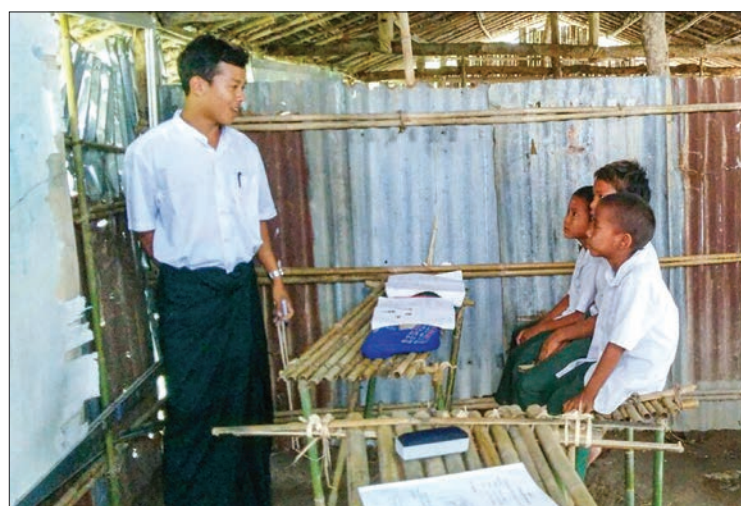
A brave teacher and his three students.

Our Tarein village has opened since October end. I am in Maungtau to present papers. We will not go back home during the December school holidays as we are going to open classes. We will sacrifice our holidays as we want to end the courses in time. Only half of the students come back to school in Tarein. Many of the schools are like that. We found transport and other social needs as the main difficulty of Maungtau region. Despite the hardships, teachers do their work with heart and soul. We were in Tarein during the terrorist attacks. We could not go anywhere till the Tatmadaw came and conveyed us to our relatives in the nearest places. It costs K 15,000 to