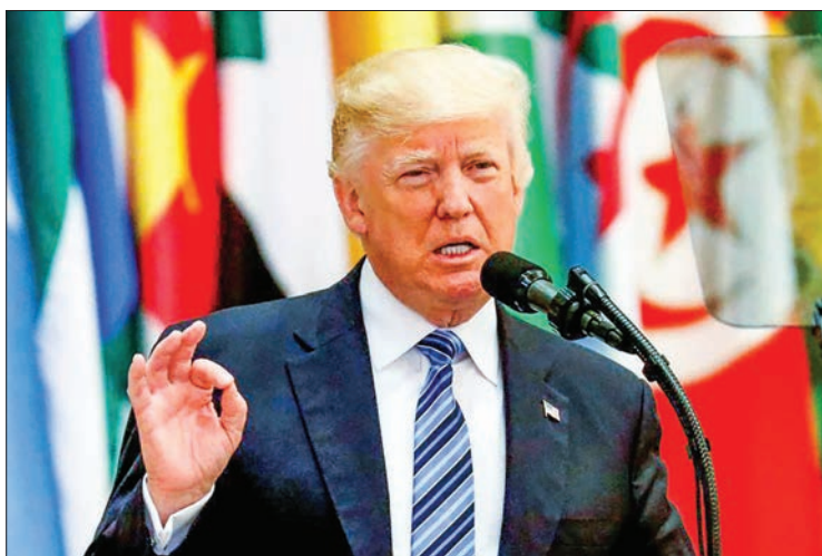
US President Donald Trump delivers a speech during Arab-Islamic-American Summit in Riyadh, Saudi Arabia on 21 May 2017.

On Saturday, Trump tweeted that the CFPB — which has imposed steep penalties on banks, auto dealers, student lenders and credit card companies for predatory lending practices — had “devastated” financial institutions. Democrats and Republicans agree that Trump may nominate a permanent CFPB chief, but they disagree over who may lead the