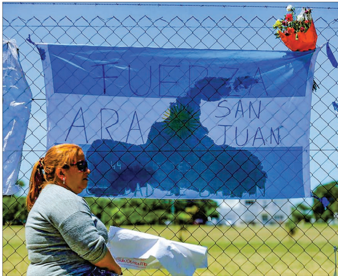
A woman sits next to a banner in support of the 44 crew members of the missing at sea ARA San Juan submarine, outside an Argentine naval base in Mar del Plata, Argentina on 25 November 2017.

The US Navy said it had deployed unmanned underwater vehicles, or "mini-sub"