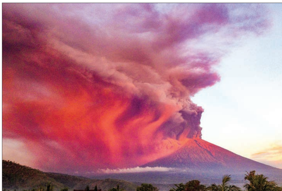
Indonesia's Mount Agung volcano erupts as seen from Amed, Karangasem, Bali, Indonesia on 26 November 2017.

Vulcanologist Simon Carn said on his Twitter account: "Summit glow at #Agung indicates magma likely at or near surface. Satellites also detected thermal anomalies over-