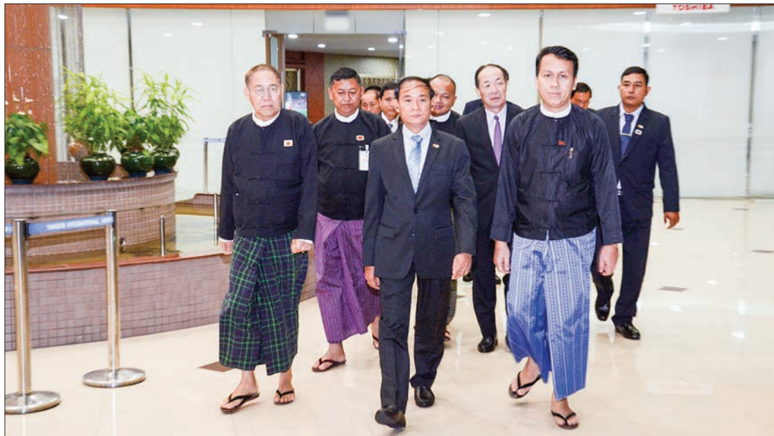
Pyithu Hluttaw Speaker U Win Myint and party being seen off at Yangon International airport.

Pyithu Hluttaw Speaker U Win Myint and party left for Japan yesterday night for friendship tour at the invitation of H.E Mr. Tadamori Oshima, Speaker of the House Representative of Japan.