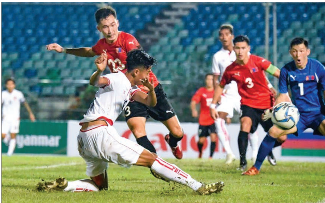
Myanmar attempts to break through Mongolia's defenses.