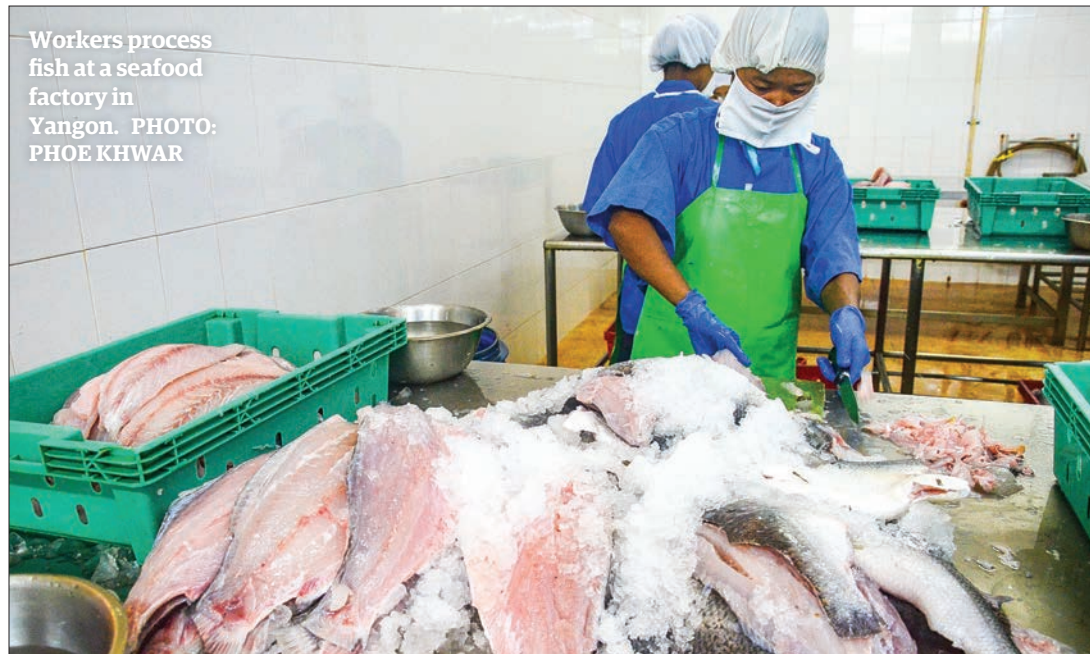
Workers process fish at a seafood factory in Yangon.