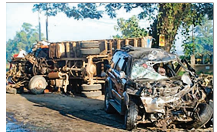
File photo taken the damaged luxury car after collision.

Those were treated for minor injuries. Action is being taken against the drivers for reckless driving under Section 337/338/304 (a).—Ko Lwin (Swa) ■