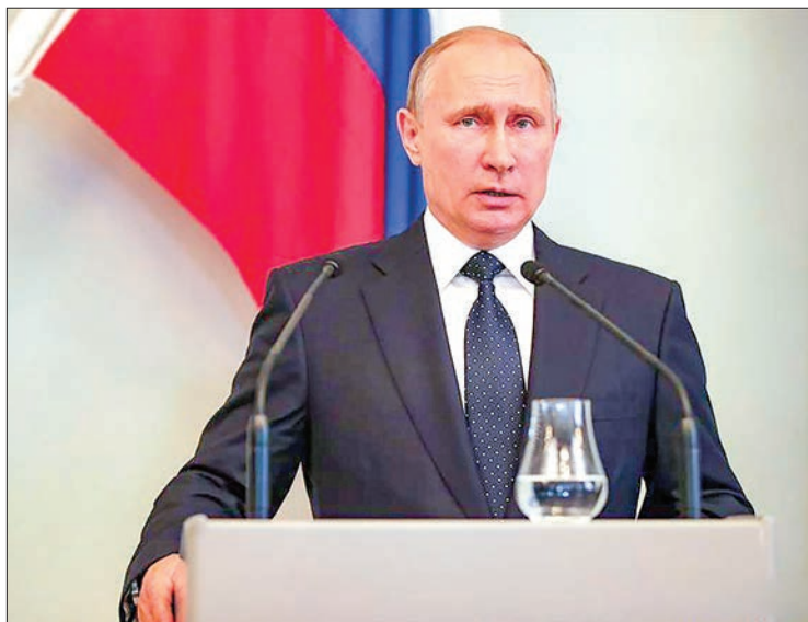
Russian President Vladimir Putin.

The law was enacted after Russia's state-owned English news channel RT America was forced to register as a foreign agent in the United States by the Department of Justice under its