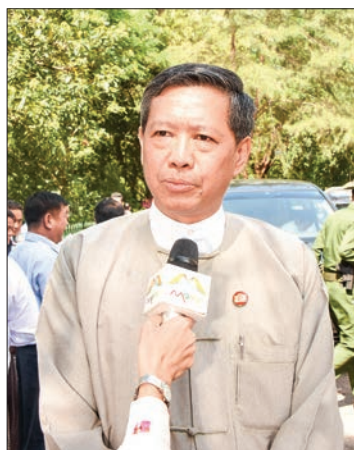
Union Minister for Education Dr Myo Thein Gyi.