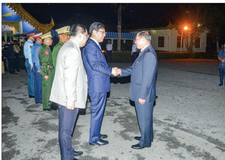
Senior General Min Aung Hlaing being welcomed back at Yangon International Airport.

Then, they arrived at Shenzhen Museum and looked around the booths showing the development stages of the city. The Senior General arrived back Yangon in the evening and was welcomed by Commander of the Yangon