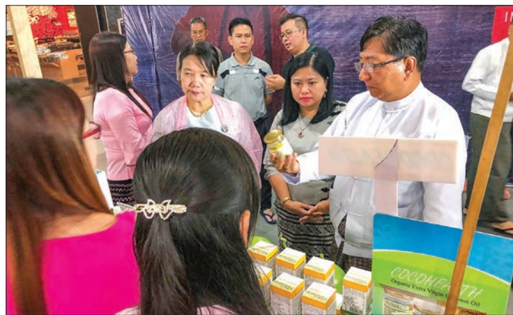
5th Pride of Myanmar programme in progress.

taste and packing design which can be showcased to the world. Customers who love local snacks would be very happy because of the 5 th time Pride of Myanmar Promotion along with exclusively selected Myanmar Products showcasing at all our branches. The Special Promotion of 5 th Pride of Myanmar programme 2017-2018 will be launched starting from 26th November 2017 to 28 February 2018. All the interestees are being invited to come and test the favourite local snacks.—