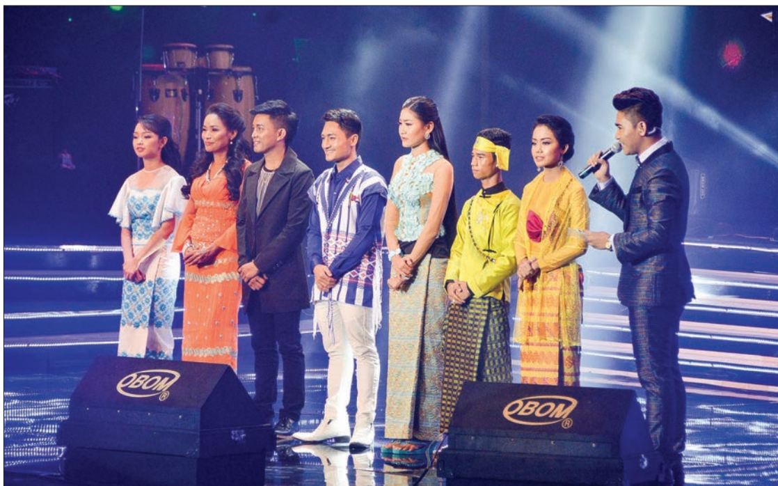
Presenter and the participants at the Peace Music Festival.

peted last night with a song which is particularly composed for the Peace Music Festival.