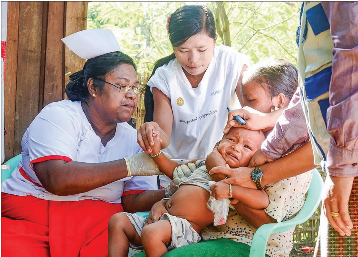
A child in a rural area of Rakhine State is vaccinated by a nurse who is part of a mobile team administering vaccinations nationwide.