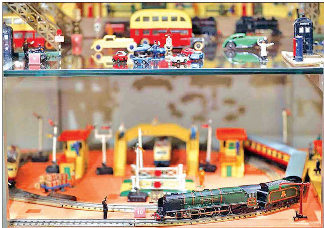
Photo taken on 11 November, 2017 shows toys on display at the Benaki Museum of Toys in the southern suburb of Athens, Greece.

“A miniature set of living room furniture made of cheap wood that a mother made for her daughter’s birthday during the Nazi occupation (in the 40s)... She brought it to us herself and she told us its story. This toy has a special significance for us,” she told Xinhua. —Xinhua ■