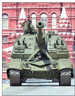
Koalitsiya-SV self-propelled tracked howitzer.