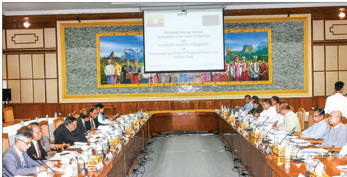
Union Minister for the Office of the State Counsellor U Kyaw Tint Swe holds talks with Bangladesh delegation led by Bangladesh Foreign Minister Mr. Abdul Hassan Mahmood Ali in Nay Pyi Taw.

U Kyaw Tint Swe, Union Minister for the Office of the State Counsellor, hosted a dinner at 1900 hrs in honour of visiting Foreign Minister of Bangladesh at Shwe San Eain Hotel in Nay Pyi Taw. —Ministry of the Office of the State Counsellor ■