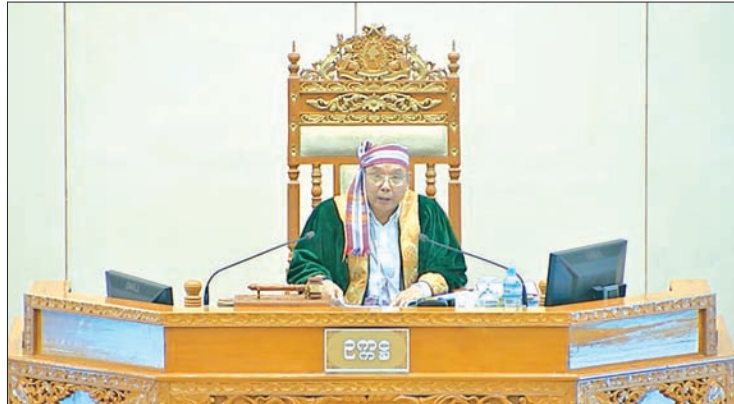
Amyotha Hluttaw Speaker Mahn Win Khaing Than.

Mya Min Swe of constituency 9 in Magway Region supported, followed by the approval of the bill from the Amyotha Hluttaw.