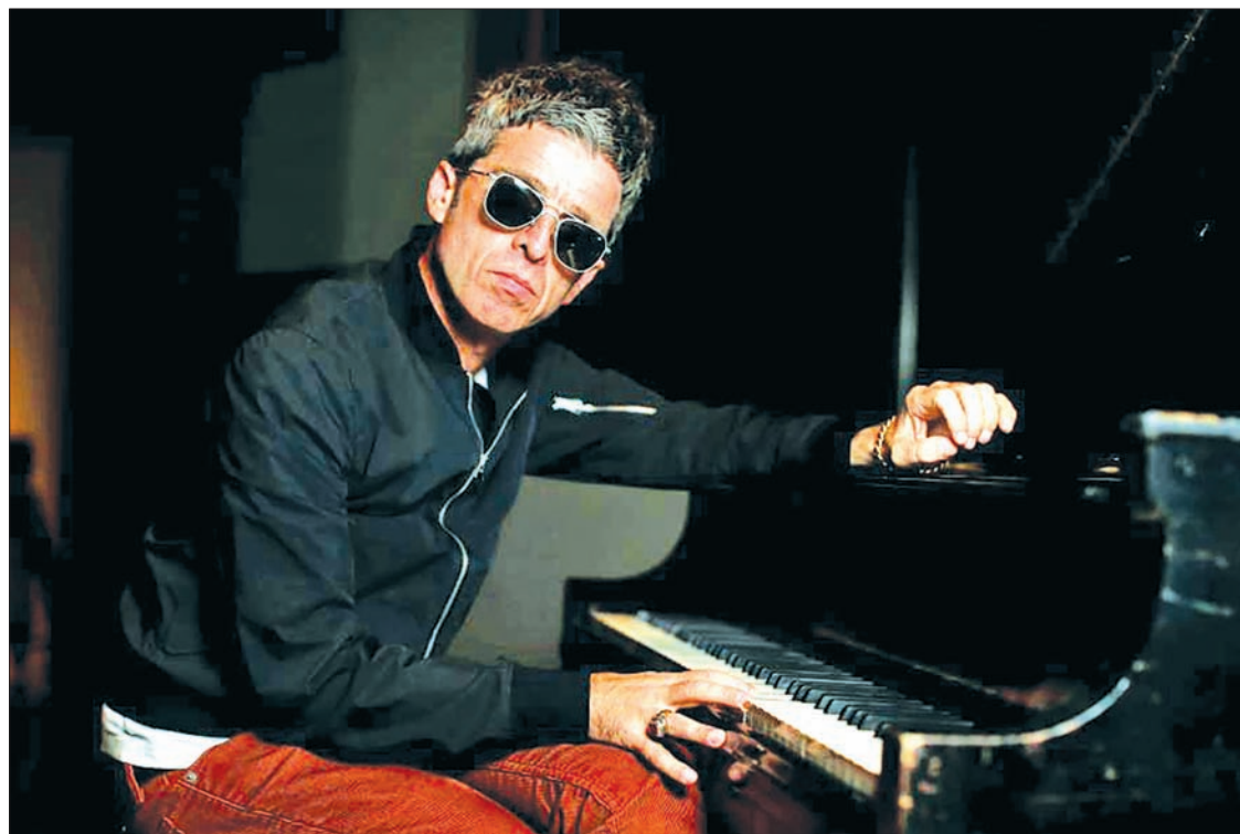
Musician Noel Gallagher poses for a portrait while promoting his upcoming album “Who Built The Moon?” in Los Angeles, California, US, on 29 September 2017.

rockers Oasis broke up in bitterness between Gallagher and his younger brother Liam, Gallagher claims all the credit for the band’s enduring legacy.