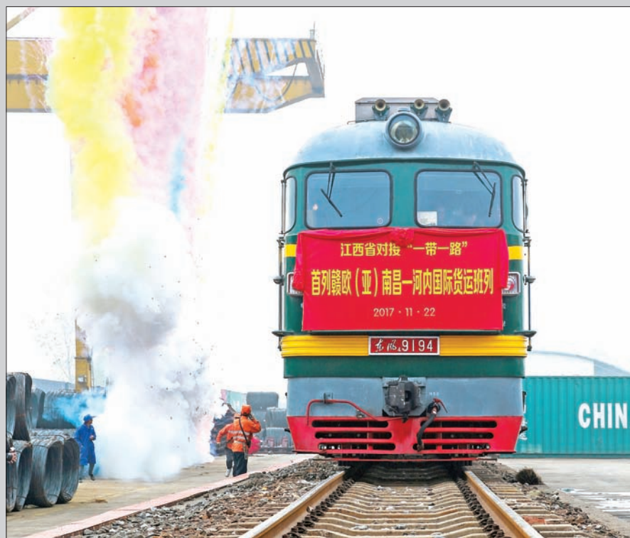
A freight train linking China's Nanchang and Viet Nam's Hanoi departs Henggang railway station, marking the launch of the service, in Nanchang, China on 22 November, 2017.

Though new investment from China softened the blow, most of Zimbabwe's 16 million people remain poor, squeezed by chronic currency shortages and sky-high unemployment.—Reuters ■