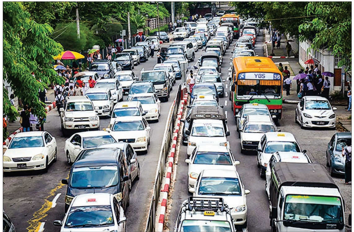
Vehicles are seen in a traffic jam on a road in Yangon.

only cars with left-hand drive are allowed to import into the market.