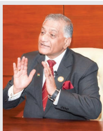
Mr. Vijay Kumar Singh, India's Minister of State for Foreign Affairs.

A: As I see, there are small businesses run by people here that can be boosted. Similarly in India we have what we call the MSME (Micro and Small and Medium Enterprises) sector or the Micro and Small Industry Sector; these are small units in manufacturing or something similar, and they do not require