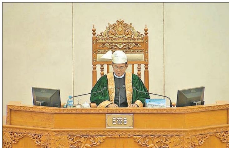
Pyithu Hluttaw Speaker U Win Myint.

U Tun Tun Naing of Kani constituency put forward a motion to urge the Union Government for scrutiny committee on confiscated farming lands to settle disputes between original farmers and those who monopolized empty, virgin and va-