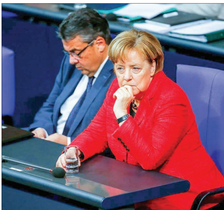
German Foreign Minister Sigmar Gabriel and Chancellor Angela Merkel are seen during a session of the Bundestag in Berlin, Germany on 21 November, 2017.

Merkel's bid to forge a three-way alliance with the pro-business Free Democrats and the environmental Greens collapsed on Sunday, raising the prospect