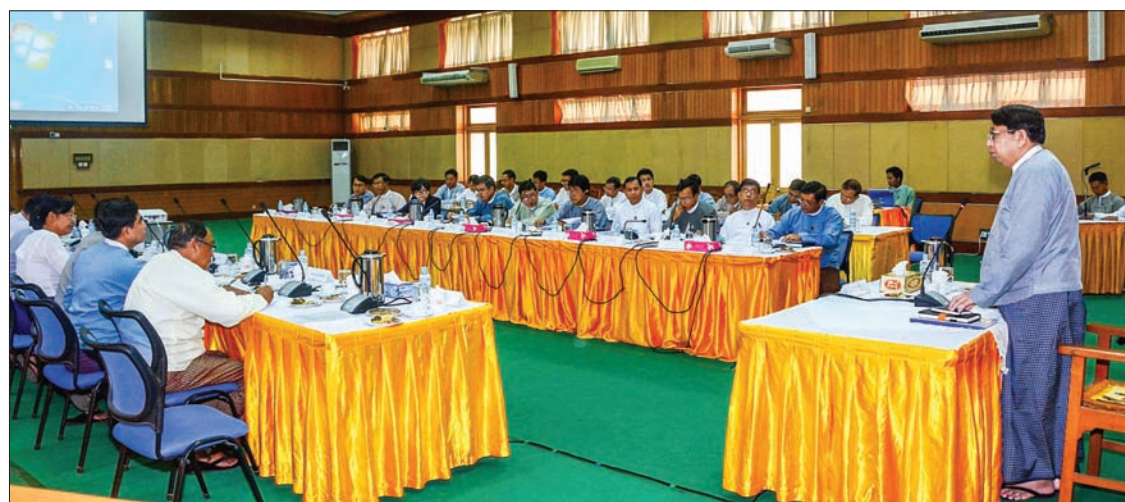
Union Minister Dr Pe Myint delivers the speech at the youth multi-development festival coordination meeting.

The coordination meeting for convening a youth multi-development festival was held at the meeting hall of the Ministry of Information in Nay Pyi Taw yesterday.