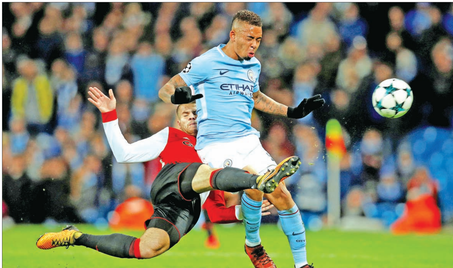
Manchester City's Gabriel Jesus in action with Feyenoord's Bart Nieuwkoop during the Champions League at Etihad Stadium in Manchester, Britain on 21 November, 2017.

LONDON — Manager Pep Guardiola is calm about Manchester City's potential opponents in the Champions League