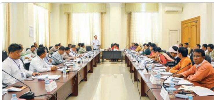
Participants discuss upgrading the capacity of Hluttaw and its result in Nay Pyi Taw.

Chairman of cooperation committee for the development of the Hluttaw, a delegation led by Pyithu Hluttaw Deputy Speaker U T Khun Myat, international organisations including UNDP and IPU and the representatives from donor countries: Australia,