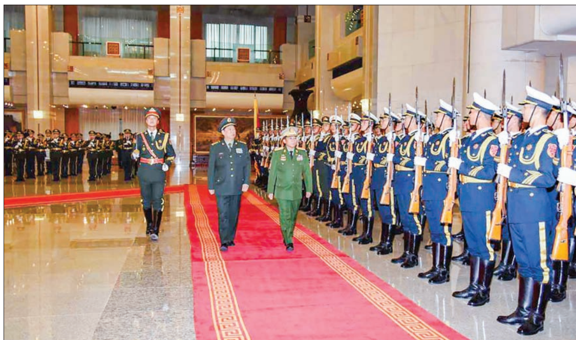
Senior General Min Aung Hlaing inspects the Honour Guard as he arrives Nanyuan, China.

Then, Senior General rendered presents to officials' families of the Embassy and Military Attaché and trainees. —Myanmar News Agency ■