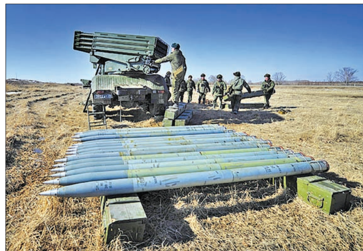
Tornado-G multiple rocket launcher system.

According to data of Russia's Defense Ministry, Russia's missile and artillery troops are expected to have three types of highly mobile brigades — missile, rocket artillery and artillery units with increased combat capabilities exceeding the 2016 potential by 1.5-2 times. —Tass ■