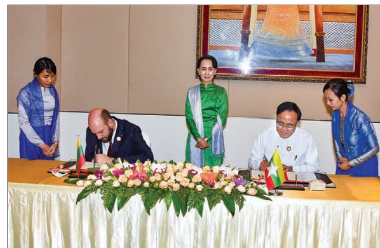
U Kyaw Tin and Lithuania Deputy Foreign Minister signed MoU for between the Ministry of Foreign Affairs of the two countries.