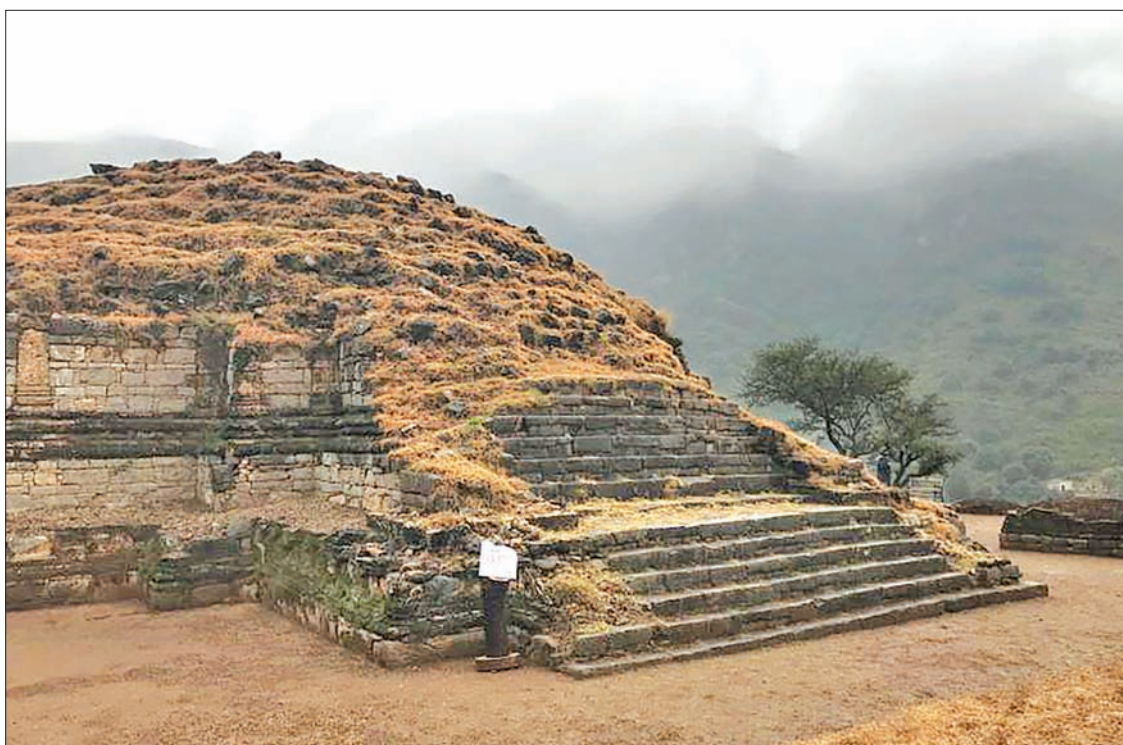
A general view of main stupa, is seen after it was discovered and unveiled to the public, during a ceremony at the Buddhist-period archeological site near Haripur, in Khyber Pakhtunkhwa (KPK) province, Pakistan on 15 November, 2017.

But recent attempts to improve Pakistan's image have included overtures to minority