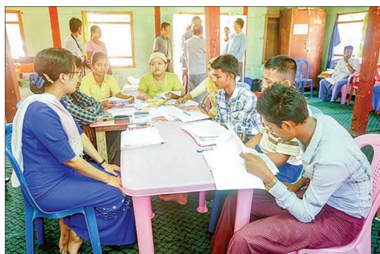
A class in session in Basic Education High School in Thetkel Pyin village.