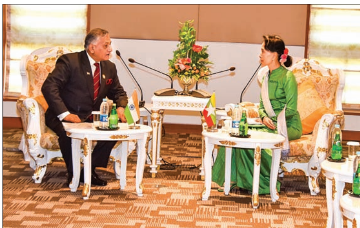
State Counsellor holds talks with Mr. Vijay Kumar Singh of Affairs Ministry of External Affairs in India.