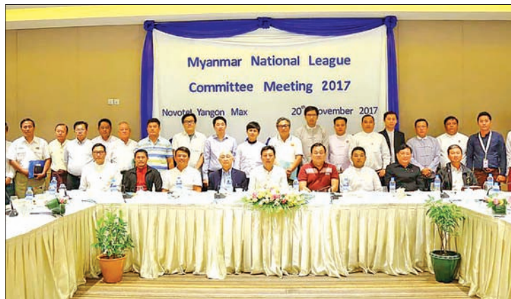
The MNL Committee Meeting 2017 attendees have the photo taken at Novotel Yangon Max on 20 November.

The CEO of MNL then explained the status of 2017 MNL,