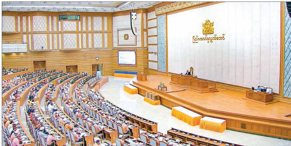
Pyidaungsu Hluttaw is being convened in Nay Pyi Taw.