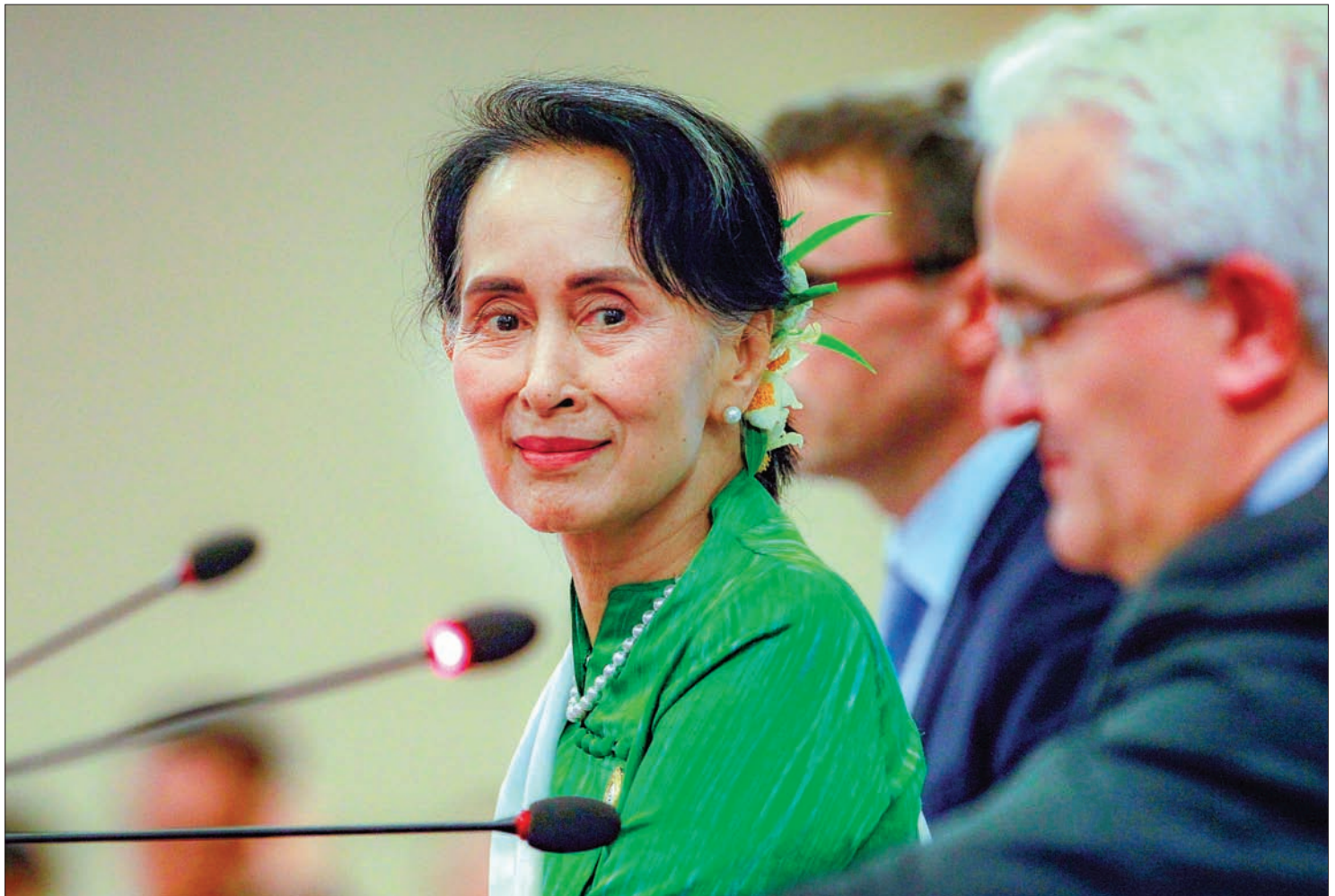
State Counsellor Daw Aung San Suu Kyi at a news conference held yesterday at the conclusion of the ASEM FMM.