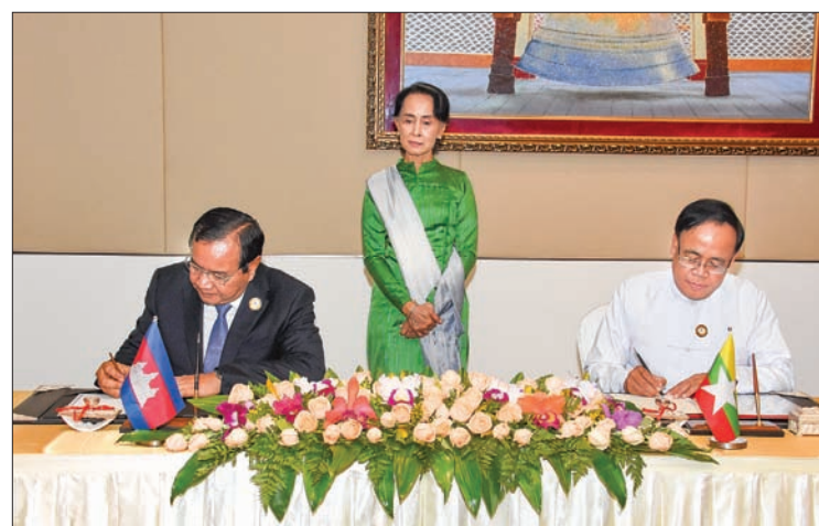
U Kyaw Tin and Cambodian Foreign Minister signing MoU for between the Ministry of Foreign Affairs of the two countries.

bilateral cooperation. After that, Minister of State for Foreign Affairs U Kyaw Tin and H.E. Mr Prak Sokhonn Minister of Foreign Affairs and International Cooperation of the Kingdom of Cambodia signed MoU of Between the Ministry of Foreign Affairs of the Republic of the Union of Myanmar and the Ministry of Foreign Affairs and International Cooperation of the Kingdom of Cambodia on Political Consultations.— Myanmar News Agency ■