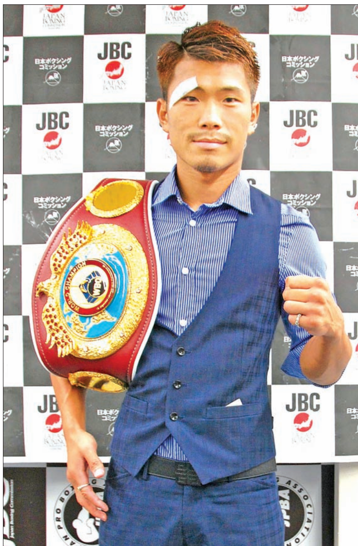
WBO flyweight champion Sho Kimura poses with his title belt in Tokyo on 4 August, 2017, after beating Chinese champion Zou Shiming. Kimura will make his first title defence on New Year's Eve.

Igarashi is a former WBC flyweight champion and is getting his first title shot since losing the belt to Akira Yaegashi in April 2013. Kimura, who holds a 15 win, one loss, two draw record with eight knockouts, upset two-time Olympic gold medalist Zou Shiming of China in Shanghai in July, scoring an 11 th -round knockout to snatch the WBO flyweight title.—Kyodo News ■