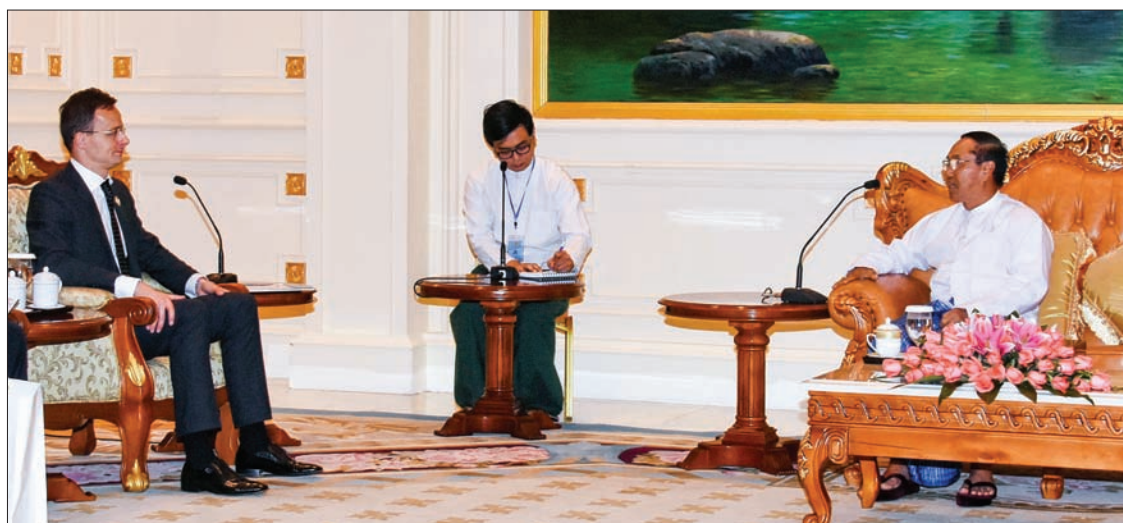
Vice President U Myint Swe meets Hungary Minister of Foreign Affairs in Nay Pyi Taw.

Present at the meeting were Union Minister Dr. Than Myint, Deputy Minister U Win Maw Tun, and officials. — Myanmar News Agency ■