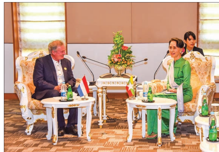
State Counsellor Daw Aung San Suu Kyi receives Mr. Jean Asselborn, Minister for Foreign and European Affairs, Luxembourg.