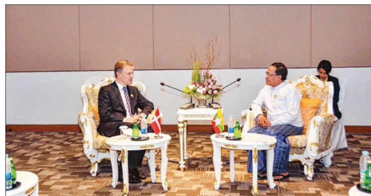
Minister of State for Foreign Affairs U Kyaw Tin holds talks with Denmark State Secretary for Foreign Policy.