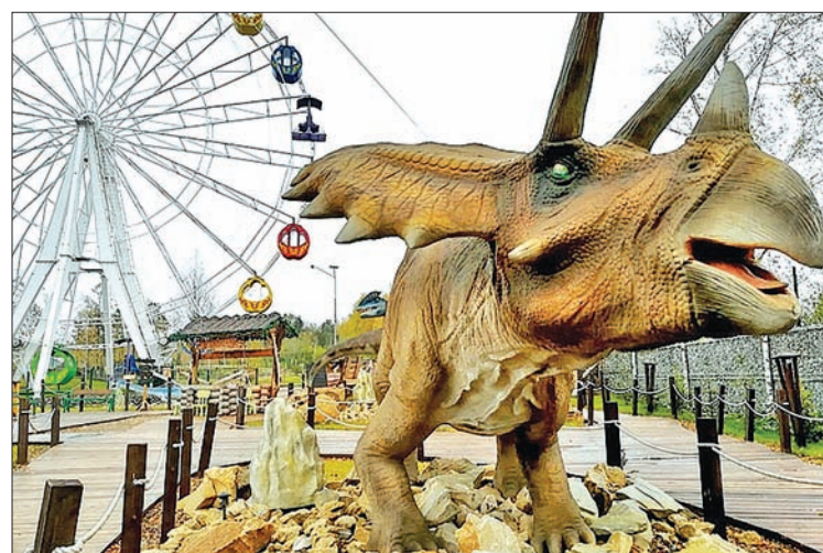
The first two skeletons of the ancient reptiles were unearthed near Kotelnich in 1933.