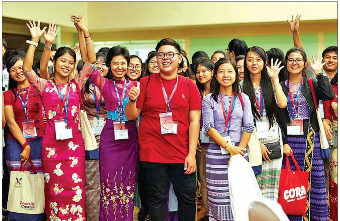
Youths can apply for the Education Programmes of ASEF.

"One representative from each partnership countries is being chosen. Arrangements will be made for bed and board of every representative by the foundation. A person who will represent for Myanmar will be chosen, hence the chance for youths to apply. Arrangements for application will be described in the Facebook page of ASEF—ASEFedu. In cooperation between ASEF and the Ministry of Education, Myanmar, 8th Model ASEM was held just prior to the ASEM Foreign Ministers' Meeting. Based on the meeting, it has been arranged for youths rep-