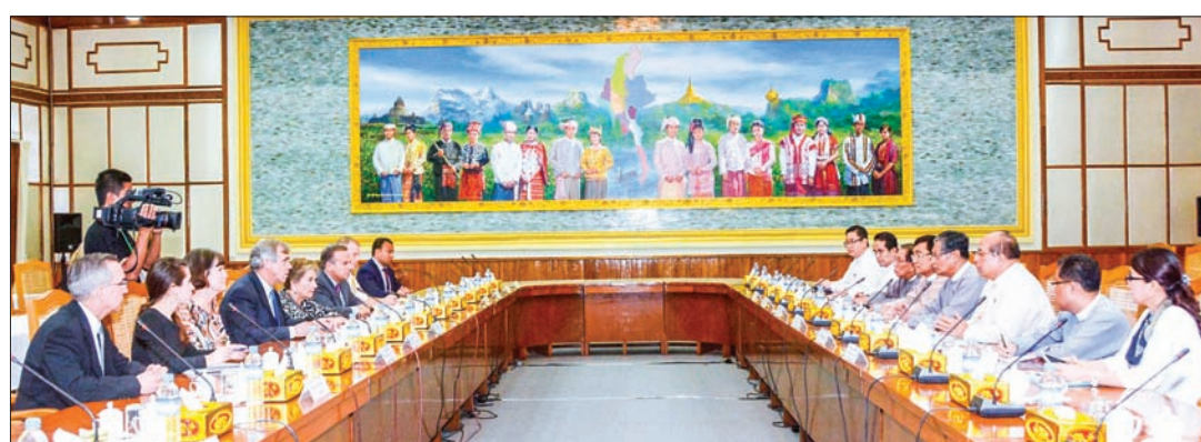
Union Minister for the office of the State Counsellor U Kyaw Tint Swe holds talks with a delegation led by American Congressional Delegation led by Senator Jeff Merkley.

Thet, and officials from the Ministry of the Office of the State Counsellor, Ministry of Foreign Affairs, and Ministry of Social Welfare, Relief and Resettlement, as well as the U.S Ambassador to Myanmar H.E. Mr. Scot Marciel and Congressional delegates.—MNA■