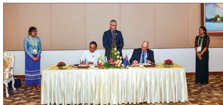
Minister of State for Foreign Affairs U Kyaw Tin and New Zealand Parliamentary Under-Secretary sign MoU for Foreign Ministries of the two countries.

10:30 a.m., Latvia State Secretary for Foreign Affairs H. E. Mr. Andrejs Pildegovics and party at noon, Republic of Korea Vice Minister of Foreign Affairs H.E. Mr. Lim Sung-nam and party at 1:30 p.m., Russian Federation Deputy Minister for Foreign Affairs H.E. Mr. Igor V. Morgulov and party at 2 p.m. and Hungary Minister for Foreign Affairs and Trade H.E. Mr. Peter Szijjarto at 3:50 p.m. and discussed increasing bilateral relations, increasing cooperation and exchanged views on the status of events in Rakhine State. —Myanmar News Agency ■