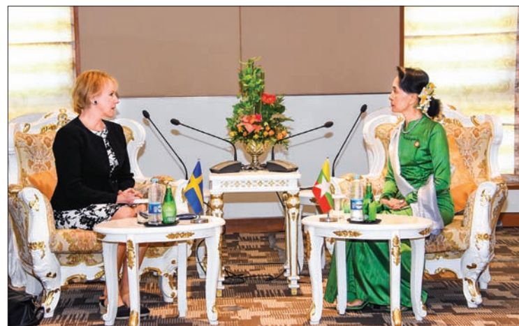
State Counsellor Daw Aung San Suu Kyi meets Minister for Foreign Affairs of Sweden Mrs. Margot Elisabeth Wallström.