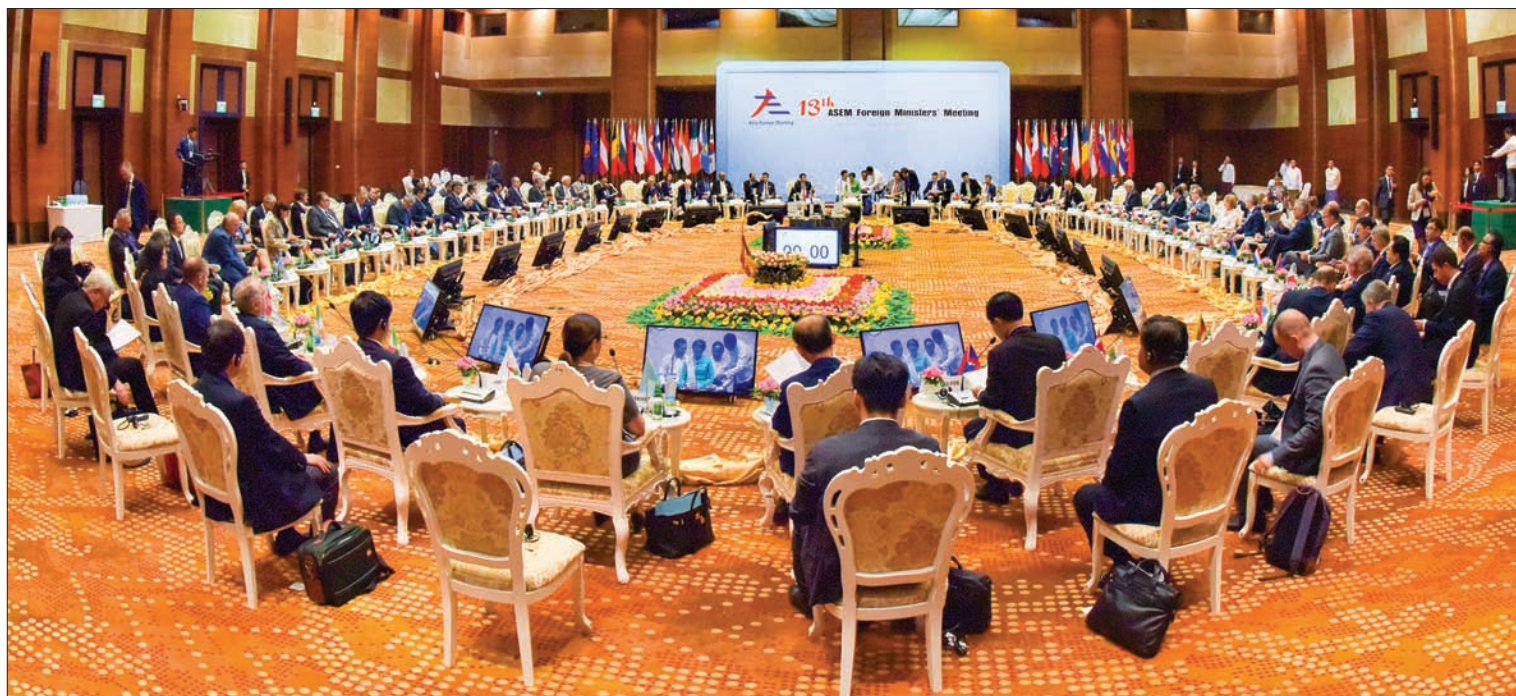
The 13 th ASEM Foreign Ministers' Meeting concludes at MICC-1 Padamya Hall in Nay Pyi Taw on 21 November 2017.

Turning to the question of repatriation of the Muslims in northern Rakhine, Daw Aung San Suu Kyi said discussions would be held with the Bangladesh foreign minister tomorrow and Thursday. Officials from both countries began discussions last month on