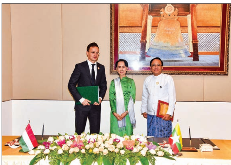
State Counsellor Daw Aung San Suu Kyi, Minister of State for Foreign Affairs U Kyaw Tin and Hungary's Foreign Minister pose for documentary photo after signing MoU.

During the meeting, they exchanged views to promote the Myanmar-Hungary bilateral relationships in cooperation and potential cooperation for Rakhine State. After the meeting, Minister of State for Foreign Affairs U Kyaw Tin and H.E. Mr. Peter Szijjarto Hungary's Minister of Foreign Affairs and Trade signed the MoU which includes Between the Ministry of Foreign Affairs of the Republic of the Union of Myanmar and Minister of Foreign Affairs of Hungary on Political Consultations. Then, State Counsellor Daw Aung San Suu Kyi received H.E Mr. Darius Skusevicius Deputy Foreign Minister of Lithuania and exchanged views for Myanmar-Lithuania bilateral relationships in cooperation and potential cooperation for Rakhine State. After the meeting, Minister of State for Foreign Affairs