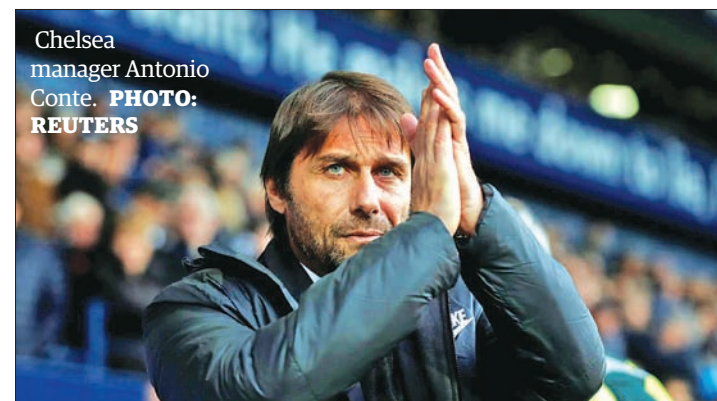
Chelsea manager Antonio Conte.