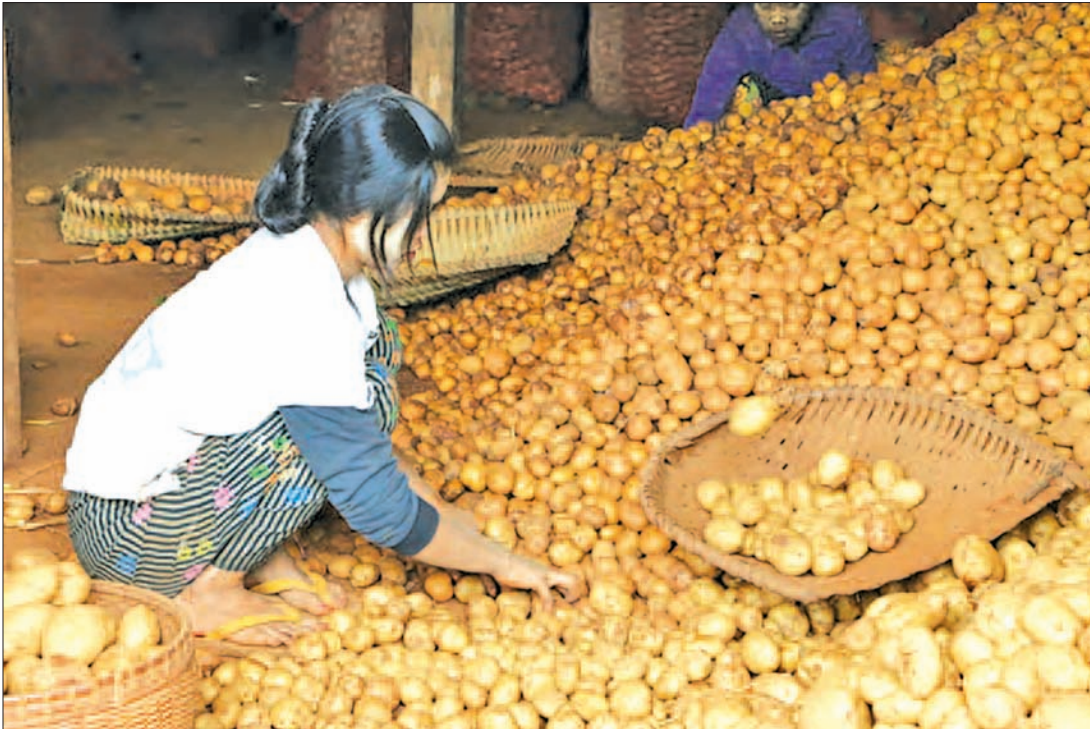
Farm worker sorts potatoes during harvest.