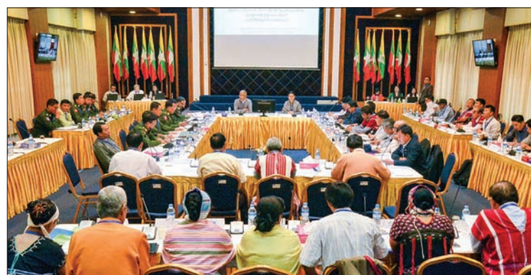
The second day of 13 th Union Joint Monitoring Committee meeting in progress in Yangon.

THE second day of the 13 th Union Joint Monitoring Committee (JMC-U) meeting was held yesterday morning at the Yangon office of the National Reconciliation and Peace Centre on Shweli Road in Kamayut Township, Yangon.