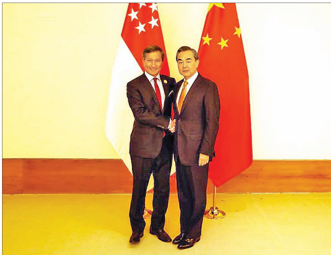
Chinese Foreign Minister Wang Yi (R) meets with his Singaporean counterpart Vivian Balakrishnan on the sidelines of the 13 th foreign ministers' meeting of the Asia-Europe Meeting (ASEM), in Nay Pyi Taw, Myanmar on 20 November, 2017.

said Singapore is ready to work with China to bring the all-around pragmatic cooperation between the two countries to a new high and consolidate the