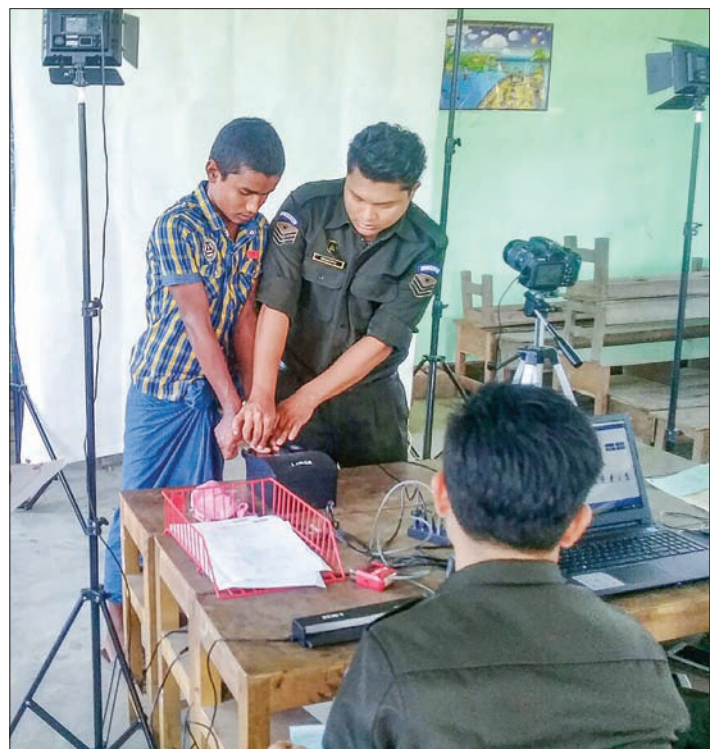
Staff scans finger print for register with biometrics identification were issued National Verification Cards.

This effort was started in Maungtaw Township, Shwezar village tract on 12 October and so far, after scrutiny with a Biometric system, 787 people, including 463 men and 324 women, were issued National Verification Cards. The information of 46 people, including 25 men and 21 women, were recorded in preparation for issuance of an NV Card. — Myanmar News Agency ■