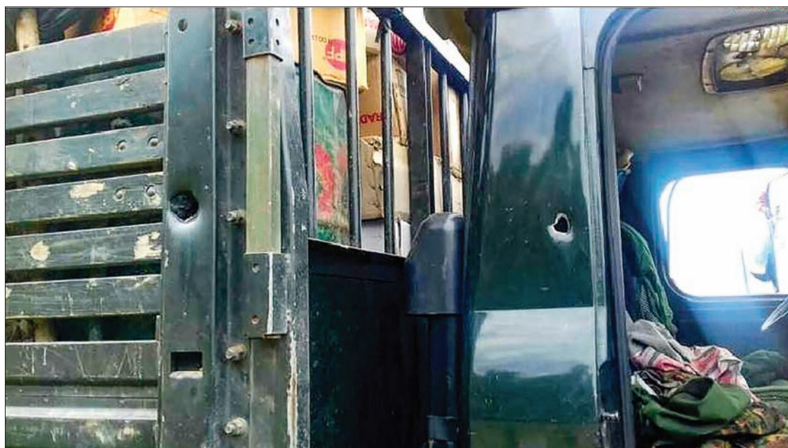
The car damaged by mine explosions on Yangon-Sittway Road.