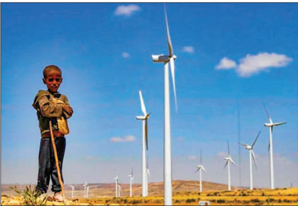
A boy stands in front of wind turbines near a village in Tigray, Ethiopia, in a file photo.

CAPE TOWN—Strong demand is set to give a huge boost to renewable energy growth in Sub-Saharan Africa over the next five years, driving cumulative capacity up more than 70 per cent, a senior international energy official said on Wednesday. From Ethiopia to South Africa, millions of people are getting access to electricity for the first time as the continent turns to solar, wind and hydropower projects to boost generation capacity. “A big chunk of this (growth) is hydro because of Ethiopia, but then you have solar ... in South Africa, Nigeria and Namibia and wind in South Africa and Ethiopia as well,” said Paolo Frankl, head of the renewable division at the Paris-based International Energy Agency (IEA). He forecast installed capacity of renewable energy in the Sub-Saharan region almost doubling from around 35 gigawatts now to above 60 GW given the right conditions. Ethiopia has an array of hydropower projects under construction, including the $4.1 billion Grand Renaissance Dam along the Nile River that will churn out 6,000 MW upon completion. That is enough for a good-sized city for a year. “Africa has one of the best potential resources of renewables anywhere in the world, but it depends very much on the enabling framework, on the governance and the right rules,” Frankl told Reuters on the sidelines of a wind energy conference.