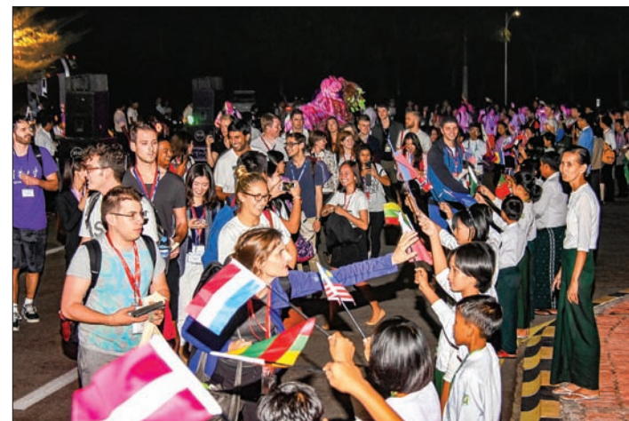
International students arrive at Mingalar Thiri Hotel, Nay Pyi Taw on 16 November to attend 8th Model ASEM 2017.

The Asia-Europe Meeting was created in 1996 as a forum for dialogue and cooperation between Europe and Asia.—china.org ■