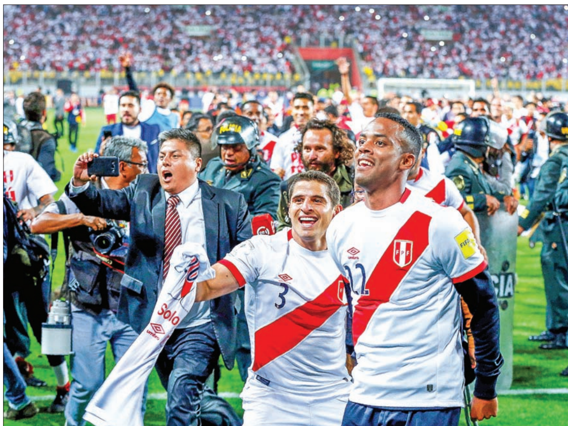
Peru's players celebrate their victory after 2018 World Cup Qualifying Playoffs at National Stadium, Lima, Peru, on 15 November 2017.

Playing the back nine first, Matsuyama jump-started his round with a 30-foot eagle putt at the par-five 18th, where he read the green perfectly and curled a sharply-breaking putt into the middle of the cup. —Reuters ■