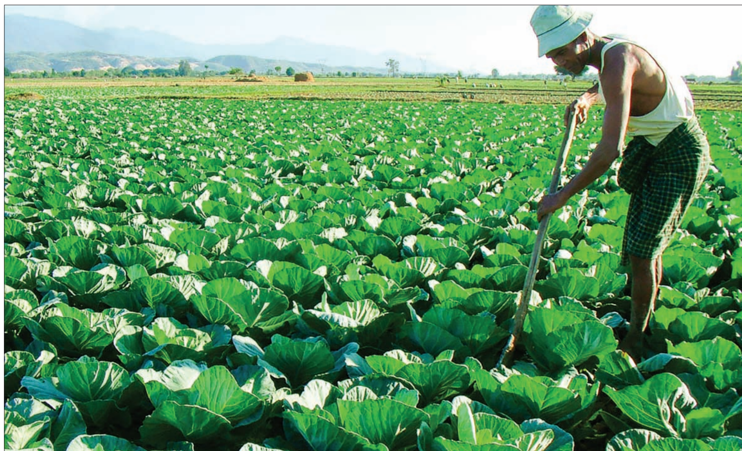
A farmer works at a cabbage farm near Nay Pyi Taw.

Department of Agriculture of the Ministry of Agriculture, Livestock and Irrigation in co-