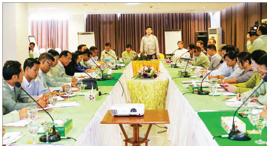
Forest Department Director General Dr Nyi Nyi Kyaw delivers the opening speech at the ceremony of marine conservation policy workshop held in Nay Pyi Taw.

State-level policy on marine and coastal regions that will result from yesterday's workshop will support the pledges made in international circles on extending the marine and coastal nature conservation areas. Most importantly, the marine conservation policy drawn up must be not for conservation and protection sector only but encompasses the three sectors of conservation, protection and sustainable usage, experts said.—Myanmar News Agency ■