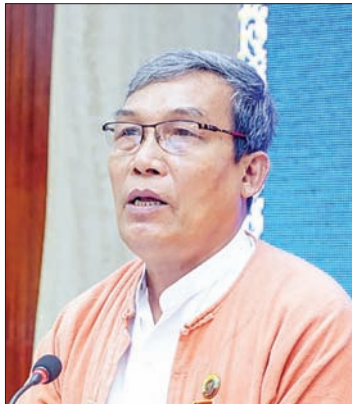
U Nyi Pu, Chief Minister of Rakhine State speaks at the interview.

ed Ks10 million with Ks21 million donated by MKSH. The amount will be just normal for support of Rakhine State. In fact, the State must spend as many billions for the whole project. We joined the project as a grain of sand and a piece of brick in building the nation together with the Union Government. Maungdaw is a region which is greatly in need of infrastructures. Transportation and living standard conditions are very poor in this area. People from remote areas are very poor, especially villages where the Mro, Thet, Daingnet, Khami and others are living. Only if we collectively contribute can their living standards be upgraded. We assume that it is incumbent upon us to do so, that is 50 mil-