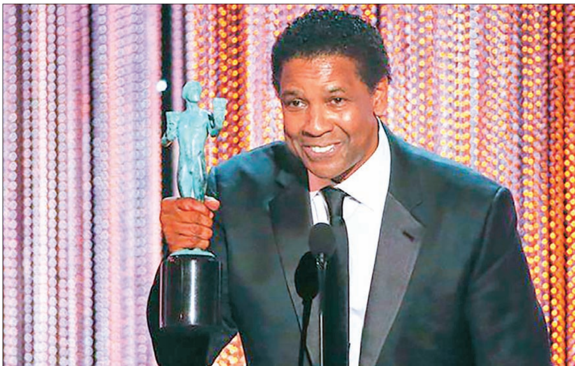
Oscar-winning actor Denzel Washington .

"Our prison system needs reform at a fundamental level. We have the highest incarceration rate of any place in the Western world ... It's not racially equal, it's not socio-economically equal," he said. —Reuters ■