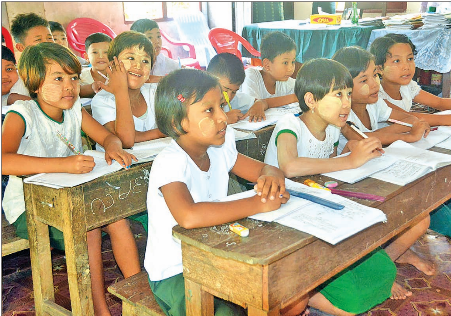
Students go to school in Maungtaaw as stability returns to normalcy in Maungtaaw, northern Rakhine State.