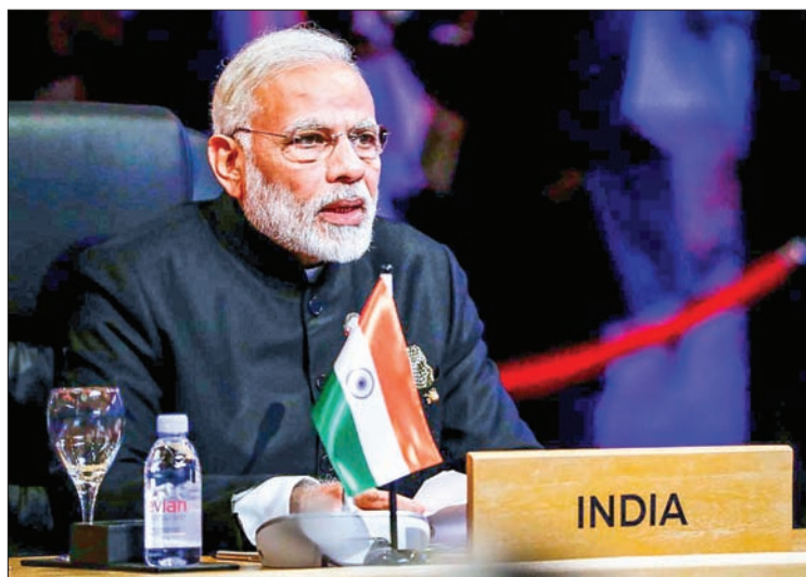
India's Prime Minister Narendra Modi participates in the opening session of the 15 th ASEAN-India Summit at the Philippine International Convention Center in Manila, Philippines, on 14 November 2017.

NEW DELHI — Nearly nine out of 10 Indians hold a favourable opinion of Prime Minister Narendra Modi and more than two-thirds are satisfied with the direction he is taking the country, a Pew survey has found, two years before he heads into a general election.