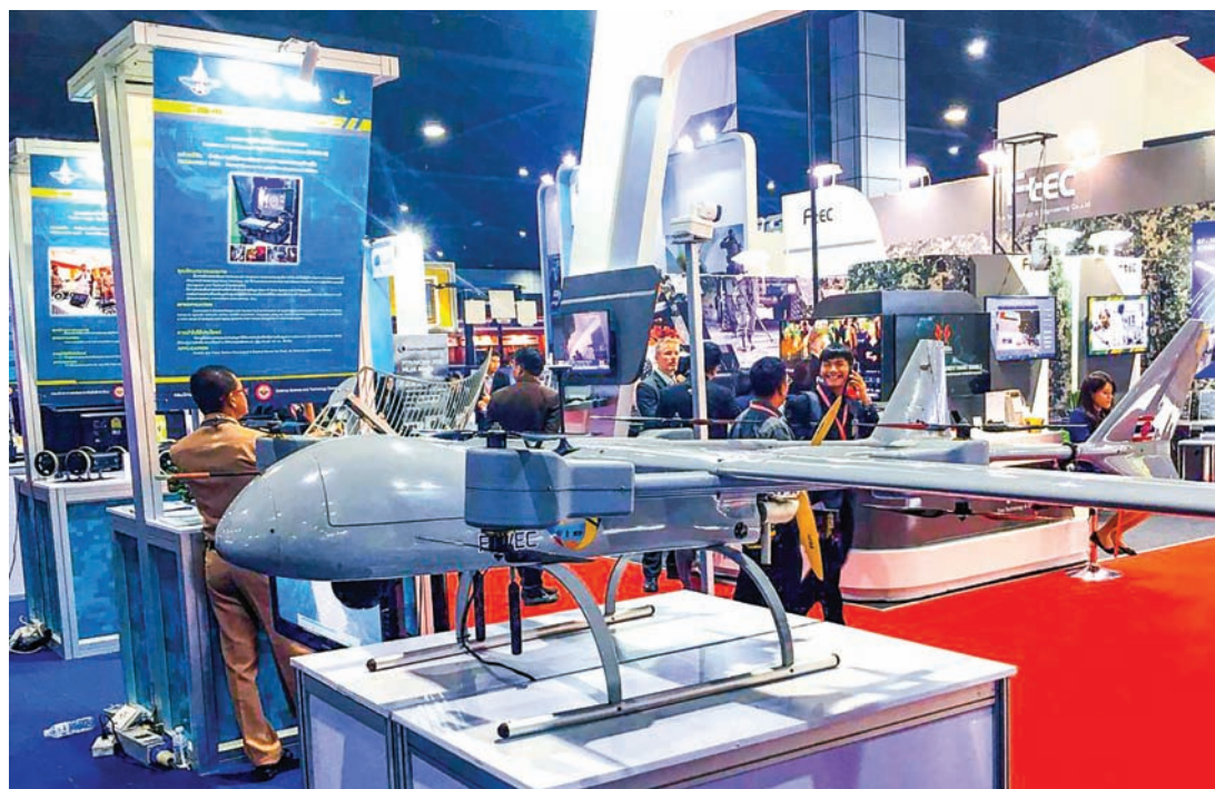
A Royal Thai Navy prototype combat drone, developed by the Defence Science and Technology Department is pictured during the Defence and Security 2017 exhibition in Bangkok, Thailand, on 7 November 2017.

The Chinese Defence Ministry did not respond when contacted by Reuters for comment.—Reuters ■