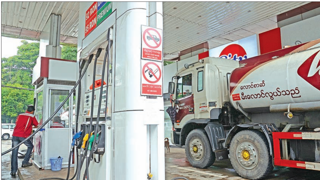
Worker refills to car the fuel at the shop.