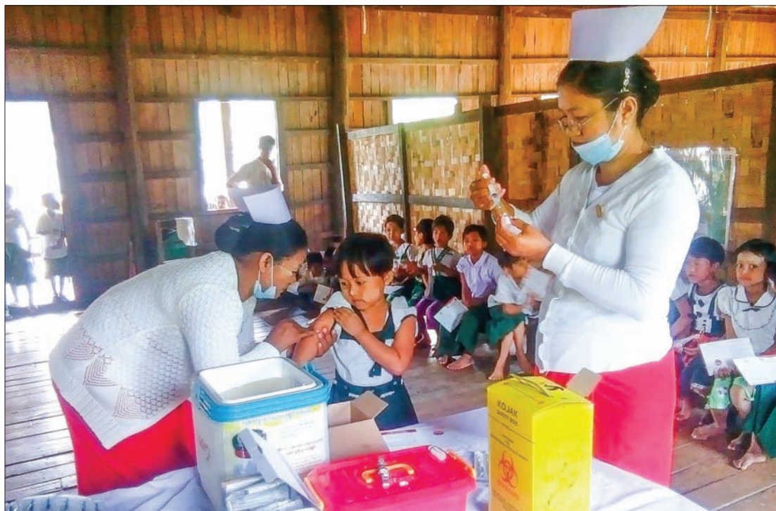
Nurses giving vaccinations to children for Japanese encephalitis.

JAPANESE encephalitis vaccinations were injected to Children Under-15 by medical staff from Kyauk Htu Township General