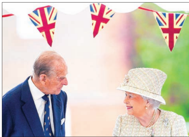
Britain's Queen Elizabeth and Prince Philip visit Pangbourne College near Reading, on 9 May 2017.

LONDON — Britain's Queen Elizabeth will add another landmark to her record-breaking reign on Monday when she and Prince Philip celebrate their 70 th wedding anniversary.