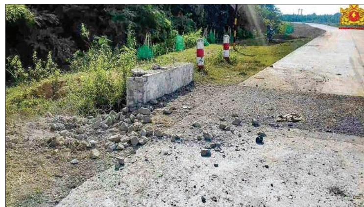
A concrete bridge damaged by landmine explosions on Yangon-Sittway Road in Rakhine State.

Later the same day, another landmine exploded near a concrete bridge between the 116/3 and 116/4 mile markers near Vethali Village and Pauktawpyin Village as seven Tatmadaw convoy trucks approached from