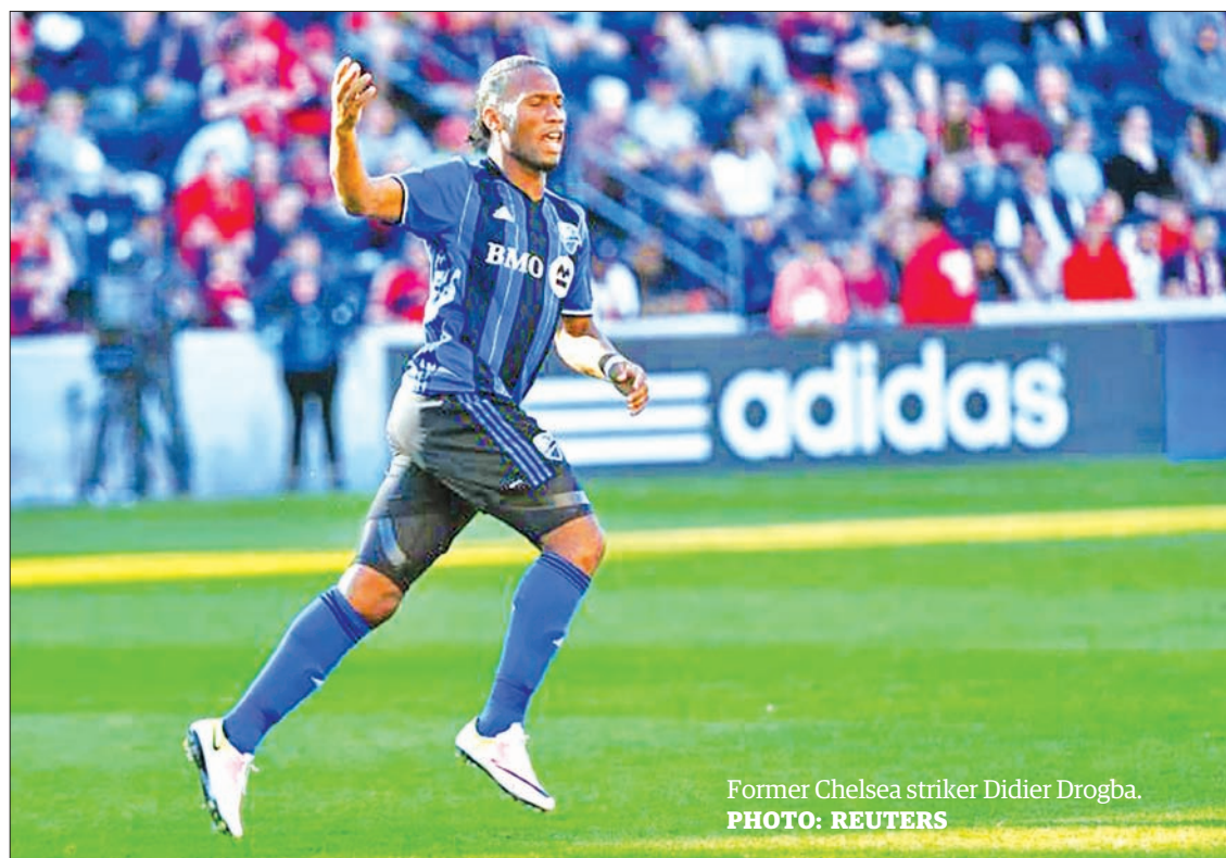
Former Chelsea striker Didier Drogba.

have time for my other projects. It's good to play, but at 39, it holds me back a bit." Drogba has enjoyed an illustrious club career, playing more than 670 games for eight different teams, including French side Olympique Marseille and Turkey's Galatasaray. —Reuters ■