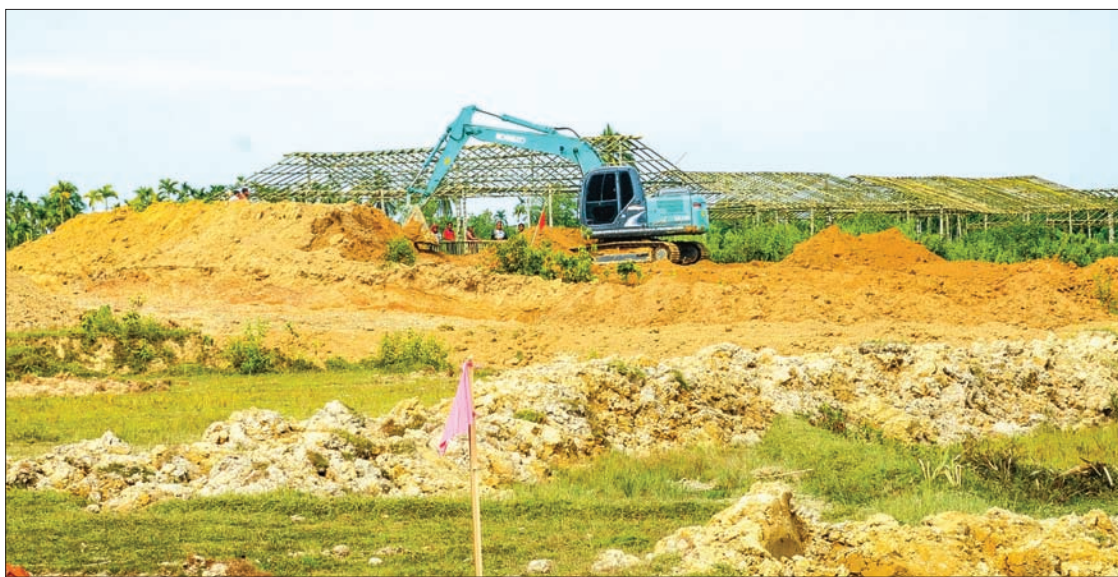
The area for the new Mro village being cleaned.

Q: Do you have an estimated time for when you'll