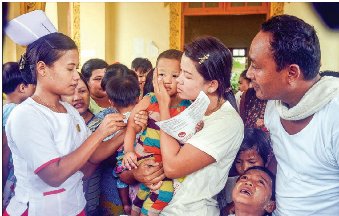
A nurse making injection to child under 15 for Japanese encephalitis prevention in Maungtaw, Rakhine.

The vaccination can protect 85 to 100 per cent of children from Japanese encephalitis, it is learnt from the staff of the health department.