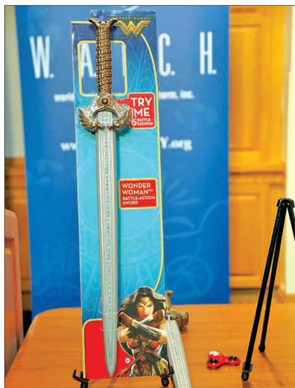
Mattel “Wonder Woman Battle-action Sword” is displayed during the World Against Toys Causing Harm (WATCH) news conference to announce their nominees for the “Ten Worst Toys” this holiday season in Boston, Massachusetts, US on 14 November, 2017.

The 32-year-old Super Mario Brothers video game series and its spin-offs have sold more than 330 million units. Nintendo had revealed it was in talks with several Hollywood studios about making films based on its games. — Kyodo News ■