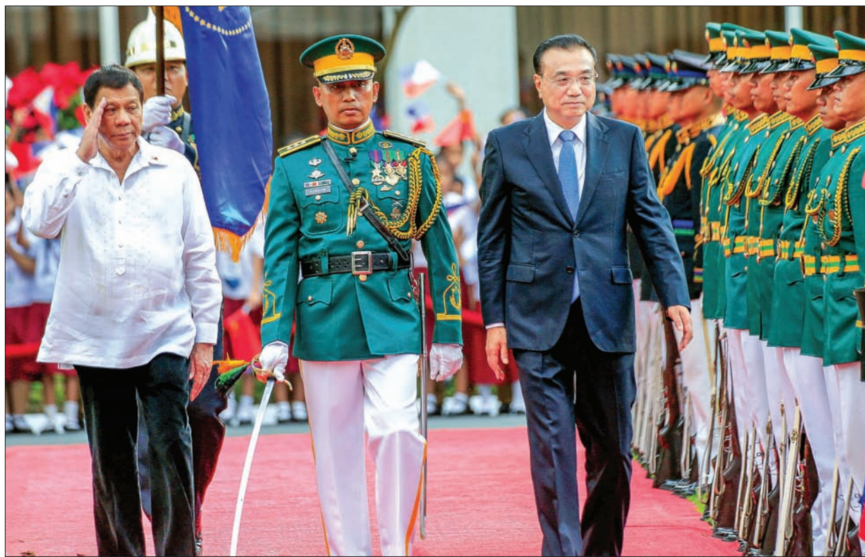
Philippine President Rodrigo Duterte salutes with Chinese Premier Li Keqiang as they review honor guards upon arrival Li Keqiang's official visit, at the Malacanang presidential palace in Manila, Philippines on 15 November, 2017.

There are doubts, however, about if it really was a Chinese sniper rifle that killed Hapilon, and uncertainty about whether the military has used any of the 6,100 guns Beijing has donated since June. The Philippine defence