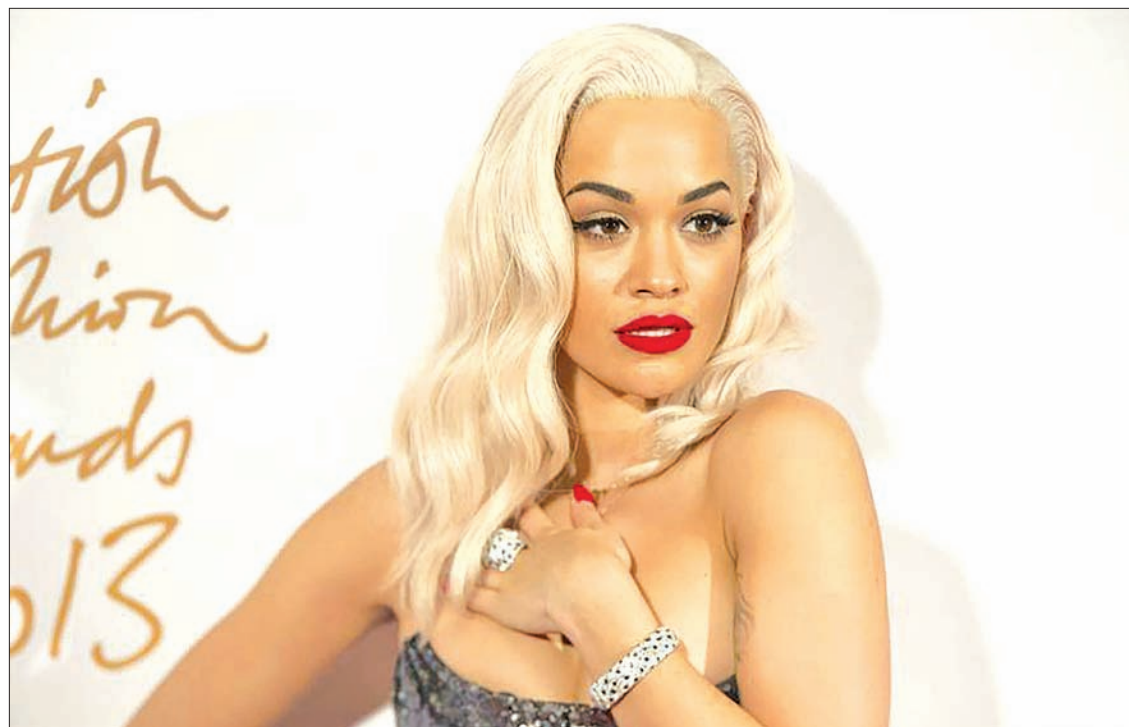
British singer Rita Ora.

The script of the film will be penned by Monica Beletsky.—PTI