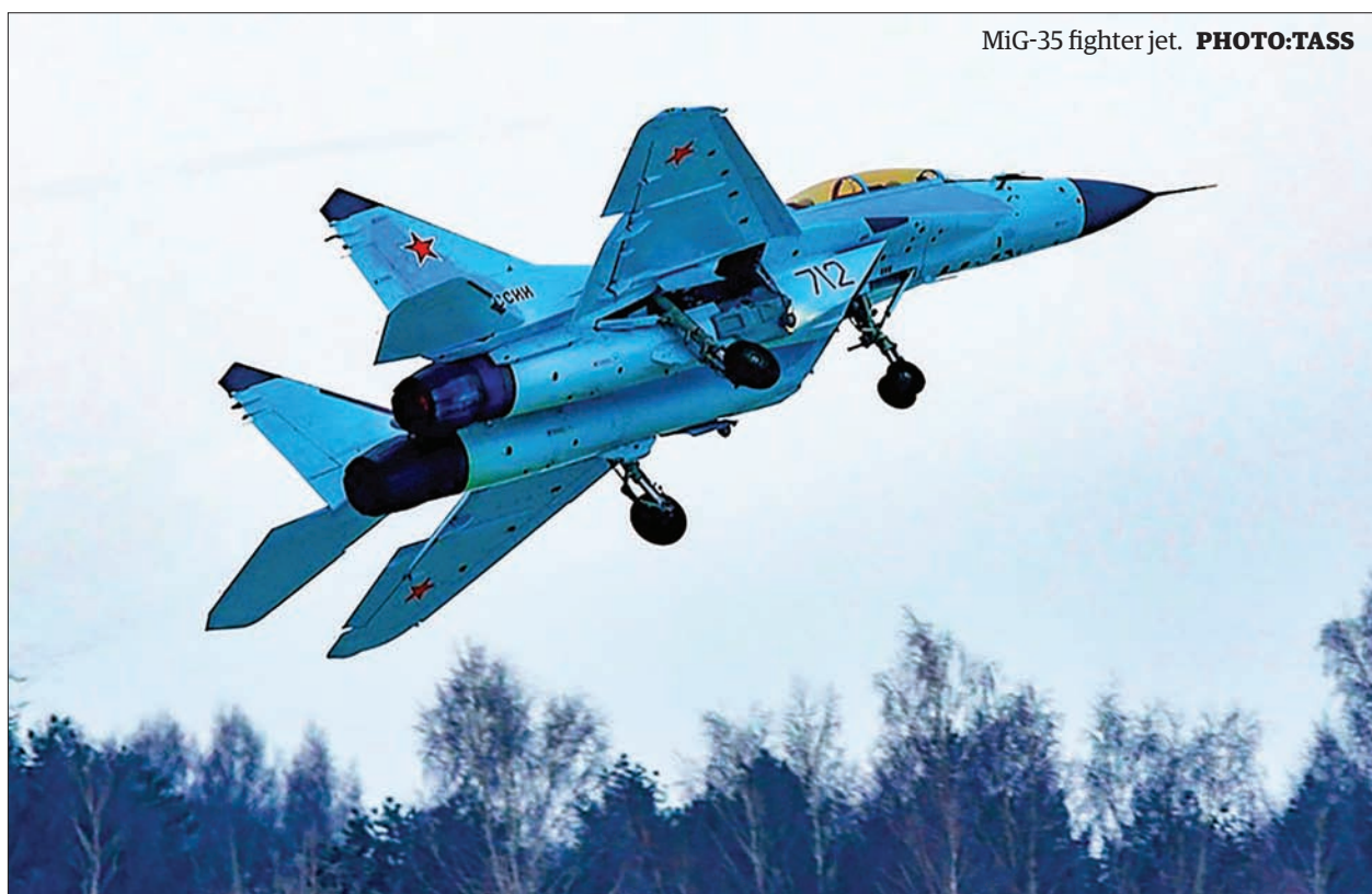
MiG-35 fighter jet.