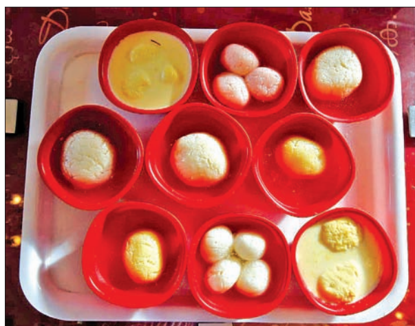
Varieties of 'Rosogolla', popularly known as the king of Indian sweets, are displayed inside a sweet shop in Kolkata, India on 14 November, 2017.

But two eastern states, West Bengal and Odisha, have been arguing over the origins of rosogolla, which means a ball of sweet.