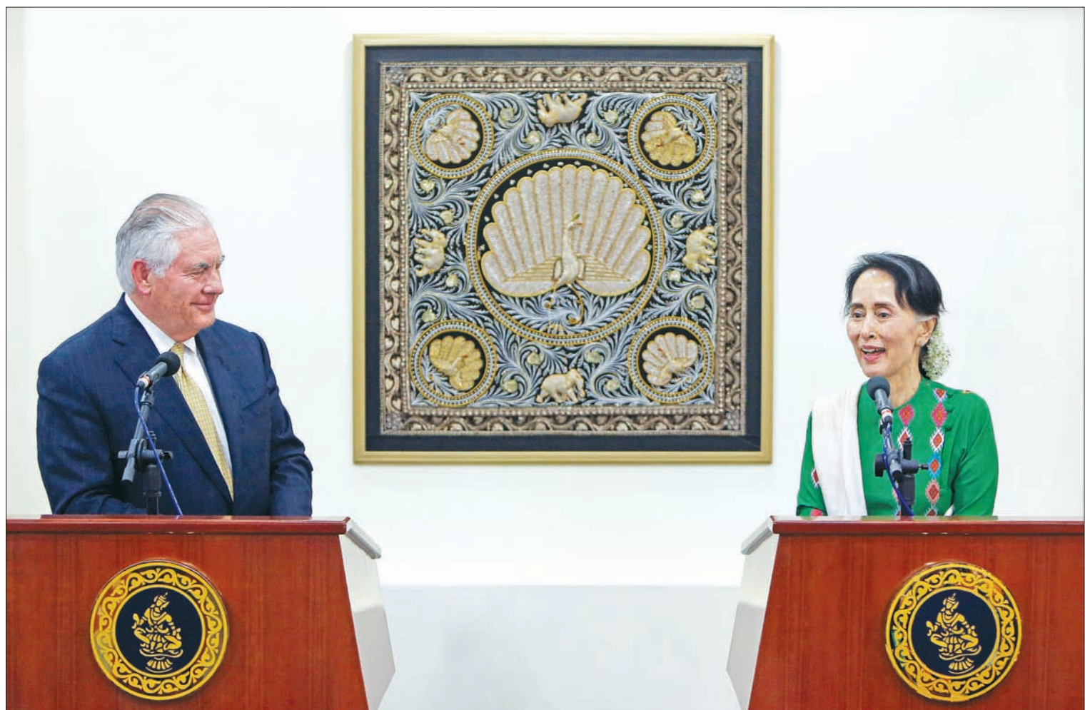
US Secretary of State Mr. Rex Tillerson, left, at a press conference held jointly with Daw Aung San Suu Kyi in Nay Pyi Taw.

The US Secretary of State also reaffirmed the US commitment to democratic transition in Myanmar, condemning the ARSA