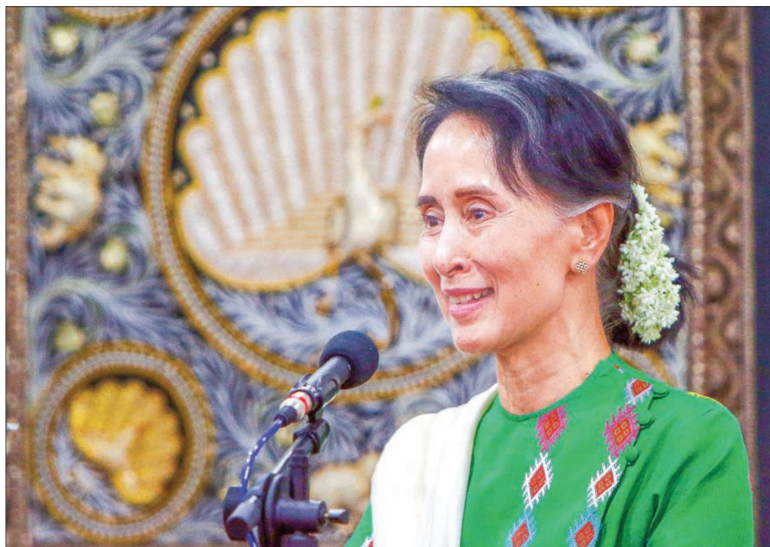
State Counsellor Daw Aung San Suu Kyi.

Daw Aung San Suu Kyi explained the Myanmar Government’s efforts to achieve sustainable peace and stability in Rakhine State, to provide humanitarian assistance to the