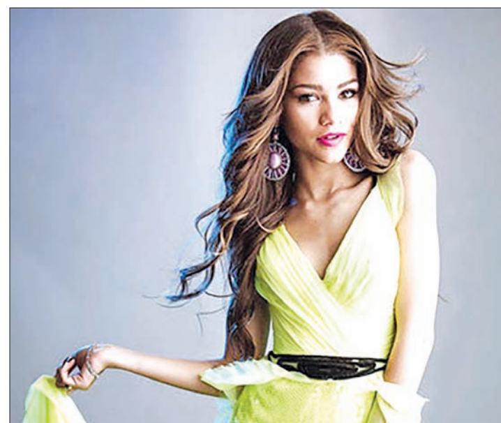
Actress Zendaya.

"This song that I'm really excited about, Ed Sheeran loves as well. I've played loads to Ed. I really trust his opinion," she says.—PTI ■