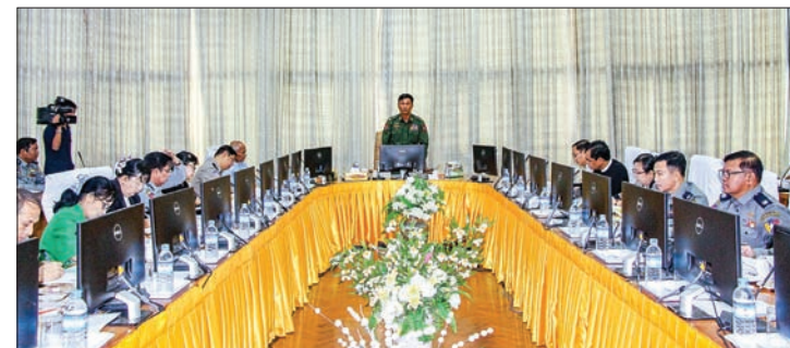
Lt. General Kyaw Swe delivers the speech at the meeting of anti-money laundering Central Committee.

Myanmar) U Nyi Nyi San and Rector of Central Institute of Civil Service (Lower Myanmar) U Aung Tin Soe signed the MoU agreement in front of the Chairman of UCSB for the bilateral cooperation between the Chinese Academy of Governance and the Central Institutes of Civil Service. — Myanmar News Agency ■