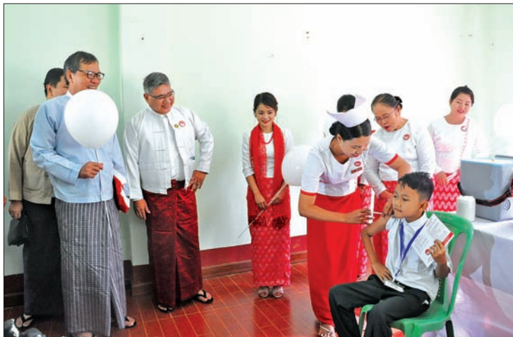
Child receives vaccination for Japanese encephalitis prevention at No.6 BEHS in Zabuthiri Township.

Japanese encephalitis (JE) is a potentially fatal viral brain infection for which there is no cure and it mainly affects children aged between one and 14, said the Director