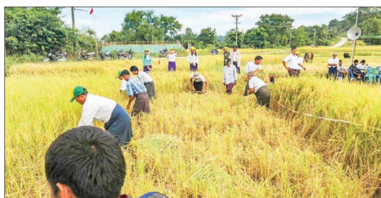
Farmers harvest rice by the traditional approach, reaping the rice together by a sickle.

Paddy harvested yesterday yielded 97.90 baskets per acre, it was learnt.—Myanmar News Agency ■