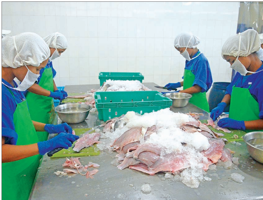
Workers process fish at a seafood factory in Yangon.