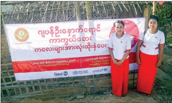
Nurses are ready to give vaccination to children in northern Rakhine.