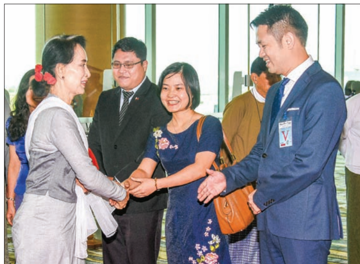
State Counsellor Daw Aung San Suu Kyi arrives at Nay Pyi Taw International Airport.