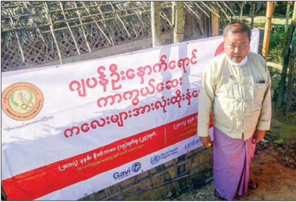
Rakhine State Minister for Social Affairs Dr Chan Thar.

WITH nationwide vaccination against encephalitis on 15 November, children under 15 in Maungdaw Township also received the vaccination. Myanmar's 14 million of children including 1 million children in 17 townships in Rakhine State are vaccinated on 15 November. "We are ready today to give vaccination to nearly 350,000 children in two townships today. The population of children is expected to decrease because of those who fled to the neighbouring country. Vaccines and nurses and doctors are ready to launch the campaign," said Rakhine State Minister for Social Affairs Dr Chan Thar. Rakhine State has suffered from mosquito-borne diseases as the state rich in rivers and forests. The successive authorities had tried many years to conduct such kind of huge vaccination campaign in the state. The state's dream do come true today due to the efforts of the authorities and Union Minister for Health. Reporters who visited the villages of Daing Net recently with authorities for media cover-age said nurses and vaccines had arrived at the village of Thinbawhla to give vaccinations to the children there. There are 170 households with a population of more than 700 in the village of Daing Net ethnic people. The campaign would paint a rosy picture for healthy children in Rakhine State.—Ko Zaw (Insein) ■