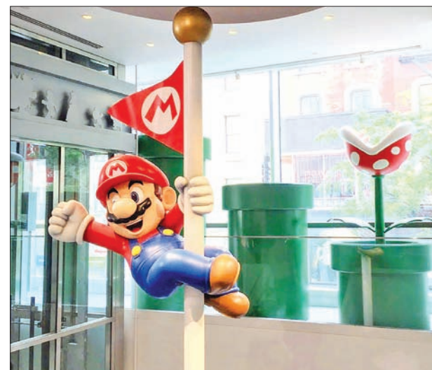
Photo taken on 29 July, 2017, shows Super Mario decoration in a store selling games and goods related to Nintendo Co in New York. Nintendo is close to an agreement with a US production company to make an animated “Super Mario Bros” movie, The Wall Street Journal reported on 14 November, 2017.