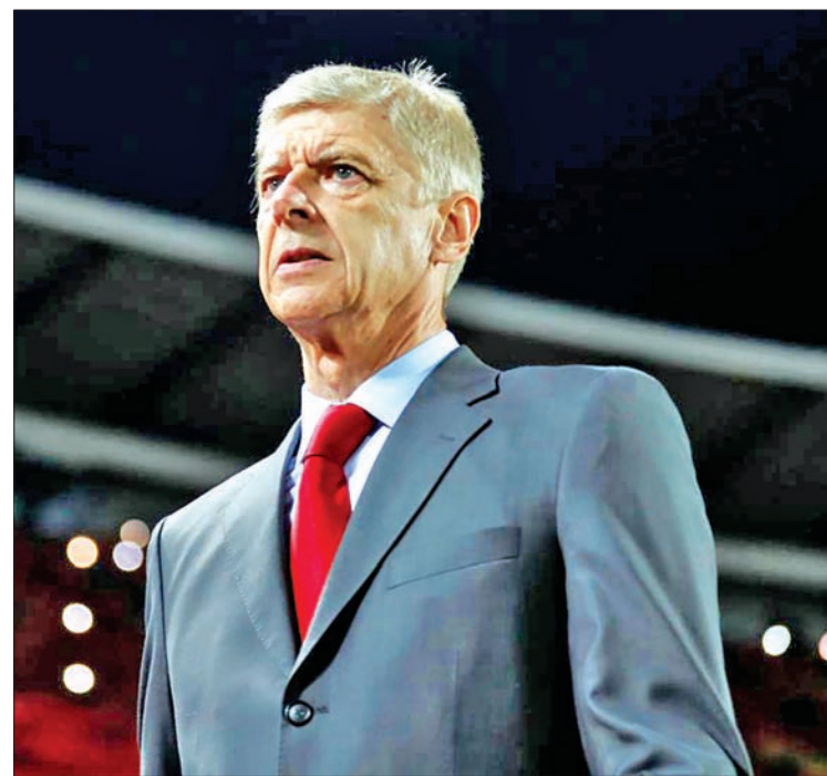
Arsenal manager Arsene Wenger.

"But I will not always have the physical strength to do that so maybe I will move into (international coaching). It's a fact my life