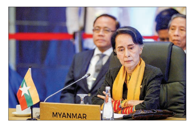
State Counsellor Daw Aung San Suu Kyi participates in the 31<sup>st</sup> ASEAN Summit and Related summits in Manila, Philippines on 13 November 2017.

31<sup>st</sup> ASEAN Summit and Related summits held in Manila