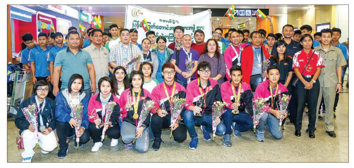
Myanmar Badminton Team seen with gold medals at Yangon International Airport.

MYANMAR Badminton team stood first with earning four gold medals in Yunnan Asian National Badminton Championship 2017 hosted in Kunming City in Yunnan Province, China from 11 to 12 November.