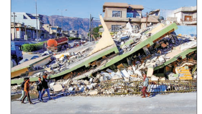
Collapsed building is seen in the town of Darbandikhan, near the city of Sulaimaniyah, in the semi-autonomous Kurdistan region, Iraq on 13 November, 2017.

The quake also triggered landslides that hindered rescue efforts. officials told state television. At least 14 provinces in Iran had been affected, Iranian media reported.