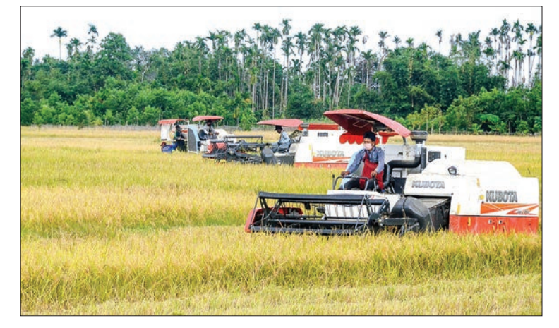
Workers work with harvesters at a field in Maungtaw.

UEHRD - Union Enterprise for Humanitarian Assistance, Resettlement and Development in Rakhine.—GNLM