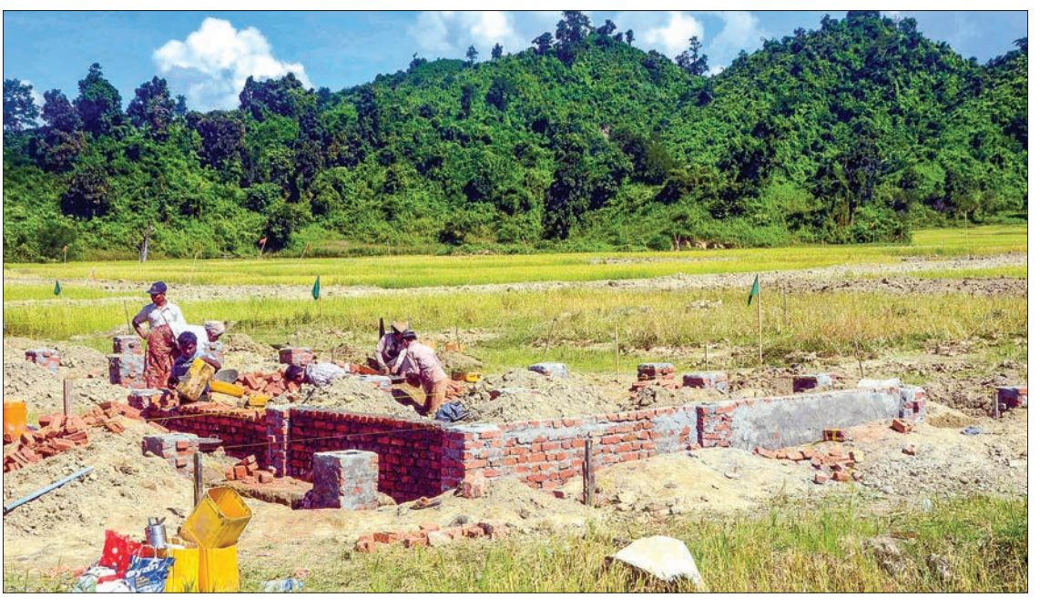
Local people get jobs as infrastructure are under construction in Khonhtaing Village.

The Union Minister provided Ks 50,000 for each of the 38 households totaling Ks 1.9 million and Ks 100,000 for traditional culture group while State Chief Minister provided Ks 200,000 for traditional culture group and then viewed the construction of the new village. New Khonhtaing village