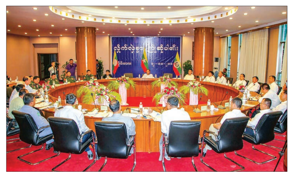
The delegation led by Union Minister for Border Affairs Lt-Gen Ye Aung holds talks with leaders The delegation led by Union Minister for Border Affairs Lt-Gen Ye Aung holds talks with of ethnic nationals led by chairman U Sai Lin in Mongla Special Region-4.