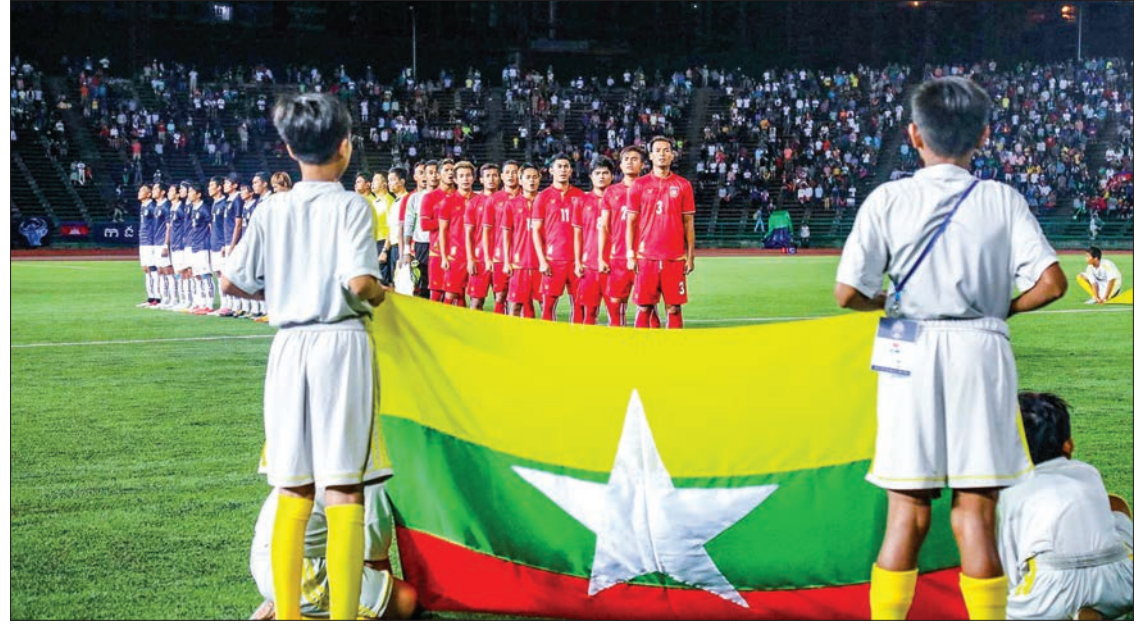
Myanmar national footballers singing their national anthem at an international friendly match against Cambodia on 9 November.

MYANMAR national football team will play a qualifying match for 2019 AFC Asian Cup against India tonight at the Jawahrlal Nehru Stadium in Goa city in India.