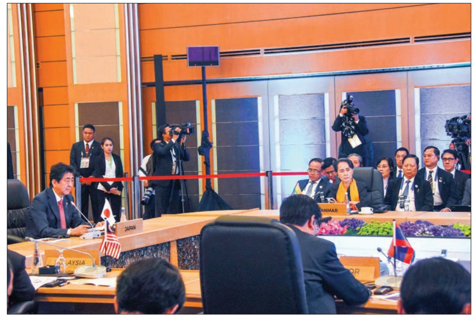
The meeting of ASEAN-Japan Summit being held in Manila on 13 November.