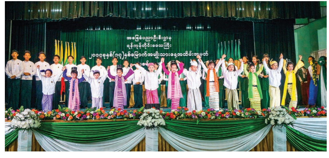
Students from BEHS No.2 (Myoma) perform Pyi Myanmar song to mark the 97<sup>th</sup> National Day 2017 ceremony in Dagon Township, Yangon on 13 November 2017.

and rest place for travelers and devotees paying homage to the pagoda and a shelter where people can gather to talk and share news). A nationwide campaign was organized to open schools not only in Yangon but all across the country resulting in opening of 93 national schools. When these schools were established, they were called national schools and ethnic national schools while Myoma School became the central national school. The day the school was established was seen in the record as 17 December 1920 and on 17 December 2020, it will be the 100<sup>th</sup> year of its establishment. The day it was established became the National Day and National Day events were held every year. Looking back at the history of the school, it was at its zenith during Sayagyi U Ba