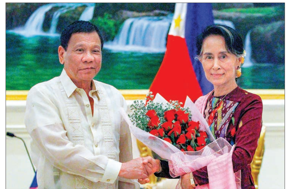
State Counsellor Daw Aung San Suu Kyi welcomed Philippine President Rodrigo Duterte (L) in Yangon, on 20 March 2017.

The Philippines is the country consisting of national ethnic people, but the amount is lower than compared to that of Myanmar. Of them, Tagalog ethnics occupy 28 percent of the national populace, with Cebuano 13 percent, Ilocano 9 percent, Bisaya 8 percent, Haligaynon Ilonggo 8 percent, Bikol 6 percent and Waray 3 percent respectively. As regards the religion they profess, 86 percent of the populace belongs to Christianity and 5 percent to Islam. The Philippines imports 11.5 percent of imports from USA, with 18.8 percent