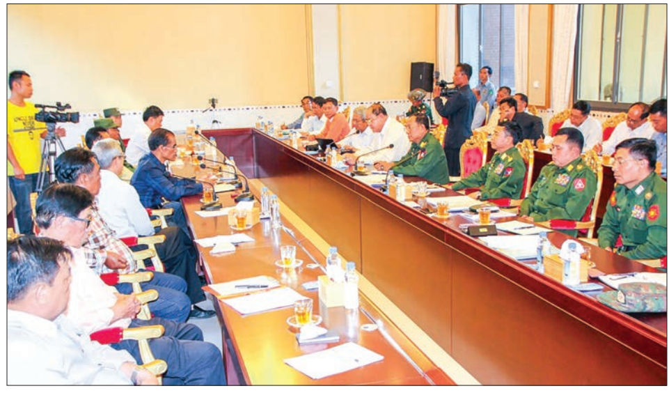
leaders of ethnic nationals led by Wa Special Region-2.