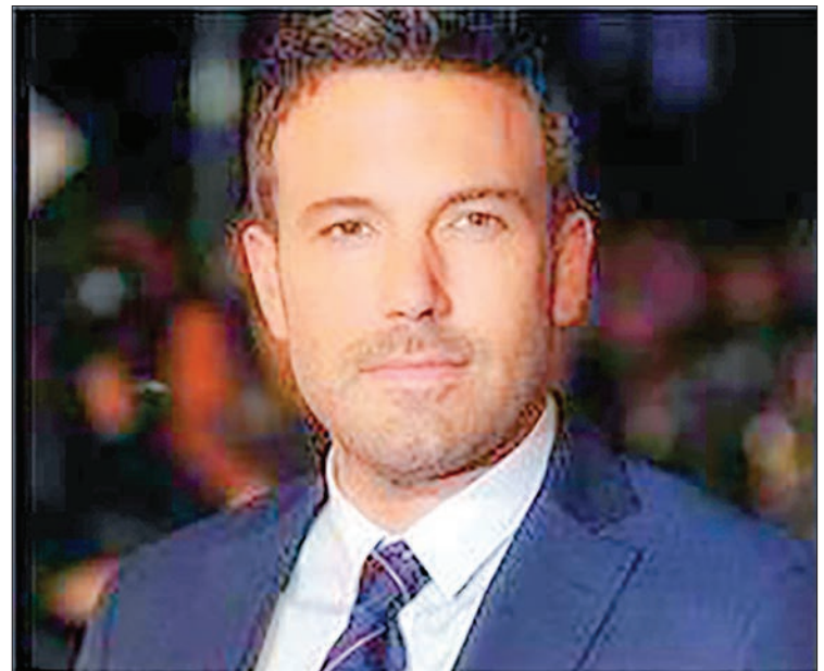
Ben Affleck.