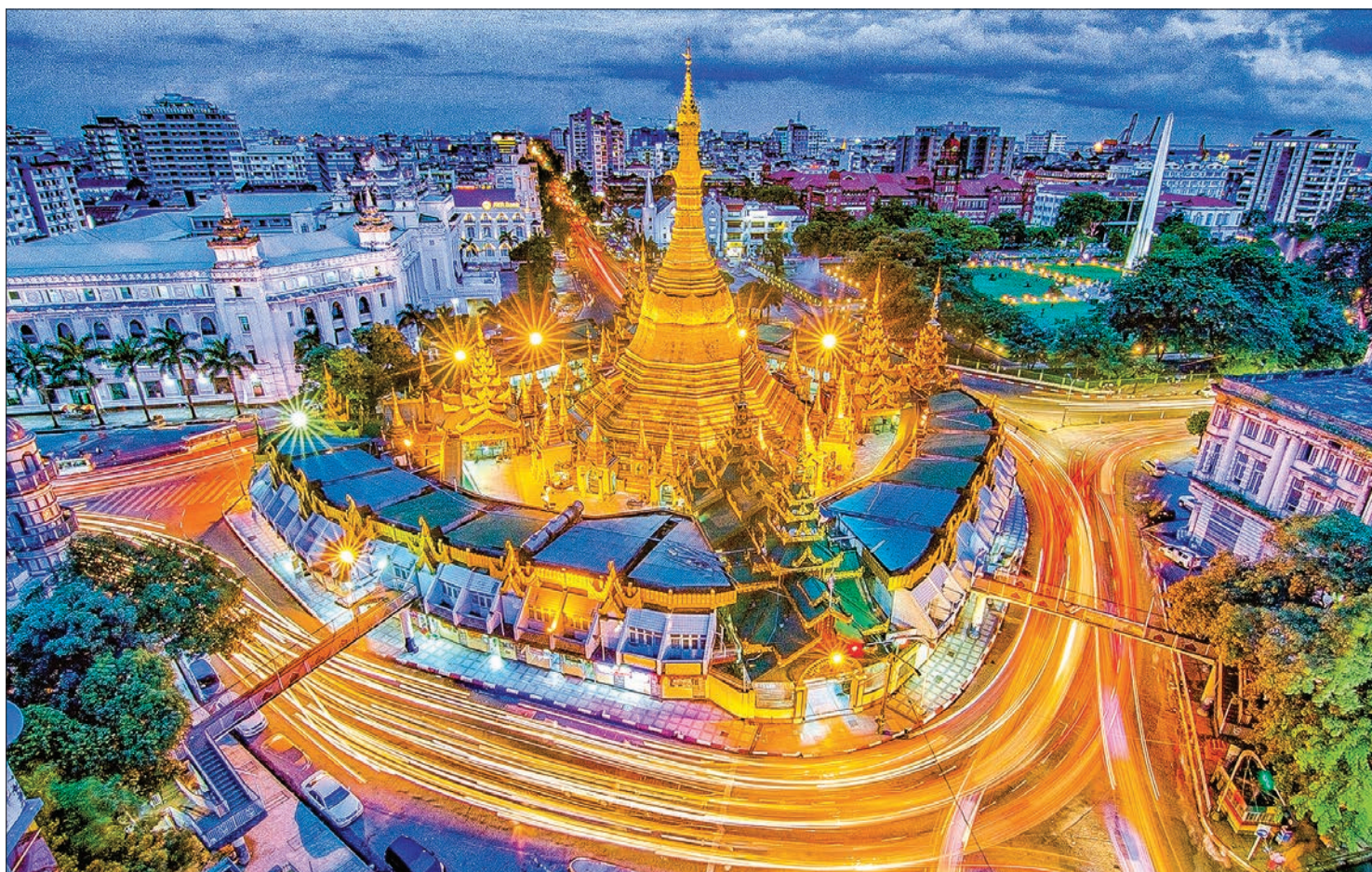
The night scene of Sule Pagoda landmark ancient Pagoda at blue hour in downtown Yangon.

Due to limitation of space we are only able to publish "Letter to the Editor" that do not exceed 500 words. Should you submit a text longer than 500 words please be aware that your letter will be edited.