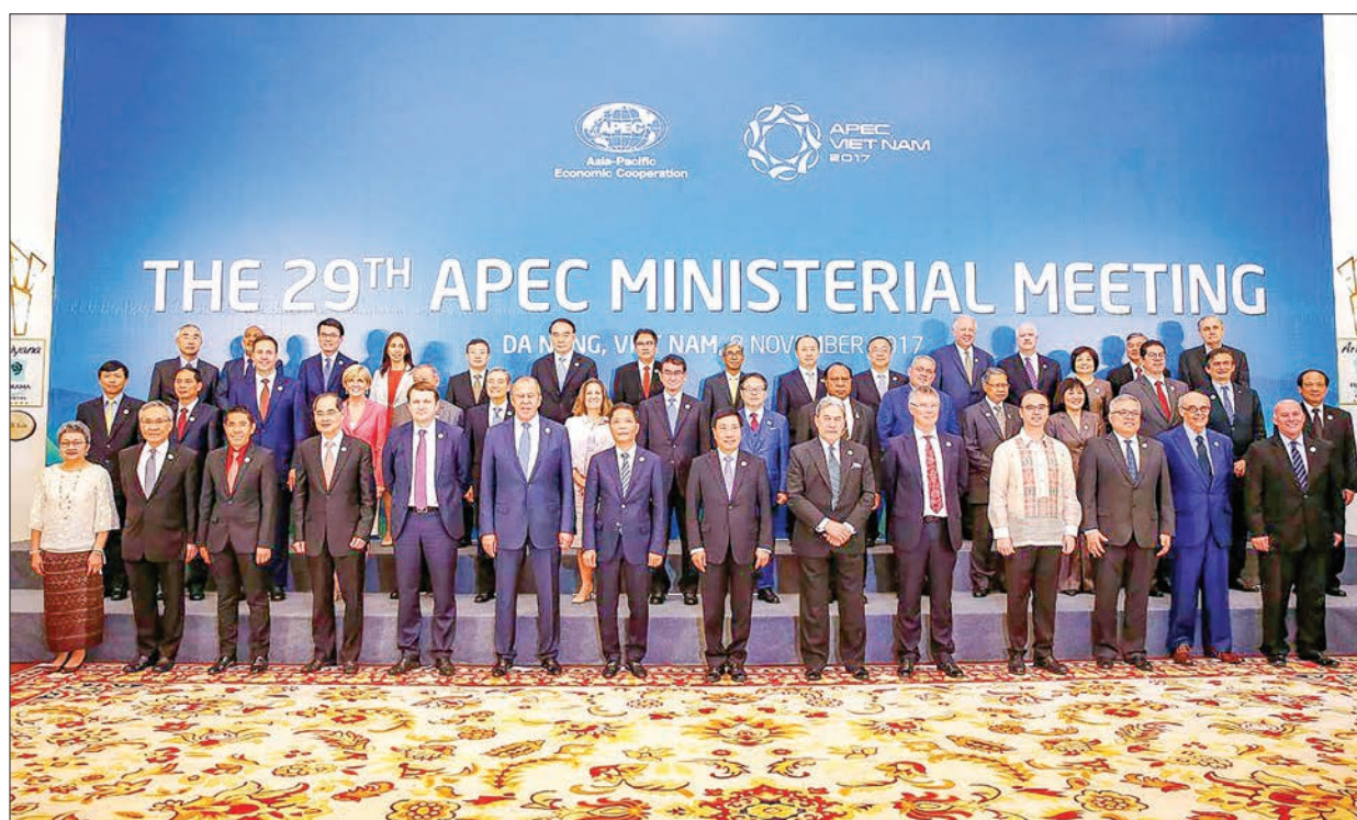
Ministers gather for a group photo after the APEC Ministerial Meeting (AMM) ahead of the Asia-Pacific Economic Cooperation (APEC) Summit leaders meetings in Danang, Vietnam, on 8 November 2017.