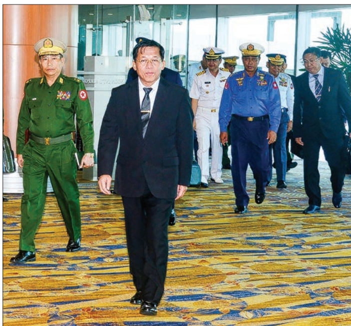
Senior General Min Aung Hlaing arrives back at Yangon International Airport on 8 November 2017.

Then Senior General and delegation arrived at Yangon International Airport yesterday afternoon and welcomed by Commander-in-Chief (Navy) Admiral Tin Aung San, Commander-in-Chief (Air) General Khin Aung Myint and high ranking officers from the office of