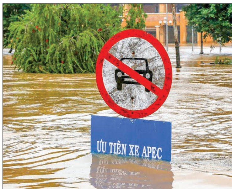
A traffic sign indicating APEC summit vehicles priority is seen along submerged street in UNESCO heritage ancient town of Hoi An after typhoon Damrey hits Vietnam, on 6 November 2017.

Typhoon Damrey, which struck on Saturday, was the 12th major storm of the year. Eighty-nine people were known to have died because of the storm, 18 people were missing and 174