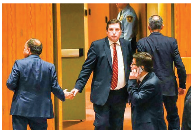
Russia's deputy UN envoy, Vladimir Safronkov arrives at a Security Council meeting on the situation in Syria at the United Nations Headquarters, in New York, US on 7 April 2017.

“Without a comprehensive change it will become a tool to settle accounts with the Syrian authorities,” Safronkov