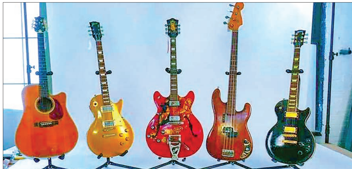
Guitars used by Jimi Hendrix to sell at auction.

Master recordings of James Brown and Elvis Presley, and recorded live performances of the Beatles, the Rolling Stones and others will be included in the sale. —Reuters ■