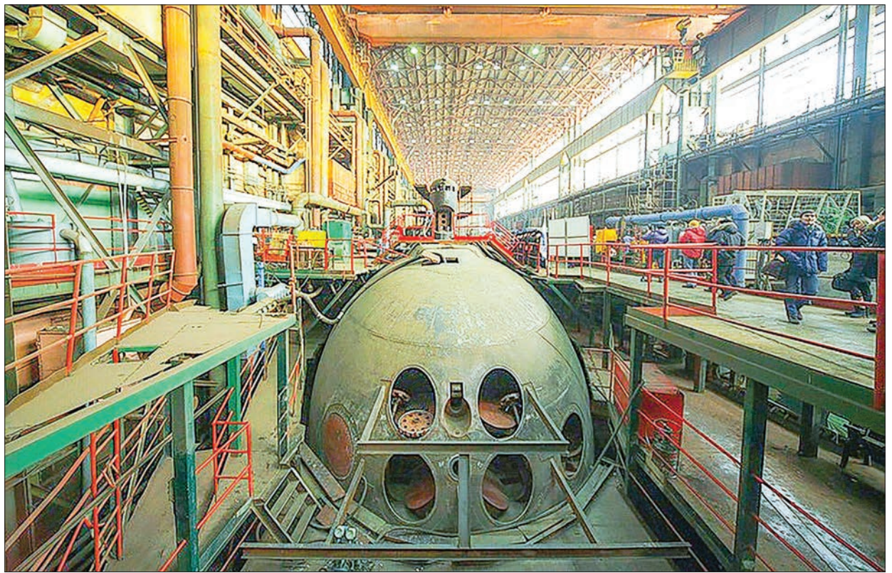
The Russian Navy currently has three Borei-class nuclear-powered submarines at its disposal.