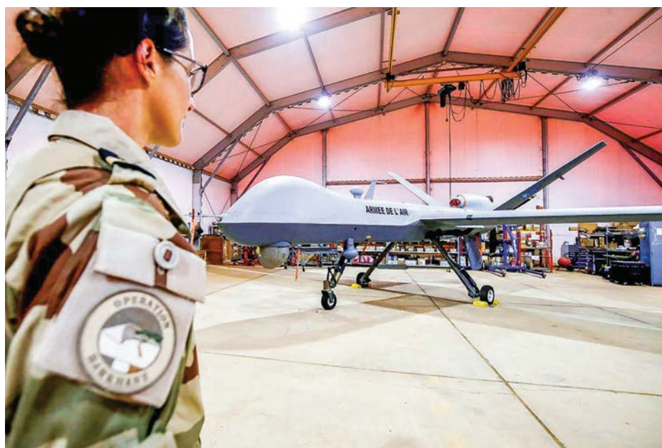
A French soldier of the regional anti-insurgent Operation Barkhane stands in front of a General Atomics MQ-9 Reaper drone version Block 1 in Niamey, Niger on 21 October 2017.

“There is a long way to go to reach full operational capacity, even though the timeframe is relatively short,” G5 force commander General Didier Dacko told visiting UN Security Council envoys last month, citing a range