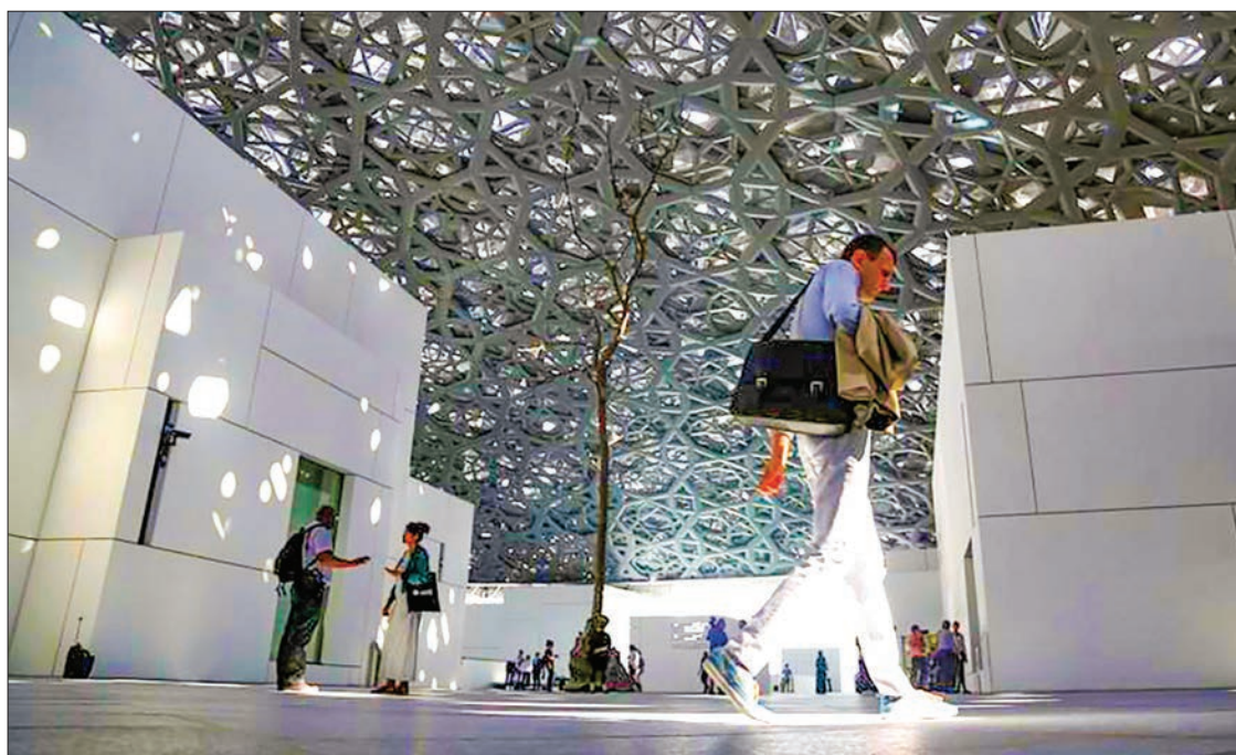
People are seen at the Louvre Abu Dhabi in Abu Dhabi, United Arab Emirates on 6 November, 2017.

Permanent installations include a sculpture by Auguste Rodin, an enormous bronze tree with mirrored branches called "leaves of light" by Italian artist