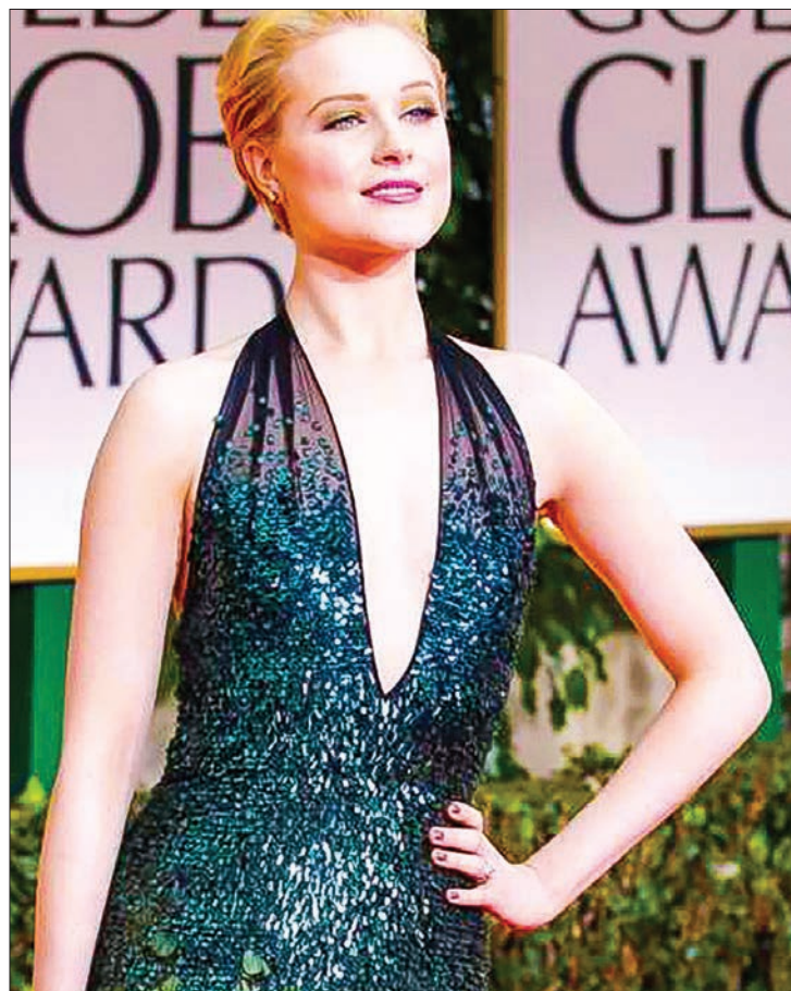
Evan Rachel Wood.

LOS ANGELES — Evan Rachel Wood has confirmed that the second session of "Westworld" will premiere next year in spring.