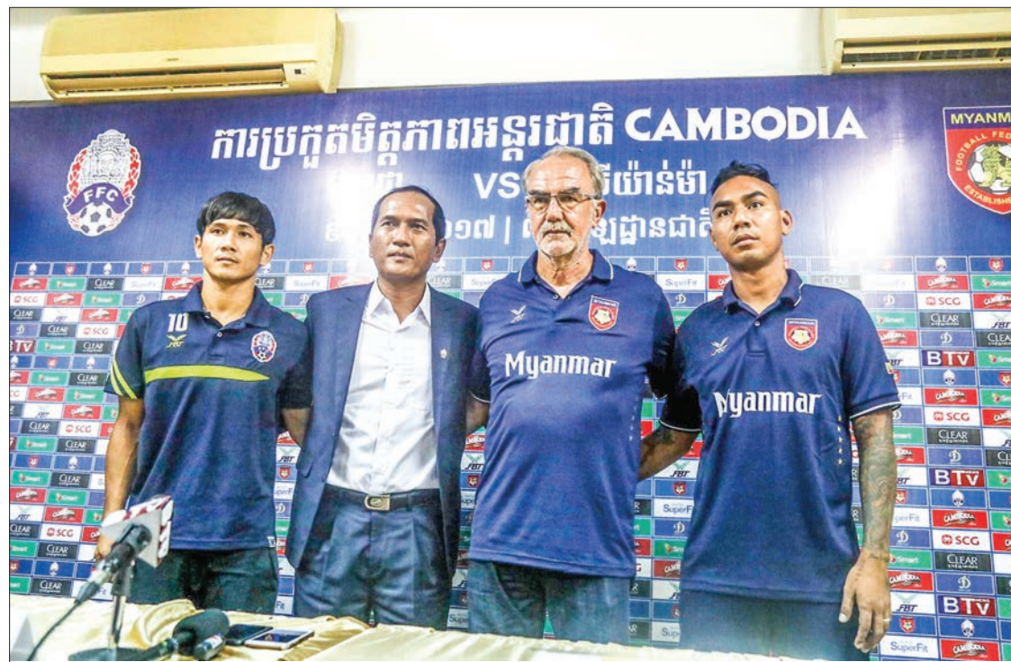
Head Coaches and players from Cambodia and Myanmar seen at the Match Coordination Meeting in Phnom Penh, Cambodia yesterday.

“We have no pressure in the match, as the match is just a friendly and a preparation for the match against India next week. However, the match will be