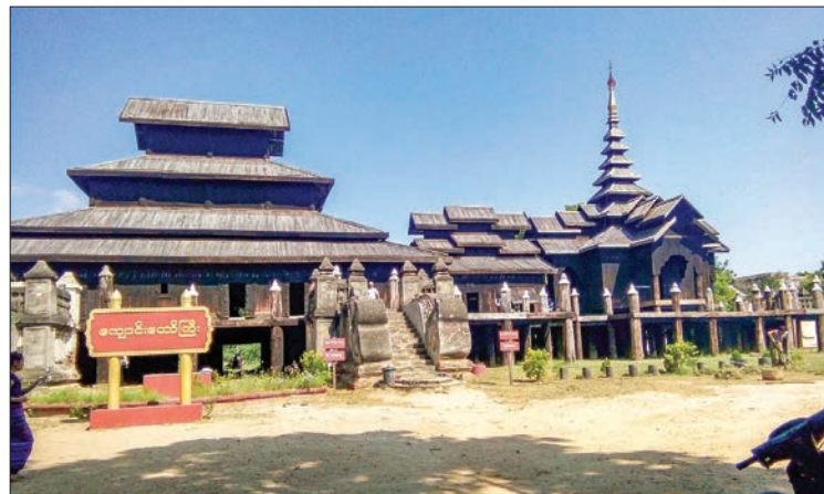
File photo shows an ancient monastery, Pakhan Gyi, in Yesagyo, Pakokku District.

There 771 foreign visitors between January and October this year. This year has seen more visitors than previous years. —MDN ■