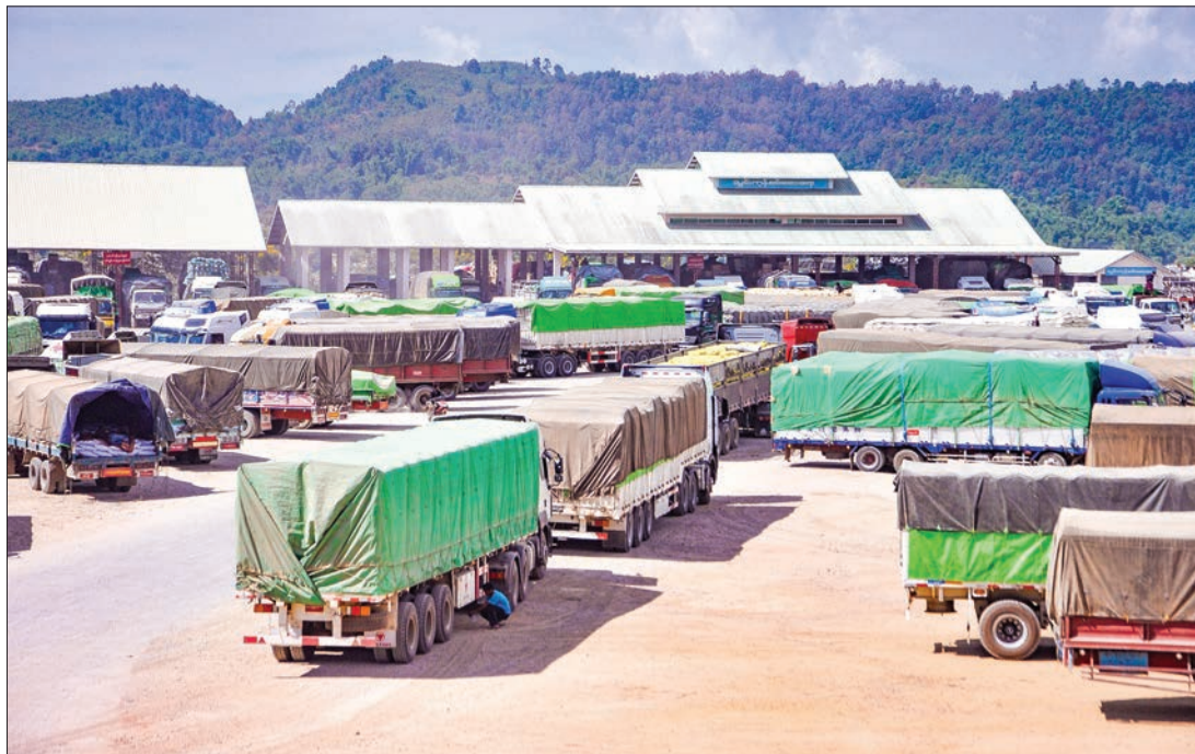
Trucks seen at 105-mile trade zone Muse, northern Shan State.