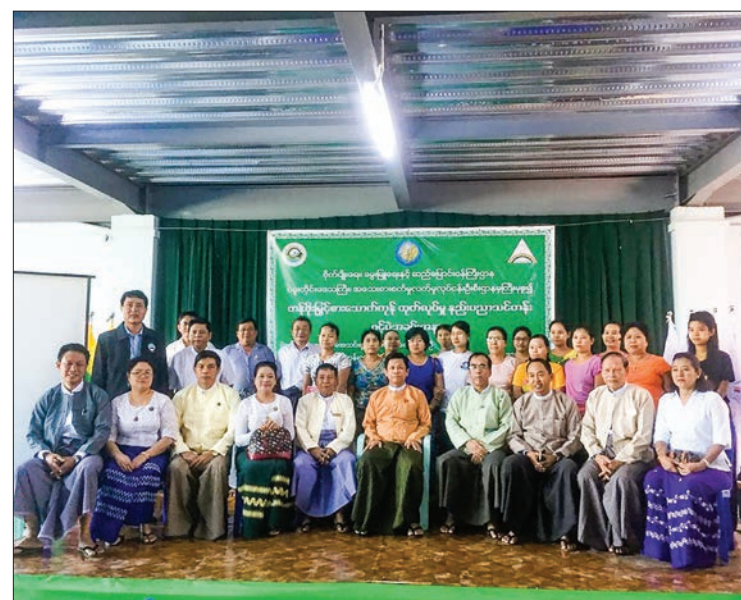
Officials and trainees pose for a documentary photo after conducting vocational training on making value-added food in Bago.

The training is funded by Bago Region Government.— Maung Shwe Win (Pyay) ■