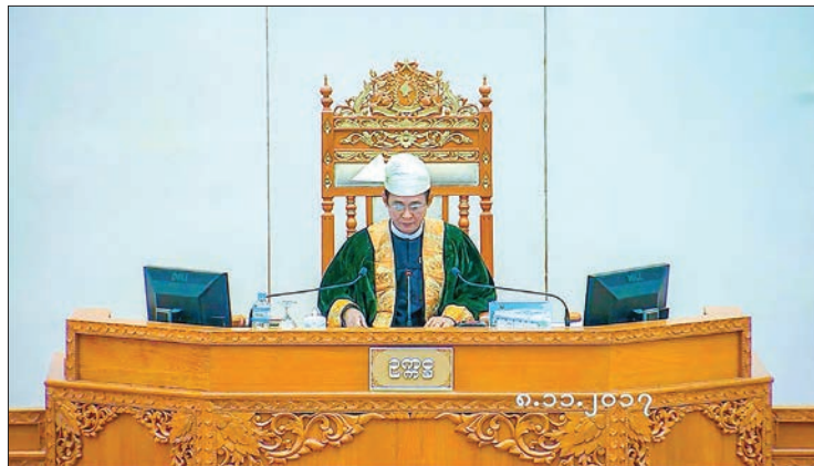
Pyithu Hluttaw Speaker U Win Myint.

Measures for promulgating Cyber Law should be implemented as soon as possible. Regarding excessive use of social websites by youths and