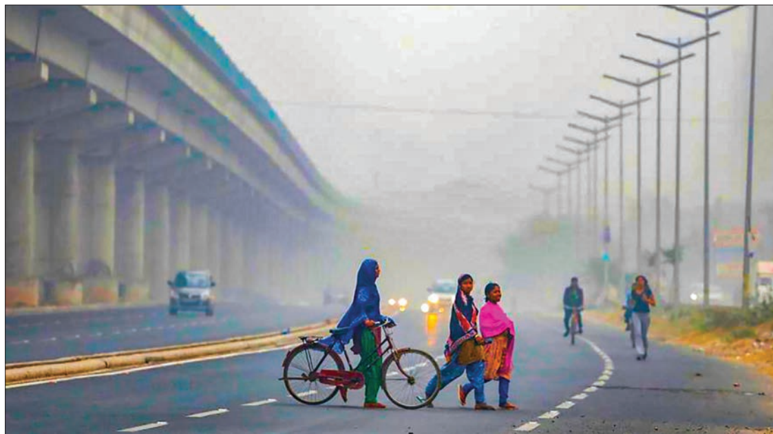
People cross the road in Delhi, India, on 7 November 2017.

In some parts of Delhi, the air quality was so poor that it was beyond the maximum level, ac-