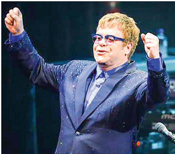
British musician Elton John.

John will deliver a lecture about his work at an award ceremony to be held on Harvard's