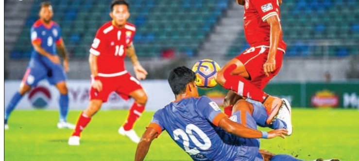
Photo is taken during the match Myanmar team against India in previous leg.