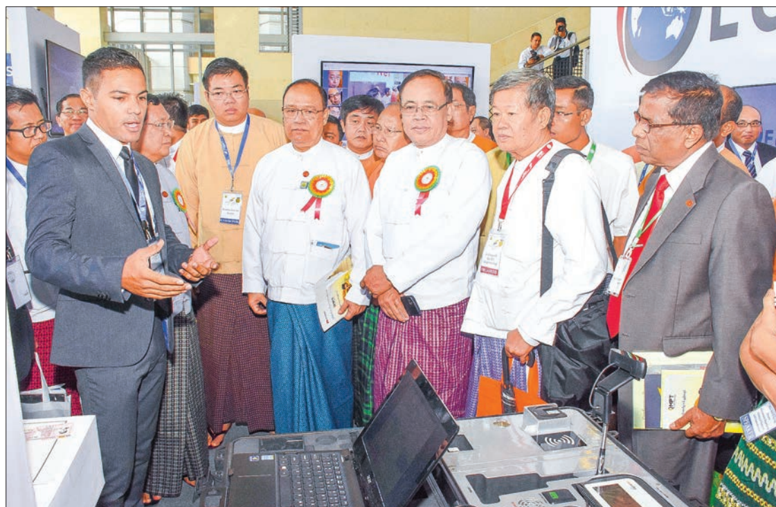
An official explains to Union Minister for Transport and Communications U Thant Sin Maung and party at e-Government Conference & ICT Exhibition 2017 held in Nay Pyi Taw on 7 November.

At the opening ceremony, the Union Minister said e-Govern-