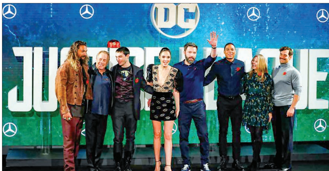
The cast and producers pose for photographers at the Justice League photocall, at The College, in London, Britain on 4 November, 2017.

While both totals are not insubstantial, they are dwarfed by Marvel's big hits — 2012's "The Avengers" and 2015's "Avengers: Age of Ultron," which took $1.5 billion and $1.4 billion respectively. Audiences in 2017, however warmed to "Wonder Woman," which grossed over $80 million more at the US box office than "Dawn of Justice," as well at proving a hit with critics, garnering a 92 per cent Rotten Tomatoes score. —Reuters ■