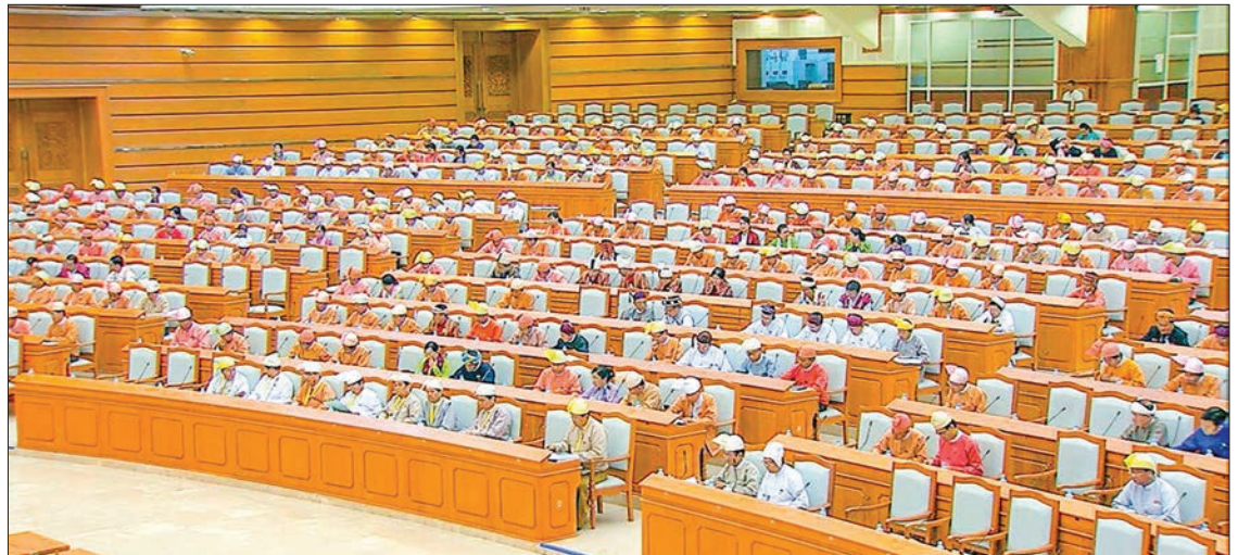
Members of Parliament attend the 2 nd Pyidaungsu Hluttaw meeting in Nay Pyi Taw.

Here, I would like to suggest that additionally demanded amounts should not exceed the designated percentage of the Budget Estimate. Concerning the interest rate on foreign loans, if necessary preventions are carried out after sustainable assessment of nature and months in which rise and fall of foreign exchange rates happen, a big gap on surplus and deficit in demanding additional fund can