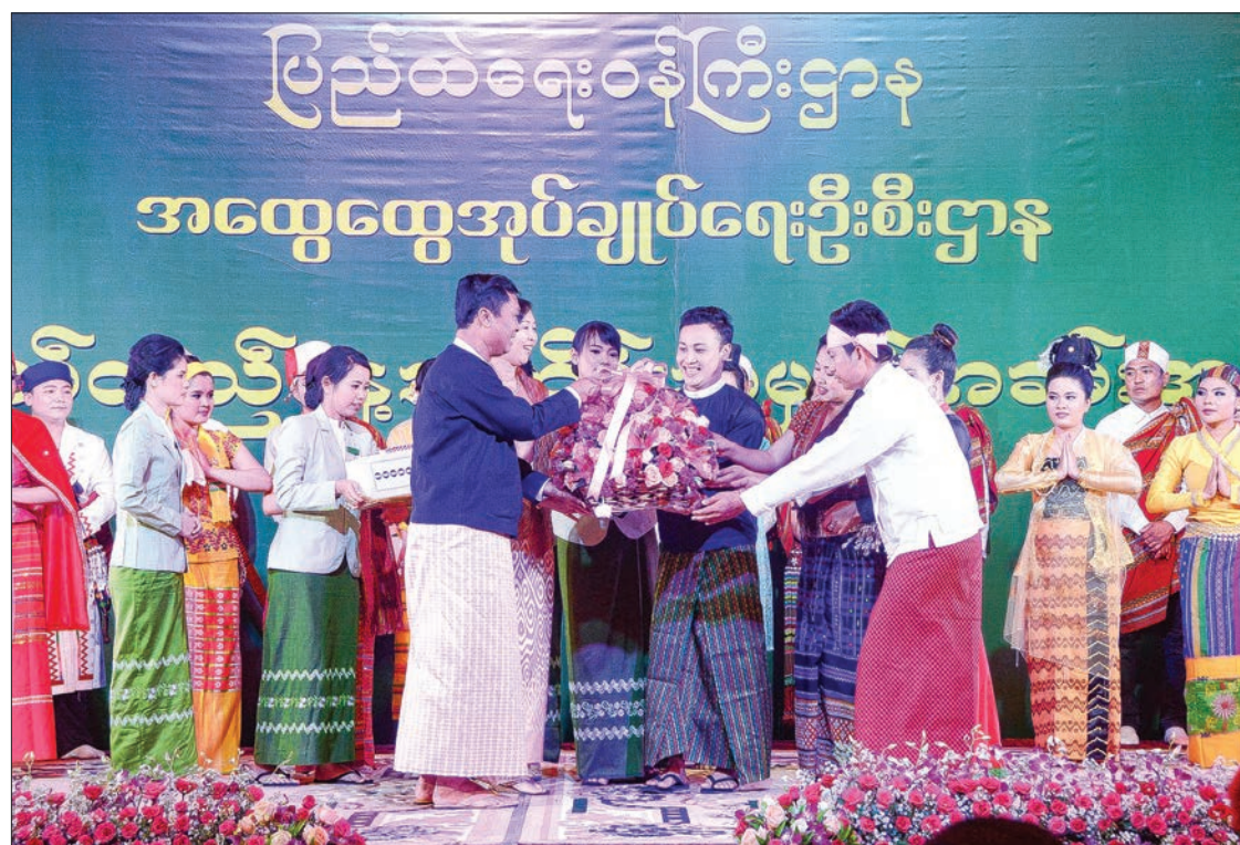
Union Minister Lt-Gen Kyaw Swe presents the award to the administrative service providers at the 29 th anniversary of General Administration Department, Ministry of Home Affairs in Nay Pyi Taw.

The government is striving toward achieving a permanent peace. As GAD personnel are assigned widely from ward/village-tract level to union level, they need to let the people and