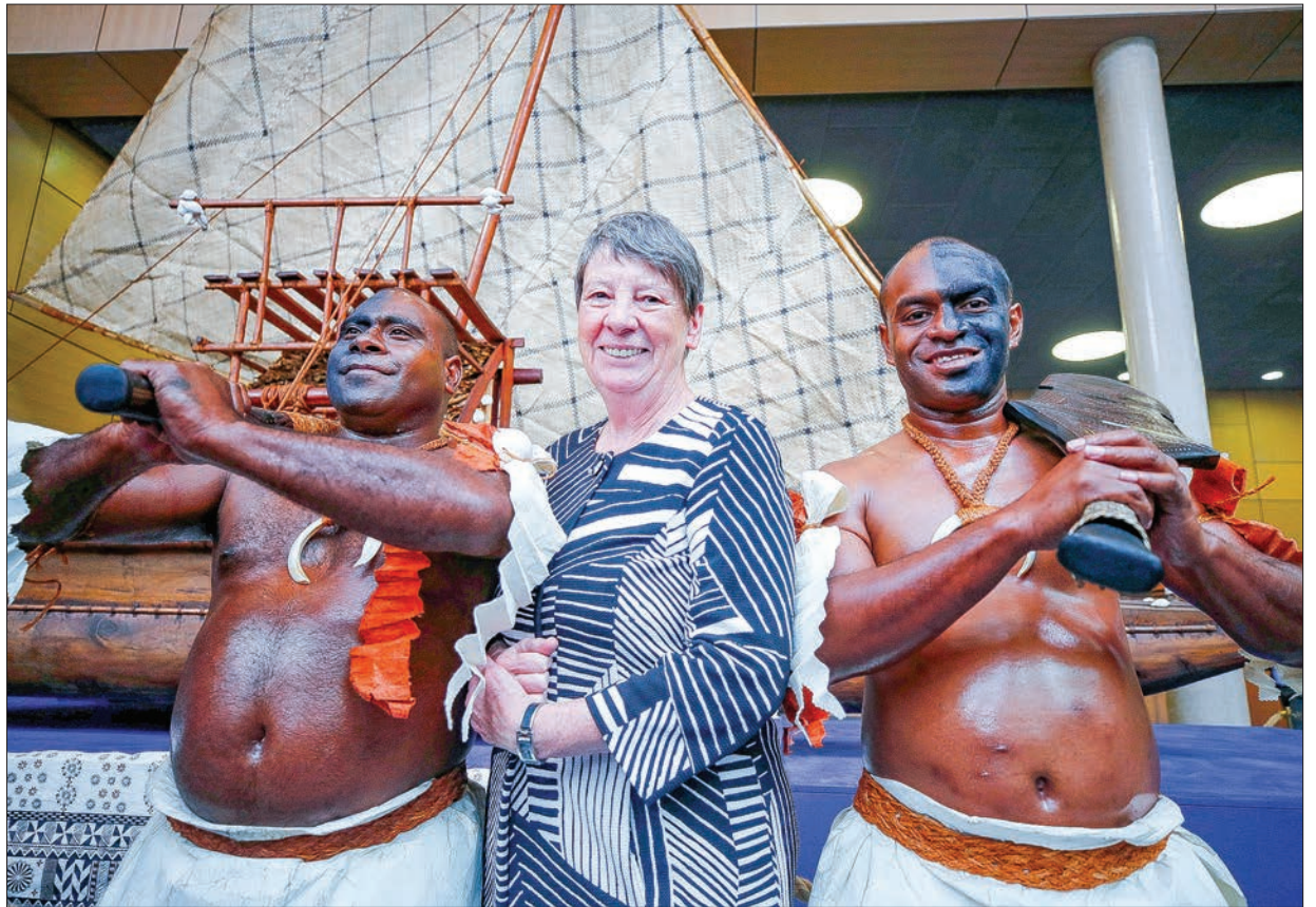
Barbara Hendricks, Germany's Minister for the Environment, Nature Conservation, Building and Nuclear Safety, poses for a picture with traditional dressed Fijian warriors during the COP23 UN Climate Change Conference 2017, hosted by Fiji but held in Bonn, in World Conference Center Bonn, Germany on 6 November, 2017.

Under a set of envisaged steps unveiled Tuesday, the Finance Ministry is considering imposing higher fines on gold smugglers and plans to step up customs inspections with the use of gate-like metal detectors and X-ray detectors nationwide. Currently, Japan imposes a fine of up to 10 million yen on gold smugglers who fail to pay the sales tax and raising the maximum amount is one of the options.—Kyodo News