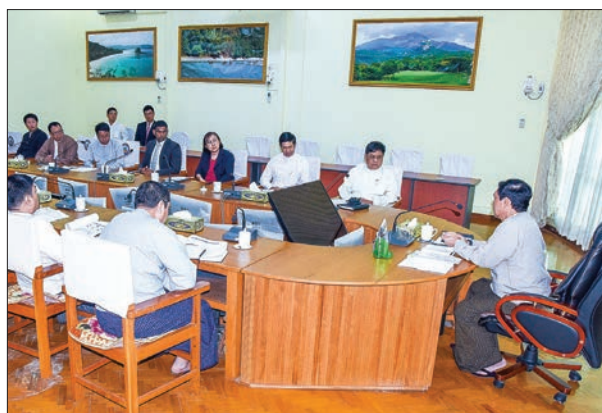
Union Minister U Khin Maung Cho meets with the representatives of Thiha Group, CAMC Engineering Company of China.

Regarding inviting investors for the factories of the ministry, the Union