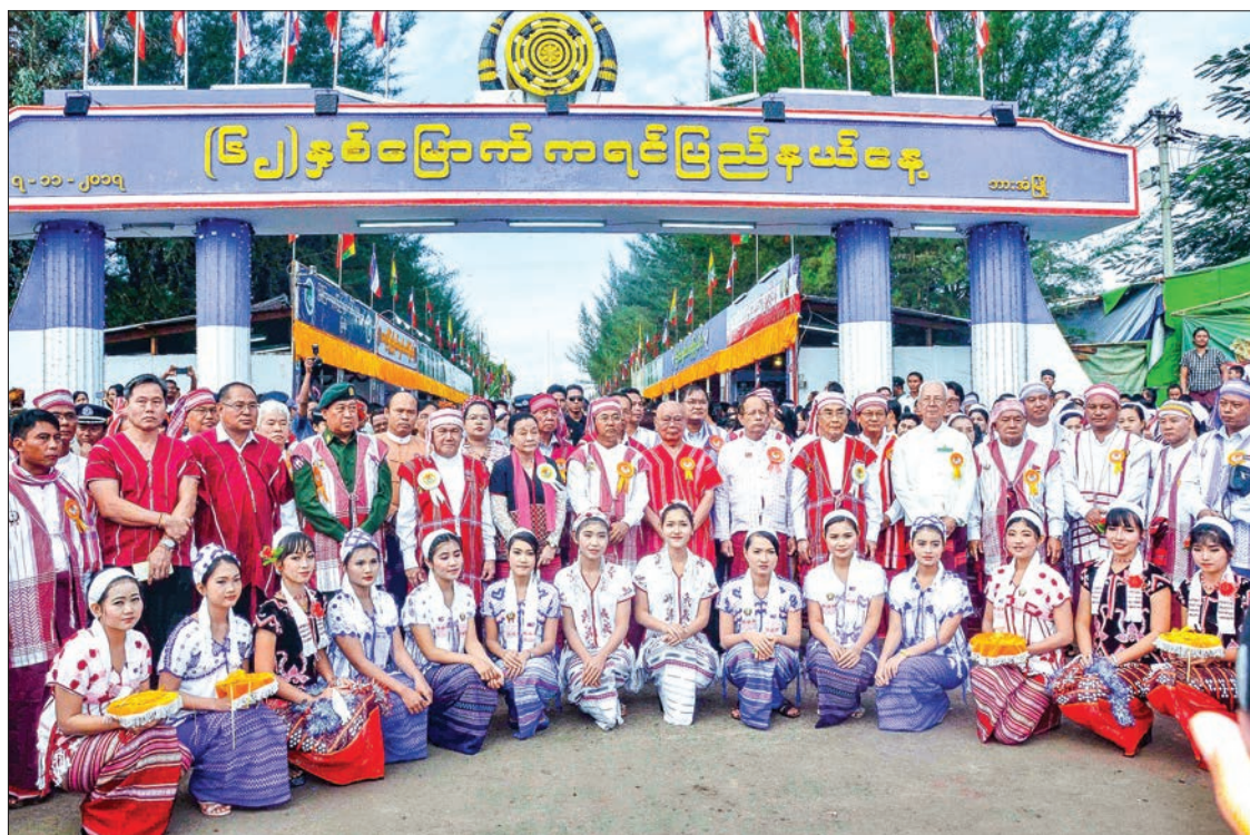
Vice-President U Myint Swe, centre, together with responsible officials and local people pose for photos at the 62 nd anniversary ceremony of Kayin State Day in Myawady, Kayin State.