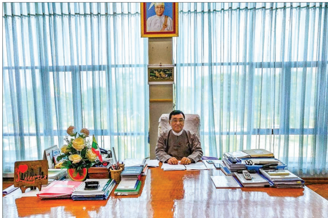
Vice-Chairman of UEHRD Dr Win Myat Aye, Union Minister for Social Welfare, Relief and Resettlement, speaks during the interview with Myanmar News Agency.

A: It is of great importance to find out the root cause of this controversial conflict. In doing so, a