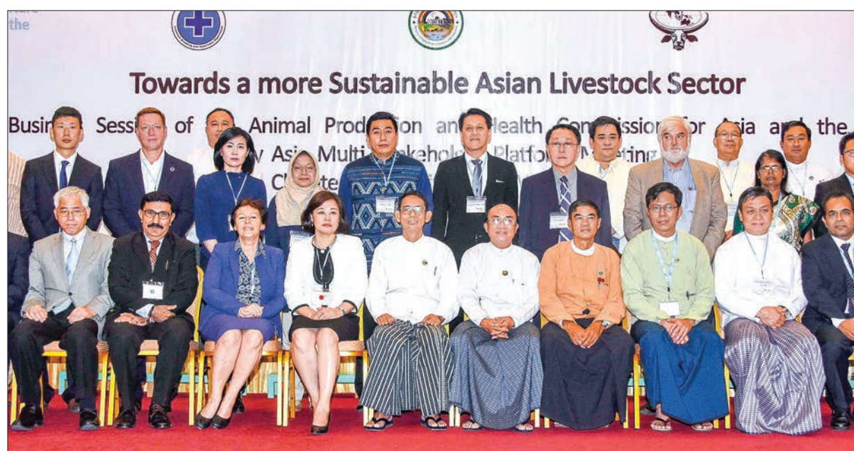
Union Minister Dr Aung Thu and dignitaries pose for a documentary photo.