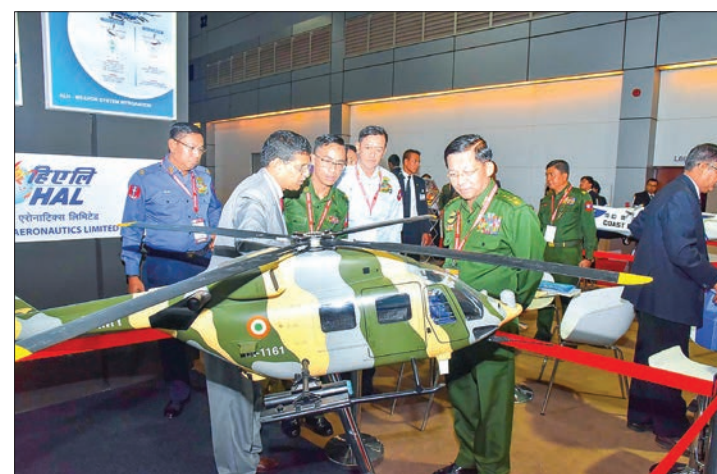
Senior General Min Aung Hlaing inspects the display of military at the Defence & Security expo in Thailand.