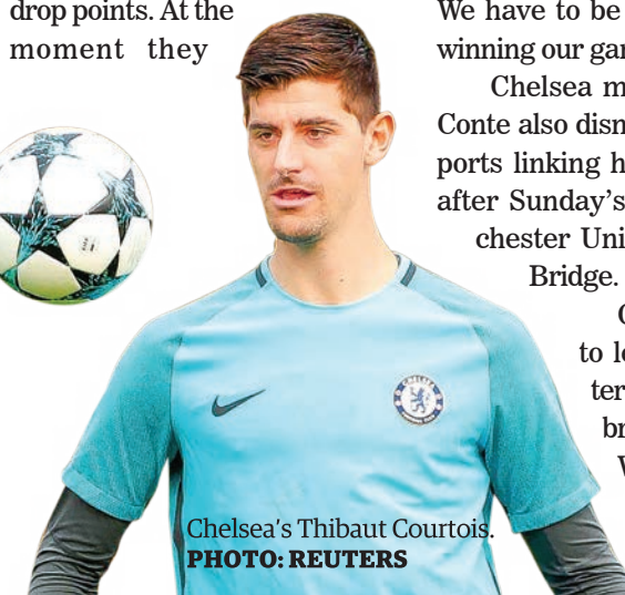
Chelsea's Thibaut Courtois.