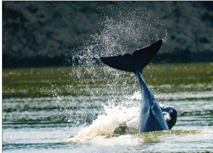
An Ayeyawady dolphin seen at a conservation area near Mandalay.

It is hoped this eco-tourism effort will result in increasing numbers of tourists and local visitors to observe endangered dolphins, eco-villages and fishermen.