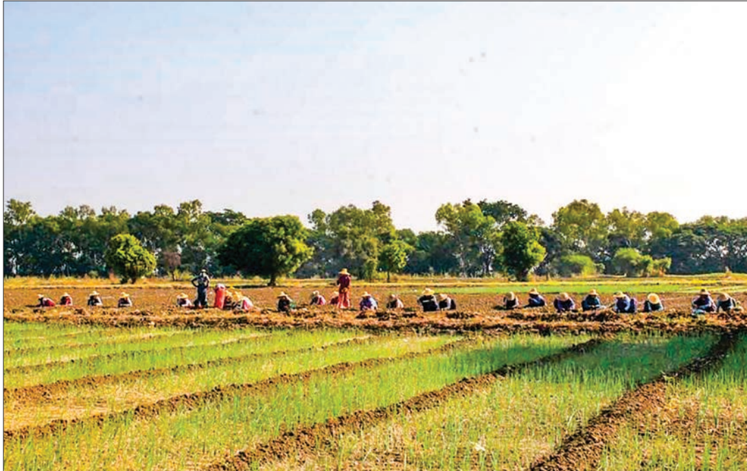
Onion growers planting winter onion on nursery in 2016.

ONION nurseries in Monywa Township, Sagaing Region were destroyed by torrential rain last month, causing the price of seeds to rise, said onion growers.