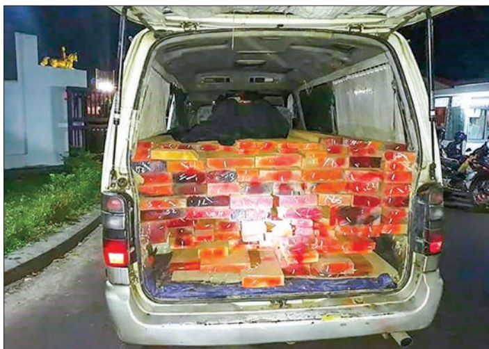
Forestry department officials seized illegal teak timber.

The two suspects are being charged under section 43(A) of the Forestry Act.—Phyo Ko Lin (Nyaung Wine) ■