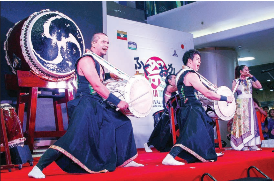
Members of the Japan Marvelous Drummers perform at the Fukuoka-Yangon Festival 2017 in Yangon on 3 November, 2017, to celebrate the first anniversary of the two cities' sister relationship.