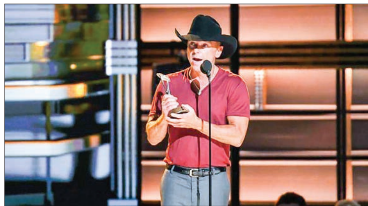
Kenny Chesney accepts the Pinnacle Award at the 50th Annual Country Music Association Awards in Nashville, Tennessee, US on 2 November, 2016.

The busy week of new releases pushed pop star Pink down to 21 st place on the Billboard 200 after the No 1 debut last week of her album "Beautiful Trauma." On the digital songs chart, which measures online single sales, alt-rockers Imagine Dragons retained their No 1 spot with another 54,000 units sold for "Thunder." —Reuters ■