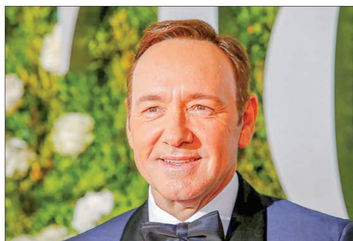
Actor Kevin Spacey.