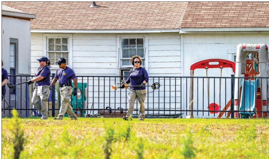
Members of the FBI Evidence Response Team use metal detectors at the playground at the site of the shooting at the First Baptist Church of Sutherland, Texas, US on 6 November, 2017.

Twenty others were wounded, 10 of whom remained in critical condition late on Monday, officials said. Two handguns were found in Kelley's getaway vehicle, where he died of a self-inflicted gunshot wound to the head after a failed attempt to flee from