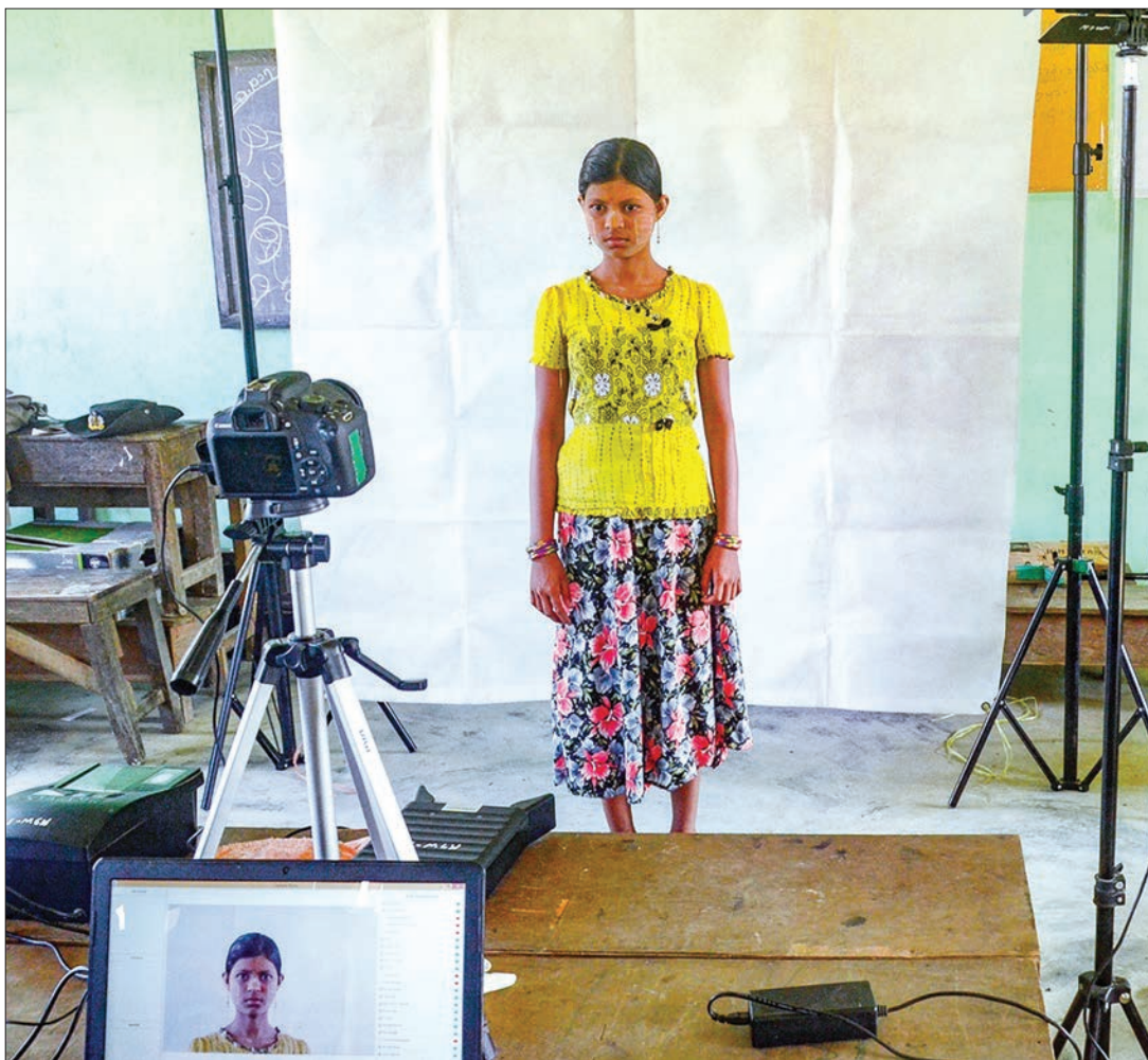
A girl from Zedipyin Village in Maungdaw Township has her photo taken as she applies for a National Verification Card, the first step towards citizenship in Rakhine State.