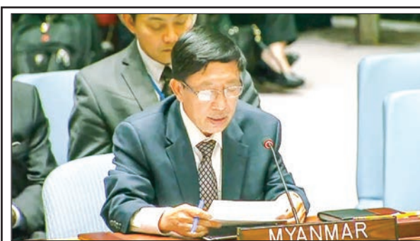
Permanent Representative of Myanmar to UN, U Hau Do Suan.

For the development of the industry sector of Myanmar, factories in the country need investment and technology eyeing local and foreign investors who has strong capital and high technology. After constructing the infrastructure, iron poles, iron plates, iron frames, iron beams, railway lines and other iron and steel products which are demanded by the market will be distributed systematically with the standard quality and fair rates.—Myanmar News Agency ■