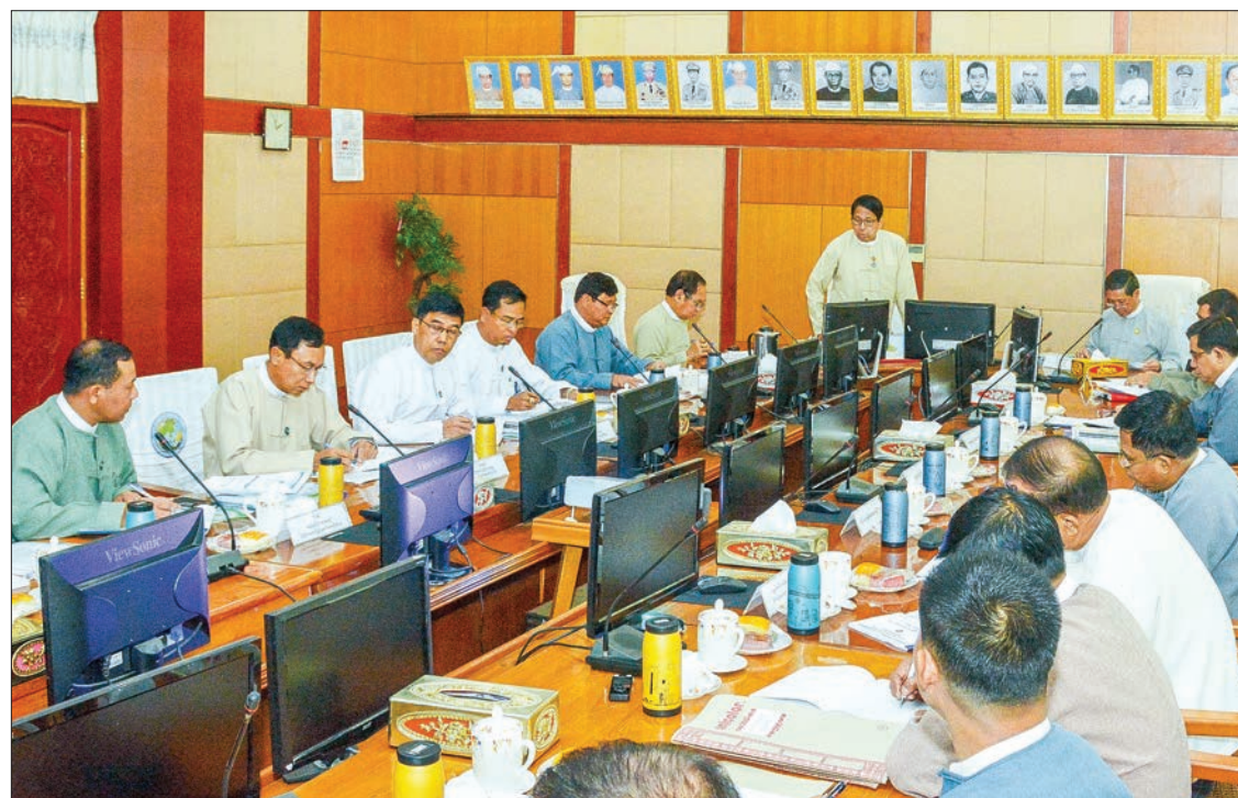
Union Minister for Information Dr Pe Myint addresses the 3 rd Coordination meeting for convening Youth Multi-Development Festival in Nay Pyi Taw, on 7 November 2017.

talks, arrangements of meeting with outstanding youths, programmes for ex-university students/alumni to participate, sports show rooms with extraordinary games included, exhibition on science with the avant-garde of youths included, display of discussion on English and Myanmar languages and related showrooms, description of the festival as the Pre-Centenary Commemorative Ceremony which did coincide unusually, showroom exhibiting preventive ways against contagious and infectious diseases, showing effects which will result from regular physical exercises, programme for making youths know federalism and set-up of federal union, the State Counsellor's address on