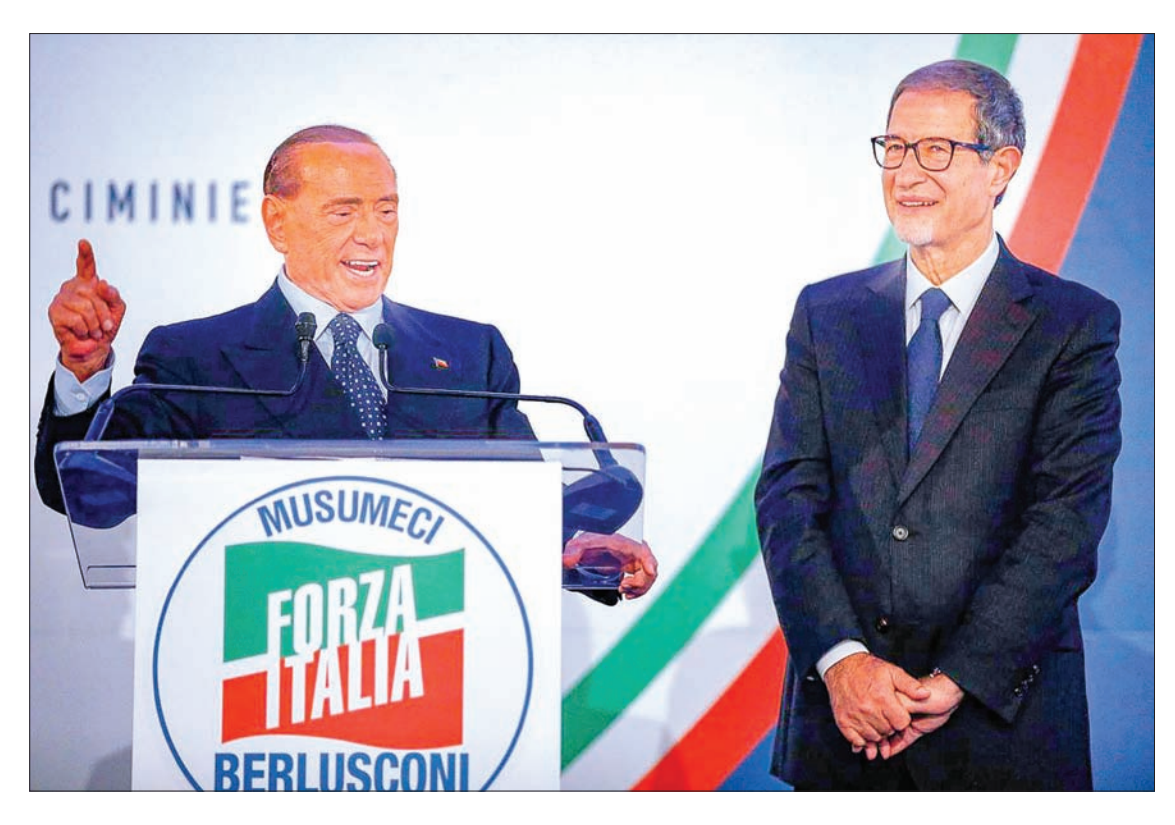
Forza Italia party leader Silvio Berlusconi (L) speaks next to local candidate Nello Musumeci during a rally in Catania, Italy, on 2 November 2017.

Some 4.5 million Sicilians are eligible to vote for the island's new governor, with opinion polls