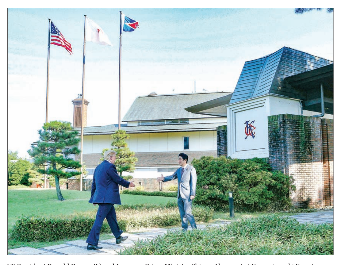
US President Donald Trump (L) and Japanese Prime Minister Shinzo Abe meet at Kasumigaseki Country Club in Kawagoe, Saitama Prefecture, north of Tokyo, on 5 November 2017. Trump and Abe will discuss regional security and other issues during Trump's three-day Japan visit.

Abe has repeatedly voiced support for Trump's position that all options, including military action, are "on the table" in