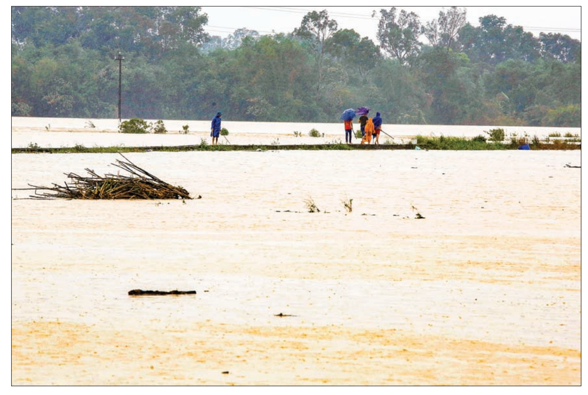
People walk along a flooded road after typhoon Damrey hits Vietnam in Hue city, Viet Nam, on 5 November 2017.

Battle tanks were mobilised to help with rescue efforts.