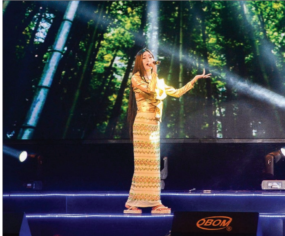
Contestants performing music at level-3 competition at peace music festival in Nay Pyi Taw.

THE first round of Level 3 of Peace Music Festival 2017 was held yesterday in Nay Pyi Taw's Myanmar International Convention Center 2 (MICC-2).