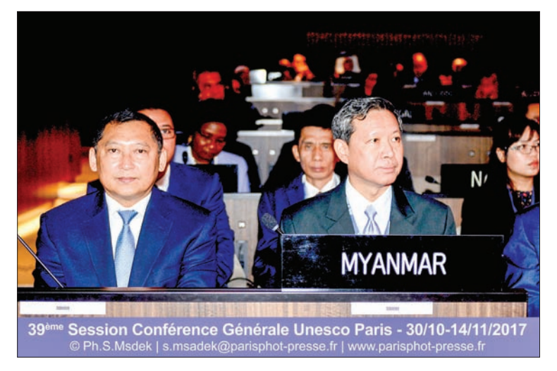
Dr Myo Thein Gyi and party attend UNESCO General Conference in Paris.

At the meeting, the Union Minister discussed and explained Myanmar's policies and strategies to achieve UNESCO's Sustainable Development Goals (SDG). The Union Minster also