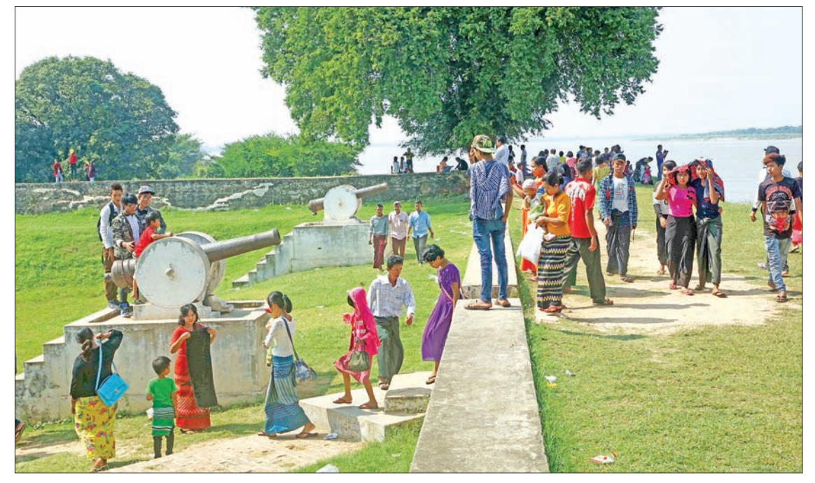
Tourists crowd to Hsin Kyone Fort in Ava ancient city. PHOTO: THAN ZAW MIN/ZEYATU (MAGWAY)

The square-shaped Hsin Kyone Fort consists of three brick walls. This is the best destination to enjoy beautiful landscapes along the river and observe cannons and arsenal in the ancient structure.—Than Zaw Min/Zeyatu (Magway)