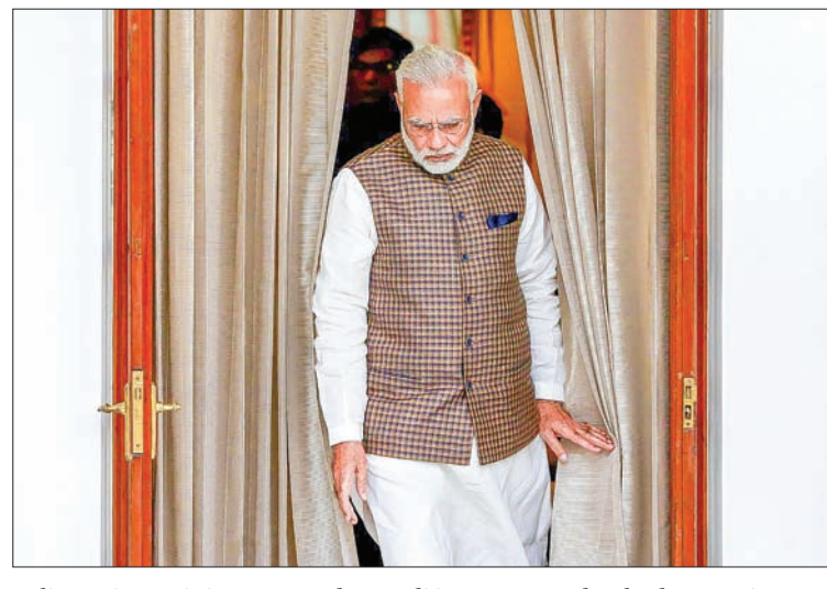
India's Prime Minister Narendra Modi is seen at Hyderabad House in New Delhi, India, on 30 October 2017.

caused by the roll-out of GST and the shock removal of higher-value bills from circulation last year. As a result of these issues India's economy is expected to grow at its slowest pace in four years this fiscal year, a Reuters poll found.