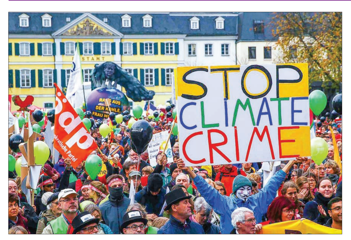
People march during a demonstration under the banner "Protect the climate - stop coal" two days before the start of the COP 23 UN Climate Change Conference hosted by Fiji but held in Bonn, Germany, on 4 November 2017.

WORLD 6 NOVEMBER 2017 THE GLOBAL NEW LIGHT OF MYANMAR