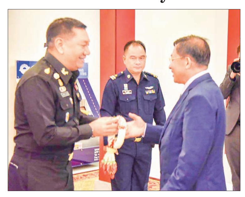
Senior General Min Aung Hlaing is greeted by Chief of Joint Staff of the Royal Thai Armed Forces on arrival in Thailand.

COMMANDER-IN-CHIEF of Defence Services Senior General Min Aung Hlaing and delegation left Yangon by air yesterday morning for Bangkok to attend the ASEAN Defence and Security Exhibition 2017.