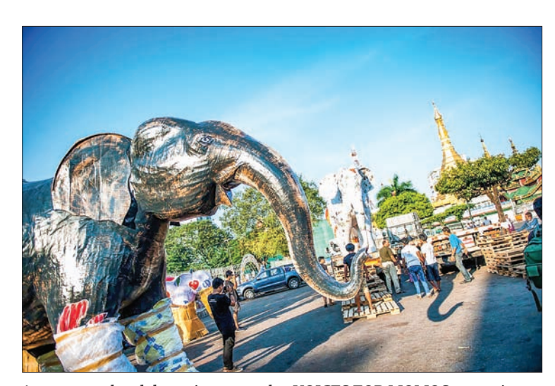
A paper mache elelpant is seen at the VOICES FOR MOMOS campaign, at Mahabandoola Park.

"See big, think big, and do big to save our elephants" is the message that artist Arker Kyaw is sending through We Love Our Momos, a public art that aims to raise awareness of the elephant poaching and skinning crisis in Myanmar. Unveiled today in downtown Yangon, the project which features a herd of seven supersize paper mache elephants is Arker Kyaw's showcase contribution to the VOICES FOR MOMOS campaign.