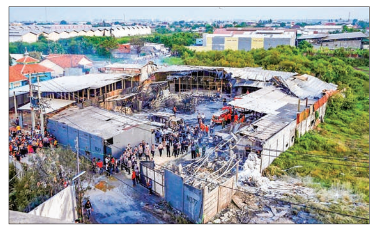
An aerial view of an explosion at a fireworks factory at Kosambi village in Tangerang, Banten province, Indonesia, on 26 October 2017. PHOTO: REUTERS

The building housed more than 4,000 kg of combustible materials in various locations, which, police say, made it all too easy for the fire to rip through the 2,600 square metre factory within minutes, killing 49 workers and injuring dozens more. Survivors told Reuters they had not had any emergency training or drills, and were not familiar with evacuation routes. Police spokesman Argo Yuwono said there was no indication anyone had tried to use the fire extinguisher.—Reuters ■