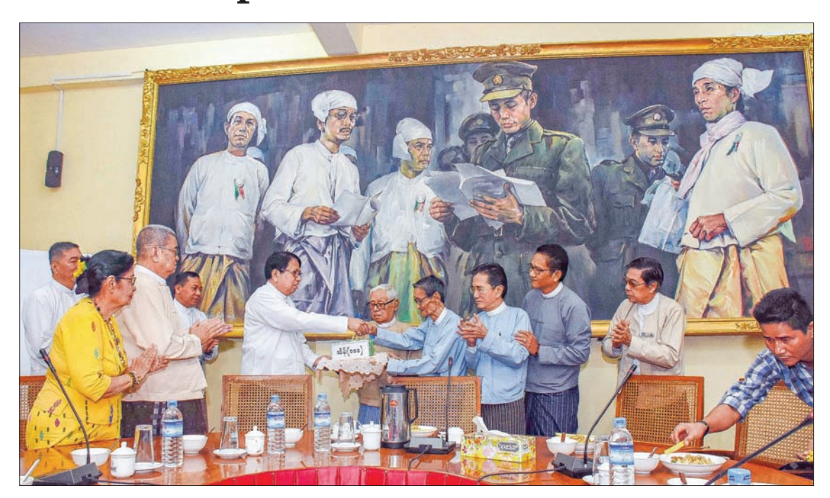
Union Minister Dr Pe Myint accepts donation from Myanmar Motion Picture Organization.

The ceremony for providing donation money for resettlement and development in Rakhine State was held at the meeting hall of MMPO in Wingaba road in Yangon at 8 am of yesterday. The Union Minister for Information attended the event and accepted the donation money.