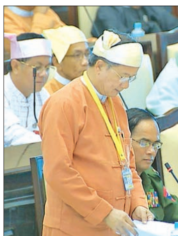
U Ohn Maung, Union Minister for Hotels and Tourism.

“Acquisition of land lease grant, at the time when the land is changed into town land area of Nyaung-U from the original type of land is to be performed under the supervision of Mandalay Region Government in accord with the farmland act of 2012. Expenses to be spent in measuring town land area were demanded to be included in the financial fund of FY 2018-2019 of the Department of Agriculture Land Manage-