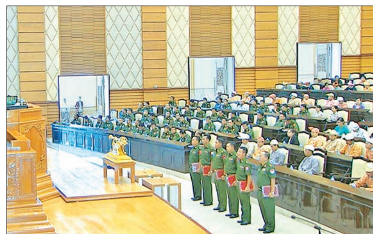
Six Amyotha Hluttaw parliamentarians take an oath during Amyotha Hluttaw meeting.