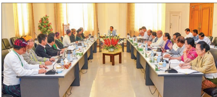
Thura U Shwe Mann meets with multiple groups of the Kachin Christian delegation in Nay Pyi Taw.

Pyidaungsu Hluttaw's Legal Affairs and Special Cases Assessment Commission Chairman Thura U Shwe Mann yesterday morning received multiple groups from the Kachin Christian delegation at the Hluttaw