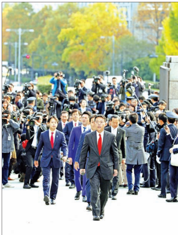
Lawmakers arrive at the parliament building in Tokyo on 1 November, 2017.

The election outcome strengthened the prospects of Abe running in the LDP leadership contest next September and becoming Japan's longest-serving prime minister; after he returned to power in late 2012. At present, he is the third longest-serving Japanese leader in the postwar era. As his long-cherished goal, Abe wants to amend Japan's pacifist Constitution. As part of its election platform, the LDP vowed to discuss changes including an explicit mention of the status of Japan's Self-De-