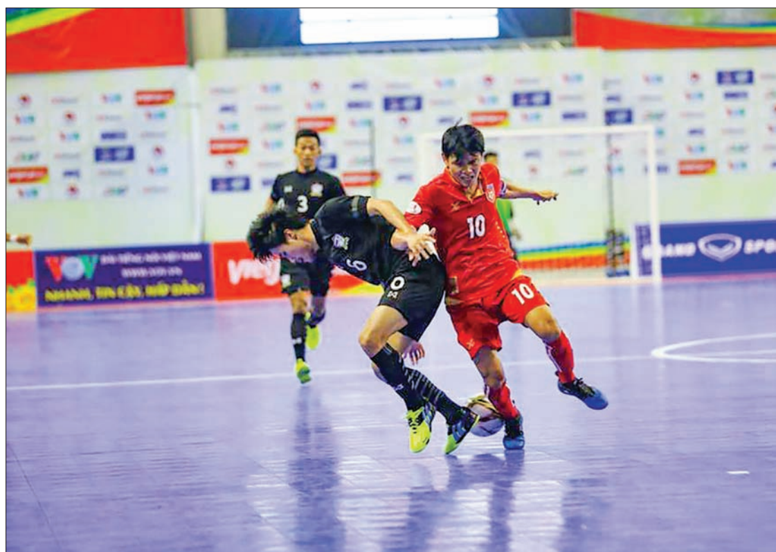
Thailand (black) and Myanmar (red) struggle for the ball at Phu Tho Indoor Stadium in Ho Chi Minh City yesterday.

But Thailand continued pressing Myanmar and showed