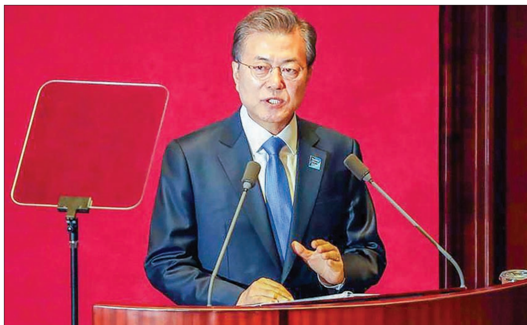
South Korean President Moon Jae-in delivers his speech on the 2018 budget bill during a plenary session at the National Assembly in Seoul, South Korea on 1 November, 2017.

Moon's remarks and China's statement came a day after China and South Korea agreed to normalise relations to end a year-long standoff over the deployment of the US Terminal High Altitude