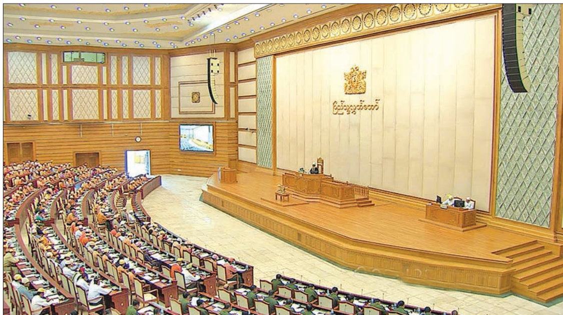
Pyithu Hluttaw is being convened in Nay Pyi Taw.

access to and fro between east and west of the river. If implemented, on the west bank the road will reach Thayet, Mindon, Pathein, Monywa and thence to Kyaukpyu deep sea port, SEZ Development Project, and on the east bank of the river the road will reach Aunglan, Yangon, Pyay, Taungdwingyi, Magway, Kyaukpadaung, Myingyan and the Mandalay Expressway. Cement bags will be easily able to be distributed to the eastern parts of Ayeyawady River. And it will speed up economic development of the western part of the Ayeyawady River in Magway Region and help development of related areas. Smooth transport will make the local people develop their economic, social, education and health sectors. A feasibility study is being carried out for successful implementation of the bridge with the aid of the Korea Inter-