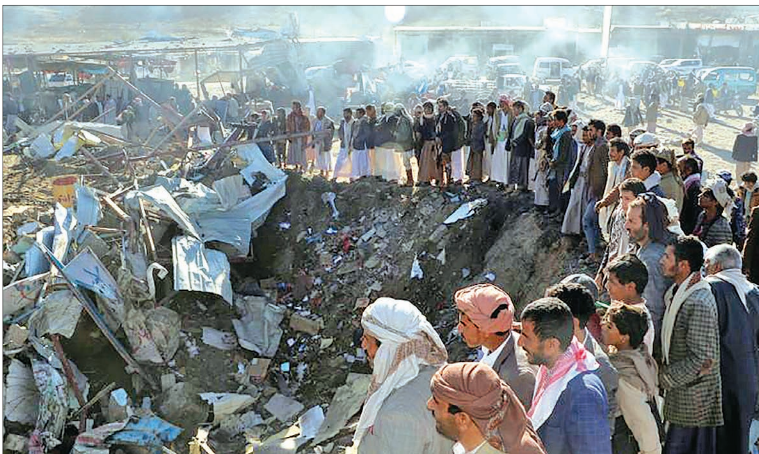
People gather at the site of an air strike in the northwestern city of Saada, Yemen on 1 November, 2017.

The 2-1/2 year war effort has yet to achieve its goal of restoring to power the internationally recognized government, but the conflict has unleashed one of the world's worst humanitarian crises and killed at least 10,000 people.