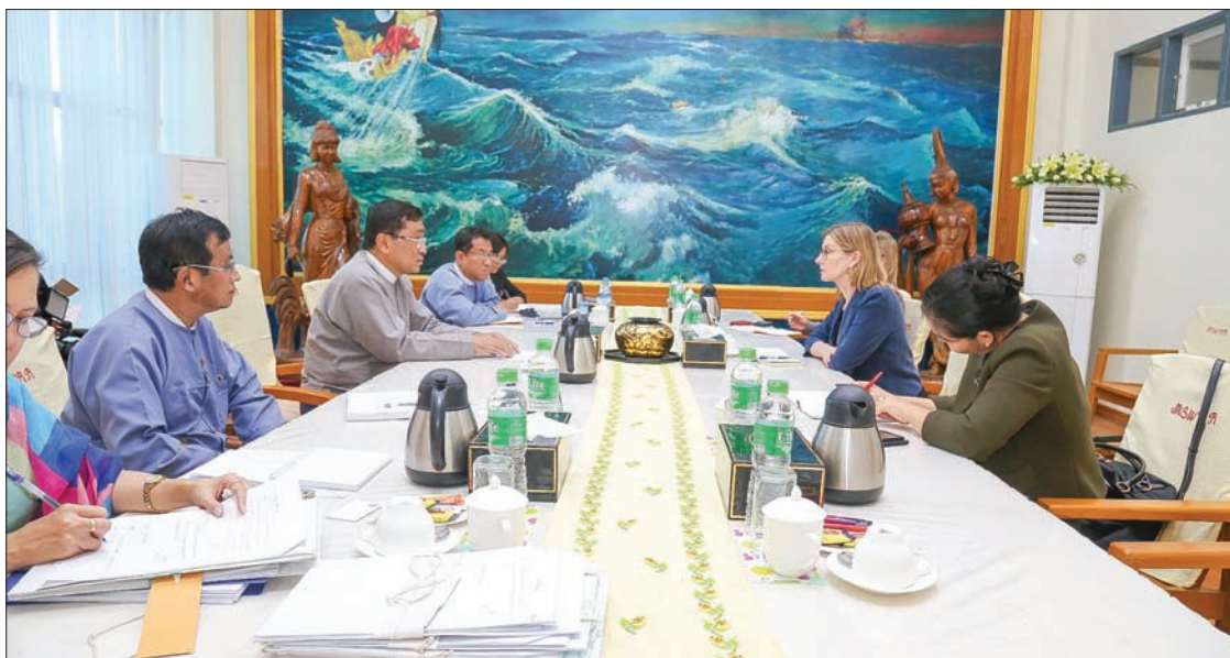
Union Minister Dr Win Myat Aye holds talks with Danish Minister Ms. Ulla Toernaes at the ministry in Nay Pyi Taw on 1 November 2017.

The Union Minister also received a delegation led by Assistant High Commissioner for Protection Mr. Volker Turk