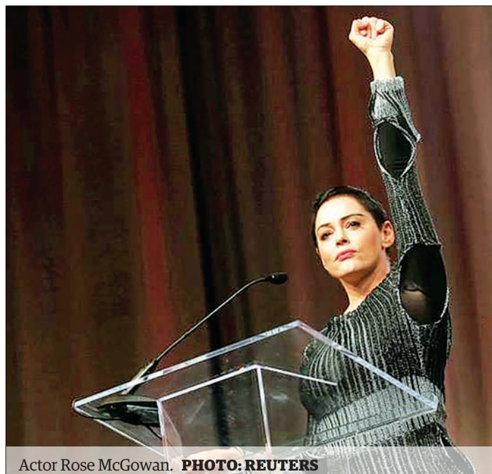
Actor Rose McGowan.

ton Airports Authority Police Department said in a statement on Monday that on 1 February it had issued the warrant for possession of a controlled substance.