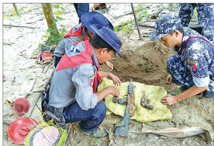
Security members found one gun, bullet cartridge and revolver yesterday.

"At present, the YCDC is working its best on the sewage systems with the use of compressors and manpower," said the mayor. The current sewage system in six townships including Kyauktada, Pabedan and Latha have been in use for more than 100 years.—Ko Moe ■