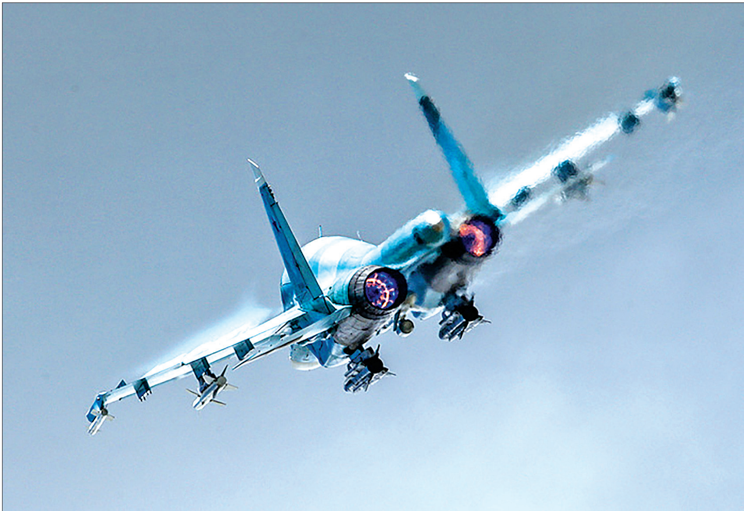
A new attack aircraft will have the same engines as the Su-34.