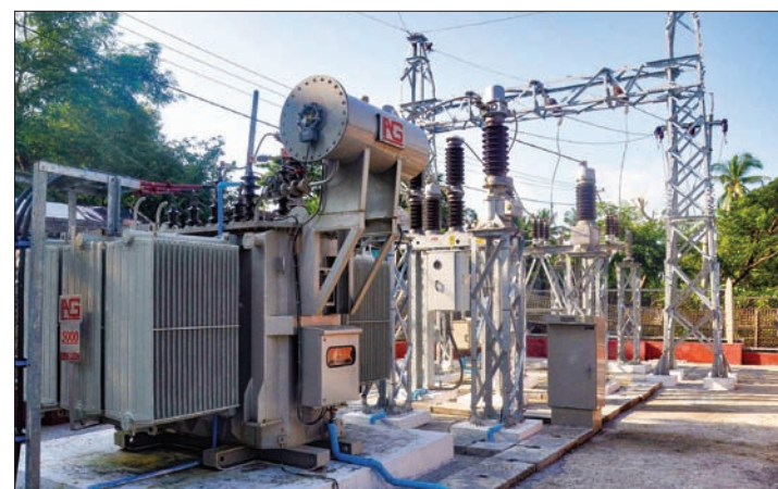
Two electric sub-power stations will be opened in Pawkaw and Myebon Townships in Rakhine State.