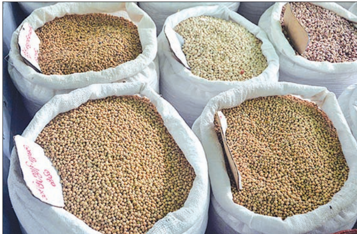
Myanmar pulses are kept on display for sale in a shop at a market.

At present, a huge stock of around 70,000 tons of pigeon peas and 200,000 tons of mung beans are piling up. "The stocks will gradually decrease with local demand", he added.