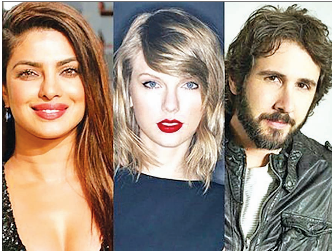
Priyanka, Taylor Swift, Josh Groban.

Josh Groban narrated the incident in a series of tweets, saying that he heard gun shots and