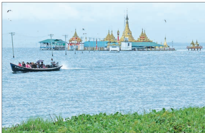
Union Minister U Ohn Win, German Ambassador and representatives from NGO, INGO, CBO and ASEAN center for Biodiversity, officials observed and toured Indawgyi Lake with boats.

Setting Indawgyi Lake area as a Biosphere Reserve is a great opportunity for sustainable development of natural resource maintaining biodiversity and ecosystem. It is the third largest lake in South East Asia. The