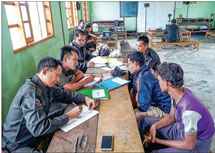
Mobile immigration officials conducting national verification process to the villagers in Maungtaw Township, Rakhine State.

The other teams have issued the NV cards to more than 2,600 people from Shwezar (North), (West) and (Middle) villagers in mid-October and provided mosquito nets and food to the villagers.— Myanmar News Agency ■