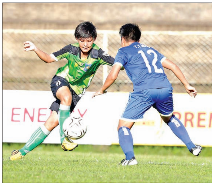
Players from YREO and Gandamar vie for the ball in yesterday's match at Padonmar Stadium