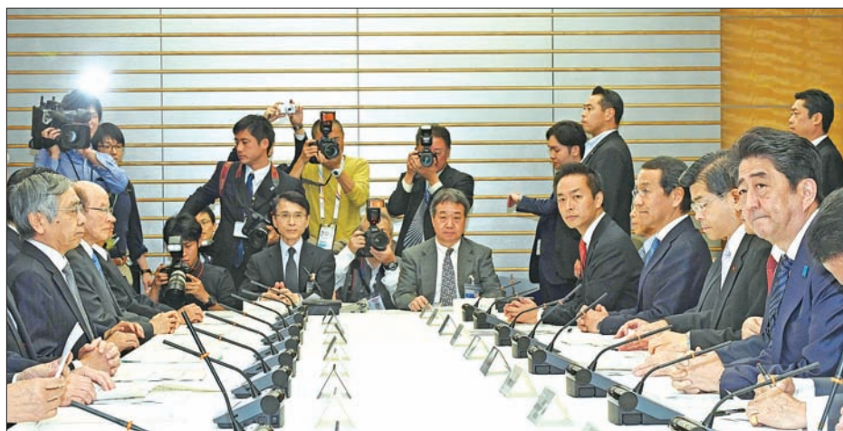
Japanese Prime Minister Shinzo Abe (far L), members of his Cabinet and Bank of Japan Governor Haruhiko Kuroda (far R) meet at the prime minister's office in Tokyo on 25 October, 2017, over a monthly economic report for October. Japan's economy is recovering moderately, the report said, reinforcing the view that what would be the second-longest postwar expansion is continuing.

The Cabinet Office retroactively determines the length of an economic boom after its panel of