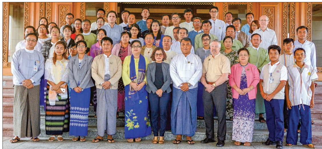
Participants pose for a documentary photo after holding 19 th National-level monsoon forum.

Also present at the meeting were officials from UN Resident Coordinator Office, U San Shwe Aung, member of Legal Affairs and Special Cases Assessment Commission of Pyidaungsu Hluttaw and officials from the office.—Myanmar News Agency ■