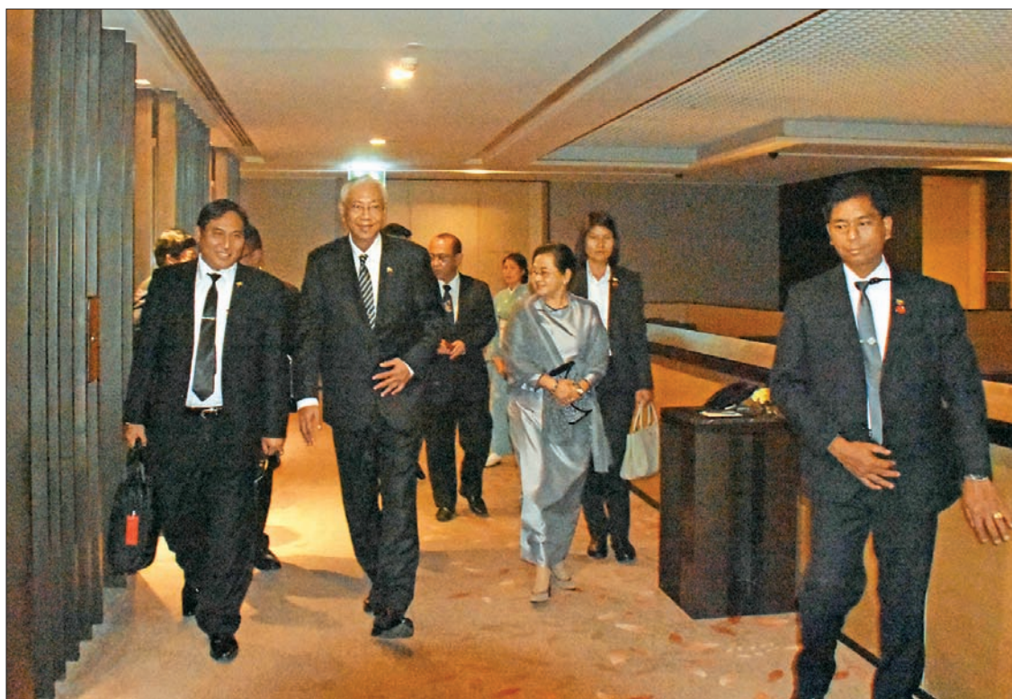
President U Htin Kyaw and wife Daw Su Su Lwin arrive in Don Mueang Airport in Bangkok to attend the funeral of Thailand's King Bhumibol Adulyadej yesterday.