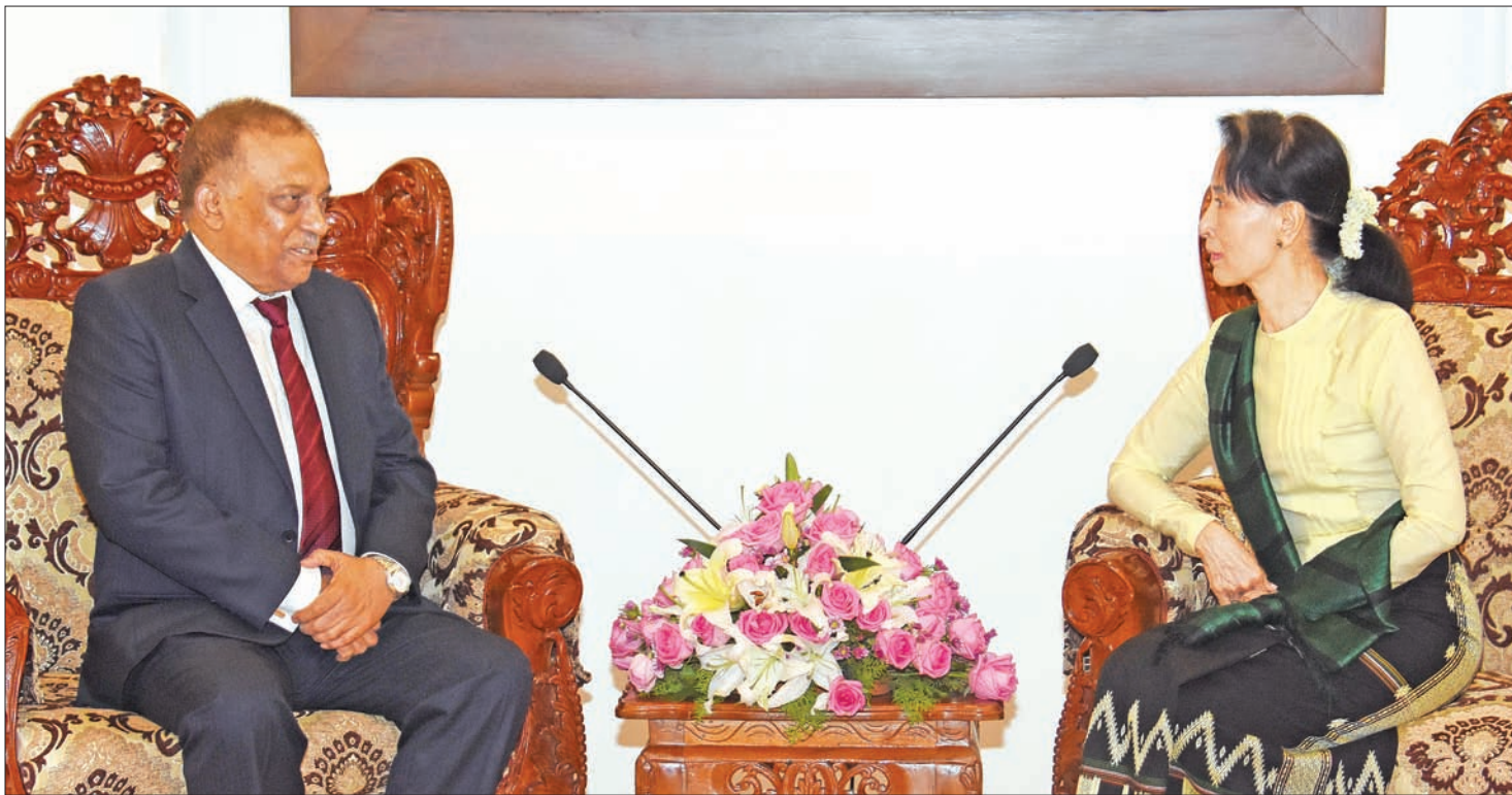
State Counsellor Daw Aung San Suu Kyi, right, with the Bangladesh Minister for Home Affairs Mr. Asaduzzaman in Nay Pyi Taw.