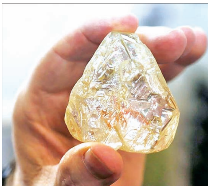
A 709-carat diamond, found in Sierra Leone and known as the "Peace Diamond", is displayed during a tour ahead of its auction, at Israel's Diamond Exchange, in Ramat Gan, Israel on 19 October, 2017.

auctioneers described as the 14 th largest in the world, was unearthed in Koryardu in March by a Christian pastor who gave it to the government.