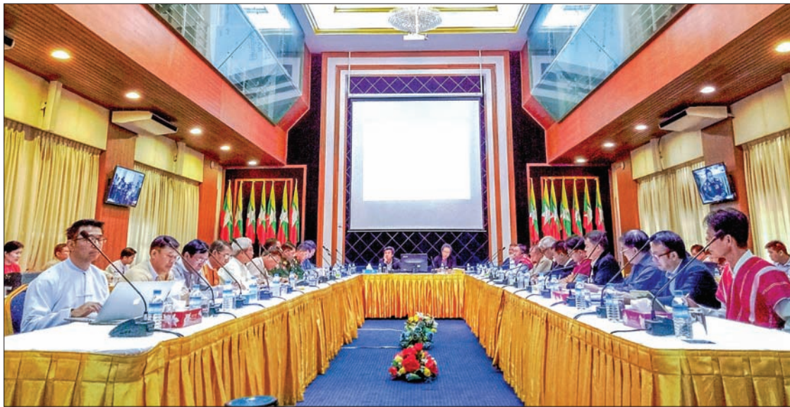
A joint implementation coordination meeting on Nationwide Ceasefire Agreement held in progress in Yangon on 25 October 2017.

point was mostly from the ethnic people's perspective and was carried out since the previous government's administration.