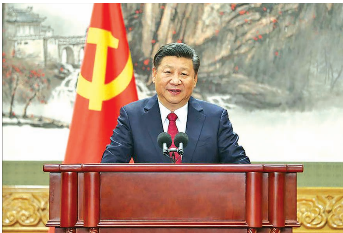
Xi Jinping, general secretary of the Central Committee of the Communist Party of China (CPC), speaks when meeting the press at the Great Hall of the People in Beijing, capital of China on 25 October, 2017.

establish a moderately prosperous society across all metrics in 2020.