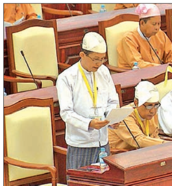
Dr Tun Naing, Deputy Minister for Electricity and Energy.

“Now, as inland natural gas is decreasing in production from the above-said oil fields, No. 2 Kyun Chaung fertilizer plant stopped its production on 31st May 2009, with production from No. 3 Kyaw Zwa fertilizer plant stopped on 7th September 2010. Due to long