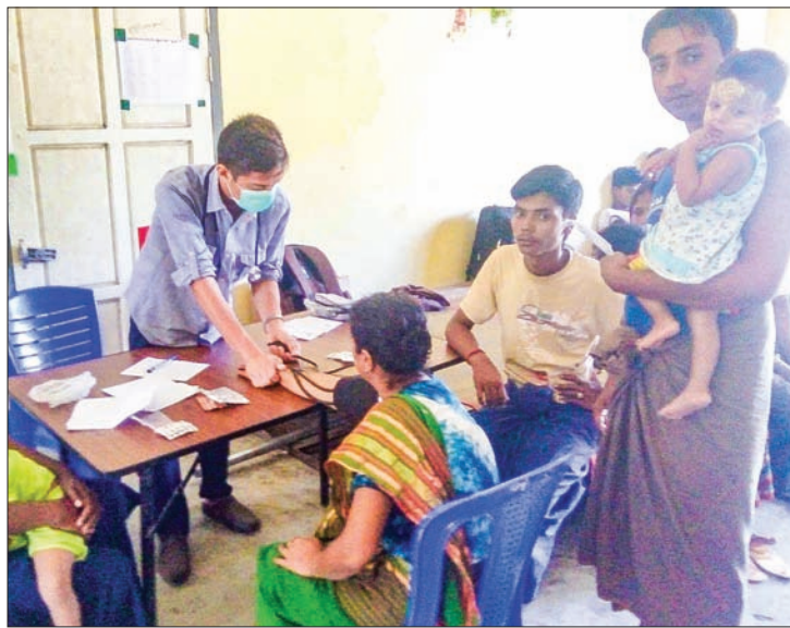
Medical officer giving a medical check-up to a Hindu woman in the IDP camp in Sittway.