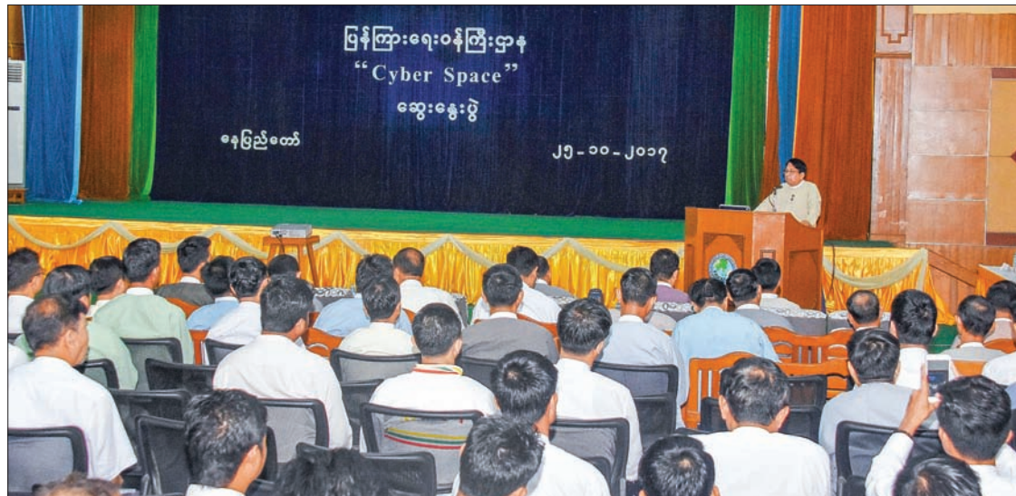
Dr. Pe Myint, Union Minister for Information, at podium, speaks to attendees of a seminar on internet security.

Therefore, in the current epoch, it needs to be understood how the activities are done using high technology. Acquisition of individual development in high technology should be endeavoured at all cost. Individual development can bring about the development in the department concerned, and then in development of the country. Today three expert professionals are invited and they will impart their technological knowledge as much as possible. The attendees shall take all what they are given. The visiting experts will share their knowledge regarding cyberspace