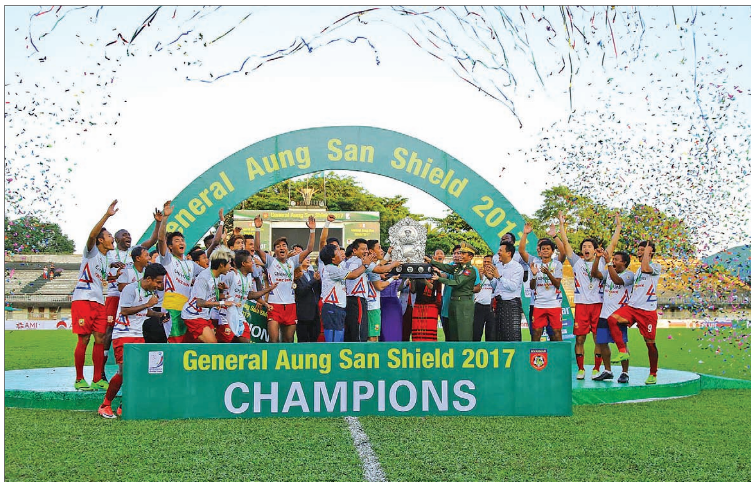
Champion Shan United team receiving the shield yesterday at Aung San Stadium.

This was Shan United's first tourney championship. ■