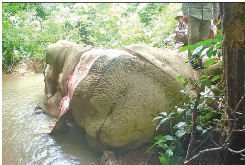
A slain elephant stripped of its skin was the victim of a new epidemic threatening Asian elephants in Myanmar which are already endangered.

which has now become the epicentre of this poaching epidemic.