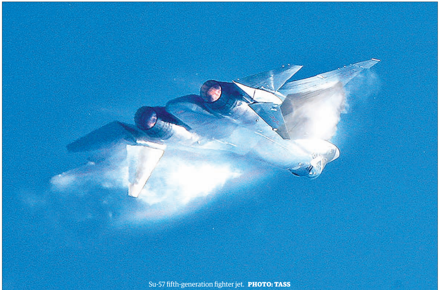
Su-57 fifth-generation fighter jet.

FGFA project was signed in 2007. In early May, a source in India's Defence Ministry told the Indian news agency PTI that a contract on the development of a detailed project of the new