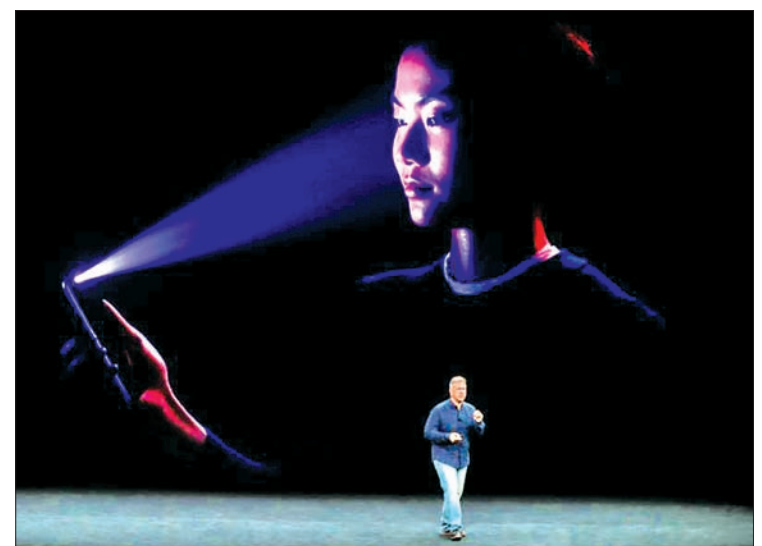
Apple Senior Vice President of Worldwide Marketing, Phil Schiller, introduces the iPhone x during a launch event in Cupertino, California, US on 12 September, 2017.

Apple has been facing a slew of issues with its latest set of phones that it launched on 12 September, with the iPhone 8 and