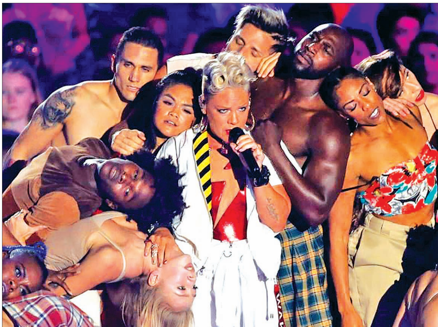
Singer Pink performs at the 2017 MTV Video Music Awards Show in Inglewood, California, US on 27 August, 2017.