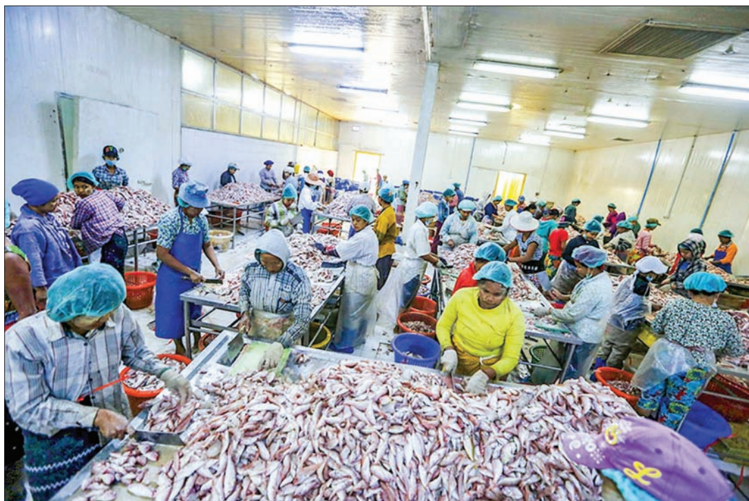
Women workers process fish at a seafood export factory in Hlaingthaya Industrial Zone in Yangon.