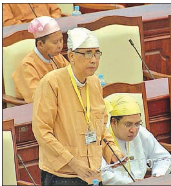
U Kyaw Myo, Deputy Minister for Transport and Communications.

“Out of five fertilizer plants under Myanmar petroleum chemical enterprise, No. 2 fertilizer plant (Kyun Chaung) and No. 3 fertilizer plant (Kyaw Zwa) stopped production a long time ago, having suffered great losses. No. 2 Kyun Chaung fertilizer plant was built in 1968 by the Pintsch Bamag Co. of Germany, operated by using inland natural gas from the Kyauk Khwet, Ayardaw, Thargyitaung oil fields. It had production capacity of 207 tons of fertilizer per day, (which it produced) for 49 years. No. 3