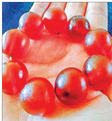
The skin is polished and made into blood-red beads, which are sold as bracelets and necklaces at up to £75 each.

Last year, rangers found more than 60 elephants butchered for skin in Myanmar,