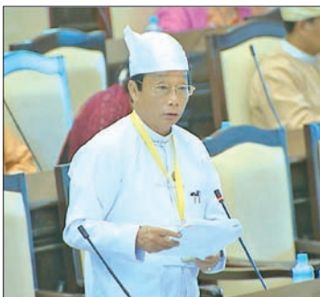
Deputy Minister for Agriculture, Livestock and Irrigation U Hla Kyaw.

“Rakhine State is situated along the coast, so it is naturally in the storm-prone area. Accordingly it faces risks of storms annually and construction of cyclone resistant shelters is under way in cooperation of Union Government and Rakhine State Cabinet. The department of relief and resettlement had already built 12 units of cyclone shelters during the period—from FY 2013-2014 to 2016-2017 with