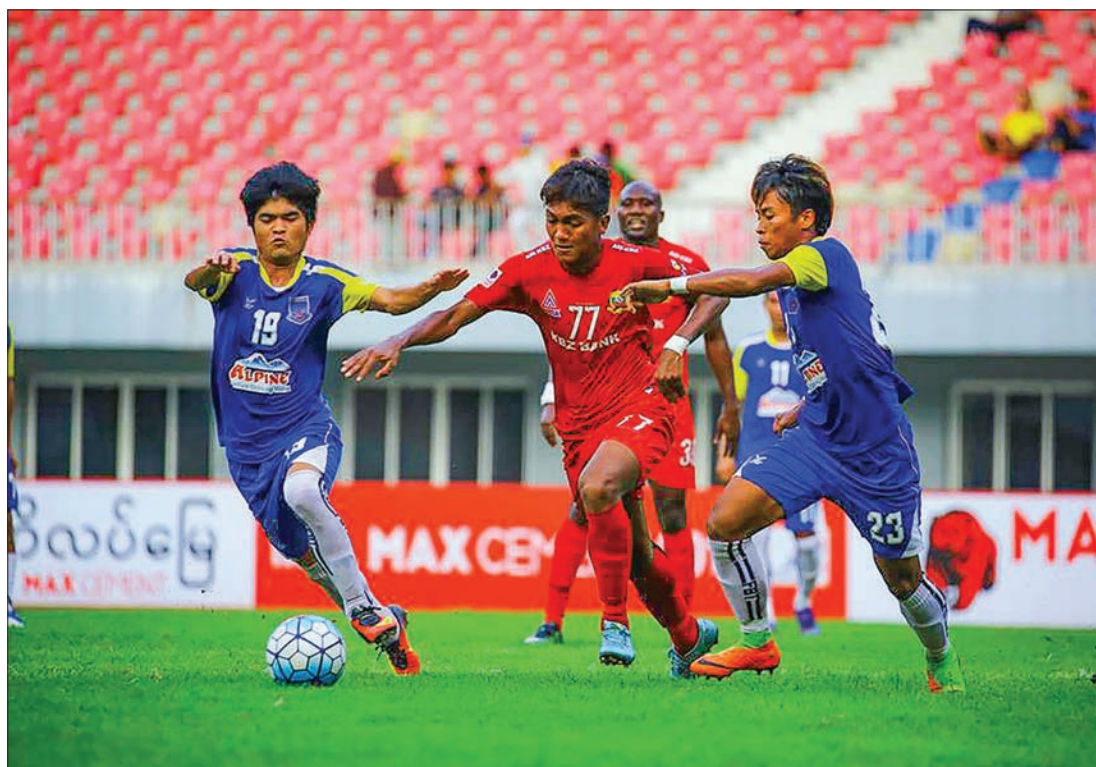
Players from Yadanabon and Shan United vie for the ball in yesterday's match at Mandalar Thiri Stadium in Mandalay.