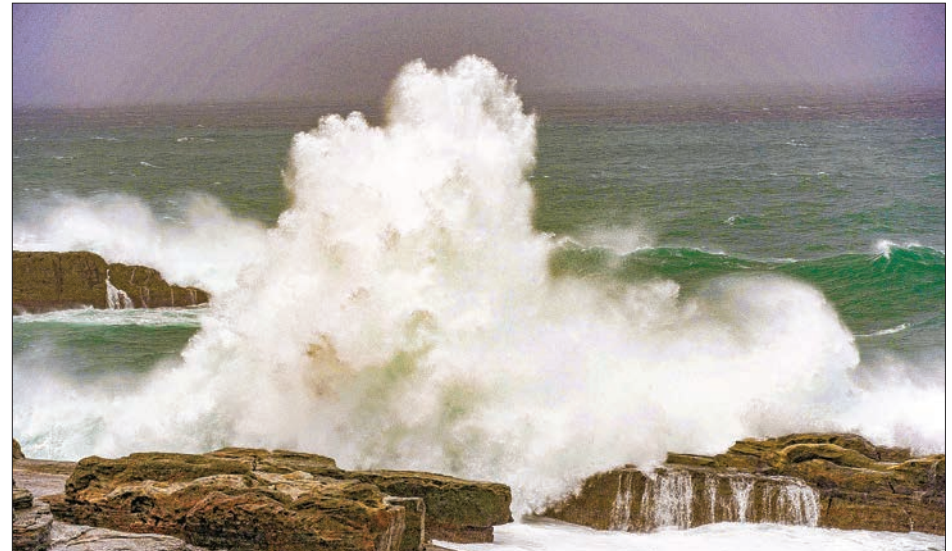
Waves crash on the coast of Shirahama, Wakayama Prefecture on 22 October, 2017, as Typhoon Lan approaches Japan's main island of Honshu.

TOKYO — Typhoon Lan was approaching Japan's main island of Honshu on Sunday, bringing rain to much of the nation as voting continued in the general election.