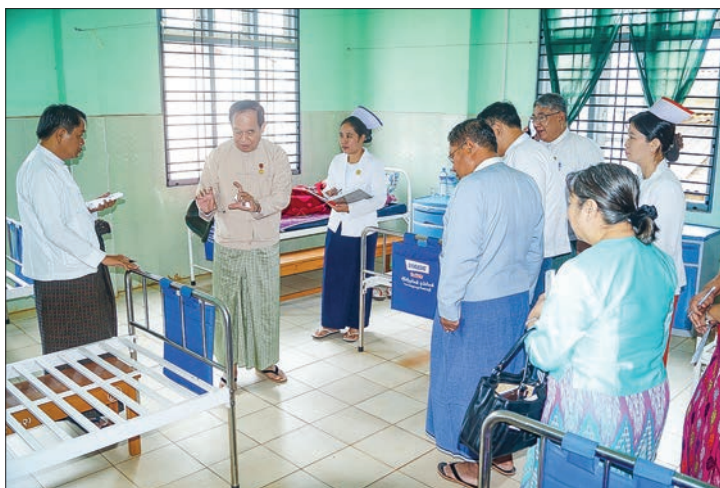
Union Minister Dr Myint Htwe visits Pekhon People's Hospital.

Then, the Union Minister met with health staff and clarified regarding health care service for all people and the service to cover all people regardless of race, religion, rich or poor, disease prevention, upgrading health care standard, giving perfect health care services such as finding the disease area and treatment, and rehabilitation and all people to get