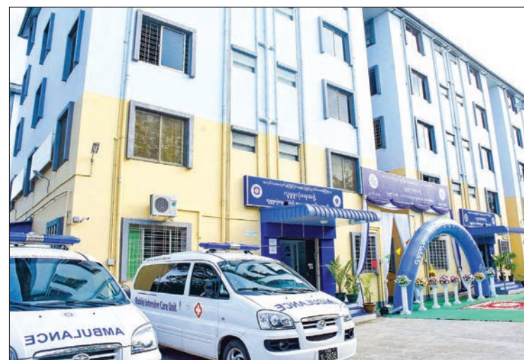
Carewell Clinic in Shwepyitha.