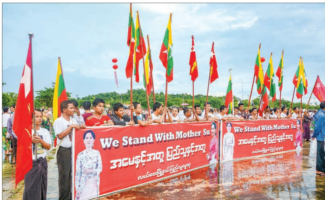
Local people participate in the rally to show their solidarity with Daw Aung San Suu Kyi.