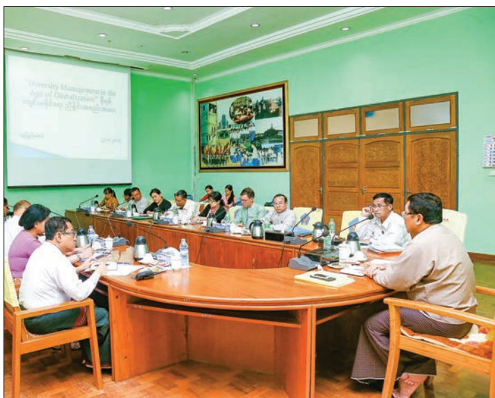
Union Minister Dr Win Myat Aye addresses the meeting on holding the "Diversity Management in the Age of Globalization."

Attending the meeting yesterday were the Deputy