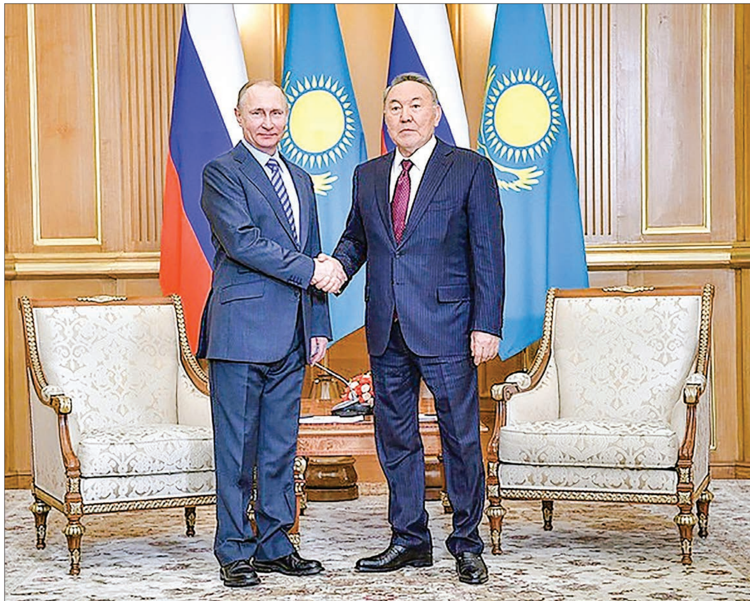
Russia's President Vladimir Putin greets Kazakhstan's President Nursultan Nazarbayev.

MOSCOW — Russia's President Vladimir Putin greeted Kazakhstan's President Nursultan Nazarbayev on the 25 th anniversary of diplomatic relations between the countries, noting the high level of strategic partnership. The telegram is published on the Kremlin's website on Sunday.