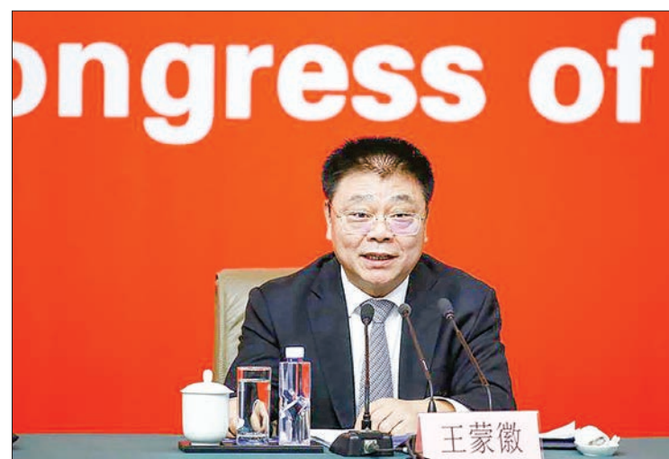
China's Minister of Housing and Urban-Rural Development Wang Menghui speaks at a press conference held by the press center of the 19 th National Congress of the Communist Party of China (CPC) in Beijing, capital of China on 22 October, 2017. The press conference was themed on securing and improving people's livelihood.

The government is also carrying out pilot programs in 12