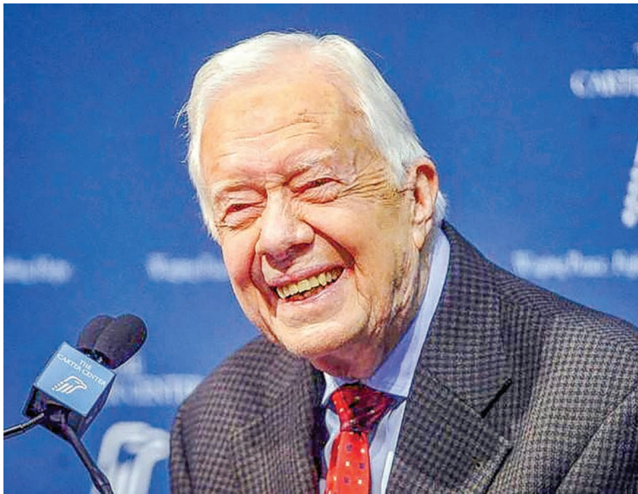
Former US President Jimmy Carter.

Carter, a Democrat who was president from 1977 to 1981, said he had spoken to Trump’s National Security Adviser Lt-Gen