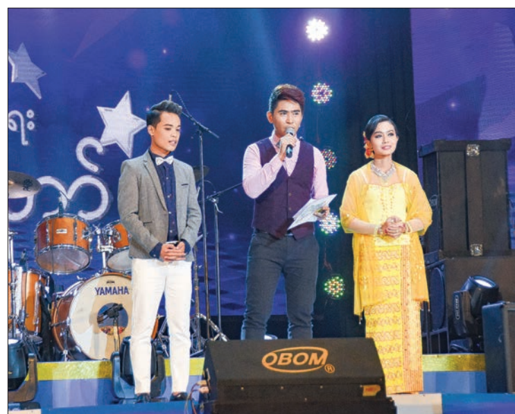
Peace music festival in progress in Mandalay.

calists and all the contestants will entertain the public at the Grand Final.