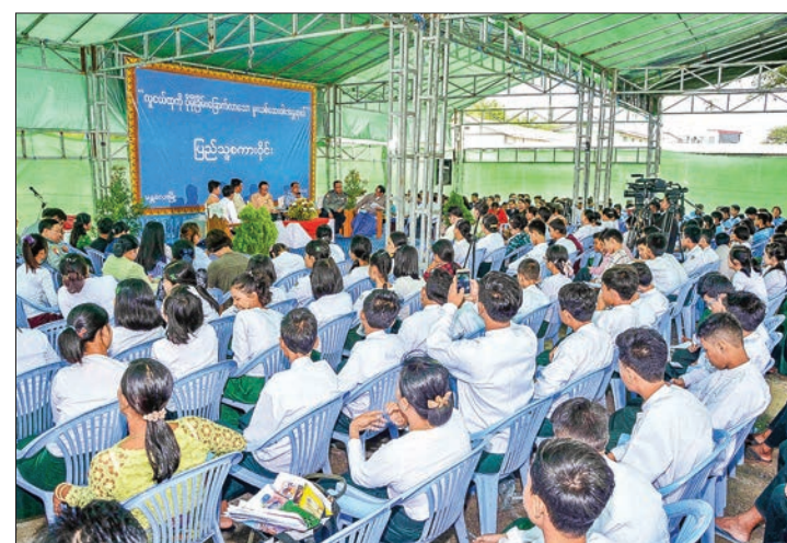
People participate in the public talk in Mandalay.