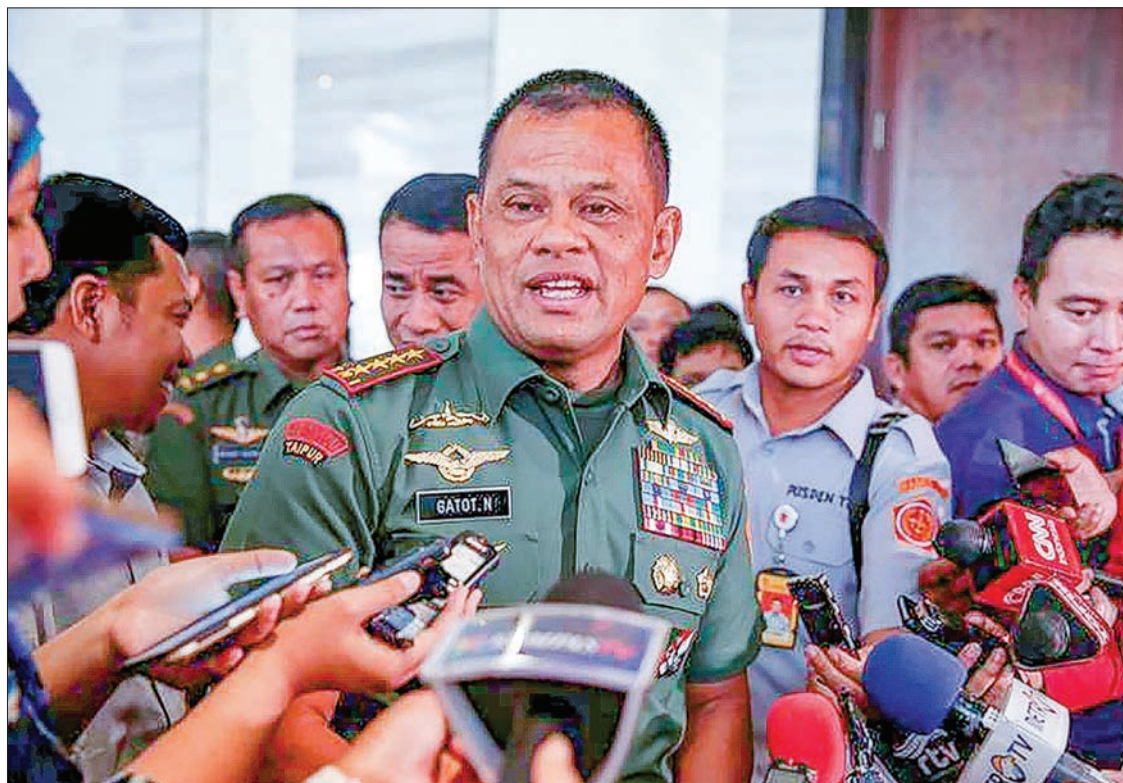
Indonesian military Chief Gatot Nurmantyo talks to reporters in Jakarta, Indonesia on 5 January, 2017.

"After receiving that information, our foreign affairs minister has asked our ambassador in Washington DC to send a dip-