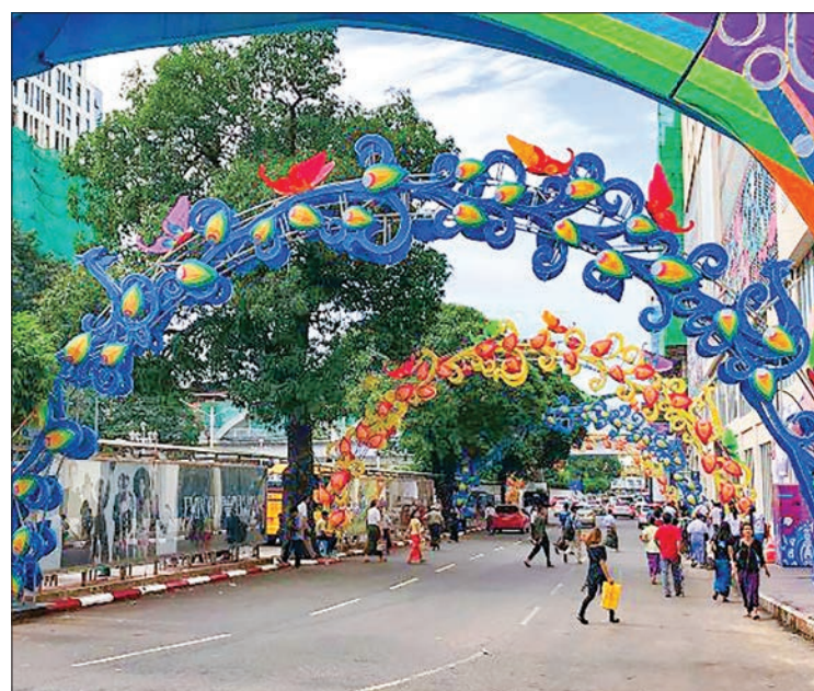
Lantern are displayed outside Sule Square Office Tower and Retail Mall on the official opening day.

The unveiling of the mixed-use grade-A Sule Square Office Tower and Retail Mall represents Shangri-La's investment