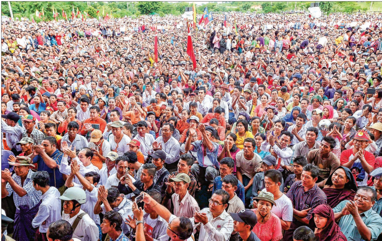
People assemble at the Uppatasanti Pagoda ground in Nay Pyi Taw to show their support to Daw Aung San Suu Kyi.