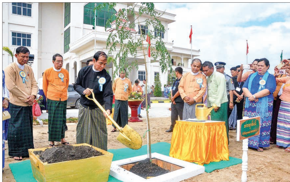
Pyithu Hluttaw Speaker U Win Myint planting a tree to mark the opening of new Hluttaw building in Taninthayi Region.

THE new Hluttaw building in Taninthayi Region was opened at a ceremony on 22 October and attended by U Win Myint, the Speaker of the Pyithu Hluttaw.