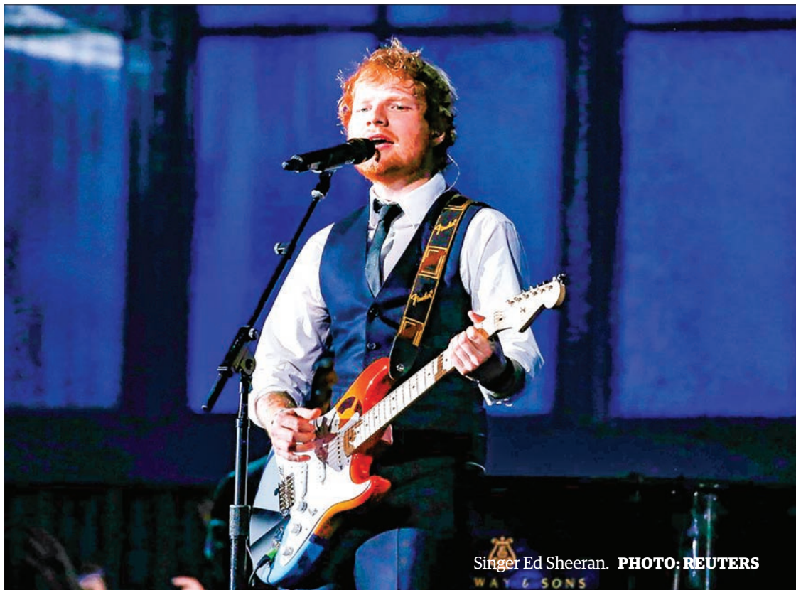
Singer Ed Sheeran.

he completely started focusing on his work as he did not want to lose his success to addiction.