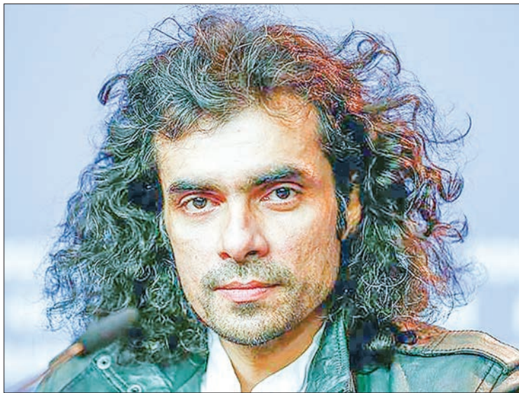
Director Imtiaz Ali.

"I feel elated that people love the simplicity of the movie. It is a bit different. It is about positivity, it gives you hope, makes you smile, especially that part