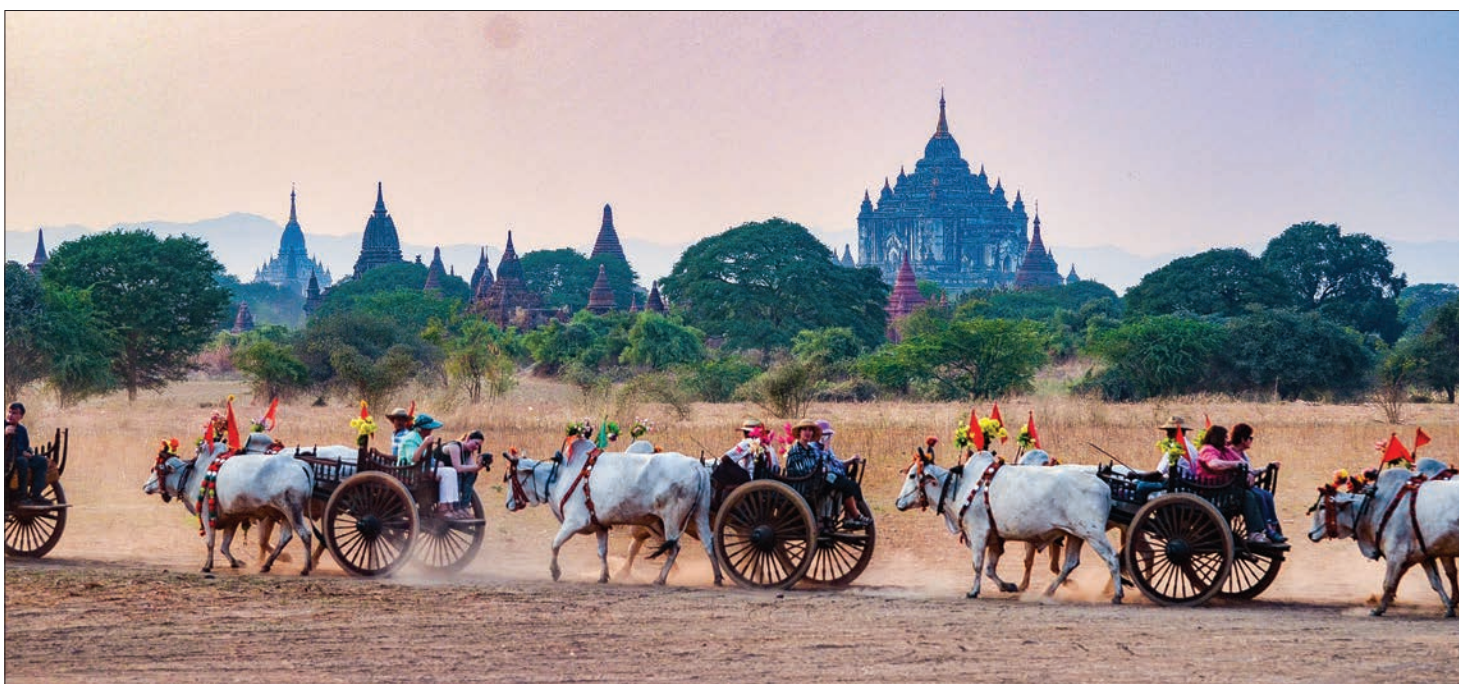
Pagodas of Bagan with a procession of traditional carts in the foreground.

gnlmdaily@gmail.com www.globalnewlightofmyanmar.com www.facebook.com/ globalnewlightofmyanmar