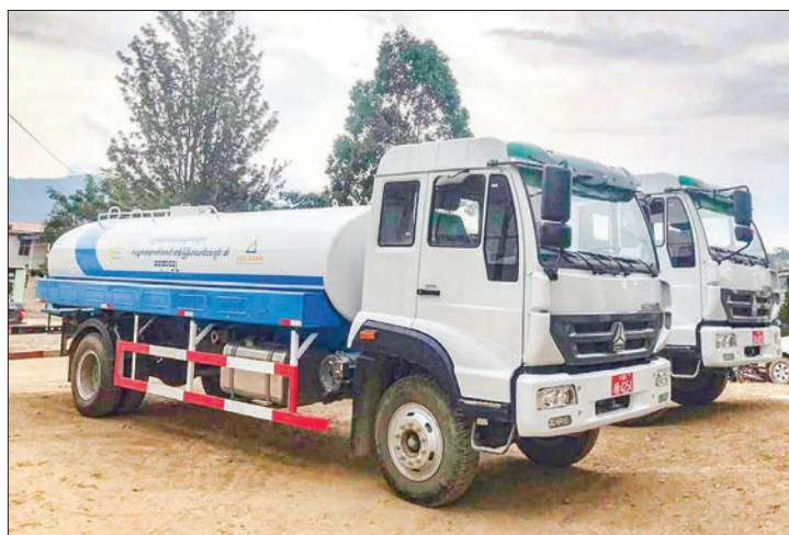
The two water bowzers donated by KBZ's Brighter Future Myanmar Foundation to Htantalan, Chin State.