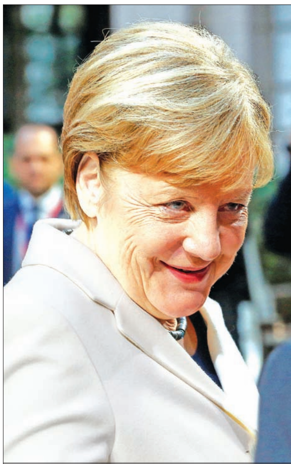
Germany's Chancellor Angela Merkel arrives at a European Union leaders summit in Brussels, Belgium on 20 October, 2017.