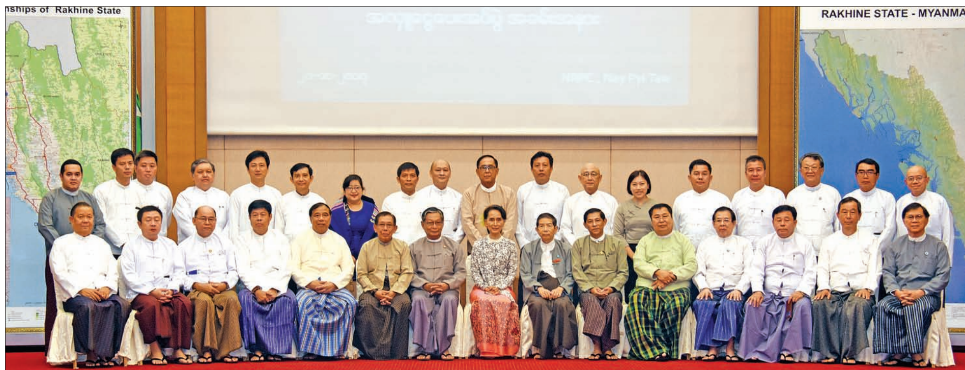
State Counsellor Daw Aung San Suu Kyi together with the country's businessmen for the UEHRD pose for a documentary photo in Nay Pyi Taw on 20 October.