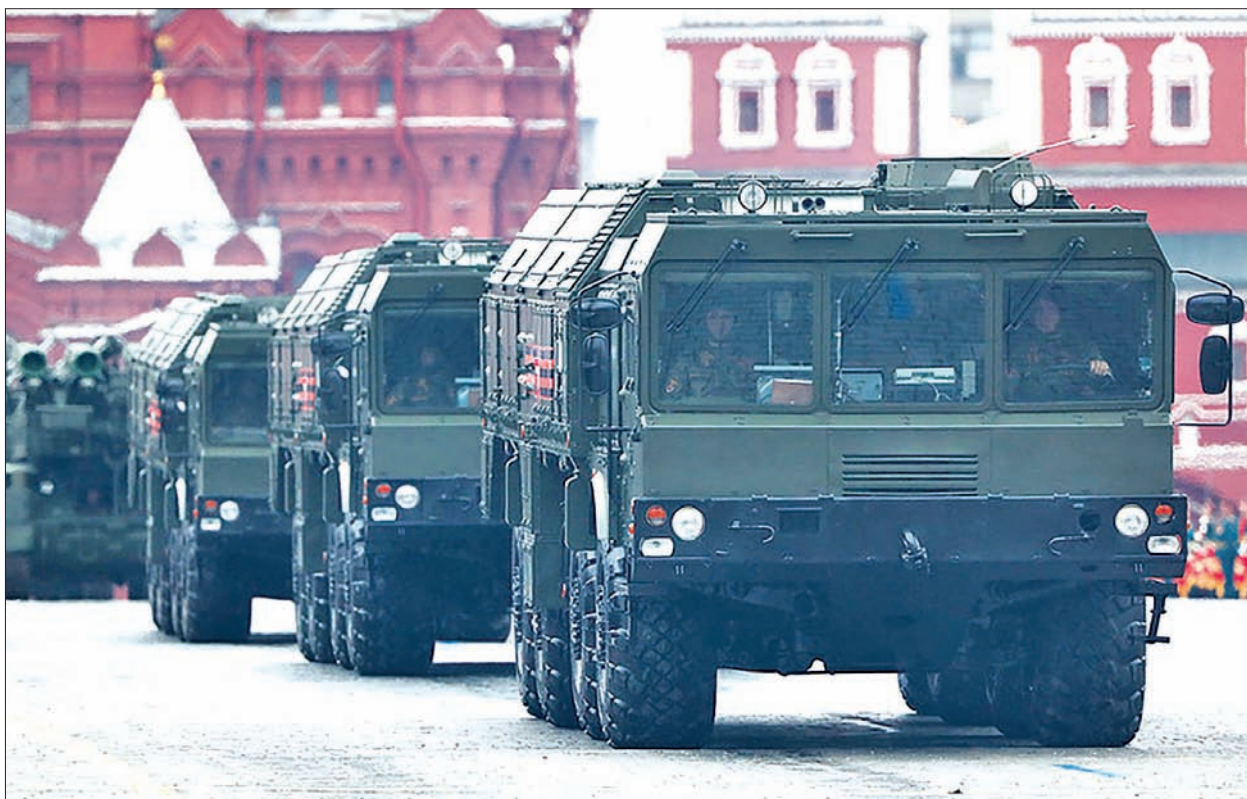
Amid an escalating international situation, "measures to strengthen the country's defence capability are of special importance," Viktor Bondarev said.

Amid tense geopolitical developments and an escalating international