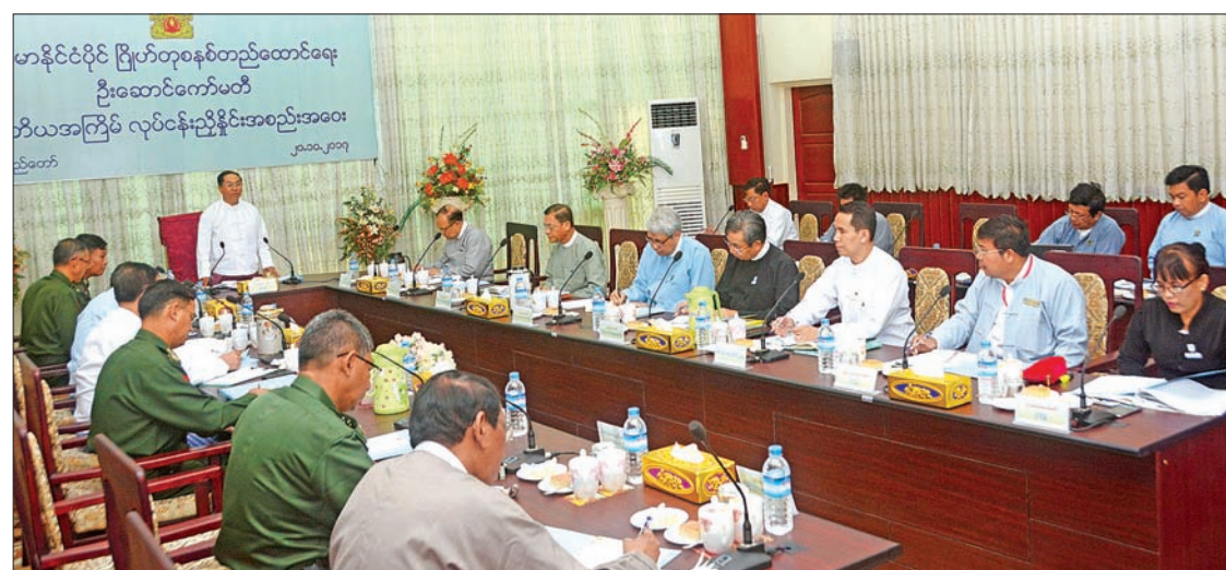
Vice President U Myint Swe addresses the meeting of leading committee on establishing satellite system in Nay Pyi Taw on 20 October 2017.

There are three ways that were mentioned in the previous meetings, for Myanmar to be able to establish State-owned