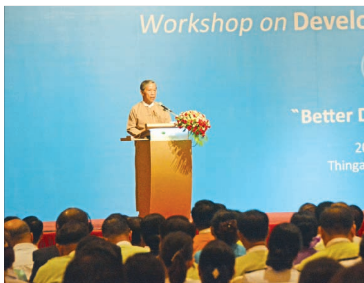
Union Minister U Kyaw Win addresses the ceremony of Launching of the Birth and Death Registration Manual and the workshop on Developing Vital Statistics System in Nay Pyi Taw.

"Our work done here is for the sake of the country, but the