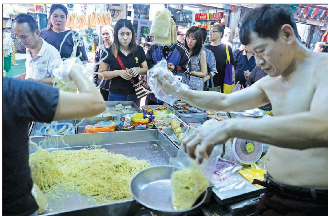
People shop for vegetarian food at a market in Chinatown Bangkok, Thailand on 19 October, 2017.

Out-of-towners who come to renovate and preserve old houses that are not classed as "cultural relics," but nonetheless have historical value, will bring new life to these old villages, said He Wei, an official with the Architectural Society of China.—Xinhua ■