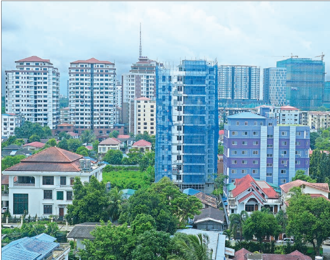
Houses seen in Yangon.