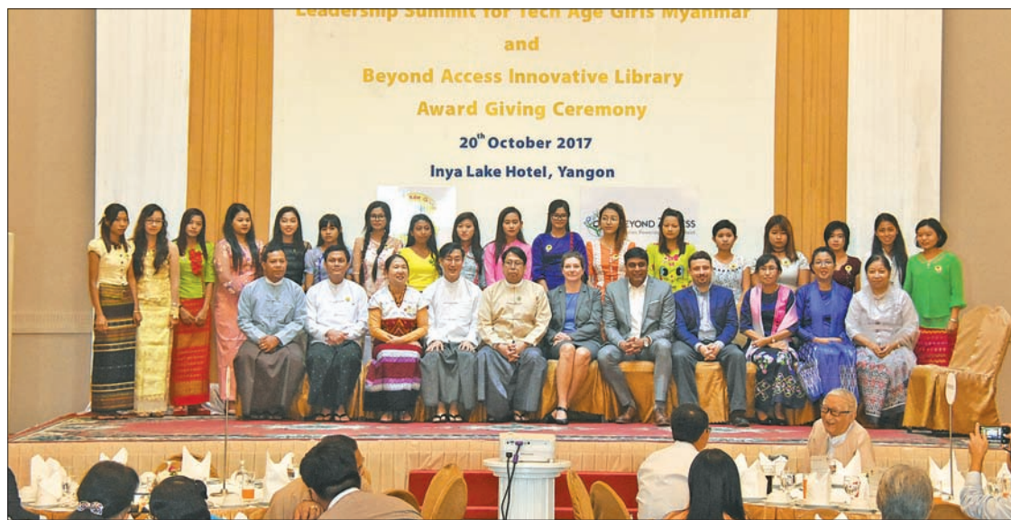
Union Minister Dr Pe Myint and officials pose for photo together with winners of the Beyond Access Innovative Library Award at Inya Lake Hotel in Yangon.

“The Ministry of Information is performing the task of increasing the number of books and readers. The Myanmar Book Aid and Preservation Foundation are carrying out the tasks of making readers read more and developing libraries. The Ministry of Information is co-operating by signing an MoU for libraries under the Ministry to acquire aids on news and information and for the acquisition of the internet to fully acquire news and information. Libraries are being changed into community