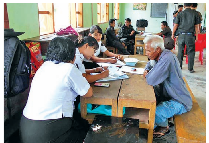
Immigration officials work on issuing National Verification Cards to locals in northern Rakhine State.

The NVC and NID (biometric) works will continue, it is learnt.—Myanmar News Agency