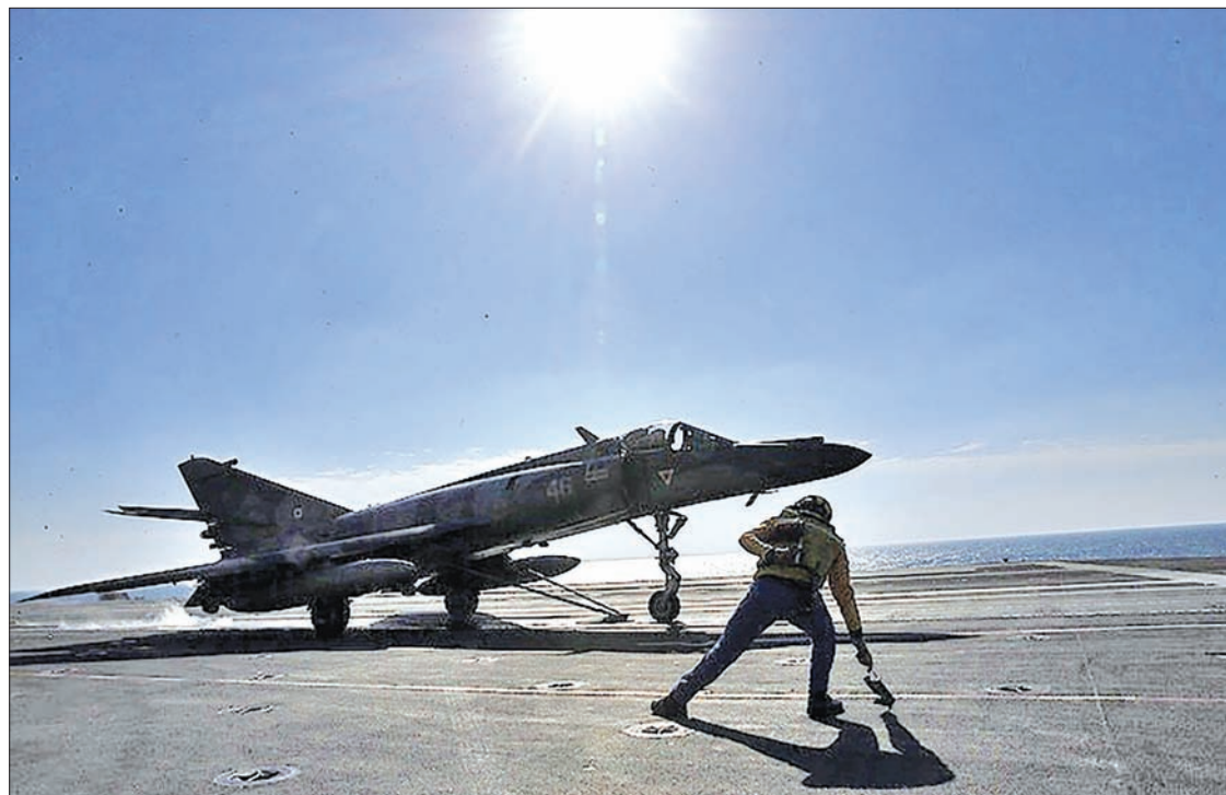
The Russian Defence Ministry refutes US allegations about Idlib bombing.

The Russian general pointed out that only one chemical weapons incident had been recorded in the Idlib province, which took place in Khan Shaykhun and was