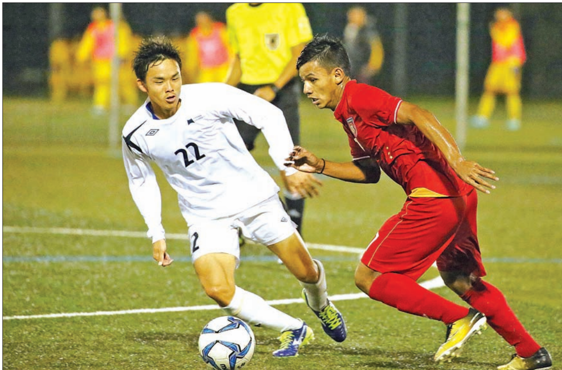
Myanmar and Japan's Hannan Club vie for the ball in yesterday's match.

The Myanmar U-19 team is leaving for Cambodia for the 2018 AFC U-19 Championship qualification today, according to Myanmar Football Federation. ■