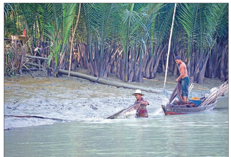
Mangrove forests along the coastline of the Gulf of Mottama to be designated as the protected public forests.

third-largest mangrove forest coverage in Asia and seventh in the world. The country, with a total coastline of 2,832km, has mangrove forests covering an