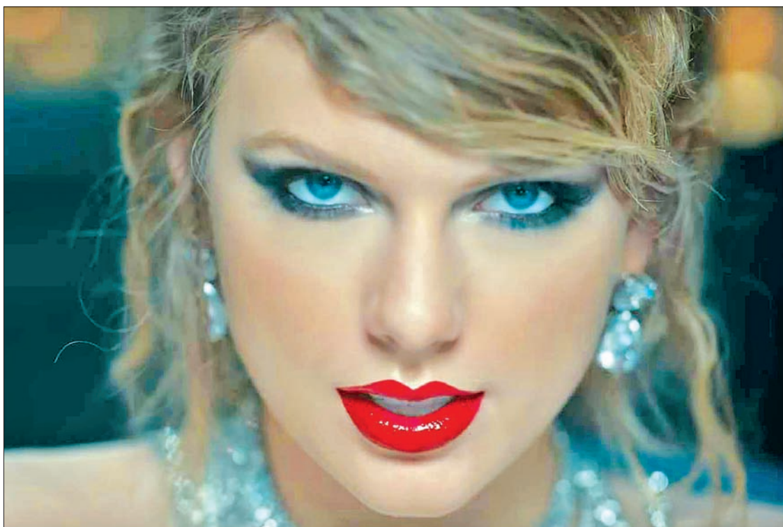
Taylor Swift.

After disappointing box office growth in 2016, regulators announced that all sales grosses would include service fees for each ticket purchased online. This has boosted this year's growth, although movie-makers see little of the additional revenue.—Reuters ■