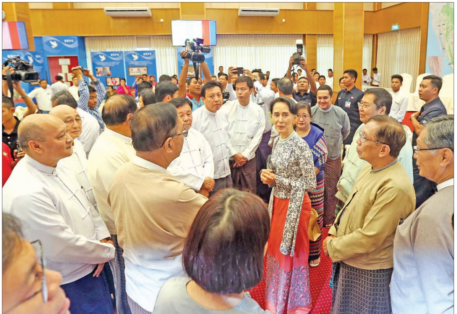
State Counsellor Daw Aung San Suu Kyi chats with businessmen yesterday at a ceremony to accept donation for Rakhine State.

Myanmar-India trade from Tamu border decreased by $19 mn this FY