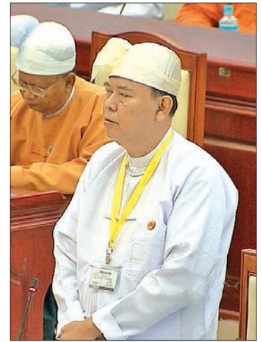
U Win Maw Tun, Deputy Minister for Education.

regulations and promotions are made whenever there are available positions in the organisation. Equal opportunities are provided to all who are qualified, without any favoritism.