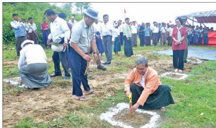
Rakhine State Chief Minister drives a stake into the ground to mark the launching of the construction project.