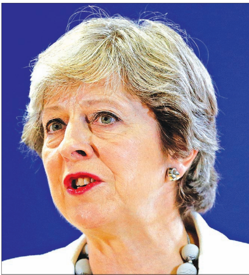
Britain's Prime Minister Theresa May addresses a news conference during a European Union leaders summit in Brussels, Belgium on 20 October, 2017.