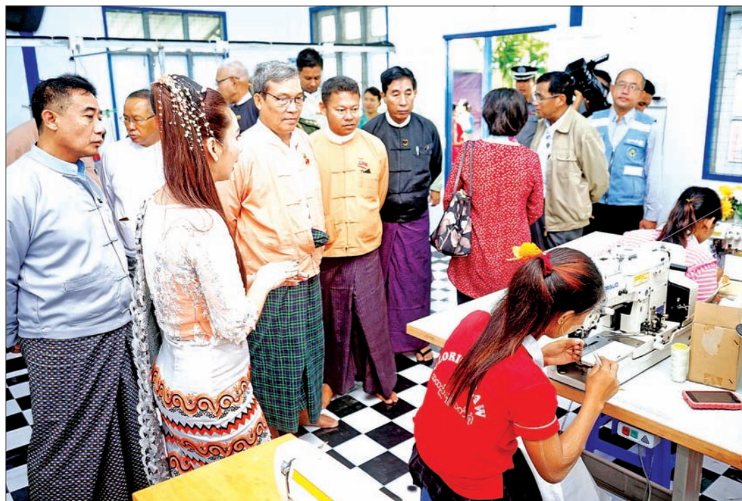
Rakhine State Chief Minister U Nyi Pu visits Khaing Pyi Soe garment factory in Sittway.

The Rakhine State Chief Minister said that youths in Rakhine State, including Sittway, will gain more job opportunities as a result of the factory's opening. If job opportunities will be developed in the State, the State's development will increase year by year. The Rakhine State government will work to develop industries and factories