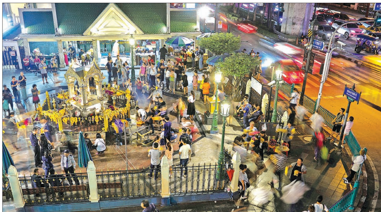
Tourists pray at Erawan Shrine, a Hindu shrine popular among tourists in central Bangkok, Thailand on 16 October, 2017.

per cent in 2015 and only 42 per cent in 2012. No earlier official data were available, but research from as far back as the 1980s shows a ratio of about 60 per cent male to 40 per cent female visitors. "Not as many