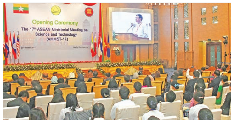
Union Minister Dr Myo Thein Gyi delivers an address at the 17th ASEAN Ministerial Meeting on Science and Technology.

Prasidh, Senior Minister, Ministry of Industry and Handcraft, Cambodia gave an honorary speech.