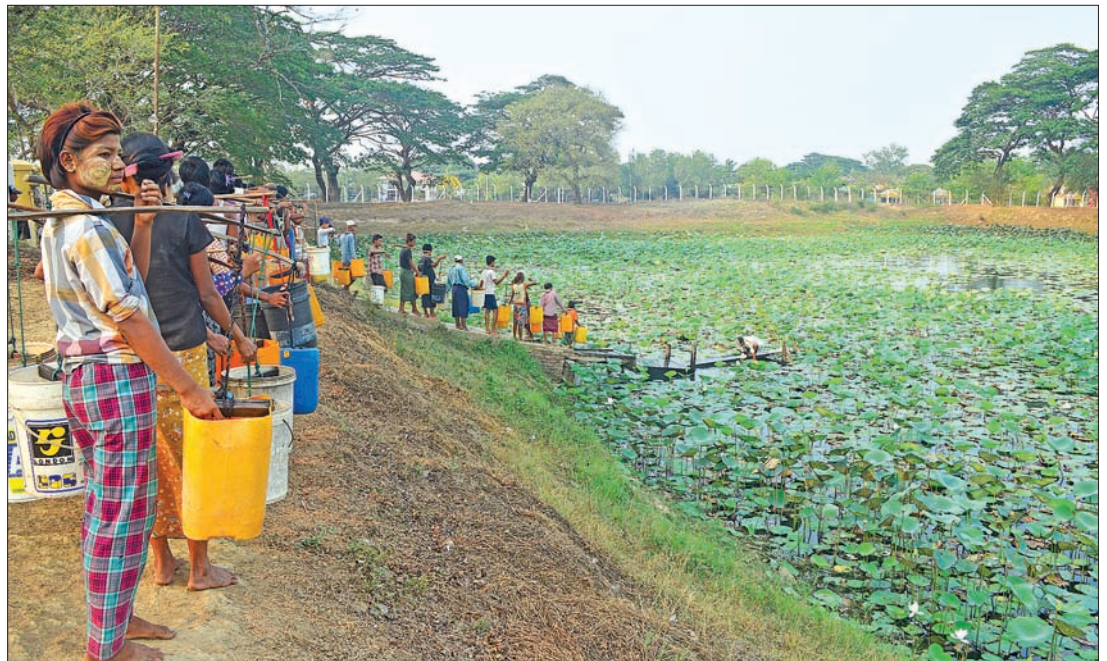
People line up to fetch drinking water in Dala Township, Yangon Region.

According to a report of the Myawady Daily, the town dwellers yearly experience a lack of sufficient available water resources to meet the water needs within the region. They chiefly rely on lakes and ponds for their drinking water. A local study shows that the water quality of the lakes is not suitable for use as drinking water. Water-related health problems