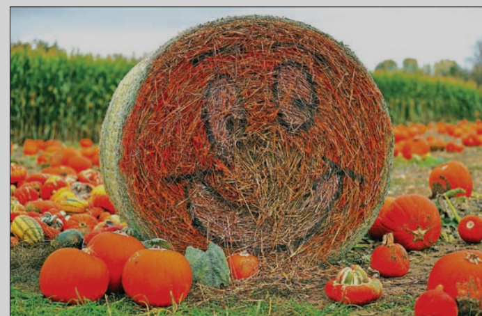
A decorated hay bale stands in a pumpkin field at Foxes Farm in Colchester, Britain on 11 October, 2017.

Currently, the coins were stored in the county museum.—Xinhua ■