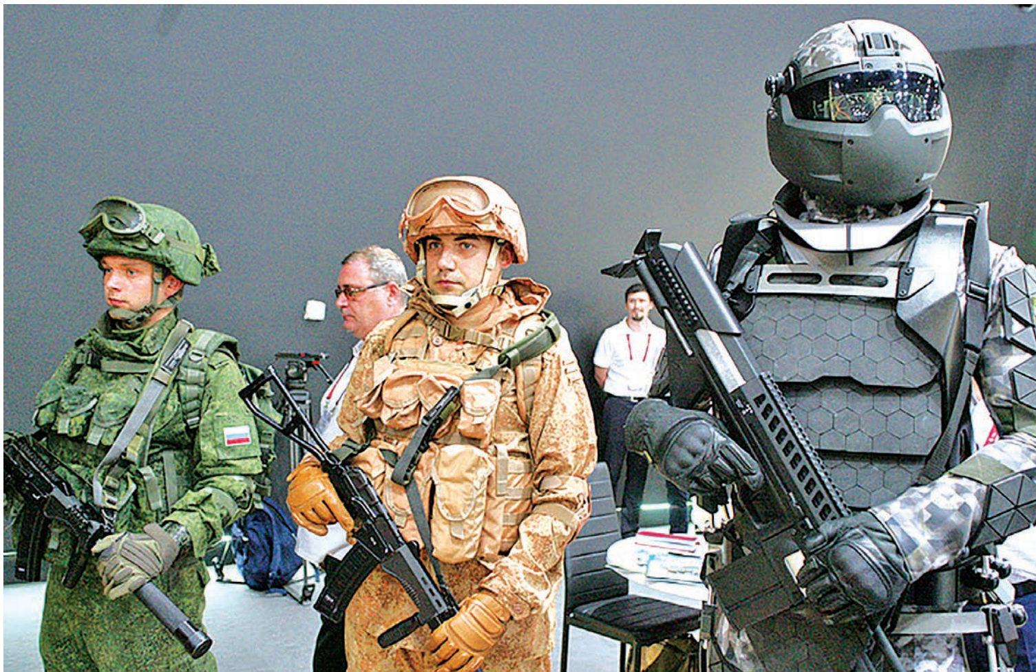
Ratnik combat gear.