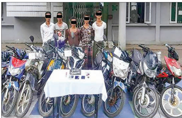
The five suspects and seized motorcycles.

The tea leaf are being cultivated mostly in Laukkai, Kyaukme, Namgsan, Mantung, Namtu, Tangyan and Lashio townships.— GNLM ■