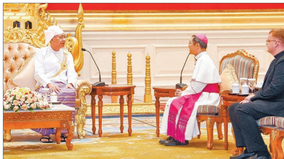
President U Htin Kyaw receives the newly-accredited Apostolic Nuncio of the Holy See Mr. Archbishop Paul Tschang In-Nam in Nay Pyi Taw.

Present on the occasion were Minister of State for Foreign Affairs U Kyaw Tin and Director-General U Thant Sin of the Protocol Department.—Myanmar News Agency ■