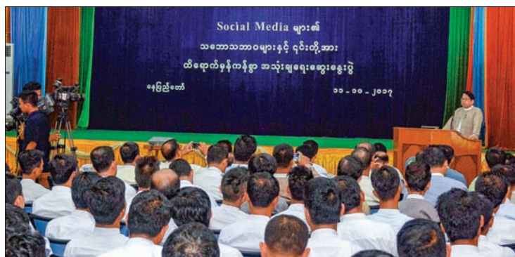
Union Minister Dr Pe Myint addresses the workshop on effective uses of social media and their natures in Nay Pyi Taw.

“As for me, I would like the Ministry of Information to be proactive, rather than to explain false information posted on social media in response. Proactive means leading. Qualified governments try their best to be proactive. Had true news been released promptly just after false news appears, there would no longer be room for false news. Rumours can survive until the time when true news appears. Rapid response needs to be promptly done for false news. I would like the Ministry of Information to be proactive and to make rapid responses. Technology must be applied for service to be sent to the public exactly and quickly. In the international sphere as well, they try hard like this. For using technology, it will be e-government. It needs to move on to reach this stage. We have already had techniques. Red tape systems are required to be reduced as much as possible. Utilisation of advanced technology can erase our worries of taking