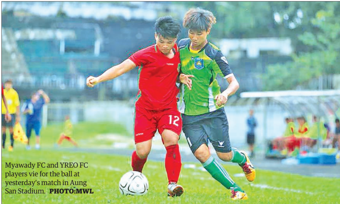
Myawady FC and YREO FC players vie for the ball at yesterday's match in Aung San Stadium.

Myawady's big win keeps the team at the top of the standings, earning 25 marks after playing 9 matches. ■