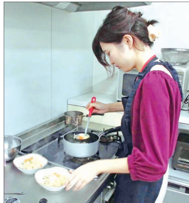
A woman cooks a meal at her home in the city of Shizuoka in central Japan on 11 September 2017, using a food ingredient and seasoning kit delivered by Yoshiike Kaihatsu KK, a Shizuoka-based meal kit delivery company mainly targeting beginners, seniors and homemakers who find it difficult to plan their everyday meals.

koku and Kyushu regions in the southwest. A Sharp official says the company aims at 20 billion yen in yearly sales by fiscal 2020. — Kyodo News ■