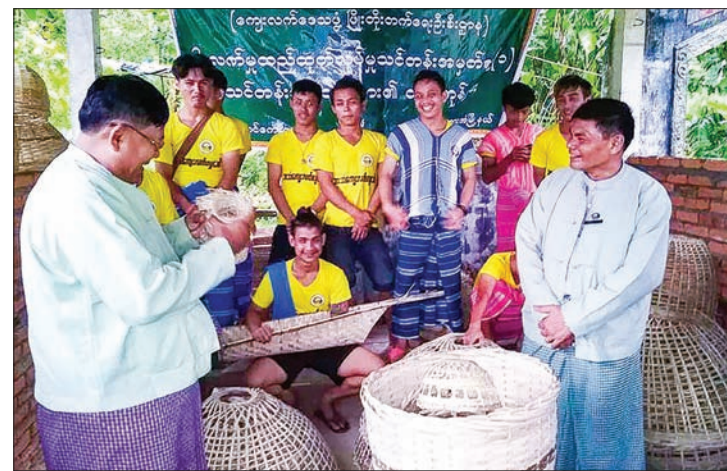
Head of rural development department observes at the closing ceremony of bamboo handicrafts vocational training in Kayin State.

A bamboo plant is purchased Ks 700 and can produce five bamboo chicken mesh covers. A family can make around 10 bamboo chicken mesh cover a day. A family can earn around Ks 13,000 a day as an item of bamboo chicken mesh cover is sold Ks 1300 at trade price. The wholesale buyers have also bought the bamboo products from this village and distributed and sold at the townships of Mawlamyine, Thaton and Kawkaireik. —Nay Myo Lwin (IPRD) ■