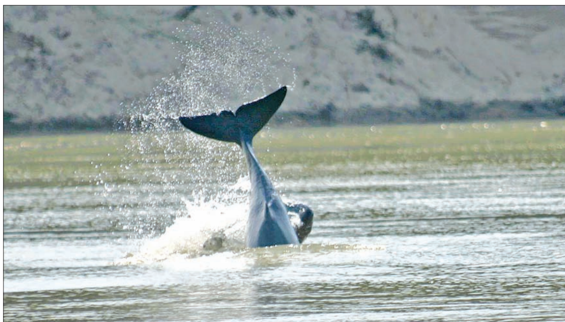
A dolphin is seen in the conservation area near Mandalay.

The extension area will start from the Ayeyawady River