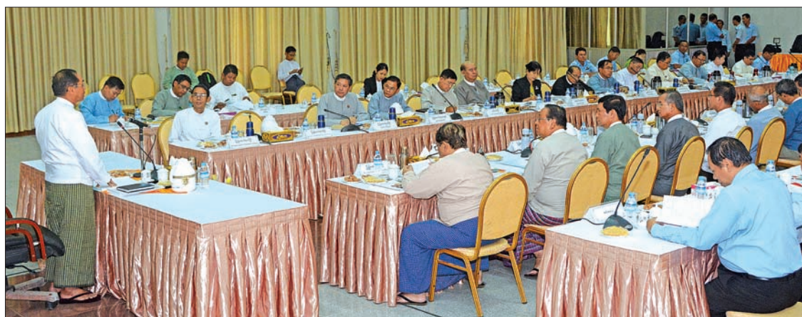
Vice President U Myint Swe delivers the speech at the fifth meeting of the Private Sector Development Committee in Nay Pyi Taw, on 11 October 2017.

The Vice President said advice given at regular meetings