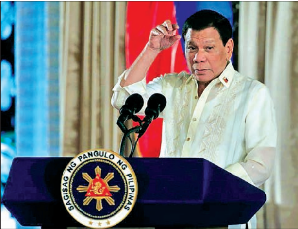
Philippine President Rodrigo Duterte.

rifles and 100 sniper rifles, among the fruits of Duterte’s efforts to form partnerships with two arms-producing powers that are rivals to the United States. The United States has for decades been the Philippines’ defence treaty ally and its biggest source or hardware and training, providing about $1 billion in equipment since 2000. Duterte has made no secret of his animosity towards Washington and his disdain for the US military alliance. A senior defence official told Reuters the Russian weapons would arrive later this month, when Russia’s defence minister attends a regional meeting. The rifles would be accompanied by mil-