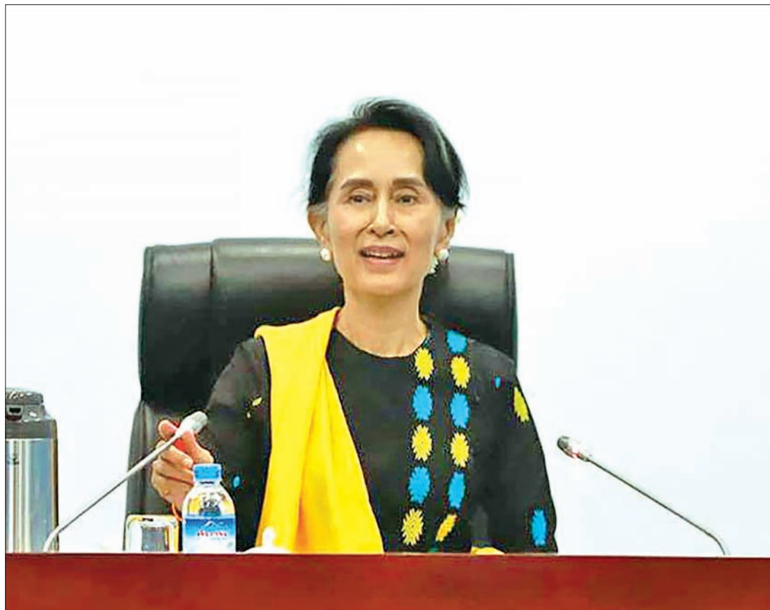
State Counsellor Daw Aung San Suu Kyi at the work coordination on Rakhine State.

Union Minister for Home Affairs Lt-Gen Kyaw Swe reported on the security situation and Union Minister for Construction U Win Khaing on ongoing rehabilitation and construction