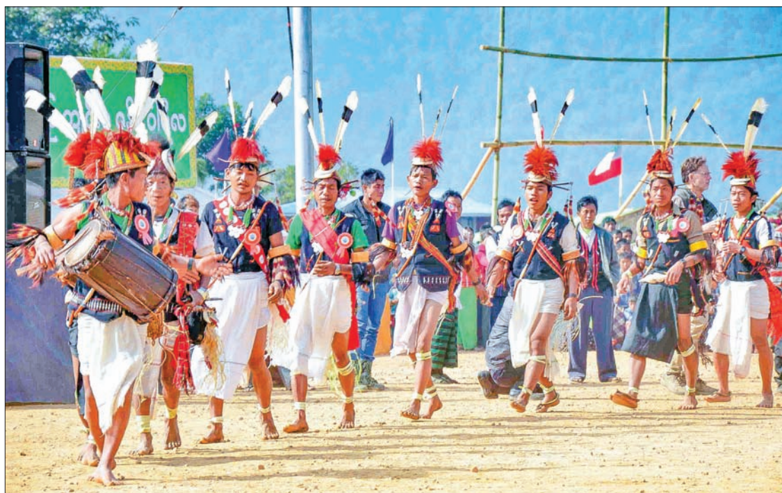
Naga ethnic people are dancing at the traditional new year festival in Lahe.