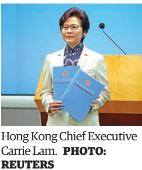
Hong Kong Chief Executive Carrie Lam.

HONG KONG — Hong Kong’s Chief Executive Carrie Lam warned in her maiden policy speech on Wednesday that the city faced “grave” challenges and must develop a more diversified economy, unveiling a mix of housing and tax relief policies to raise competitiveness. Hong Kong, one of the world’s costliest cities, has battled rising income inequality, the slow implementation of marquee public projects, political tensions with its mainland China and a slide in its competitiveness.