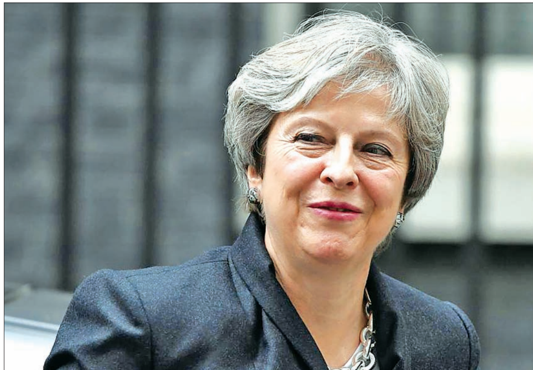
Britain's Prime Minister, Theresa May, arrives at 10 Downing Street in central London, Britain on 9 October, 2017.

The United Kingdom remains deeply divided over Brexit which most senior politicians view as the most important de-