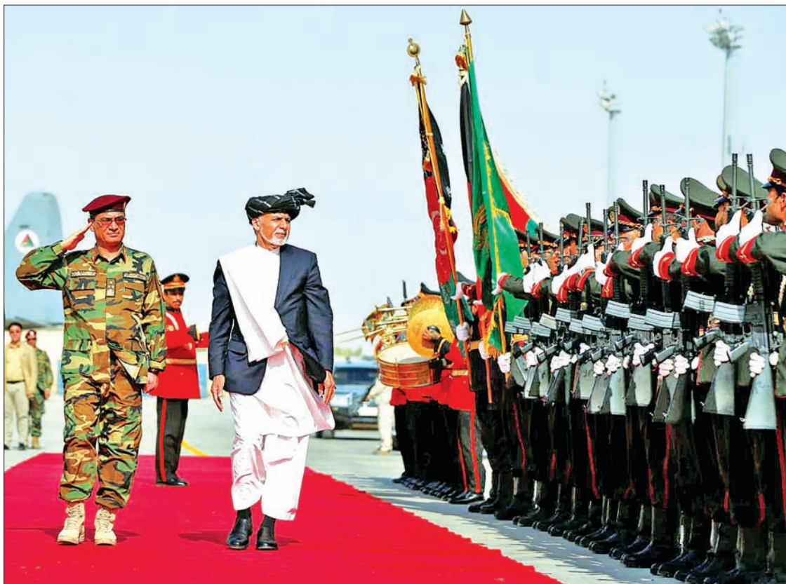
Afghan president Ashraf Ghani inspects the honor guard before the handover ceremony of Blackhawk helicopters from US to the Afghan forces at the Kandahar Air base, Afghanistan on 7 October, 2017.

"The date is 7 July but no one really believes it will happen on that day," said one Western official in Kabul who follows the election process closely.