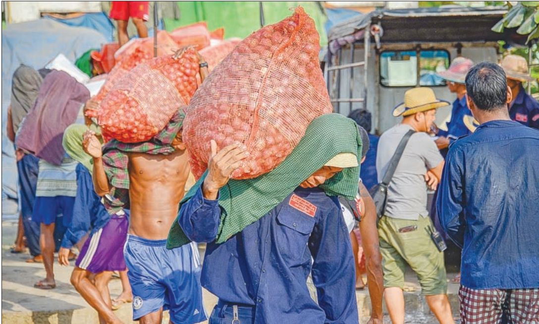
Labourers unload sacks of onion from a truck in Yangon.