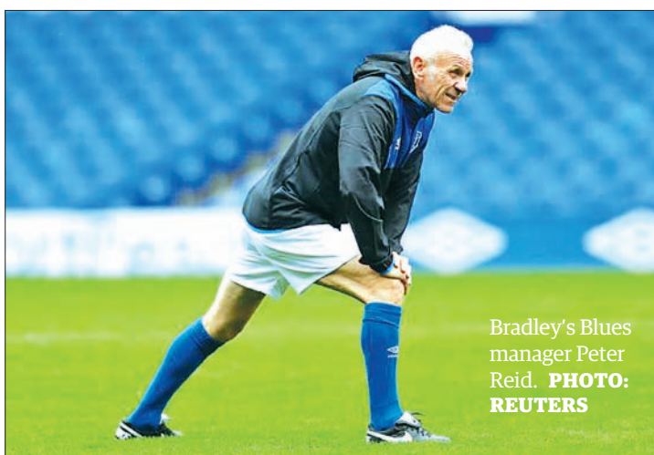
Bradley's Blues manager Peter Reid.

"We are in a dogfight and I am not sure ... they are ready for that. They look scared to put in a shift. I wouldn't say they are not trying, but they look like they cannot move."