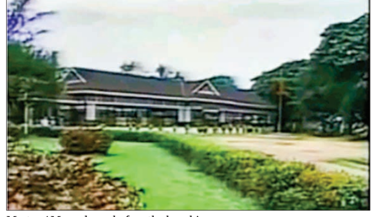
Martyrs' Mausoleum before the bombing.

As I had finished instructing the Korean, I was about to take up position on the opposite