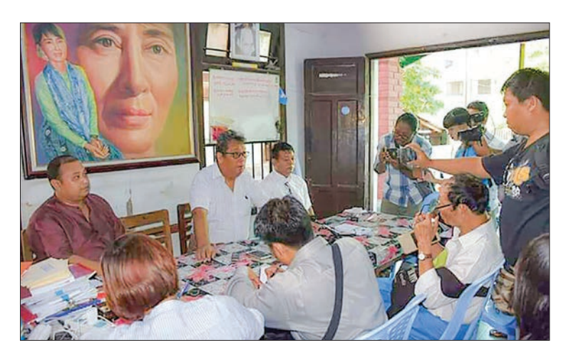
Members of the inter-faith group discuss plan for holding prayer ceremony in Mandalay.

The Tatmadaw vocational training camp conduct 19 types of vocational trainings and in addition to military personnel, personnel from Myanmar Police Forces are also attended the trainings it is learnt. —Myanmar News Agency