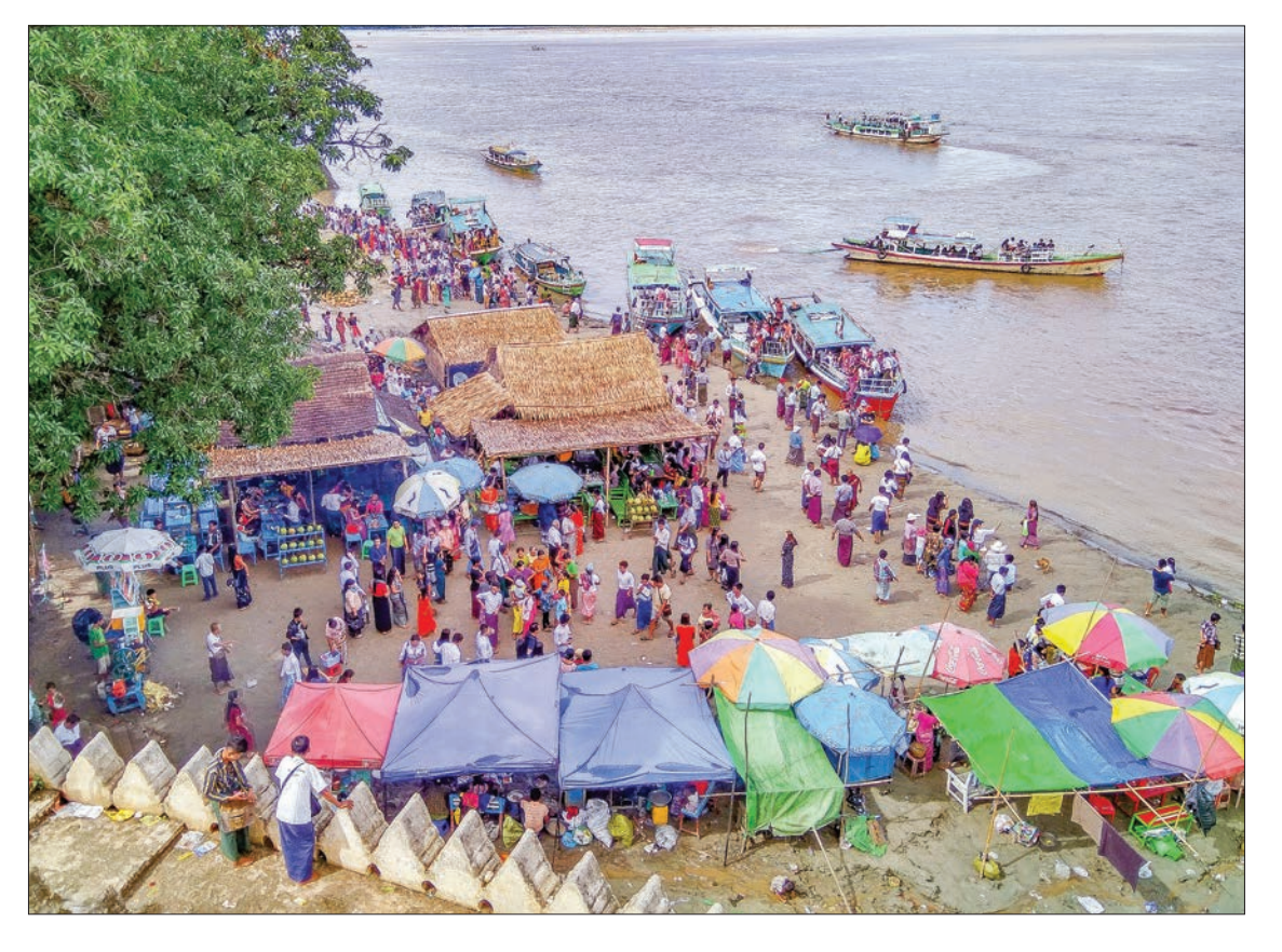
Pilgrims are seen around the golden stupa of Paya Pagoda by the Ayeyawady River, Bagan. PHOTO: 001

In five-holiday Thadingyut Festival this year, famous pagodas in the region — Shwe See Gone, Ananda, Ah Lo Daw Pyae, Buu pagoda, Lawka Nanda and Htilo-Minlo pagodas are heavily congested with pilgrims, with local residents paying homage to the pagodas like during the Thingyan Festival (New Year Water Festival).—001