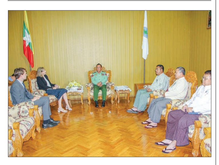
Union Minister for Border Affairs Lt-Gen Ye Aung holds talk with Norwegian Ambassador Ms. Tone Tinnes.

The outlook for subsequent two days, there is likely to have increase of rain in most parts of Myanmar, said the Meteorology and Hydrology Department.