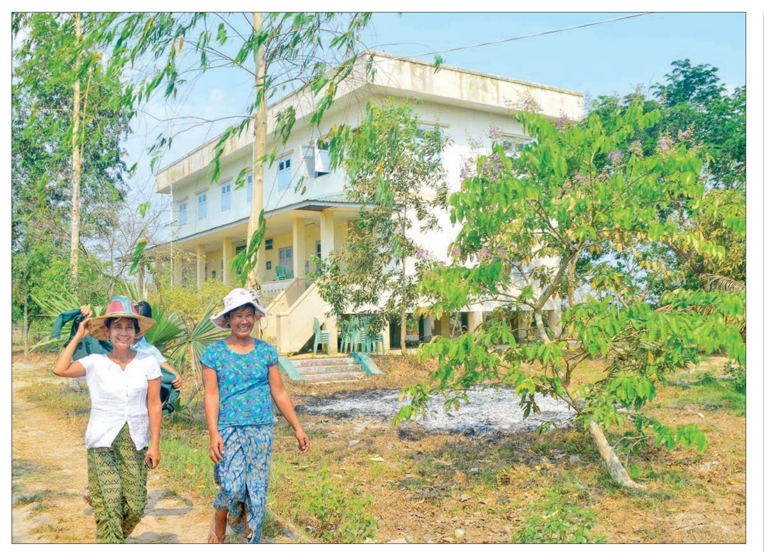
Women walk past the cyclone shelter in Kungyangon which was striken by Cyclone Nargis in 2008. The government yesterday instituted a programme that places higher priority on risk management and preparedness over natural disaster response.