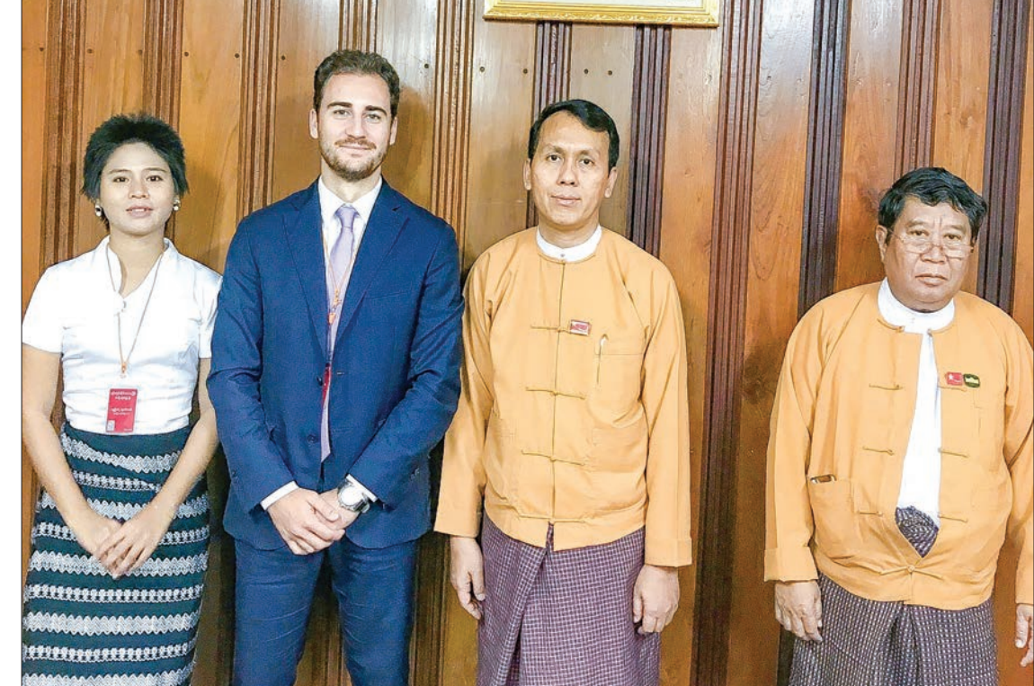
Chief Minister U Phyo Min Thein, (2nd from right), Yangon Mayor U Maung Maung Soe (Right), and representatives of the Oxford Business Group pose for photo after the meeting.

Yangon's severe infrastructure gaps, which have been exacerbated by the city's growing population, were also key topic of discussion at the meeting. "Yangon's expansion in recent decades has not been followed by the modernisation of its infrastructure and this