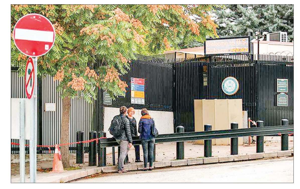
People wait in front of the visa application office entrance of the US Embassy in Ankara, Turkey on 9 October, 2017.

Congolese authorities have blamed the ADF for nearly all the massacres between 2014-2016. However, independent and UN experts say several armed groups as well as national army commanders have been involved. —Reuters