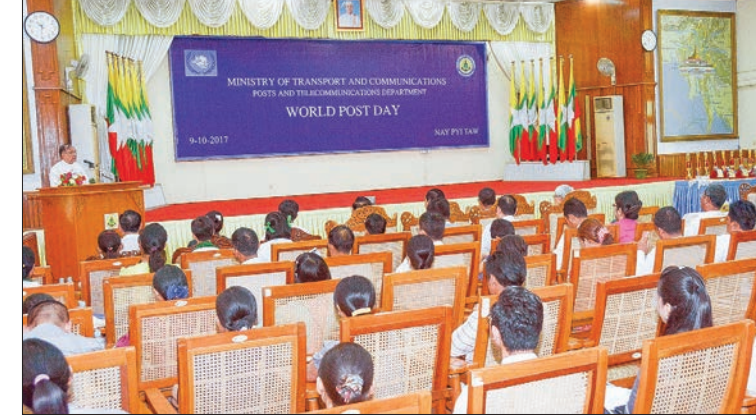
Union Minister U Thant Sin Maung delivers an address at the ceremony of 143<sup>th</sup> World Post Day on 9 October 2017.

tor Daw Ni Ni Han read a 2017 World Post Day message sent by Switzerland based UPU's Director General and letter to international youth competition (local level) assessment group vice chairman U Zaw Win explained about assessment system for prize winners.