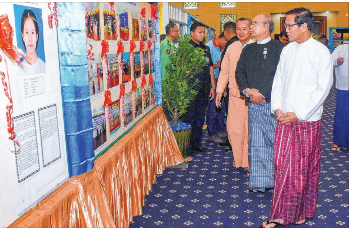
Vice President U Henry Van Thio looks at documentary photos displayed at the ceremony to mark the World Tourism Day in Nay Pyi Taw, on 9 October 2017.

Tourism is a service between people and for more tourists to enter the country emphasis must be towards the satisfaction of the tourists. The drive towards development of the Myanmar tourism sector is not only for economic purposes only but also aims to increase understanding among cultures. To obtain long term benefits from the fast developing tourism sector appropriate