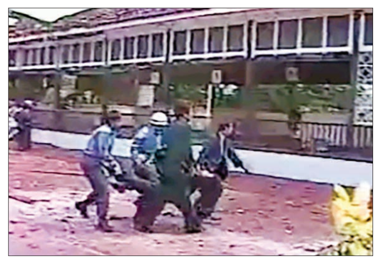
Naval personnels and diplomats carry the injured after the bombing.

side facing him, when I saw a plain-clothed Myanmar intelligence personnel, who was just outside the portico, suddenly dived to the ground. His action mystified me, but was more confused on hearing a loud boom. However, within a split second I realized what had happened. As I was standing with my back to the building, I had not seen the explosion, which the man who dived to the ground must have seen. Only when the force of the blast sent me staggering forward followed by the sound