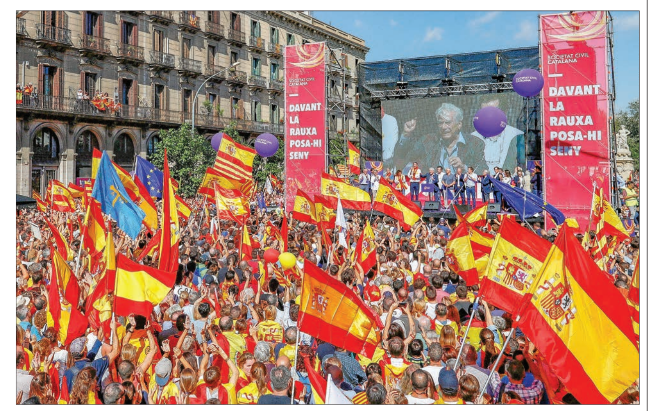
Peruvian literature Nobel Laureate Mario Vargas Llosa addresses a pro-union demonstration organised by the Catalan Civil Society organisation in Barcelona, Spain on 8 October, 2017.

The crisis has also reopened old divisions in a nation where fascism is a living memory easily revived by strong displays of nationalism. —Reuters ■