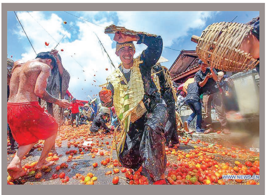
People participate in a tomato war at Cikarembi Village of Bandung in West Java, Indonesia, on 8 October 2017. Tomato war is a tradition here for farmers after harvest.