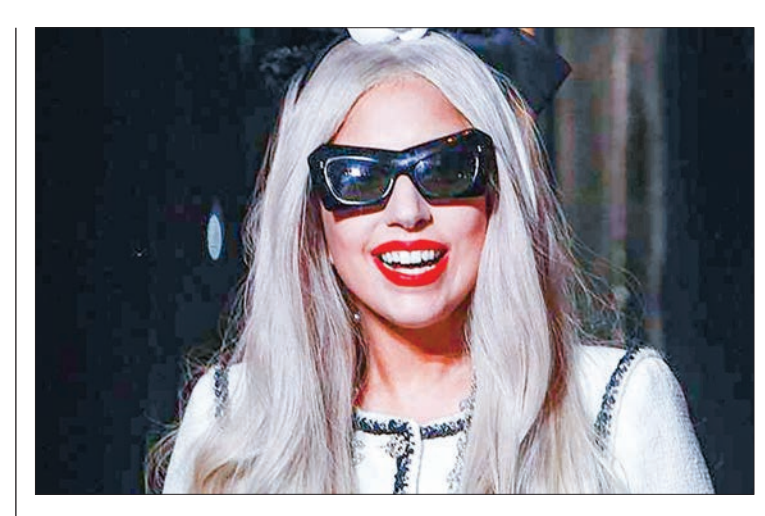
Singer Lady Gaga.

According to PostTrack, males over 25 represented 50% of the audience and females over 25 were 27%, while males under 25 represented 15% of moviegoers and females under 25 were 8%. Males gave the movie an A CinemaScore, while females gave it a B+.—Reuters ■