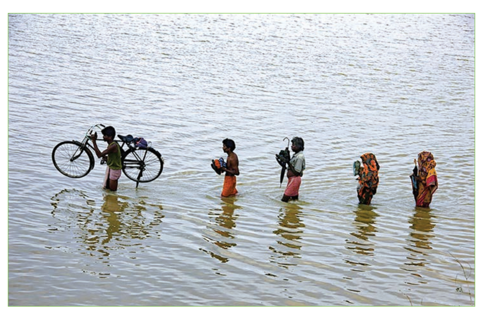
Lessons learnt from a flooding in the Indian state of Odisha has helped reduce casualties.

But there's less demand for longterm climate information. This is