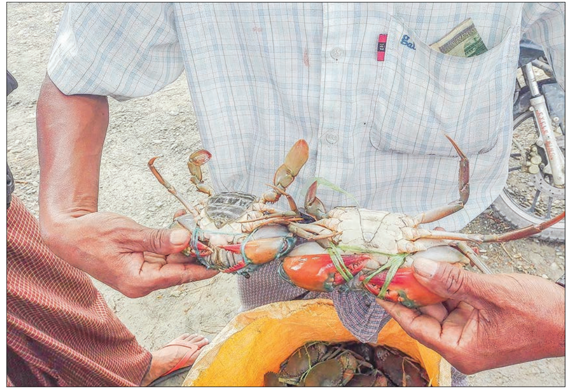
Catching the crab needed to avoid during breeding season.