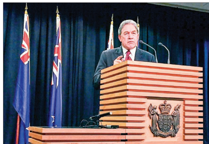
Winston Peters, leader of the New Zealand First Party, speaks during a media conference in Wellington, New Zealand, on 27 September 2017.

Both Labour and New Zealand First have said they want to curb immigration, renegotiate certain trade deals and adjust the role of the central bank albeit in different ways. Analysts expected the political uncertainty to have little impact on financial markets and the New Zealand dollar. "I think on Monday the market is going to be a little bit subdued because basically nothing has changed," said Stuart Ive, private client manager at OM Financial. "You could say that the policies are probably more aligned to a Labour-Green-NZ First partnership but a three-way coalition is a lot harder to manage than a two-way coalition."—Reuters ■