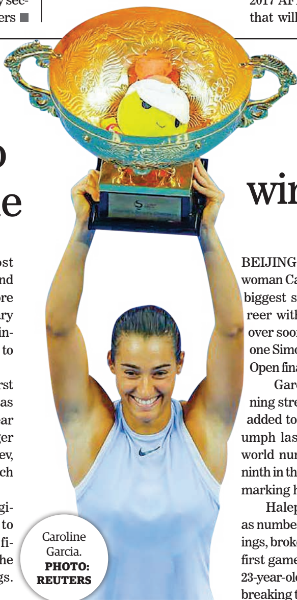
Caroline Garcia.

The loss dented Kyrgios's chances of making it to the season-ending ATP finals as he stands 20th in the Race to London standings.—Reuters ■