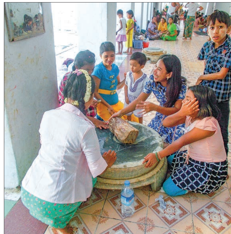
Pilgrims using a large grindstone to make thanakha.