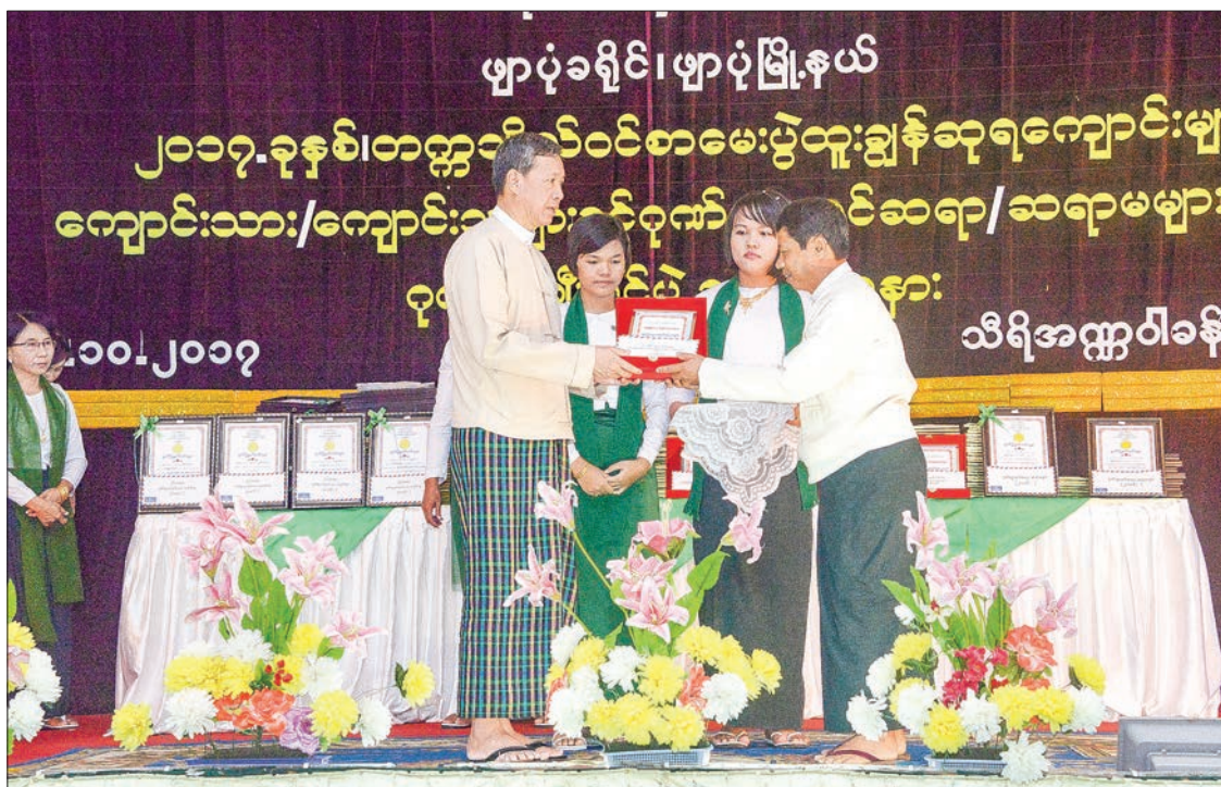
Union Minister for Education Dr Myo Thein Gyi presents gift of honour to a teacher.

teachers in the current academic year, up from 277,584 in 2011-2012. Student population increased to over 9.1 million at present from eight million in 2011-2012 thanks to the fair school admission system conducted by teachers, arrangement to provide assistance for student's facing various difficulties to attend school and the teachers doing their job well in a corruption environment. Now the country is moving towards KG+12 education system leaving behind 11-grade system. The ministry is drawing curriculum and syllabus for primary schools in cooperation with Japan International Cooperation Agency-JICA, and those of the middle and high schools with Asia Development Bank-ADB.