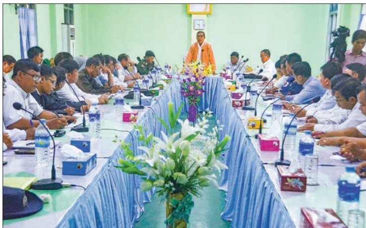
Chief Minister U Nyi Pu delivering address at the meeting.

Speaking on the occasion Chief Minister U Nyi Pu said there cannot be excuse for any future mistakes. All-inclusive coordination must be made through the ground situation and the remedial action by the regional departments concerned in finding the best answer. There must also be unity and goodwill for durable peace and progress. All must prioritize the affairs of Rakhine State, the nation and the people. As the future task becomes more important careful and proper