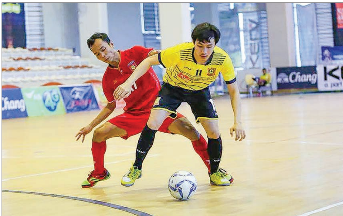
Myanmar and Thai players vying for the ball at yesterday's friendly match.

For a moment it seemed as if Verstappen, the Dutch driver who turned 20 last week and won for Red Bull in Malaysia a day later, would steal an unlikely second successive win.—Reuters ■