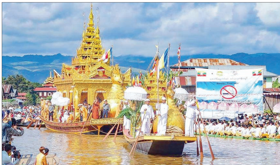
Annually held Phaungdaw U Pagoda of Inlay Lake in progress.