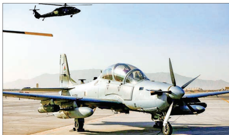
A Blackhawk helicopter flies above a parked A-29 Super Tucano aircraft, during a handover ceremony of Blackhawk helicopters from US to the Afghan forces, at the Kandahar Air base, Afghanistan, on 7 October, 2017.

Airfield in southern Afghanistan, Afghan President Ashraf Ghani formally accepted the first new helicopters, calling it a "historic day" that would allow the air force to better respond to the demands on the security forces.