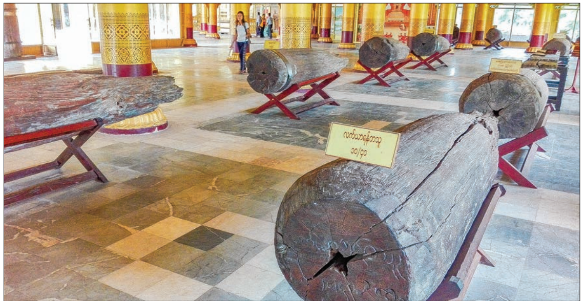
Ancient teak posts.

of the posts, it was learnt that these posts were donated from the regions under the vast land of the king, due to the organization of the ruler.