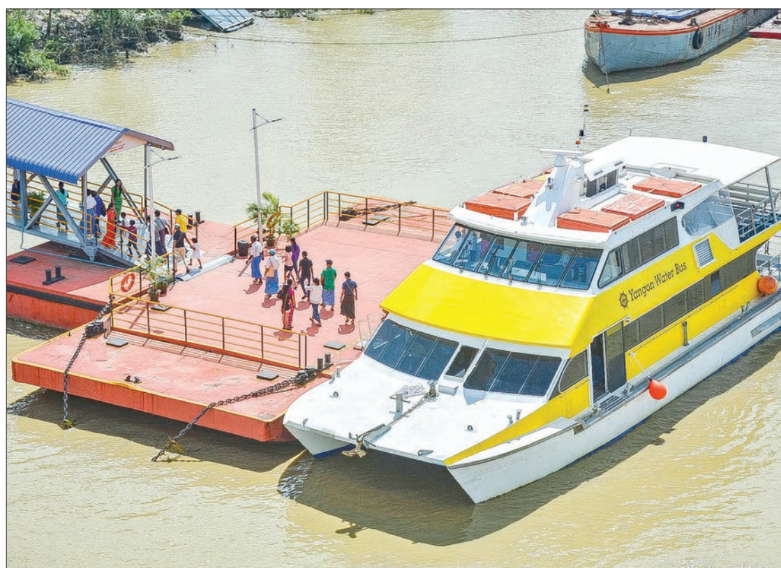
A water bus docked at the jetty.

Thiha Htun rode a route from Insein to downtown on the new YWB system and commented on the water bus. "The