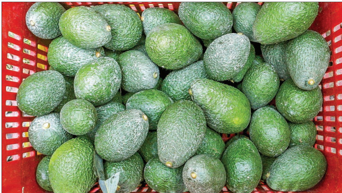
Fresh green avocado in the basket.

U Kyaw Thu said that systematically run avocado