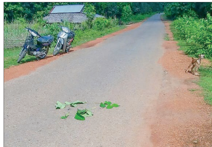
The sense of fatal accident.

The victim sustained serious head injuries in the accident and was rushed to nearby