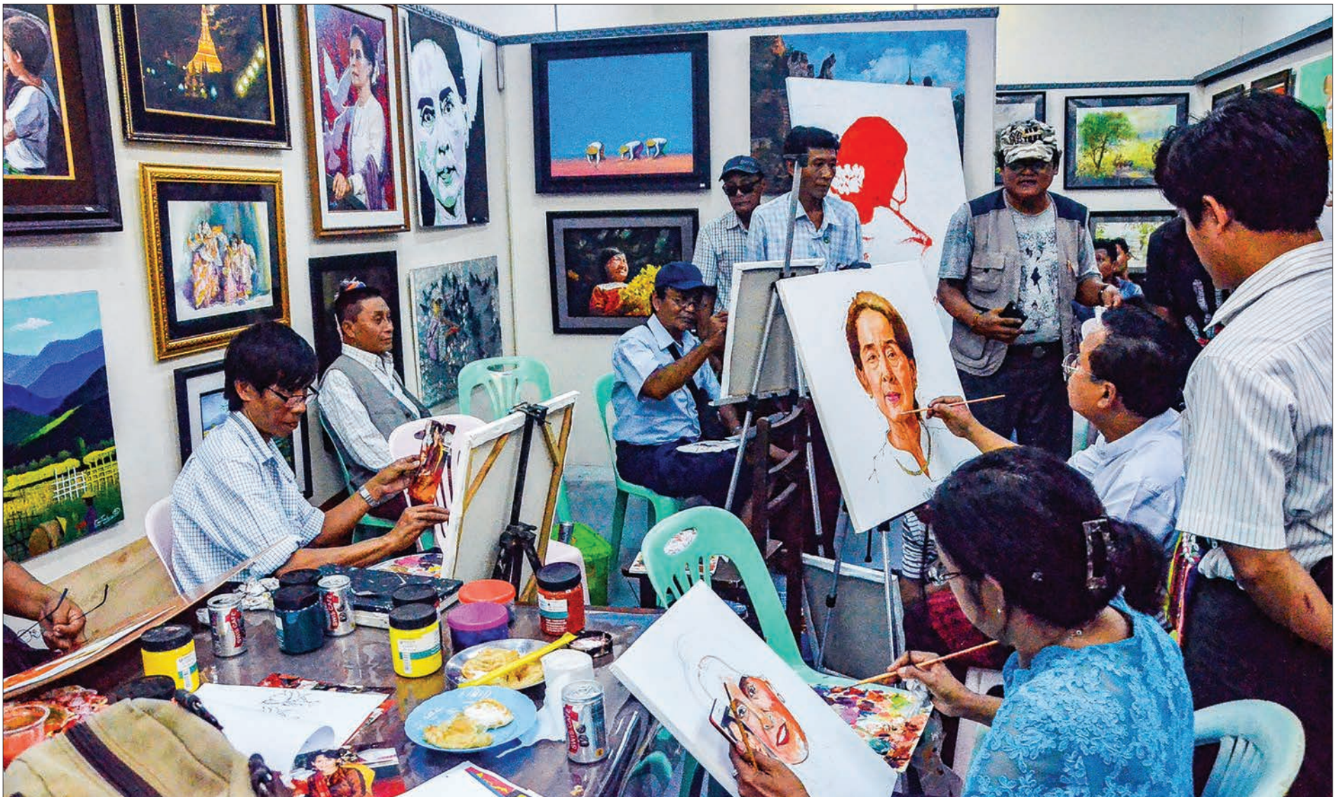
Artists drawing the portraits of State Counsellor Daw Aung San Suu Kyi.