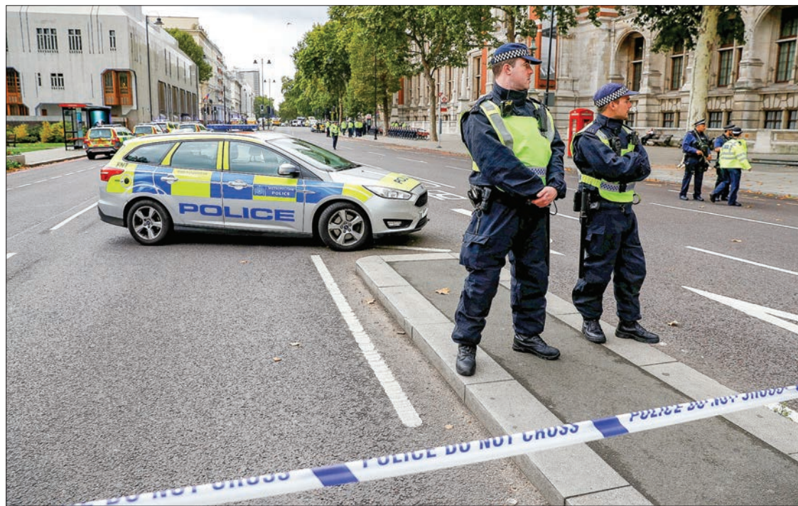
Police officers stand in the road near the Natural History Museum, after a car mounted the pavement injuring a number of pedestrians, police said, in London, Britain, on 7 October 2017.

London's ambulance service said they had treated 11