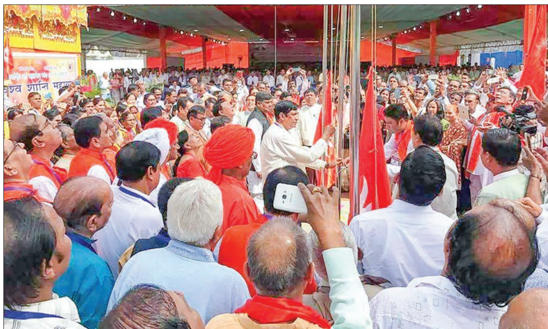
International Arya Samaj Hindu Conference in progress. PHOTO: THIHA KO KO (MDY)

Then, the Region Chief Minister and ministers, Hindu families hoisted the National Flag of Myanmar and saluted singing the National anthem. After that, Arya youths put up the Hindu Dhamma Flag and sang Dhamma song.