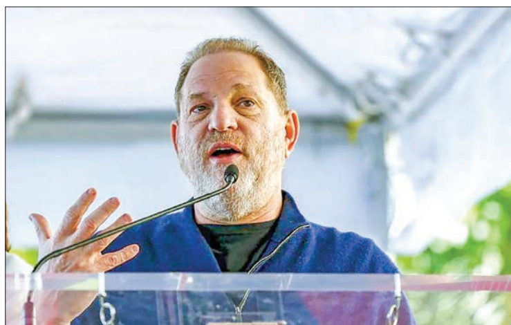
Producer Harvey Weinstein speaks at the ceremony for the unveiling of the star for Italian composer Ennio Morricone on the Hollywood Walk of Fame in Hollywood, California in 2016.

sentatives called it "essential" to company culture "that all women who work for it or have any dealings with it or any of our executives are treated with respect and have no experience of harassment or discrimination."