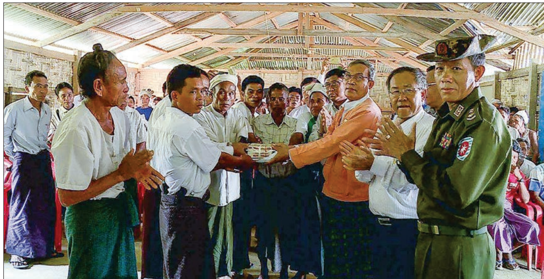
Rakhine State Chief Minister U Nyi Pu hands over cash assistance to villagers in Maungtaw.

The State Chief Minister and party fulfilled the current needs of the businesses which are requested by the local ethnic