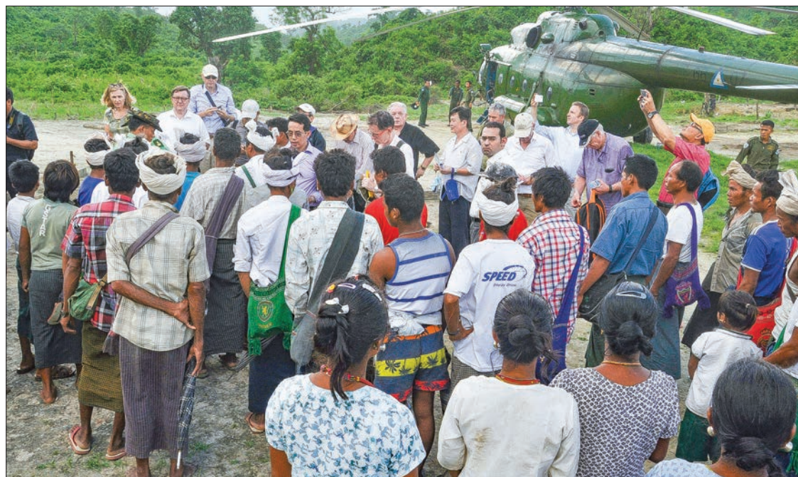
Ethnic people of Rakhine State recount their horrible experiences to diplomats.