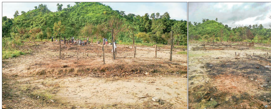
Photos show the burnt-out villages of ethnic people.

villagers beaten and killed as the terrorists surrounded their village and cut off all ways to escape. Three elderly people, two men and a five year old boy were killed and seven people received