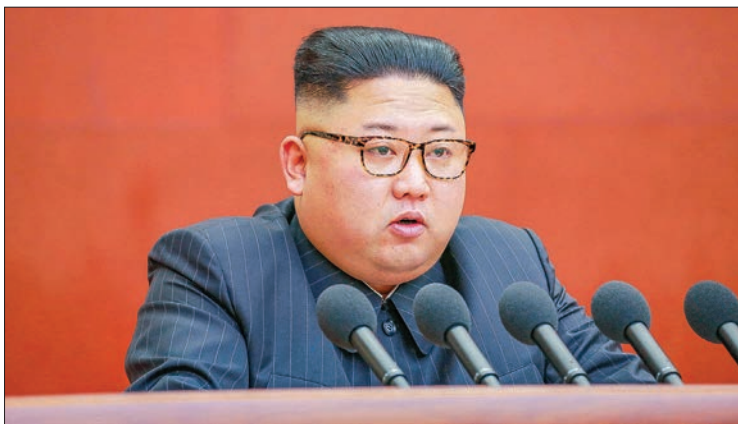
North Korean leader Kim Jong Un speaks during the Second Plenum of the 7th Central Committee of the Workers' Party of Korea (WPK) at the Kumsusan Palace of the Sun, in this undated photo released by North Korea's Korean Central News Agency (KCNA) in Pyongyang, on 8 October 2017.

North Korea is preparing to test-launch such a missile, a Russian lawmaker who had just