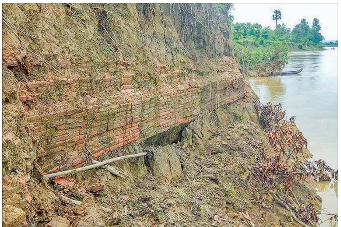
Photo shows ancient brick wall in Kalay Township.

The four-foot high and 100-feet long ancient brick wall also appeared in the township in mid-2016. Almost all parts of the wall fell down the river during this rainy season, residents say.—Chindwin Thar ■