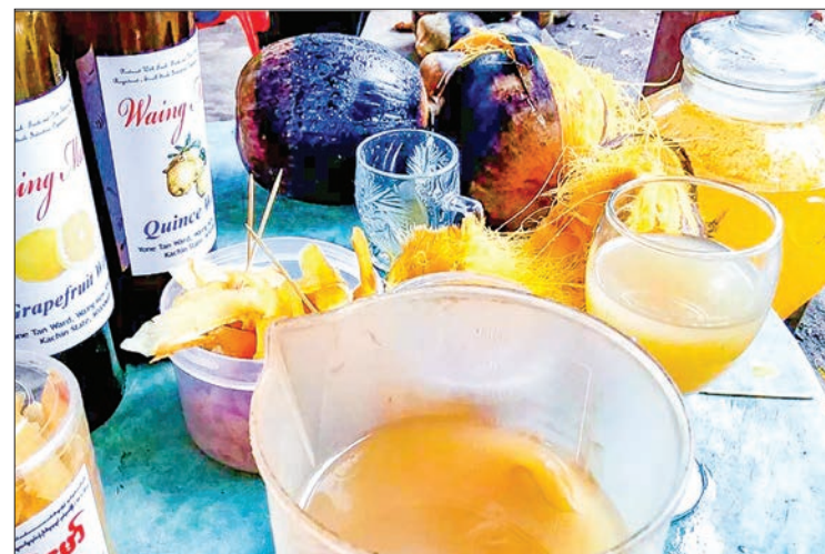
Value-added palm fruit products on displays.

As value-added products, jelly, soft drinks, and palm wine are produced from liquors acquired by grinding husks of palm fruits. Soft drinks from solid white flesh (kernel), pillows and bed sheets from dried fibers of palm fruits and palm fruits alternative fuels were produced. All these products were distributed in the market. —Sein Win (IPRD)