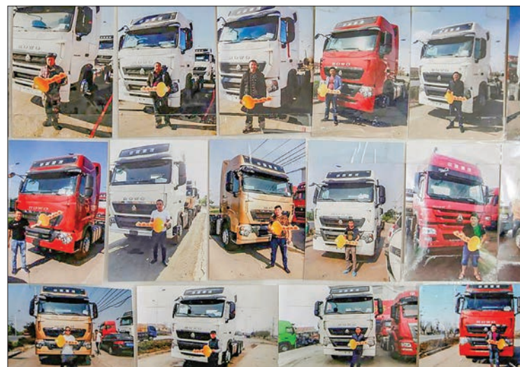
Pictures show customers with their new liquefied natural gas (LNG) trucks at a heavy-duty truck shop in Yutian county, China's Hebei province on 29 September 2017.