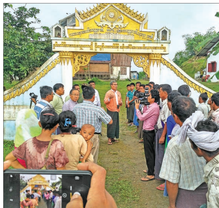
Chief Minister U Nyi Pu meeting with local people.

The State Chief Minister was accompanied by Rakhine State Security and Border Affairs Minister Colonel Phone Tint, Finance, Revenue Planning, and Economy Minister U Kyaw Aye Thein, Electric Power, Industry and Transportation Minister U Aung Kyaw Zan and departmental officials from the state government.—Myanmar News Agency