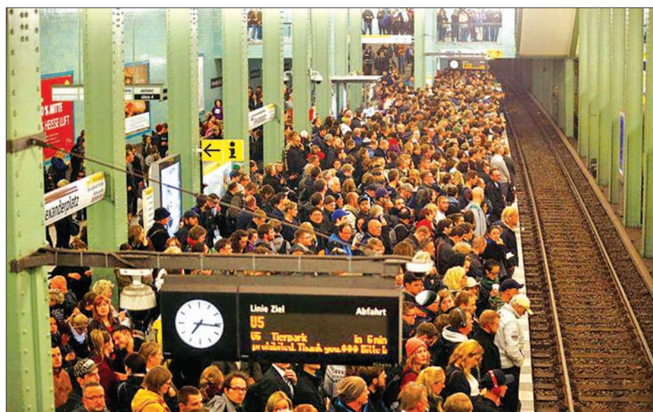
People wait at subway station Alexanderplatz during stormy weather in Berlin, Germany, on 5 October 2017.

The NHC said a hurricane watch was issued from Morgan City, Louisiana, to the Mississippi-Alabama border, including metropolitan New Orleans, Lake Pontchartrain, and Lake Maurepas. US officials from Florida to Texas told residents on Thursday to prepare for the storm. A state of emergency was declared for 29 Florida counties and the city of New Orleans.—Reuters ■