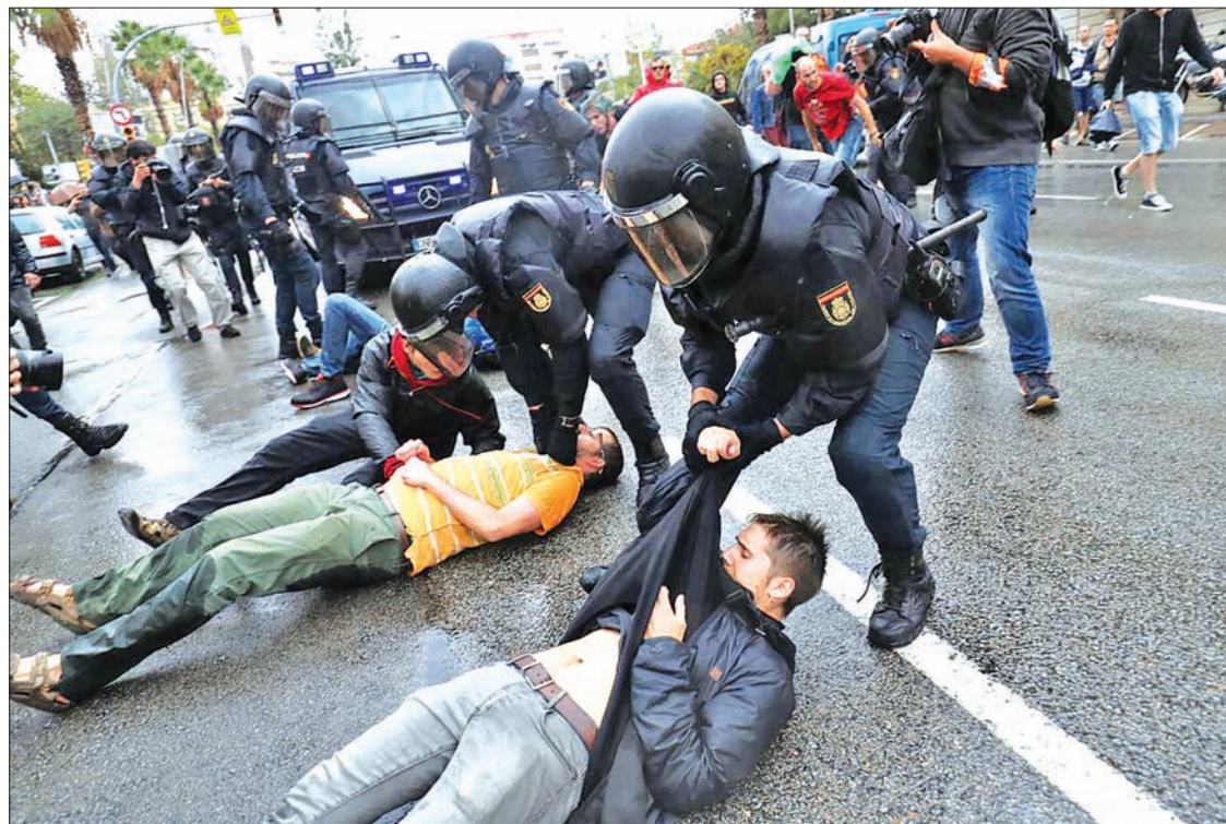
Spanish Civil Guard officers remove demonstrators outside a polling station for the banned independence referendum in Barcelona, Spain, on 1 October 2017.

Spanish police used batons and rubber bullets to stop people voting in Sunday's referendum, which Madrid had banned as unconstitutional. The scenes brought worldwide condemnation and fanned separatist feeling but failed to prevent what the