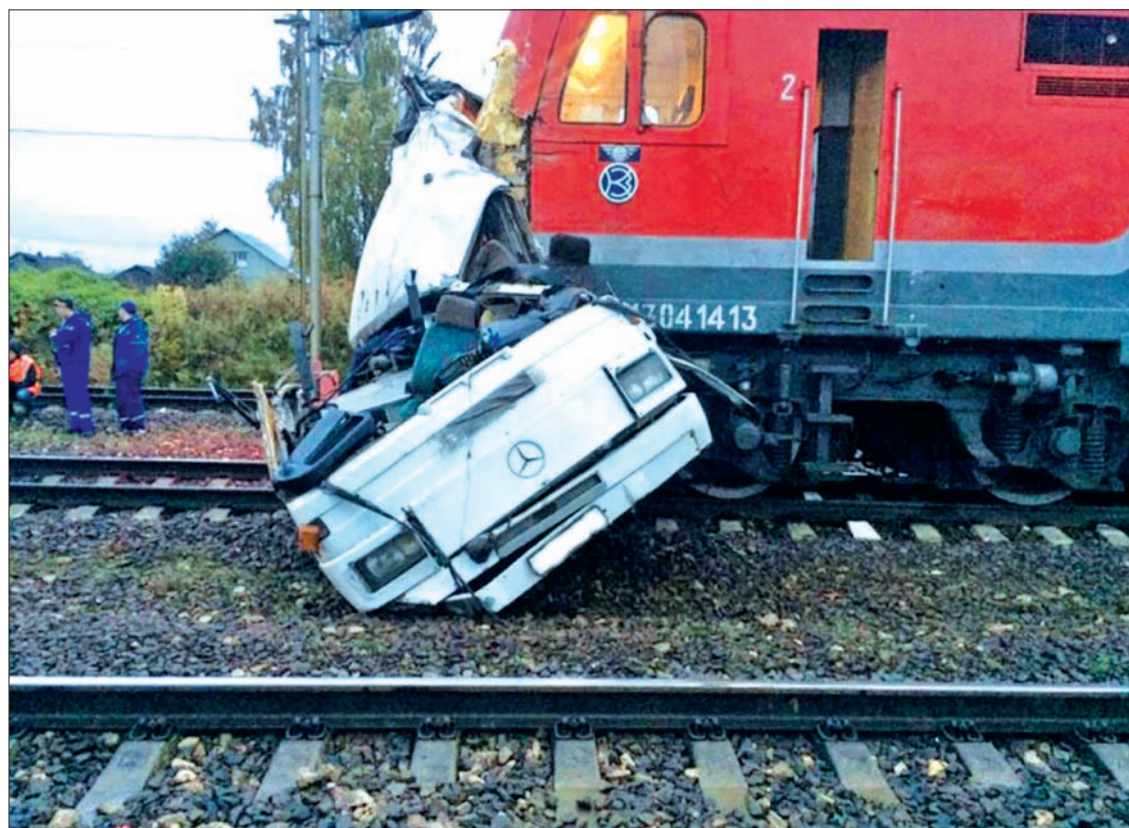
The wreckage of a passenger bus is seen after it was hit by a train at a crossing near the town of Pokrov, in Vladimir region, Russia, on 6 October 2017.

Though carrying workers from the Central Asian nation of Uzbekistan, the bus had a license plate registered in Kazakhstan, Russian news agencies reported. — Reuters ■