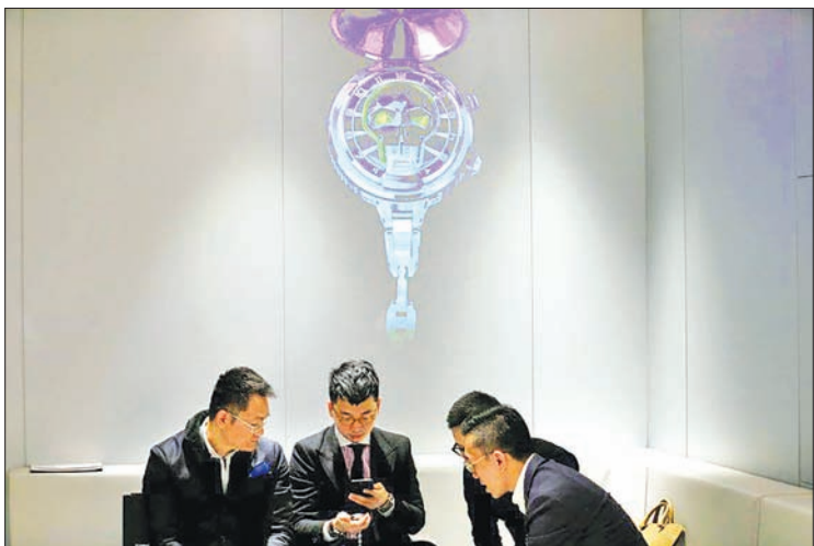
Visitors on the HYT stand look at a model watch during the Salon International de la Haute Horlogerie (SIHH) watch fair in Geneva, Switzerland, on 17 January 2017.

“It was a painful decision,” Peserico said, “but the costs were so high — 1 million Swiss francs ($1.02 million) last year — and there are fewer buyers and journalists there each year.”