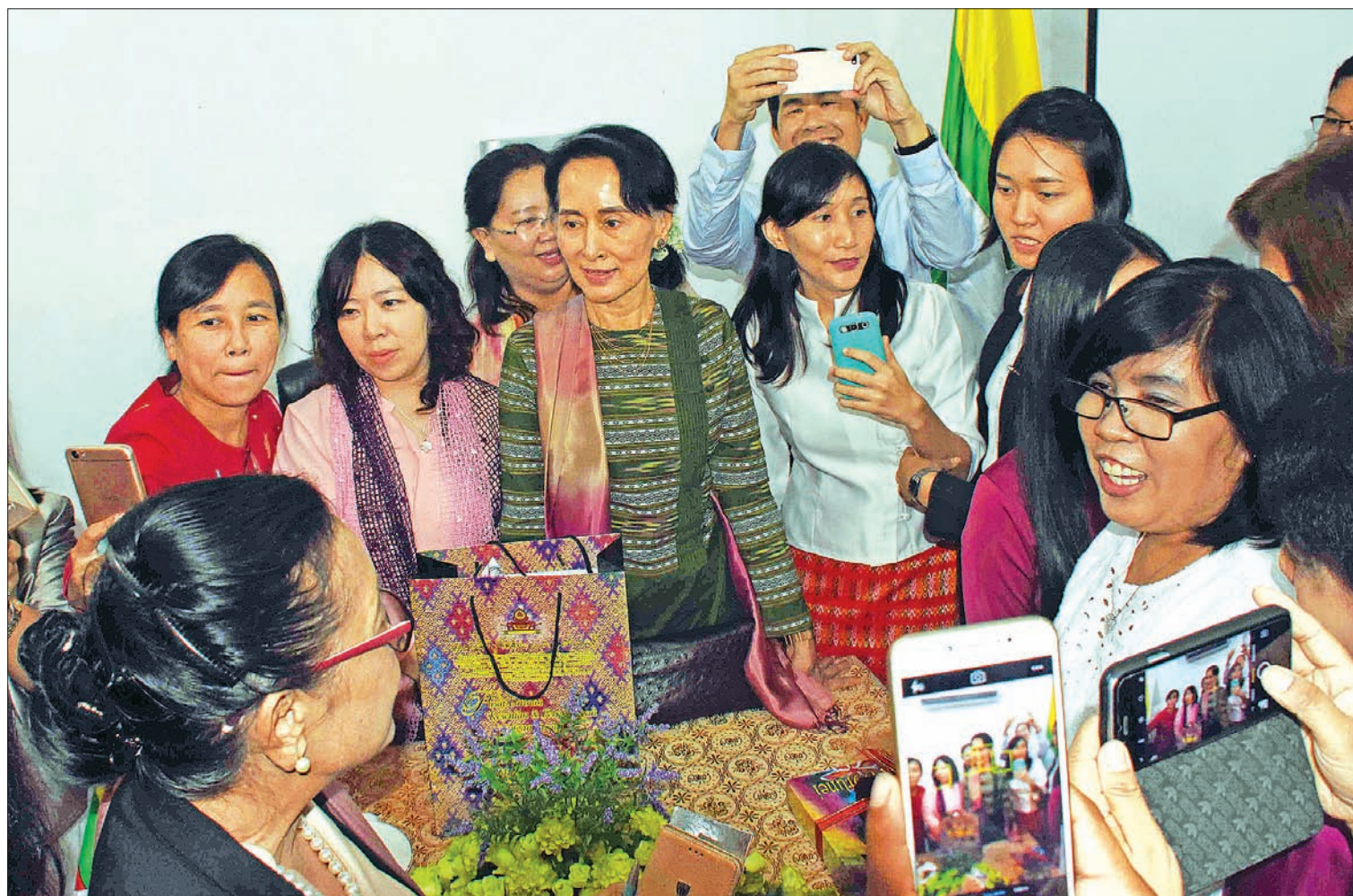
State Counsellor Daw Aung San Suu Kyi meeting with Myanmar nationals in Brunei on 6 October 2017.

Last night, the State Counsellor attended the royal banquet held at Istana Nurul Iman, the official residence of the Sultan of Brunei, in Brunei Darussalam Bandar Seri Begawan. The dinner was held in honour of the Royal Jubilee marking 50 years on the throne of His Majesty Sultan Hassanal Bolkiyah Mu'izzaddin Wadduwa, the world's second-longest reigning monarch. In addition to the State Counsellor, also in attendance at the royal banquet last night were other Southeast Asian leaders such as Philippines President Rodrigo Duterte and Middle Eastern royalty.—Myanmar News Agency