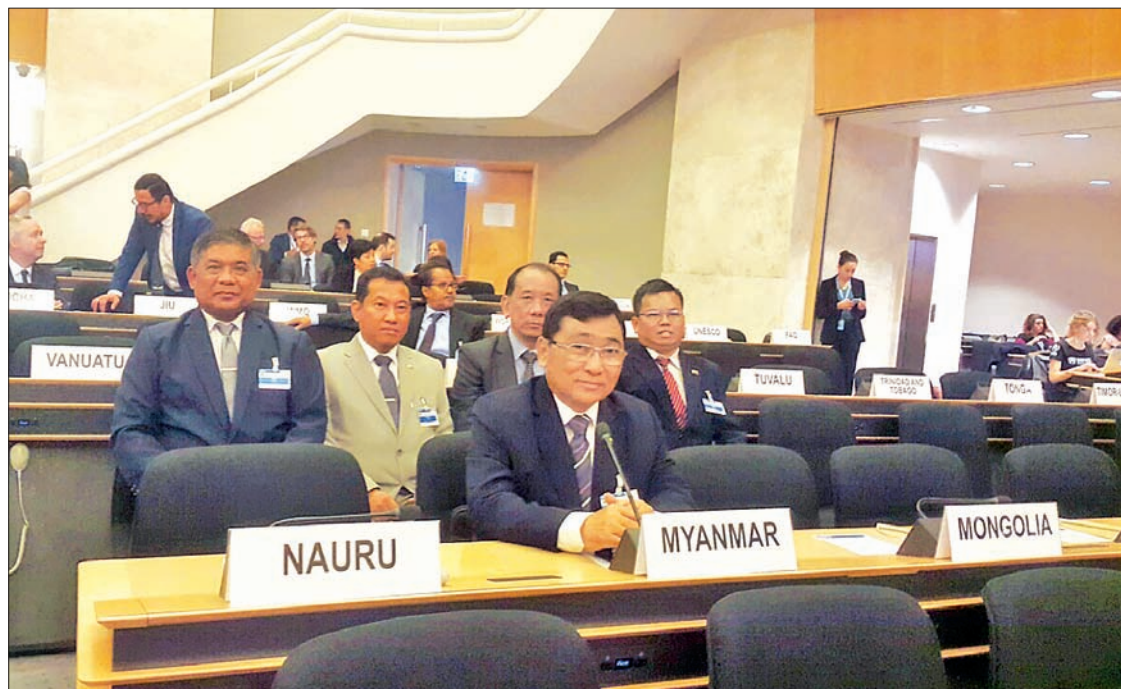
Myanmar delegation led by Union Minister Dr Win Myat Aye attending 68th Session of the Executive Committee of United Nations High Commissioner for Refugees.

The Union Minister added, "In launching the operations against these terrorist attacks, security forces paid special attention for innocent people not to be harmed. Simultaneously, tasks of providing humanitarian aid to the victimized people were carried out. Controversial conflicts happening currently in Rakhine State got involved