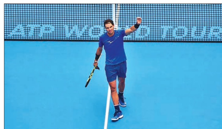
Rafael Nadal of Spain reacts during the men's singles quarter-final match against John Isner of the United States of America at the China Open tennis tournament in Beijing on 6 October 2017. Rafael Nadal won 2-0 and advanced to the semifinal.

edition of the international men's football championship of Asia. For the first time, the Asian Cup final tournament will be contested by 24 teams, having been expanded from the 16-team format that had been used from 2004 to 2015. The qualification process will involve four rounds, where the first two doubled as the 2018 FIFA World Cup qualification for Asian teams. ■