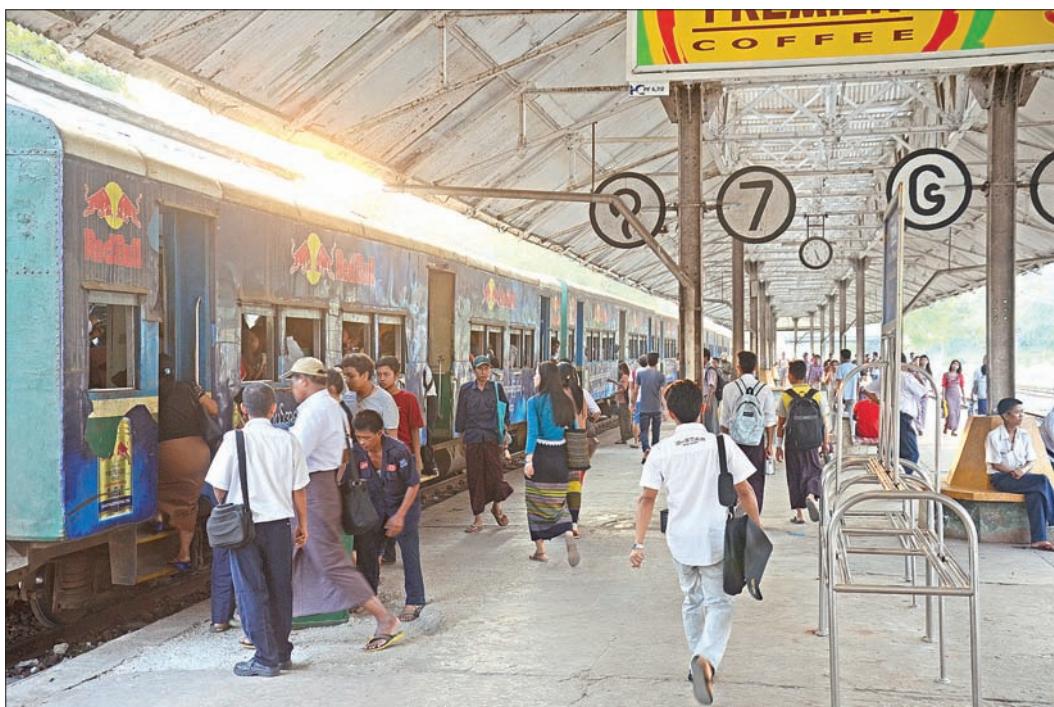
Commuters are struggling to ride a circular train at Yangon Central Railways Station.

Due to limitation of space we are only able to publish "Letter to the Editor" that do not exceed 500 words. Should you submit a text longer than 500 words please be aware that your letter will be edited.