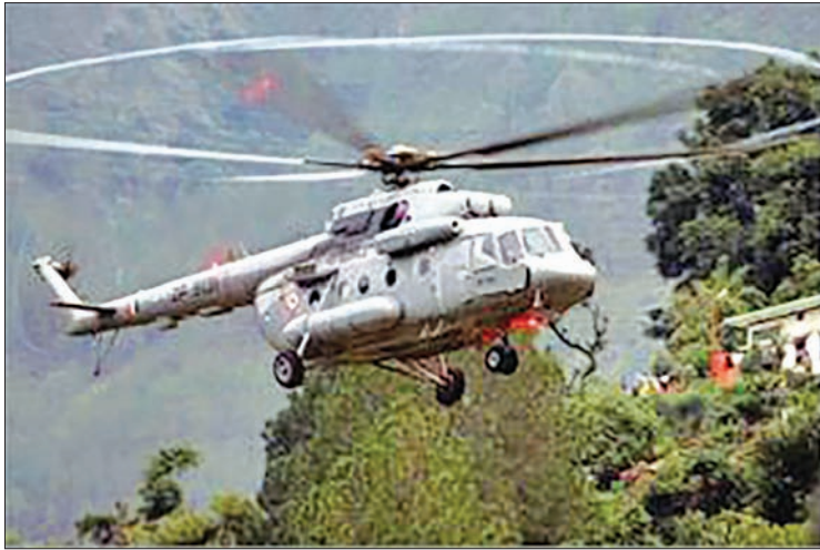
An Mi-17 helicopter of the IAF.