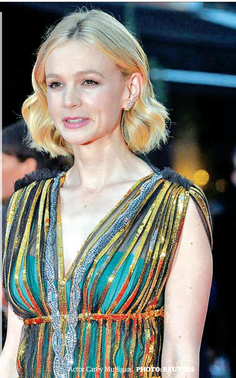
Actor Carey Mulligan.

"What this film does so cleverly is it creates empathy," Mulligan said. "It gets you in the mind of all the different characters. It makes you look at so many people's different perspectives and it asks you to ask the right questions, but it's not prescriptive. It's not telling you what to think."—Reuters ■