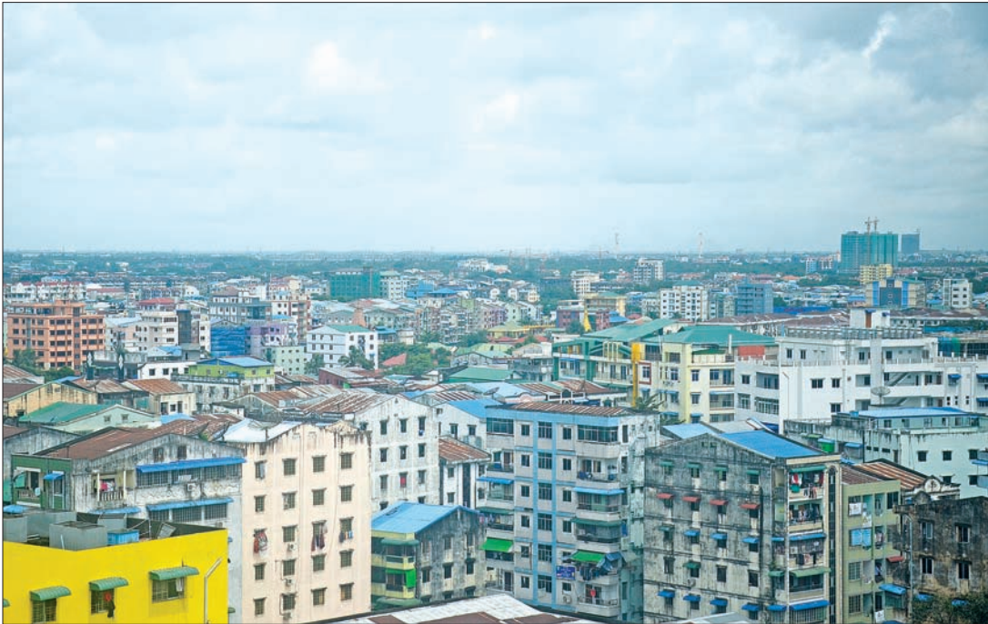
An aerial view of downtown Yangon.