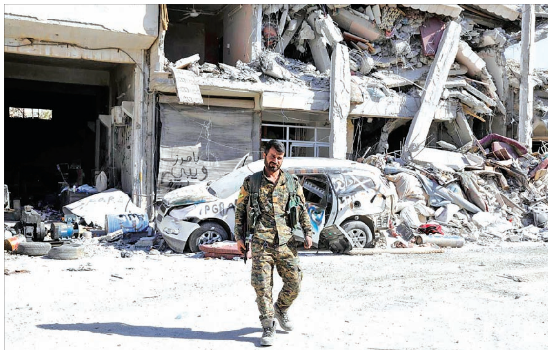
A fighter of the Syrian Democratic Forces guards a road at the frontline in Raqqa, Syria, on 5 October 2017.

The nascent Raqqa Civil Council, set up to rebuild and govern Raqqa, faces a huge task. It says aid from countries in the