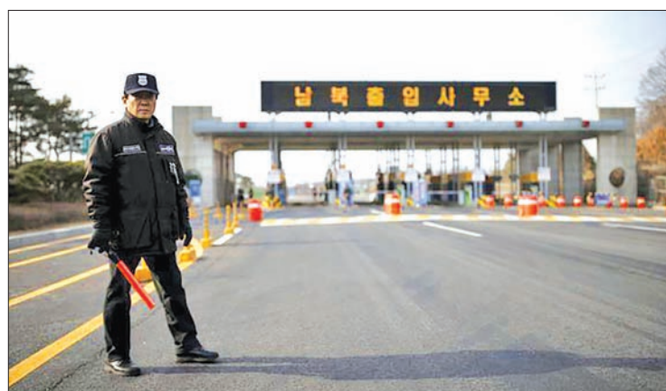
A South Korean security guard stands guard on an empty road which leads to the Kaesong Industrial Complex (KIC) at the South's CIQ (Customs, Immigration and Quarantine), just south of the demilitarised zone separating the two Koreas, in Paju, South Korea, on 11 February 2016.

At the time, South Korea said it would no longer allow funds paid for Kaesong to be used in the North's missile and nuclear programmes. Since then, a South Korean official has said there is no evidence that North Korea diverted wages paid to its workers by South Korean companies operating in the park to its weapons programmes.