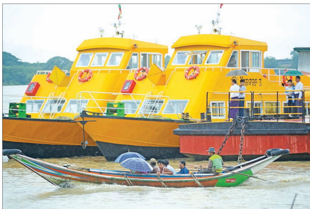
Two water buses are seen in the Yangon River at the ceremony to launch.

"We are happy to participate in a small way in the government's reforms. Our company has experience in providing riverine service to foreigners along the Ayeyawady River. We want to provide good service to our