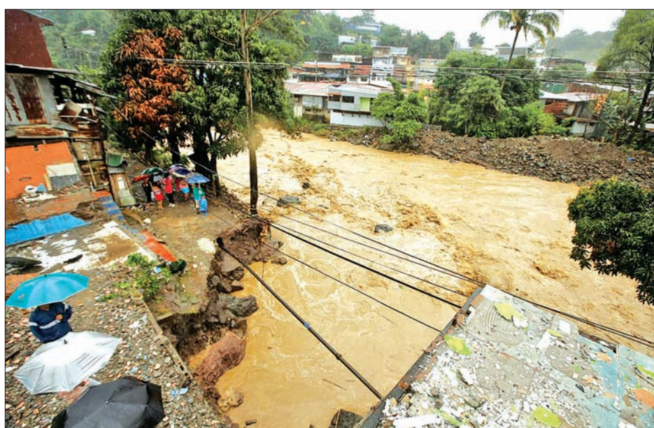
People look at a street collapsed by the Tiribi river flooded by heavy rains from Tropical Storm Nate in San Jose, Costa Rica, on 5 October 2017.

Emergency officials in Costa Rica reported that at least eight people were killed due to the lashing rain, including two children. Another 17 people were missing, while more than 7,000 had to take refuge from Nate in shelters, authorities said.