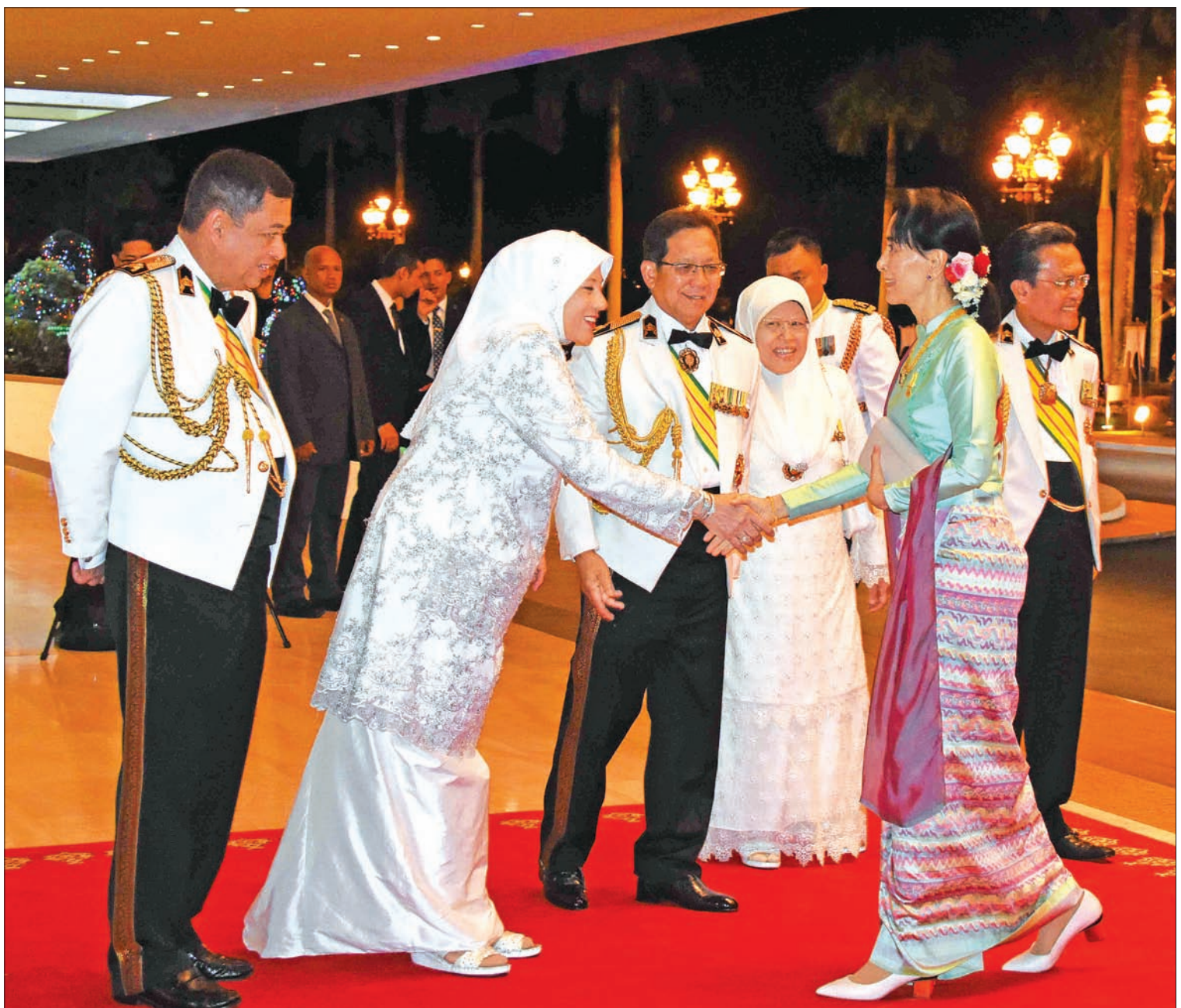
State Counsellor Daw Aung San Suu Kyi is welcomed by dignitaries at the Royal Palace as she arrives to attend the Royal Banquet.