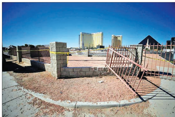
A broken fence is pictured leading from the parking lot near the site of the Route 91 music festival mass shooting in Las Vegas, Nevada, US, on 5 October 2017.

The carnage on Sunday night across the street from the Mandalay Bay hotel ranks as the bloodiest mass shooting in modern US history, surpassing the 49 people shot to death last year at a gay nightclub in Orlan-