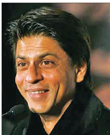
Superstar Shah Rukh Khan.

MUMBAI — Superstar Shah Rukh Khan has thanked his leading ladies Sridevi, Kajol, Karisma Kapoor, Rani Mukerji and Alia Bhatt for being the epitome of love and grace.