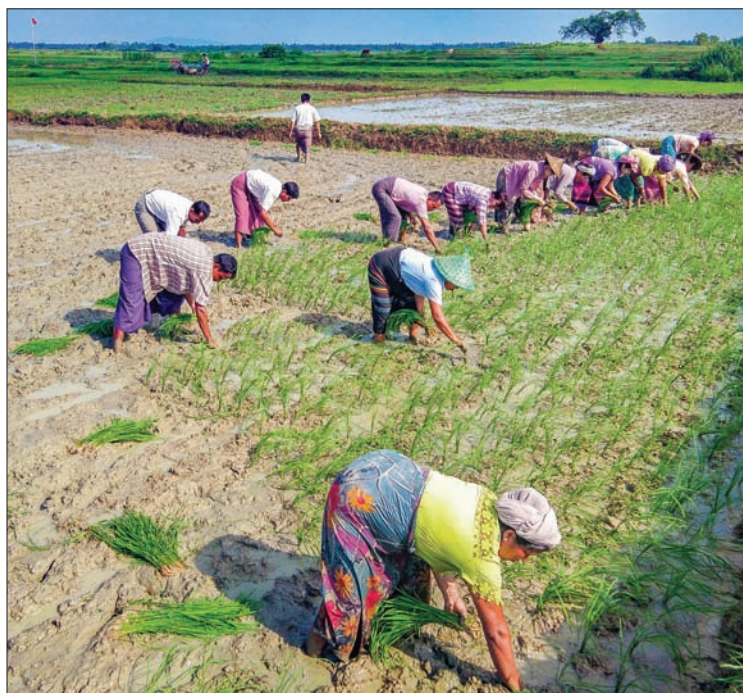
Farmers planting seeds on the farming land in Maungtaw, Rakhine State.

IN an effort to improve, modernise and increase the agricultural presence in the Rakhine State, State and Union governments will provide training, techniques, machinery and high-quality seeds, it was announced yesterday.