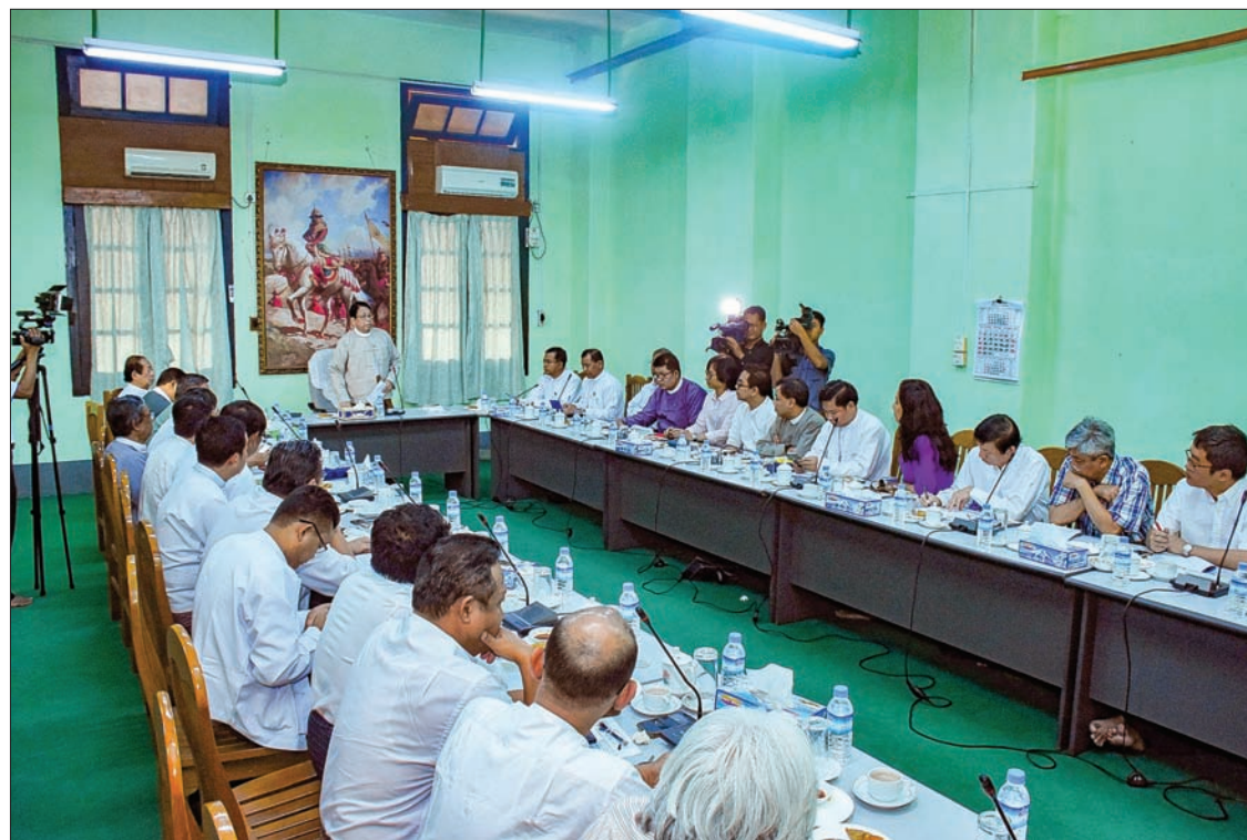
Union Minister Dr Pe Myint discusses with local journalists and foreign correspondents in Yangon.

One year after the attacks of 9 October, 2016, the latest coordinated attacks on more than 30 police outposts by terrorists