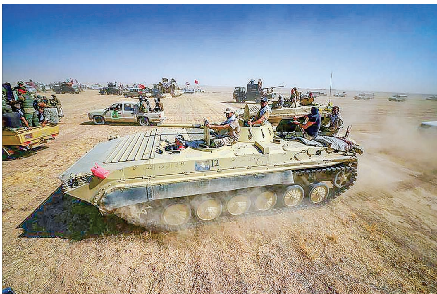
Military vehicles of Iraqi army and Shi'ite Popular Mobilization Forces are seen on the outskirts of Hawija.

Iraq's autonomous Kurdistan region announced on Tuesday it was calling presidential and parliamentary elections for 1 November. Baghdad has responded with further punitive measures, having already slapped sanctions on Kurdish banks and halting foreign currency transfers to the Kurdish region. Iraq's central government, its neighbours and Western powers fear the vote in favour of secession could spark another, wider conflict in the region to add to the war in Syria, and fear it could derail the fight against Islamic State. The Kurds are the region's fourth largest ethnic group, spread across Iran, Turkey, Syria and Iraq, all of which oppose any moves towards sovereignty. In Turkey, a 30-year insurgency waged by Kurdistan's Workers' Party (PKK) militants has recently flared up since a ceasefire broke down almost two years ago.—Reuters ■