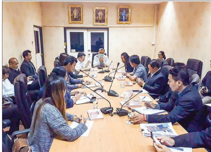
Thailand's Department of Labour Protection and Welfare officials and Myanmar philanthropic organisations hold a meeting in Bangkok, on 3 October 2017.