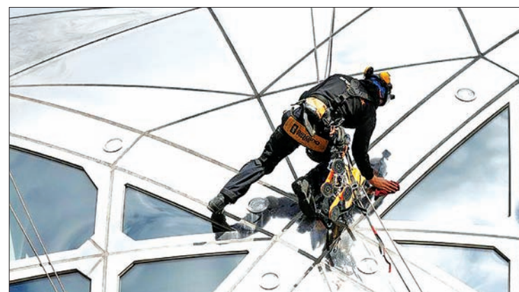
A worker cleans one of the nine spheres of the Atomium, a 102-metre-tall (335-foot-tall) structure designed for Expo 58 in the form of a crystal of iron, during the annual cleaning of Brussels' iconic monument, Belgium on 3 October, 2017.

"Each one of us, we are proud to do this because this is a symbol of Belgium." —Reuters ■