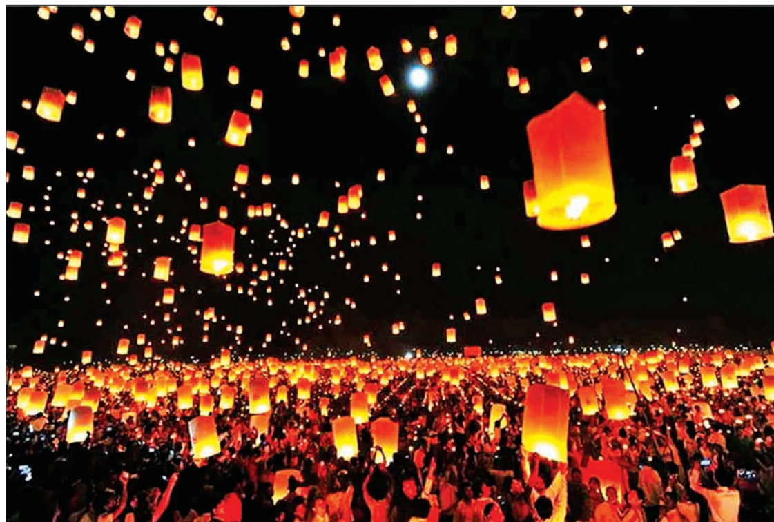
Hundreds of people release lanterns into the sky in celebration of Thadingyut.

Lord Buddha went up to the celestial Kingdom "Tavatimsa" where his mother Maha Maya, chief Queen of Emperor Sudhodana of Kapila Vittu Kingdom became Sandusitha deva, after her demise a week after she gave birth to baby boy Prince Sidhartha [Bodhisutha or Buddha to be] For carrying and keeping in her womb and giving birth to him and feeding him her breast milk the son owed indefinite gratitude to his mother. On becoming Buddha, the son was obliged to fulfill his filial gratitude to his mother. So the Buddha spent the whole Lent in Tavatimsa to deliver his Abhidhamma to his mother, now Santisitha deva in Tavatimsa celestial Kingdom. The delivery of Abhidhamma at Tavatimsa took the whole rain retreat of that year. All Brahmas and deities of the entire Universe gathered to listen to