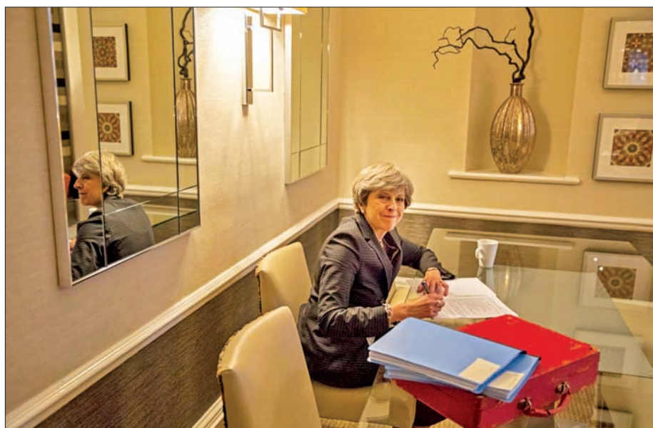
British Prime Minister Theresa May is pictured in her hotel room as she prepares her conference speech that she will deliver to her party's annual conference, tomorrow, in Manchester Central conference center, in Manchester, Britain on 3 October, 2017.

be make or break for the prime minister, whose attempt to present a united front at the conference has been undermined by Johnson, a possible leadership contender who received rousing applause for his speech on Tuesday.