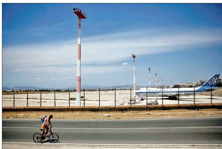
A man rides his bike along the former international Hellenikon airport in Athens, Greece on 16 July, 2017.

Prime Minister Alexis Tsipras, whose leftist party strongly opposed it before coming to power in 2015, is now seen as keen to implement the deal to help boost economic activity and reduce unemployment, the euro zone's highest. —Reuters ■