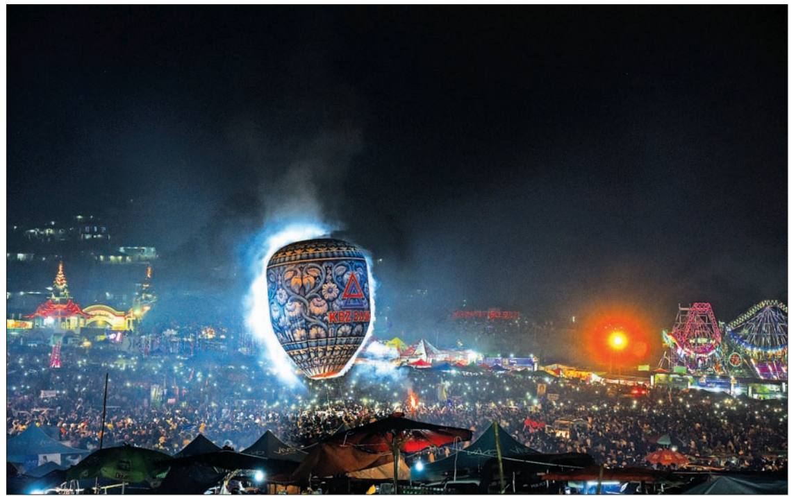
File photo shows a hot-air balloon lifts off in Taunggyi Tazaungdaing festival.

They also do not allow advertisements for beer other types of alcohol or cigarettes.