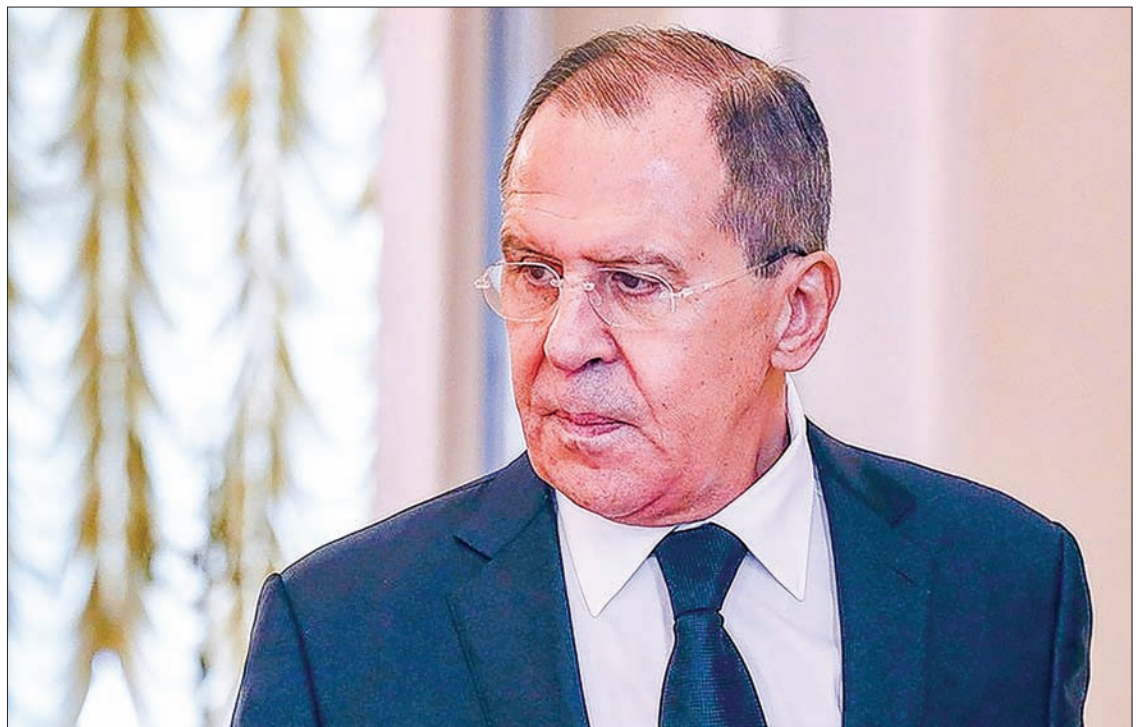
Russian Foreign Minister Sergey Lavrov.

“We do really seek it,” he stressed. “We understand that the US and Russia as major nuclear-weapon states bear special responsibility for the general situation in the world, for maintaining global stability and security. It can be viewed as a positive sign that our coun-