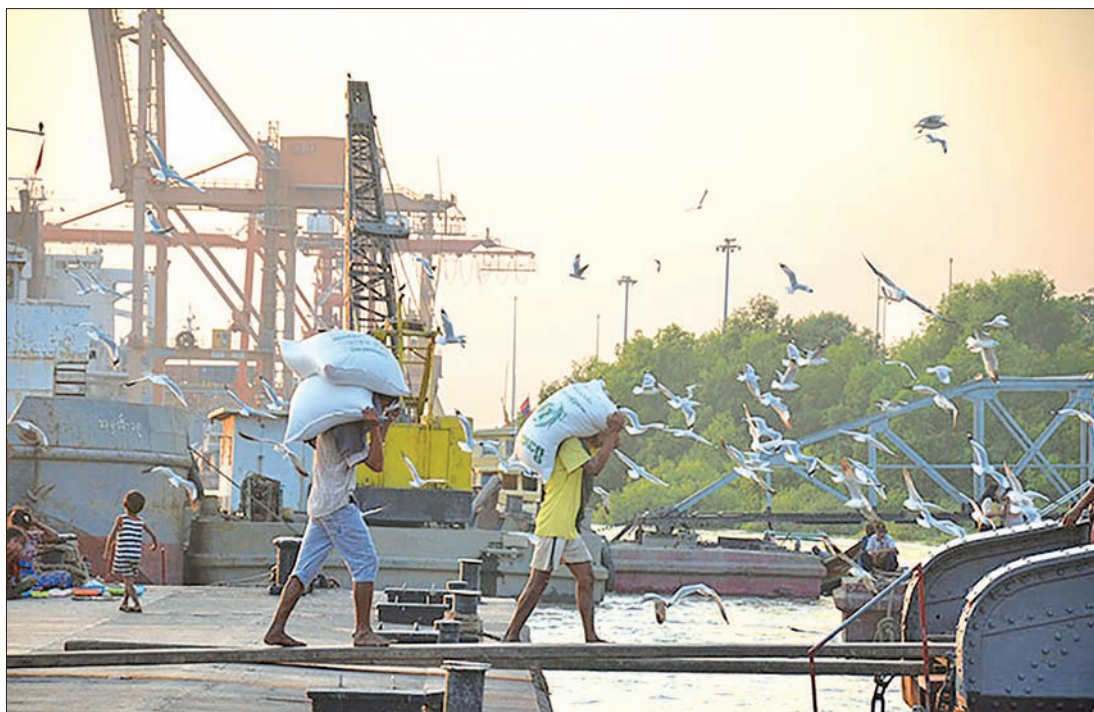
Workers loading rice bags onto a ship at a Bothtaung jetty in Yangon.