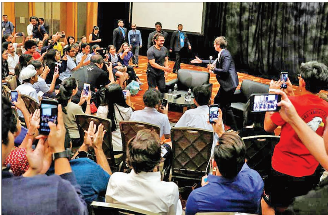
Actor Aamir Khan attends a meeting with students to talk about his film "Secret Superstar" in Singapore on 2 October, 2017.

the dream of a father which a daughter fulfils, this is about the hopes and aspirations of a 14-year-old girl from a small town in India. I don't know what the box office will be but it's a bigger film than Dangal in what it's trying to say."