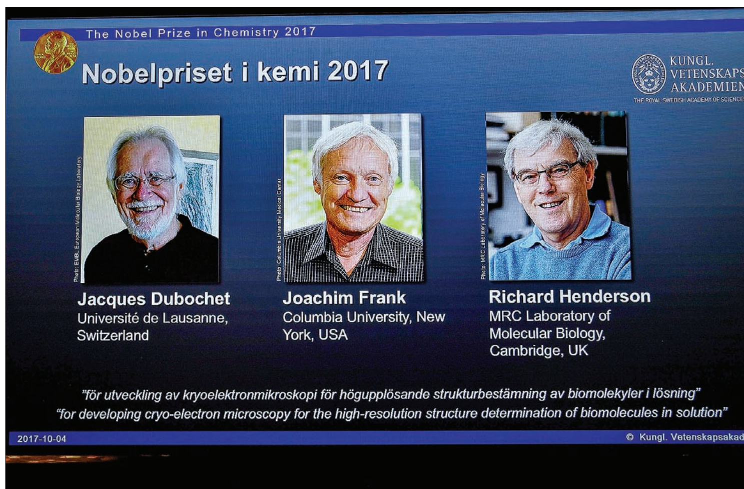
The names of Jacques Dubochet, Joachim Frank and Richard Henderson are displayed on the screen during the announcement of the winners of the Nobel Prize in Chemistry 2017, in Stockholm, Sweden on 4 October, 2017.