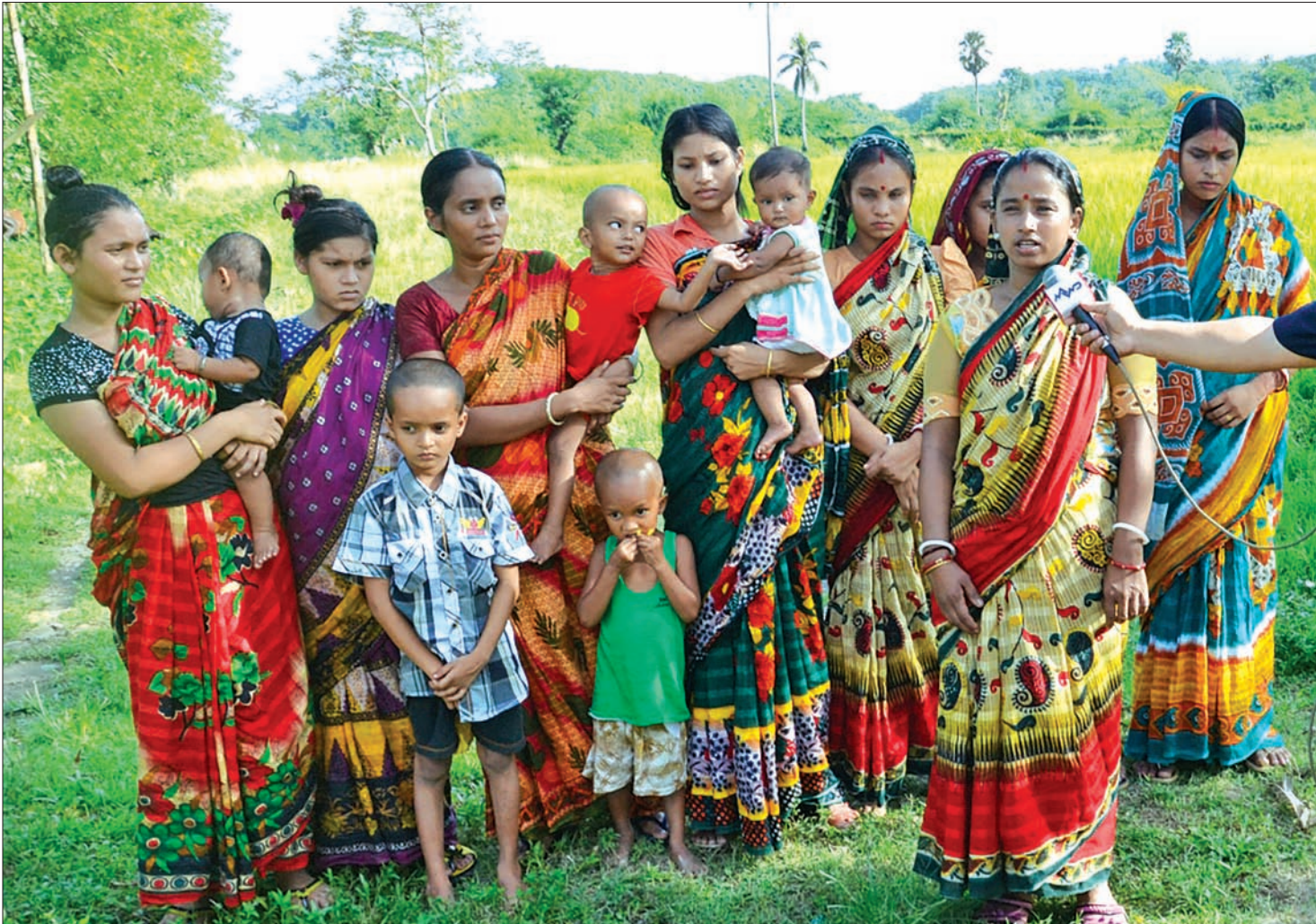
Eight Hindu women arrive back Myanmar together with their children.