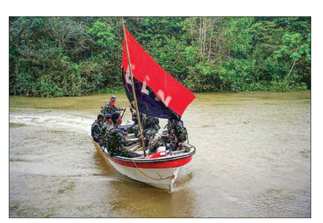
Rebels of Colombia's Marxist National Liberation Army (ELN) arrive in a boat, in the northwestern jungles, Colombia, on 30 August 2017.

the road to a definitive peace accord will be long and complex. The ELN is considered hard-line in its ideology and was not known for compromise during past attempts at peace.