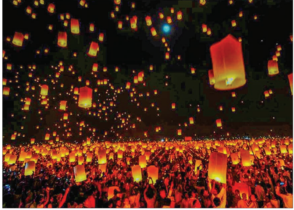
Hundreds of people release lanterns into the sky in celebration of Thadingyut.

Students of Dhamma School Foundation in Kawthoung Township will celebrate 3000 candle light festival and launching 1000 hot-air balloons festival on 1st waning of Thadingyut (6 October) on the platform of Shwe Pyi Thar Anandar Pagoda in Kawthoung Township, Taninthayi Region. Kawthoung Township Dhamma School Foundation will celebrate the festival in cooperation with Dhamma Kaya Foundation of Thailand as a second time. Possession of 3000 Dhamma School students from various places of the town holding the candle light will gather and offered candle lights systematically to the Shwe Pyi Thar Arnandar Pagoda platform. Then. 1000 ho-air balloons festival including donation of foods will be grandly continued.—Kyaw Soe (Kawthoung) ■