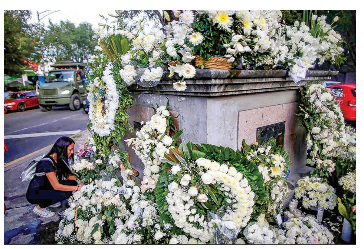
People put floral wreaths for the students of the Enrique Rebsamen school after an earthquake in Mexico city, Mexico, on 22 September 2017.

While the quantity of steel required under Mexico's stringent post-1985 building code