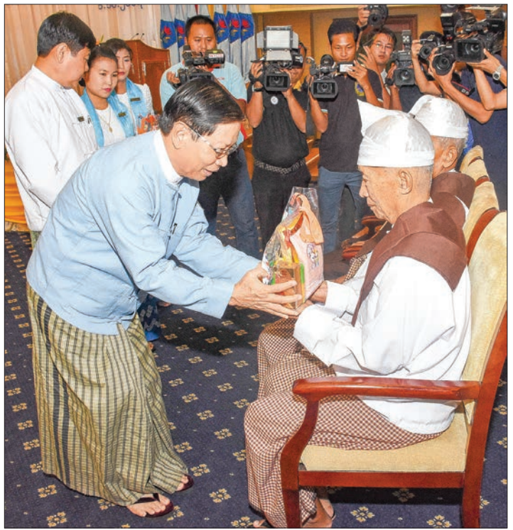
Union Minister Thura U Aung Ko presents medicines and cash donations to an aged person.

The system of caring the older persons through voluntary homes for the aged began over 100 years ago in 1915. At present, 82 recognized homes for the aged