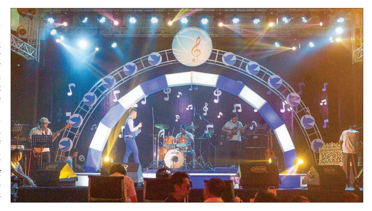
The stage for the Peace music festival 2017 held in Hpa-An Town in Kayin State.

The real time announcements of Peace music festival 2017 posted at Peace Music Festival Facebook Page can be seen at www.facebook.com/ peacemusicfestival. Families of the festival and well-wishers are visiting IDP camps of the host cities and donating provisions. —Saw Myo Min Thein (IPRD) ■