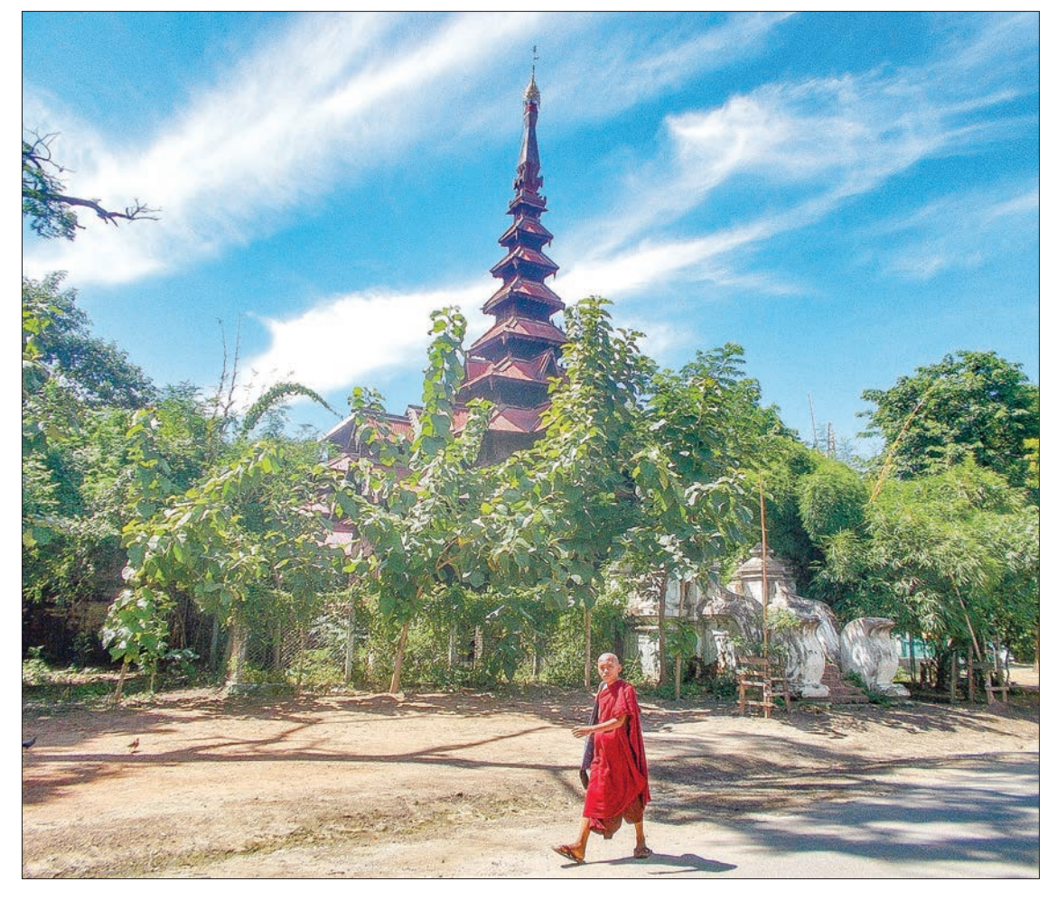
A historical monastery being seen in Mandalay.

This historical monastery is located in west Daywun Quarter, Chan Mya Thar Zi Township. Delicate adornments, volute stairs, verandas and Buddha Images of Yadanarbon Era and wood carvings are conserved and tourists appreciate monuments.