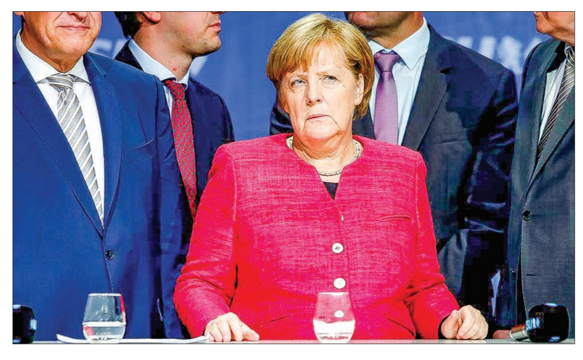
German Chancellor Angela Merkel.

The AfD's surge prompted soul-searching within the conservative camp, with many blaming Merkel's 2015 decision to open the doors to over a million migrants fleeing war and poverty in the Middle East and Africa for