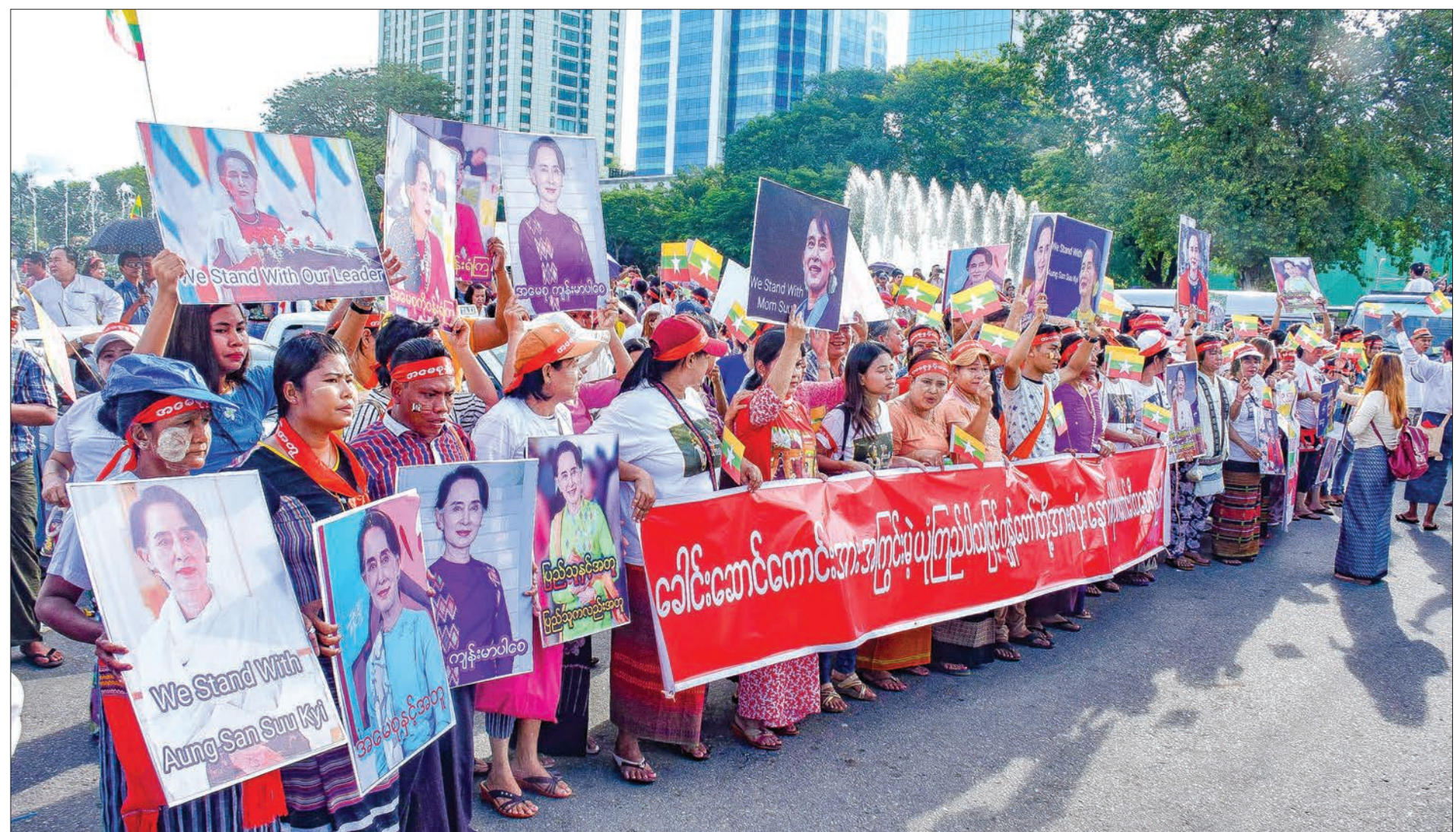
Yangonites showing solidarity with State Counsellor Daw Aung San Suu Kyi.