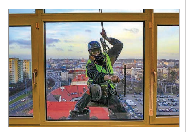
A worker cleans the window of a high rise office building in Gdynia, Poland, in 2015. PHOTO: REUTERS

Poland's population of 38 million is among the most rapidly ageing in the European Union. "The government is throwing away the most effective tool to increase the labour market participation rate," Benecki said. The state pension agency ZUS has estimated that 331,000 people could decide to take advantage of the option to retire earlier, which would amount to 2.0 per cent of Poland's 16.3 million workers.—Reuters