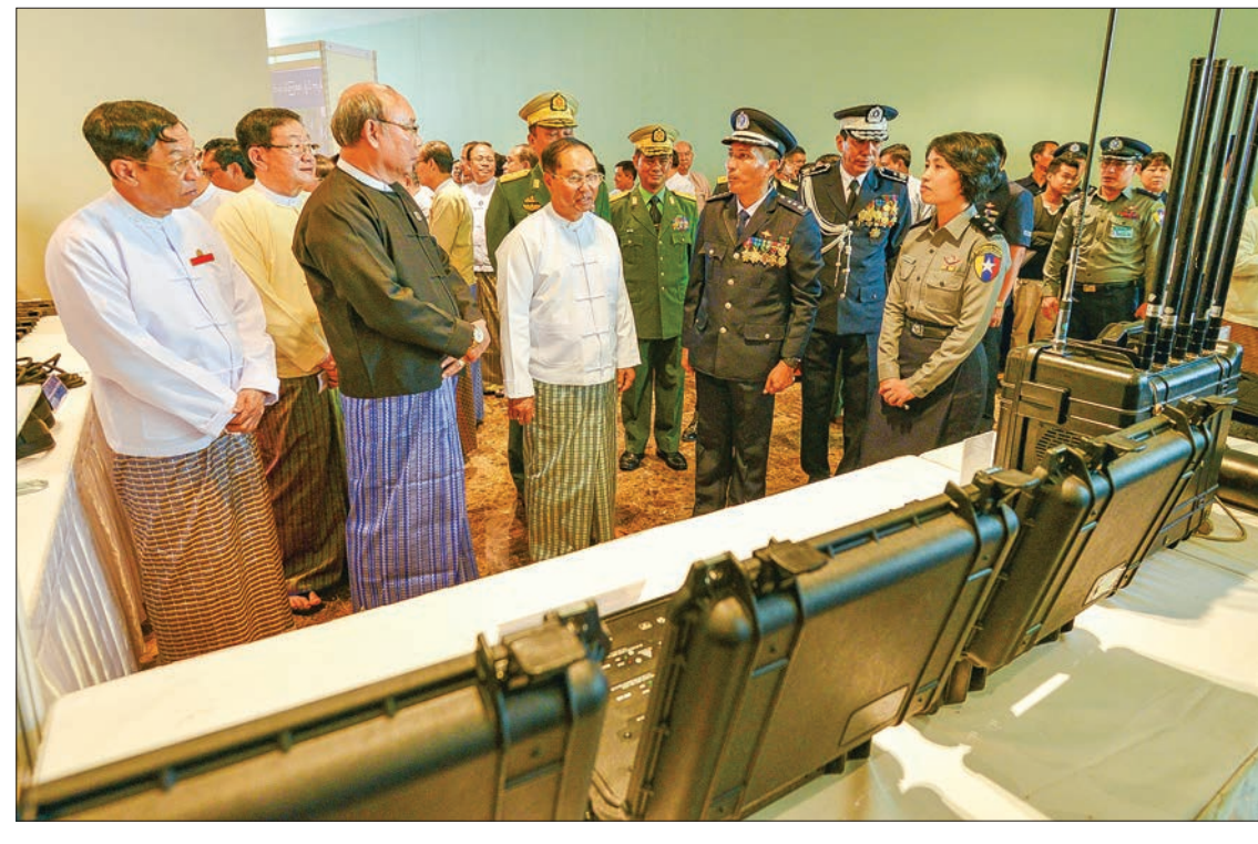
Vice President U Myint Swe attends 53rd Myanmar Police Force Day Celebration in Nay Pyi Taw.

Myanmar police force is now undergoing training in foreign countries in cooperation with EU, Interpol, Aseanpol, AFP, DEA, MPS. The workshops are also being held in relation with human rights, rule of law with the assistance of UNDP, UNICEF, UNDOC, ICRC, OHCHR and UN.