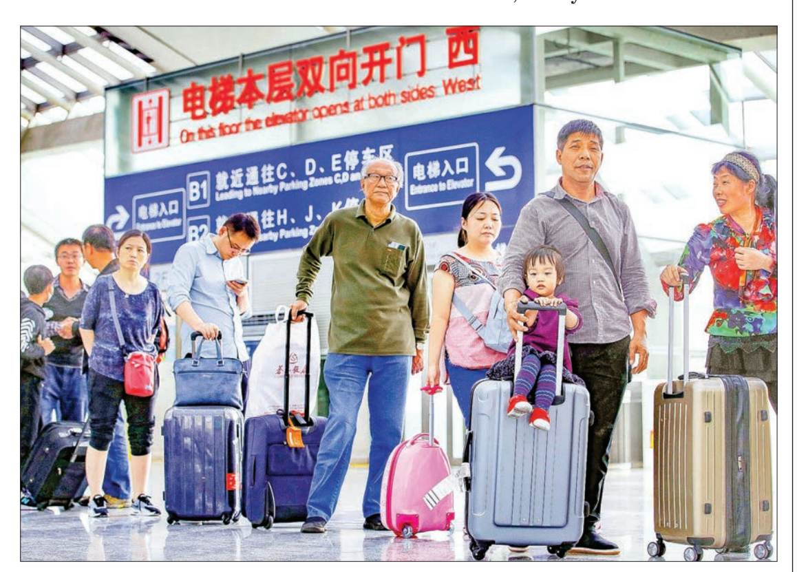
Beijing international airport is crowded with tourists heading overseas on China's 68th National Day on 1 October, 2017, the start of a weeklong holiday.

While installed to guard against the missile threat posed by North Korea, Beijing fears the THAAD system's power radar can also be used to spy deep within China. — Kyodo News ■