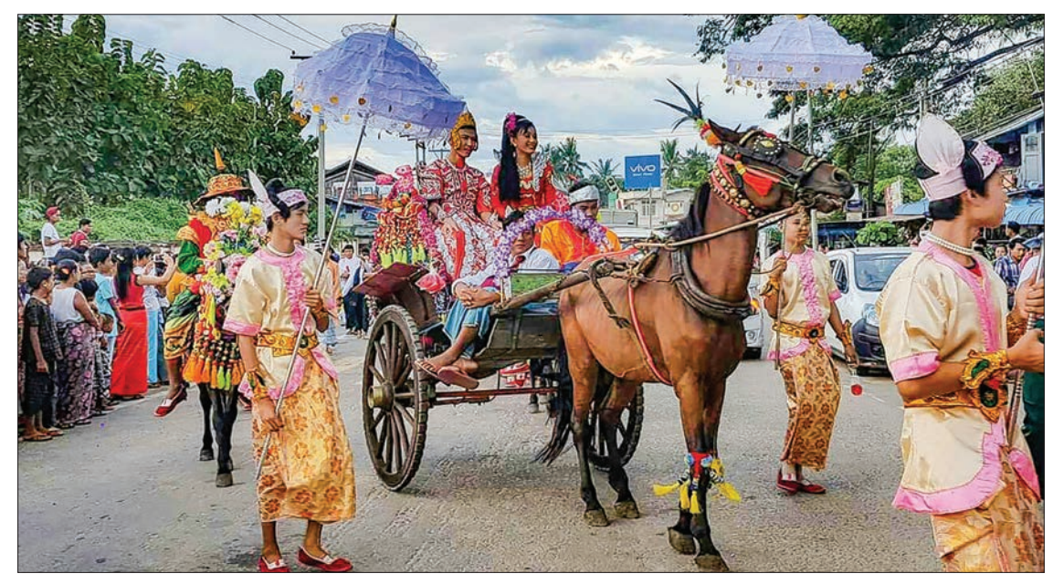
One of Dhamma chanting teams participating in the Annual Festival of Pyinmanna.

Every year, the said eight entertainment vehicles have