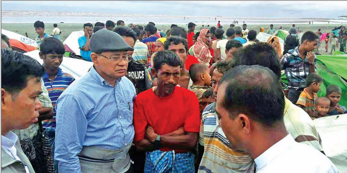
Members of the Myanmar National Human Rights Commission (MNHRC) meet ethnic Mro people in Aungthabyay Village in Maungtau Township, Rakhine State yesterday. (NEWS ARTICLE ON PAGE 3)