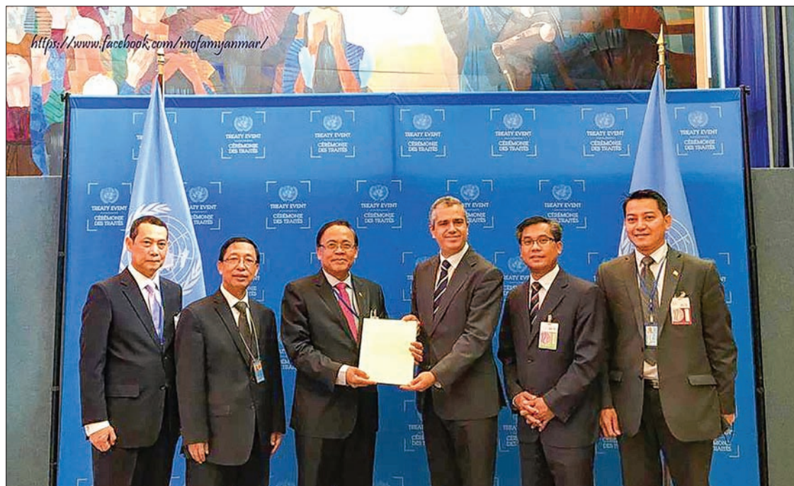
Minister of State for Foreign Affairs U Kyaw Tin presents the instruments of ratification on the Paris Agreement on Climate Change and acceptance of the Doha Amendment to the Kyoto Protocol to the Chief of the Treaty Section of the United Nations.

On 20 September, Minister of State for Foreign Affairs met with Mr. Mark Field, Minister of State for Foreign and Commonwealth Office of Britain and exchanged views on the true situation of northern Rakhine State. On 21 September, Minister of State for Foreign Affairs met with Mrs. Maria Angela Holguin Cuellar, Minister for Foreign Af-