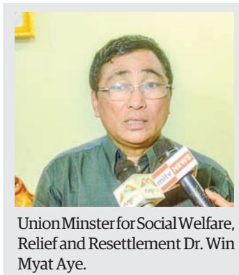
Union Minister for Social Welfare, Relief and Resettlement Dr. Win Myat Aye.

A. The affairs happening in Rakhine State started from many years ago. Since the time taking office, the incumbent government repeatedly says that it will prioritize bringing about the internal peace and affairs of the