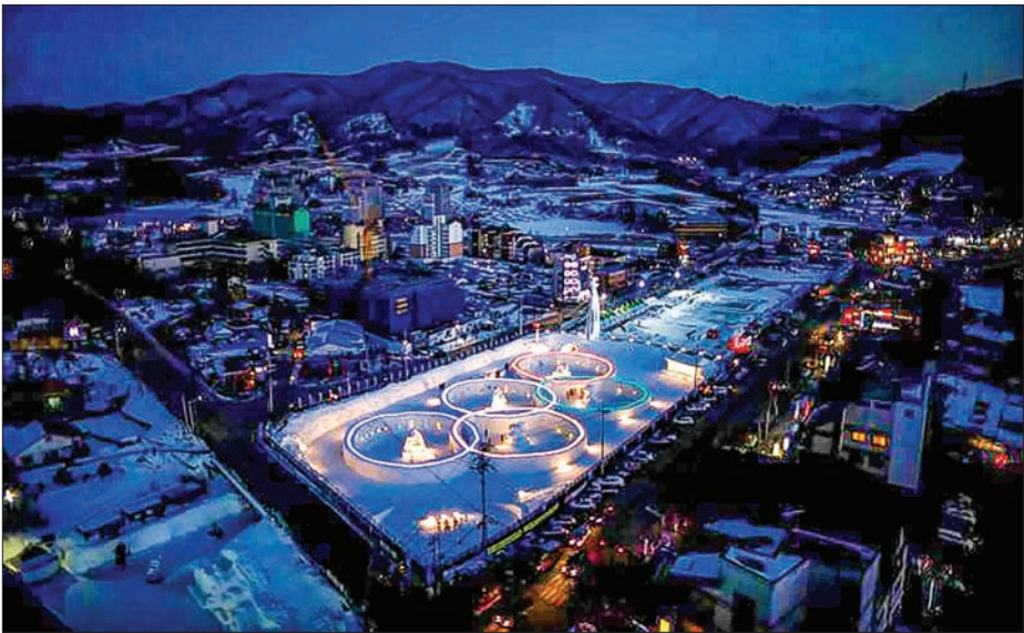
An ice sculpture of the Olympic rings is illuminated during the Pyeongchang Winter Festival, near the venue for the opening and closing ceremony of the PyeongChang 2018 Winter Olympic Games in Pyeongchang, South Korea, on 10 February 2017.