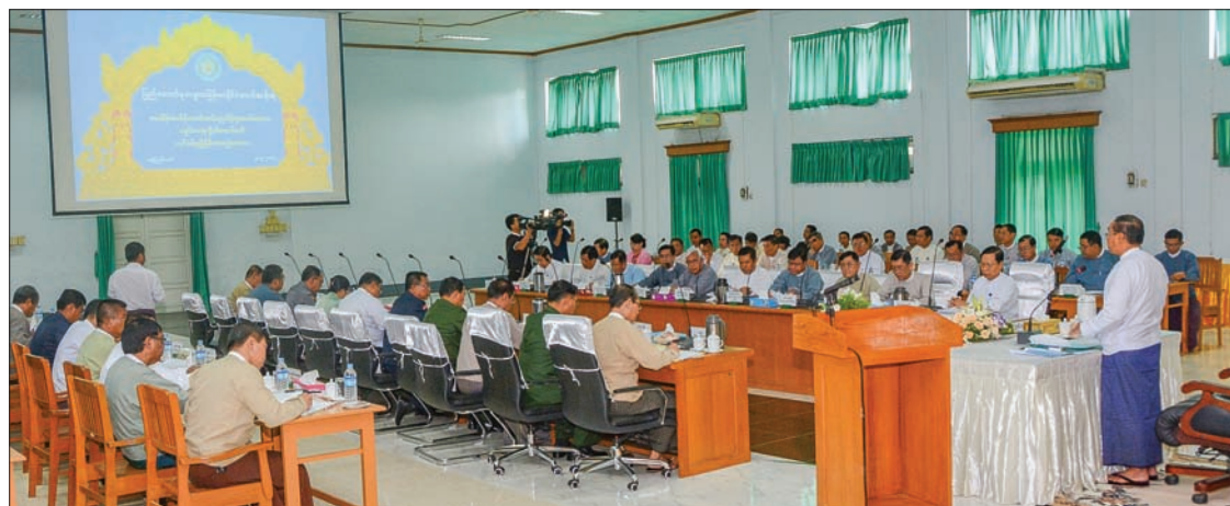
Vice President U Myint Swe addresses the meeting for Kathina ceremony in the hall of the Ministry of Religious Affairs and Culture in Nay Pyi Taw.

As the Kahtina ceremony is an annual, government-level cer-