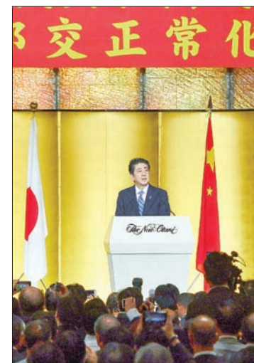
Japanese Prime Minister Shinzo Abe gives a speech at a ceremony held in Tokyo on 28 September 2017, a day before Japan and China mark the 45th anniversary of their diplomatic ties.

“By promoting reciprocal visits between political leaders of the two nations, we would like to drive Japan-China relations forward,” Abe said in a