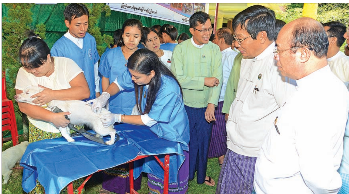
Veterinary doctor giving vaccination injection to dog at 11 th World Rabies Day ceremony.

The World Organisation for Animal Health (OIE), the World Health Organisation (WHO) and the Food and Agriculture Organisation of the United Nations (FAO) are attempting to prevent rabies under the concept of "One World, One Health" and with the