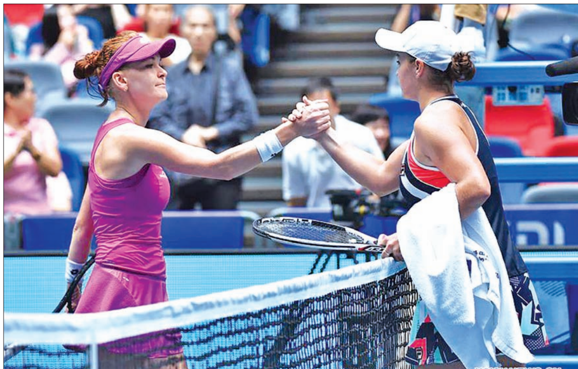
Agnieszka Radwanska (L) of Poland shakes hands with Ashleigh Barty of Australia after their singles third round match at 2017 WTA Wuhan Open in Wuhan, capital of central China's Hubei Province, on 27 September 2017. Agnieszka Radwanska lost 1-2.

WUHAN, (China) — Round three of action here at the Dongfeng Motors Wuhan Open started out with yet another major upset in what has become a jungle of a stop on the WTA tour.