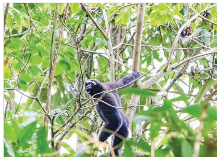
An endangered species of snub-nosed monkey.

The Myanmar snub-nosed monkey lives only in the remote high forests of northeast Myanmar and across the border in China's Gaoligong Mountain Natural Preserve. There are as few as 260 to 330 left in the wild, according to conservationists.—Shin Min ■