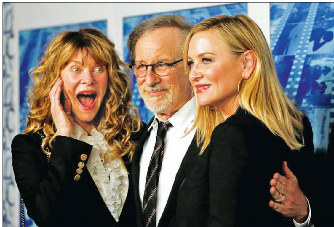
Director Steven Spielberg, his wife Kate Capshaw (L) and stepdaughter Jessica Capshaw pose at the premiere of the HBO documentary film "Spielberg" in Los Angeles, California, US, on 26 September 2017.

LOS ANGELES — Steven Spielberg has directed dozens of award-winning movies in a 40-year career, but when it came to turning the cameras on himself he found the attention pretty uncomfortable.