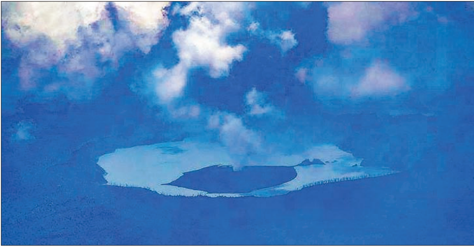
Smoke emanates from the Manaro Voui volcano located on Vanuatu's northern island Ambae in the South Pacific, in this aerial photo taken on 26 September 2017.

"The evacuation of every family out of Am-