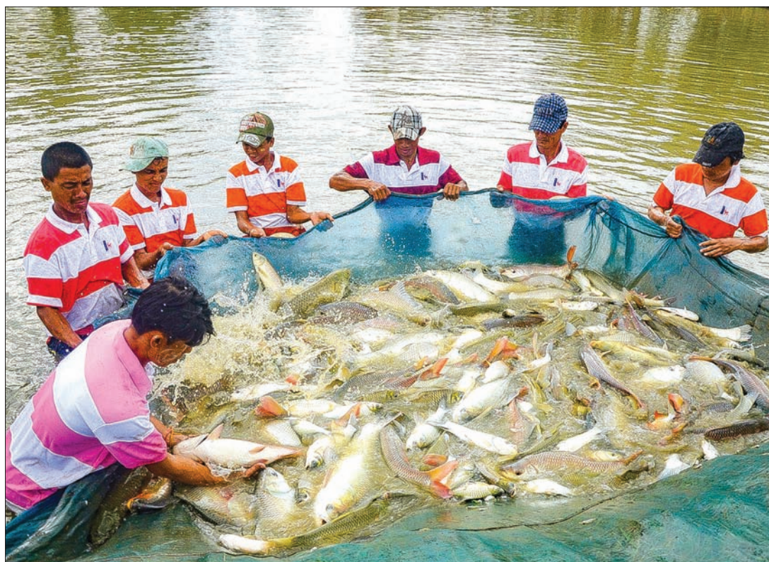
Fishes are caught to be bred at a farm in Yangon.

Due to limitation of space we are only able to publish "Letter to the Editor" that do not exceed 500 words. Should you submit a text longer than 500 words please be aware that your letter will be edited.