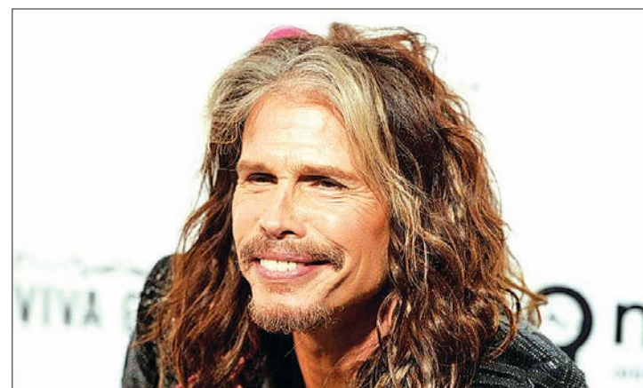
Musician Steven Tyler arrives at the Elton John AIDS Foundation Academy Awards Viewing Party in West Hollywood, California in 2016.

LOS ANGELES — Aerosmith lead singer Steven Tyler is dealing with an "unexpected medical issue" that has forced the band to cancel four shows in South America, the group said in a statement on Tuesday.