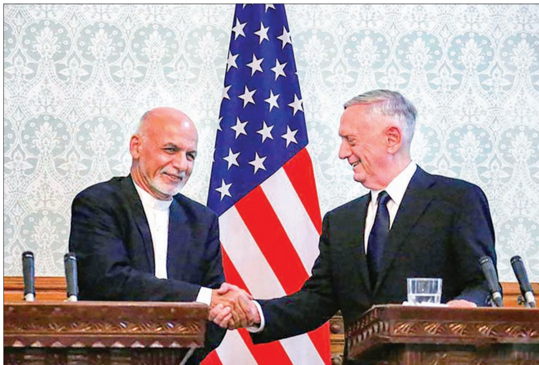
Afghan President Ashraf Ghani (L) shakes hands with visiting US Defence Secretary James Mattis during a joint press conference in Kabul, capital of Afghanistan, 27 September 2017. The visiting US Defence Secretary James Mattis said Wednesday that the exact number of additional US troops to be deployed in Afghanistan was not still clear.

Talking to reporters at the press conference, Stoltenberg stated that NATO had welcomed