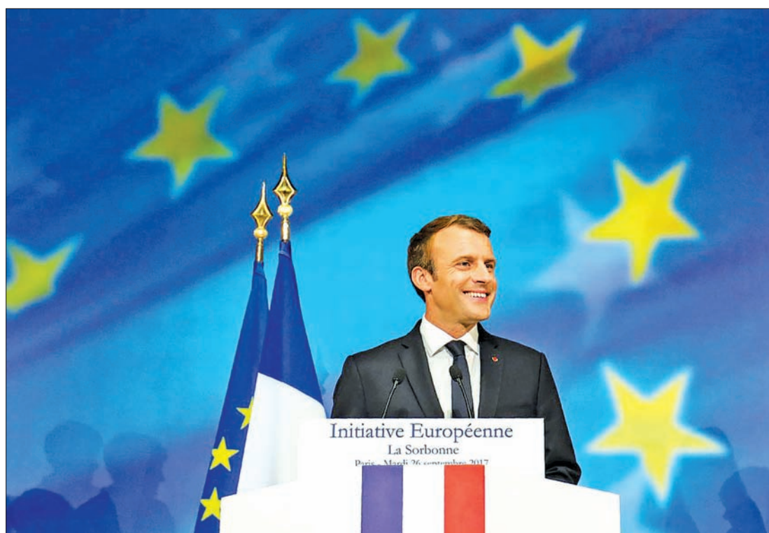
French President Emmanuel Macron delivers a speech to set out plans for reforming the European Union at the Sorbonne in Paris, France, on 26 September 2017.

But four days after a German election that has raised the prospect of months of tough coalition talks for Chancellor Angela Merkel, the most influential EU leader, and two days after Macron's rallying cry for deeper integration of national economies, the focus will rather be on the fizz of new initiatives, diplomats say. “Macron has stolen the show,” one senior EU official said of the dinner debate and which all of the 28 national leaders bar Spanish Prime Minister Mariano Rajoy are expected to attend. Many admire the youthful new French president's energy and oratory after years in which Paris, long a driving force