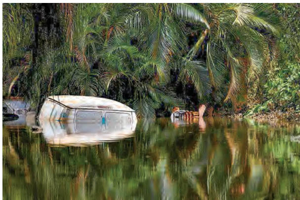
A car submerged in flood waters is seen close to the dam of the Guajataca lake after the area was hit by Hurricane Maria in Guajataca, Puerto Rico, on 23 September 2017.