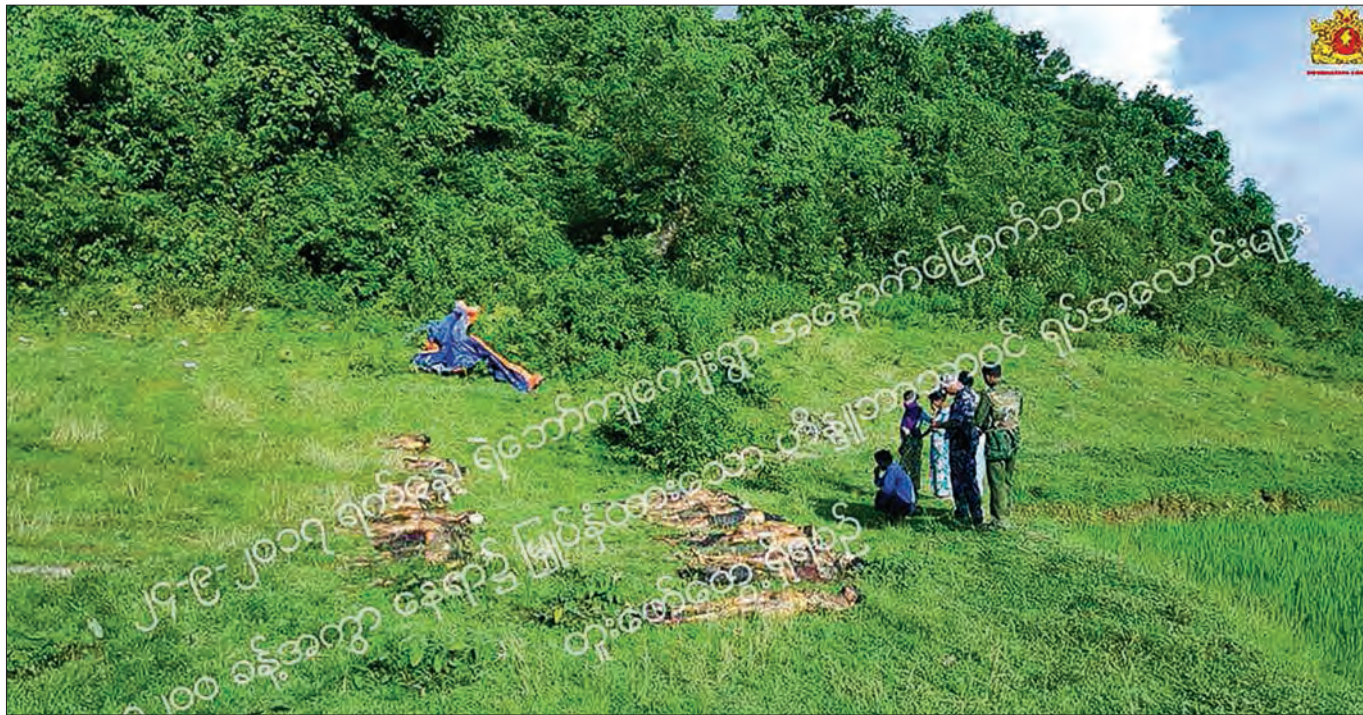
Remains of Hindus murdered by terrorists in Northern Rakhine State.