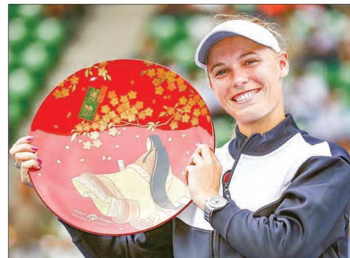
Caroline Wozniacki of Denmark celebrates after defeating Anastasia Pavlyuchenkova of Russia 6-0, 7-5 in the final of the Toray Pan Pacific Open at Tokyo's Ariake Colosseum, on 24 September 2017.

"I've won here in the past and it's a great court where I have great memories so I'm very happy."—Kyodo News ■