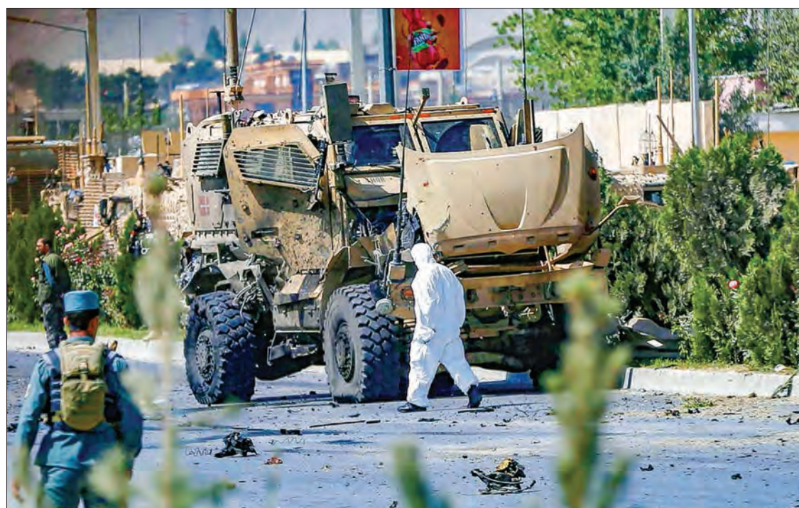
An Afghan official investigates a damaged Danish convoy at the site of a car bomb attack in Kabul, Afghanistan, on 24 September 2017.

Afghan security officials said a car bomb had been used in the attack on the convoy.—Reuters ■