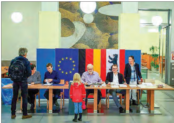
Working staff help voters to cast ballot at a polling station in Berlin, Germany, on 24 September 2017.

"We work too long. We have to retire at 67 years old to get our pensions," a voter said anonymously to Xinhua. — Xinhua ■