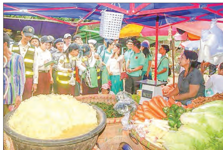
A surprise check finds contaminated foodstuff.

micelli and noodle produced by Mya Thidar food industry have been contaminated with formaldehyde out of 26 items, with 5 purified water factories in Wakema, Kyonmangay and Shwelaung found to have been unregistered. Those who produce for distribution of foodstuff unfit for health will be taken into legal actions, it was learnt. — Myanmar Digital News ■