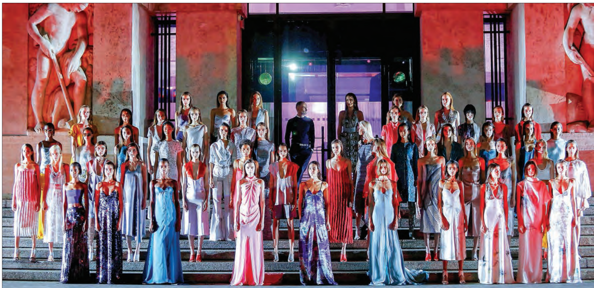
Models parade in front of Milan's stock exchange at the end of the Salvatore Ferragamo Spring/Summer 2018 show at the Milan Fashion Week in Milan, Italy, on 23 September, 2017.