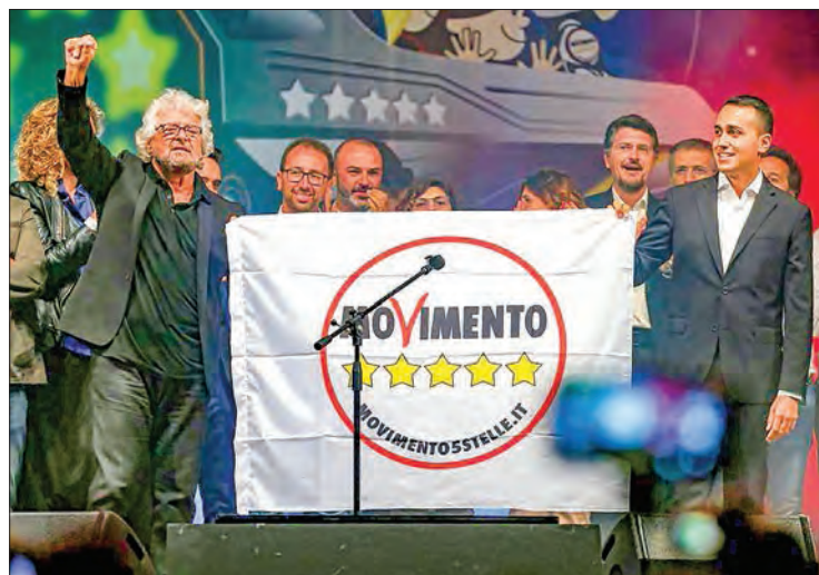
5-Star movement founder Beppe Grillo (L) and Luigi Di Maio hold the banner of the movement during a gathering in Rimini, Italy, on 23 September 2017.

Grillo, who has so far acted as 5-Star's de facto chief, is now