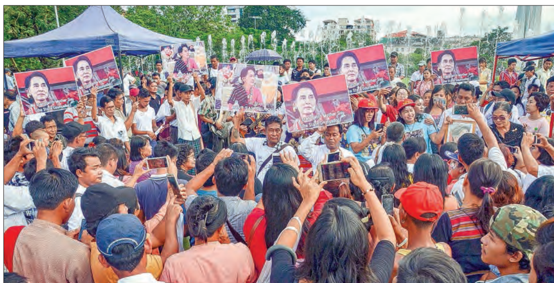
A large number of people showing the solidarity with State Counsellor Daw Aung San Suu Kyi in Yangon.