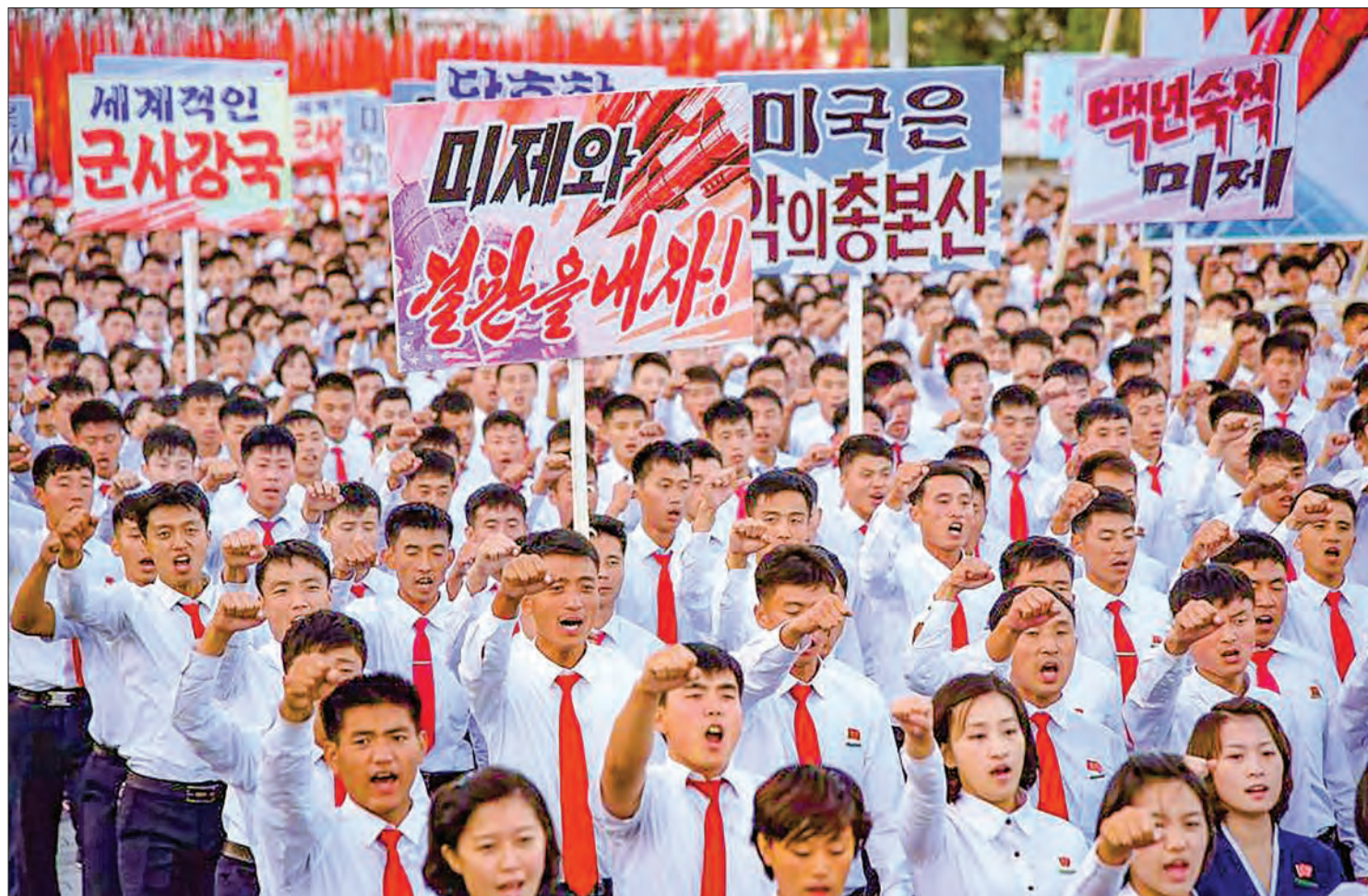
An anti-US rally at Kim Il Sung Square is seen in this 23 September 2017 photo released by North Korea's Korean Central News Agency (KCNA) in Pyongyang, on 24 September 2017.