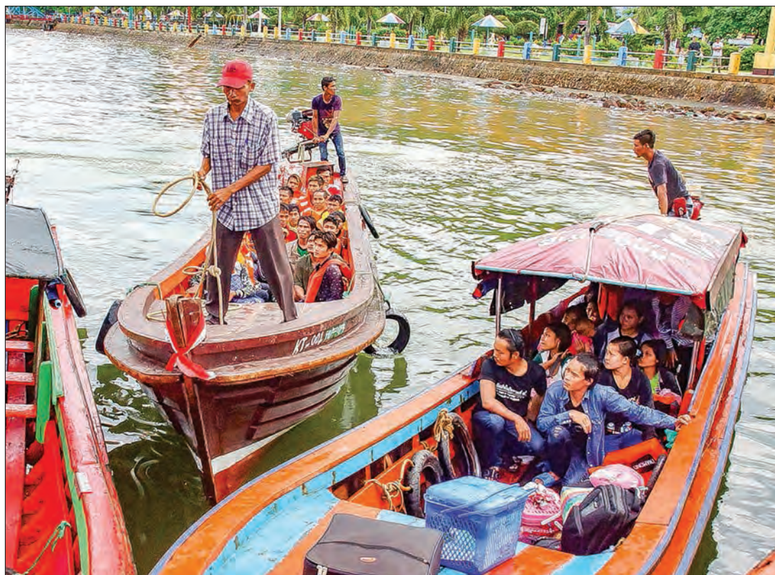
Myanmar migrant workers arriving back home from Thailand. PHOTO: KYAW SOE (KAWTHOUNG) ■

So far, total 2295 having no legal documents Myanmar migrant workers returned to Myanmar through Kawthoung Border Gate. —Kyaw Soe (Kawthoung) ■