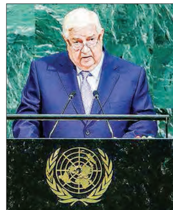
Deputy Prime Minister for Syrian Arab Republic Walid Al-Moualem addresses the 72 nd United Nations General Assembly at UN headquarters in New York, US, on 23 September 2017.

Moualem, who praised as constructive the role of Russia and Iran, which back Syrian President Bashar al-Assad, said Syria