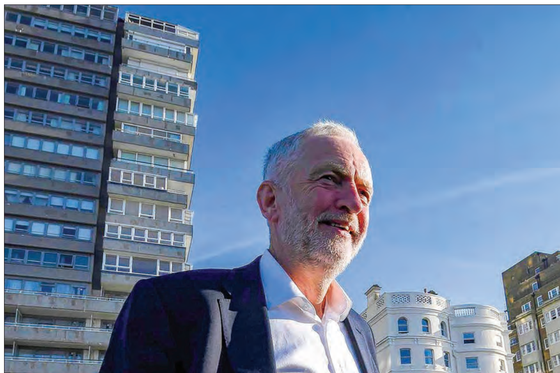
Britain's opposition Labour party leader Jeremy Corbyn arrives at a television studio to appear on the BBC Andrew Marr politics programme during the Labour party Conference in Brighton, Britain, on 24 September 2017.

"We have watched with dismay as the government has used a narrow referendum result to justify an extreme approach to