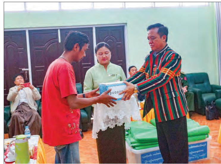
Chin State Chief Minister presents cash to a local.

The state chief minister and party then inspected the construction of Falam airport (Surbone) implemented by the Department of Civil Aviation. After explaining the working situation by officials, the state chief minister gave instruction to finish in time and carry out eradication of occupational hazard and fulfilled the needs.—State IPRD ■