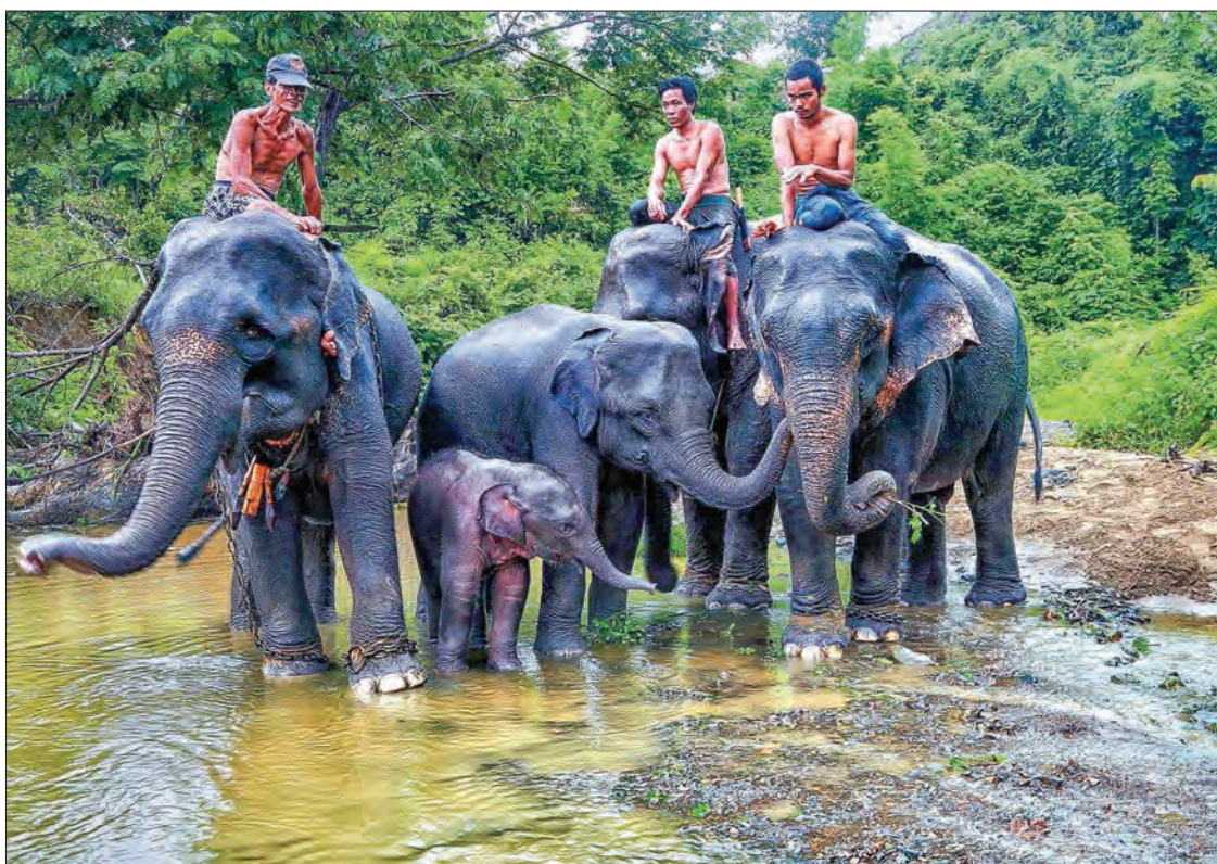
Mahouts seen cleaning elephants at the Wingabaw Elephant Camp near Yangon-Mandalay Highway.

Elephant bathing watch is also available between 7 a.m. and 8.30 p.m. daily. "We widely explain the natural characters and movements of the large mammal to the visitors while they visiting around the camp for observation purpose between 12 to 3 p.m. on a daily basis," said U Myint Soe.—GNLM ■