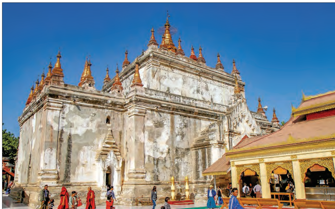
Manuha Temple in Bagan.

of ancient cave temple will take a long time. Nowadays, the Manuha Temple, which is located near Nagayon Temple,