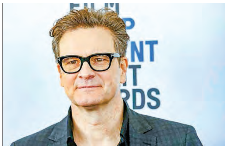
Actor Colin Firth arrives at the 2017 Film Independent Spirit Awards in Santa Monica, California, US, on 25 February, 2017.

"We never really thought much about our different pass-