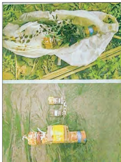
Photo shows pipe bomb defused by Security personnel.