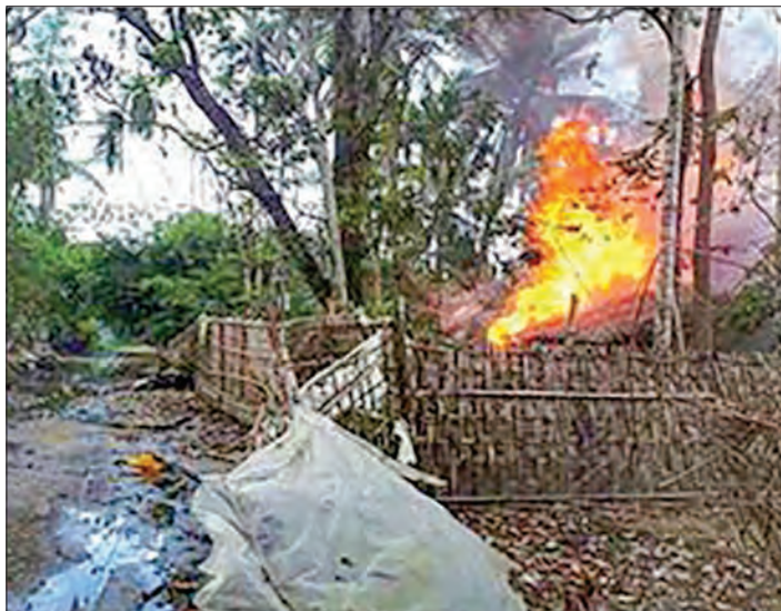
Abandoned houses on fire at a village in Maungdaw Township.

SECURITY forces while on their duty to ensure the rule of law in Tinmay village-tract searched an empty house of Abu Kalaung, 45, and its compound at Ward 2 of Tinmay village at 4:30 pm on 23 September. They were acting on information.