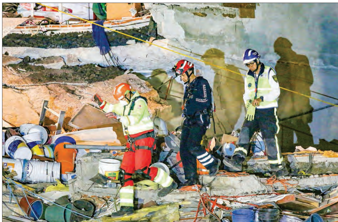
Members of rescue teams search for survivors in the rubble of a collapsed building after an earthquake in Mexico City, Mexico, on 24 September 2017.

Frustration has grown among the thousands left homeless by Tuesday's quake with critics saying the government reaction pales in comparison to an outpouring of volunteer support, from rescue work to food donations. When Tuesday's quake hit, Mexico was already reeling from a 7 September earthquake