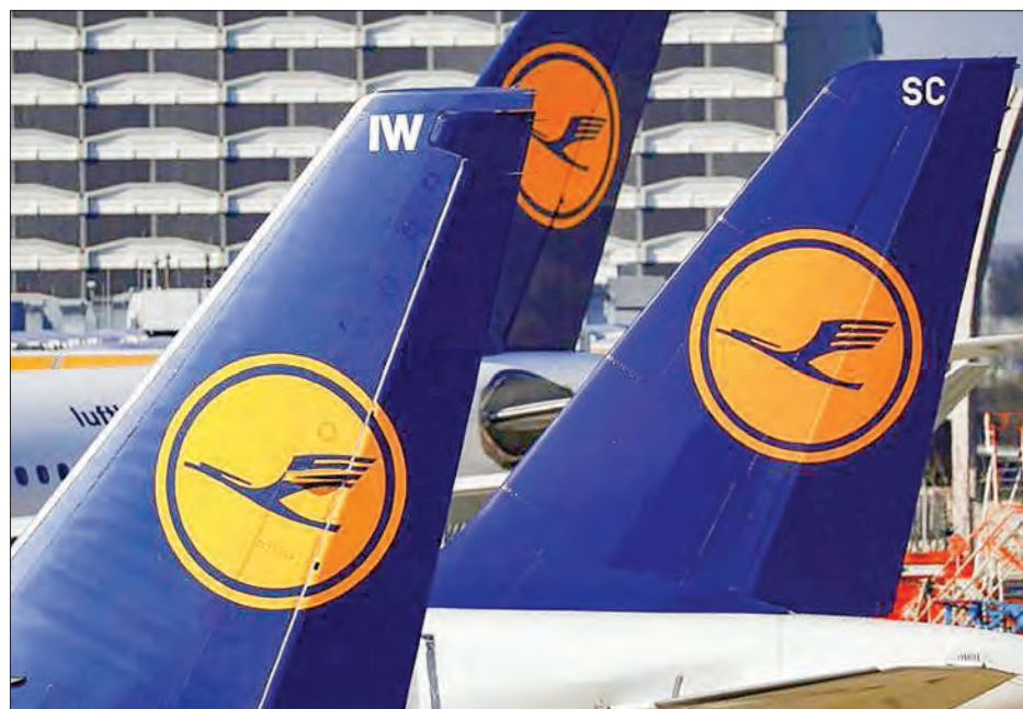
Planes of the Lufthansa airline stand on the tarmac in Frankfurt airport, Germany, in 2016.

Severe flooding, structural damage to homes and virtually no electric power were three of the most pressing problems facing Puerto Ricans, said New York Governor Andrew Cuomo during a tour of the island. "It's a terrible immediate situation that requires assistance from the federal government — not just financial assistance," said Cuomo, whose state is home to millions of people of Puerto Rican descent. "It is a dangerous situation today and it's going to be a long-term reconstruction issue for months," Cuomo, a Democrat and potential 2020 presidential candidate, told CNN. —Reuters ■