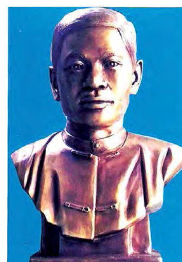
Bronze bust of Myanmar music researcher and conductor Sein Bo Tint.

The opening ceremony of the bronze bust will be held on 13 November (Myanmar National Day) with entertainment of Myanmar musical troupes from Yangon, Mandalay and Kyaiklat.—Tin Win Lay (Kyimindine) ■