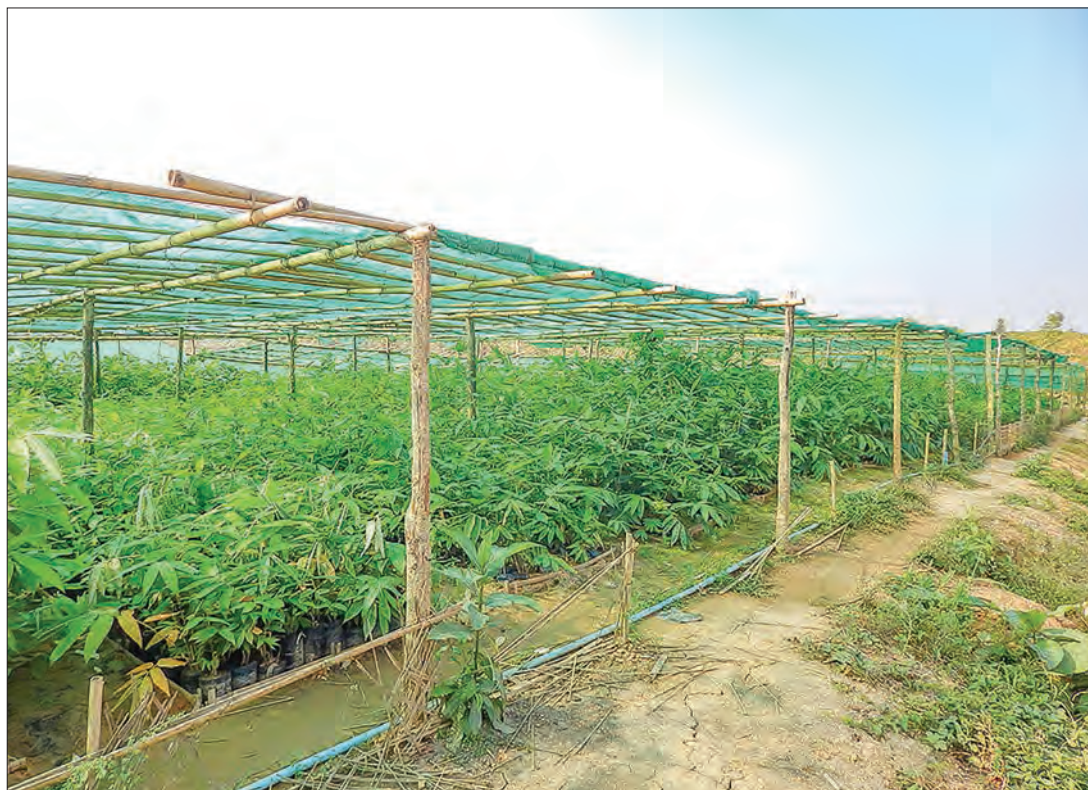
Bamboo plantation in the Hlaing Yoma Mountain reserve forest.