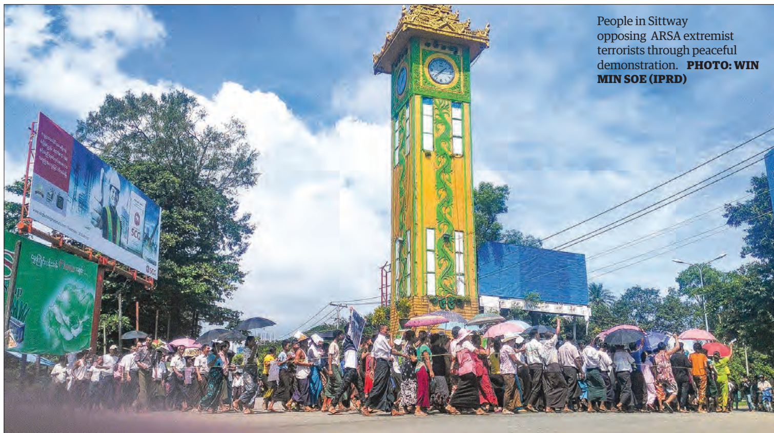
People in Sittway opposing ARSA extremist terrorists through peaceful demonstration.

Holding vinyl signboards and slogans condemning the terrorist activities, the demonstrators walked peacefully along Kyaung Tet street, U Uttama street, main road, clock tower circle, merchant street, Setyonesu street in Sittway and dispersed at 2:30 pm after arriving back to the starting place. ■