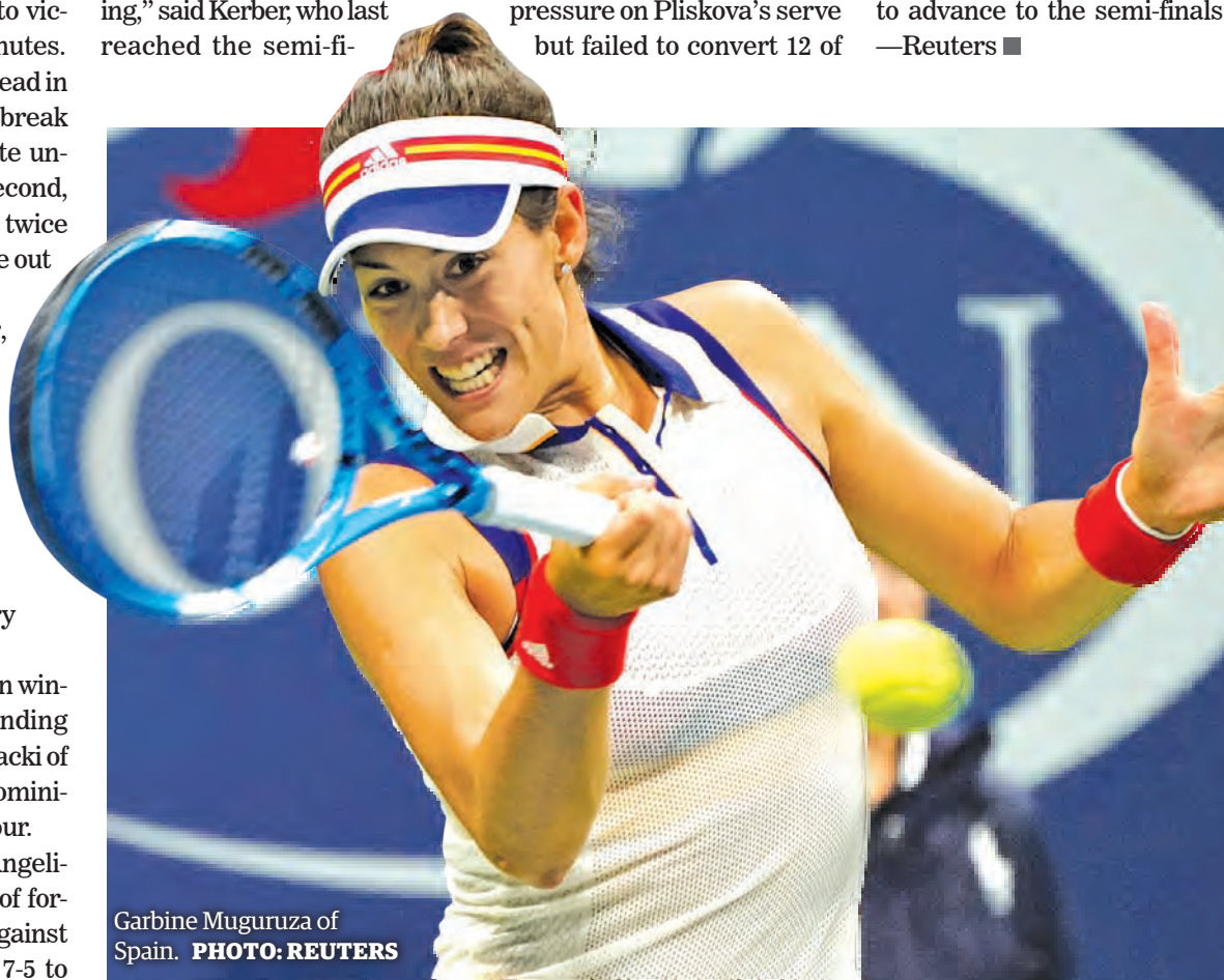
Garbine Muguruza of Spain.

Russian Pavlyuchenkova defeated another Czech player, Barbora Strycova, 5-7, 6-3, 6-1 to advance to the semi-finals. —Reuters ■