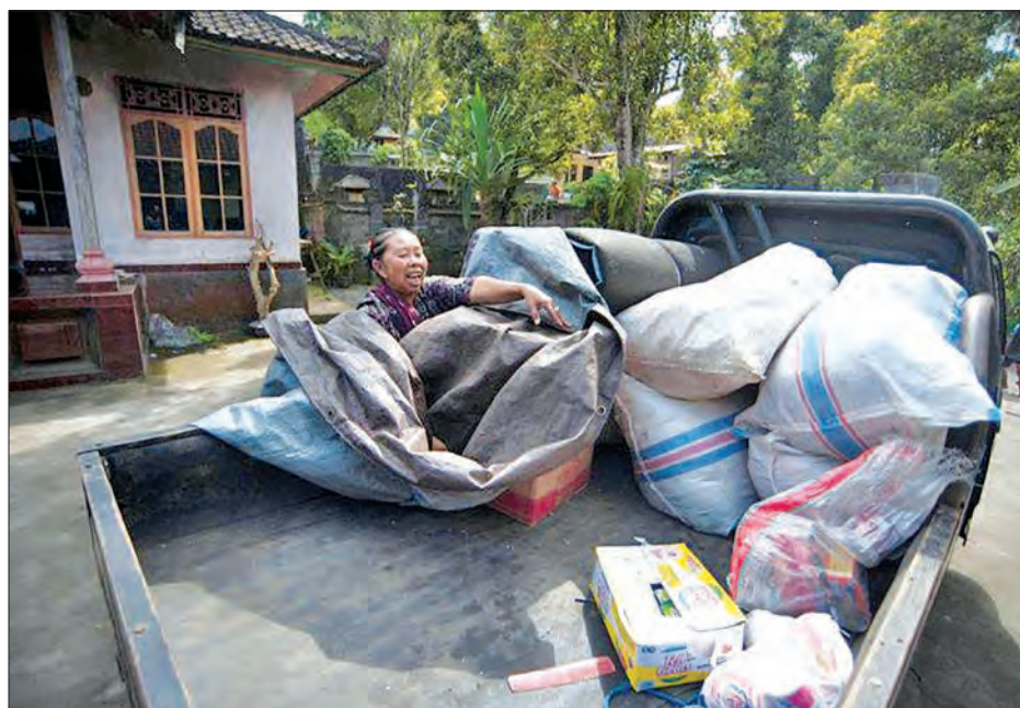
A resident packs up some belongings to evacuate from the village of Sebudi located on Mount Agung volcano following increased seismic activity in Karangasem on the resort island of Bali, Indonesia, on 20 September 2017 in this photo taken by Antara Foto. PHOTO: REUTERS

Indonesia straddles the "Pacific Ring of Fire", where several tectonic plates meet and cause 90 per cent of the world's seismic activity, according to the US Geological Survey.—Reuters ■