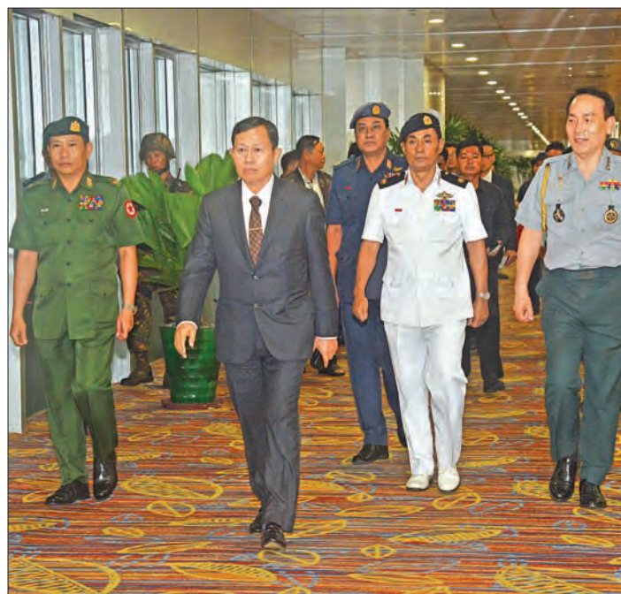
Vice-Senior General Soe Win is welcomed back by senior military personnel at Yangon International Airport.

Earlier in the day, Deputy Commander-in-Chief of