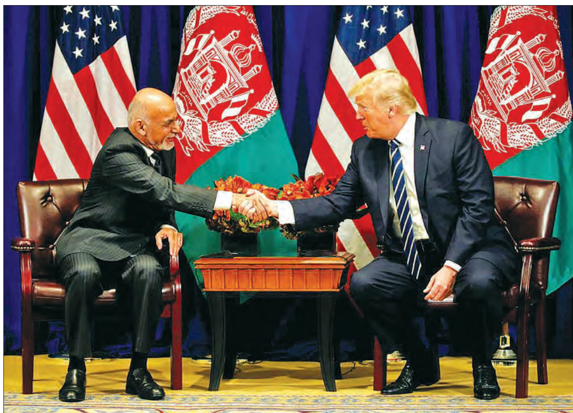
US President Donald Trump meets with Afghan President Ashraf Ghani during the UN General Assembly in New York, US, on 21 September 2017.