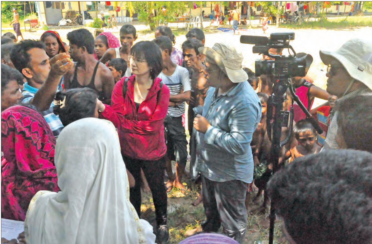
Chinese journalists interview Muslims in a conflict area in Maungtaw on 22 September 2017.