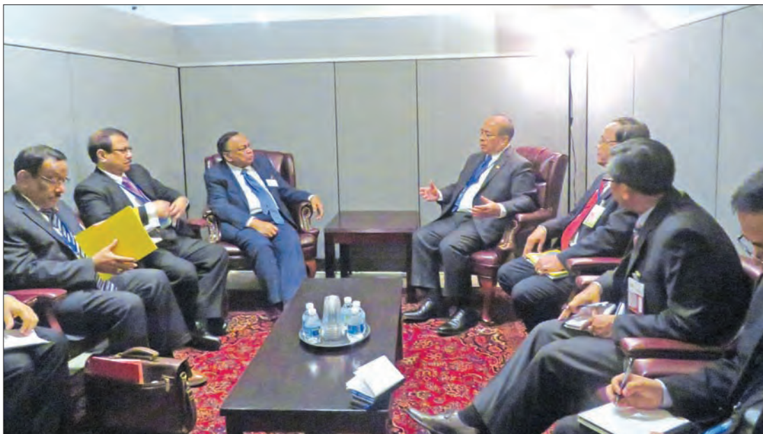
National Security Advisor U Thaung Tun and Foreign Minister of Bangladesh Mr. Abul Hassan Mahmud Ali hold talks in New York on 21 September 2017.