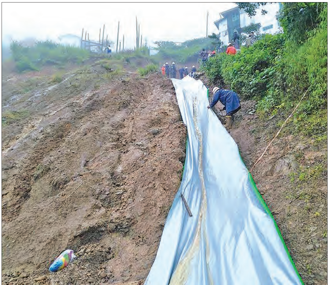
Authorities and volunteers clear the road damaged by the landslides in Chin State.

Traffic on the roads returned to normal after local authorities and volunteers cleared the road.—Chin State IPRD ■