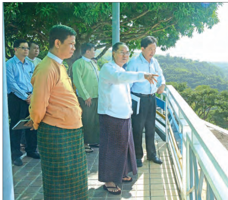
Vice President U Myint Swe inspects the Phyu Chaung Multi-Purpose Dam Project in Phyu, Bago Region on 22 September.

First, the Vice President observed the Phyu Chaung Dam from the dam view point. Next, he was briefed about the status of the Phyu Chaung Multi-Purpose Dam Project and the irrigation system which was under construction by the Irrigation and Water Utilization Manage-