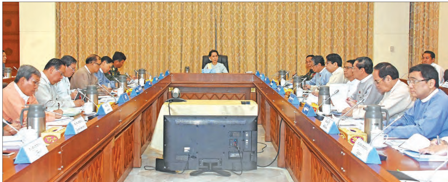
State Counsellor Daw Aung San Suu Kyi speaks to the members of Implementation Committee for the recommendations on Rakhine State at the meeting hall of the President Office in Nay Pyi Taw on 22 September 2017.

• To seek advice of UN-HABITAT so as to include sustainable development aspects in the resettlement programmes for the affected community. This will