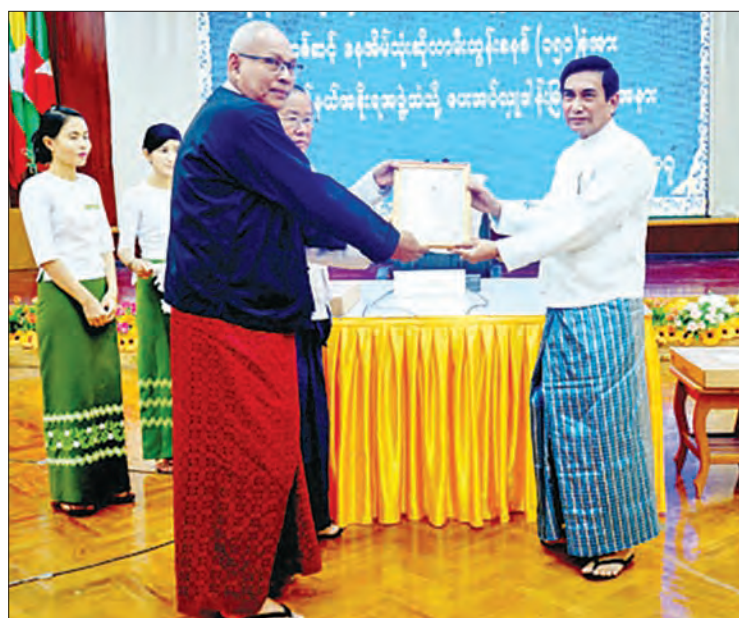
Officials accept the certificate of honour for the donation of 150 sets of solar lights.

tor and technical expert, demonstrated how to install and use the solar-energy panels.