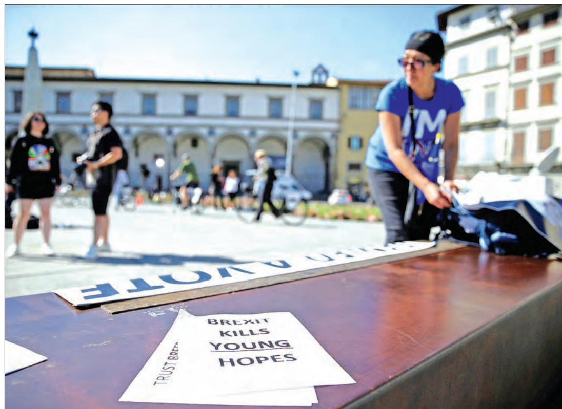
Demonstrators' banners rest on a bench ahead of a speech by Britain's Prime Minister Theresa May in Florence, Italy, on 22 September 2017.

Negotiations, which began three months ago, have effectively reached an impasse over the divorce, including the issue