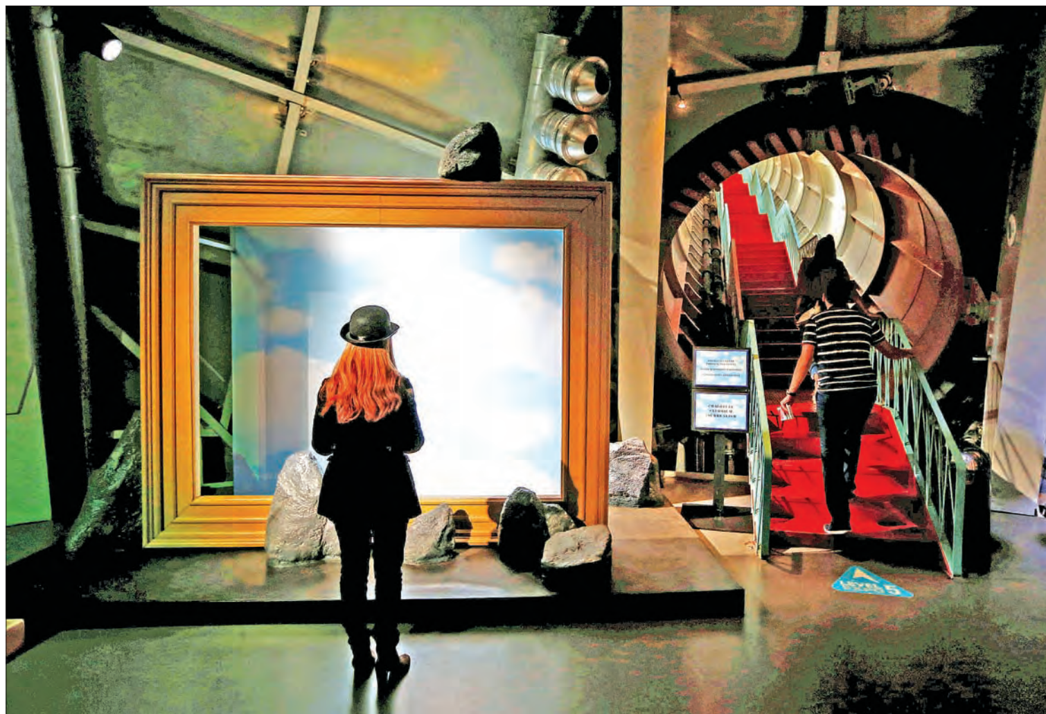
An official poses during the opening of the exhibition on Belgian surrealist painter Rene Magritte at Brussels' Atomium building, Belgium, on 21 September 2017.

In winter months, scant snowfall means the summit approach can turn into bare ice.—Reuters ■