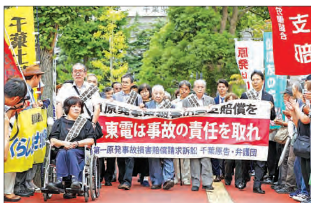
Evacuees of the Fukushima Daiichi nuclear disaster and their lawyers head to the Chiba District Court, near Tokyo, on 22 September 2017, to hear the ruling on a lawsuit under which they are demanding that the state and Tokyo Electric Power Company Holdings Inc. pay a total of 2.8 billion yen in damages.

The Chiba court awarded a total of 376 million yen ($3.35 million) to 42 of them, including all four who voluntarily evacuated. In the suit filed in March 2013, the plaintiffs were collectively seeking