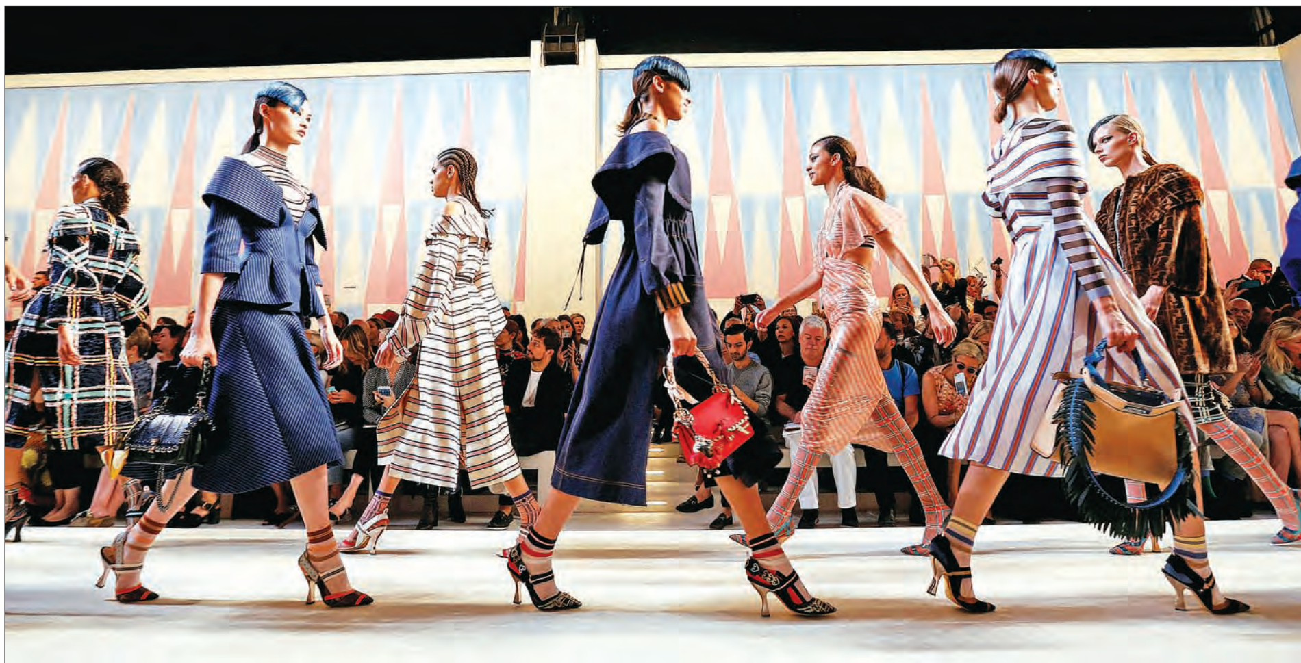
Models parade at the end of the Fendi Spring/Summer 2018 show during the Milan Fashion Week in Milan, Italy, on 21 September 2017.