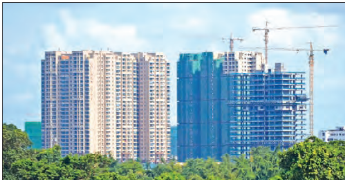
The condominiums are under construction in Yangon on 13 September 2017.

A condominium offers safe and sound living, with security staff, a 24-hour electrical supply and sufficient water supply. There can also be leisure facilities such as mini-cinemas, playgrounds, swimming pools and restaurants.