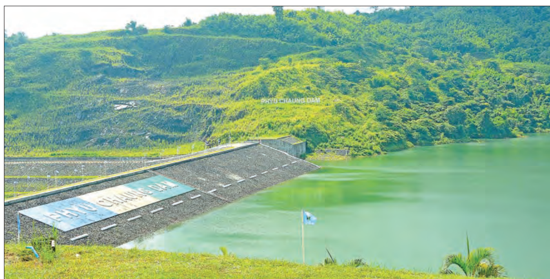
Phyu Chaung Muli-Purpose Dam in Phyu Township, Bago Region.