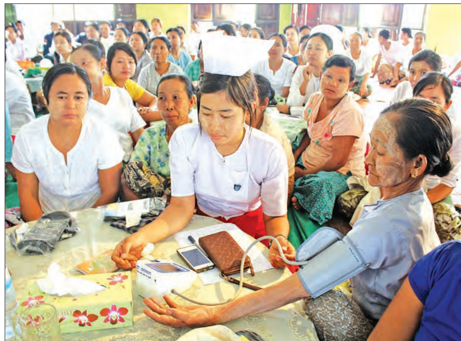
A nurse checks blood pressure of a patient at a rural clinic in Nay Pyi Taw.