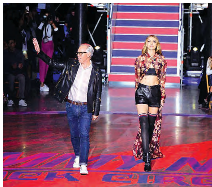
Tommy Hilfiger and model Gigi Hadid thank guests at the end of the Tommy Hilfiger Spring/Summer 2018 show at London Fashion Week, in London, Britain on 19 September, 2017.

Their participation gave the event a boost, as Britain's fashion industry — which experts say contributes £28 billion ($37 billion) to the country's economy — faces uncertainty as the UK negotiates its exit from the European Union. —Reuters ■