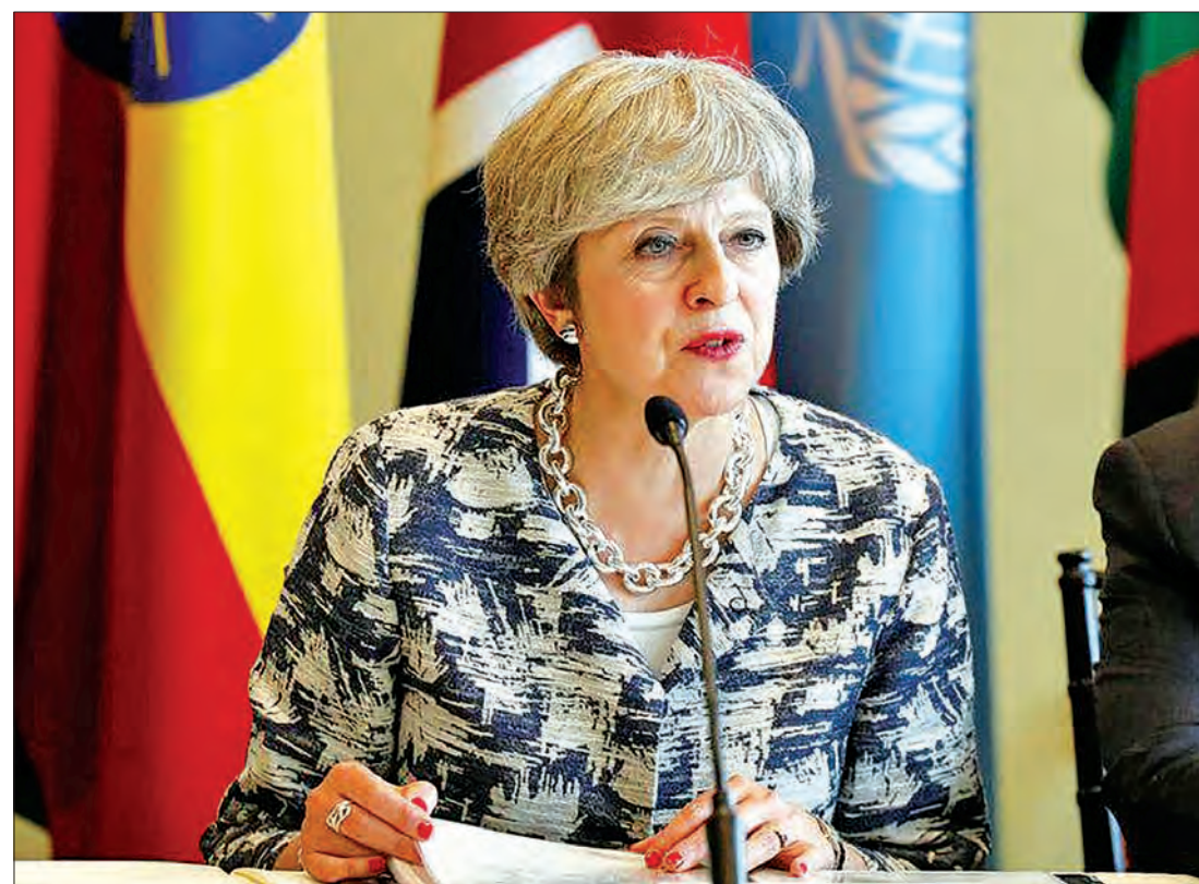
British Prime Minister Theresa May speaks during a meeting on action to end modern slavery and human trafficking on the sidelines of the 72 nd United Nations General Assembly at UN Headquarters in Manhattan, New York, US on 19 September, 2017.

The British UN mission said May will welcome progress, but urge companies