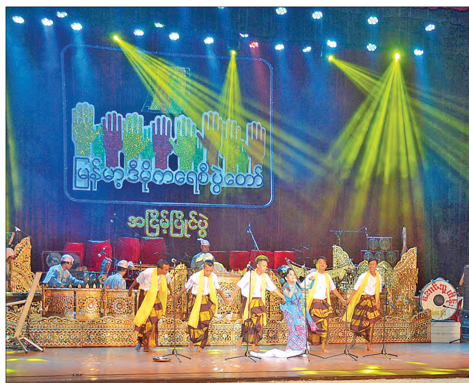
Troupes are competing with their Anyeint songs at the final Anyeint contest of Myanmar Democracy Festival at National Theater in Yangon.