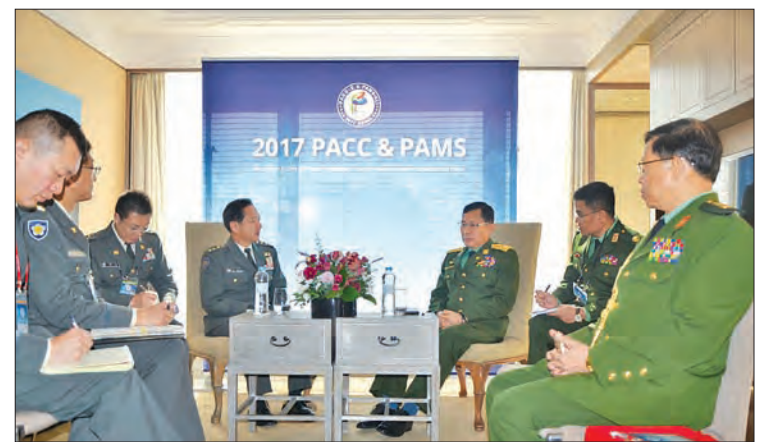
Vice-Senior General Soe Win holds talks with General Koji Yamazaki.

In the meeting, Vice-Senior General Soe Win spoke of the friendship and military cooperation between the two armies, the Tatmadaw’s participation in Myanmar’s democratic transition