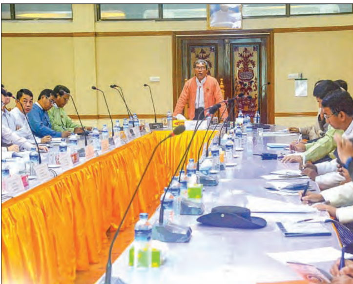
Chief Minister of Rakhine State U Nyi Pu delivers the address at the coordination meeting for suggestions on Rakhine Issue.

"The Implementation Committee is required to implement on the ground situation. We have already seen and listened to feelings and sufferings they had faced. As we have concluded these situations in general, it is necessary to prioritise resettlement including rehabilitation of the national people. Had the findings been implemented generally, the tasks of the committee could have been accomplished successfully. Committee members need to submit the findings of the trips collectively," said the Chief Minister of Rakhine State