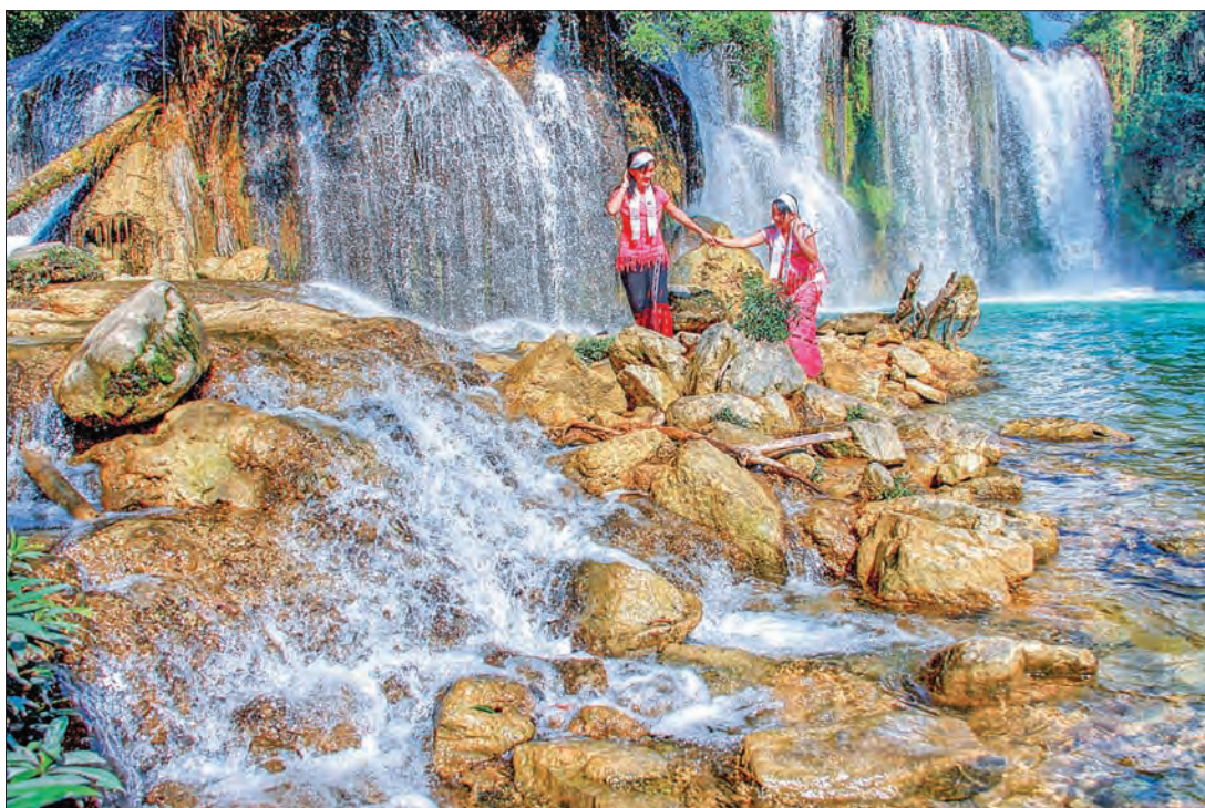
One of the most precious geographical treasures of Myanmar, Kyone Hta Waterfall, consists of emerald waters and rocks in Kayin State.

Due to limitation of space we are only able to publish "Letter to the Editor" that do not exceed 500 words. Should you submit a text longer than 500 words please be aware that your letter will be edited.