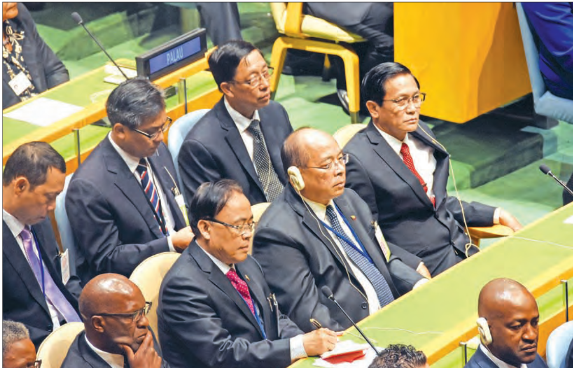
Myanmar delegation led by Vice President U Henry Van Thio attends 72 nd session of UN General Assembly in New York, US.