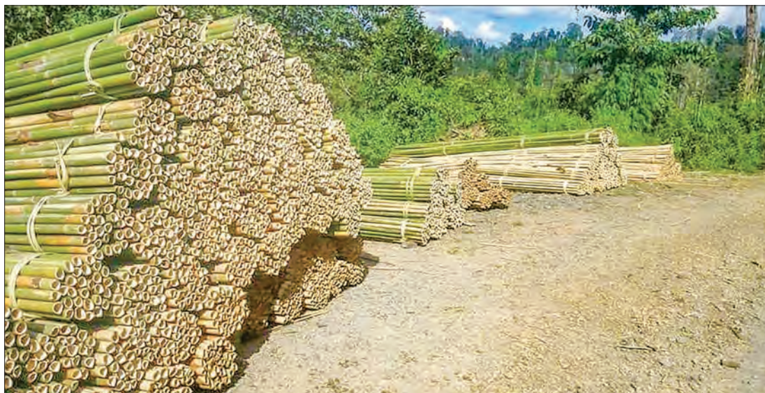
Bamboo binds are sorted beside the road for sale in Mawlamyinyun Township.