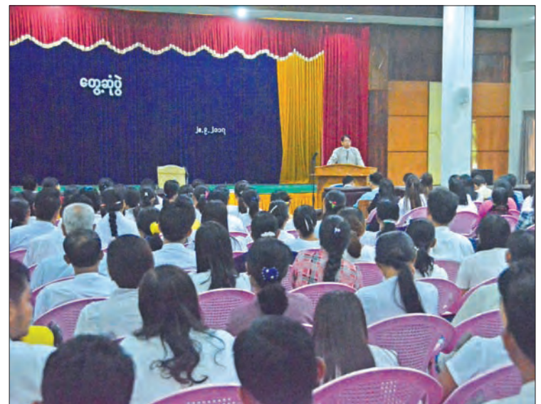
Union Minister Dr Pe Myint meeting with staff from the two state-run dailies and Printing and Publishing Department.

Discussions are under way as to whether it will stand as public-orientated media or it will stand as a government media. The present meeting is designed