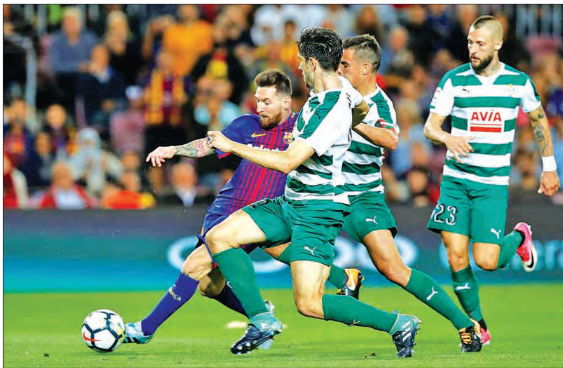
Barcelona's Lionel Messi scores their fifth goal to complete his hat-trick at Camp Nou in Barcelona, Spain on 19 September, 2017.

“Game by game he surprises us, there are no words for him,” said the Portuguese right back, who won the penalty which Messi converted for his first goal of the night in the 21 st minute.