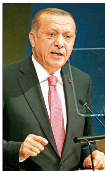
Turkish President Recep Tayyip Erdogan.