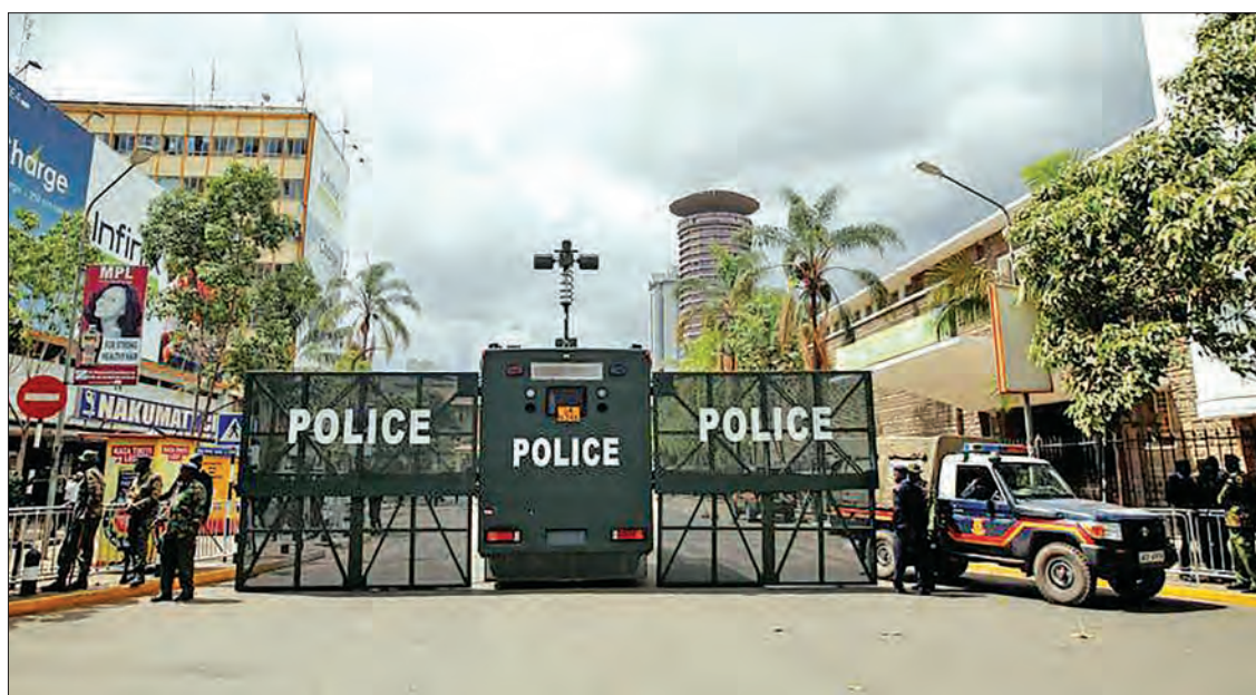
Police seal off roads near Kenya's Supreme Court in Nairobi, Kenya on 20 September, 2017.

Kenya used two parallel systems: a quick electronic tally vulnerable to typos and a slower paper system designed as a verifiable, definitive back-up. The official results were based on the electronic tally before the paper results were fully collated, the judges said.