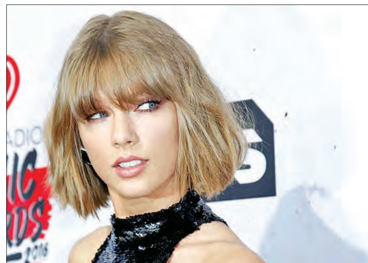
Singer Taylor Swift.