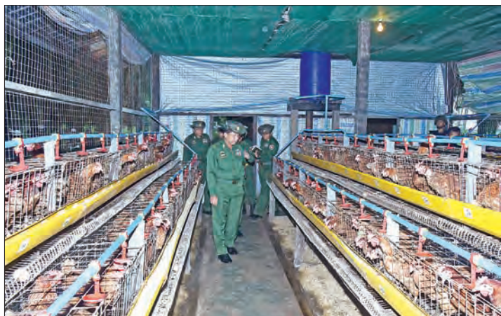
Senior General Min Aung Hlaing visits Multi-Agricultural and Poultry Farming.

Yesterday’s meeting was attended by government representatives, members of JMC-U, representatives from ethnic armed groups of NCA signatories and civilian representatives. ■