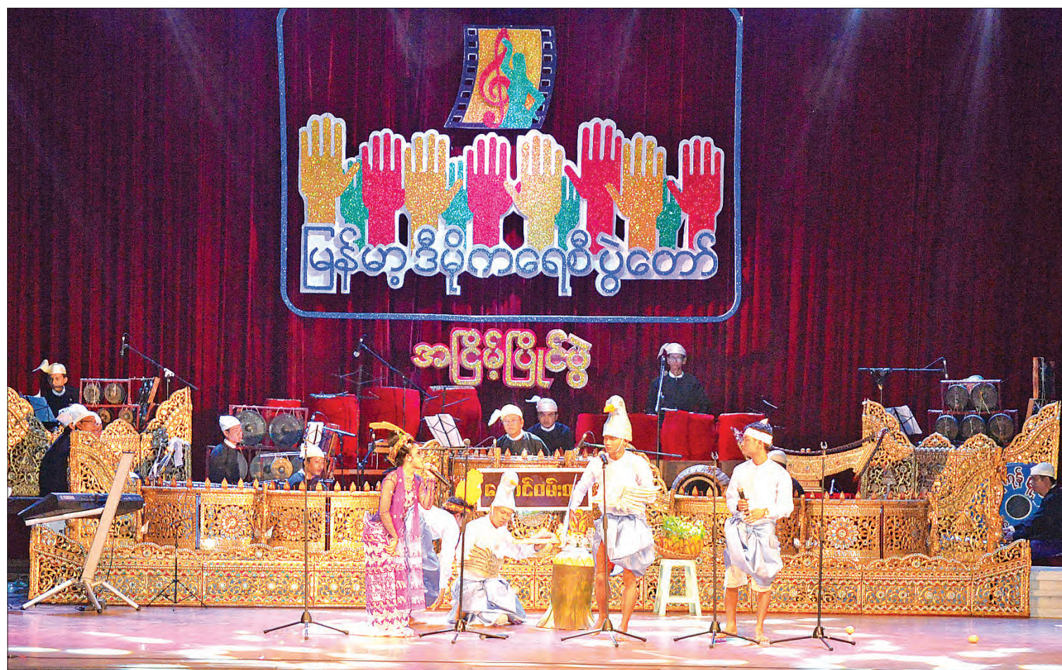
The final Anyeint contest of Myanmar Democracy Festival is performed at National Theater in Yangon on 20 and 21 September.

"The democracy songs and the jokes reflected the current