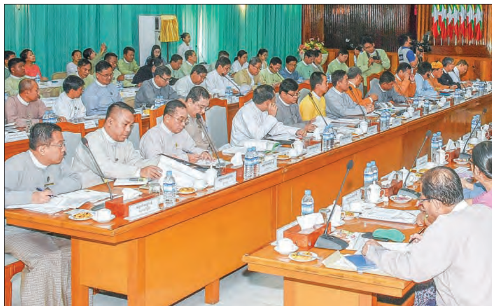
Vice President U Myint Swe addresses the National-Level Environmental Conservation and Climate Change Central Committee in Nay Pyi Taw.

The decisions mainly include drawing up a policy on climate change impacts in My-