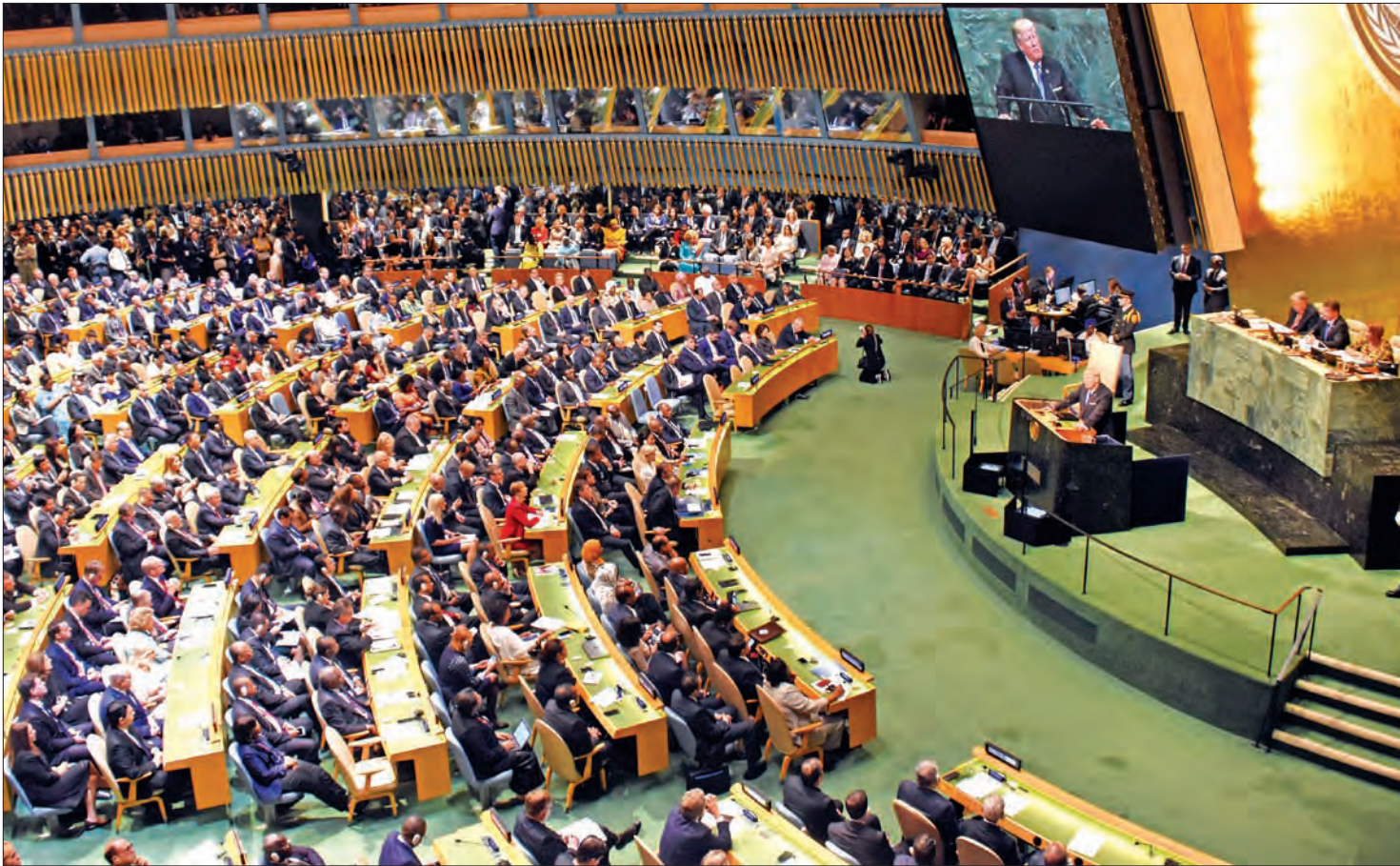
Donald Trump addresses the 72nd United Nations General Assembly at UN Headquarters in New York City yesterday.