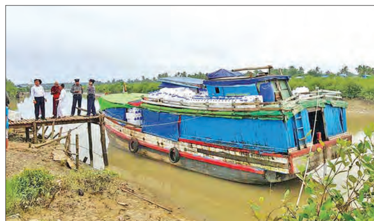
Local authorities arrive at the boat loaded with aid as they arrange for negotiation with the crowd.

However, people gathered to see the situation reaching the number about 300 at 8 pm and some threw stones and Molotov at the riot police. About 200 police used 20 12-bolt greeners and water cannons to disperse the crowd. Some people from the crowd threw homemade arrows, locally called 'Jingali' with the use catapults. Currently, security forces are stationed in Sittway providing security to local people and the situation under control.— Myanmar News Agency ■