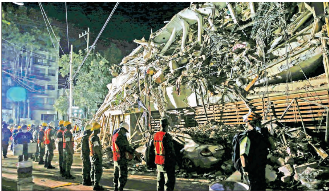
Rescuers work at the site of a collapsed building after an earthquake in Mexico City, Mexico on 20 September, 2017.

"Relatives of Fatima Navarro," one soldier shouted through cupped hands at the school the Coapa district in the south of the city. "Fatima is alive!" The earthquake toppled dozens of buildings, broke gas mains and sparked fires across the city and other towns in central Mexico. Falling rubble and billboards crushed cars. Parts of colonial-era churches crumbled in the state of Puebla, to the south of the capital, where the US Geological Survey (USGS) located the