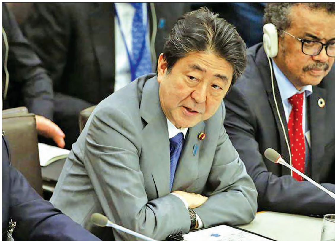
Japanese Prime Minister Shinzo Abe attends the World Leaders for Universal Health Coverage event held at UN headquarters in New York, US on 18 September, 2017.

But with massive government bond purchases by the central bank under its yield curve control policy, the bond market has already lost its price-setting mechanism that should serve as warning against weakening of