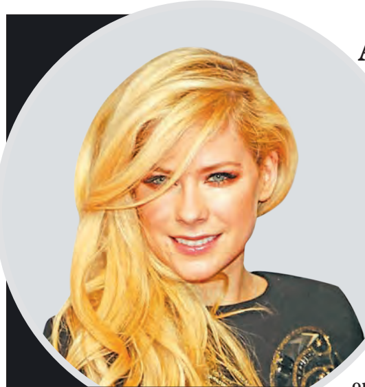
Singer Avril Lavigne.