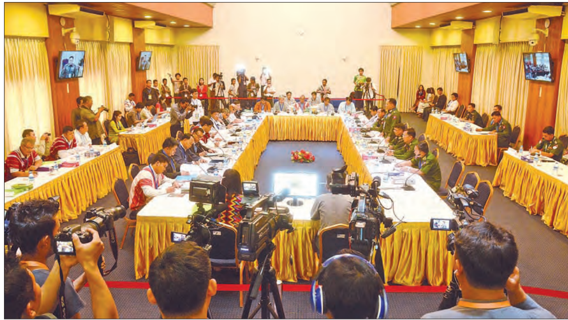
Peace makers participate in the 12th regular meeting of JMC-U.

of the JMC-U is being held for three days from 20-22 September. In the meeting, the discussion regarding organising local civilian monitors, holding workshops for the placement of the armed groups in order to avoid engagement, acquiring policy to review the SoP and ToR which