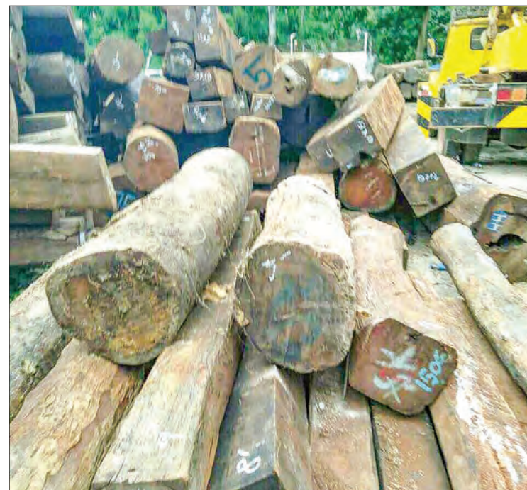
Illegal timber seized in Yaypu and Mayanchaung checkpoints.

On 17 September, the authorities confiscated various species of illegal woods worth about Ks 77.212 million at Yaypu Check-point in two cases, various species of illegal woods worth about Ks 24.612 million at Mayanchaung permanent inspection gate in eight cases totalling worth about Ks 101.824 million.—001 ■