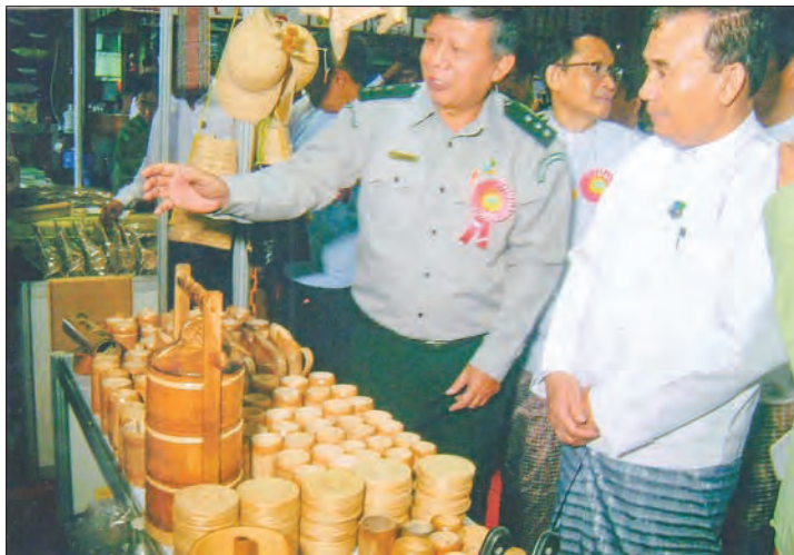
Union Minister U Ohn Win views handmade bamboo utensils at World Bamboo Day event.

A similar World Bamboo Day event was held in Forest Department, Ministry of Natural Resources and Environmental Conservation, Nay Pyi Taw where papers titled "Bamboo resources and sustainable de-