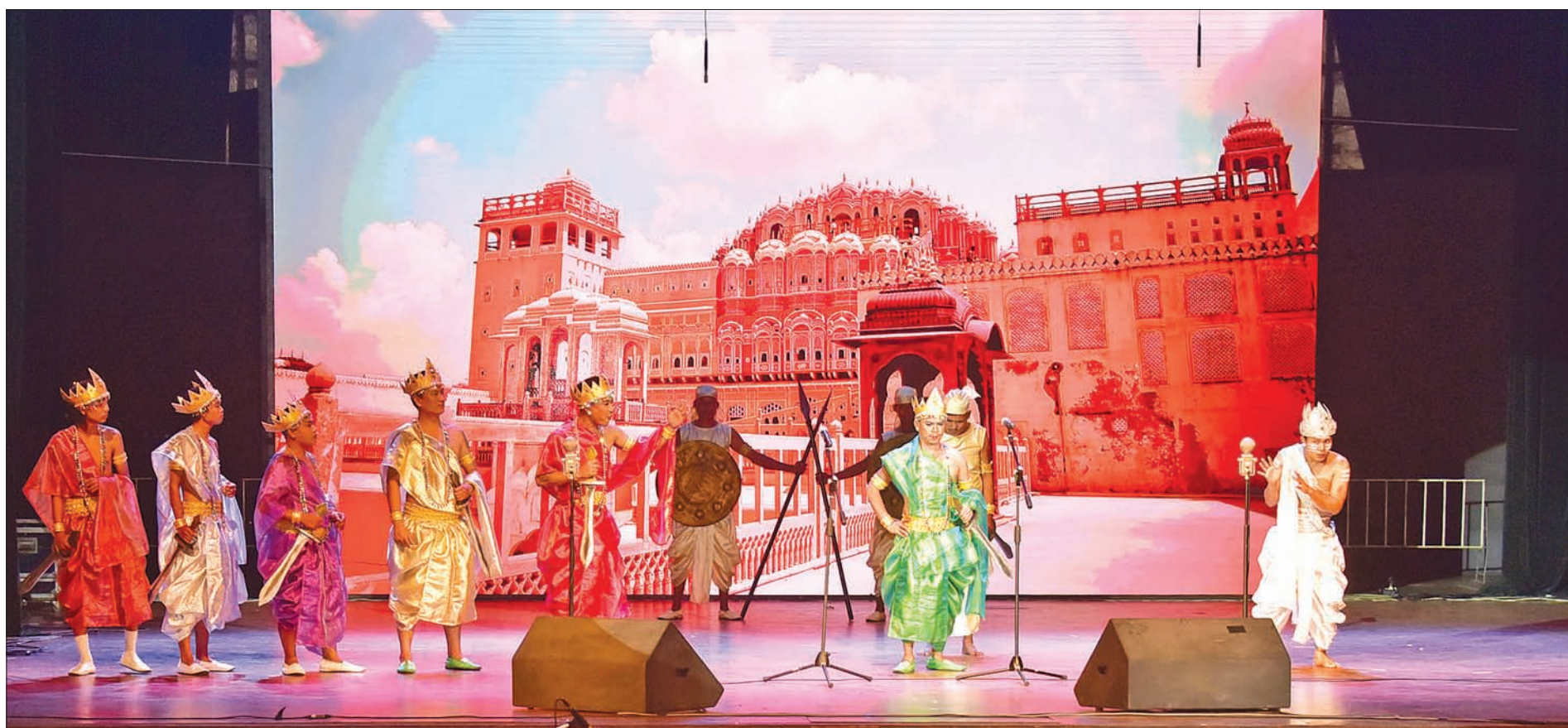
Artistees perform in honour of Myanmar Democracy Festival at the National Theatre on Myoma Kyaung Street, Yangon on Monday.