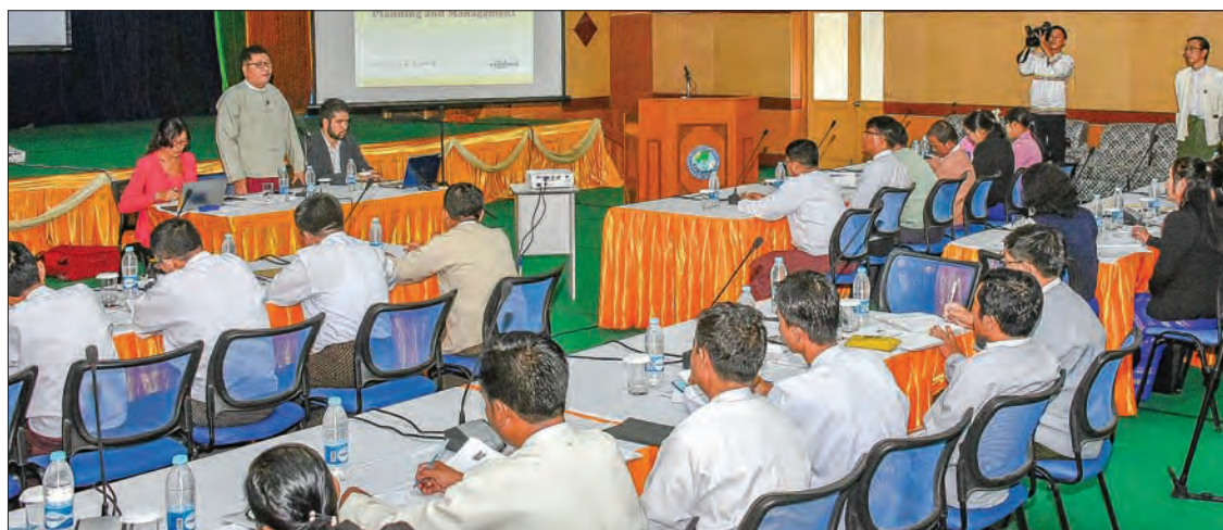
Ministry of Information and Friedrich-Ebert-Stiftung jointly workshop held in progress.

The workshop was attended by 30 officials from departments and enterprises under Ministry of Information and the workshop will be held until 19 September it is learnt. — Myanmar News Agency ■