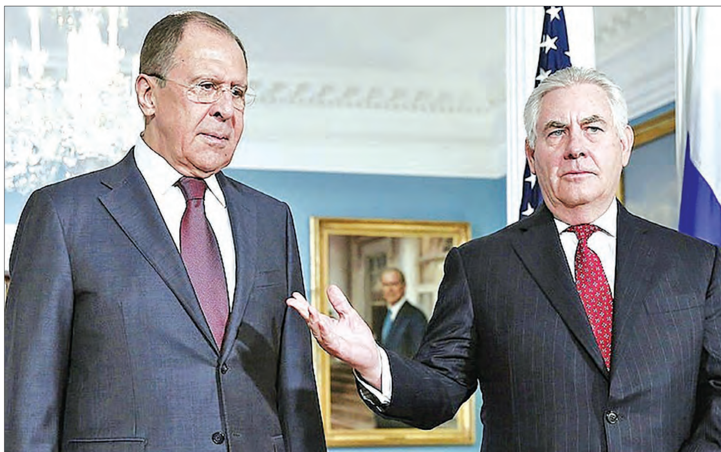
Russian Foreign Minister Sergey Lavrov and US Secretary of State Rex Tillerson.