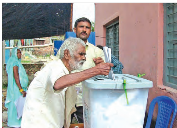
A man casts his vote into a ballot box during the final round of local election of municipalities and villages representatives in Janakpur on 18 September, 2017.

Significantly, the Ras-triya Janata Party Nepal, formed in April following the merger of six Madhesi political parties that have rejected the nation's new Constitution adopted in September 2015, is participating for the first time in elections held un-