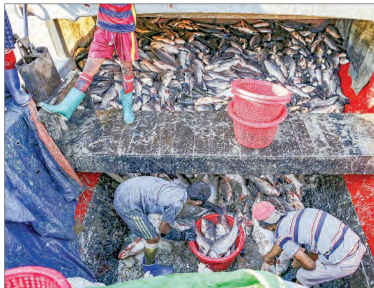
Workers unload fish from a boat at San Pya fish market in Yangon.

Myanmar fisheries enterprise will provide assistance in cooperation with small and medium fish breeding enterprises and rice producers in conducting the research with an aim to start a family managed mixed fisheries and paddy farming and upgrade to commercial scale businesses. Moreover, the fisheries research will be conducted to be able to submit a suggestion for the development of the small-scale fishery business and the weakness of the fishery management law to the government.—GNLM ■