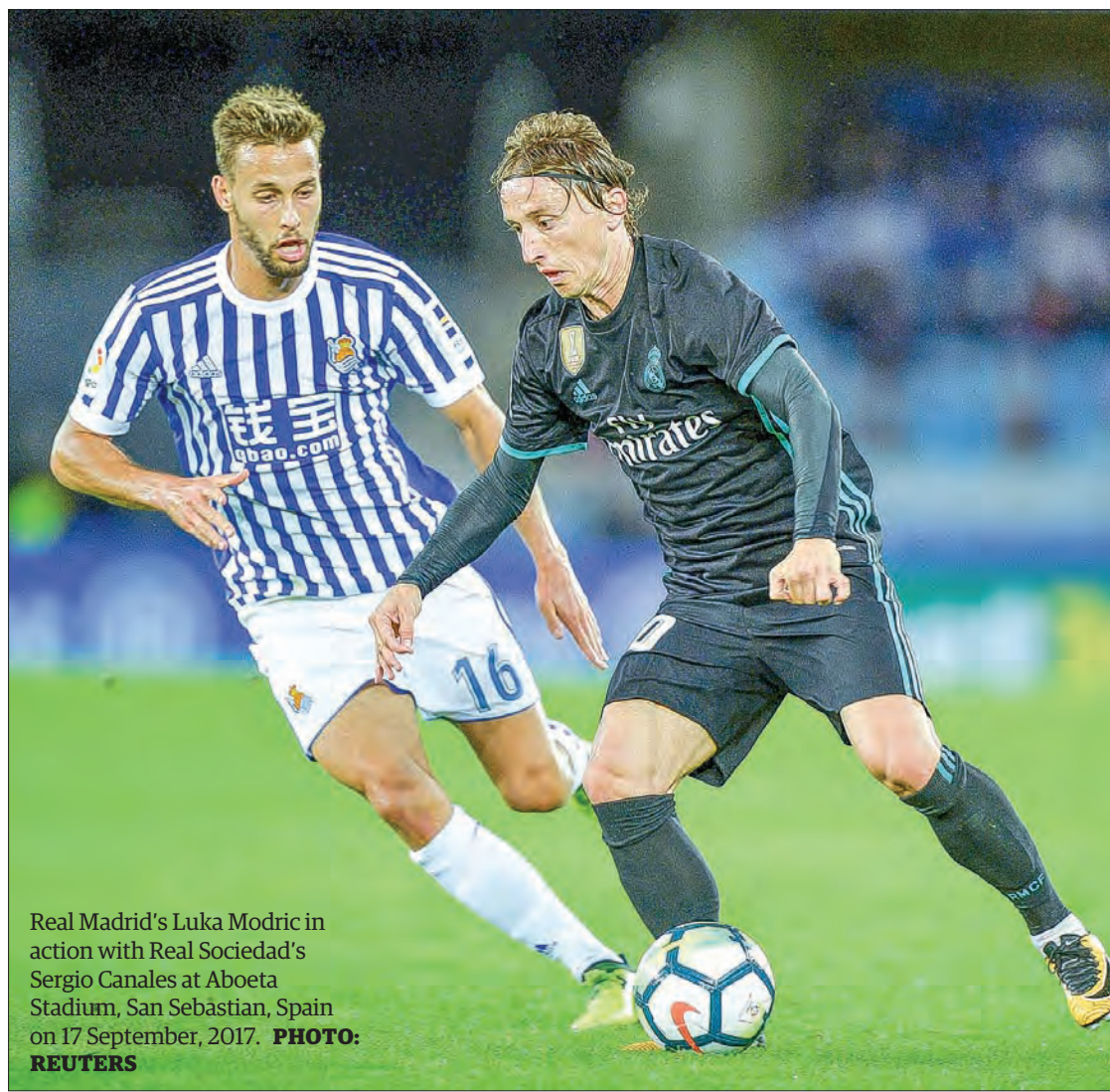
Real Madrid's Luka Modric in action with Real Sociedad's Sergio Canales at Anoeta Stadium, San Sebastian, Spain on 17 September, 2017.

Real Sociedad are third, on nine points, one ahead of Madrid and one behind Sevilla, who beat Girona 1-0 away to move second.—Reuters ■