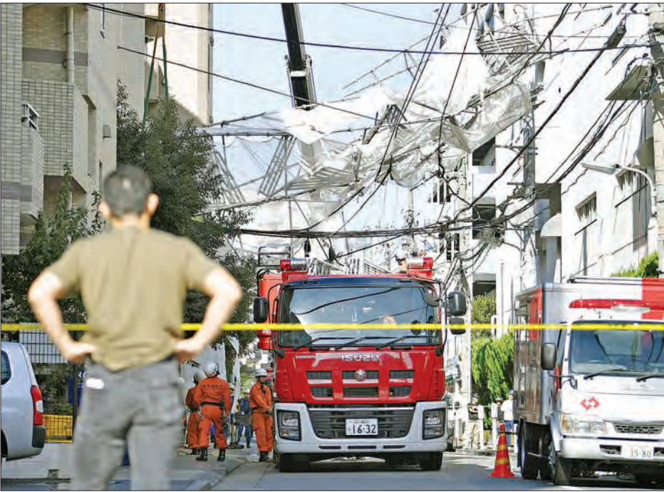
Scaffolding is seen collapsed in Tokyo's Shinagawa Ward on 18 September, 2017, due to strong winds brought by Typhoon Talim.

TOKYO — A large typhoon made landfall on Japan's northernmost main island of Hokkaido on Monday after heavy rain and a mudslide killed two people on the western main island of Shikoku the previous day. Three men, meanwhile, are missing in Kochi and Oita prefectures in western Japan after Typhoon Talim swept across and caused flooding in rivers. It landed on Hokkaido just after 10 am after passing over the Sea of Japan, the Japan Meteorological Agency said. The weather agency is warning of heavy rain and stormy winds even in areas far from the center of the typhoon, as areas affected by strong winds widen when it approaches an extratropical depression. As of 11 am, the typhoon was moving at a speed of 65 kilometres per hour around 120 km south-southwest of Sapporo, Hokkaido. With an atmospheric pressure of