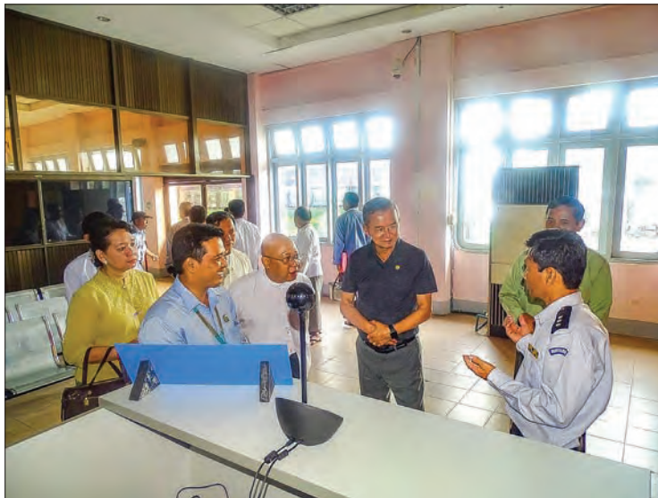
Union Minister for Hotels and Tourism U Ohn Maung and party visit Bagan Information Centre on 16 September.

On 17 September, the delegation arrived Bagan-NyaungU airport and inspected Customs, Immigration and Quarantine