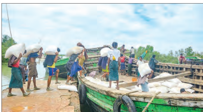
Workers load sacks of rice into a boat at Maungtaw Border Trade Station in August.

Due to the stoppage of border trade, banks, departments and some shops were operating, regional income dropped remarkably. Respective officials are making arrangements to reopen Kanyinchaung border trade zone being built as Maungtaw border trade zone, as soon as possible, they still find it difficult under the current situations. ■