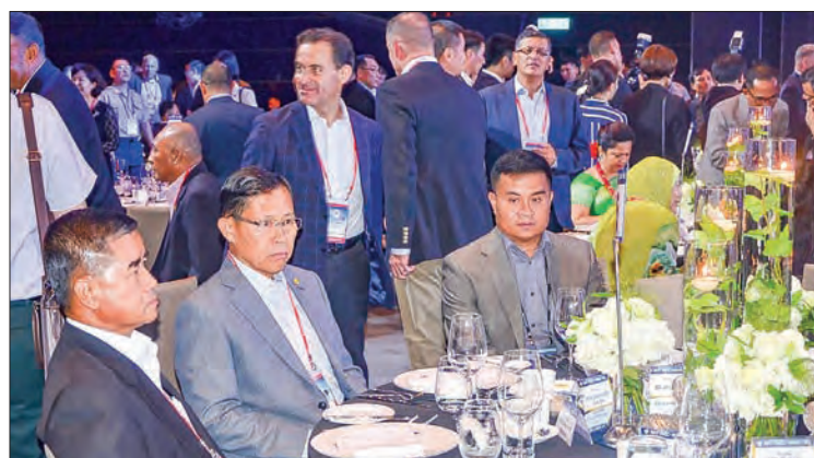
Vice Senior General attends the welcoming party at Grand Ballroom in Grand Hyatt in the evening