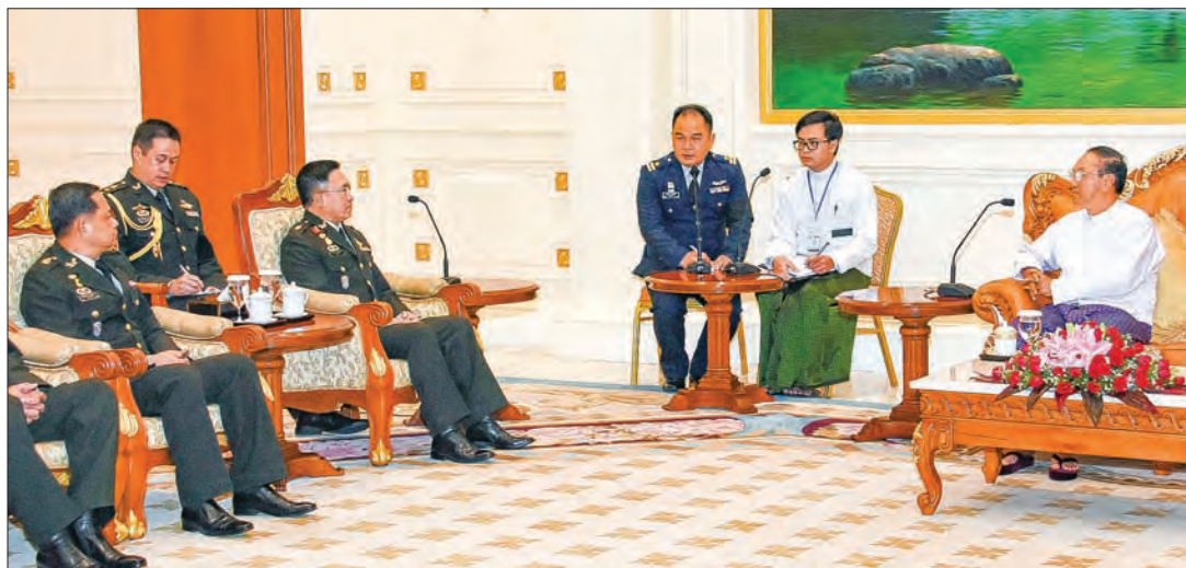
Chief of Defence Forces of Royal Thai Armed Forces General Surapong Suwana-adth calls on Vice President U Myint Swe in Nay Pyi Taw.