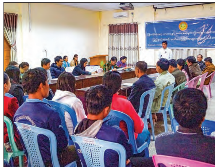
State Minister for Social Affairs U Paung Loon Min Htan delivers speech at the state level coordination and information meeting on MMFC.

According to State Department of Public Health, MMFC Survey will be conducted in 30 wards and villages in districts and townships of Chin States it is learnt. —State IPRD ■