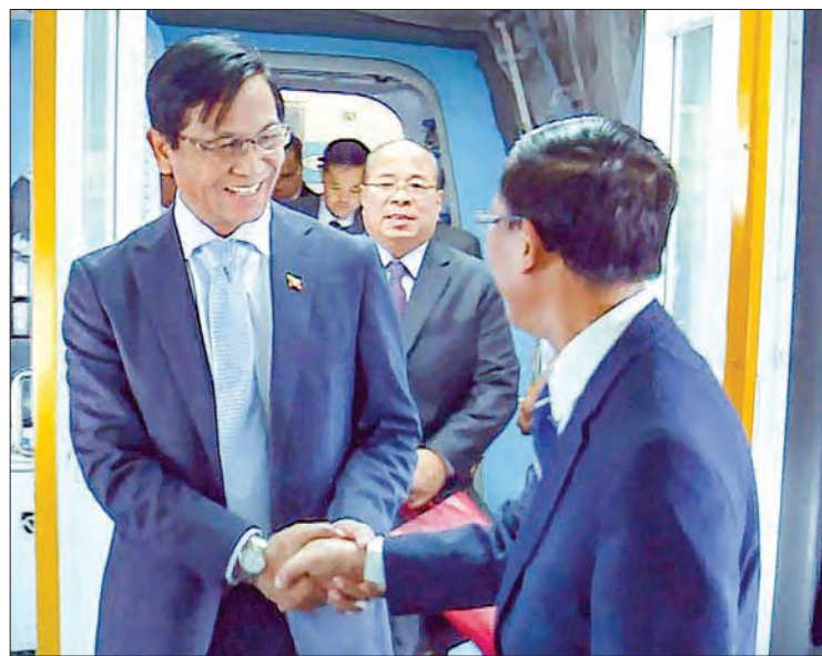
Vice President U Henry Van Thio welcomed at John F Kennedy International Airport in New York.

STATE Counsellor Daw Aung San Suu Kyi is delivering a speech in Myanmar International Convention Center 2 at 10 a.m. 19 September on Government's efforts with regard to National Reconciliation and Peace. The event will be broadcasted live in MRTV, MITV, Myanma Radio and FM radio programmes starting from 9:55 a.m. it is learnt.—Myanmar News Agency