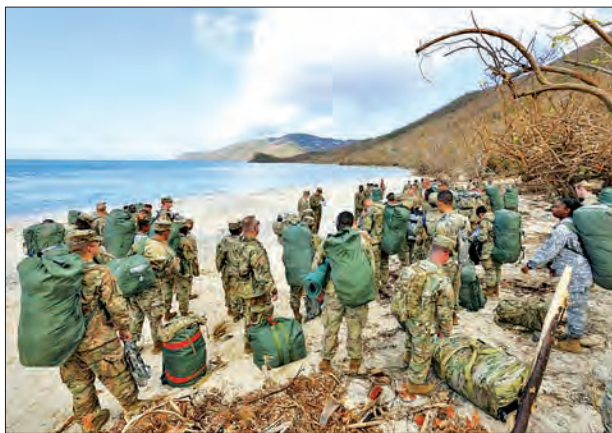
Army soldiers from the 602nd Area Support Medical Company gather on a beach as they await transport on a Navy landing craft while evacuating in advance of Hurricane Maria, in Charlotte Amalie, St Thomas, US Virgin Islands on 17 September, 2017.

Maria is approaching the eastern Caribbean less than two weeks after Irma hammered the region be-