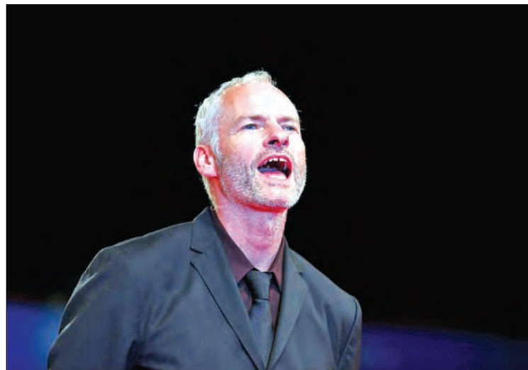
Rolling Stone / 50 Years special exhibition at Rock and Roll Hall of Fame and Museum in Cleveland, Ohio on 30 August, 2017.

NEW YORK — Rolling Stone, the iconic 50-year-old magazine of music and counterculture, is putting itself up for sale amid an increasingly uncertain outlook, its founder said.