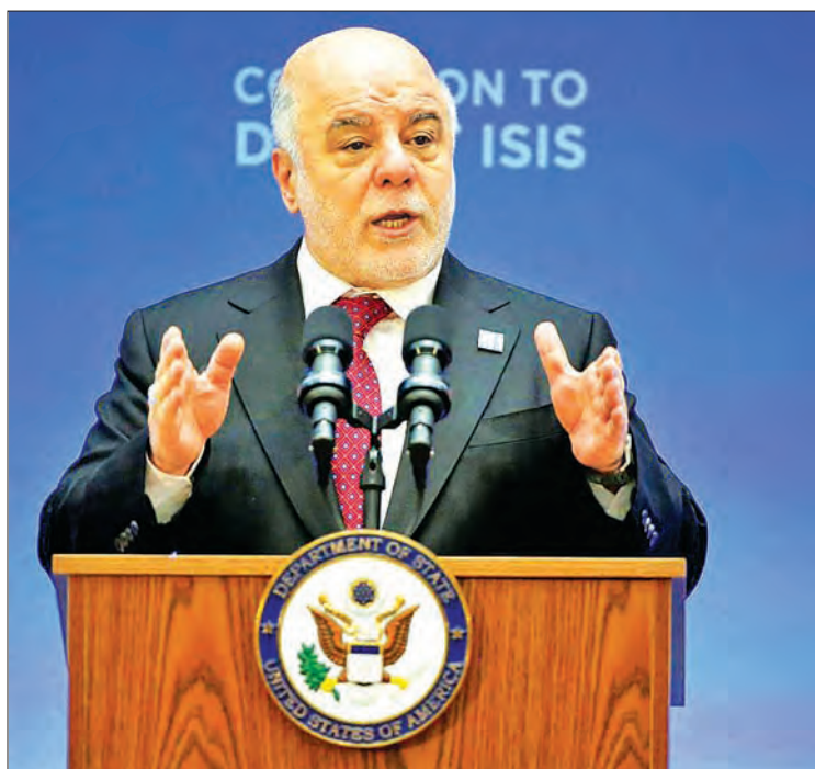
Iraqi Prime Minister Haider al-Abadi.