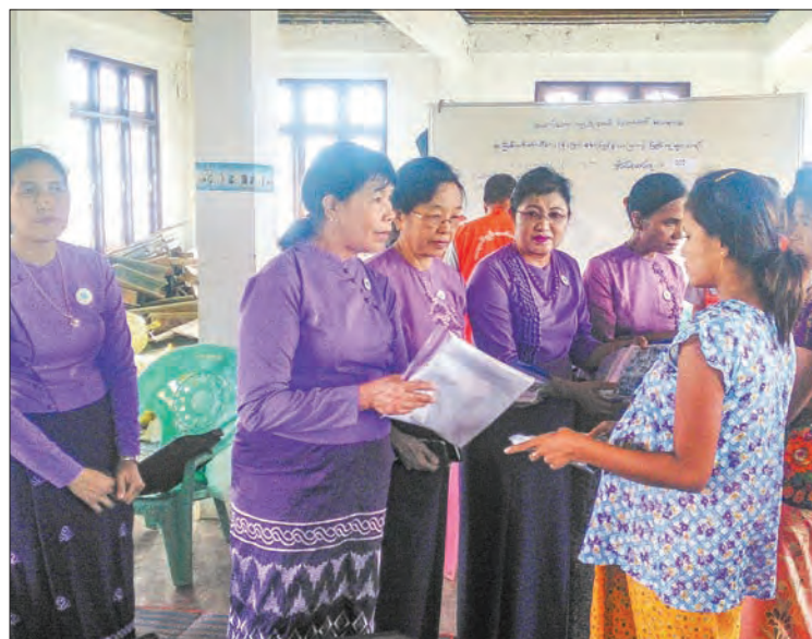
Members of MMCWA (Central) provide cash and commodities to displaced persons in Ponnagyun in Rakhine State.