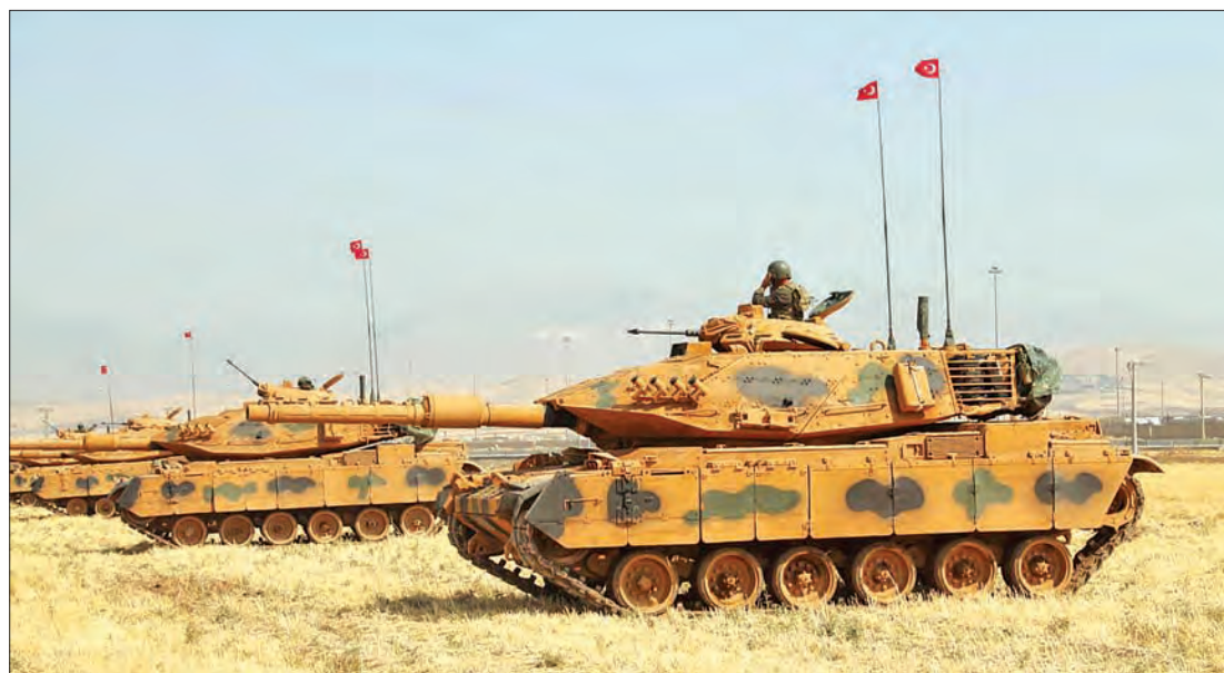
Turkish army tanks are seen during a military exercise near the Turkish-Iraqi border in Silopi, Turkey on 18 September, 2017.

population in the region, Turkey fears that a "Yes" vote would fuel separatism in its southeast, where militants of the outlawed Kurdistan Workers Party (PKK) have waged an insurgency for three decades.