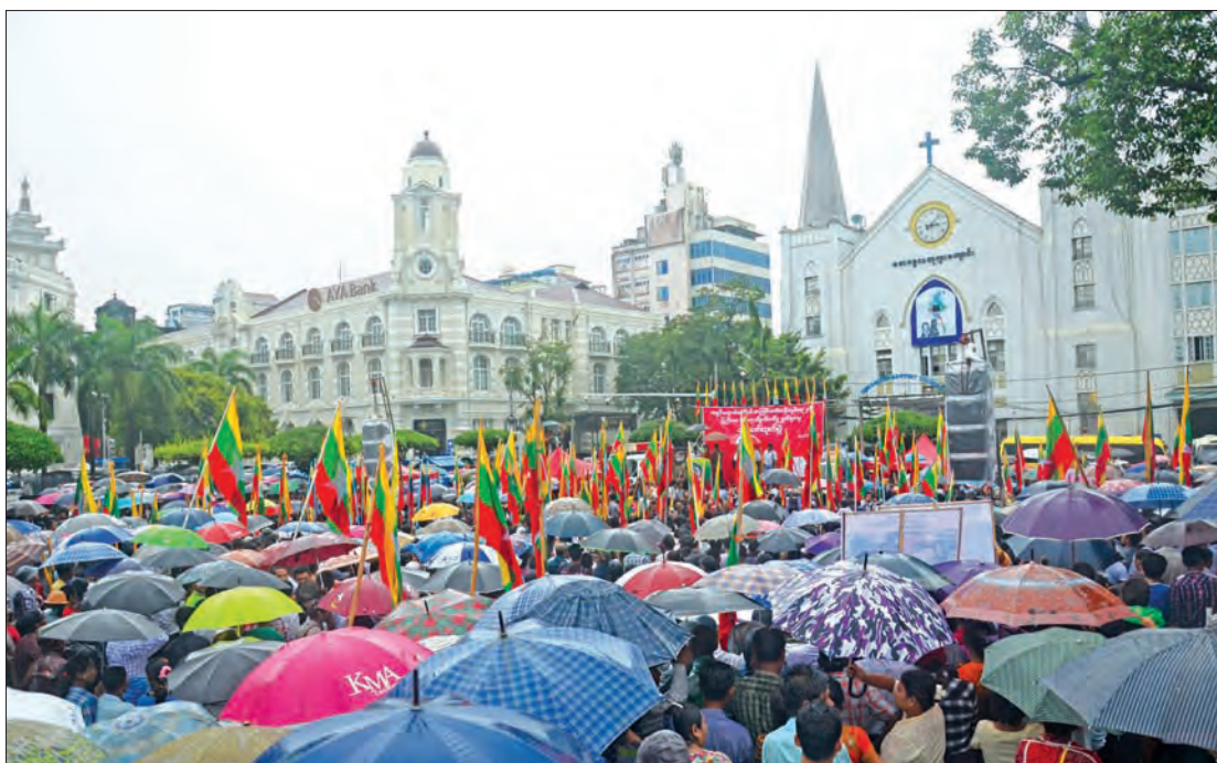
People stage protest against ARSA terrorists, foreign interference in Rakhine.

The final report of the Advisory Commission released on 24 th August puts forward recommendations to surmount the political, socio-economic and humanitarian challenges that currently face Rakhine State.—MNA ■