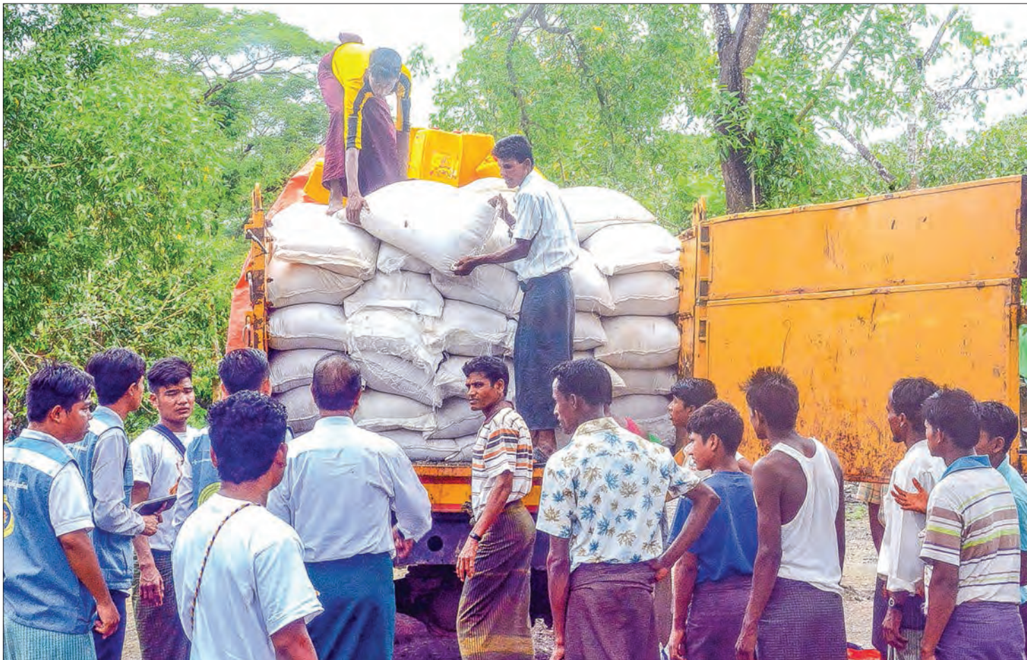
Relief aids are arriving at both Local Ethnic communities and Muslim communities in Northern Rakhine State.

The central administrative body of the State Pariyatti Sasana universities of State Sangha Maha Nayaka Committee held its meeting (2/2017) at the convocation hall of the State Pariyatti Sasana University (Yangon) at Kaba Aye in Yangon at 1 pm yesterday. NEWS ON PAGE-2 >>>