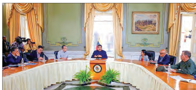
Venezuela's President Nicolas Maduro (C) speaks during a meeting with ministers in Caracas, Venezuela, on 15 September 2017.

CARACAS — President Nicolas Maduro has predicted a new foreign-led effort to mediate Venezuela's political crisis would produce a deal soon, but the opposition said on Saturday it would not accept another time-wasting "show".