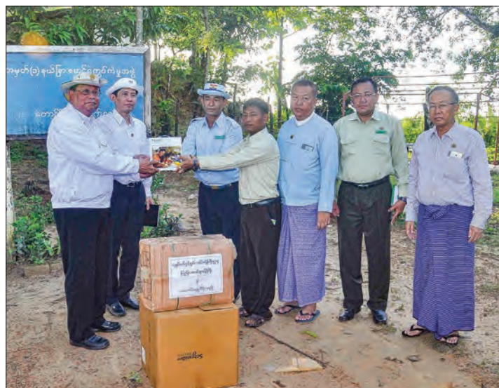
Union Minister U Win Khaing presents solar lamps for service personnel.

In Buthidaung township, they inspected the 600-ft-long Saitin Bridge on Ponnagyun-Yathedaung-Buthidaung road undertaken by construc-