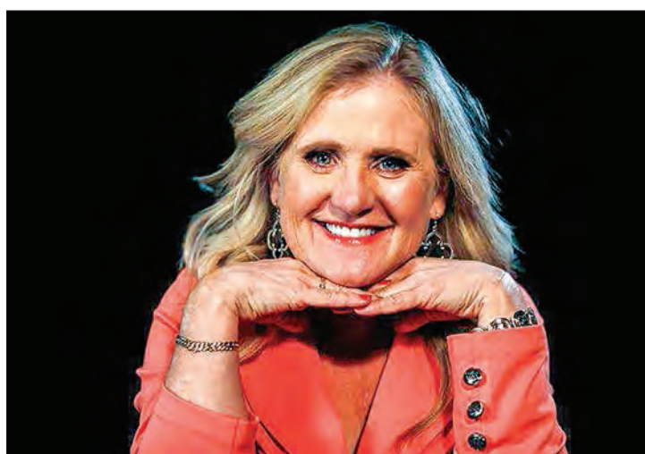
Actor Nancy Cartwright poses for a portrait in Los Angeles, California, US, on 11 September 2017.

“In Search of Fellini” follows Lucy, a young, naive girl living a sheltered life with her mother in a small Midwestern American town until she undergoes a spiritual awakening watching Fellini’s 1954’s “La Strada” and