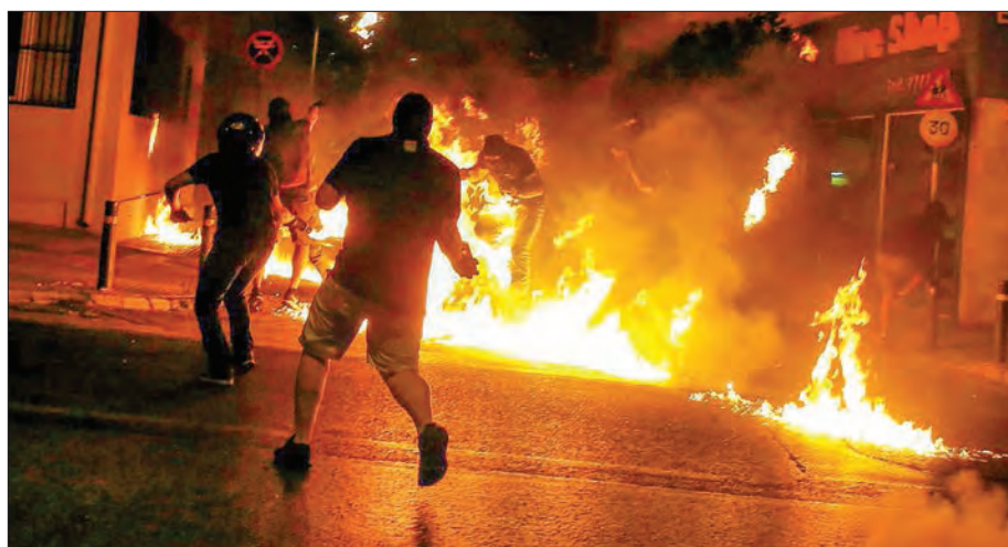
A masked demonstrator (C) is engulfed in flames as clashes with riot police take place during a rally marking four years since the fatal stabbing of Greek anti-fascism rapper Pavlos Fyssas by a supporter of the ultranationalist Golden Dawn party in Athens, Greece, on 16 September 2017.

The killing of Pavlos Fyssas, who performed under the stage name Killah P, had sparked protests across Greece and led to an investigation into Golden Dawn for evidence linking it to violent attacks. A trial of party members is continuing. Clashes broke out on Saturday after dozens of hooded demonstrators broke off from a march of about 2,000 people, including activists and migrants, towards the Golden Dawn