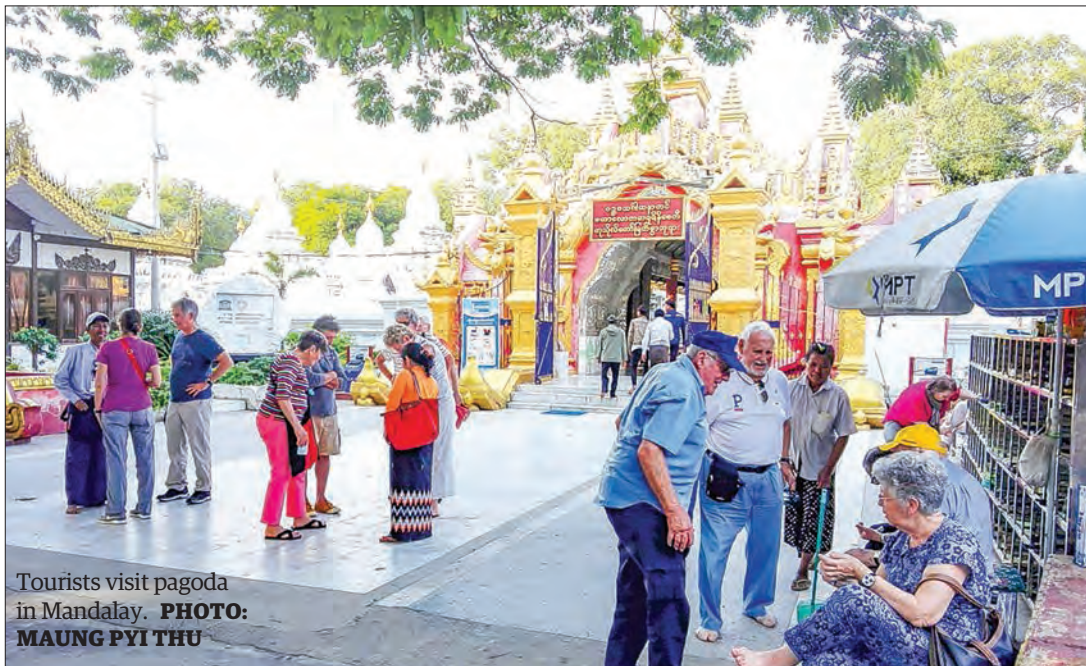
Tourists visit pagoda in Mandalay.