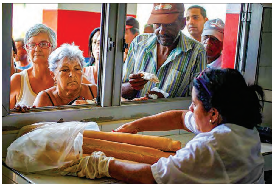
People line up to buy bread after Hurricane Irma caused flooding and a blackout in Havana, Cuba, on 11 September 2017.

The WFP already had more than 1,600 tonnes of food pre-positioned around Cuba available to distribute and had funds to buy more. It would start by distributing for free rations of rice and beans in the most vulnerable areas. Irma's impact on food availability