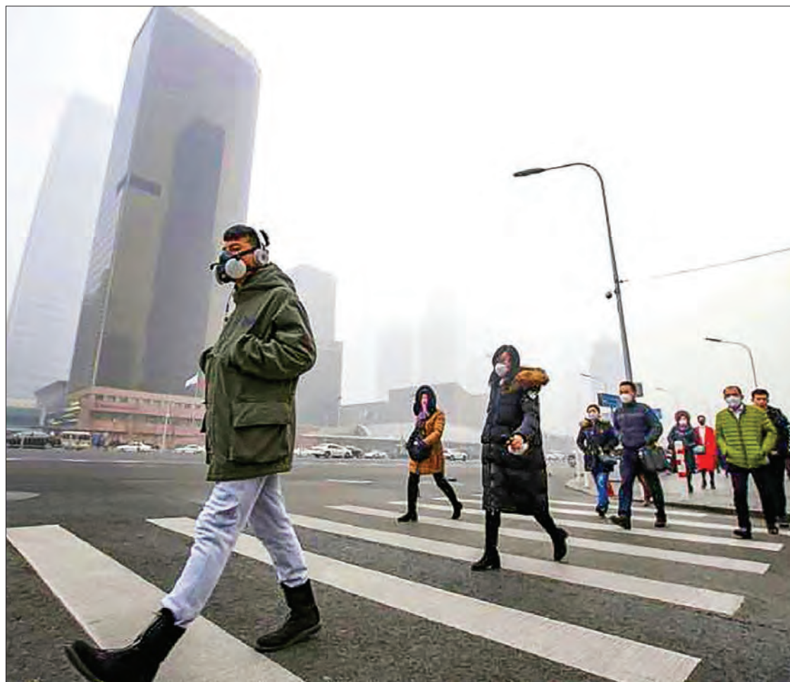
A man wearing a respiratory protection mask walks toward an office building during the smog after a red alert was issued for heavy air pollution in Beijing's central business district, China, in 2016.

In the capital, it is aiming to reduce airborne particles known as PM2.5 by more than