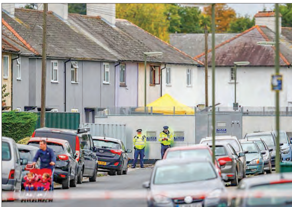
Police officers stand in front of barriers forming a cordon around a property being searched after a man was arrested in connection with an explosion on a London Underground train, in Sunbury-on-Thames, Britain, on 17 September 2017.

"I think that he like I supports the prime minister at this difficult time as we try to conclude the negotiations with the EU," she said.—Reuters ■