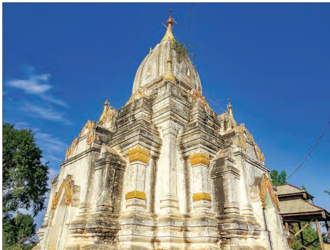
Photo shows a Stupa of Bagan era in MyinKunn Ancient City.

There are seventeen hotels and seventeen hostels in Magway and it is reported that the number of tourists reached 19,386 in 2016 and 10,861 in 2017. Dr. Aung Moe Nyo, the Chief Minister of Magway Region, said after community based tourism (CBT) was set up in Pakkoku District, about a thousand tourists come visit annually. The Chief Minister said CBT was also set up in Makyikan Village