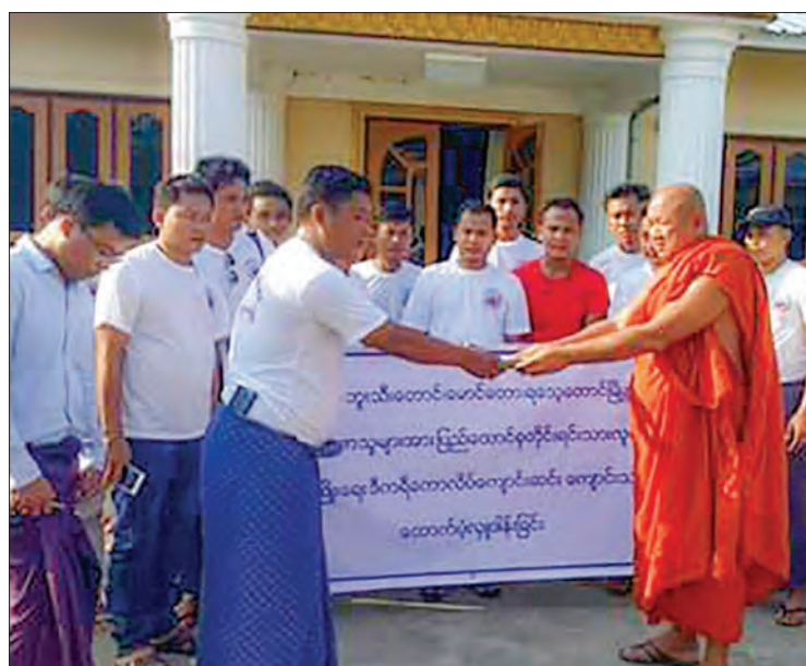
Well-wishers making donations for people of Maungtaw.

Ks 700,000 for a temporary rescue camp in four miles ward, Maungtaw Township for, Ks 200,000 for a temporary rescue camp of Dat Paung Su Parahita (Philanthropic) monastery in three miles ward, Ks 500,000 for a temporary rescue camp of Aloetaw Pyae monastery, Ks 600,000 for a temporary rescue camp of Beikman emergency supporting committee, Ks350,000 for students in temporary rescue camp of Myoma Nant Tha Taung Parahita monastery, Ks500,000 for a temporary rescue camp of Lan Ma monastery in No.2 ward, Buthidaung Township, Ks 500,000 for a temporary rescue camp