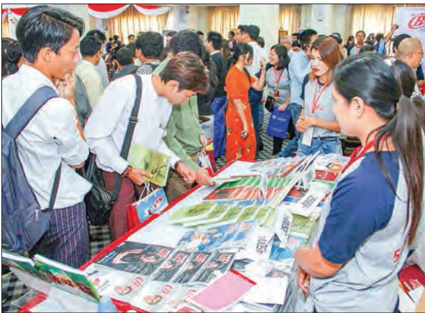
Guests view copies Myanmar B2B Magazine at its 5 th anniversary at UMFCCI on 10 September.

Present at the ceremony were economic experts, businesspersons, writers, cartoonists, special guests, news medias and other interested persons. — GNLM