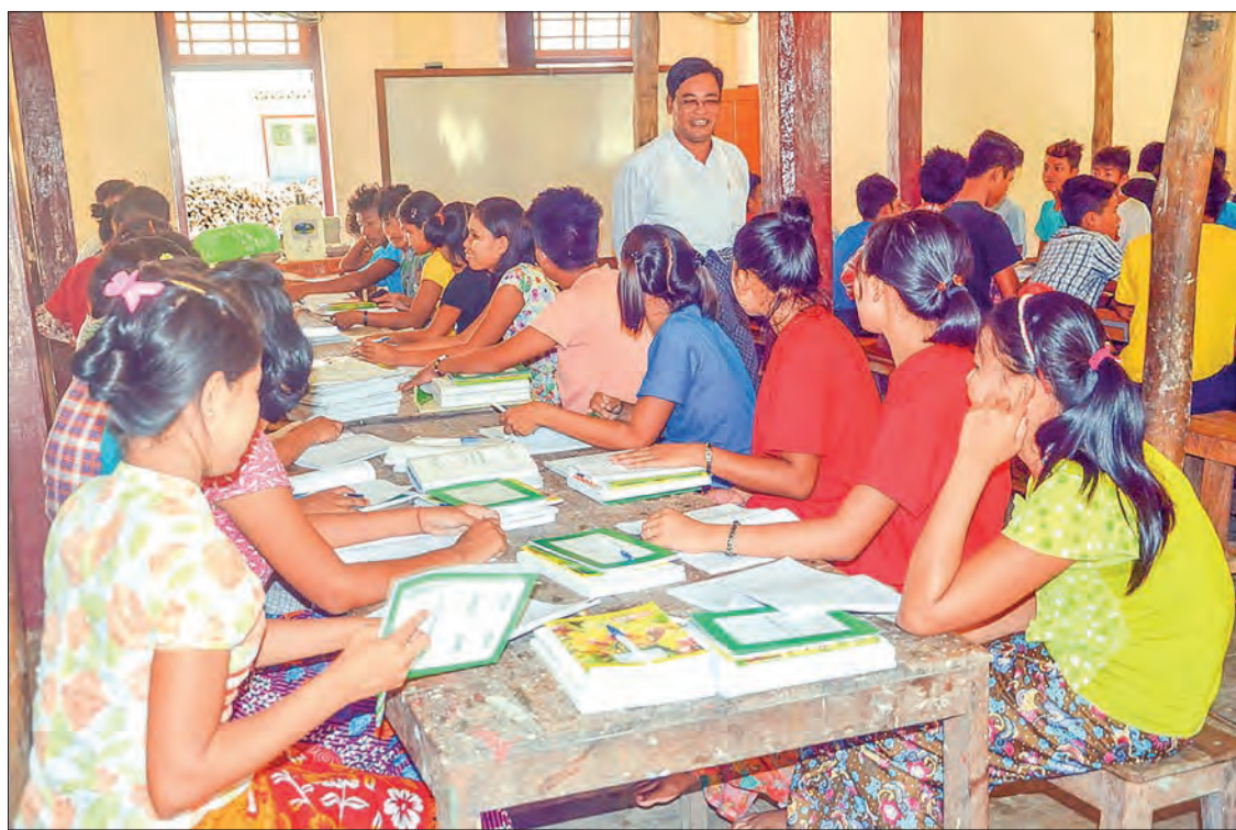
A peaceful learning environment in a restive area.