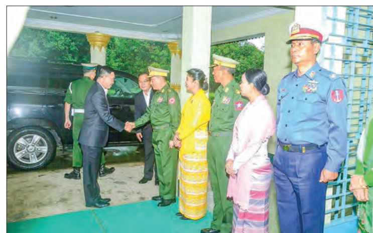
Chief of Defence Forces of Royal Thai Armed Forces General Surapong Suwana-adth, his wife and party arrive in Yangon.

The delegation visited Shwemawdaw Pagoda and Shwethalyaung Pagoda, Kanbawzathadi Palace in Bago and Bogyoke Aung San Market in Yangon. —Myanmar News Agency ■