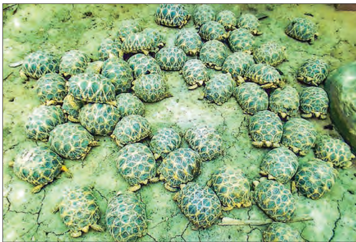
Myanmar Star tortoises are found in arid regions of Myanmar.

Situated in Minbu Township, Magway Region, a total of 150 star tortoises ( Geochelone Platynota ), a critically endangered species, are naturally living in the sanctuary, according to a report of the Myawady Daily issued on Sunday. All of the total numbers, small radio transmitters have been installed on the back of 42 turtle's upper shell to provide information for follow-up healthcare to those land-dwelling reptiles in the sanctuary. Altogether 50 tortoises have been placed in each 2.5-acre wide plot. Recording, mapping and calculation have been conducted by