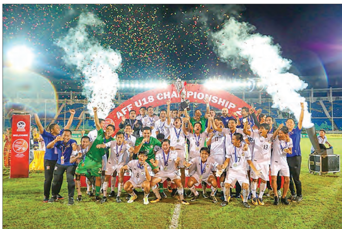
Thailand footballers are celebrating victory as they won the 2017 AFF Under-18 Championship Cup.

Just before the end of the match, Malaysia got a penalty but Muhammad Zafuan Azeman unable to score when Kantaphat judged the direction well and ended up the match with 2-0 win for Thailand.