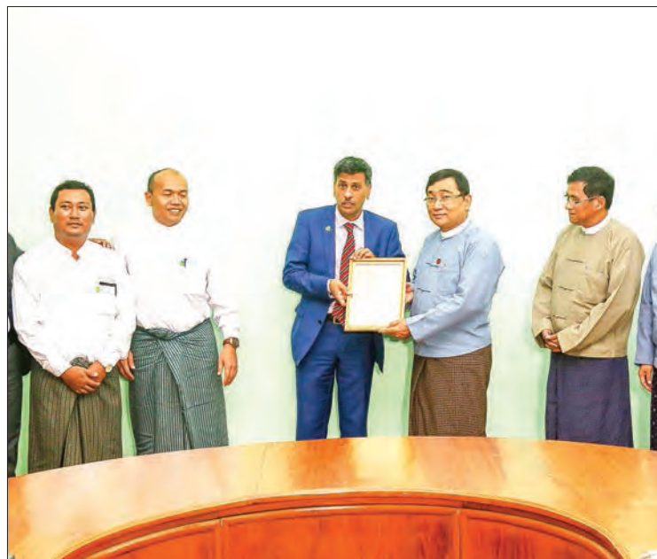
Union Minister Dr Win Myat Aye receiving aids for victims in N Rakhine State.

Ministry of Social Welfare, Relief and Resettlement is systematically distributing cash, foods and utensils contributed by international organizations to all victims in Rakhine State. —Myanmar news Agency