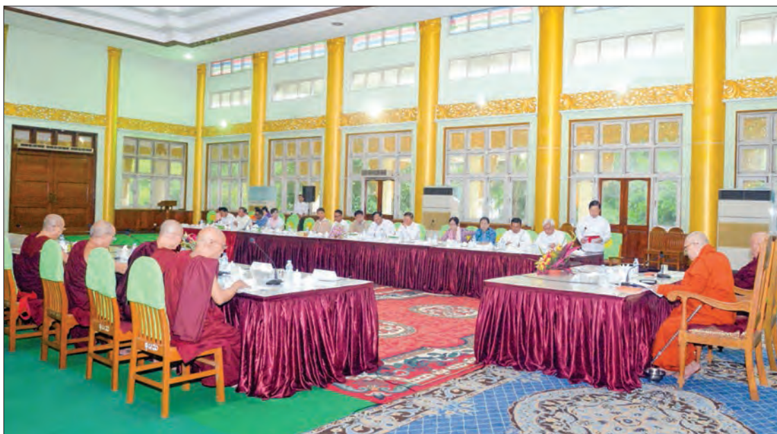
Pariyatti universities administrative body meeting in progress.

Sayadaw Bhaddanta Obhasabhivamsa delivered a sermon.—Myanmar News Agency ■