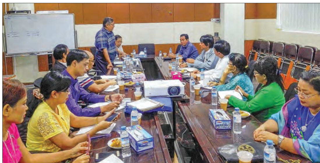
Meeting to provide free ferry service to Democracy Anyeint contest in progress.

YANGON Region government has arranged to provide ferry services across six different routes to Anyeint Contest, which is scheduled to be held at the National Theatre in Yangon, from 20 to 21 September.