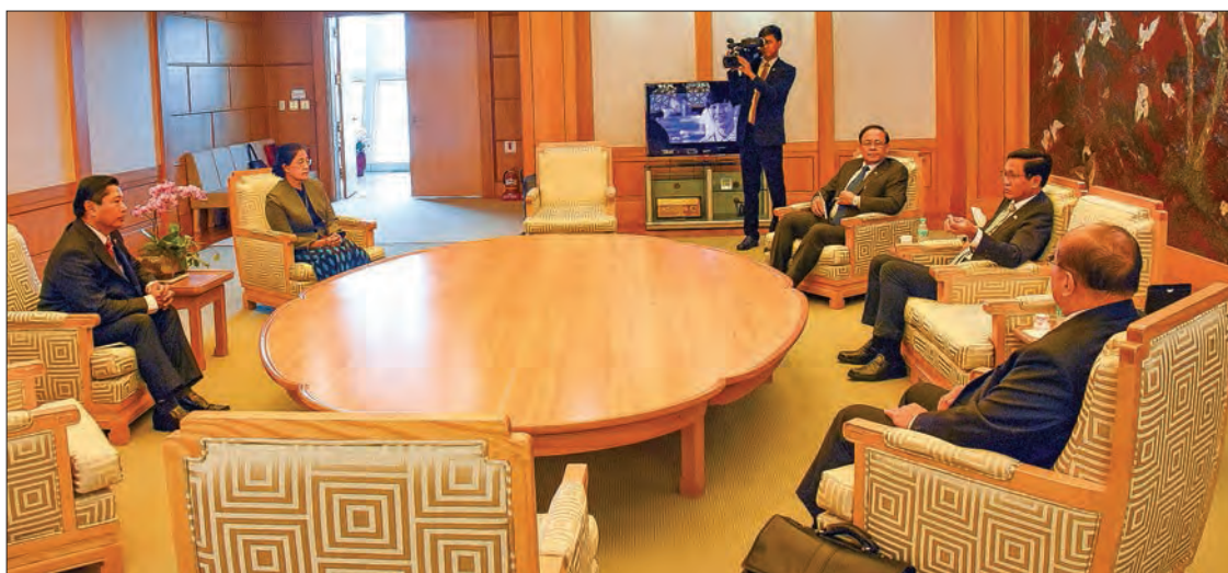
Vice-President U Henry Van Thio on his way to fly to New York via the Republic of Korea.