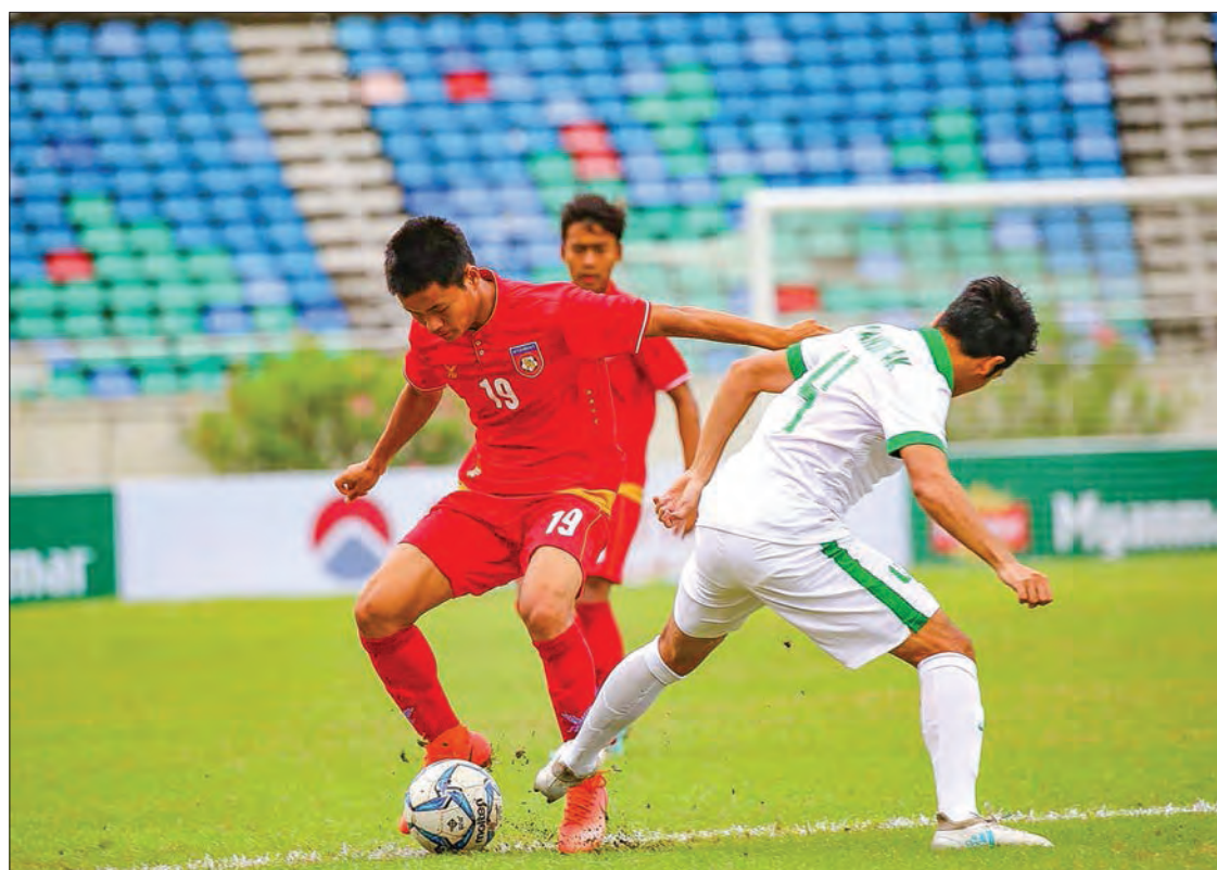
Myanmar and Indonesia football players in action with passing the ball at yesterday match in Thuwunna Stadium.