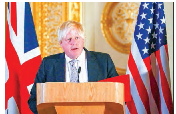
Britain's State Secretary for Foreign and Commonwealth Affairs Boris Johnson speaks during a news conference at Lancaster house in London, Britain, on 14 September 2017.

Prior to that it had not been triggered since 2007.—Reuters ■