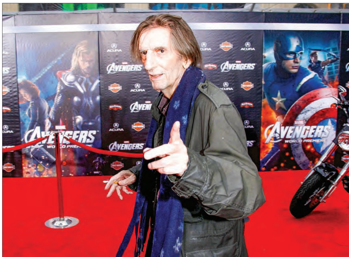
Actor Harry Dean Stanton poses at the world premiere of the film “Marvel’s The Avengers” in Hollywood, California, US in 2012.

Stanton credited Jack Nicholson with giving him vital professional advice. Nicholson had written a part for Stanton in the Western “Ride the Whirlwind” and told him, “Let the wardrobe do the acting and just play yourself.” “After Jack said that, my whole approach to acting opened up,” Stanton told Entertainment Weekly. Stanton worked with many of Hollywood’s most notable directors, including Frances Ford Coppola (“The Godfather Part Two” and “One From the Heart”), Sam Peckinpah (“Pat Garrett and Billy the Kid”), Mar-