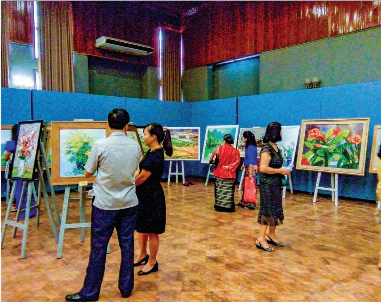
Visitors view paintings at the Myanmar-Viet Nam art exhibition at the National Theatre in Yangon.

Twenty-nine paintings of Viet Nam and 23 of Myanmar showing the charm and beauty of both countries are displayed at National Theatre in Yangon. For the third time the Myanmar-Viet Nam art exhibition is being held from 17 to 22 September with the aim of promoting cultural and arts of