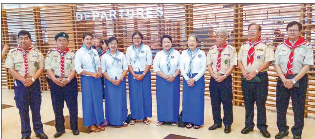
Myanmar Girl Scout delegation pose for documentary photo: PHOTO: MYANMAR SCOUT ASSOCIATION

will submit the paper regarding the activities of Myanmar Girl Scout Association, holding the training and workshops for the progress of scout services and the programs to revive the girl scout services since 2013 in co-operation with Japan Girl Scout Association. Then the Myanmar group discussed about the training courses and seminars which will be conducted in co-operation with the world Girl Scout Association.—Myanmar Scout Association ■