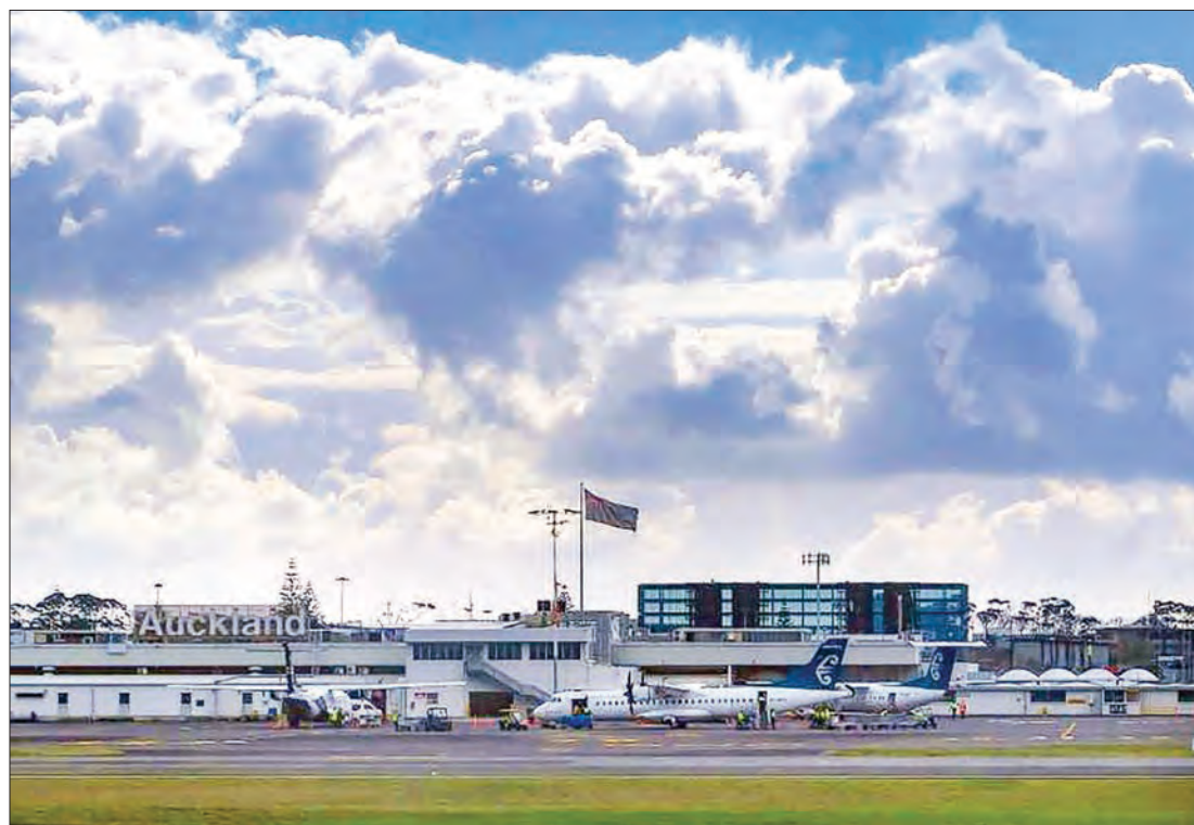
Air New Zealand Bombardier Q300 planes sit near the terminal at Auckland Airport in New Zealand, on 25 June 2017.