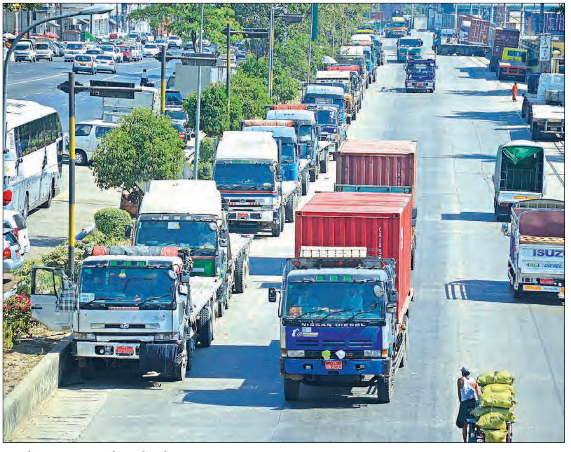
Trucks seen at Strand Road in downtown Yangon.