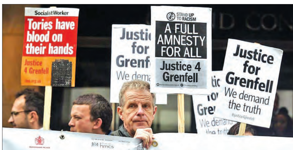
Demonstrators gather outside the Grenfell Tower public Inquiry in central London, Britain, on 14 September 2017.