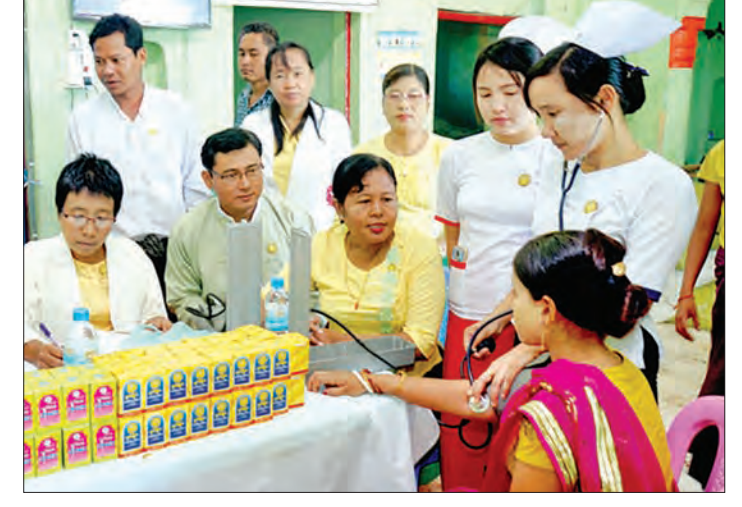
Traditional practitioners give health care to Hindus displaced by the attack of ARSA terrorists at a relief camp in Sittway.

Health care will continue to be provided to the relief camps in Sittway. Most health problems are diarrhea, headache, insomnia, knee pain and back ache, while for children cough and asthma were the most treated."