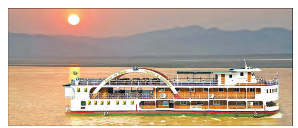
Cruise de Bagan with beautiful sunset of Bagan along the mighty Ayeyarwaddy River.

The cruise will run daily during the tourist season