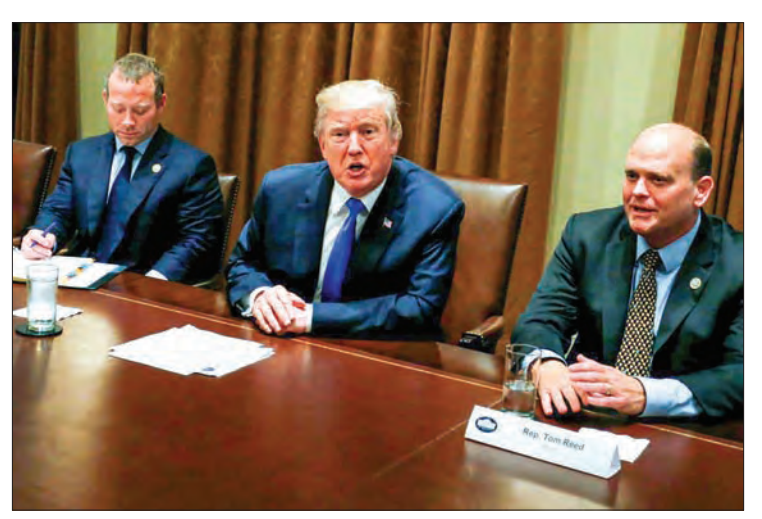
US President Donald Trump meets with a bipartisan group of members of Congress, including US Representative Josh Gottheimer (D-NJ) (L) and Representative Tom Reed (R-NY) (R), at the White House in Washington, US, on 13 September 2017.

Mnuchin told Fox News Channel the Trump adminis-