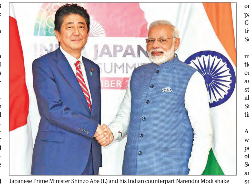
Japanese Prime Minister Shinzo Abe (L) and his Indian counterpart Narendra Modi shake hands ahead of their talks in Gandhinagar, western India, on 14 September 2017.

The UN body on Monday adopted its latest resolution that imposes