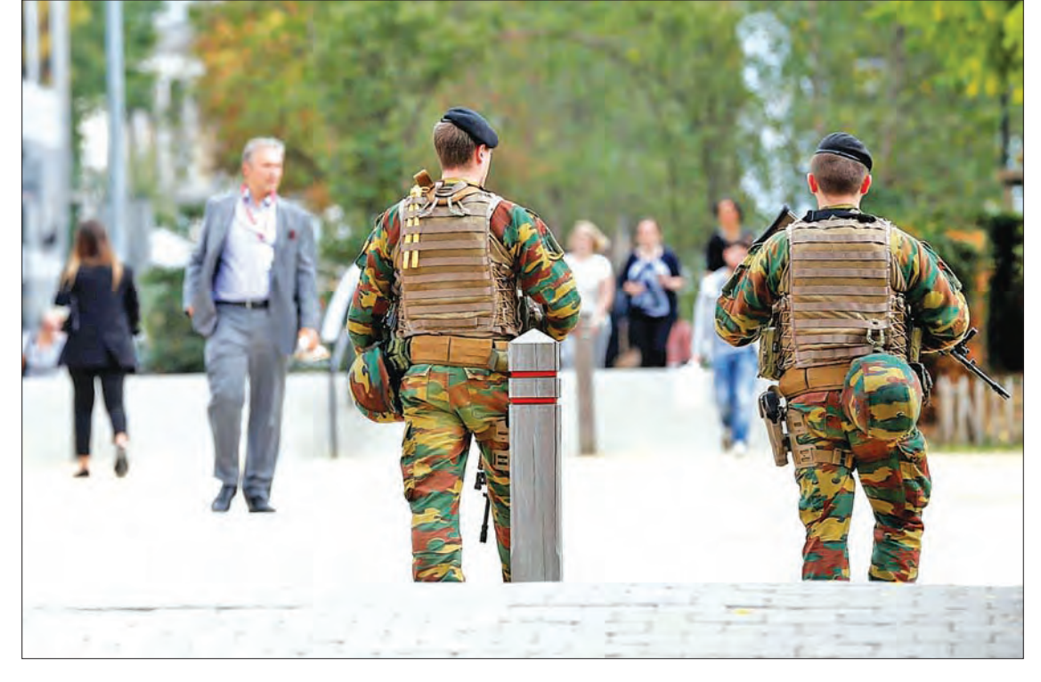
Belgian soldiers patrol near European Union institutions in Brussels, Belgium, on 5 September 2017.

"We are standing around like flowers pots, just waiting to be smashed," said an officer just returned from Afghanistan for guard duty in Belgium, which, like France, has more troops deployed at home than in any single mission abroad. Security personnel have been targeted in both countries but patrols begun as a temporary measure after Islamic State attacks in 2015 have become permanent fixtures as opinion polls show that people are reassured by soldiers on show at home. Italy has had soldiers on the streets since 2008, Britain used them briefly this year and,