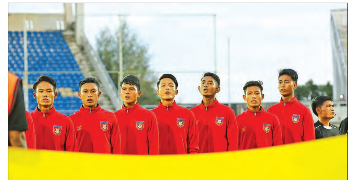
Myanmar U-18 football players singing Naitonal Anthem of Myanmar before playing a AFF U-18 Group B football match aganist Brunei at Thuwunna Stadium.

The two winners from the semifinal matches will face each other in the final match on Sunday.