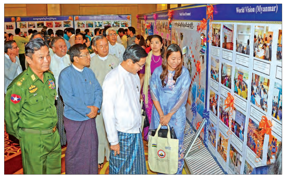
Vice President U Henry Van Thio observes documentary photos at the ceremony to mark the fifth Anti-Trafficking in Persons Day in Nay Pyi Taw yesterday.

Human trafficking continues to be happening in Myanmar due to such causes leaving people vulnerable as shortage of employment opportunities, low income, natural disasters and armed conflicts.