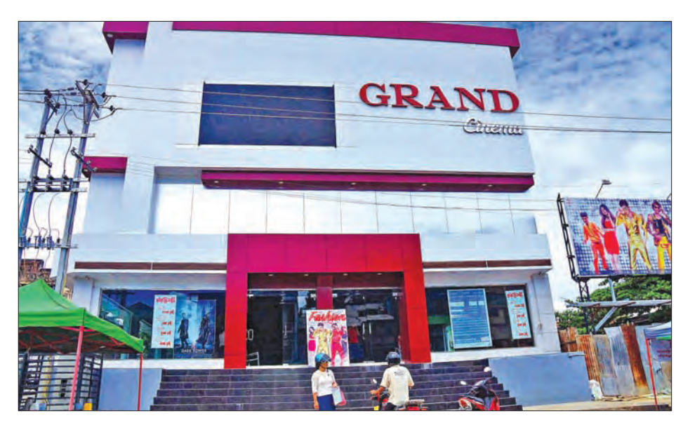
Grand Cinema in Meikhtila.

CINEMAS nationwide are preparing to host the Myanmar Democracy Film Festival on 15th Septem-