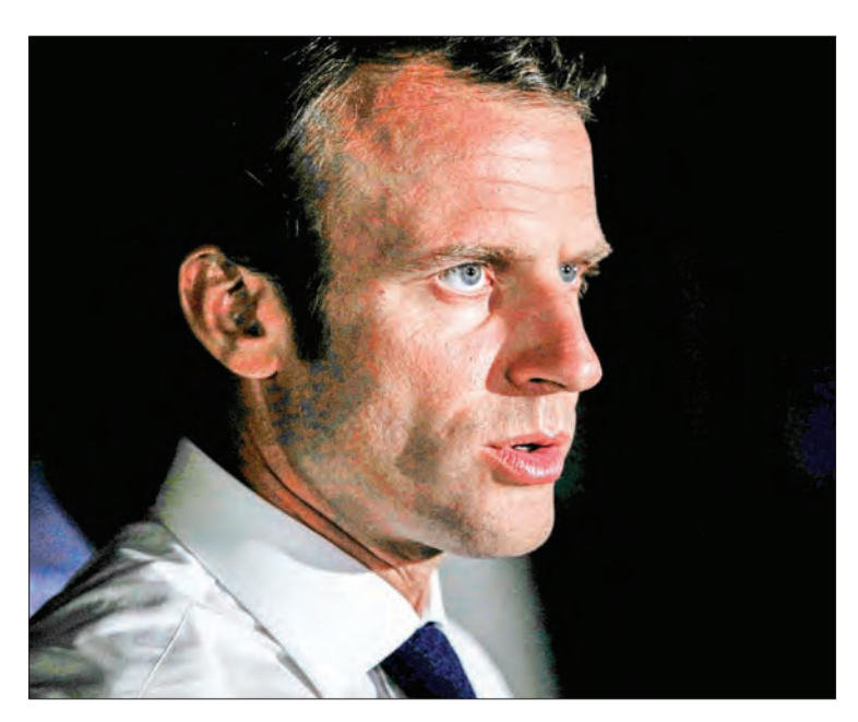
France's President Emmanuel Macron delivers a speech during a press conference as part of his visit in the French Caribbean islands of St Martin on 12 September, 2017.

However, Macron's push for an ambitious overhaul of Europe's single currency bloc is running up against resistance in Berlin despite conciliatory public signals from