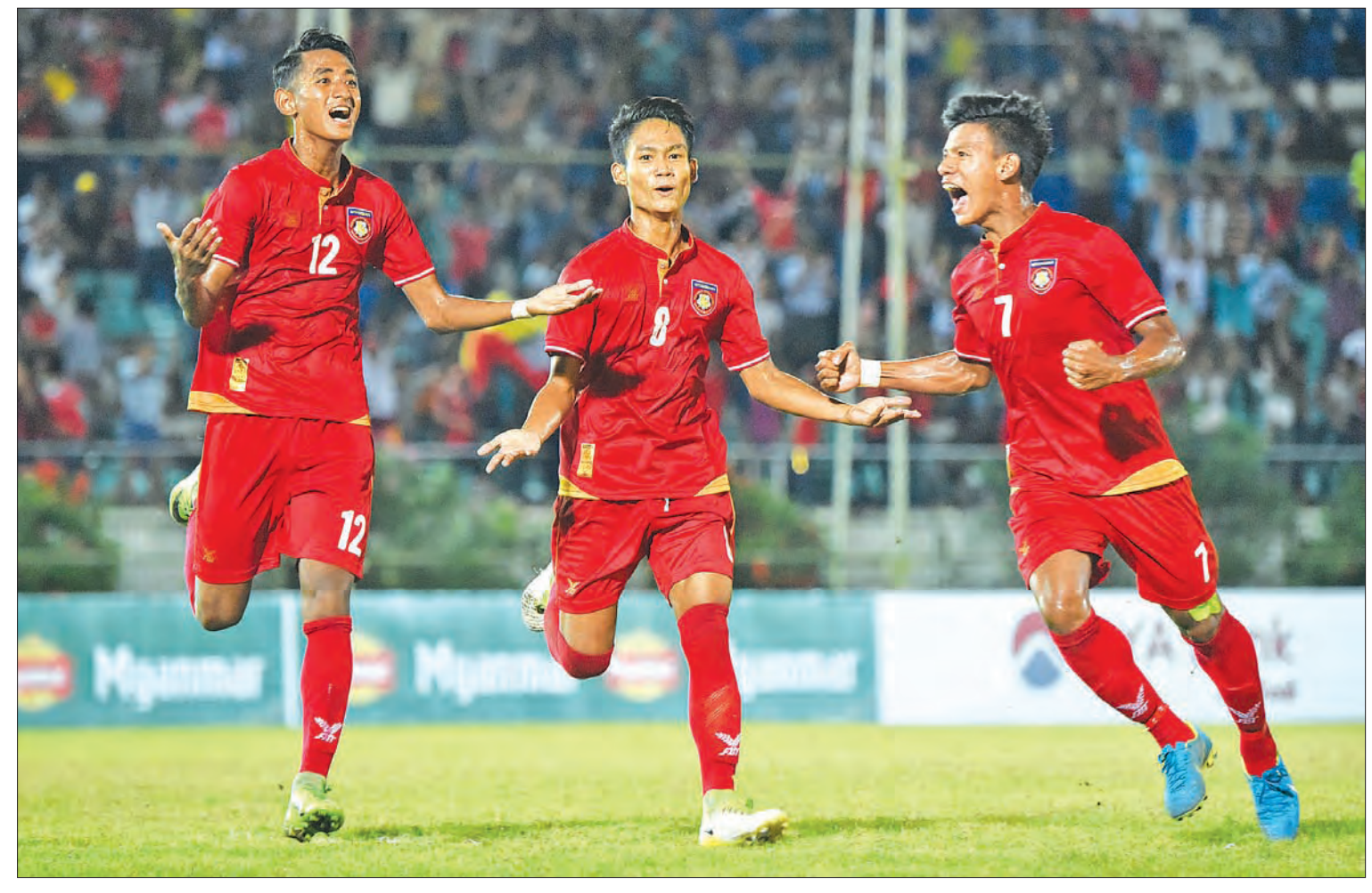
Myanmar U-18 footballers celebrating the victory in Thuwunna Stadium yesterday as Myanmar secures 2017 AFF U-18 semifinal.

Viet Nam struggled to regain focus on the game in which