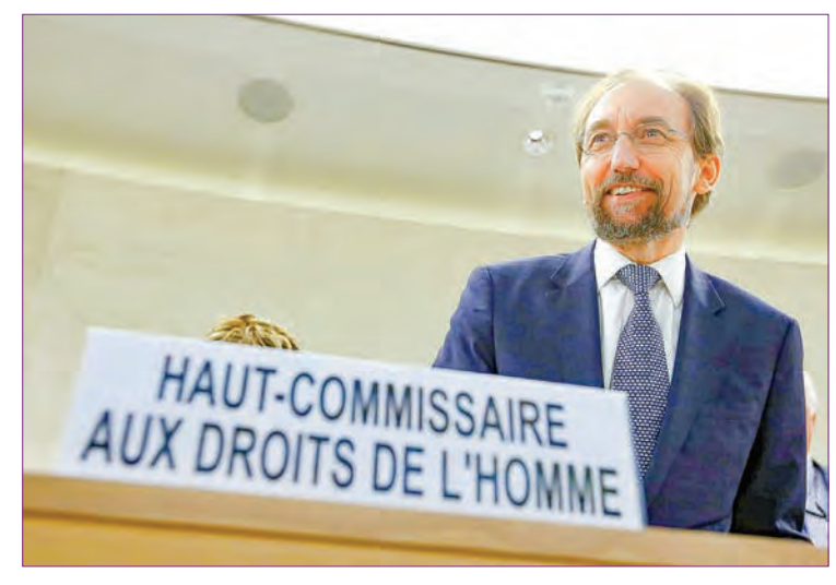
Zeid Ra'ad Al Hussein, UN High Commissioner for Human Rights arrives at the 36th Session of the Human Rights Council at the United Nations in Geneva, Switzerland on 11 September, 2017.

The Netherlands and Canada are backing a resolution at the UN Human Rights Council mandating an international inquiry, but Saudi Ambassador