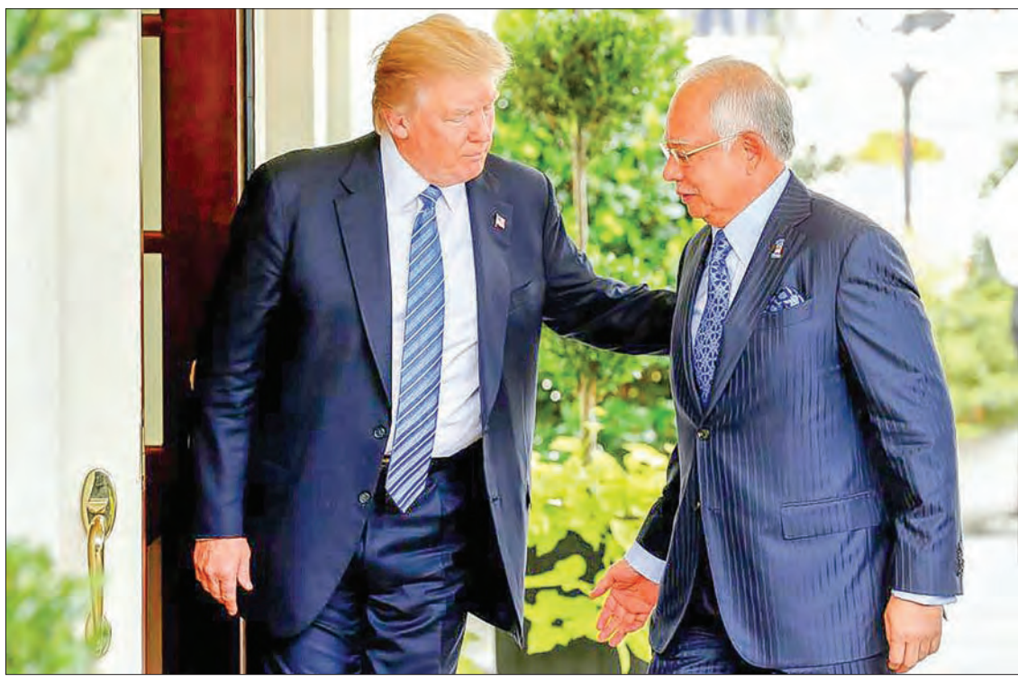
US President Donald Trump welcomes Malaysia's Prime Minister Najib Razak to the White House in Washington, US on 12 September, 2017.

The US Justice Department has said more than $4.5 billion