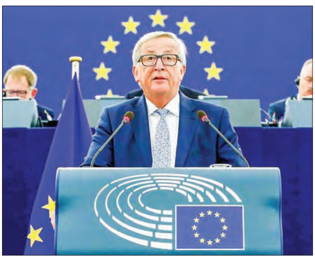
European Commission President Jean-Claude Juncker addresses the European Parliament during a debate on The State of the European Union in Strasbourg, France on 13 September, 2017.

Following a July agreement for an EU trade deal with Japan, Juncker said the Commission — the bloc's executive arm -