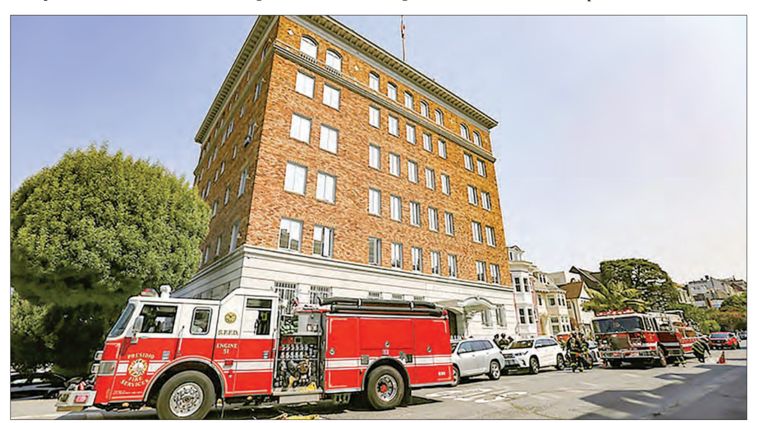
The US authorities closed down Russia's consulate general in San Francisco on 2 September.

ing of Russia's consulate-general when smoke was seen rising from the premises of the Russian diplomatic mission. It eventually turned out that the smoke was coming from the chimney of the Russian consulate-general. The US authorities closed down Russia's consulate general in San Francisco on 2 September.—Tass ■