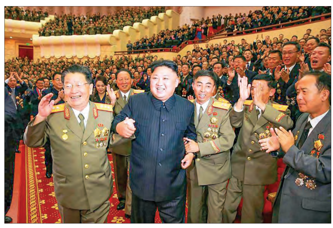
North Korean leader Kim Jong Un reacts during a celebration for nuclear scientists and engineers who contributed to a hydrogen bomb test, in this undated photo released by North Korea's Korean Central News Agency (KCNA) in Pyongyang on 10 September, 2017.

DPRK stands for the Democratic People's Republic of Korea, North Korea's official name.