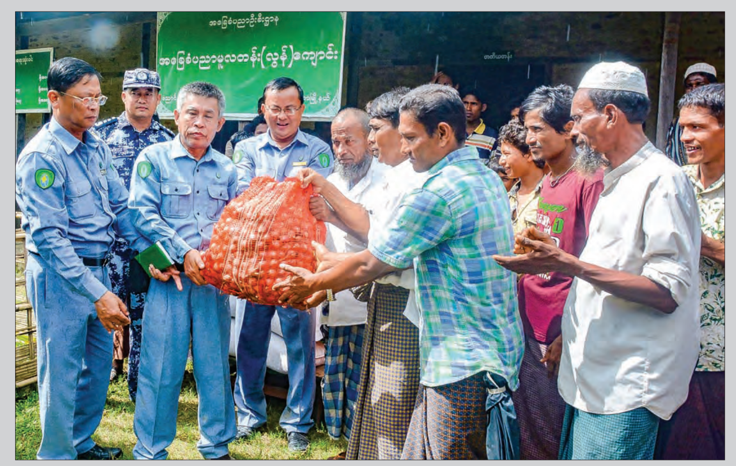
Authorities provide aid to people from Islamic community in northern Rakhine.

Rice and cash provided to people in Maungtaw Township