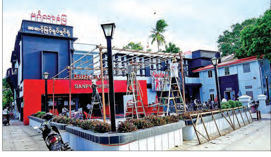
Mingala Ciname in Magway.

People can enjoy the films free of charge on 15th September.The fes-