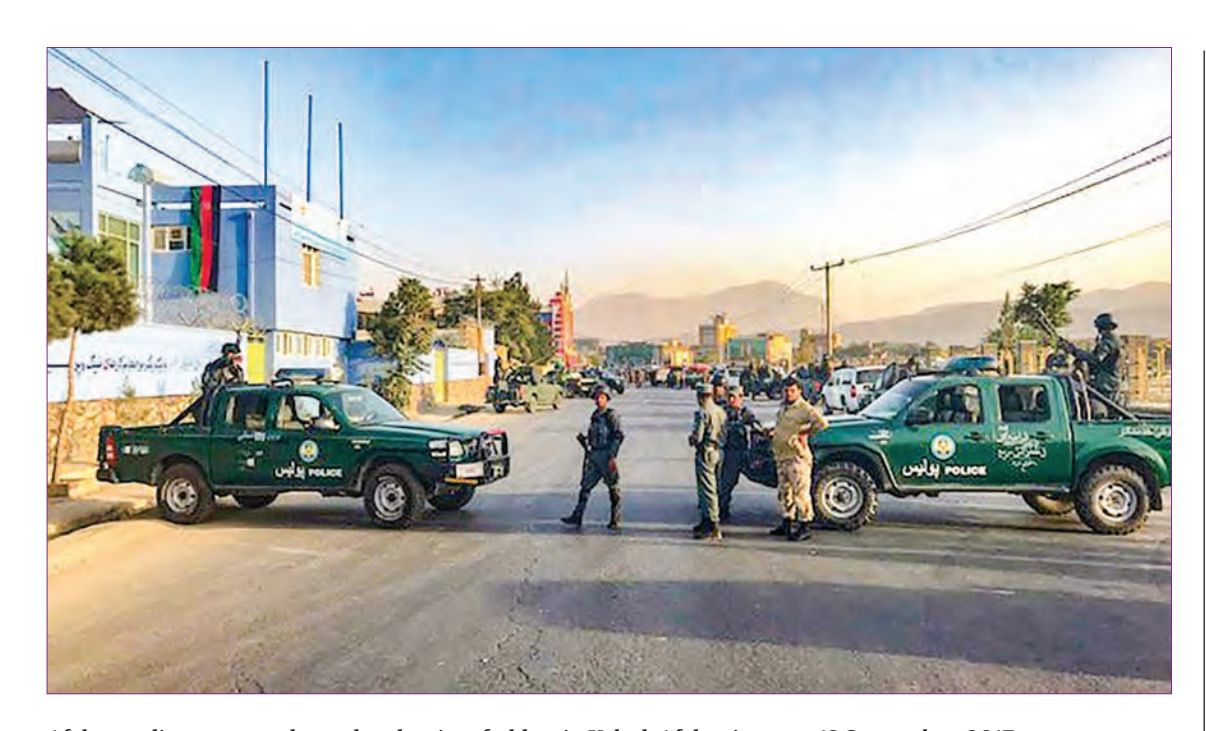
Afghan policemen stand guard at the site of a blast in Kabul, Afghanistan on 13 September, 2017.

The Saudi-led coalition has also has set up a team to investigate civilian casualties. On Tuesday it said it had found a series of deadly airstrikes had been largely justified.—Reuters ■