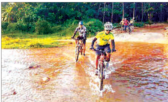
Foreigners take part in mountain bike race in Yangon.

Public awareness on traffic rules through educative talks have also been continued in the target areas, sharing road safety knowledge mostly in crowded places in the city.—GNLM ■