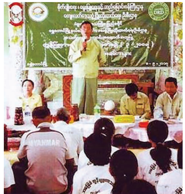
The deputy commissioner of rural development department, Pyay District delivers speech at the ceremony.

Thirty trainees from eight villages of Nwar Mayan village tract are registered for the class. — Shwe Win (Pyay) ■