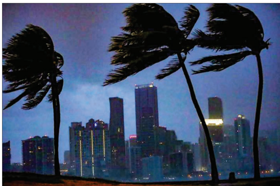
Dark clouds are seen over Miami's skyline before the arrival of Hurricane Irma to south Florida, US, on 9 September 2017.

Irma, which prompted one of the largest evacuations in US history, is expected to cause billions of dollars in damage to the third-most-populous US state, a major tourism hub, with an economy compris-