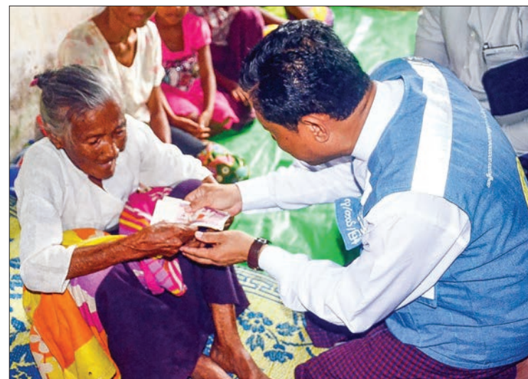
An official presents cash to a victim.