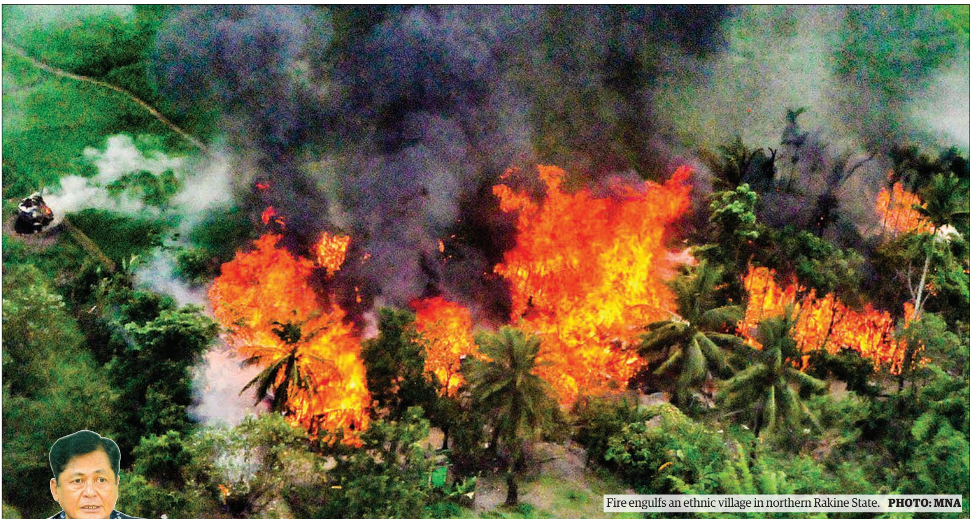
Fire engulfs an ethnic village in northern Rakine State.