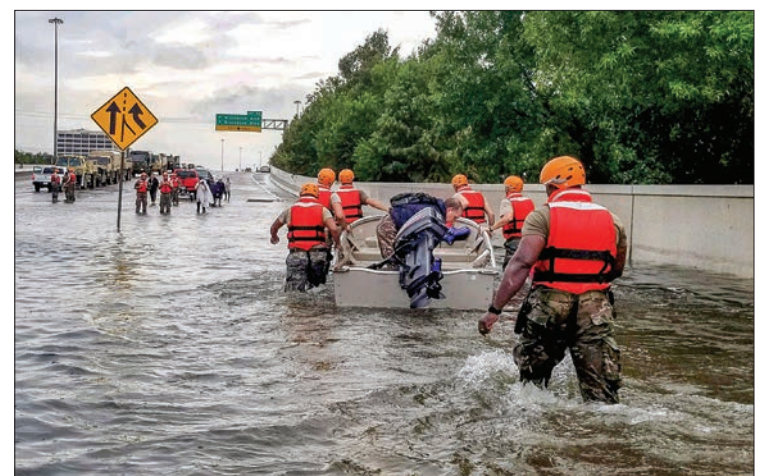
Hurricane Harvey (2017).

Throughout Texas, more than 300,000 people were left without electricity and billions of dollars of property damage was sustained. By August 29, approximately 13,000 people had been rescued across the state while an estimated 30,000 were displaced. More than 48,700 homes were affected by Harvey throughout the state, including over 1,000 that were completely