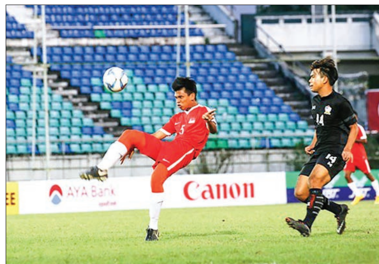
Singapore player tries to clear the ball with Thailand striker's following at yesterday match in Thuwunna Stadium.

And the Thai bench would once again explode into celebration just eight minutes later where the mistake of the Singapore defence to make a clearance allowed Chokanan Saima-in to stab the ball in from close range.—Kyaw Zin Lin ■