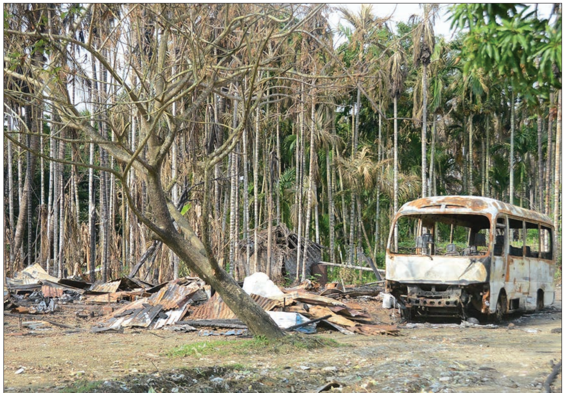
Burnt-out homes and a bus seen after terrorists' arson attack.