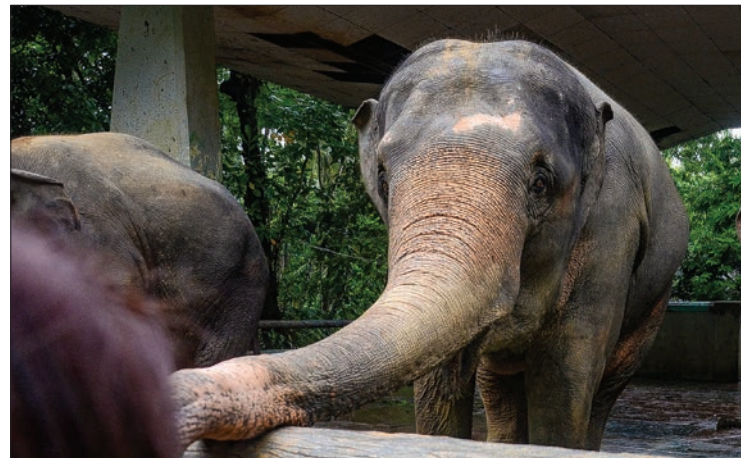
Mo Mo, 64, being seen at Yangon Zoological Garden.

U Myo Kyaw Thu said that the zoo hosted nine elephants in the past, including three males and six females. Under an agreement with the Forest Department, three male elephants will be transferred to Yangon's Hlawga Wildlife Park.—GNLM ■