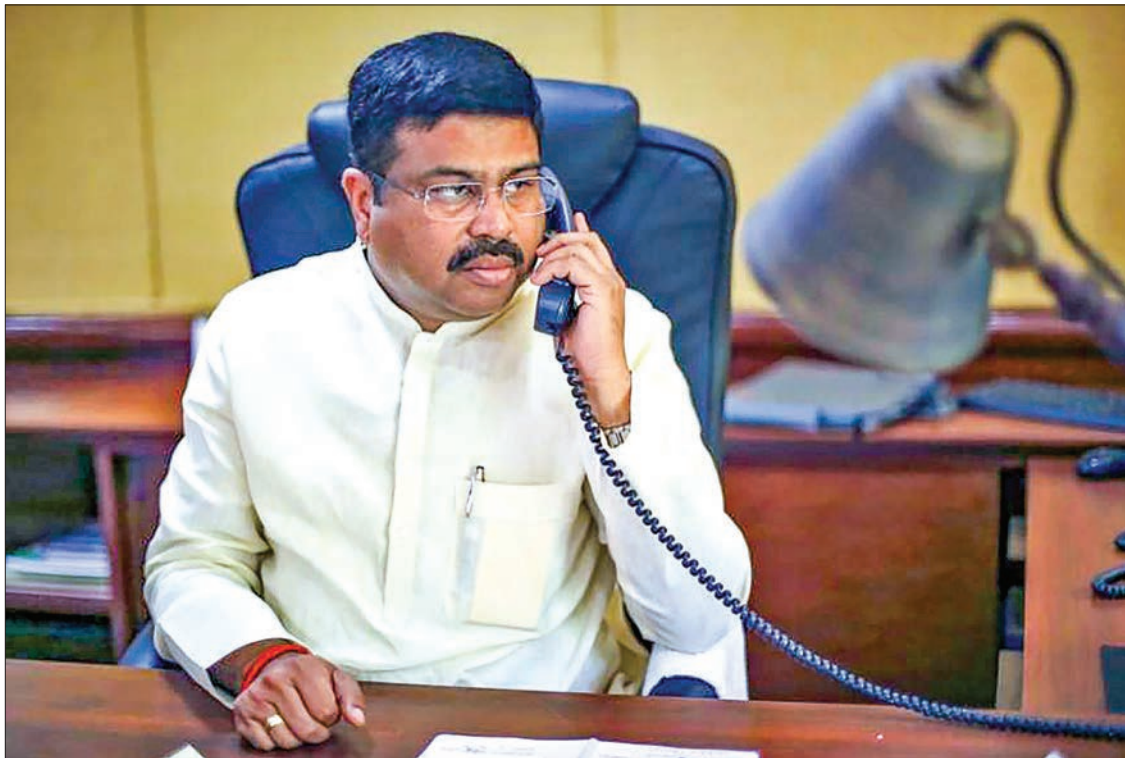
India's Oil Minister Dharmendra Pradhan speaks on phone during an interview with Reuters in New Delhi, India, on 5 May 2016.