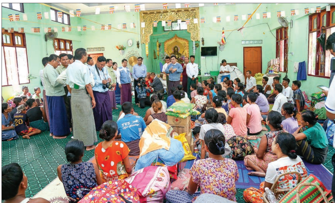
Union Minister Dr Win Myat Aye and Chief Minister U Nyi Pu hear heartfelt voices of minority ethnic races.

“Of the 108 persons of the 23 households of Khamongseik Hindu village, 96 are still missing. Terrorists captured and took