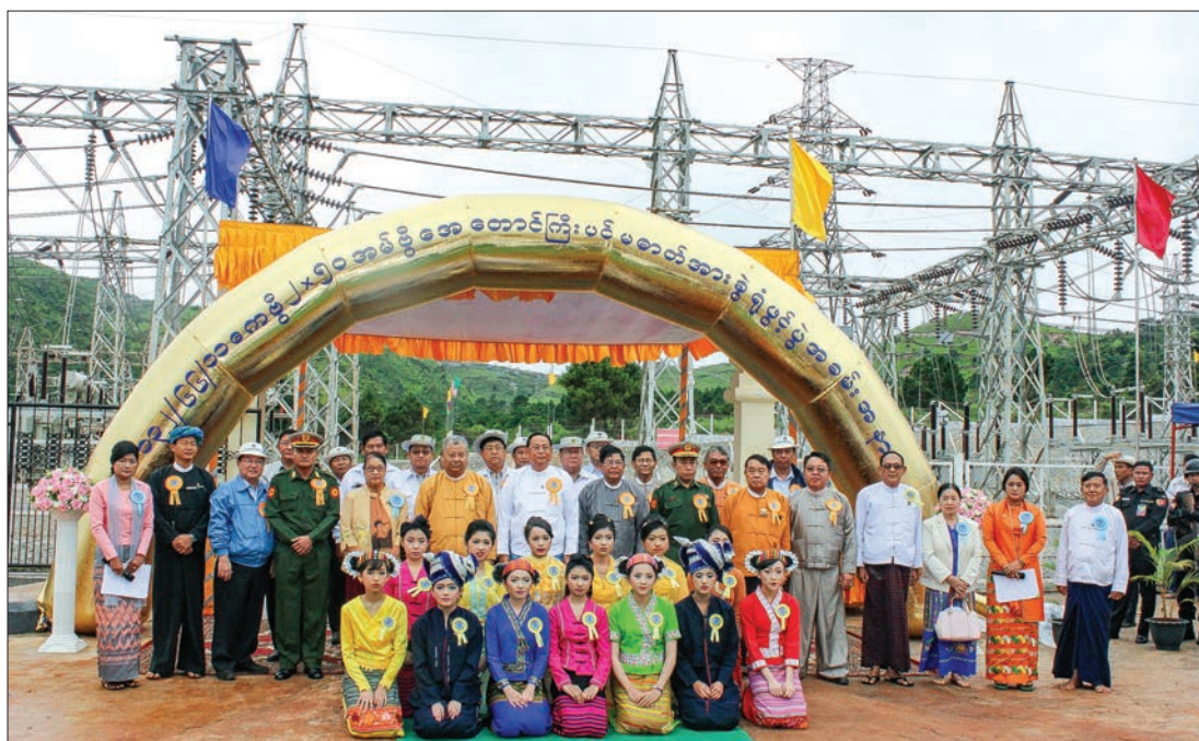
Officials pose for documentary photo.