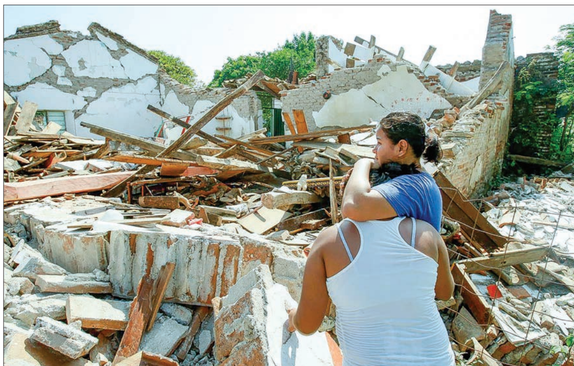
Women hug while standing next to a destroyed house after an earthquake struck the southern coast of Mexico late on Thursday, in Union Hidalgo, Mexico, on 9 September 2017.