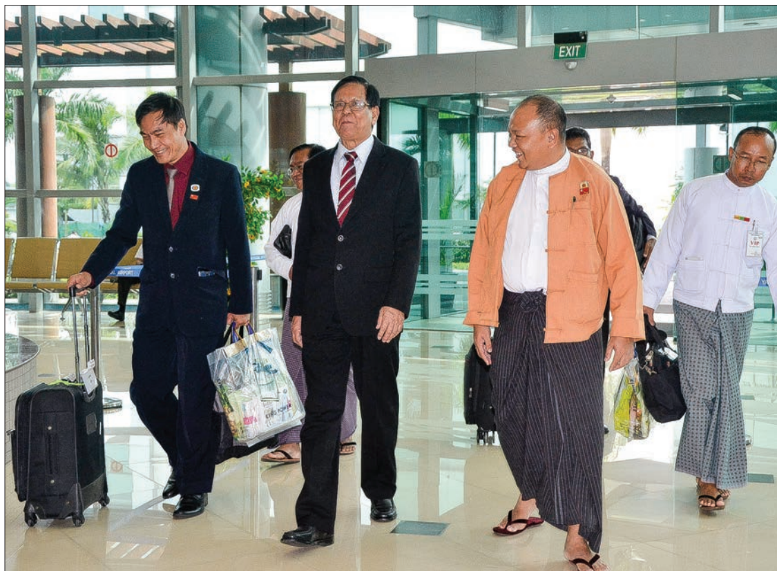
Amyotha Hluttaw Deputy Speaker U Aye Tha Aung being welcomed by officials.

Then, the Union Minister proceeded to the Training School for Tourism in Yatha Condominium of Pabedan Township and discussed about human resource development project in Myanmar with representatives of Luxemburg Development (Lux Dev). Afterwards, he continued to Kempinski Hotel Project in Yangon implemented by Prime Residence Co., Ltd and gave some instructions to preserve the original handiworks as much as possible in renovating the existing building which is an ancient edifice. The Union Minister, then attended the 6th Coordination Meeting for successful setting of the Myanmar booth in Jata Tourism Expo 2017 held at the Sule Shangri-La, Yangon and discussed about the matters in relation with the display of Myanmar Tourism elements.—Myanmar News Agency ■