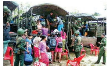
NATIONAL Local Order issued in Yathedaung Township PAGE-2