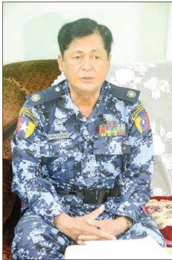
Police Brig-Gen Thura San Lwin.

A: We found in every instances that the terrorists and Bengalis were burning their houses by themselves and fled. According to security forces, when they went on clearing operation to villages the improvised bombs were set to explode and gunfire were heard. Then the houses were seen burning. Then, they fled. The sequence