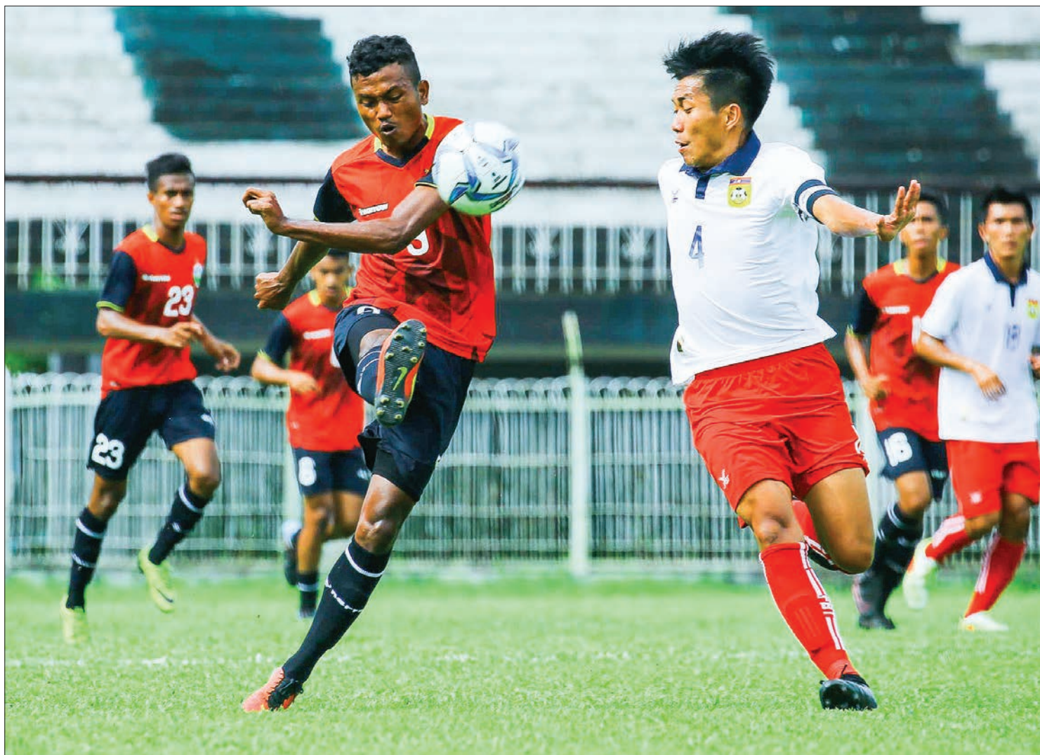
Timor Leste football player(left) shooting the ball forward at yesterday's match in Aung San Stadium.

Chelsea must continue to work on integrating new signings into the squad after winning three games in a row since their opening day defeat, Conte said. —Reuters ■