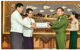
NATIONAL Donations for displaced persons, fallen security members PAGE-7

discovered in the check-up and underwent surgical operation as required. It was reported that the operation was successful.—Myanmar News Agency ■