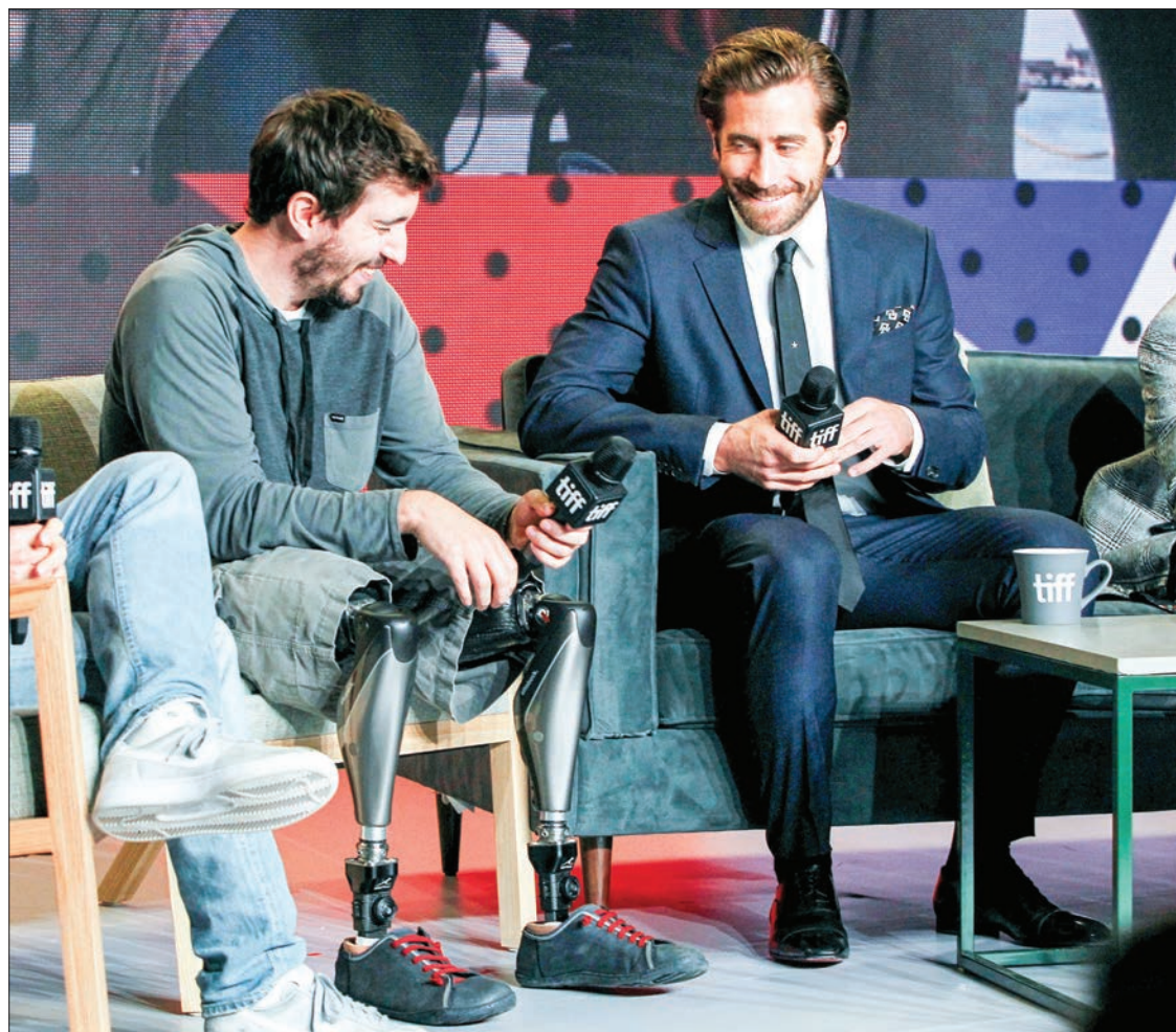
Actor Jake Gyllenhaal and author Jeff Bauman attend a press conference to promote the film “Stronger” at the Toronto International Film Festival (TIFF) in Toronto, Canada, on 9 September 2017.

Gyllenhaal, whose production company Nine Stories chose “Stronger” as its first film, said he was faced every day with the fact that he probably could not do what Bauman did and called him one of the strongest people he knew. Gyllenhaal admitted to being intimidated when he first met Bauman, knowing the impossibility of matching the reality of Bauman’s experience. But