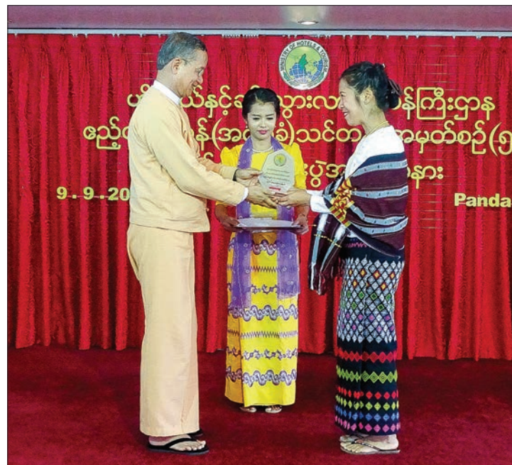
Certificates are presented to trainees.