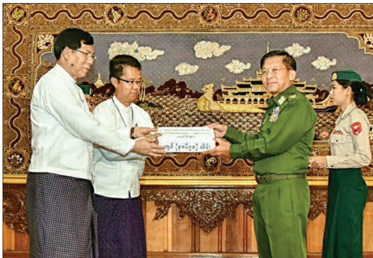
Senior General Min Aung Hlaing accepting donations.