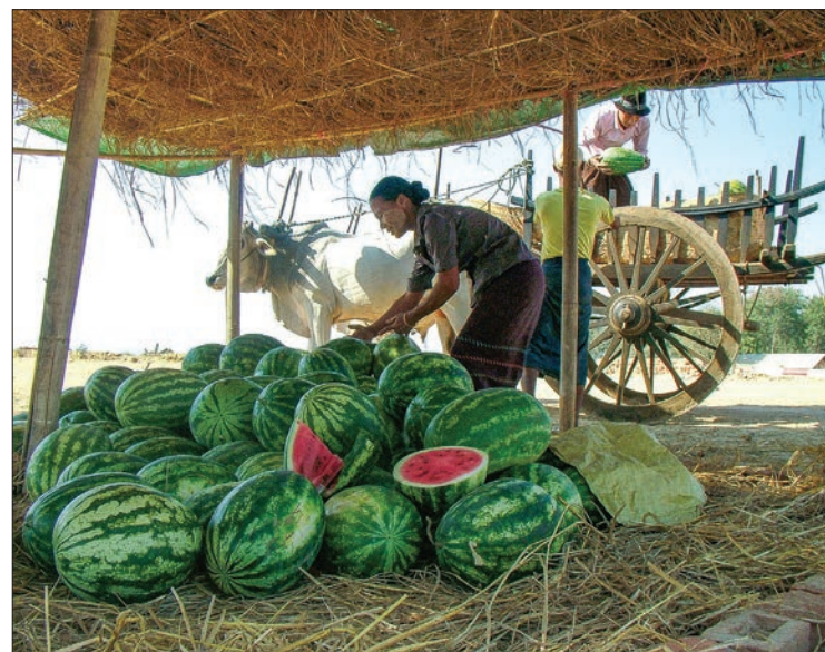
Farmers loading a bullock cart with watermelons.

WATERMELONS are being sold, according to a report of the Myawady Daily issued on Sunday.