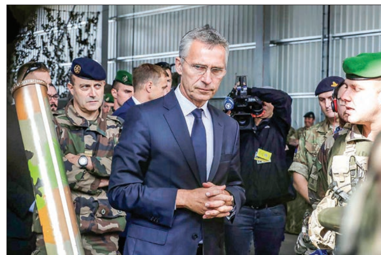
NATO Secretary General Jens Stoltenberg listens to French NATO eFP battle group soldiers in Tapa military base, Estonia, on 6 September 2017.

defend its own territory, to defend its bases and to look after its people but this involves us, London is closer to North Korea and its missiles than Los Angeles."