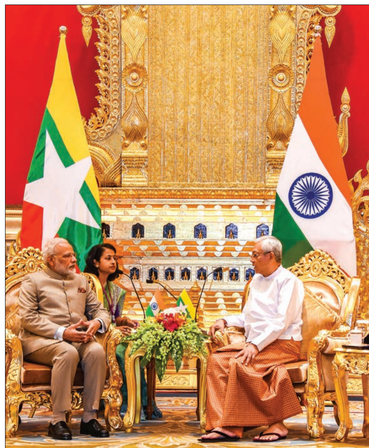
President U Htin Kyaw and Indian Prime Minister Mr Narendra Modi hold talks at Presidential Palace in Nay Pyi Taw yesterday.