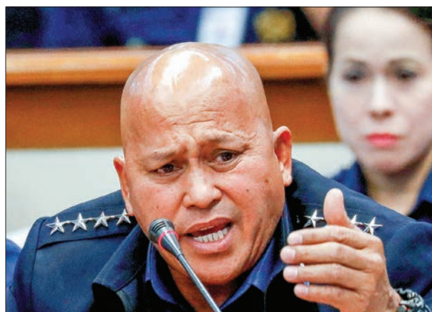
Philippine National Police chief Ronaldo dela Rosa testifies during a senate hearing on the killing of 17-year-old Kian delos Santos, in Pasay, Metro Manila, Philippines on 5 September, 2017.

The death of 17-year-old boy, Kian Loyd delos Santos, last month, after he was dragged off by plain-clothes anti-drug policemen into a dark alley, has stirred public outrage.