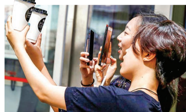
Customers take pictures of cups of tea named in the fashion of the Sang subculture at the Sung Tea shop in Beijing on 24 August, 2017.

competition for good jobs in an economy that isn't as robust as it was a few years ago and when home-ownership — long seen as a near-requirement for marriage in China — is increasingly unattainable in major cities as apartment prices have soared.—Reuters ■