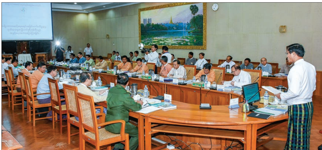
U Henry Van Thio delivers a speech at the third future work programme coordination meeting of the National Water Resources Committee in Nay Pyi Taw yesterday.

In his speech, the Vice President said this is the third future work programme coordination meeting of the National Water Resources Committee as well as a general meeting attended by all committee members. The future work programme coordination meeting was held for nationwide development of water-related sectors and to discuss and coordinate effective management and utilisation of water resources. It was also held for effective coop-