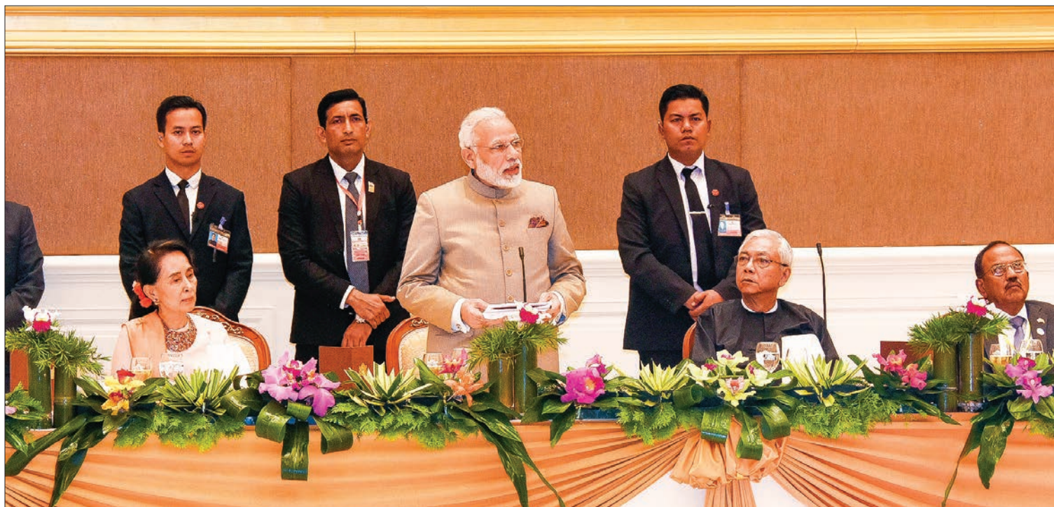
Indian Prime Minister Mr Narendra Modi speaks at the dinner hosted by President U Htin Kyaw in Nay Pyi Taw.

In 2014, the Prime Minister came to Myanmar to attend the ASEAN-India Summit. This is the Prime Minister's first official state visit to Myanmar.—Myanmar News Agency ■