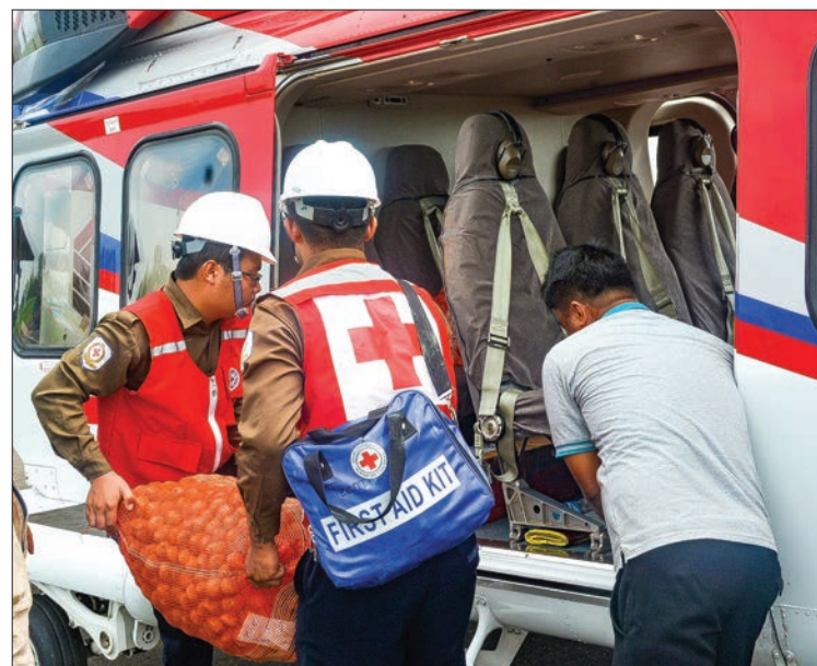
Myanmar Red Cross Society's members loading food aids.

The aid operation was been overseen yesterday by the deputy minister for the Office of the State Counsellor.