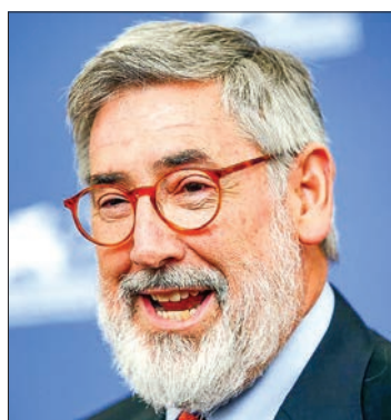
Director John Landis poses during a photocall for the movie “Michael Jackson's Thriller 3D” at the 74 th Venice Film Festival in Venice, Italy on 4 September, 2017.

Asked about his first meeting with Jackson, the child star turned King of Pop who set the world dancing but died in 2009 at the age of 50, Landis said he