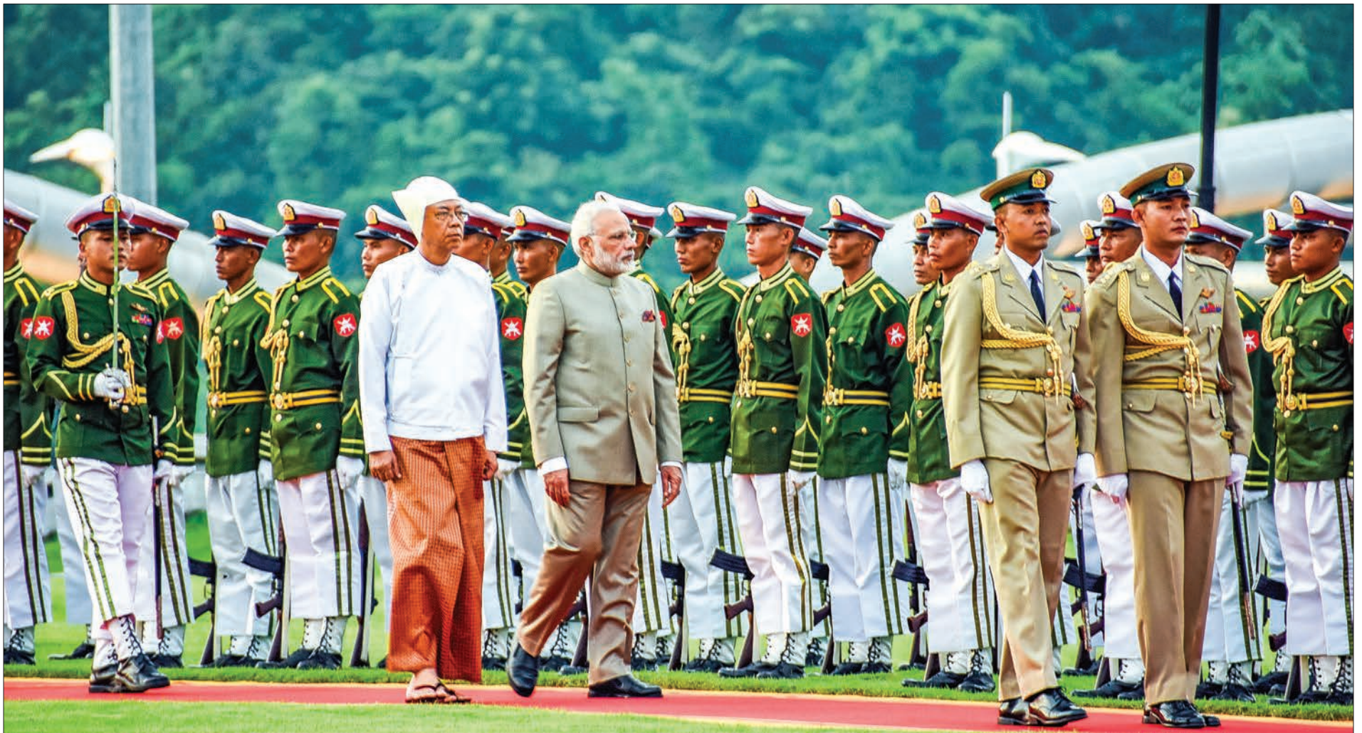
President U Htin Kyaw and Indian Prime Minister Narendra Modi inspect the honour guard at the Presidential Palace in Nay Pyi Taw yesterday. PHOTO: MNA