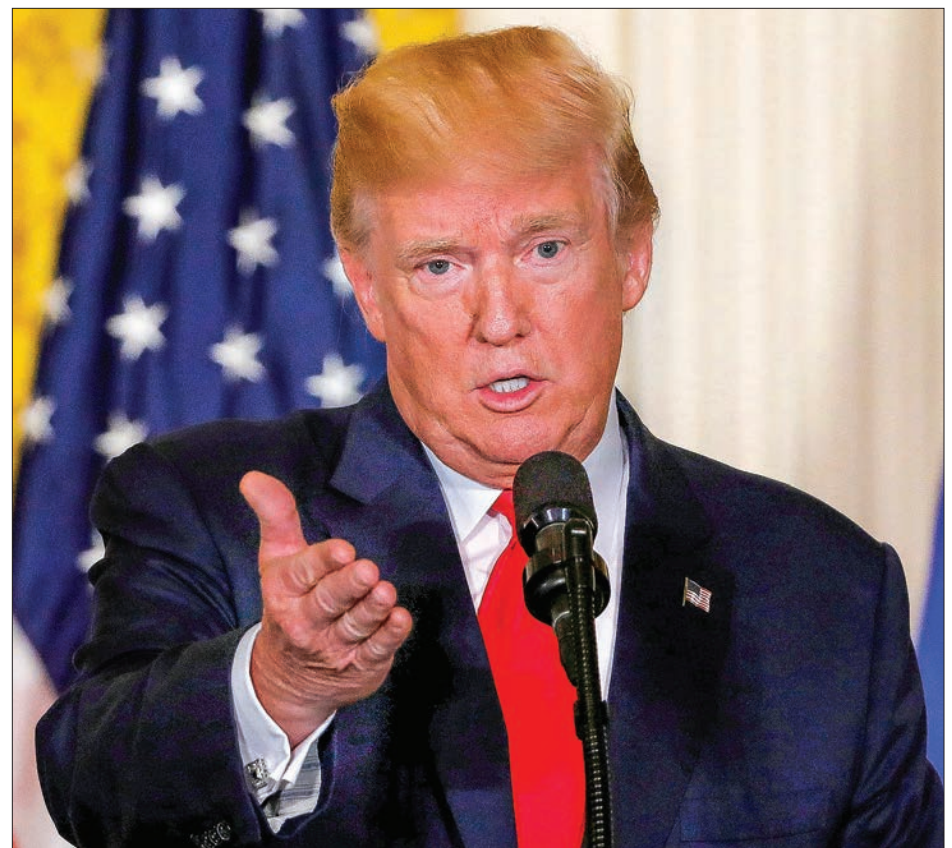
US President Donald Trump.

The missiles would still be bound by a flight range cap of 800 km. No changes to the flight range were mentioned in the Blue