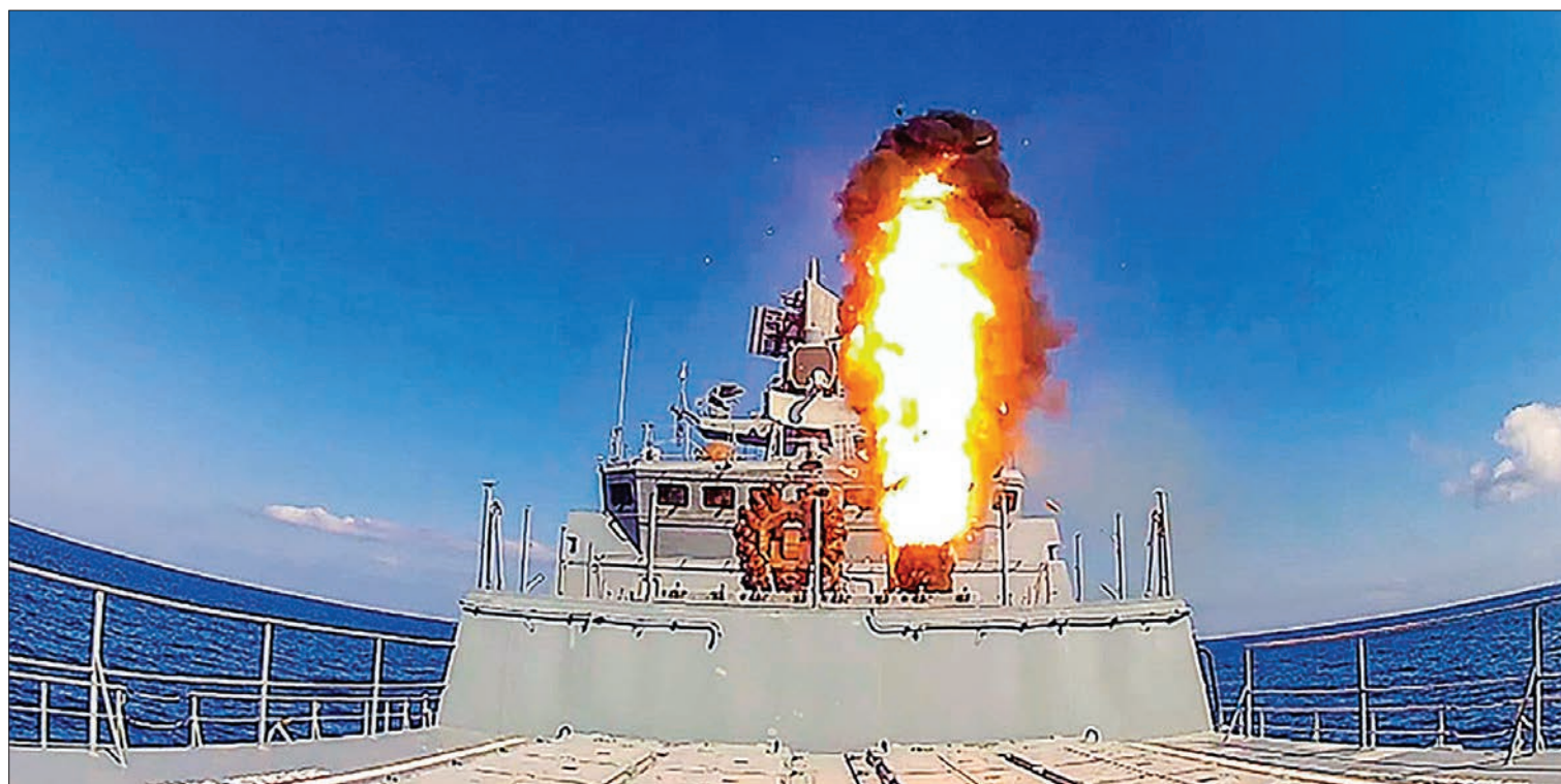
The missile strike also destroyed an armored vehicles repair plant and a large group of militants.