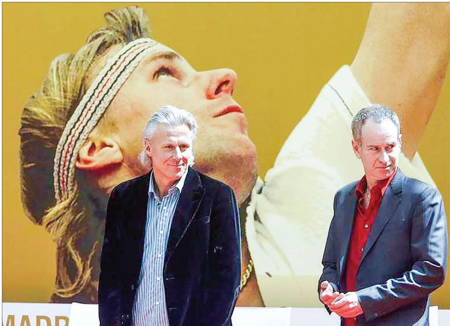
Tennis players Sweden's Bjorn Borg (L) and John McEnroe of the US stand during the presentation ceremony of masters senior tennis tournament in central Madrid on 13 April, 2007.