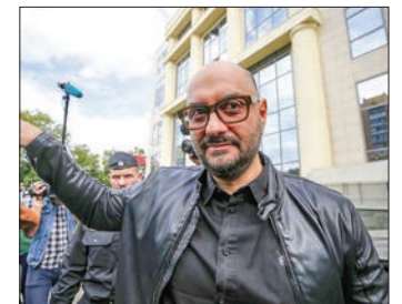
Russian theatre director Kirill Serebrennikov, who was accused of embezzling state funds and placed under house arrest, gestures after a court hearing in Moscow, Russia on 4 September, 2017.

“Others will also be brought to justice if there are any (material) claims to them,” Putin told a news conference after a summit of the BRICS nations in China. —Reuters ■