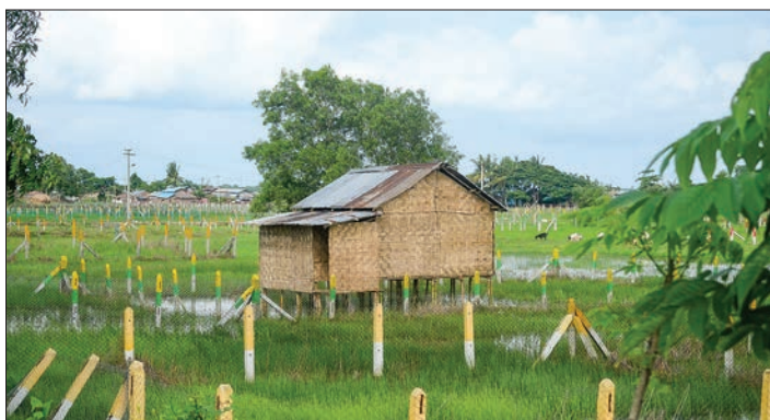
Land market in Dala Township is still cool.

"Upon completion of the project, circular trains will complete their routes in only 1 hour and 50 minutes for 38 stations instead of running two hours 50 minutes," said U Thurein Win, the managing director of MR.—GNLM ■