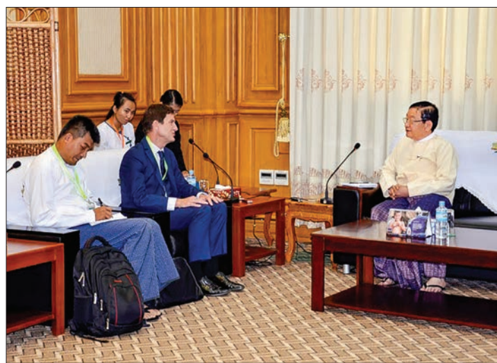
Pyithu Hluttaw Deputy Speaker U T Khun Myat holds talks with UNICEF Myanmar representative in Nay Pyi Taw.

Officials from ministerial departments, state and region governments and municipal committees who were attending the meeting explained water-related works and cooperation. Meeting attendees also suggested future work of the National Water Resources Committee. — Myanmar News Agency ■