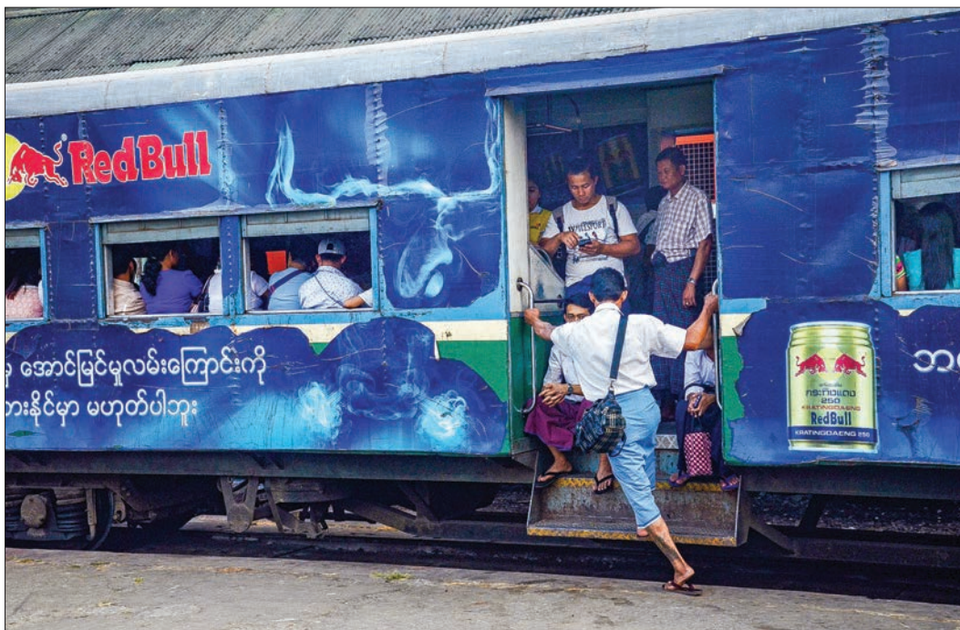
A passenger gets on a circular train at Yangon Central Railway Station.

Due to limitation of space we are only able to publish "Letter to the Editor" that do not exceed 500 words. Should you submit a text longer than 500 words please be aware that your letter will be edited.