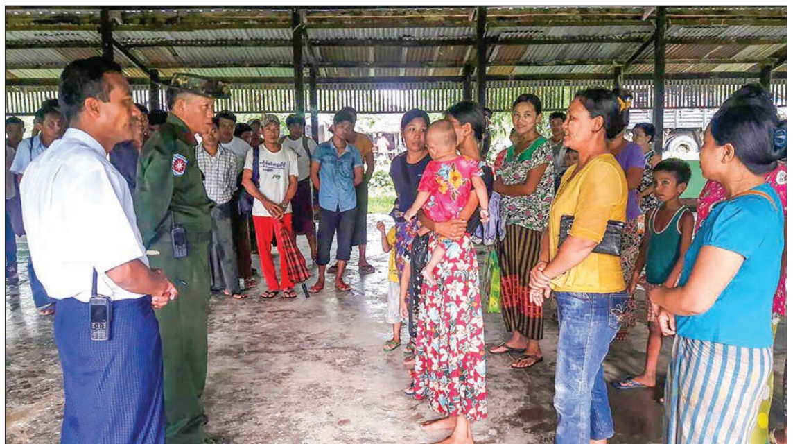
Rakhine State Minister for Security and Border Affairs Col. Phone Tint meets and encourages teachers and local ethnics.

Rakhine State Minister for Security and Border Affairs Col. Phone Tint met and encouraged teachers and local ethnics who are returning to their homes and schools in Rakhine State that