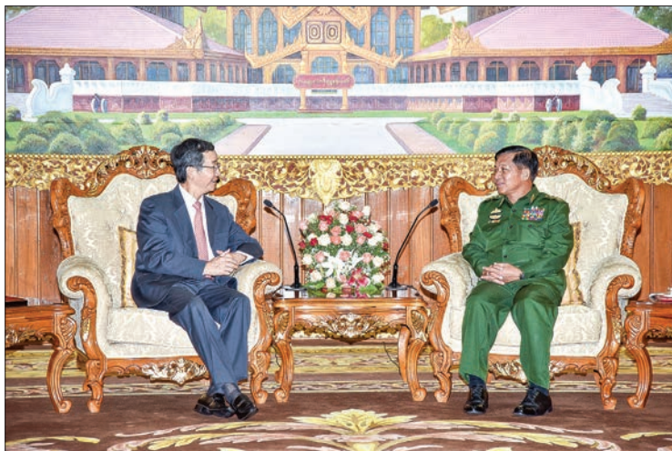
Senior General Min Aung Hlaing meets with Special Envoy of Asian Affairs of the Ministry of Foreign Affairs of China.

At the meeting the Senior General said that during the multi-party democracy era when peace process was started to be implemented, ethnic armed groups were invited to participate in "Our Three Main National Causes" and accept the "multi-party democracy system". The offer was accepted by ethnic armed groups and Nationwide Ceasefire Agreement (NCA) was signed after the government, Tatmadaw and ethnic armed groups discussed repeatedly. Thus the peace process will be implemented along