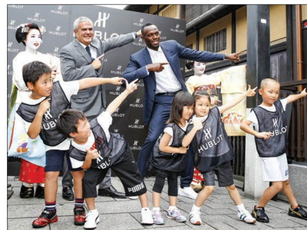
Retired Jamaican sprinter Usain Bolt (3rd from L on back) poses with local children during an event for Swiss luxury watchmaker Hublot in the traditional Gion district of Japan's tourist city of Kyoto on 5 September, 2017.